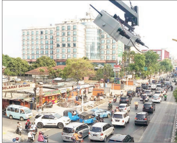
This photo shows a sensor unit for a device made by Murata Manufacturing Co. and installed in Jakarta to measure traffic data.

Murata will offer the traffic data service under a licencing contract with local information technology firm PT. —Kyodo New ■