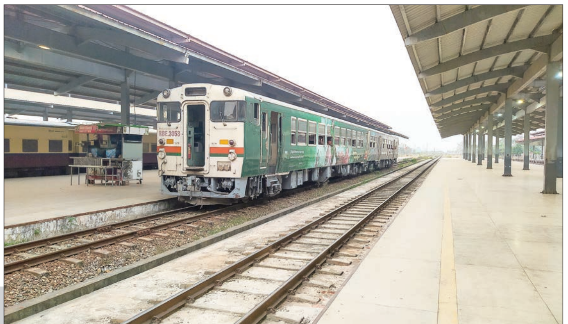
A 2-carriage RBE train is seen running for the Nay Pyi Taw-Thazi-Mandalay route on 23 March 2021.

Myanma Railways conducts up and down RBE trains for the Nay Pyi Taw-Thazi-Mandalay railway section for the passengers daily. Those who want to take the trains can make inquiries at the railway stations.—MNA