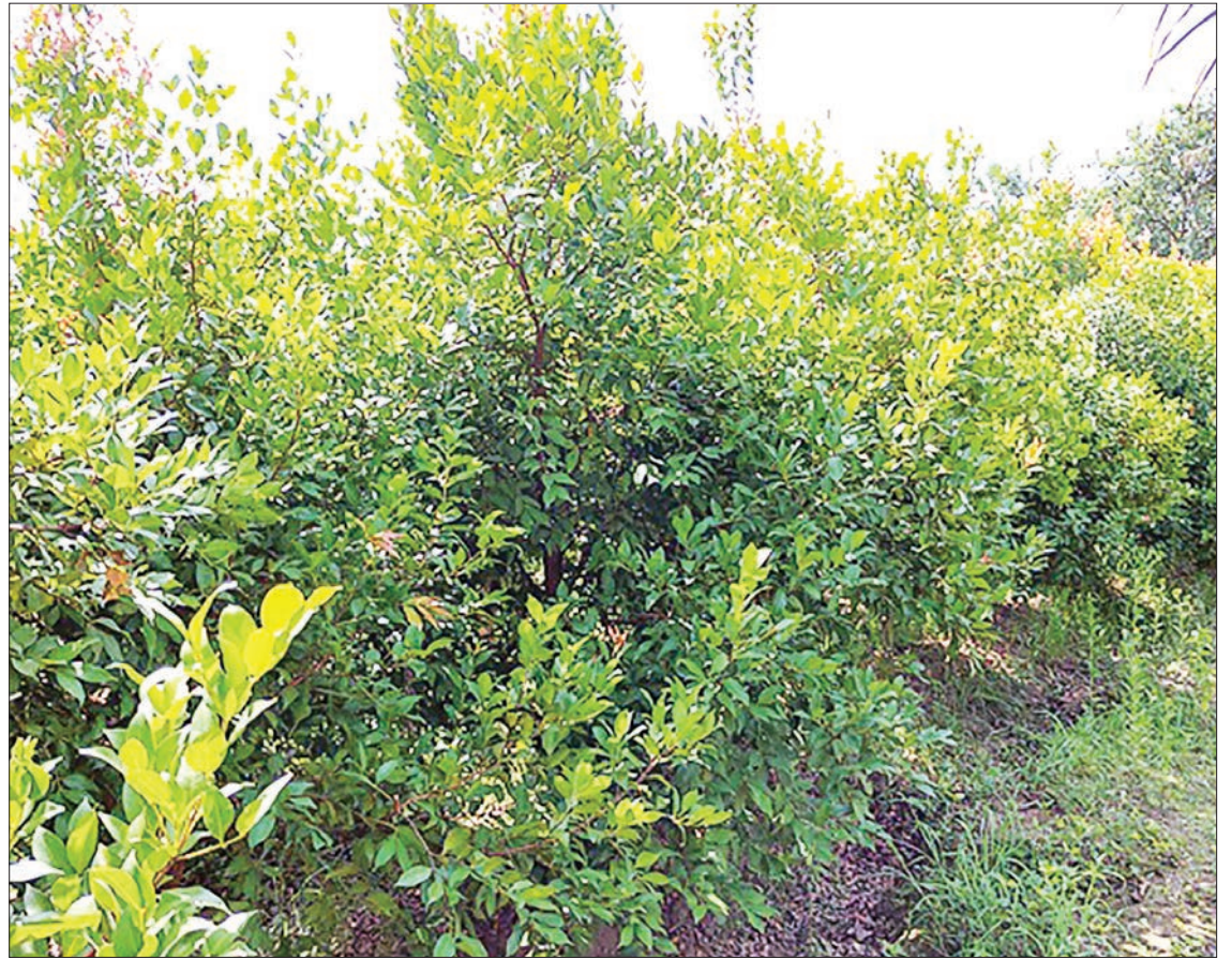
Eugenia is one of the essential flowers for pilgrims because it is a symbol of success for them.

Therefore, the eugenia plants should be cultivated because they can earn the growers daily income.