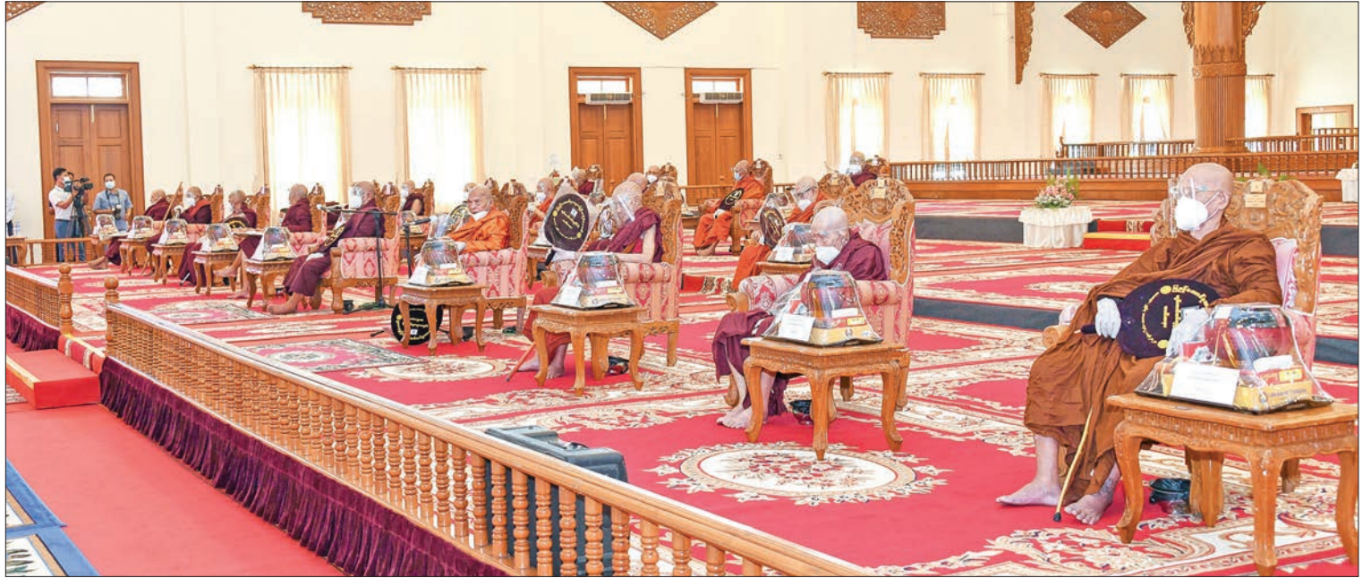
Sayadaws are seen giving sermons to the congregation yesterday.