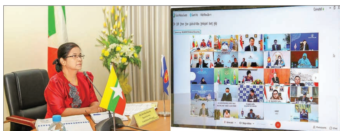
Deputy Governor of the Central Bank of Myanmar Daw Than Than Swe joins the AFCDM+3 meeting online on 25 March 2021.

During the meeting, she discussed the use of the US Treasury Bill rate (UST) as a substitute for the CMIM reference rate. However, LIBOR Rate was extended to 2023,