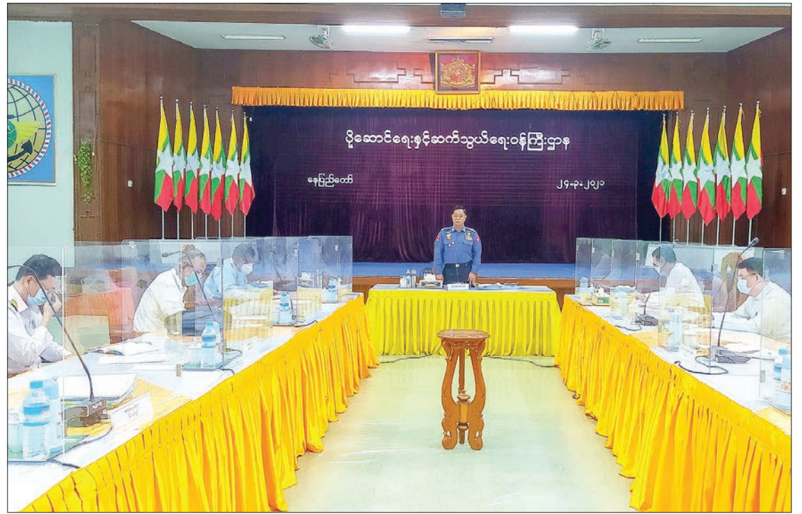
Union Minister Admiral Tin Aung San chairs the MoTC meeting on the reopening of full train services, yesterday.

Afterwards, the region heads, general managers of