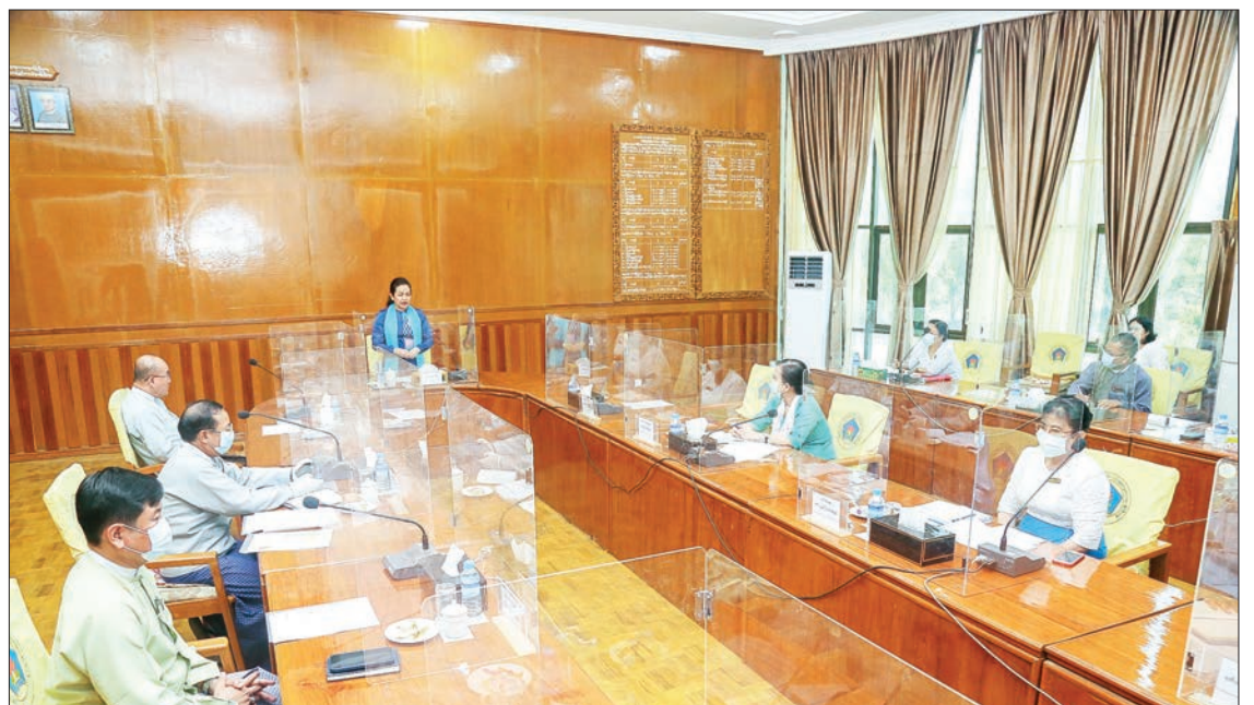
Union Minister Dr Thet Thet Khine holds talks to reorganize the national committee on the rights of persons with disabilities yesterday.