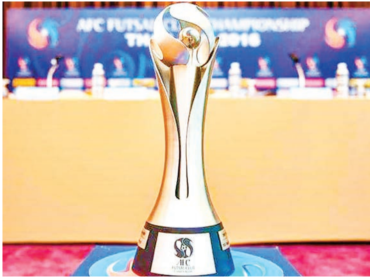
The AFC Futsal Asian Cup is everyone's dream of the futsal teams in Asia.