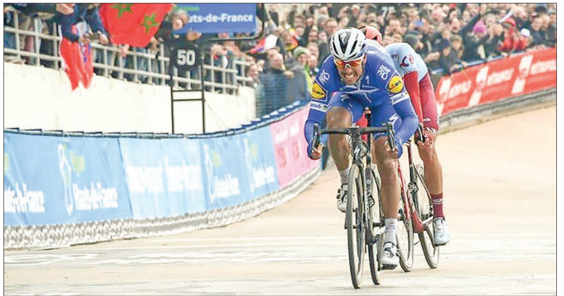
Belgium's Philippe Gilbert sprints to claim the 2019 edition of the Paris-Roubaix.

FRENCH Sports Minister Roxana Maracineanu raised fresh doubt on Thursday over the staging of the Paris-Roubaix one-day classic on April 11.