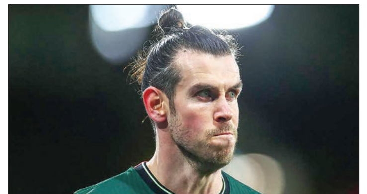
Gareth Bale said Tuesday that he plans to resume his Real Madrid career once his loan at Tottenham expires at the end of this season.

“My plan is to go back, that’s as far I have planned.” Mourinho said earlier this month that Bale’s future beyond the end of the season was a matter for Real. —AFP ■