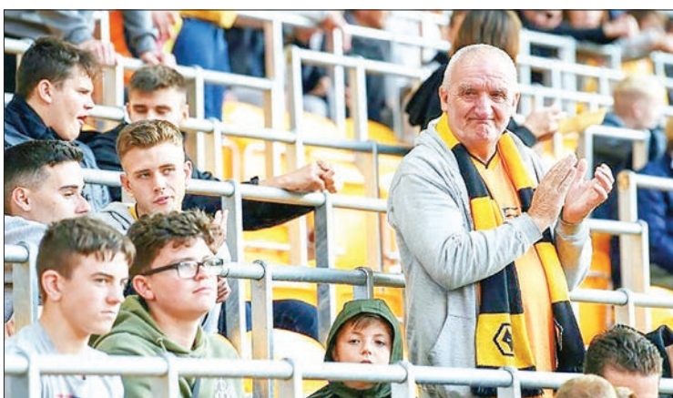
Some rail seating has already been installed at Premier League club Wolverhampton Wanderers.

MANCHESTER City are to install more than 5,000 rail seats at the Etihad Stadium in order to take advantage of any potential change in the law to allow safe standing.