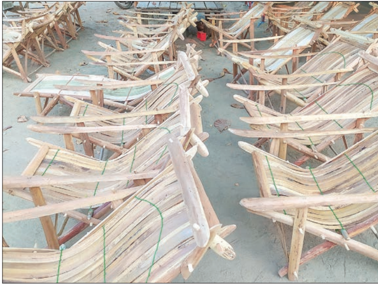
Dy-palm chairs sold well. However the sale of toddy-palm chair has dropped significantly this year because there are few local tourists.

THE Indaw Kyay village in Kyaukpadaung Township is being engaged in toddy-palm chair making business.