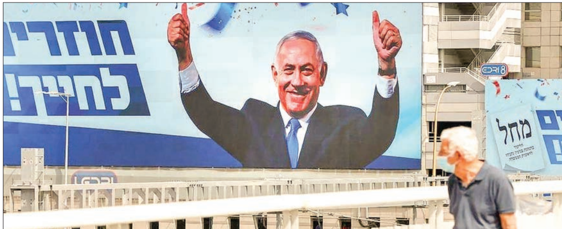
Prime Minister Benjamin Netanyahu's Likud party was on track to win the most seats in Israel's fourth election in two years, exit polls showed Tuesday, but he was not guaranteed a governing majority.

Likud's tally, along with the support earned by its right-wing religious allies, gives the pro-Netanyahu bloc an estimated 53 or 54 seats, according to the initial projections which are subject to