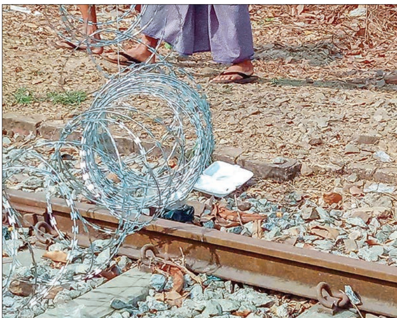
Rail lines are blocked by barbed wires.

The MR is also making arrangements to resume the operations of circular trains daily as before.—MNA