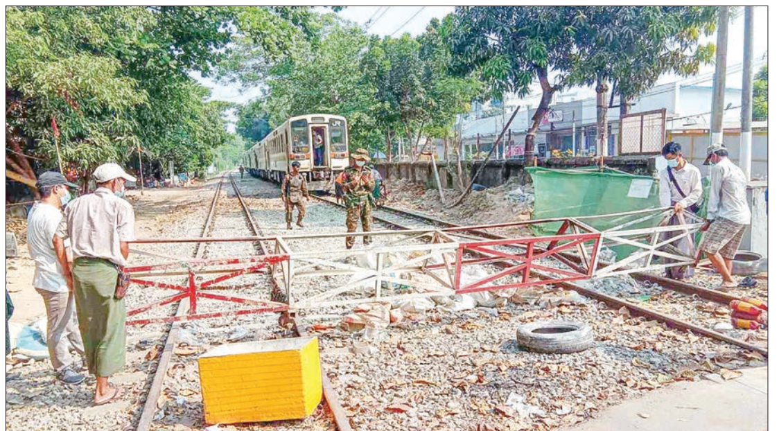
MR personnel seen clearing the blocked materials on rail tracks.