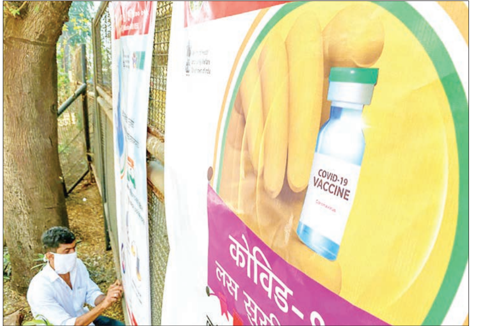
A worker sets up a poster at a coronavirus vaccination centre in Mumbai on Friday, with the Indian government aiming to inoculate around 300 million people by July.

The number of infections has been rising again in recent weeks, and several regions have been reimposing restrictions on gatherings and activity. —AFP ■