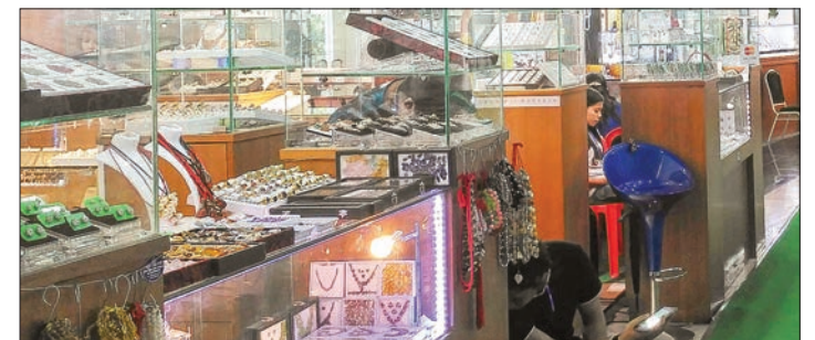
The price stood at only K1,302,000 per tical on 4 March, and then, it tremendously soared to K1,385,000 per tical on 23 March.

With global gold prices on the uptick, the domestic price hit fresh highs last year, reaching K1,000,000 per tical between 17 January and 21 February, crossing K1,100,000 (22 June to 5 August), climbing to over 1,200,000 (7 August-4 September), and then reaching a record high of K1,300,000 on 5 September 2019. — NN/GNLM