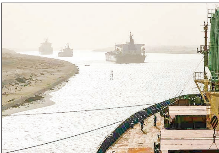
The Suez Canal is one of the world's most important trade routes, providing passage for 10 percent of all international maritime trade.

A giant container ship has blocked the Suez Canal in Egypt, tracking websites showed Wednesday, bringing marine traffic to a shuddering halt along one of the world's busiest trade routes.