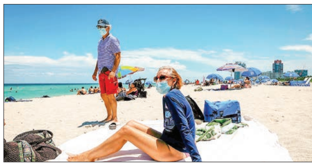
Diane, a nurse from Houston, Texas, sunbathes at the beach next to her husband, both wearing facemasks, in Miami Beach, Florida on June 16, 2020.

THE US city of Miami Beach, overrun by crowds of spring break tourists throwing Covid caution to the wind, has extended a state of emergency to stem the chaos – drawing accusations of unfairly tough tactics against mostly Black revelers.