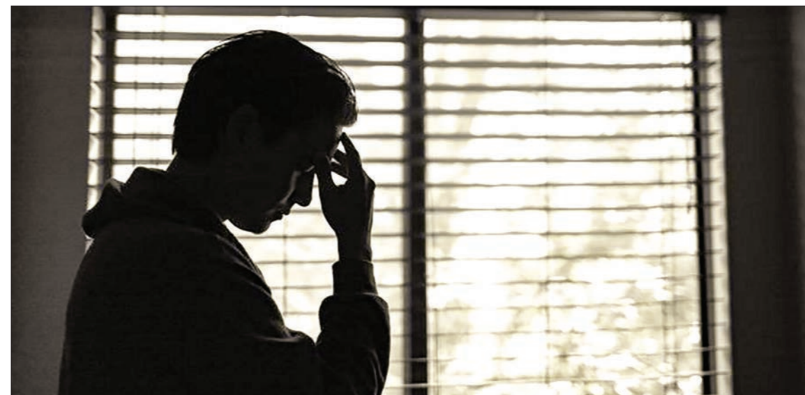
Representative image.

Italy one month after they were hospitalised, 56 per cent tested positive for at least one psychiatric condition such as PTSD, depression or anxiety.