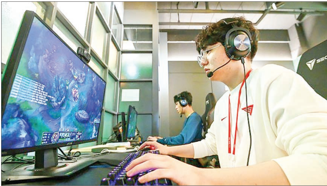
Dozens of gamers train at the T1 building in Seoul.

A Nike-sponsored gym, support staff including nutritionists and English language classes are all part of the set-up at T1, one of the world’s top eSports organizations, where around 70 gamers are looking to emulate its highest-profile member, League of Legends giant Faker.