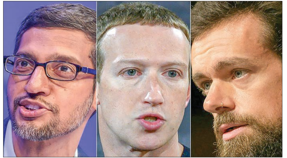
Google's Sundar Pichai, Facebook's Mark Zuckerberg and Twitter's Jack Dorsey will testify before Congress, squarely in the crosshairs of Democrats and Republicans alike.