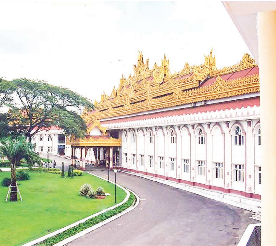
Missionary University building.

In accordance with the objectives and basic principles laid down by the University, the project was launched by forming the necessary committees, namely the Committee for Drafting University Act, Rules and Regulations, the Committee of the Patron Sayadaws, the University Curriculum Committee and the Committee for Writing University Constitution.