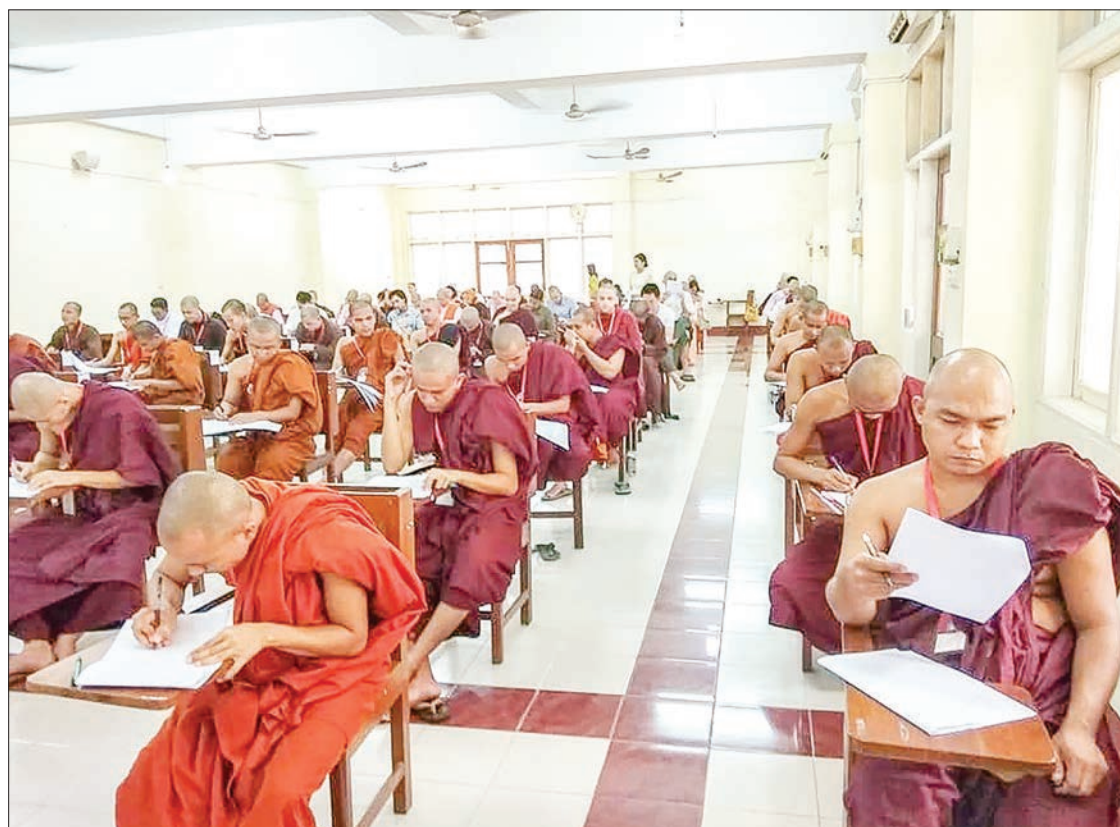
Monk students seen sitting for exam at the ITBMU.

2. The candidates need to sit for an entrance examination