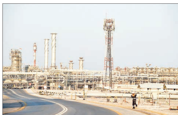
Saudi Aramco's Abqaiq oil processing plant.

But compared to many of its loss-generating international peers, the company, which made its stock market debut in 2019, played up its "strong financial resilience" despite the challenges. —AFP ■