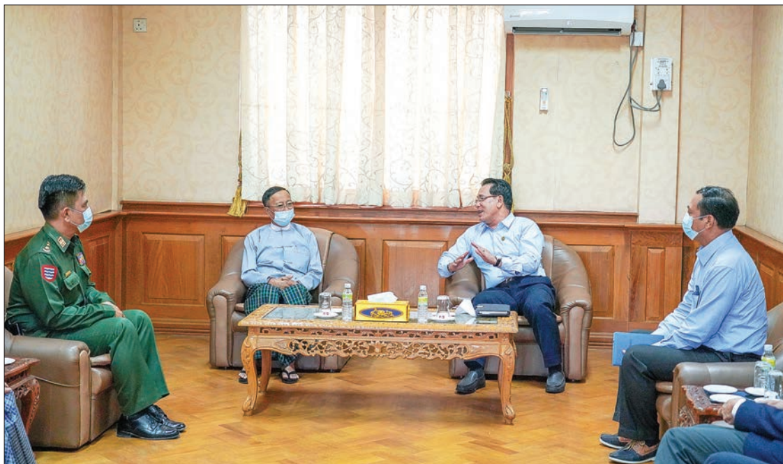
MoHT Union Minister discusses tourism development activities with hoteliers and officials in Patheingyi on 20 March.

Afterwards, the Union Minister arrived at Chaungtha Beach and met departmental officials, Deputy Chairmen and officials from the Myanmar Hotelier Association at Azura Beach Resort. At the meeting, the Union Minister said his ministry has instructed to open hotels following the COVID-19 rules and regulations. Accord-