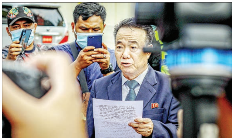
A North Korean diplomat reads out a statement in front of the North Korean Embassy in Kuala Lumpur on March 21, 2021. zoom photo A North Korean diplomat reads out a statement in front of the North Korean Embassy in Kuala Lumpur on March 21, 2021.

NORTH KOREA closed its embassy in Kuala Lumpur and its diplomats left Malaysia on Sunday after Pyongyang announced it was cutting diplomatic ties with the Southeast Asian country over the extradition of one of its citizens to the United States.