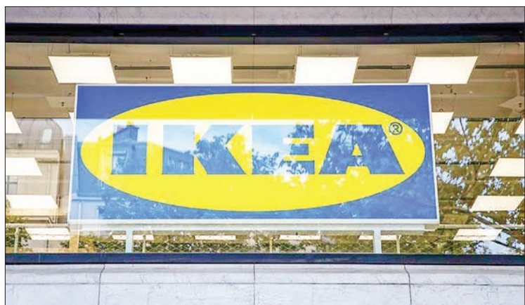
The French branch of Swedish retailing giant Ikea goes on trial Monday accused of running an elaborate system to spy on staff and job applicants using private detectives and police officers.

THE French branch of Swedish retailing giant Ikea goes on trial Monday accused of running an elaborate system to spy on staff