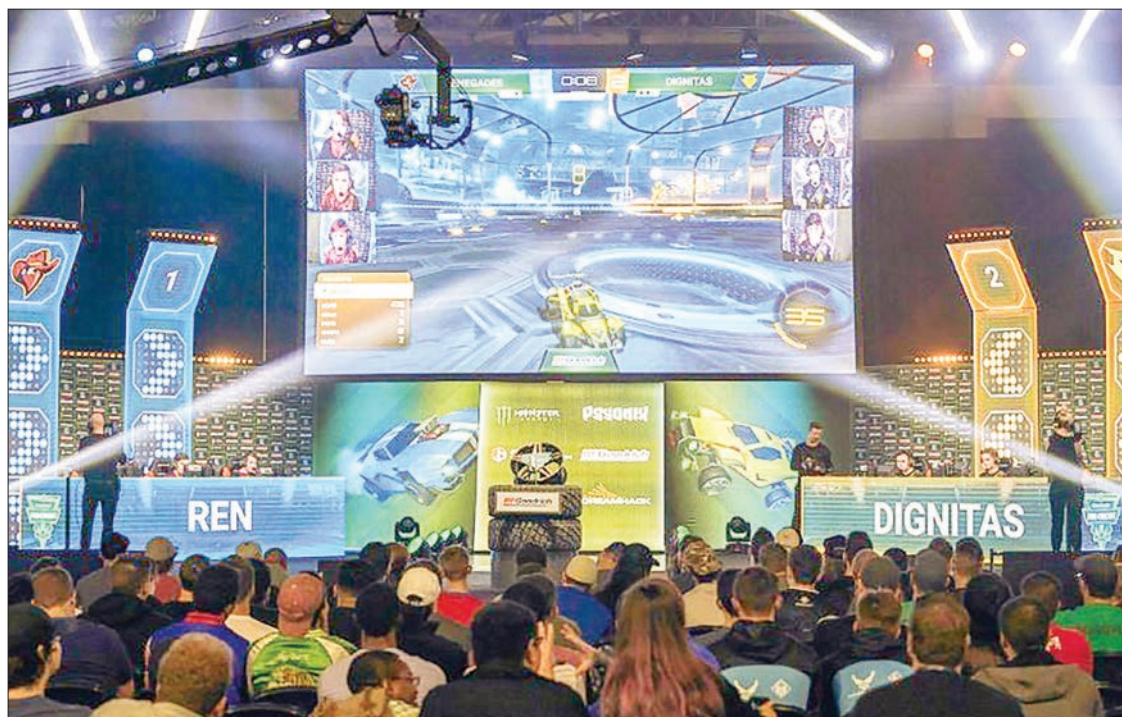
Rocket League is among the most popular games in corporate eSports leagues.

Matches are streamed online at an array of platforms such as Twitch and YouTube, with bragging rights and charity dollars on the line. Like video-game play overall, interest in company team matches has boomed during the Covid-19 pandemic as real-world options from soccer to softball stopped