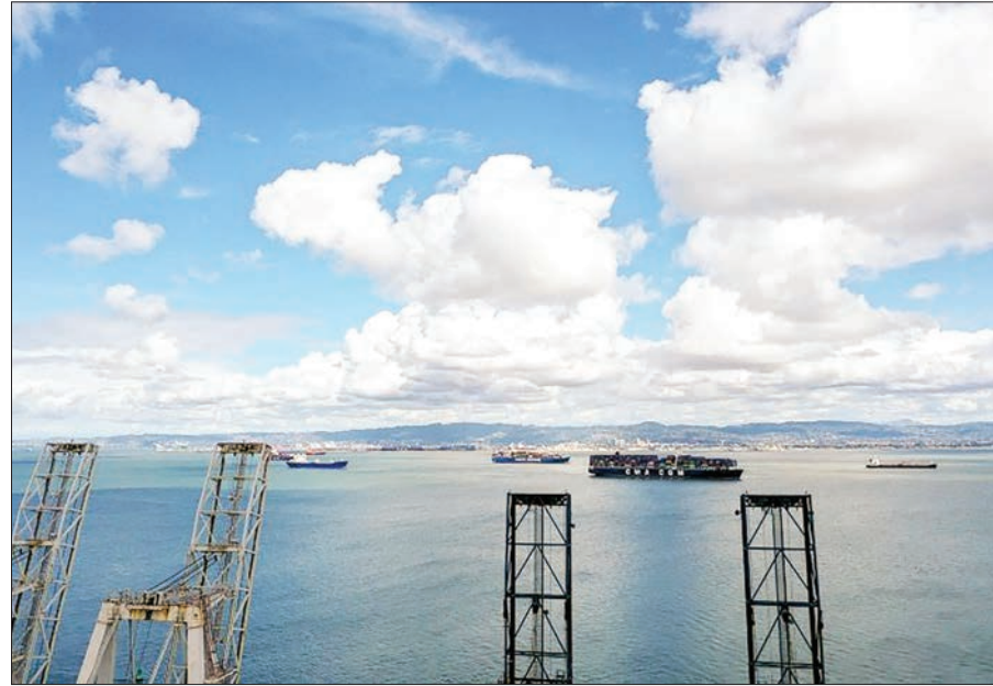
Fully loaded container ships sit anchored near the Port of San Francisco on March 09, 2021 in California.

THE cold snap that gripped the United States in February not only caused chaos in Texas and the southwest, it also triggered a shortage in plastics that has disrupted a supply chain already under strain from a lack of mi-