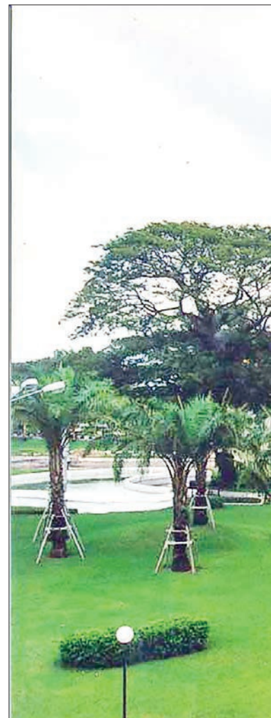
International Theravāda Buddhism M

eign countries for the propagation of Theravāda Buddhism.