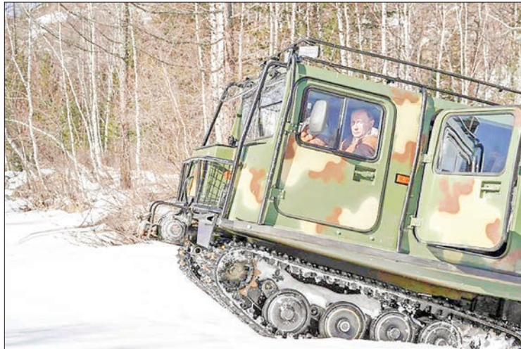
Putin likes to cultivate a virile man-of-action image.

Video released by the Kremlin from inside an all-terrain vehicle showed the president at the wheel of a vehicle that pulled branches from overhanging trees as it barrelled over snow-laden tracks through