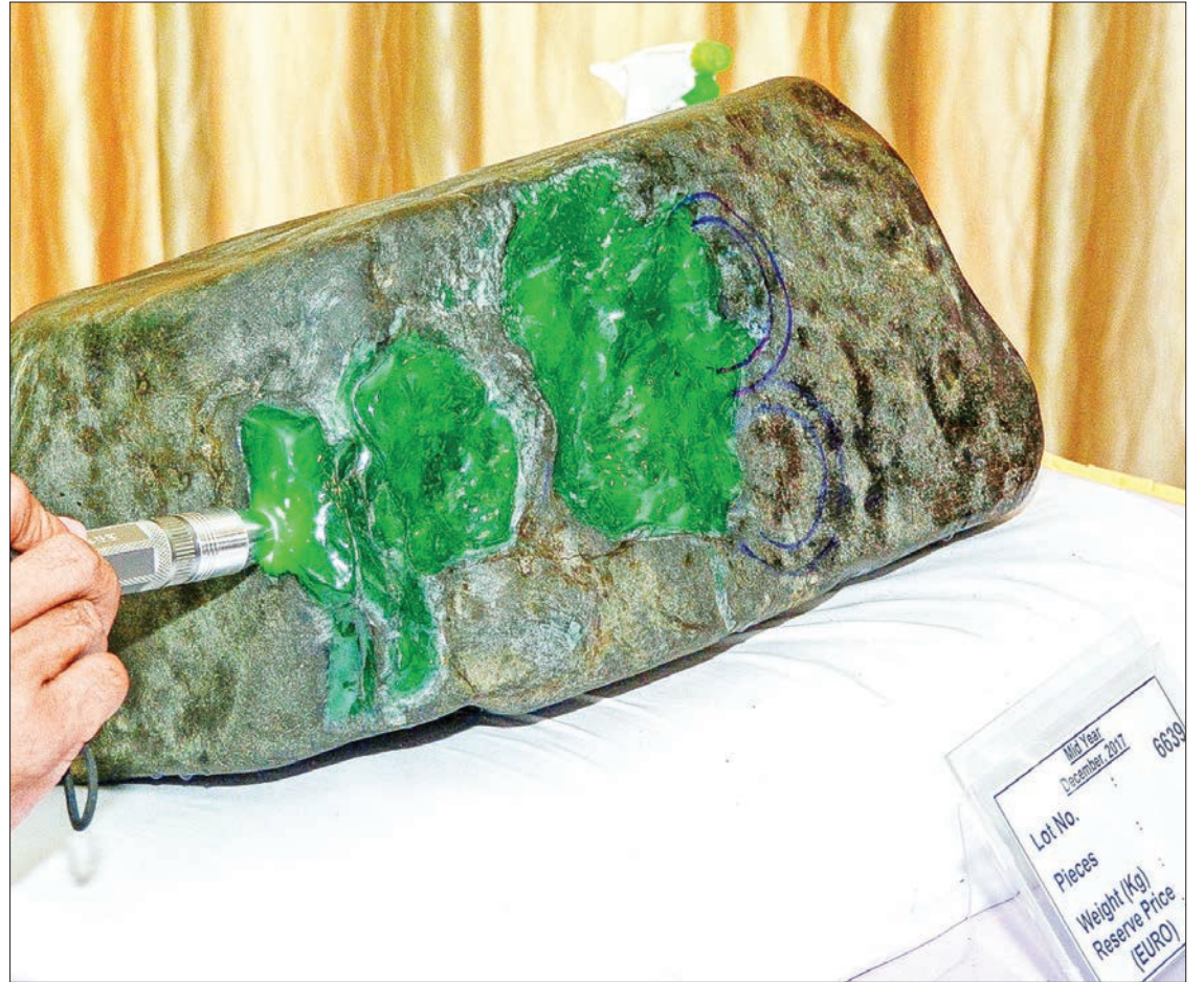
Myanmar's mineral products constitute 10 per cent of overall exports.

Myanmar's mineral exports have shown a marked increase in the previous FY2019-2020,