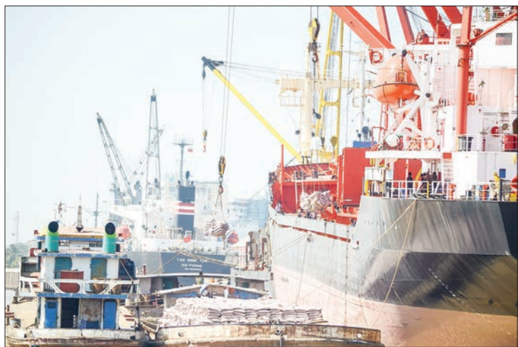
Myanmar's sea trade generated $26 billion from an overall trade value of $36 billion in the last FY2019-2020.

THE value of Myanmar's maritime trade for the period between 1 October and 13 March in the 2020-2021 financial year sank to US$9.06 billion, a drastic drop of over $3.76 billion compared to the year-ago period, according to the Ministry of Commerce.