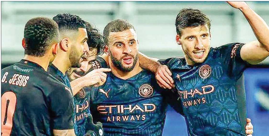
Manchester City's German midfielder Ilkay Gundogan (centre) celebrates scoring his team's first goal with teammates during their English FA Cup quarter-final match against Everton at Goodison Park in Liverpool, north west England on March 20, 2021.

MANCHESTER City's quest for an unprecedented quadruple of trophies remains intact after seeing off Everton 2-0 to reach the FA Cup semi-finals on Saturday as Southampton also booked their place in the last four.