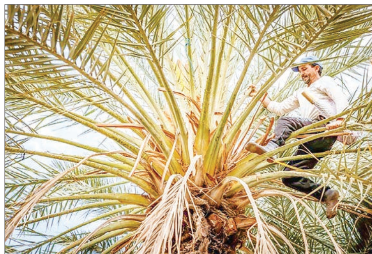
Many in Figuig are reliant on date palms for their livelihoods.

On Thursday, some 4,000 people -- around half of Figuig's population -- attended an angry demonstration against Algeria's decision. Morocco's regional authorities organized a meeting to "examine possible solutions to mitigate the impact" of a decision they said was "temporary". —AFP ■