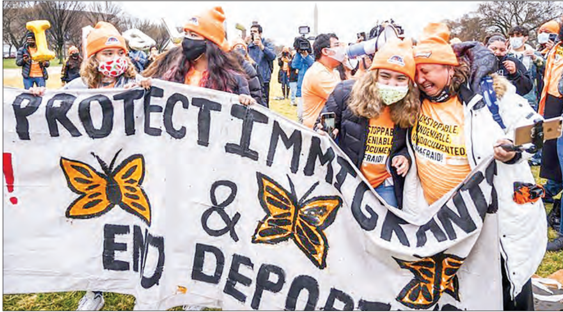
One bill offers a citizenship pathway for undocumented young people.

THE US House of Representatives has passed two immigration bills that would provide legal status for millions of undocumented immigrants, but the measures have an uncertain