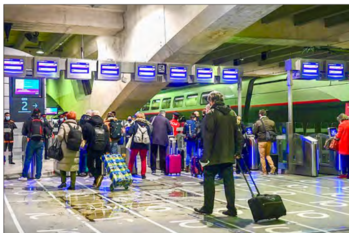
Parisians are getting away while they can.

PARISIANS packed inter-city trains leaving the capital on Friday hours ahead of a new lockdown in the French capital imposed to combat a surge in coronavirus infections.