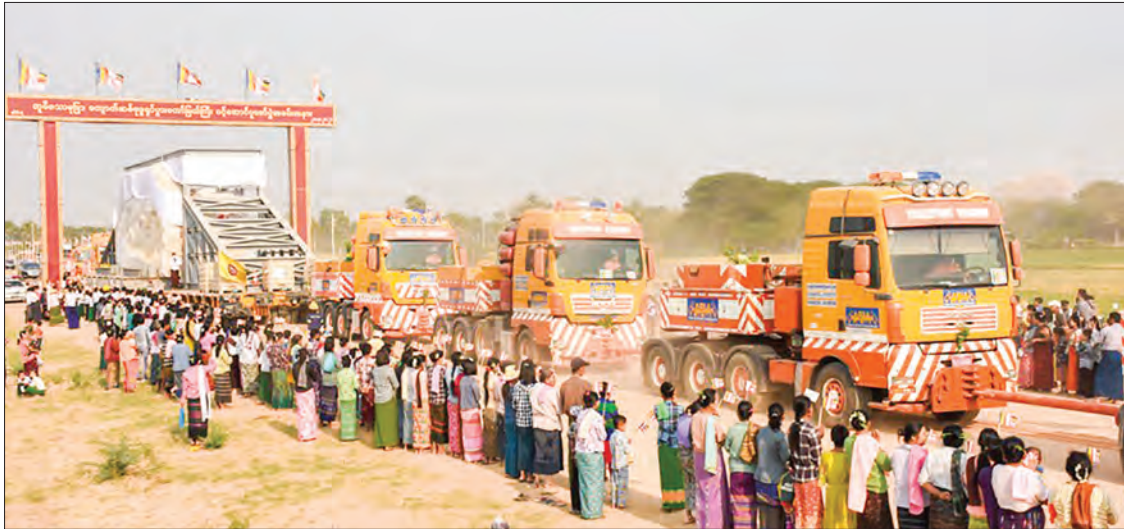
The modular trailers seen carrying the throne sections of the Bhumi Phassa Mudra Sitting Buddha Statue.

THE ceremony for conveying the statue of the Bhumi Phassa Mudra Sitting Buddha and the pieces of the throne to Nay Pyi Taw was held yesterday at Semikhone port, Myingyan Township, Mandalay Region.