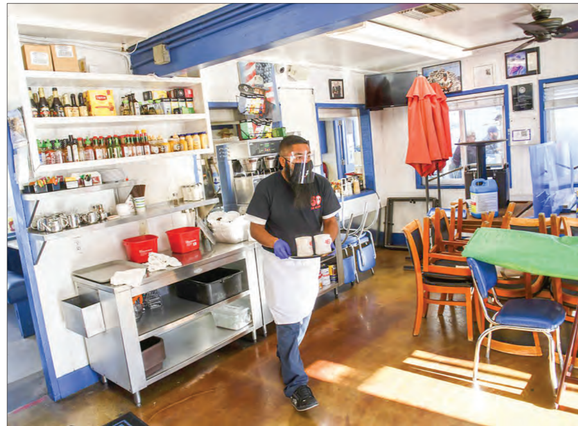
With health protocols, a worker carries out food at a restaurant in Redondo Beach, a coastal city in Los Angeles County, California, United States.

The committee announced its conclusion on Friday that the