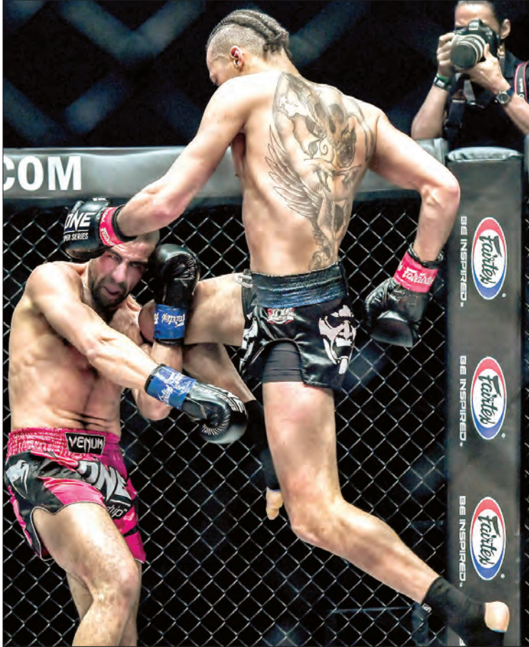
Regian Eersel (right) show just why he is the reigning ONE Championship lightweight kickboxing champion with his insane high kick on Friday night.

REGIAN Eersel of Suriname retained his ONE Championship kickboxing world title by beating Mustapha Haida of Italy in the main card of the