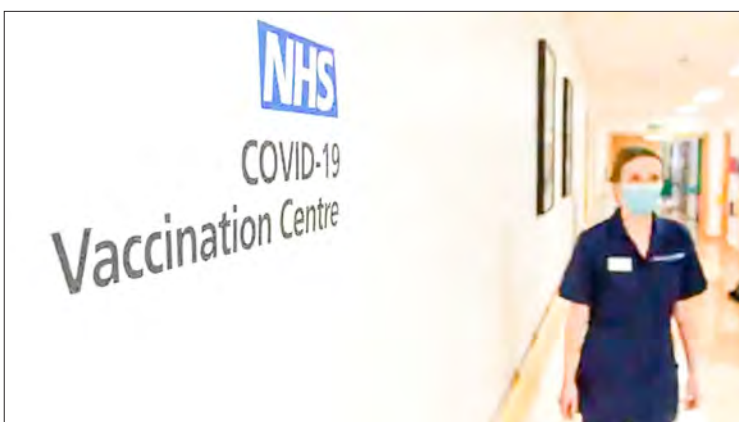
A nurse passes a sign indicating a Covid-19 Vaccination Centre at the Royal Free Hospital in London.

In addition to existing restrictions, the government is planning to ban holidays abroad. A loophole in current regulations means that travel between regions within Slovakia is prohibited, while travel outside the country is still allowed. The Slovak government also plans to pay nearly 60,000 euros in compensation to families of frontline medical staff who have died following workplace exposure to Covid-19. —AFP ■