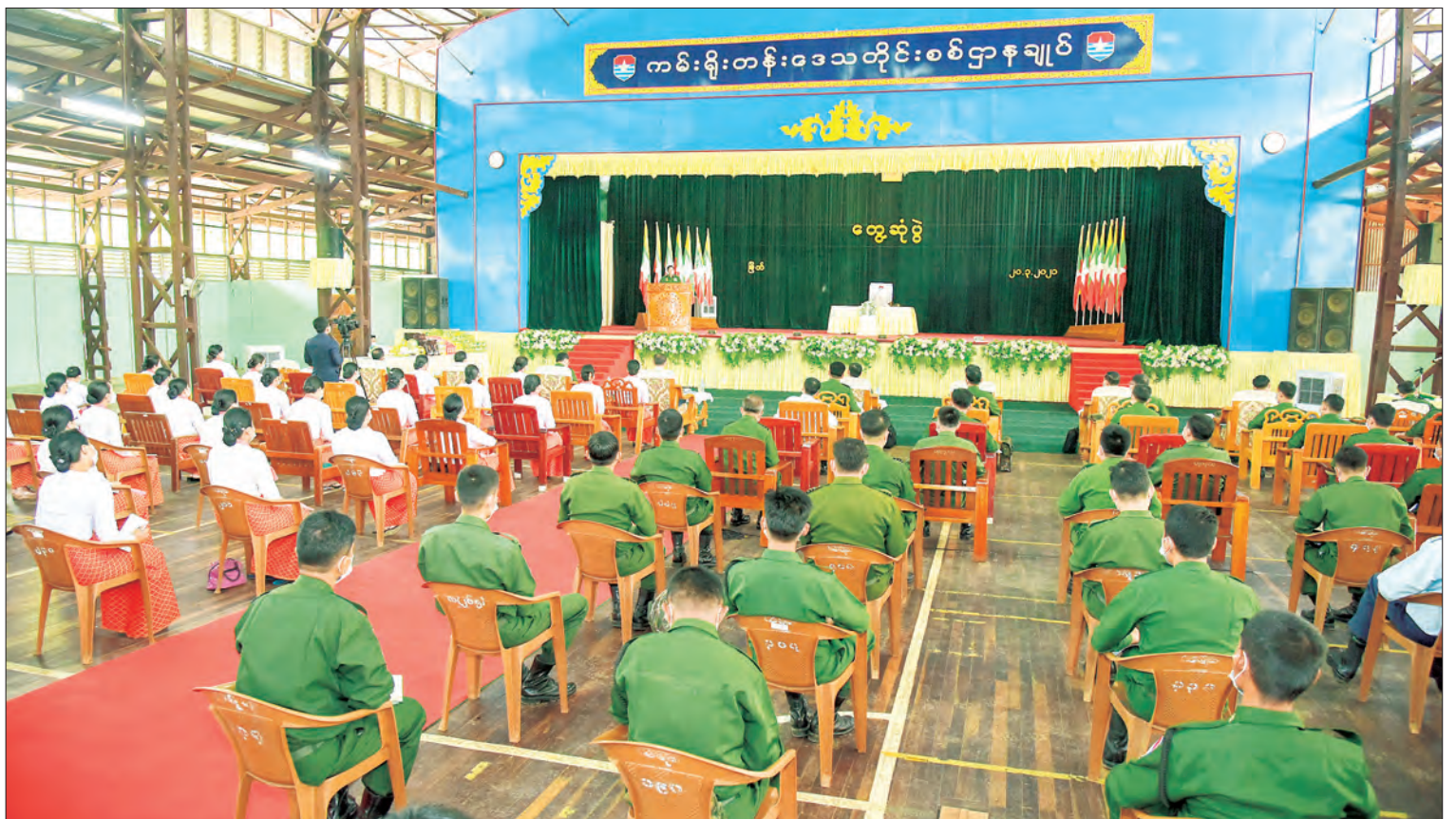
Chairman of the State Administration Council Senior General Min Aung Hlaing meets officers, other ranks and their families in Myeik station.

THE Tatmadaw is carrying out political, social and economic development by assuming State responsibilities in accord with Sections 417 and 418 of the Constitution (2008) as of 1 February 2021 and forming the State Administration Council in line with Section 419. The council temporarily takes responsibilities in a short time to ensure genuine democracy and disciplined and firm democracy. Tatmadaw members need to conscientiously try hard for their works in individuals and must strive for uplifting the prestige of the Tatmadaw, the State and the nationality while improving their individuals and military units, said Chairman of the State Administration Council Commander-in-Chief of Defence Services Senior General Min Aung Hlaing at the separate meetings with officers, other