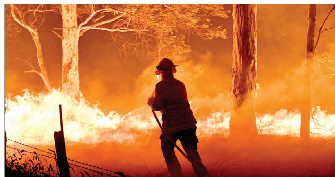
Researchers could see the smoke in the stratosphere for six months, from January to July 2020, via satellite monitoring. A firefighter in Australia hoses down trees to protect nearby homes from bush fires near the town of Nowra in the state of New South Wales on December 31, 2019 as the fires led to the evacuation of popular tourist areas in the state.

staying in the atmosphere for so long is that it can reflect radiation coming from the sun.