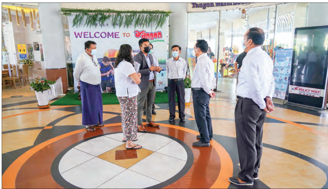
MoHT Union Minister U Maung Maung Ohn makes an inspection tour on river cruise and hotels in Yangon on 19 March.

People will be able to enjoy exciting scenes, including the beautiful scenery of the Yangon