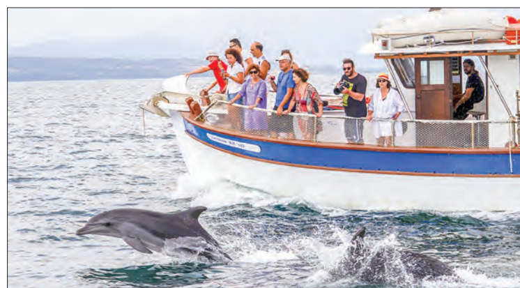
Tourists take pictures during a dolphin watching tour from a boat in the Ambracian Gulf, in Preveza, northwest Greece, on August 6.

Theocharis pointed out that the country would strengthen the structures of the public health system in all destinations, “as we did last year to ensure proper care for citizens and visitors.” In addition, in view of the opening of the season, “the vaccination of the people of tourism is prioritized, if the vaccination of the vulnerable groups is completed, while we will proceed with the updating of the health protocols, utilising the experience of last year”. —AFP ■