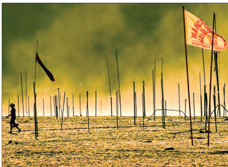
In this photo taken in the early morning of April 13, 2020 a woman walks past flag poles marking where beach kiosks renting chairs and selling drinks would normally be, on Copacabana beach, in Rio de Janeiro, Brazil amid the coronavirus pandemic.

But Bolsonaro, who has railed against stay-at-home measures and face masks, continued his campaign to keep