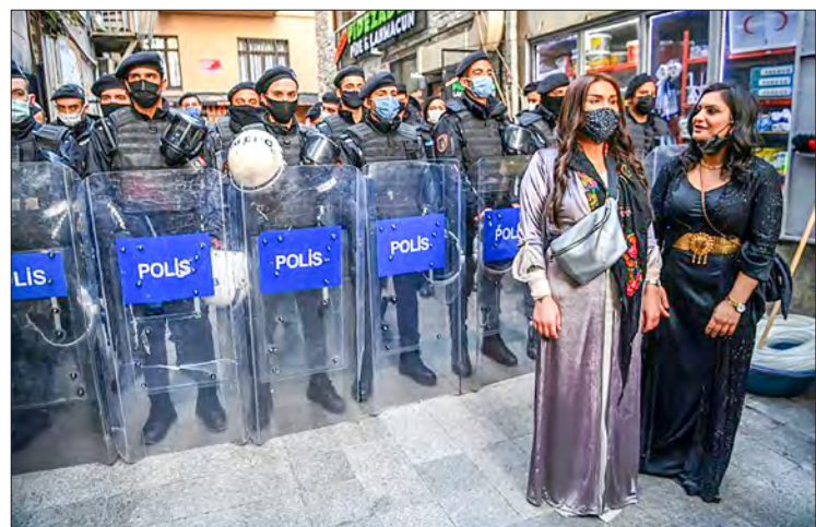
A recent protest for women's rights in Istanbul.

TURKEY sparked both domestic and international outrage Saturday after it withdrew from