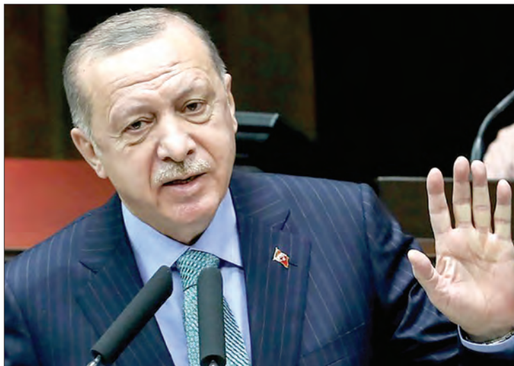
President Recep Tayyip Erdogan's dislike of high interest rates has remained a constant in Turkish politics.

Analysts say the new central banker subscribes to Erdogan's unorthodox belief that higher interest rates cause inflation.