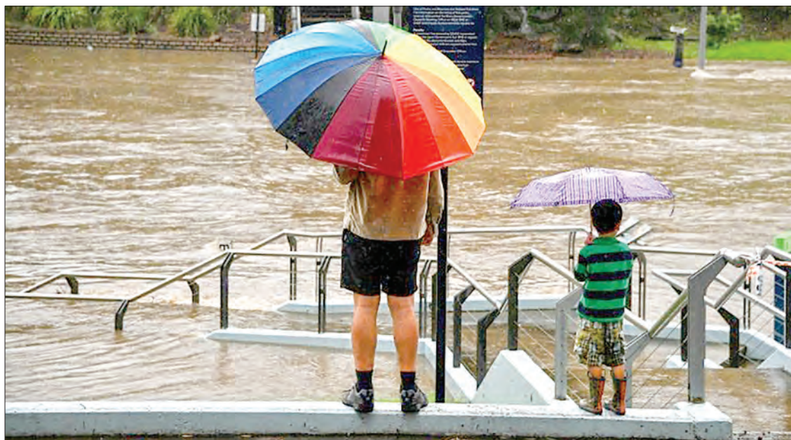
Forecasters warned the heavy rains were set to continue through Saturday ‘potentially leading to life-threatening flash flooding.’

MASS evacuations were ordered in low-lying areas along Australia’s east coast Saturday as torrential rains caused potentially “life-threatening” floods across a region already soaked by an unusually wet summer, officials said.