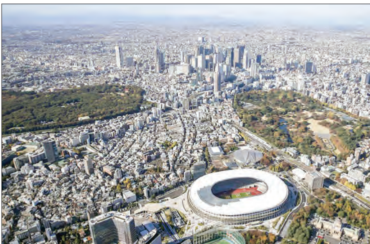
The National Stadium (seen from the Shibuya Sky observation deck) is the main venue for the much-delayed Tokyo Games.

TOKYO — Olympic organizers meet Saturday (Mar 20) for talks expected to bar overseas fans from this summer's pandemic-delayed Tokyo Games, in a bid to reduce virus risks and win over a sceptical public.