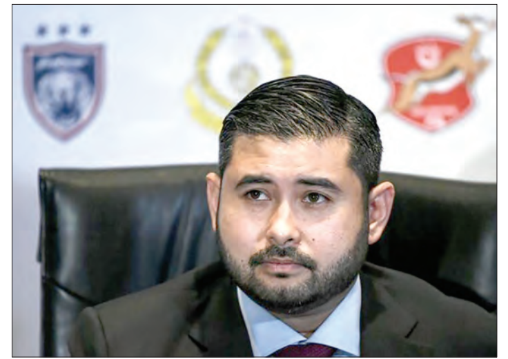
Tunku Ismail Sultan Ibrahim, crown prince of Johor, is eyeing a stake

Earlier this month, Tunku Ismail sparked speculation that was interested in buying Valencia with a series of Instagram posts. He had said the club needed someone who is "hungry for success", adding that he was motivated by "creating history". —AFP ■