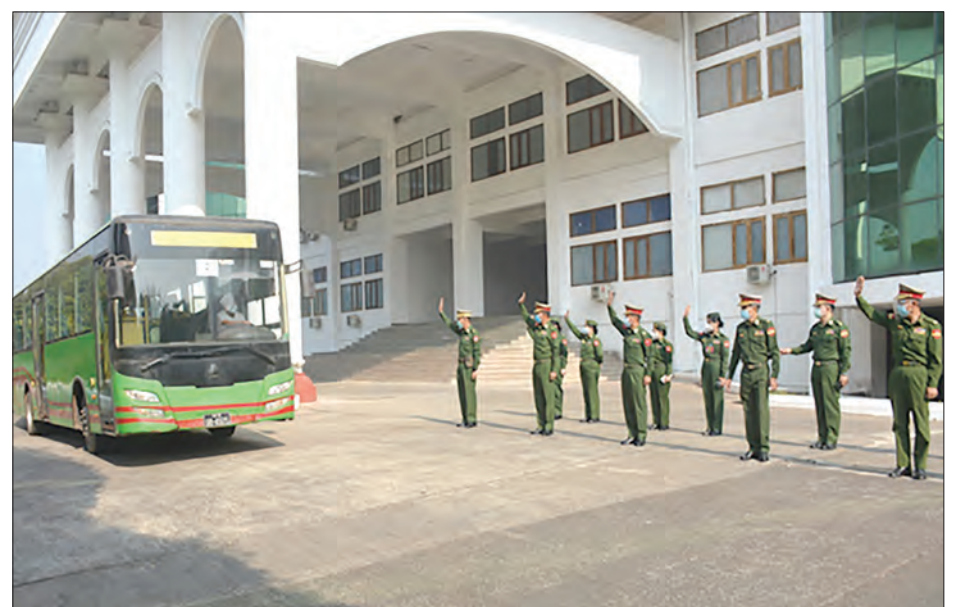
The 15 th batch of volunteer Tatmadaw medical team is leaving for Phaunggi for exchange of duty.

consisted of medics, medical specialists, and nurses supporting medical treatments to accelerate the COVID-19