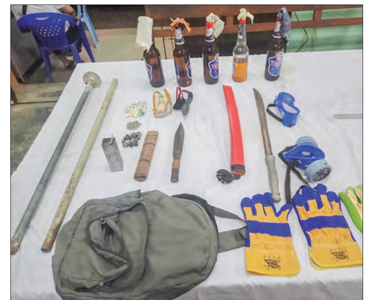
Equipment used in riots are seized.

Deterrent action will be taken against them under the law for keeping equipment used in violent acts in possession. —MNA