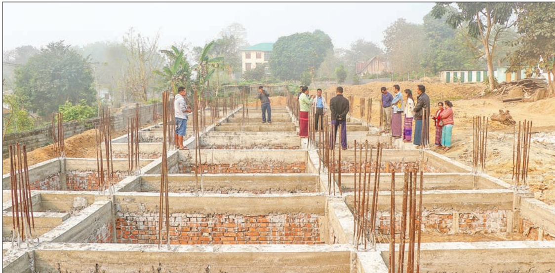
The housing quarter is a two-storeyed RC building, and it is 120 feet in length and 130 feet in width.

MONG Hpyak township administration committee chairman and township construction committee members inspected the construction site of the housing quarters construction in Basic Education High School (BEHS) Mong Hpyak compound in Shan State (East) at 8 am on 17 March.