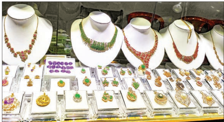
The pure gold fetched about K1,362,000 per tical on 18 March in the domestic market while the global gold price hit US$1748 per ounce.

EFFORTS are being made to stabilize and develop the gold market in Myanmar, said U Myo Myint, the chairman of Yangon Region Gold Entrepreneurs Association (YRGEA).