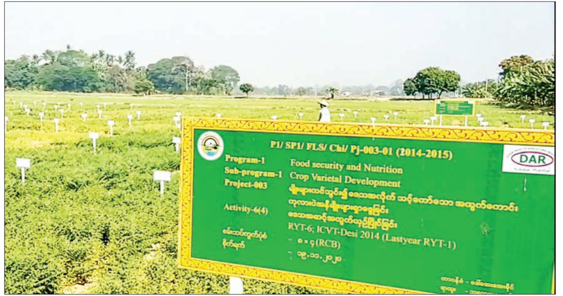
The chickpeas are cultivated in Yangon, Mandalay, Bago, Sagaing and Ayeyawady regions and Nay Pyi Taw. There are 890,000 acres of chickpeas across the country.

"The prices usually fluctuate, depending on supply and demand. When the peas are loaded on the ship, the prices climb up. At present, the market is slowing down due to transportation problem and transaction difficulties," said a trader from Mandalay sharing his opinion.