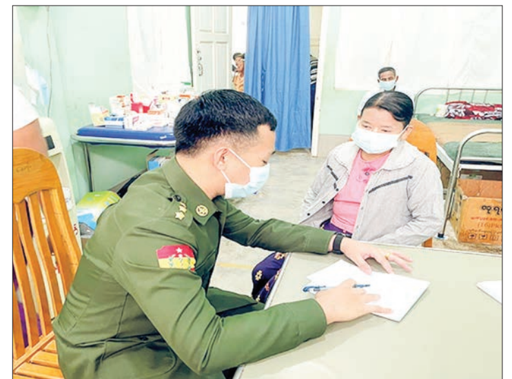
Local people seen under healthcare services provided by Tatmadaw medical corps.

THE Tatmadaw medical teams consisted of Tatmadaw doctors, specialists, and nurses, have been providing necessary medical treatments to the patients in military hospitals and public hospitals.