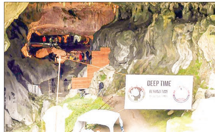
The entrance to the Lombrives cavern outside Tarascon-sur-Ariege in southern France, site of the 40-day "Deep Time" isolation experiment.

The main subject of study, however, will be the seven men and seven women, aged 27 to 50, as well as Clot, who must adapt to a constant temperature of 12 degrees Celsius (54 Fahrenheit) and 95 per cent humidity. —AFP ■