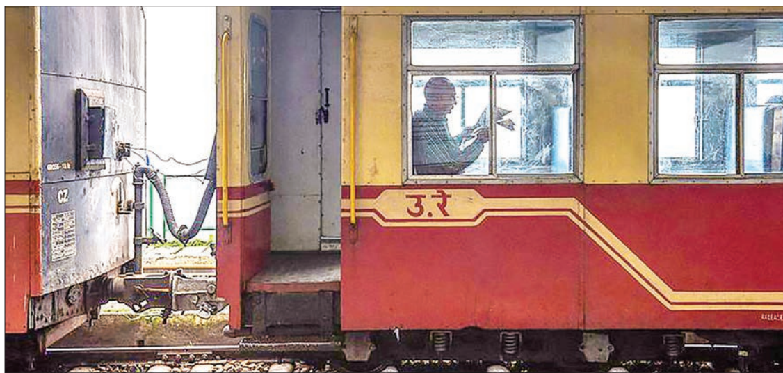
The "mechanical failure" hit service from New Delhi to Tanakpur, Uttarakhand state, after the driver slammed on the brakes to avoid hitting an animal on the tracks.

AN Indian passenger train rolled backwards for 35 kilometres (20 miles), reports said Thursday, in an alarming but injury-free incident caught in a video that went viral on social media.