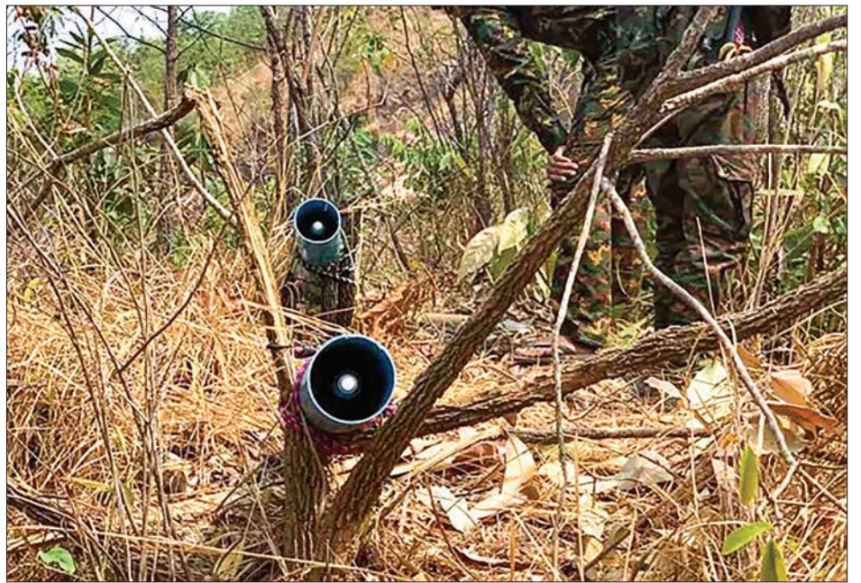
Terrorist group attack the military command in Mawlamyine, with 107MM rocket-propelled grenades.

THE terrorist group (leader and members still investigating) made some attacks on Warkadote Dam and its vicinity areas on Yangon-Mandalay highway road in Baw Net