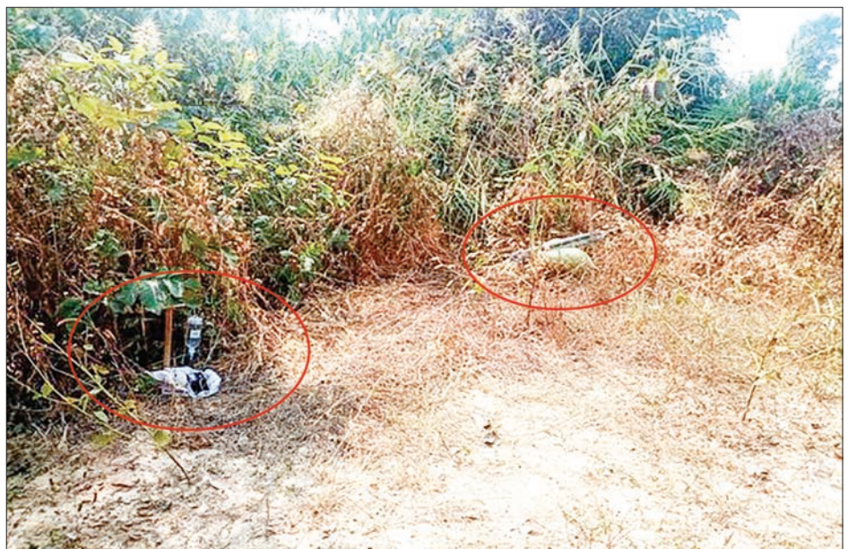
Military battalion under attack with 107MM rocket-propelled grenades in Baw Net Gyi.