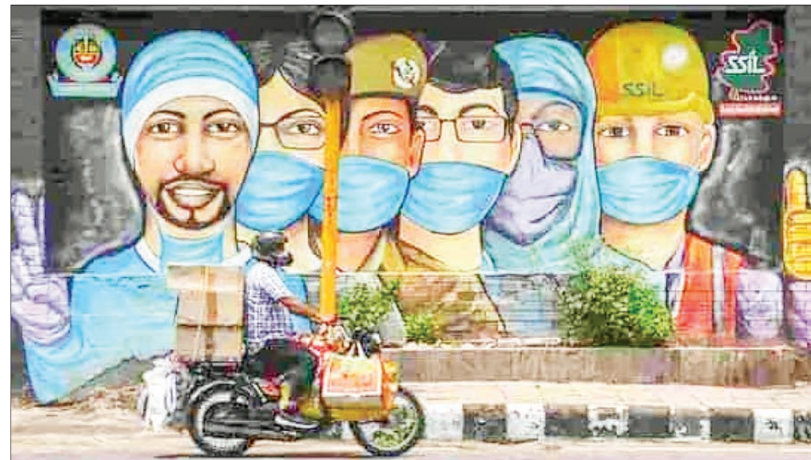
A motorist passes by a mural of frontline workers against coronavirus at RK Puram in New Delhi on July 25.

whether meteorological influences "have a meaningful influence on transmission rates under real world conditions". They also highlighted that evi-