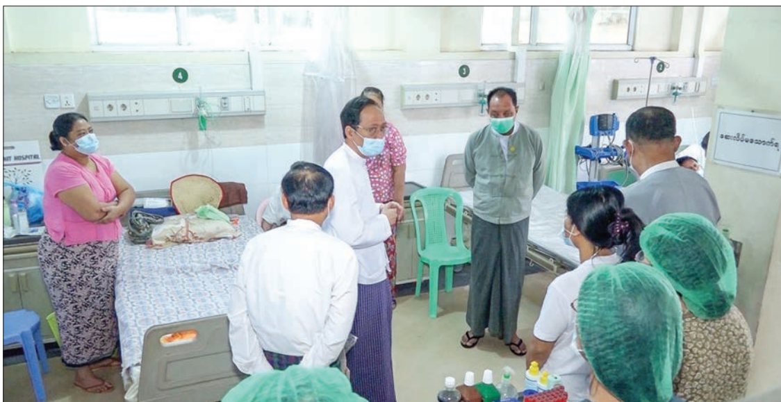
Union Minister Dr Thet Khine Win makes an inspection tour around hospitals in Nay Pyi Taw yesterday.

UNION Minister for Health and Sports Dr Thet Khine Win inspected Eyes, Ears, Nose, Throat and Head surgical operation Hospital, Pobbathiri General Hospital and Nay Pyi Taw General Hospital (1000-bed) in Nay Pyi Taw yesterday.