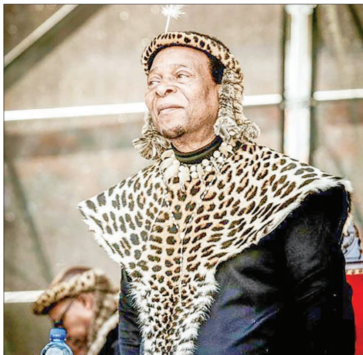
King Goodwill was well known for his leopard-skin poncho -- a traditional badge of rank in Zulu culture.

power provider Eskom suspended a week of rolling blackouts for a few hours to allow people to follow the ceremony on television.