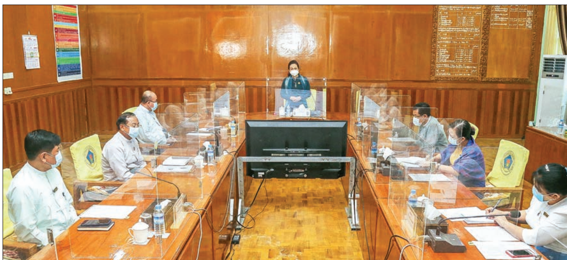
Union Minister Dr Thet Thet Khine chairs the meeting to discuss the Protection of Violence against Women Law (draft) yesterday.

UNION Minister for Social Welfare, Relief and Resettlement Dr Thet Thet Khine attended