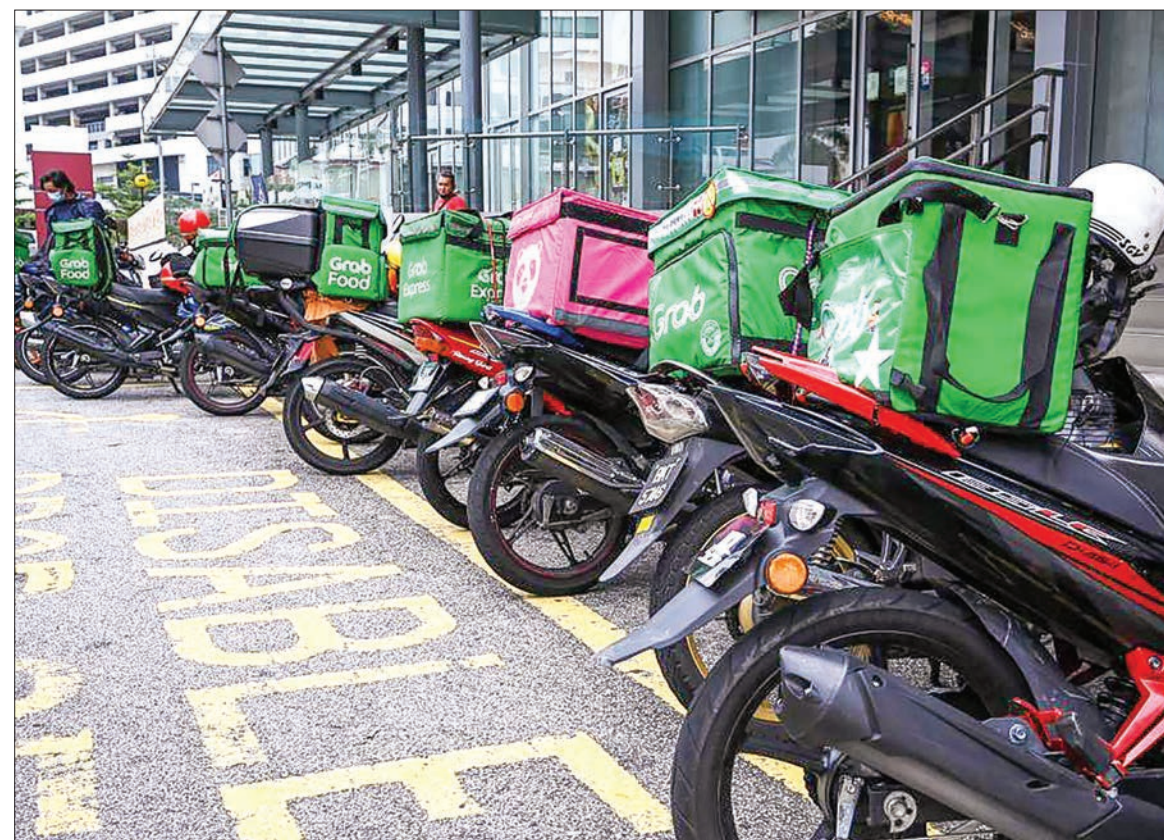
Food delivery companies have seen their revenues soar.

The home food delivery business also came of age as people dined-in instead of out, with restaurants and bars either restricted or closed completely.