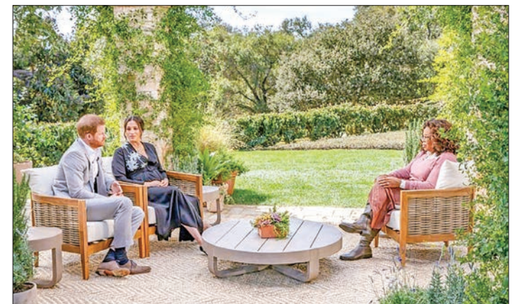
Prince Harry and his wife Meghan sit down with Oprah Winfrey for a TV interview that rocked the royal family.