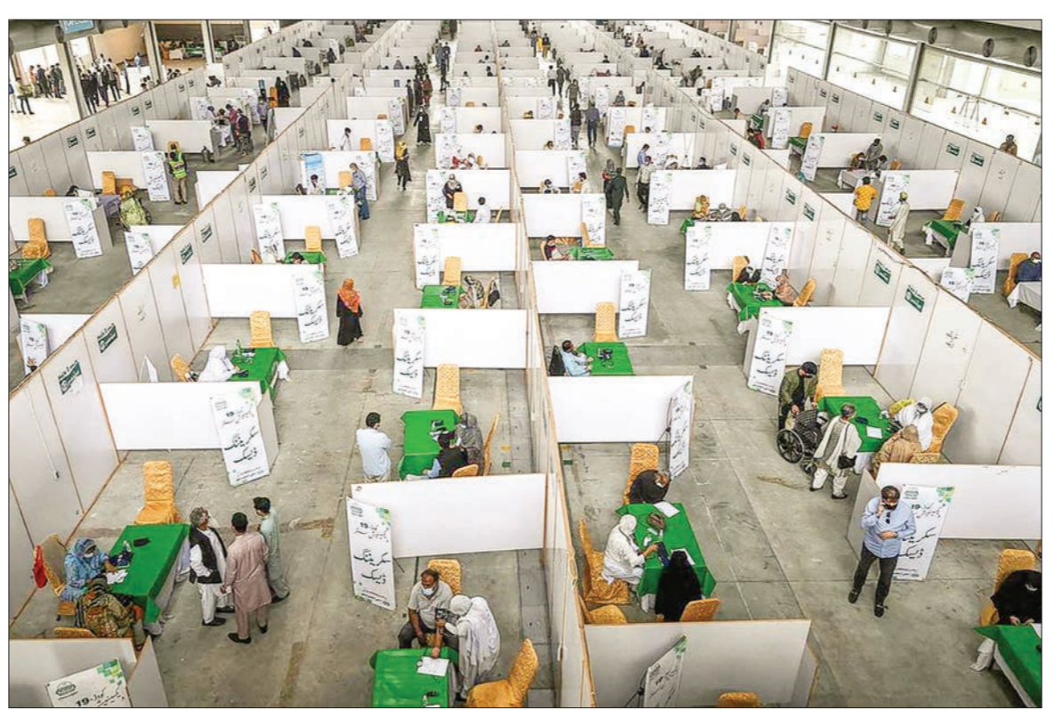
Senior citizens receive doses of the Sinopharm Covid-19 vaccine at an inoculation venue inside an Expo Centre in Lahore, Pakistan.

The British-Swedish jab has been dogged by controversy from early on in its rollout, after some countries initially recommended it for people over the age of 65 and then backpedalled, saying there was insufficient