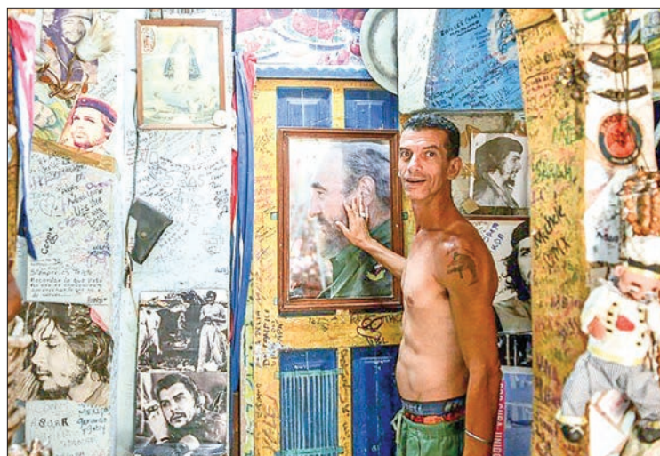
Fidel Castro is still widely hailed as Cuba's revolutionary father and savior.

ceded the Cuban presidency to Miguel Diaz-Canel, a major shift for the country that still largely sees Fidel Castro as its revolutionary father and savior.