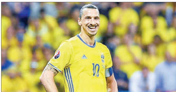
Zlatan Ibrahimovic announced his return to international football after nearly five years away on March 16, 2021.

PARIS — Zlatan Ibrahimovic looks set to face Manchester United in AC Milan's Europa League showdown with the English giants on Thursday (March 18) as the resurgent 'Rossoneri' aim to announce their return to the big stage.