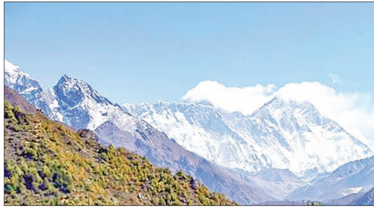
Nepal has opened its borders to climbers after a closure forced by the coronavirus, which wiped out last year's season on the world's highest peak Mount Everest.

At the time, there was a ban on foreign visitors because of the pandemic but Nepal made an exception and granted a permit to the sheikh's team.