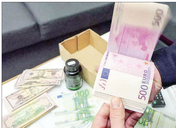
Bulgarian authorities busted a university printworks in capital Sofia that was making fake euro and dollar bills worth millions.