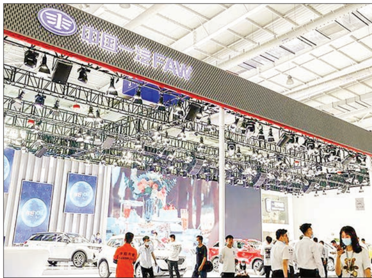
Photo taken on July 12, 2020 shows the display area of FAW-Bestune during the 17th China Changchun International Automobile Expo in Changchun, northeast China's Jilin Province.

CHINA'S automotive aftermarket is estimated to have hit 1 trillion yuan ($153.78 billion) in