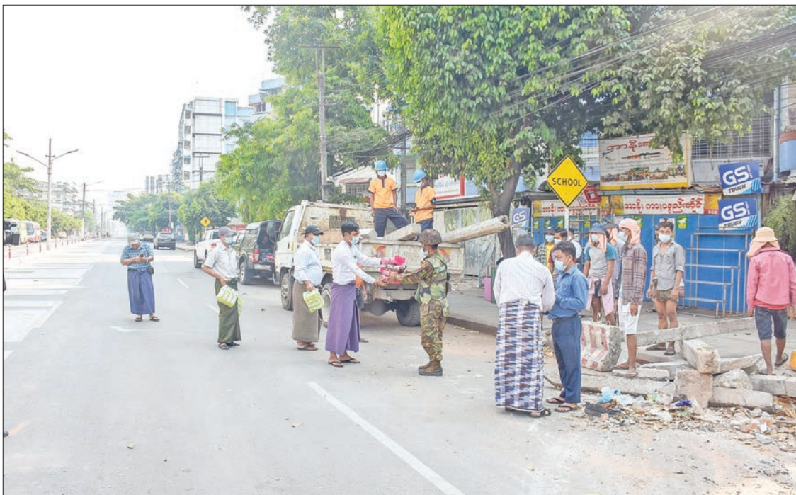
Tatmadaw members, Myanmar Police Force and municipal staff collectively removed the roadblocks on Insein road in Hline Township of Yangon Region yesterday.

Moreover, they removed barbed wires, sandbags, bamboo mattings, poles, woodblocks, used tires, stones, bricks, iron bars and old concrete mixers at 41 places on Yankin road, Yan Shin road, Moe Kaung road (between Thitsar and Aung Zeya streets), Kaba Aye Pagoda Road, Parami road, West Horse Course road, Industrial (1) road (in front of CBM) to facilitate the public transport. — MNA