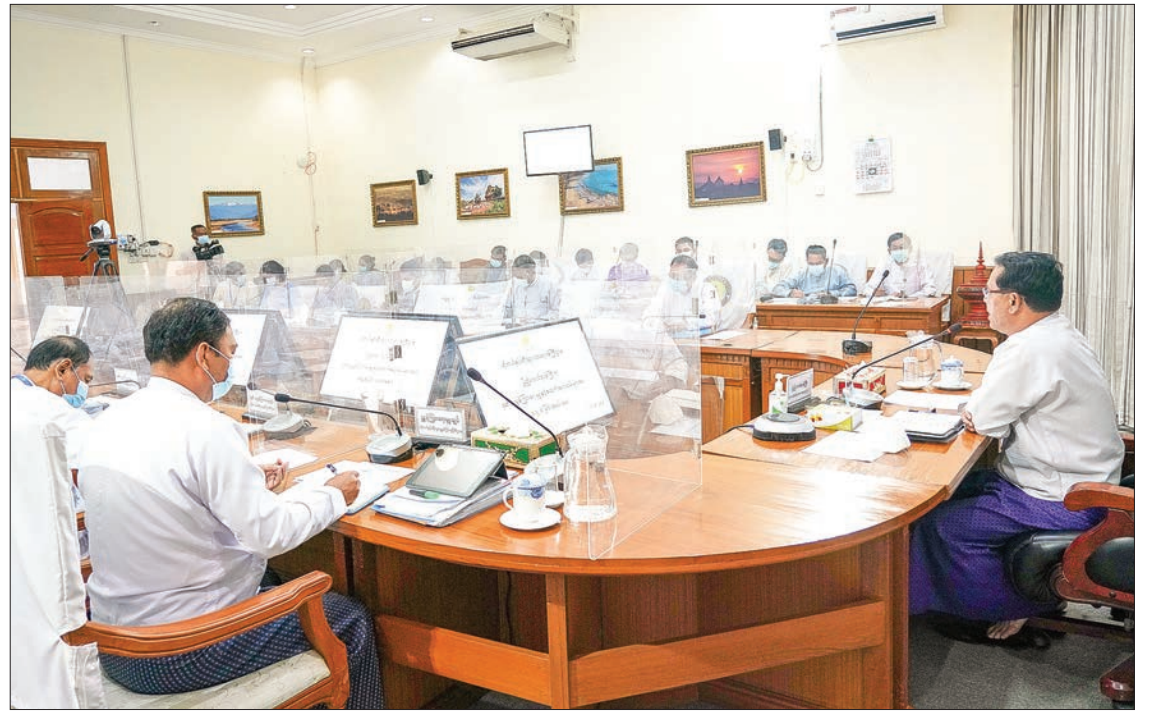
Union Minister U Maung Maung Ohn chairs the MoHT coordination meeting to discuss tourism revival on 17 March 2021.

Then, the attendees to the meeting coordinated the meeting by presenting their work plans. — MNA