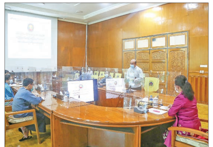
Union Minister Dr Thet Thet Khine chairs the meeting to discuss the ways to solve the prolonged conflicts in Rakhine State.

THE Ministry of Social Welfare, Relief and Resettlement organized a meeting on implementing the recommendations on Rakhine State yesterday.