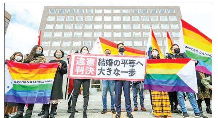
But the verdict rules that the failure to recognize same-sex marriage violates constitutional requirements for equality before the law.

Japan's constitution stipulates that "marriage shall be only with the mutual consent of both sexes". —AFP ■