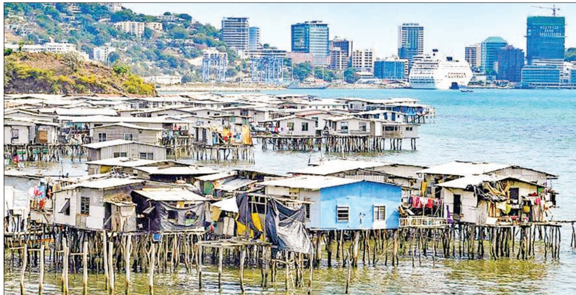
Australia says hospitals in the PNG capital Port Moresby are detecting Covid in about half of new patient admissions.

PAPUA New Guinea's health minister on Wednesday told AFP the country's record wave of coronavirus infections will "spike" further in coming weeks, calling on drug-maker AstraZeneca to urgently deliver one million vaccine doses to staunch the looming crisis.