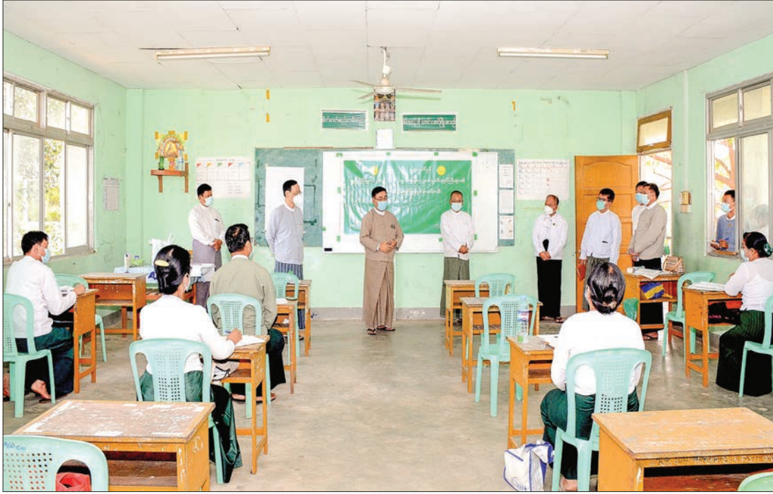
MoE minister seen meeting high and middle school principals, who are attending the management, finance and education refresher course, to prepare for reopening schools.