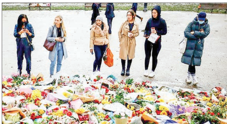
Many local women say they don't feel safe alone on the streets of London.

A British police officer was remanded in custody when he appeared in court Tuesday charged with the kidnap and murder of a woman who vanished as she walked home in London.