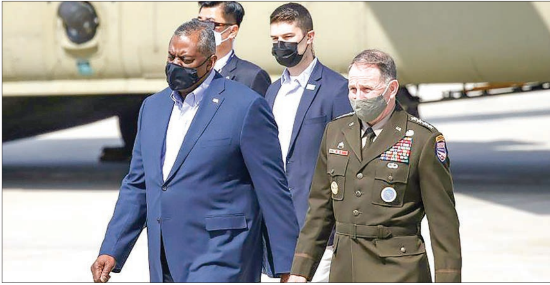
Talks between US Secretary of Defence Lloyd Austin (L) and South Korean officials are expected to focus on the North and China.

PENTAGON chief Lloyd Austin arrived in Seoul on Wednesday with top US diplomat Antony Blinken following for talks with South Korean officials to bolster a united front against an increasingly assertive China and the nuclear-armed North.