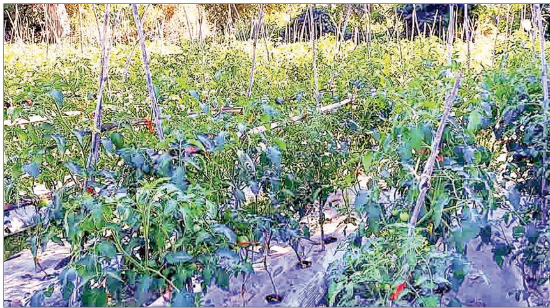
The growers from Pwintbyu township are annually cultivating the tomatoes in September. The nursery plants are transplanted to the ground after 15 days, and the fruits could be yielded after three months.

THE villagers from Pwintbyu township in the Magway region cultivate the vegetables and crops on a commercial scale using the Mone creek water and underground water. Tomato is the leading commercial crops for their villages.