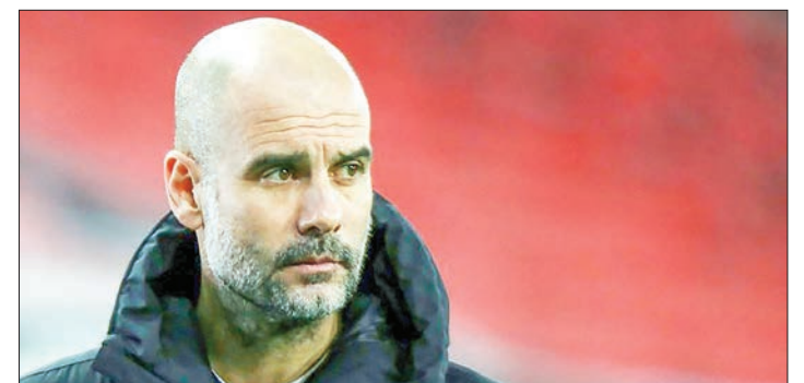
Manchester City manager Pep Guardiola.

They look almost certain to win a third Premier League title in four seasons, face Everton in the FA Cup quarter-finals on Saturday and play Tottenham in the final of the League Cup in April. ■