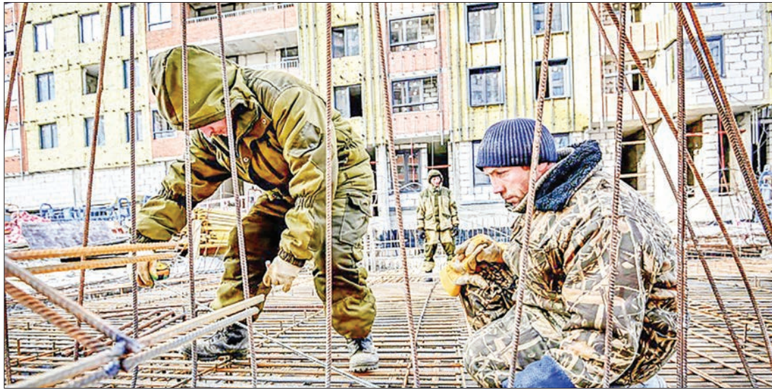
With millions of foreign labourers from the former Soviet Union stuck at home due to pandemic-induced border closures, Russian companies have had to adapt, hiring more expensive workers from the country's regions.

Now, with millions of foreign labourers from the former Soviet Union stuck at home due to pandemic-induced border closures, Russian companies have had to adapt, hiring more expensive workers from