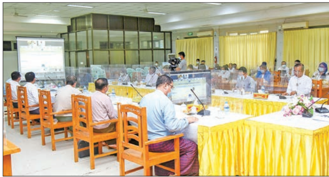
Union Minister U Myint Kyaing presides over the CMP supervisory committee meeting in Nay Pyi Taw yesterday.

The CMP Supervisory Committee is responsible for scrutinizing the company's business application or businessperson, which intends to operate under the CPM system. It will check whether the CMP activities are