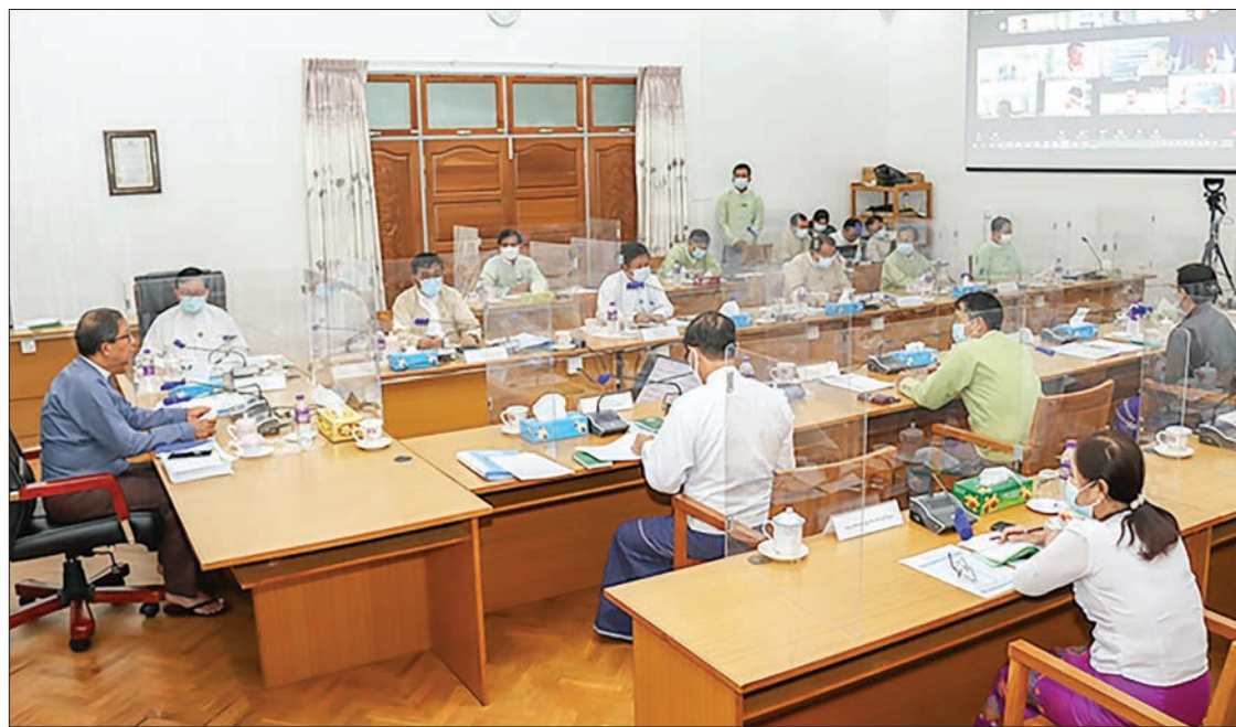
Union Minister U Tin Htut Oo chairs the MoALI meeting on drinking water supply for the water-scarce villages in summer yesterday.

Director-General for Rural Development Department U Khant Zaw discussed the summer water scarcity con-