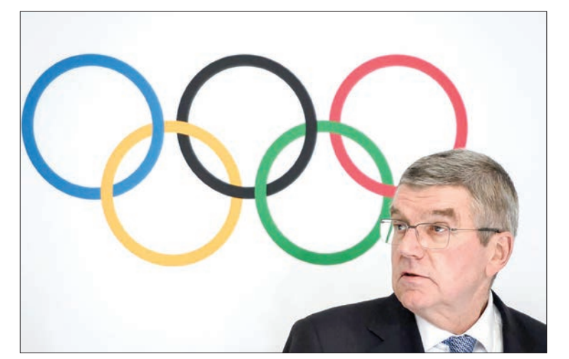
Competitors at this year's Tokyo Olympics and the 2022 Beijing Winter Games will be offered coronavirus vaccines bought from China, Olympic chief Thomas Bach announced Thursday in a significant move for the holding of the Covid-delayed Tokyo Games.

"The IOC will also pay for two doses more that can be made available to people in that country," Bach said, describing it as a "demonstration of solidarity"