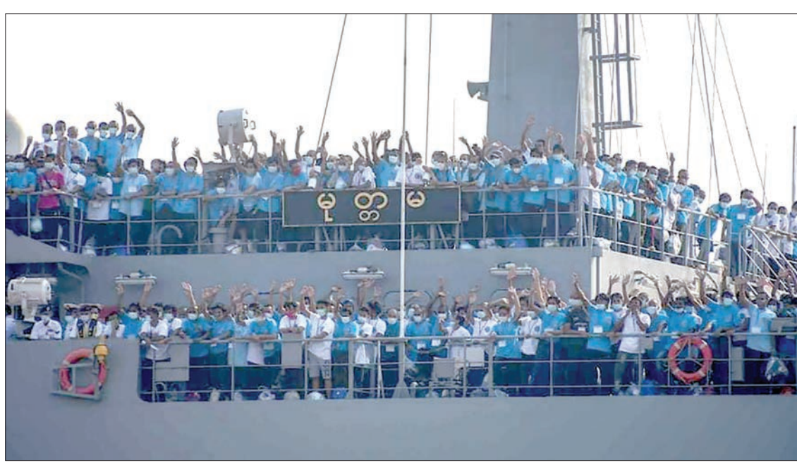
Returnees from Malaysia onboard Naval Vessel "Mottama".

(B) Following customs and traditions of all ethnic nationalities and preservation and safeguarding of cultural heritage and