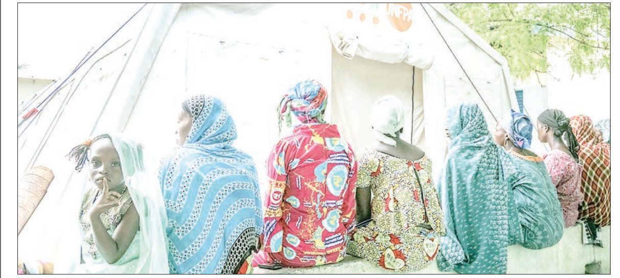
Some 12 million women globally are estimated to have experienced disruptions in family planning services due to the COVID-19 pandemic.

One year since COVID-19 was officially declared a pandemic, the UN's reproductive health agency said on Thursday that an estimated 12 million women have experienced disruptions to their family planning services.