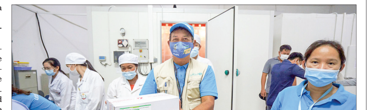
Cambodia takes delivery of 324,000 doses of the AstraZeneca COVID-19 vaccine through the COVAX Facility.

"Certainly, we are looking at the Chinese vaccine and there is the Johnson & Johnson vaccine