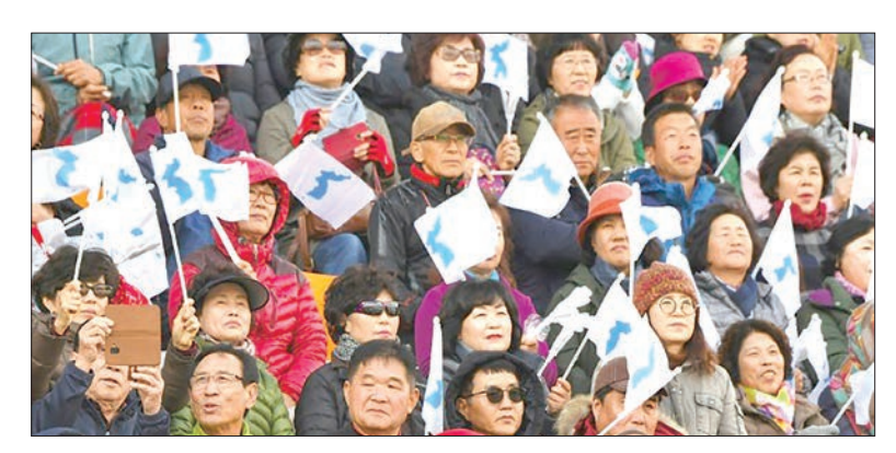
South Korean supporters often wave 'Unification flags' at sporting fixtures involving the two Koreas.

SEOUL — South Korea will host North Korea for a series of World Cup and Asian Cup qualifiers later this year, the Asian Football Confederation said on Friday.