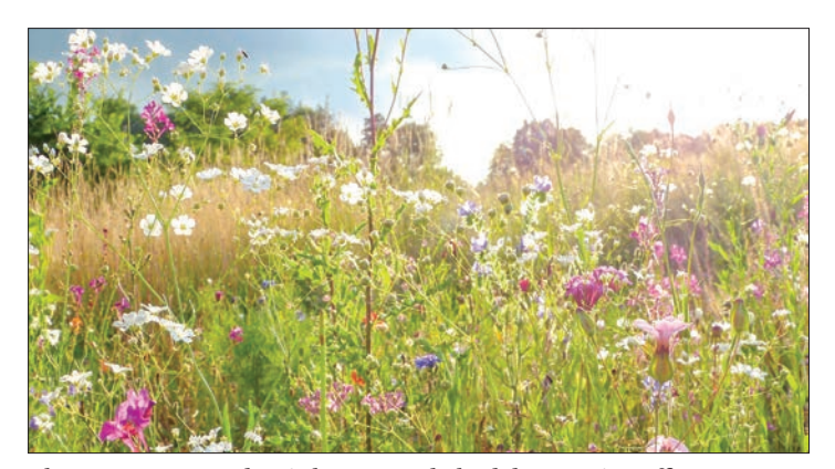
The COVID-19 pandemic has not only had devastating effects on humans, it has also heavily impacted efforts to safeguard natural ecosystems and habitats around the globe.

"There has been a massive impact on wildlife tourism, so there has been a massive loss of jobs, loss of income," PARKS journal co-editor Adrian Philips, of IUCN's World Commission on Protected Areas, told AFP.— AFP ■