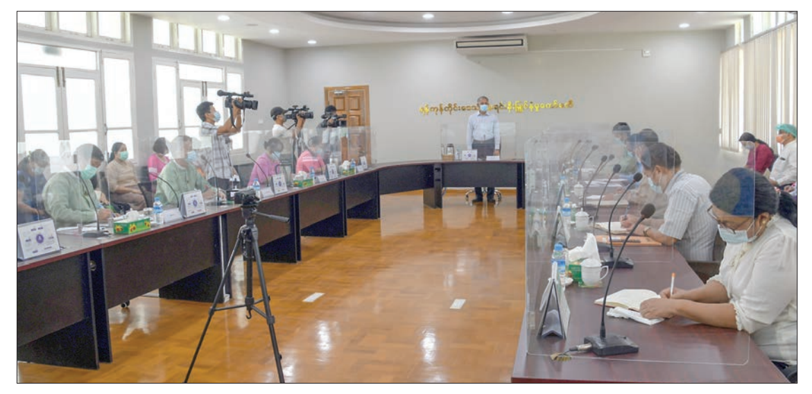
Union Minister U Aung Naing Oo holds talks with One-Stop Service officials on 12 March 2021.

Firstly, Union Minister for Investment and Foreign Economic Relations, U Aung Naing Oo delivered an opening speech. In his speech, Union Minister highlighted that in order to make it easier for doing business; the procedures of relevant ministries are being streamlined and simplified.