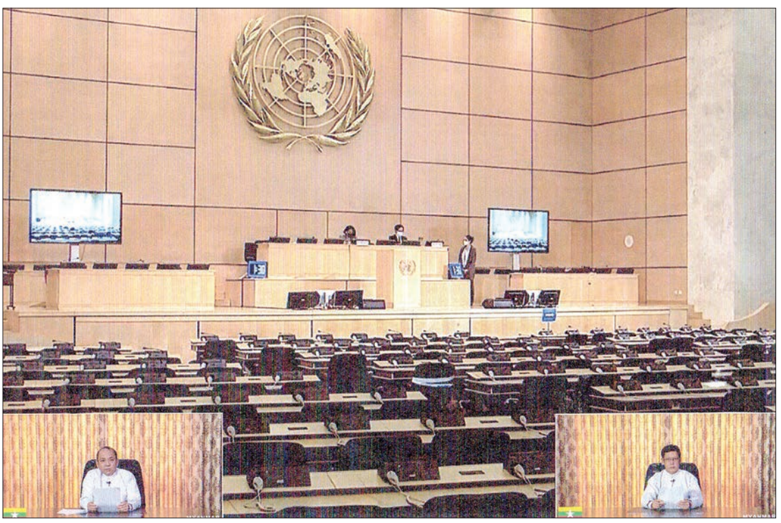
The 46<sup>th</sup> Session of the UN Human Rights Council in progress while Myanmar delegates delivered Statements on 11 and 12 March 2021.

At the Interactive Dialogue with the Special Rapporteur on the Situation of Human Rights in Myanmar, the Permanent Secretary of the Ministry of Foreign Affairs mentioned that Myanmar has consistently opposed country-specific mandates which run contrary to the principles of universality, impartiality, objectivity, non-selectivity and non-politicization in addressing human rights issues of the concerned country. However, he