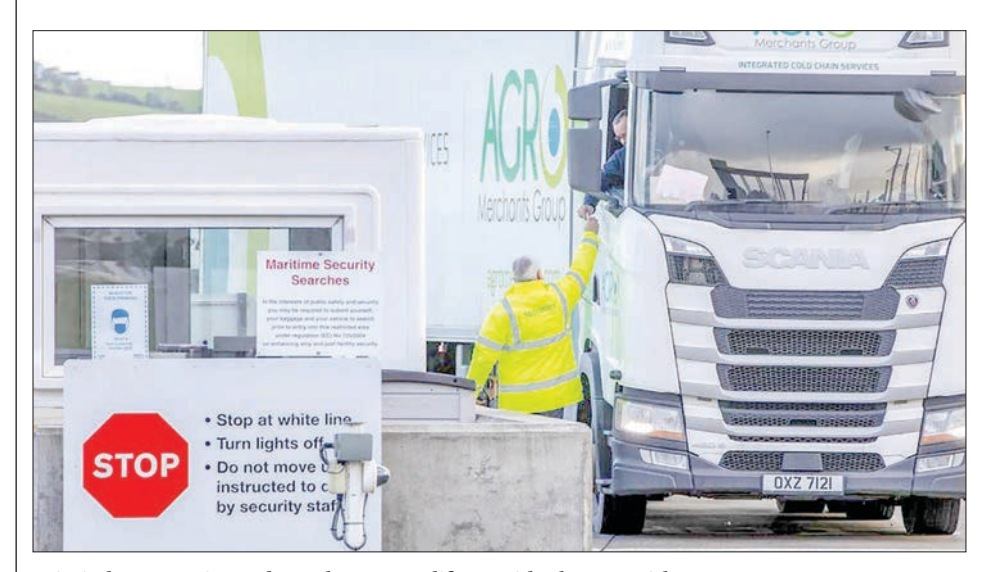
Britain has experienced a rocky start to life outside the EU, with some UK exporters complaining of huge hurdles to previously seamless continental trade.

BRITAIN'S economy hit reverse in January on renewed coronavirus curbs while the nation's post-Brexit EU goods exports suffered a record collapse, official data showed on Friday.