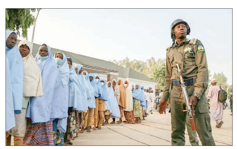
Security forces have been unable to prevent a string of kidnap attacks on Nigerian schools.

"However, about 30 students, a mix of males and females, are yet to be accounted for." The commissioner said some of the rescued students were injured during the operation and had been hospitalized in a military facility.