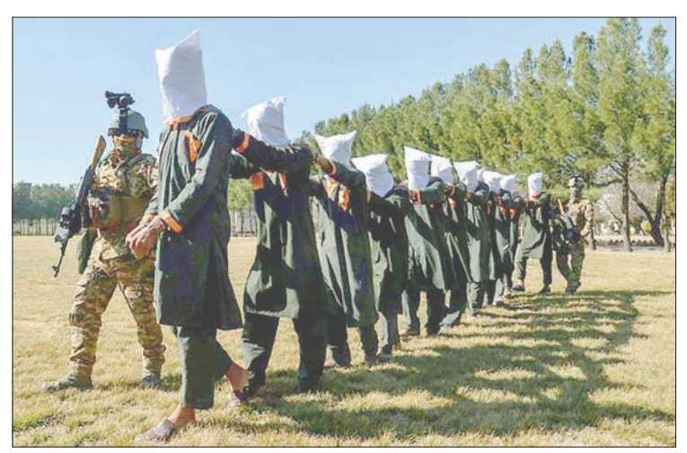
Afghan security forces escort suspected Taliban fighters.

inclusive administration would be a logical solution to the problem of integrating the Taliban