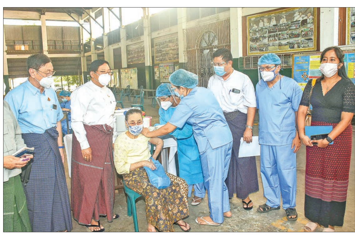
Health workers are administering the Covishield vaccine to the over 65-year-old woman in Yangon Region on 6 February 2021.

At the first meeting of the Foreign Policy Committee held on 18 February, Chairman of the State Administration Council Senior General Min Aung Hlaing discussed foreign policies, conditions for building good relations with neighbouring countries, plans for Myanmar citizens abroad, ways to boost international relations and cooperation, and international economic cooperation.