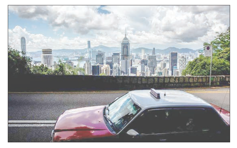
The cable, named the Pacific Light Cable Network, was originally intended to link the United States, Taiwan, Hong Kong and the Philippines.

The social networking giant and several telecom companies filed their first construction permit in 2018, to connect two sites in California to Hong Kong and Taiwan. The project was supposed to facilitate communications through fiber optics capable of carrying large volumes of data with very low waiting times. —AFP