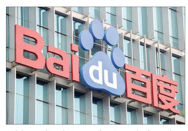
Baidu became China's dominant search engine provider after Google was blocked in 2010 - and in recent years has branched into services including maps and food delivery.

CHINESE search engine company Baidu on Thursday said it was seeking as much as $3.6 billion in a secondary listing on the Hong Kong stock exchange.