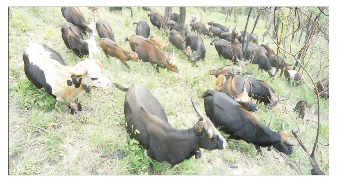
Most of the regions in Chin state are breeding gayals on a manageable scale. Then, they are selling a three-year-old gayal for K 300,000 and a six-year-old gayal for K 700,000 in the open season.

"In Chin hills, the number of gayal breeders has declined year by year. So, we need some support such as necessary aid for the gayal breeders. The gayals graze and the pastures of the gayals are deteriorating from year to year. There is also