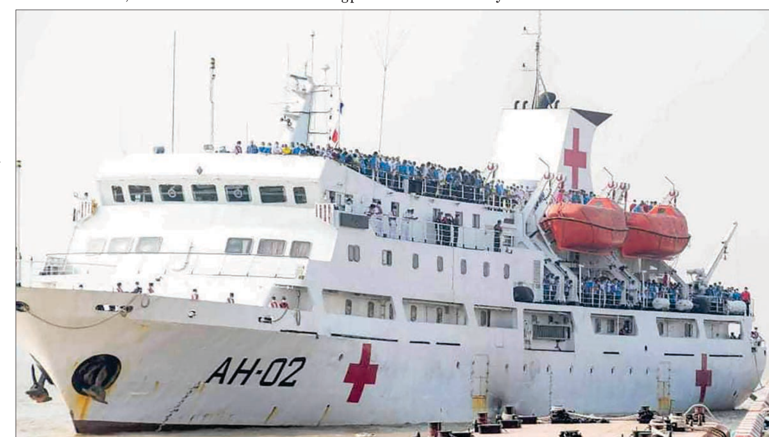
Returnees from Malaysia onboard Naval Vessel.