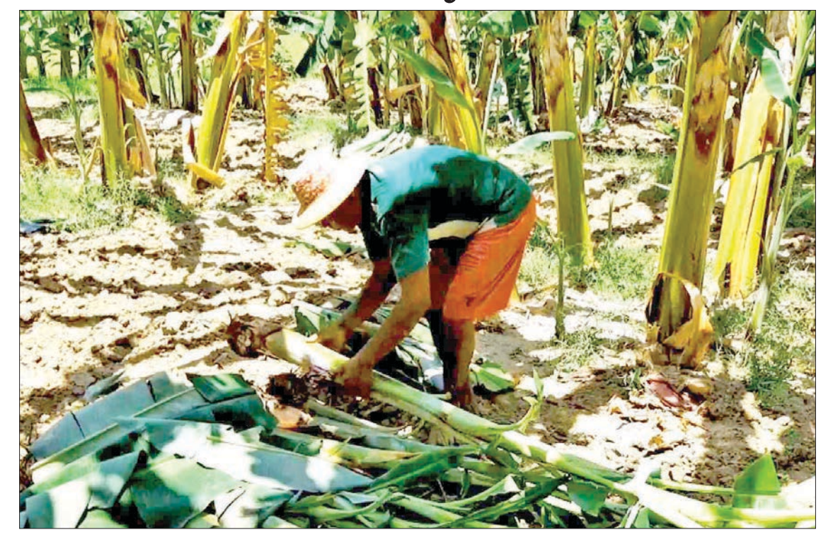
Most of the banana plantations are found not only in Tamanyin village but also in the villages near Mone creek.

THE local growers are happy with earning income from growing Pheegyan banana in Pwintbyu Township, Magway Region. They are also having extra income from selling pheegyan banana nursery plants, according to the pheegyan growers from Tamanyin village in Pwintbyu Township.