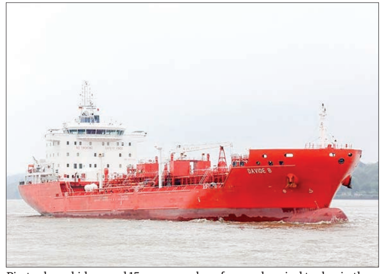
Pirates have kidnapped 15 crew members from a chemical tanker in the Gulf of Guinea after boarding the vessel off the coast of Benin, the ship's Dutch owners said on Friday.

PIRATES have kidnapped 15 crew members from a chemical tanker in the Gulf of Guinea after boarding the vessel off the coast of Benin, the ship's Dutch