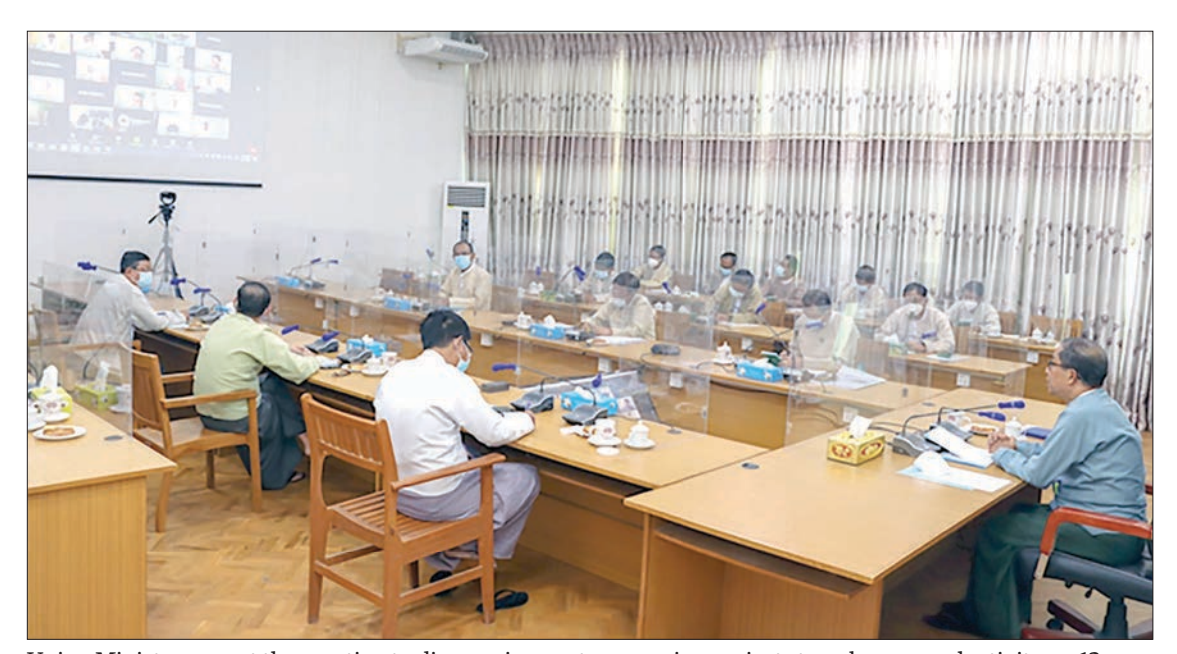
Union Minister seen at the meeting to discuss river water pumping projects to enhance productivity on 12 March 2021.

The meeting also discussed the use of modern agricultural-related technology in river water pumping areas, effective use of water, technical supports, the formation of WUG (Water Users Group)