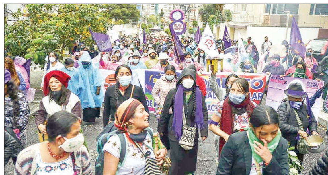
Women march during a demonstration within the commemoration of the International Women's Day in Quito on 8 March, 2021.

In Spain, Madrid banned gathering over the virus, but a few dozen women gathered nevertheless, standing at a safe distance from each other to hold