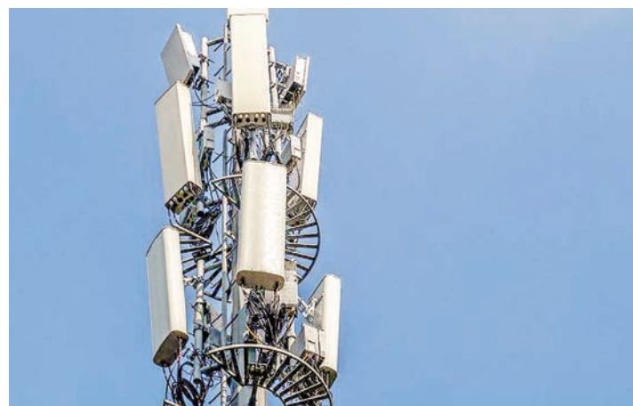
A cellphone tower used for a 5G network.

The initial public offering (IPO) “implies a total market capitalisation for Vantage Towers of €11.4 billion to €14.7 billion,” it added. Digital Colony, a digital infrastructure investor and operator based in the US, has agreed to be a cornerstone investor in the IPO, alongside RRJ, a global equity fund based in Singapore, with commitments of €500 million and €450 million, respectively.—AFP ■