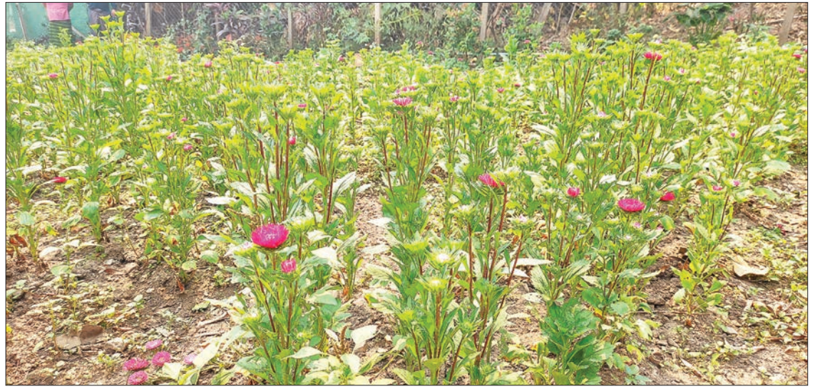
There are only three gardens in Hose village in which the Maymyo flowers are grown.

There are only three gardens in Hose village in which the Ma-