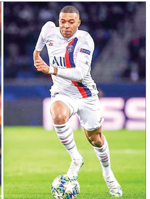
The chances of seeing Lionel Messi at PSG may depend on Kylian Mbappe, whose contract is up at the end of next season.