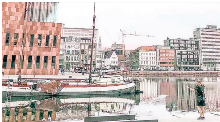
Police in Belgium staged a vast sting operation against drug traffickers Tuesday, with the main focus on the port of Antwerp, a major hub for Europe's cocaine trade.

POLICE in Belgium staged a vast sting operation against drug traffickers Tuesday, with the main focus on the port of Antwerp, a major hub for Europe's cocaine trade.