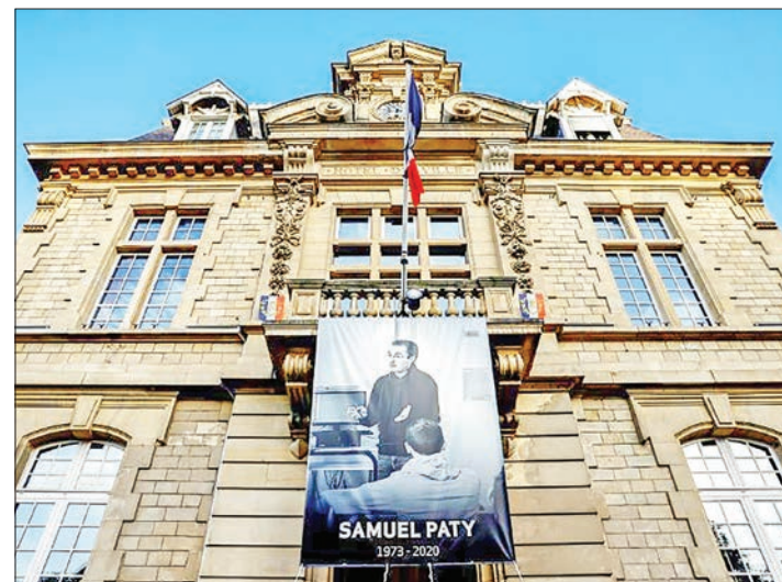
The lawyer for the family of beheaded French teacher Samuel Paty expressed her anger on Tuesday over lies spread on social media which led to the murder.