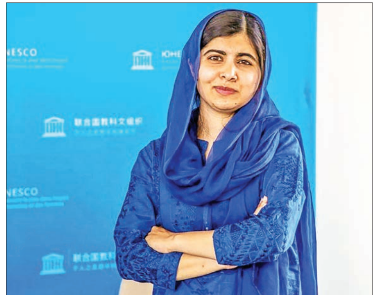
Nobel laureate Malala Yousafzai has signed a multi-year deal to produce content for Apple TV+.

At the time, the Pakistani Taliban had gained a significant foothold in the Swat Valley, imposing a fundamentalist version of Islam on areas they