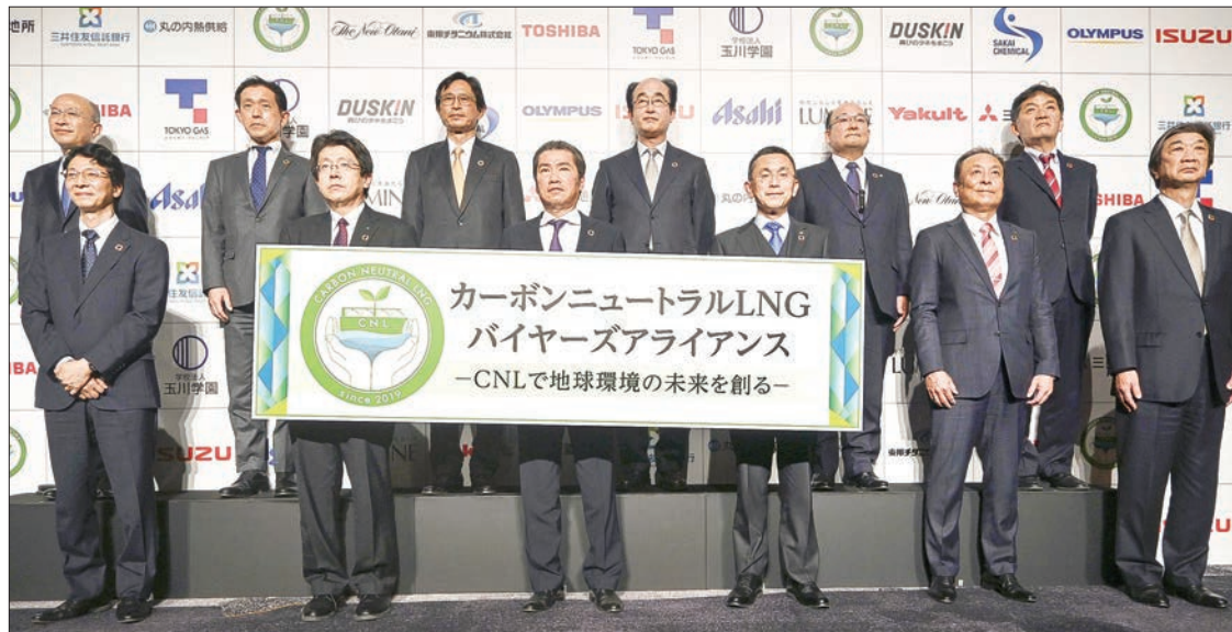
Executives of companies forming an alliance to promote carbon-neutral liquefied natural gas are pictured on March 9, 2021, in Tokyo.

volves energy suppliers engag- ing in green projects such as reforestation to offset CO2 emis-