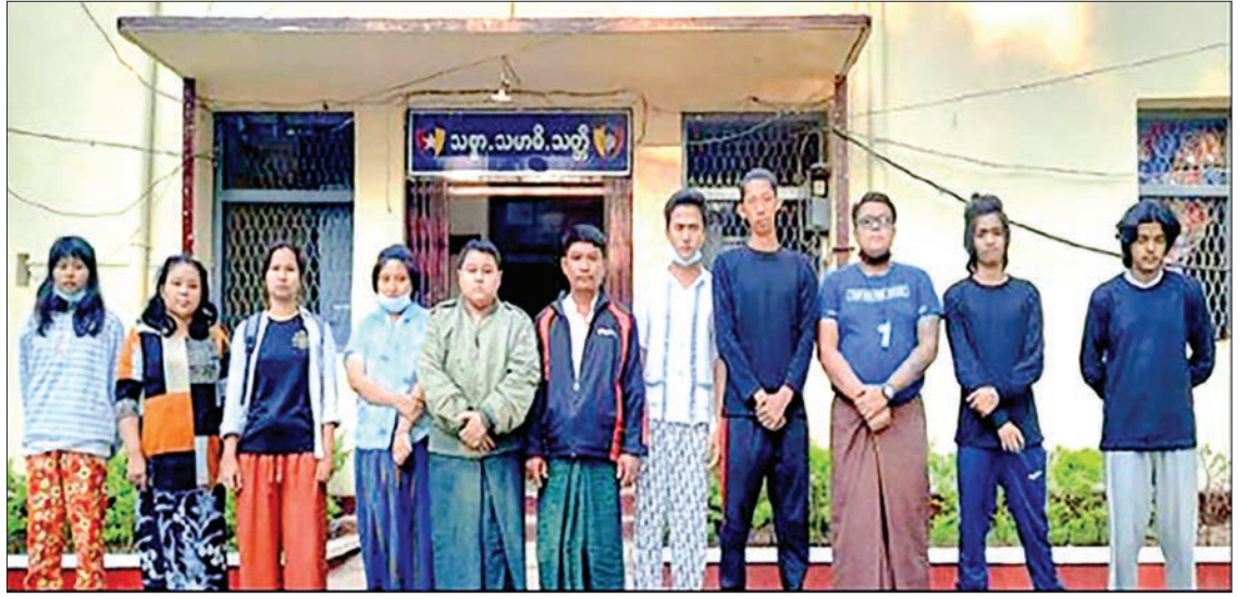
Illegally-founded Rescue Task Force (RTF) are under inspection.

As the donors have demanded to clear accounts of donations, she planned to search