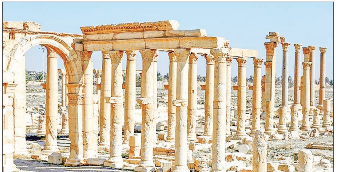
Palmyra, famed for its imposing kilometre-long colonnade, peaked towards the end of the Roman empire and was famously ruled by Queen Zenobia in the 3rd century.

Its imposing kilometre-long colonnade is unique and one of Syria's most recognizable landmarks. When IS jihadists hurtled into Palmyra in May 2015 to expand the "caliphate" they had proclaimed over parts of Syria and Iraq a year earlier, the outcry was global. —AFP ■