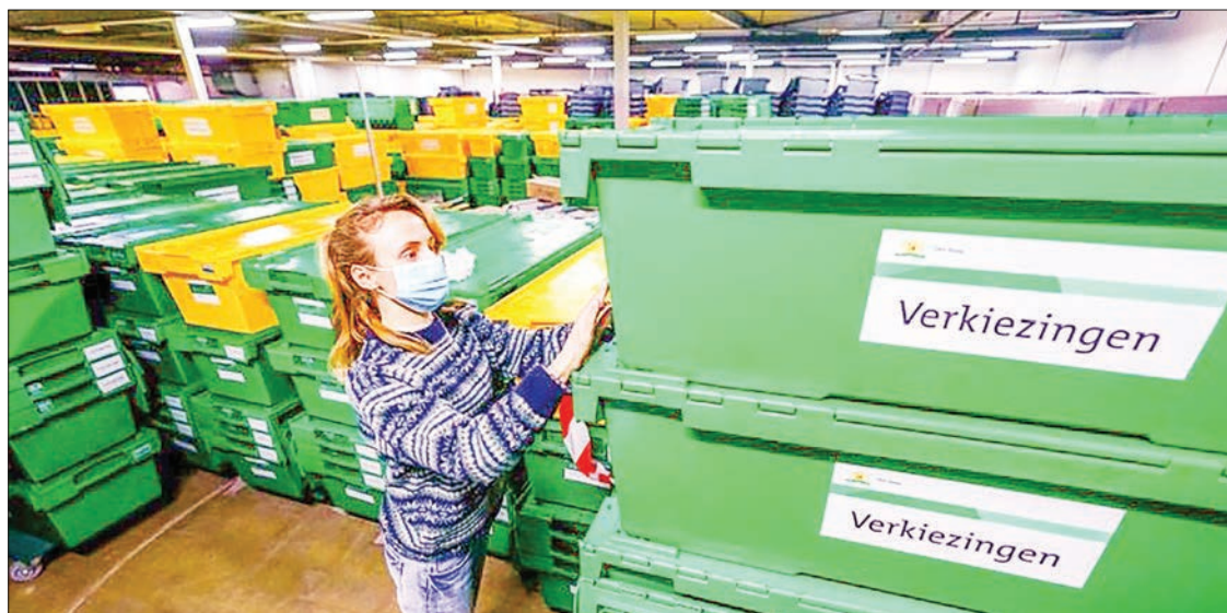
Some Dutch polling stations will open early for elderly and Covid-vulnerable people to vote.