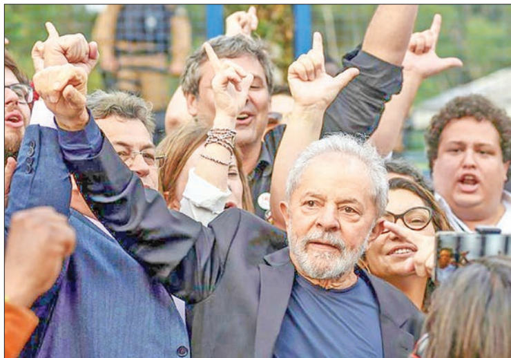
Former Brazilian president Luiz Inacio Lula da Silva, shown here in 2019, has had his graft convictions overturned.

A Brazilian Supreme Court judge on Monday overturned the graft convictions against former president Luiz Inacio Lula da Silva, clearing the way for the left-wing leader to run in the 2022 presidential election.