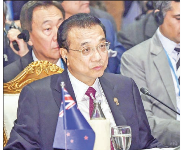
Chinese Prime Minister Li Keqiang attends a summit meeting of countries involved in talks for the Regional Comprehensive Economic Partnership in November 2019 in Bangkok.

India is exempted from a rule barring new entrants to the framework for 18 months following the deal's entry into force.—Kyodo News ■