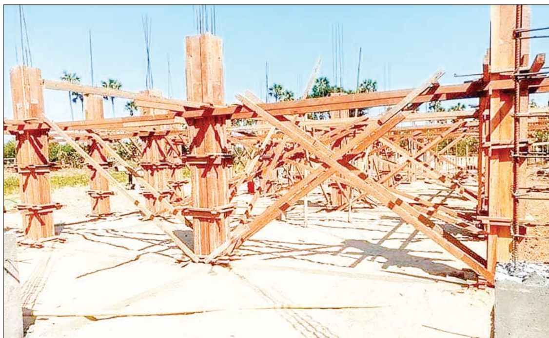
The school shelter building started its construction, with a spending of over K140 million from the National Natural Disaster Management Committee's fund of the 2020-2021 financial year.

THE construction of a school shelter started on 21 January in Zee Phyu Gone village, Kani township, Yinmabin district, Sagaing region has been completed 35 per cent.