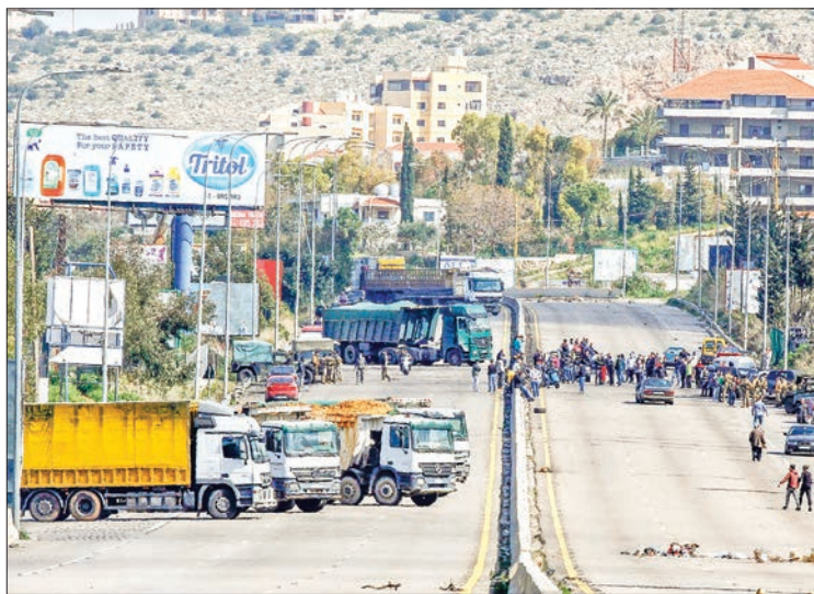
Anti-government demonstrators block a highway in the town of Jiyeh, south of the Lebanese capital on March 8, 2021, during a protest against the deteriorating value of the local currency and dire economic and social conditions.

DEMONSTRATORS blocked key roads across Lebanon on Monday in protest at the country's political paralysis after the Lebanese pound hit record lows on the black market.