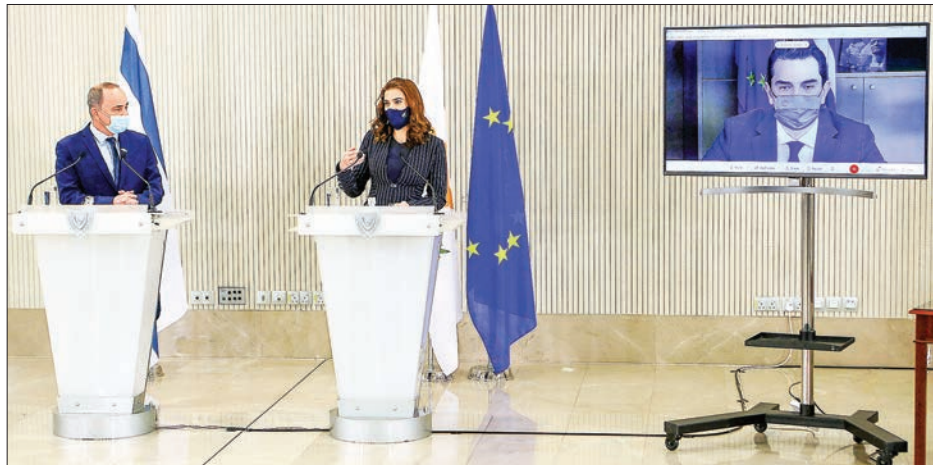
A handout picture provided by the Cypriot government's Press and Information Office (PIO) on March 8, 2021 shows (L to R) Israeli Energy Minister Yuval Steinitz, Cyprus' Minister of Energy, Commerce, and Industry, Natasa Pilides, and Greece's Minister of Environment and Energy Kostas Skrekas giving a joint press conference after signing a memorandum of understanding on cooperation in relation to the "EuroAsia Interconnector" Project. PHOTO: AFP

The project aims to connect the electricity grids of Israel, Cyprus,