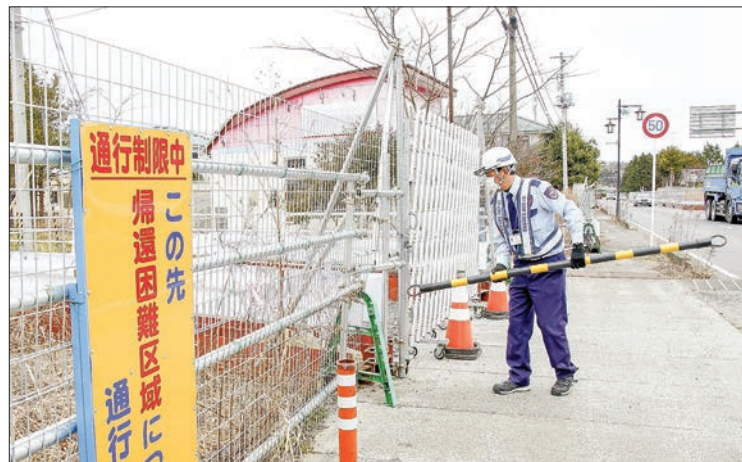
An official opens a gate barring entry to the northeastern Japan town of Okuma on 8 March, 2021.

In April 2019, the government partially lifted its mandatory evacuation order on parts of Okuma. The order was also lifted for more areas the following year.—Kyodo News ■