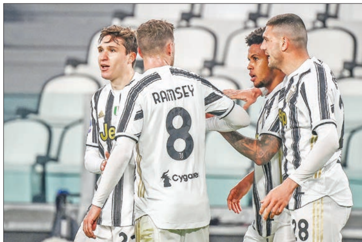
Juventus' American midfielder Weston McKennie (2ndR) celebrates after scoring the third goal during the Italian Serie A football match Juventus vs Crotona on February 22, 2021 at the Juventus stadium in Turin.

Forward Chiesa, 23, pulled a goal back for the Italians late in Portugal, for a precious away goal as they look to avoid crashing in the last 16 for a second consec-