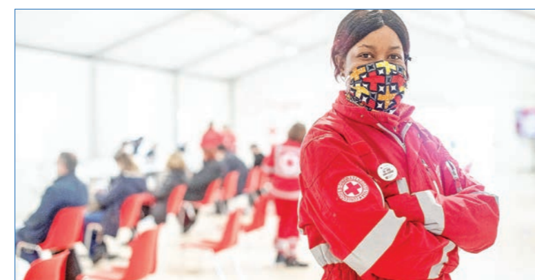
A Red Cross volunteer stands on March 8, 2021 at a Covid-19 vaccination centre located in Termini station in Rome, on the its official presentation day.