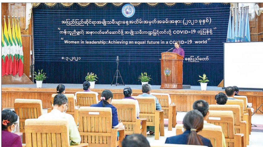
Union Minister Dr Thet Thet Khine makes a speech on the occasion of International Women Day yesterday.

Next, Union Minister Dr Thet Thet Khine delivered a