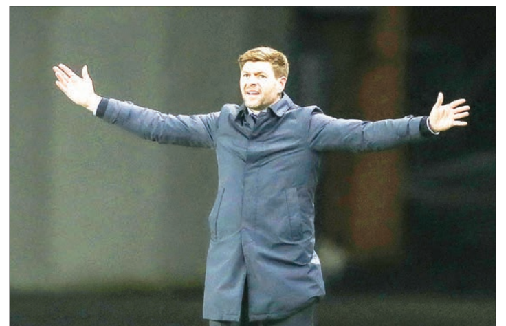
Rangers' English manager Steven Gerrard