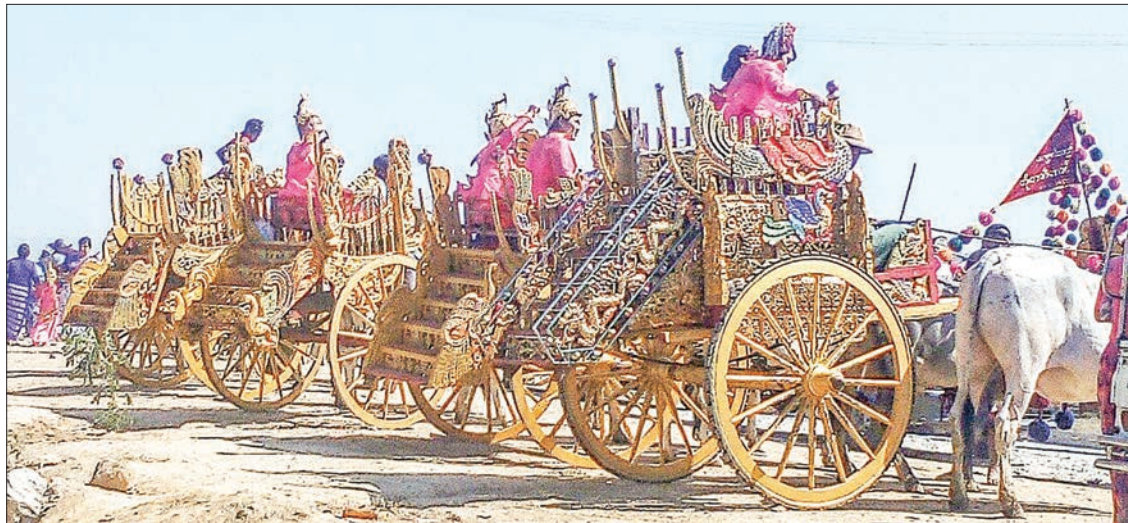
For bullock-cart races, a cart is worth K500,000, while a decorated cart costs K570,000 and the bullock-carts used in agriculture is estimated at K680,000.

number of the decorated bullock-carts this time of the previous years. at present, the donation ceremony, ordination ceremony and other festivals are closed down. Therefore, we turn to the bullock-carts for farmers to earn the livings, U