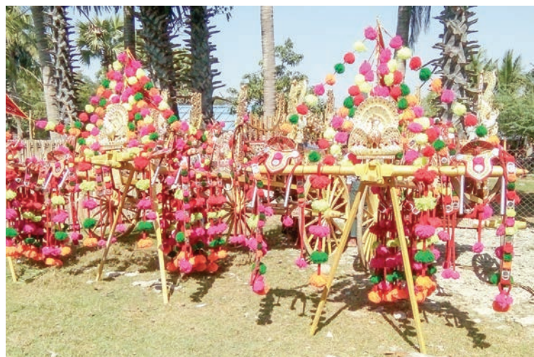
The carts are made with teak, Padauk and other woods.