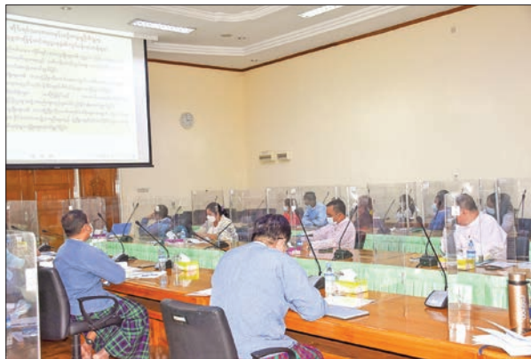
Union Minister U Saw Tun Aung Myint chairs the meeting on ethnic literature and culture yesterday.

Afterwards, Deputy Minister U Zaw Aye Maung said he would give suggestions to trans-