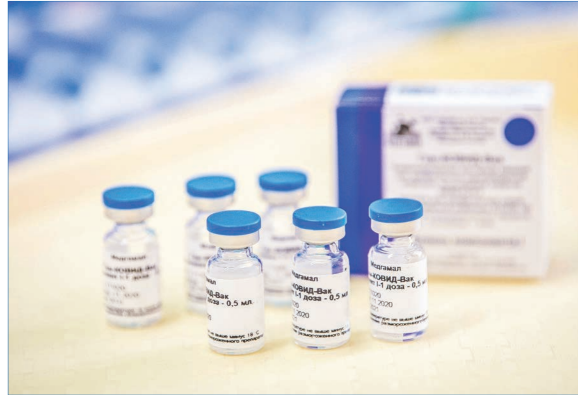
(FILES) In this file photo taken on February 12, 2021, vials with Russia's Sputnik V vaccine against the coronavirus (Covid-19) are pictured at the South Pest Central Hospital of Budapest.