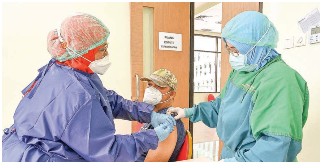
A photojournalist receives a dose of a COVID-19 coronavirus vaccine in Depok, West Java on March 4, 2021.

Since January, the country has received five batches of 38 million doses of the Sinovac vaccine in various forms, including ready-to-administer ones and vaccine bulk. They are part of