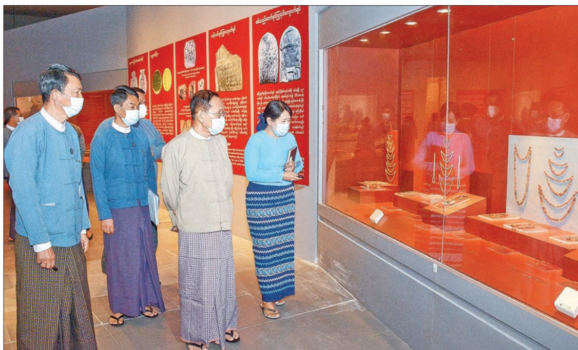
Union Minister U Ko Ko is viewing around the National Museum (Nay Pyi Taw) yesterday.

UNION Minister for Religious Affairs and Culture U Ko Ko inspected artifacts displayed at the National Museum (Nay Pyi Taw) yesterday.