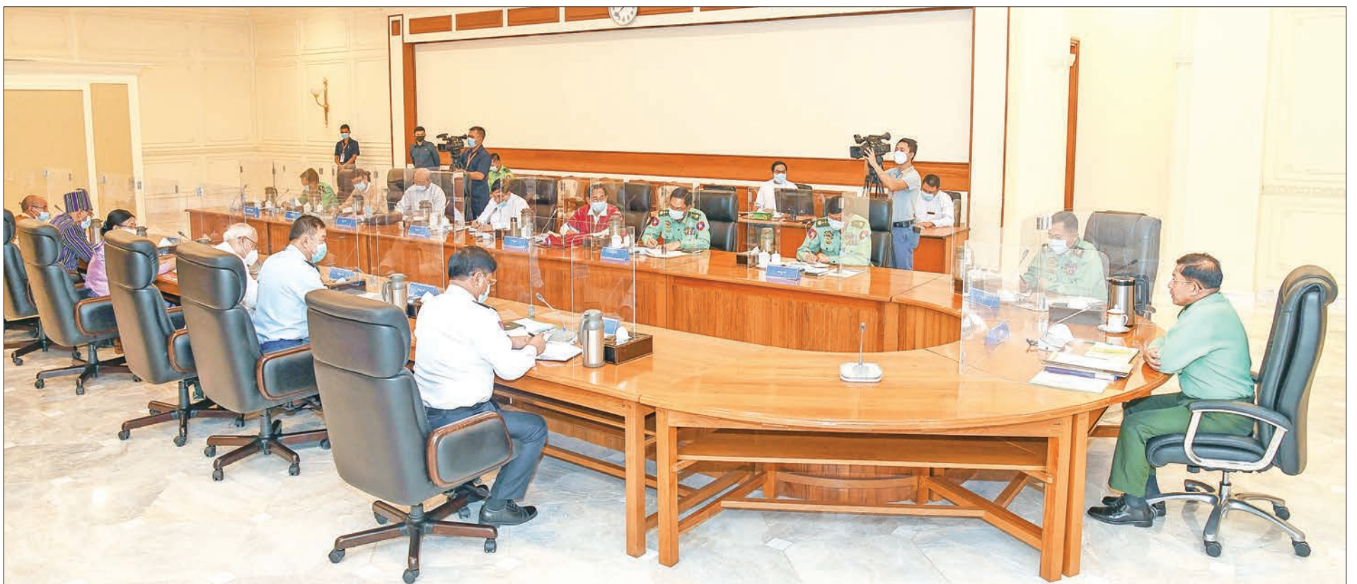
Chairman of the State Administration Council Commander-in-Chief of Defence Services Senior General Min Aung Hlaing addresses Council meeting 5/2021 in Nay Pyi Taw yesterday.

The State Administration Council held a meeting 5/2021 at the meeting hall of the Office of the Chairman of the State Administration Council, in Nay Pyi Taw yesterday afternoon, with an address delivered by Chairman of the State Administration Council Commander-in-Chief of Defence Services Senior General Min Aung Hlaing.