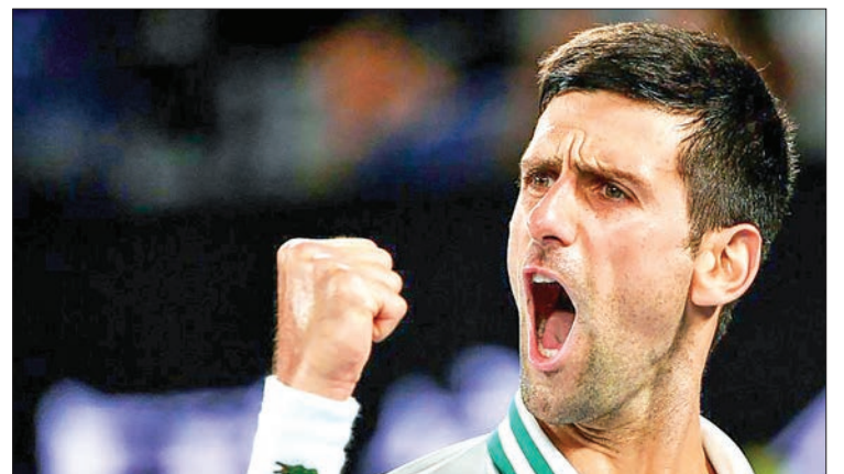
On top of the world: Novak Djokovic.

He is currently in his fifth different spell atop the rankings. —AFP ■