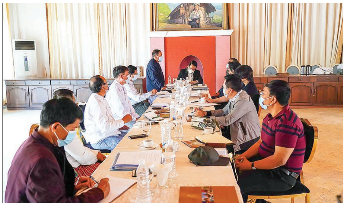
Union Minister U Maung Maung Ohn holds the meeting with representatives from hotel and tourism sector in PyinOoLwin.

Following the meeting, the Union Minister visited the museums housing fossils, orchids