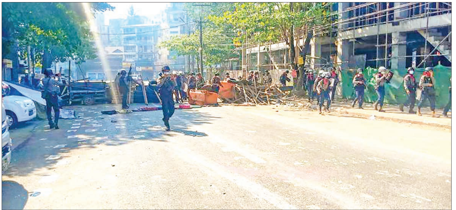
Police are clearing havoc on the road left by the protesters.

Most people who do not want to see instability in the country have called the hotlines in their respective regions and states and requested to control the public universities and hospitals and to take action ef-