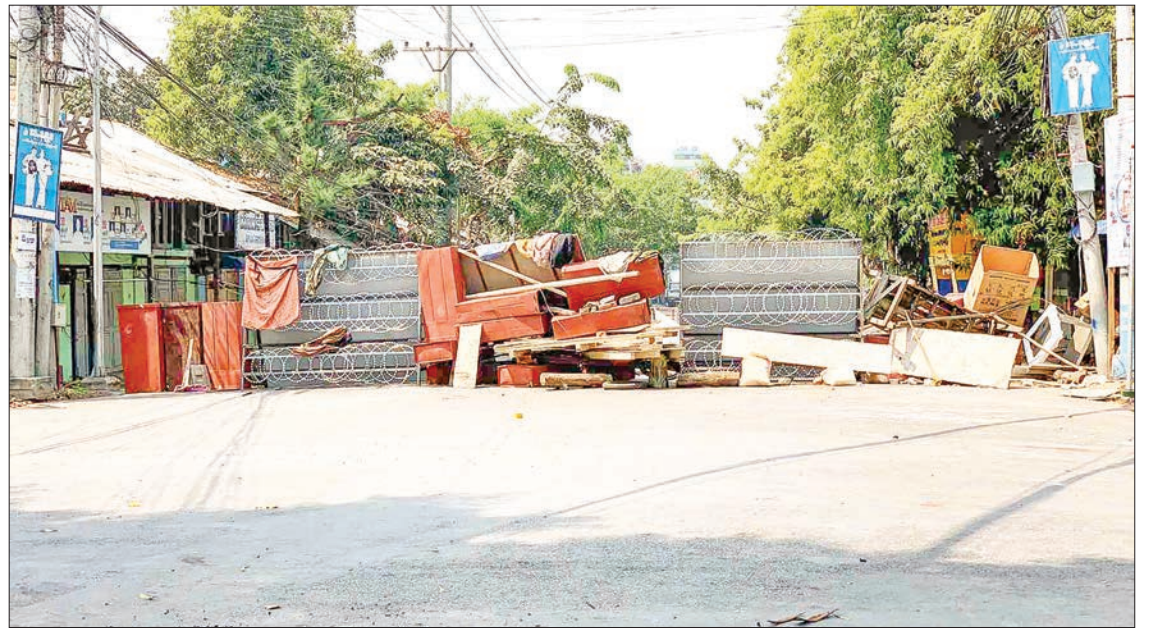
Protests turned into riots in parts of Myanmar.