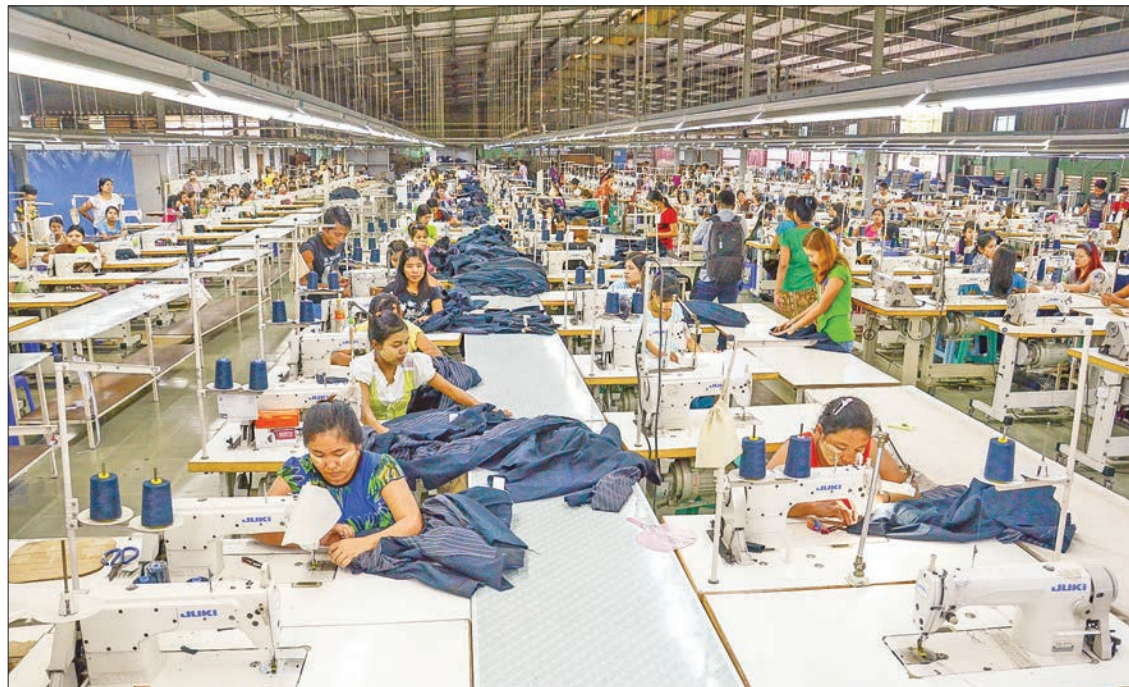
Myanmar garment industry is transforming CMP into FoB system.

"The garment sector is among the prioritized sectors driving up exports. The CMP garment industry has emerged as a promising one, with preferential