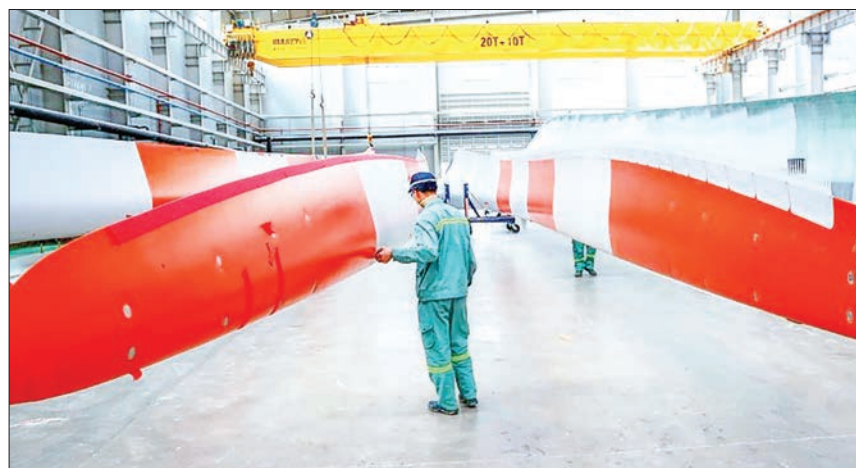
Imports also surged in a sharp bounceback from the coronavirus outbreak that had brought activity to a near halt.

The customs administration said comparison to last year is also likely to have bolstered the latest figures, saying in a statement that the "low base is one of the reasons for the larger increase this year." On Sunday, official data showed that electronics exports rose 54.1 percent, while textiles including masks rose 50.2 percent. China's overall trade surplus came in at $103.3 billion, its customs administration said. —AFP ■