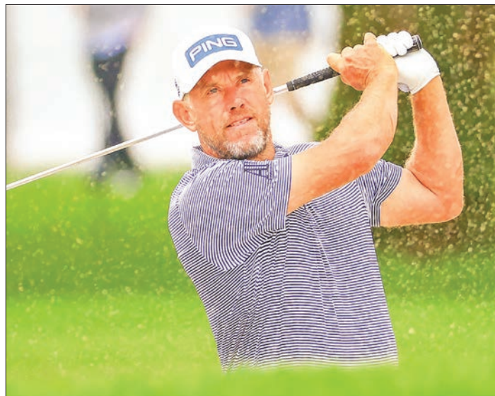
Britain's Lee Westwood curled in a 28-foot closing birdie putt after an eagle at 16 to seize a one-stroke lead after Saturday's third round of the Arnold Palmer Invitational.

"I haven't lost any of my length and I haven't lost any of my enthusiasm to go and work in the gym."—AFP ■