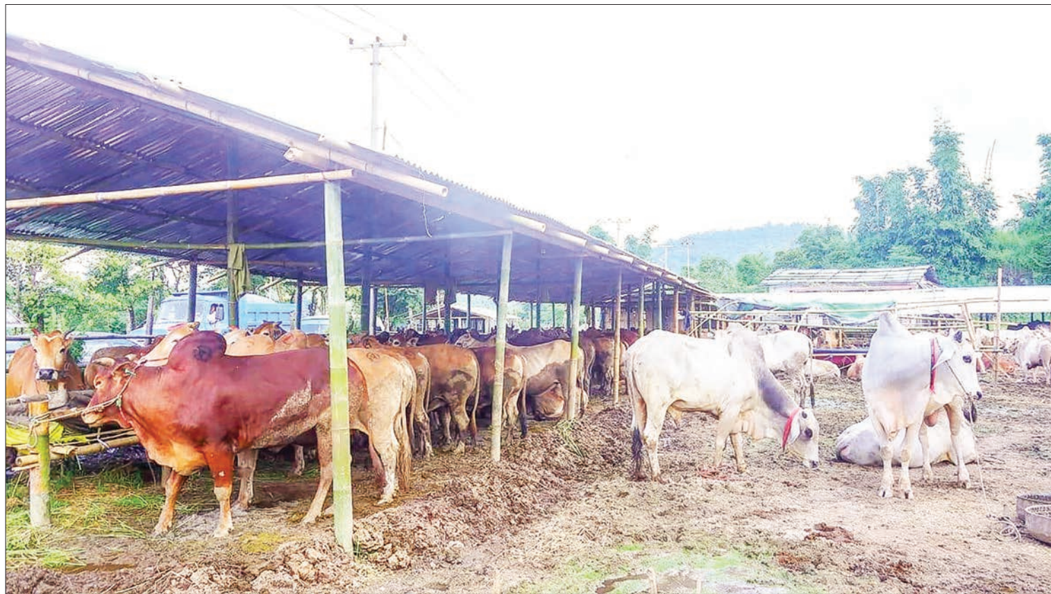
Myanmar's live cattle export heavily relies on the China market due to a reasonable price, although Myanmar has other external markets such as Laos, Thailand, Malaysia, and Bangladesh.

For legitimate trade, China permits live cattle import only after ensuring the cattle is free from 20 diseases, including Foot and Mouth Disease, along with vaccination certificates, health certificates, and farming registration certificates. Therefore, the officials concerned from the two countries are negotiating the matter.