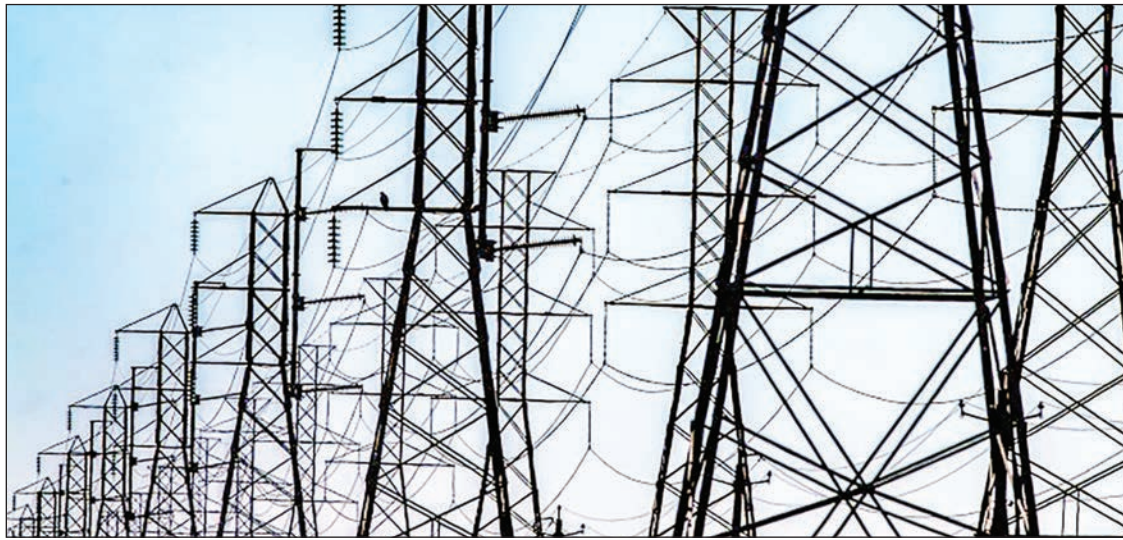
Millions of Texans were left without power in mid-February as Arctic conditions overwhelmed local utility companies ill-prepared for such weather.