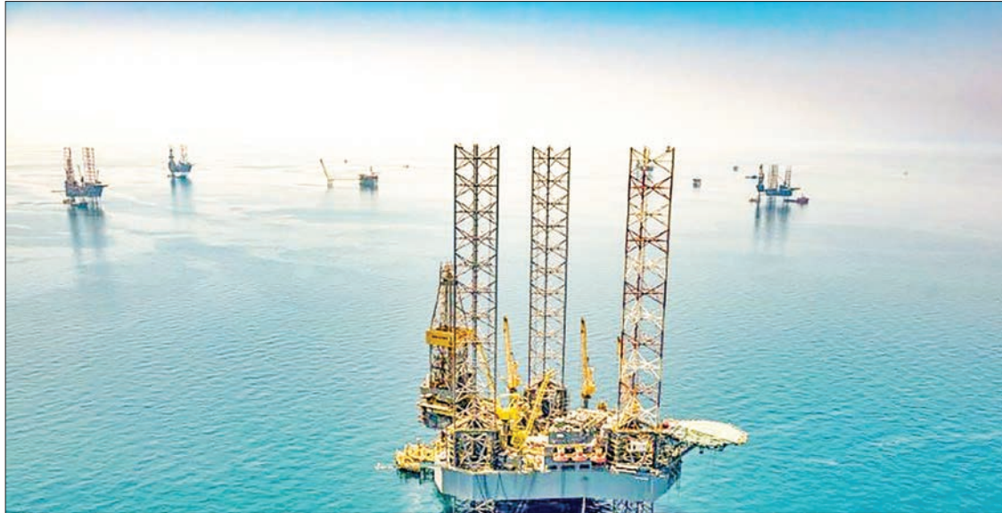
On the sidelines of a technical meeting Tuesday, the head of OPEC, Mohammed Barkindo, pushed for middle ground when he said the cartel must emphasise "cautious optimism" given persistent risks from the pandemic.