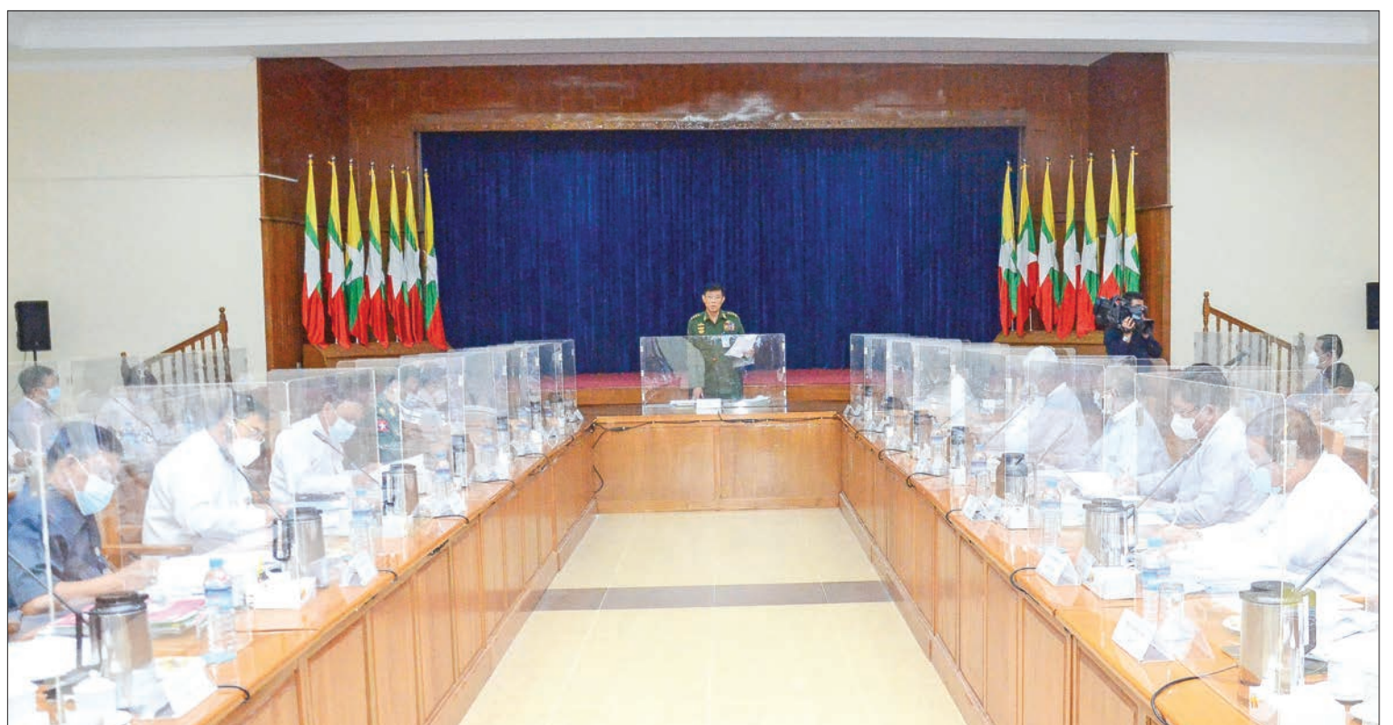
Member of the State Administration Council Union Minister for Defence General Mya Tun Oo chairs the second coordination meeting of the Ethnic Affairs, Public Affairs Management and Services Committee in Nay Pyi Taw yesterday.

At the meeting, Union Minister General Mya Tun Oo said the State Administration Council is setting nine objectives for the development of the country and among those goals, the Committee is directly related to the establishment of the Union based on genuine and disciplined multiparty de-