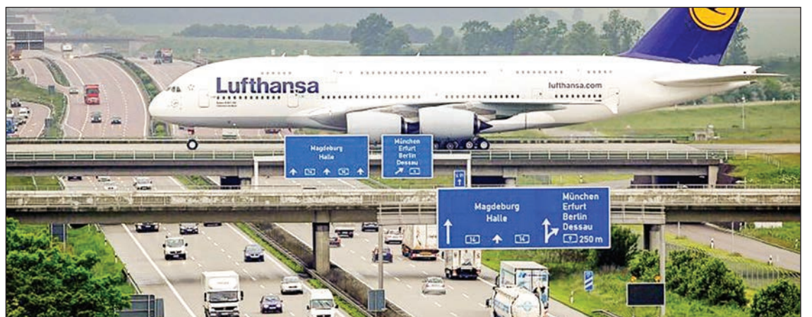
Europe's biggest airline said it expects to book an operating loss again.

GERMAN flag carrier Lufthansa said Thursday it lost a record 6.7 billion euros in 2020, as the coronavirus pandemic wiped out demand for travel and left flights grounded.