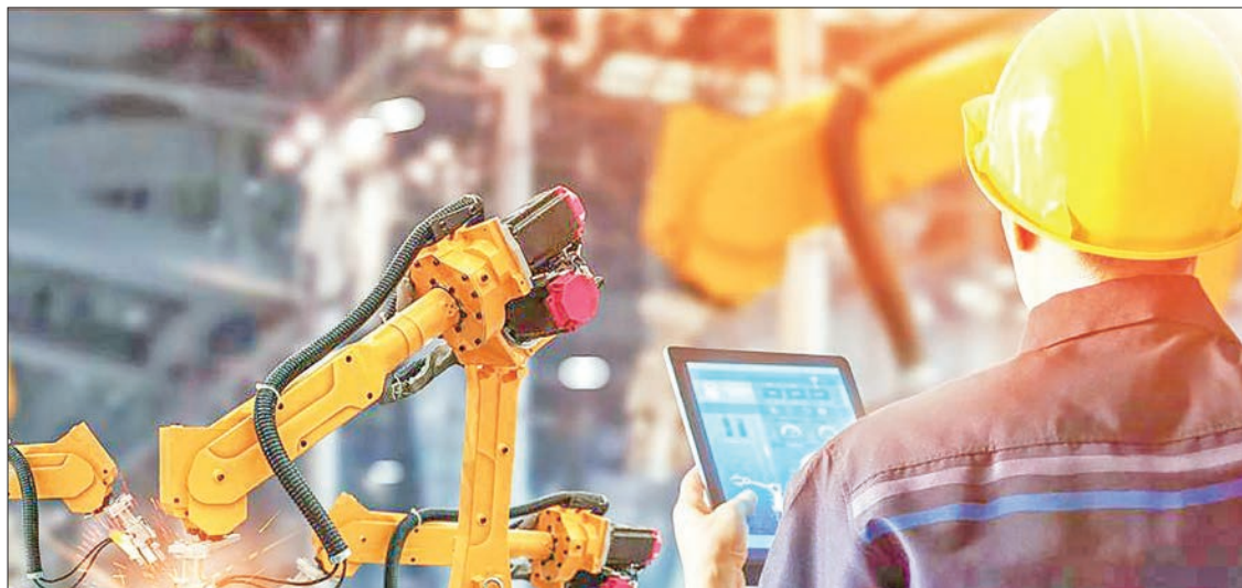
The most recent manufacturing PMI data were the latest illustration of Europe's two-speed economic recovery.

WHILE services for the sixth consecutive month revolved in contractionary territory, as virus-related restrictions continued to affect many businesses, manufacturing portrayed greater resilience, expanding for an eighth successive month