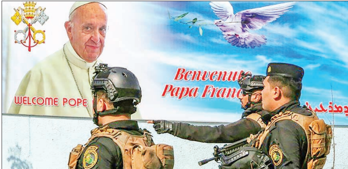
The pope's trip to Iraq is his first foreign jaunt since the pandemic swept Europe last year.

"I come as a pilgrim, a penitent pilgrim to implore forgiveness and reconciliation from the Lord after years of war and