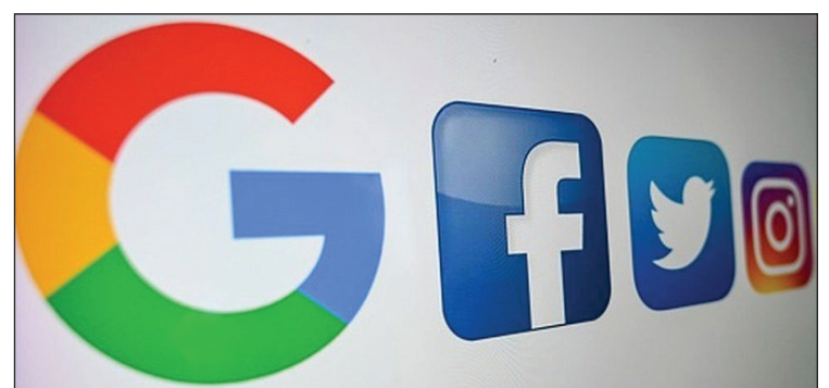
New Zealand called on Google and Facebook Wednesday to strike deals with Kiwi media similar to those reached in Australia, which require the tech giants to pay for using news.

"I'm confident that commercial discussions taking place between traditional media and digital platforms will also begin here in New Zealand and I en-