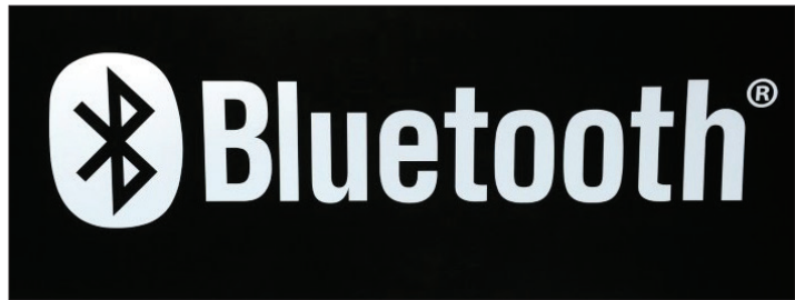
The Bluetooth logo is a superimposition of the runes for the letters "H" and "B", the initials for Viking-era king Harald "Bluetooth" Gormsson.

ONE of the best-known modern technologies owes its name and logo to a Viking-era king with a bad tooth: a quarter century ago, two engineers hatched the idea for the moniker "Bluetooth" over beers.