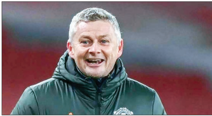
Manchester United Manager Ole Gunnar Solskjaer.

LONDON — Manchester United Manager Ole Gunnar Solskjaer said it "doesn't make sense" for his players to travel for international duty later this month if they have to quarantine on their return and miss games as a result.