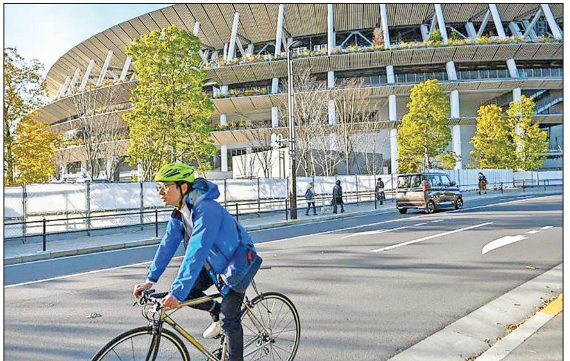
Officials fear that an influx of overseas visitors for the Games will endanger the Japanese public.

The three parties met with International Olympic and Paralympic Committee heads on Wednesday and agreed to take a decision on spectators by the end of the month, ideally before the nationwide torch relay begins on March 25. —AFP ■