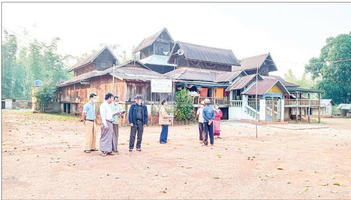
Lwelin monastery with ancient heritage is located in the village of Mongnai Township.

A WORK coordination meeting to create a community-based tourism village was inaugurated at Kanbawza Hall of Mongnai Township in southern Shan State.