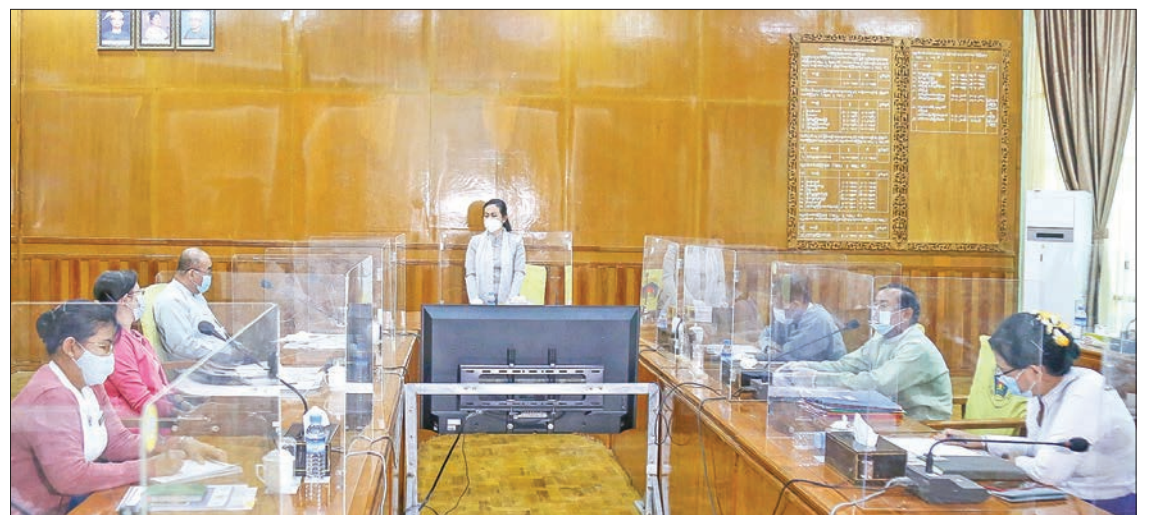
MoSWRR minister and deputy minister are leading the discussion on cooperation with UN and INGOs yesterday.

The Deputy Minister then instructed to inspect the beneficiaries through the work with NGOs and INGOs and to adopt monitoring and evaluation system. —MNA