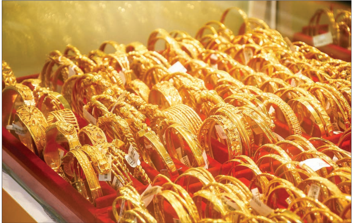
In January 2021, the domestic gold fetched the highest price of K1,336,000 per tical on 6 January. It reached the lowest price of K1,316,000 per tical on 28 January.

The local gold price reached the lowest K1,310,500 (2 September) and the highest level of K1,314,000 (1 September). In October, the rate ranged between K1,307,800 (30 October) and K1,316,500 (21 October). The rate fluctuated between the highest of K1,312,000 (16 November) and the lowest of K1,278,000 (28 November). In December, the pure yellow metal priced moved in the range of Ks