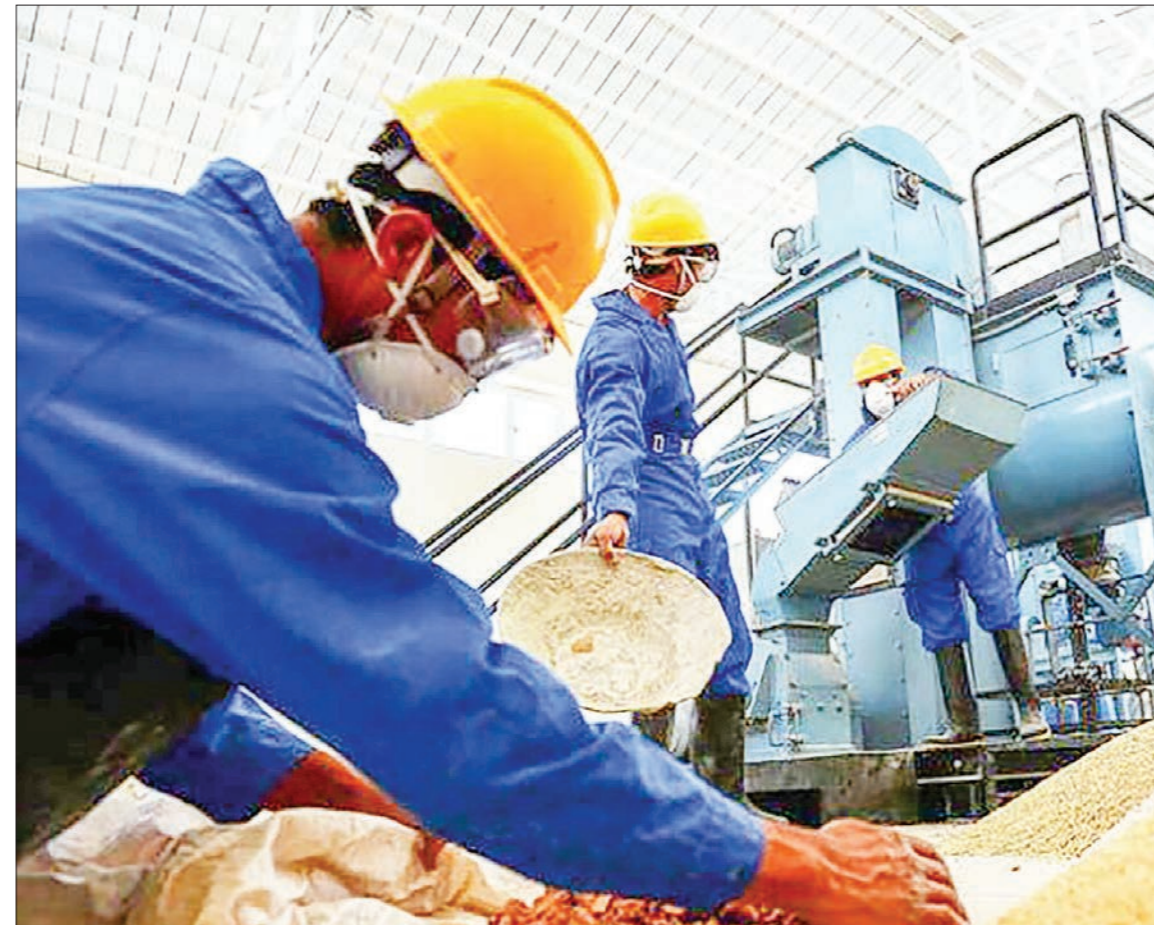
At an FAO-supported animal feed processing plant in Afghanistan.

The Centre has also stepped up its actions to increase visibil-