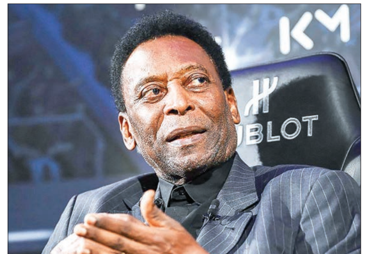
In this file photo taken on April 02, 2019 Brazilian football legend Pele speaks during a meeting with Paris Saint-Germain (PSG) and France national football team forward Kylian Mbappe at the Hotel Lutetia in Paris. PHOTO: AFP

The only player to win three World Cups — in Sweden in 1958, Chile in 1962 and Mexico in 1970 — Pele has self-isolated at his house in Sao Paulo state since the start of the health crisis which has left more than 255,000 people dead in Brazil, where vaccination has been slow to start. —AFP ■