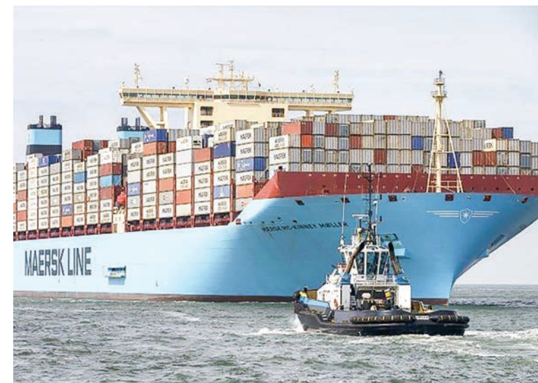
More than half of that decline in CO2 emissions in 2020 was due to less use of fuel for road transport, shipping and aviation.

"If governments don't move quickly with the right energy policies, this could put at risk the world's historic opportunity to make 2019 the definitive peak in