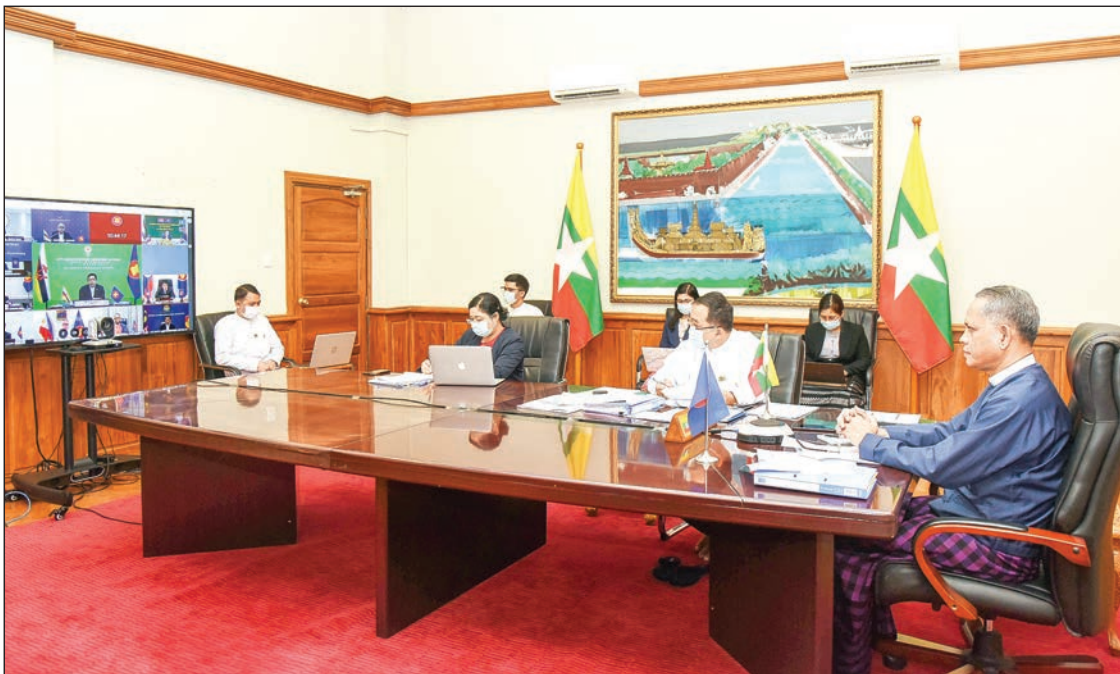
Union Minister U Aung Naing Oo joins the online second-day meeting of the 27th ASEAN Economic Ministers' Retreat Meeting yesterday.

Union Minister for Investment and Foreign Economic Relations U Aung Naing Oo attended the second day of the 27 th ASEAN Economic Ministers' Retreat Meeting via video conference which was held on 3 March 2021.