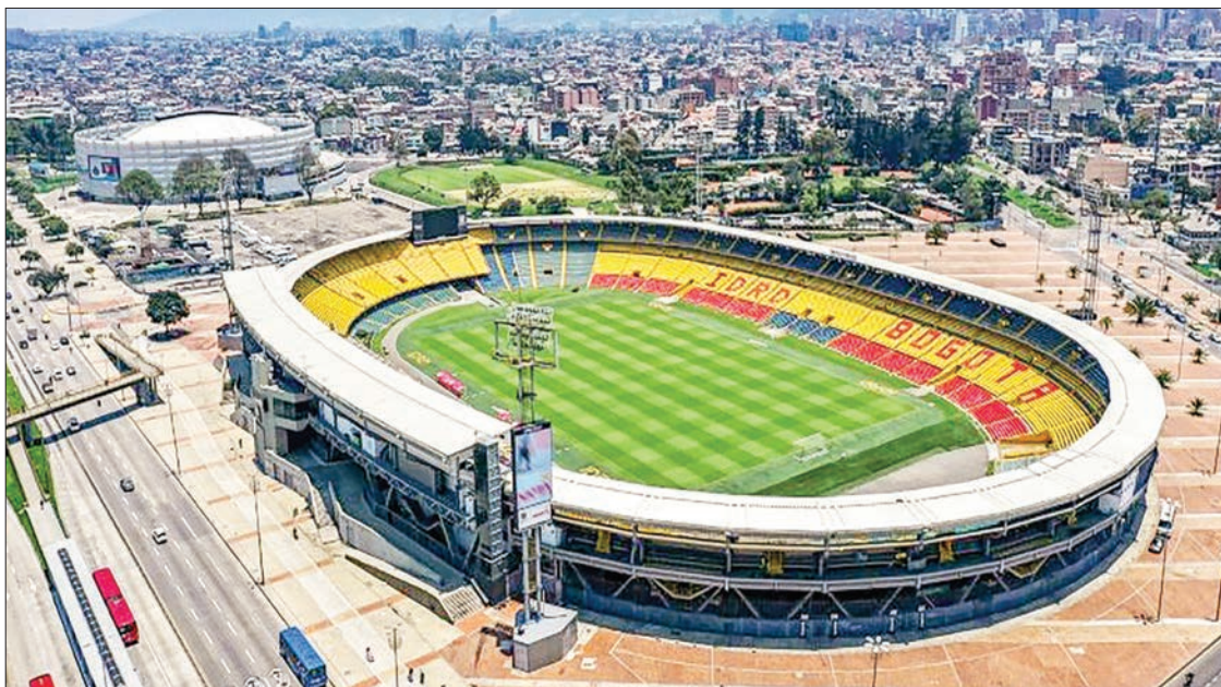
The Copa America due to kick off in June 2020 in Argentina and Colombia was postponed by a year to 2021 because of the coronavirus pandemic.

BOGOTA — Colombia said Wednesday it would open its stadiums to the public for the 2021 Copa America it will co-host with Argentina, with a 30-percent maximum attendance due to the coronavirus pandemic.