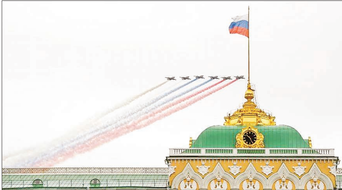
The sanctions further erode ties between Moscow and the West since Russia's annexation of Crimea in 2014.