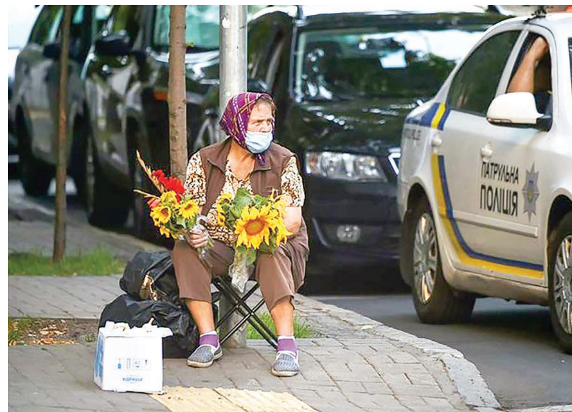
An elderly woman wearing a face mask to protect against the coronavirus disease sells flowers in the centre of the Ukrainian capital of Kiev on a hot summer day on July 21, 2020.

The study offered a range of recommendations for government, media and social media