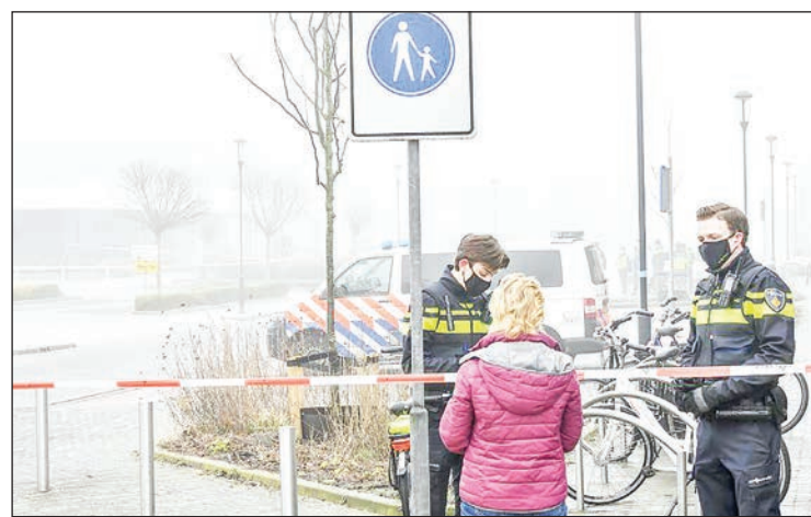
The scene of the blast in The Netherlands. PHOTO: AFP

The Netherlands suffered several nights of rioting, the most violent the country has seen in decades. —AFP ■