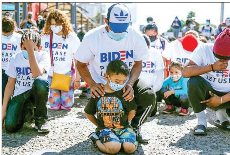
Migrants trying to get into the United States protested at the border with Mexico, begging to be allowed to start the asylum process.

MIGRANTS from central America, Cuba, Haiti and Mexico blocked two lanes of the US-Mexico border crossing in