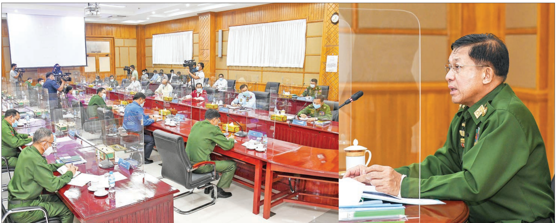
State Administration Council Chairman Senior General Min Aung Hlaing chairs the National Unity and Peace Restoration Central Committee meeting 1/2021 in Nay Pyi Taw on 3 March 2021.

T HE National Unity and Peace Restoration Central Committee held its meeting 1/2021 at the office of the State Administration Council in Nay Pyi Taw yesterday, with an address delivered by Chairman of the Central Committee Chairman of the State Administration Council Commander-in-Chief of Defence Services Senior General Min Aung Hlaing.