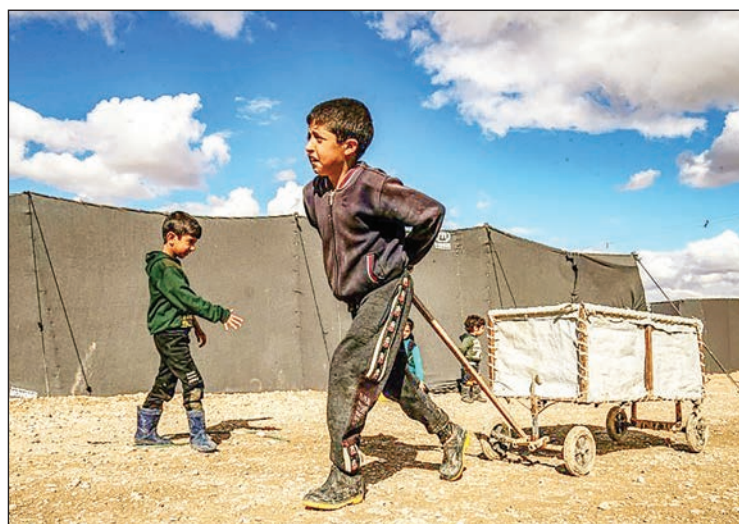
Children and their mothers make up the great majority of the nearly 62,000 suspected relatives of Islamic State group fighters interned at Syria's Al-Hol camp, where authorities say at least 31 people have been murdered since early January. PHOTO: AFP

Al-Hol holds almost 62,000 people, mostly women and children, including Syrians, Iraqis and thousands from Europe and Asia accused of family ties with IS fighters. —AFP ■