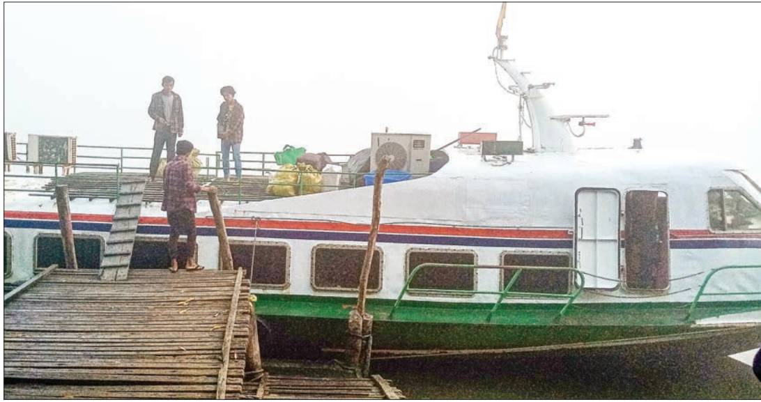
On 2 March, the express vessels operated the Sittway-Rathedaung-Buthidaung route beginning from 7 am with 13 passengers.

MALIKA Express vessels suspended beginning from 22 August 2020 due to the pandemic resumed Sittway-Rathedaung-Buthidaung route regularly starting from March.