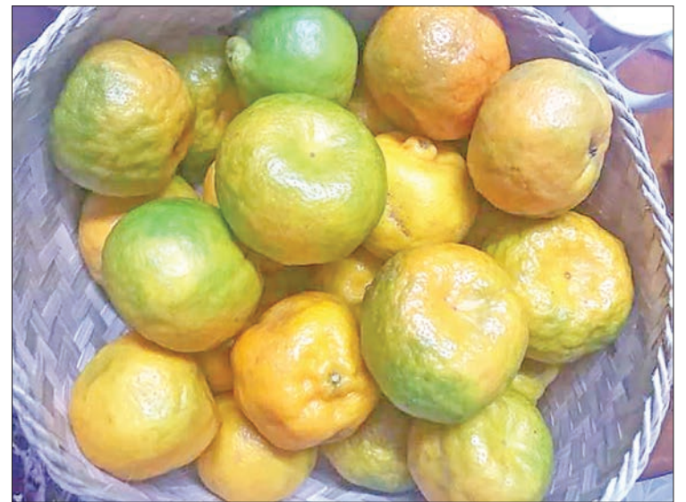
Last year growers sold a 10-piece bag of oranges for K3,000 and earned around K70,000 daily. Now, one bag of oranges is sold for K1,500 in the COVID-19 period, and it is hard to make K10,000 per day.

Last year, the oranges were sold to the tourists visiting the heart-shaped Reed Lake on the India-Myanmar border and the Chin ethnic visitors. — Chindwinthar/GNLM