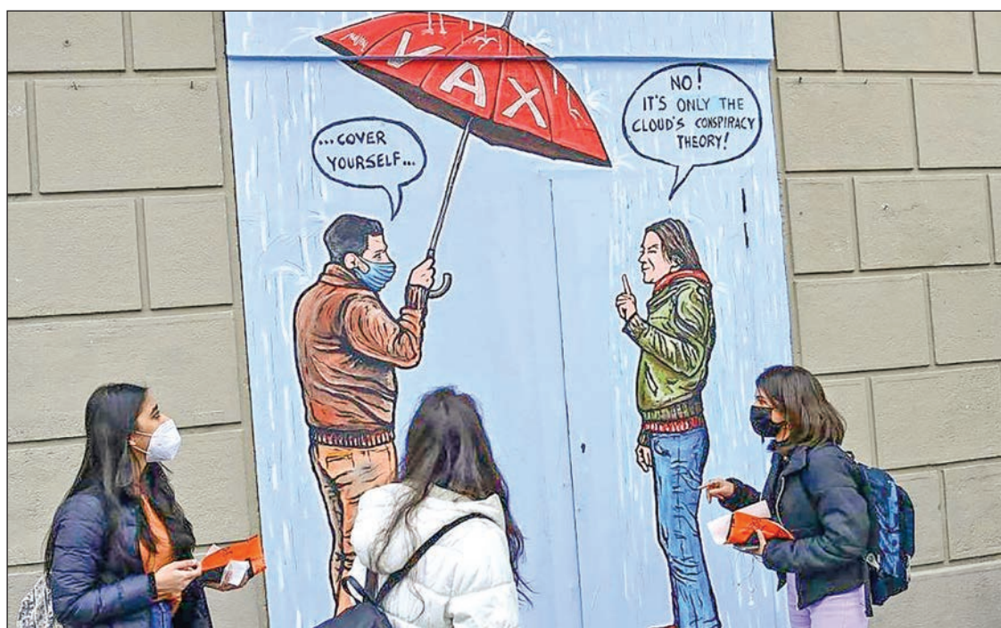
All schools in the highest risk regions will switch to distance learning under new rules to come into effect from Saturday, whereas previously only secondary schools in so-called red zones were shuttered.

ITALY'S new government ordered more school closures Tuesday after data showed the majority of coronavirus cases to be of the more contagious British variant.