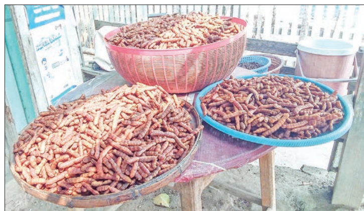
Last year, the tamarind with seeds was sold for K700 per kilo to Thailand.

“Last year, the tamarind with seeds was sold for K700