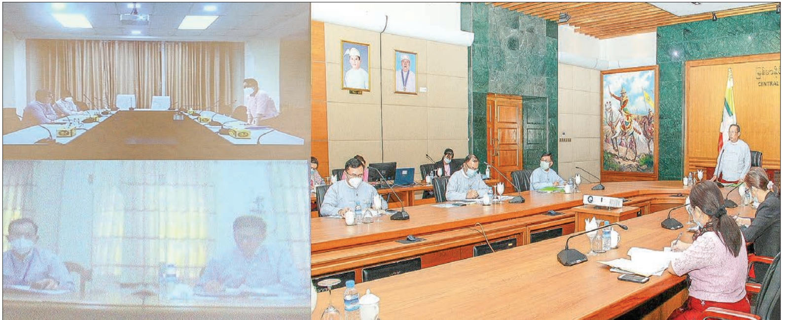
CBM Governor U Than Nyein presides over the coordination meeting from the officials with the Yangon and Mandalay branches on 3 March 2021.

He said it is important to act in good faith within the rules to ensure that the work of all departments is not interrupted while the State is being normalized and to successfully implement the State policies. He added it is important for the staff to be free from party politics and to co-