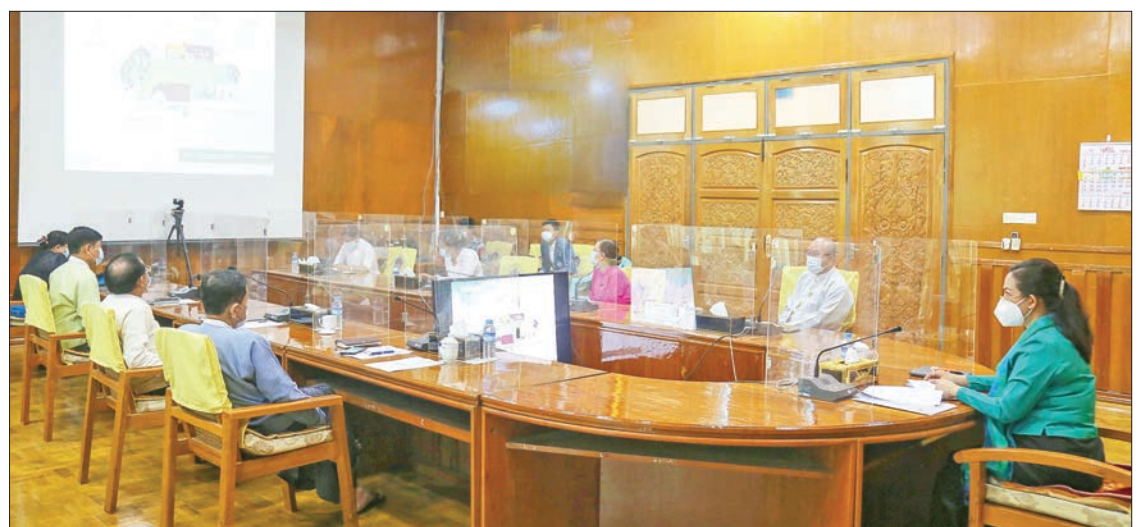
Union Minister Dr Thet Khine chairs the MoSWRR coordination meeting on cooperation works with ASEAN yesterday.

The meeting discussed the cooperation with ASEAN for the readmission of displaced persons in Rakhine State and the support to Myanmar in accordance with the agreements reached at the ASEAN Summits; implementing the recommendations of the 2019 Preliminary Needs Assessment Report by the members of the ASEAN Emergency Re-