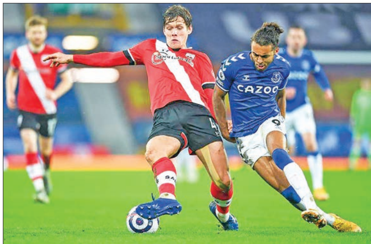
Everton boosted their bid to earn a top-four finish in the Premier League as Richarlison sealed a 1-0 win against struggling Southampton on Monday.

Fresh from beating Liverpool 2-0 to secure their first victory over their Merseyside rivals at Anfield since 1999, Everton are firmly in contention to qualify for the Champions League via a top-four finish.—AFP ■