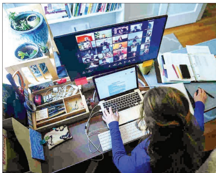
Millions of people are using Zoom to communicate.

One possible reason for the reaction is that number of companies anteing up for Zoom's subscription version of its service isn't rising as rapidly as during the pandemic's early stages. Zoom ended its latest quarter with 433,700 customers with at least 10 employees, an increase of 63,500 customers from July. In each of the previous two quarters, Zoom had added more than 100,000 customers with at least 10 em-