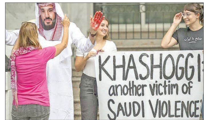
In this AFP file photo taken on October 10, 2018, a demonstrator dressed as Saudi Arabian Crown Prince Mohammed bin Salman (C) with blood on his hands protests with others outside the Saudi Embassy in Washington, DC, demanding justice for missing Saudi journalist Jamal Khashoggi.

“We have made crystal clear and will continue to do so that the brutal killing of Jamal Khashoggi 28 months ago remains unacceptable conduct,” Price said. —AFP ■