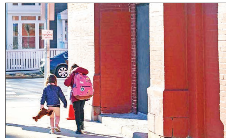
Children leave Hawthorne Scholastic Academy following their first day of in-person learning on March 1, 2021 in Chicago, Illinois.

We will lose the war against the pandemic if we do not ensure children get back to school safely, have access to health services,