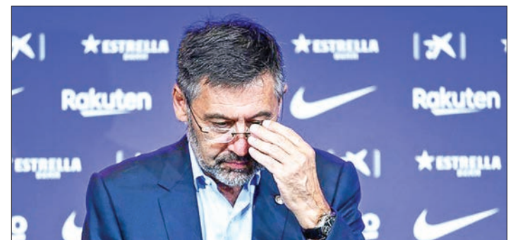
Barca president Josep Maria Bartomeu was detained by police on Monday.