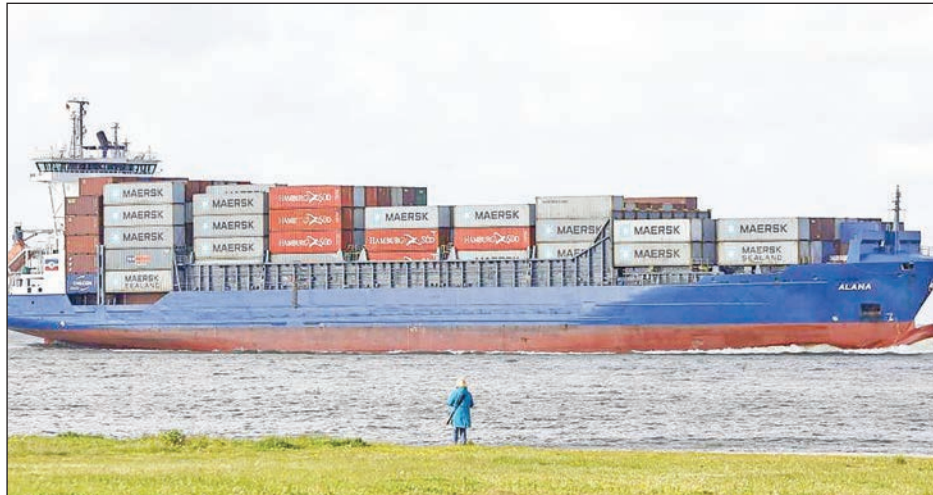
A container ship passing by the northern German port of Cuxhaven.

GERMANY exported 30 per cent less goods to Britain in January compared to a year ago, official estimates showed on Tuesday, with demand hurt both by Brexit and the coronavirus pandemic.