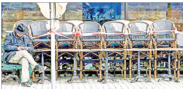
Germany closed bars, restaurants, gyms and cultural centres in November, before adding non-essential shops and schools in December as the country was badly hit by a second Covid-19 wave.

GERMAN Chancellor Angela Merkel wants to allow more socializing between households from next week as part of plans to gradually loosen virus curbs in the Covid-weary nation, a draft text showed Tuesday.