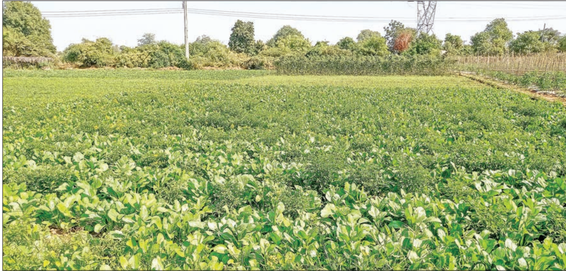
Local farmers are growing the vegetables using the underground water on manageable scale in Minbu.

THE local farmers from Kyauktan village in Minbu (Sagu) Township are growing the vegetables using the underground water. This year, people are growing mustard and other crops on a manageable scale to earn family income, said Daw Mya Kyi, a mustard grower from Kyauktan village.