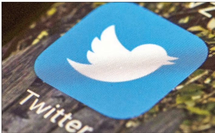
Twitter said Monday it will start labeling misleading tweets about Covid-19 vaccines and boot users who persist in spreading such misinformation.

Since then, Twitter has removed more than 8,400 tweets and notified some 11.5 million accounts worldwide about violations of its Covid-19 information rules. —AFP ■