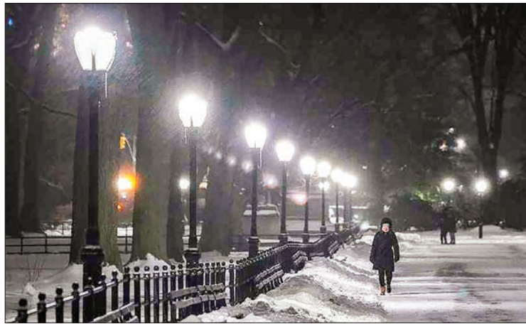
Cold weather in the United States and Covid-19 vaccine programmes have helped oil prices recover to around $65 a barrel.

Now that prices have rebounded to pre-pandemic levels, at around $65 a barrel, the two heavyweights and their partners will discuss how to move forward -- and how much crude to release back onto the global market.