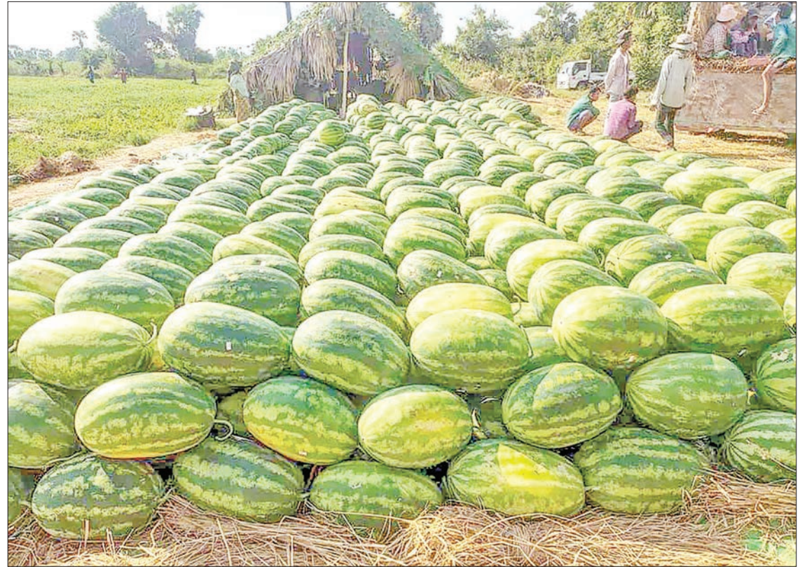
Watermelon and muskmelon will be harvested up to May-end across the country, except Kayah and Chin states.

During the previous financial year, the growers and the traders suffered the loss due to the price instability and trans-