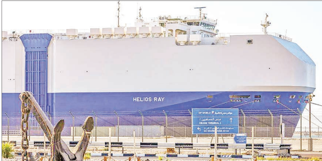
The MV Helios Ray vehicle carrier is owned by HELIOS Ltd, an Israeli company registered in the Isle of Man.

ISRAELI Prime Minister Benjamin Netanyahu accused arch-foe Iran on Monday of a recent attack on an Israeli-owned ship, saying his country was “striking back”.