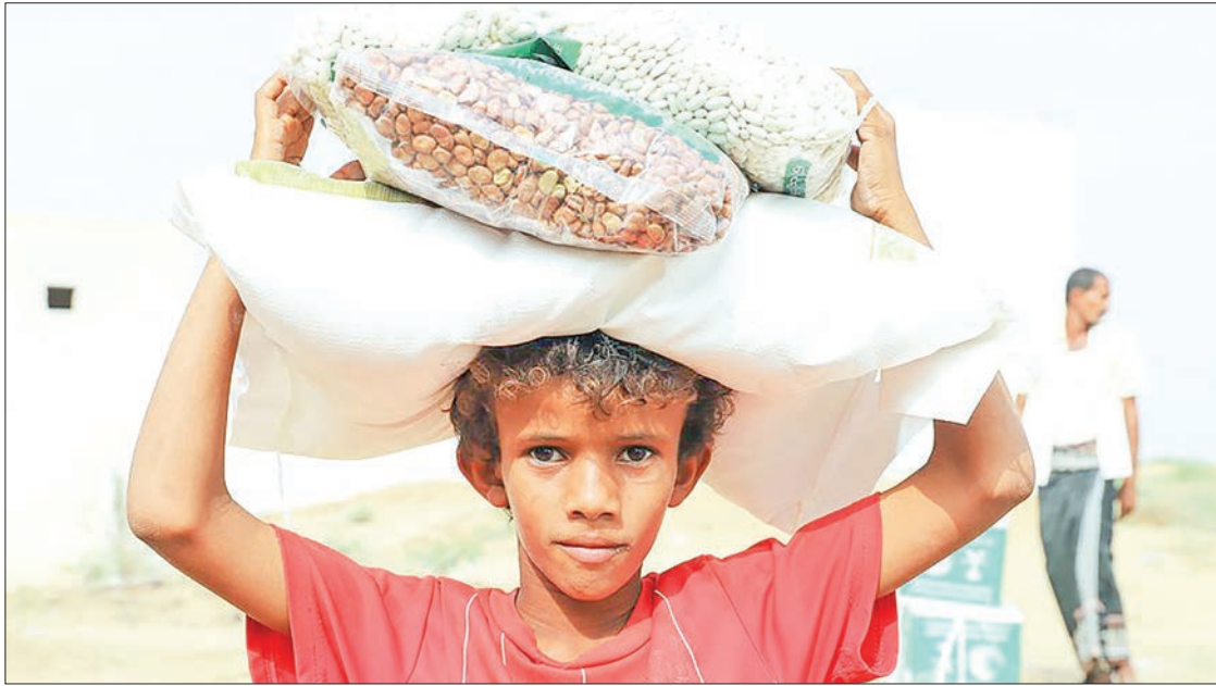
Photo taken on Feb. 14, 2021 shows a boy carrying the food donated by a charity group in Hajjah Province, north Yemen.

The entire UN system must efficiently and effectively carry out humanitarian operations, and strengthen coordination with regional countries and organizations. All parties to the