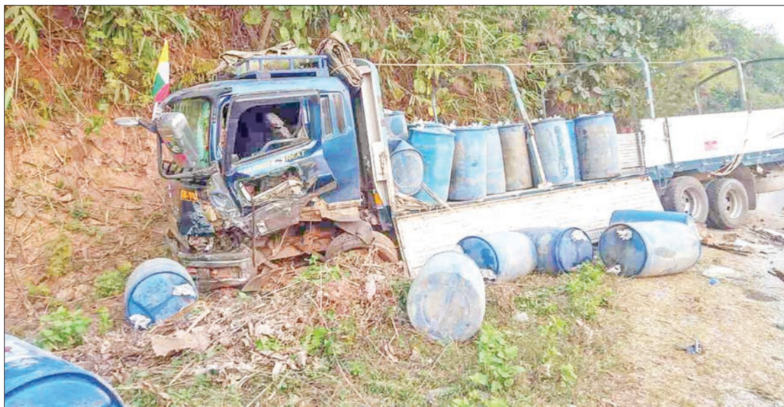
Two men were killed following a head-on car crash in Mong Phyat Township in Tachilek District, Shan State (East) on 1 March evening.

According to the investigation, Vigo, a 12-wheel vehicle, which was en route to Tachilek from Mong Phyat driven by Arr Phar, 37, with U Maw Yar, 47, U Arr Khant, 45, and Ma Arr Par, 18 onboard from Tachilek,