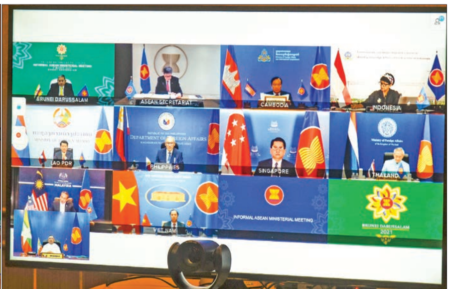
Union Minister U Wunna Maung Lwin joins the Informal ASEAN Ministerial Meeting online from Nay Pyi Taw on 2 March 2021.

November 2020, the five-point prioritized programme to be undertaken by the State Administration Council, maintaining law and order for public safety, additional effort to be made on