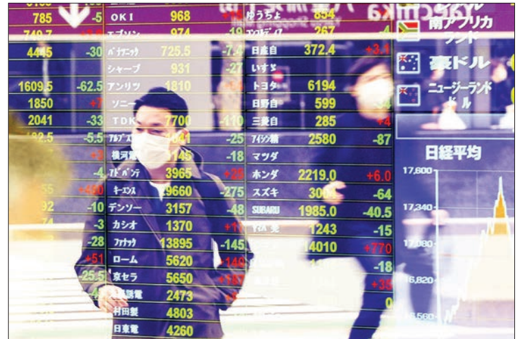
The novel coronavirus has killed at least 2,539,505 people since the outbreak emerged in China in December 2019.

After the US, the hardest-hit countries are Brazil with 255,720 deaths from 10,587,001 cases, Mexico with 186,152 deaths from 2,089,281 cases, India with 157,248 deaths from 11,124,527