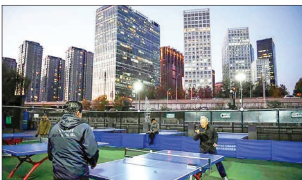
Beijing is top of the list with the world's most billionaires for the sixth year in a row.

which strips out volatile components like energy and food. Eurostat said core inflation fell in February to 1.1 per cent, from 1.4 per cent in January, indicating that the European economy has yet to enter a high gear. —AFP ■