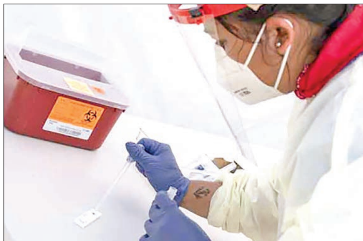
FILE: A health worker process a COVID-19 antibody test after getting the blood from the patient.

“The map shows that violence and intimidation against healthcare was a truly global crisis in 2020, affecting 79 countries,” said Insecurity Insight director Christina Wille in a statement. —AFP ■