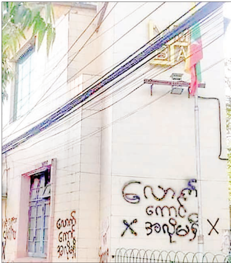
About 20 suspects attempted to destroy the YMBA building yesterday.

Therefore, YBMA also released a statement that such doings seemed to defame the YMBA that fought for Myanmar's Independence and led the national liberation movement, and show disrespect for Myanmar's history, country and Buddha Sasana.