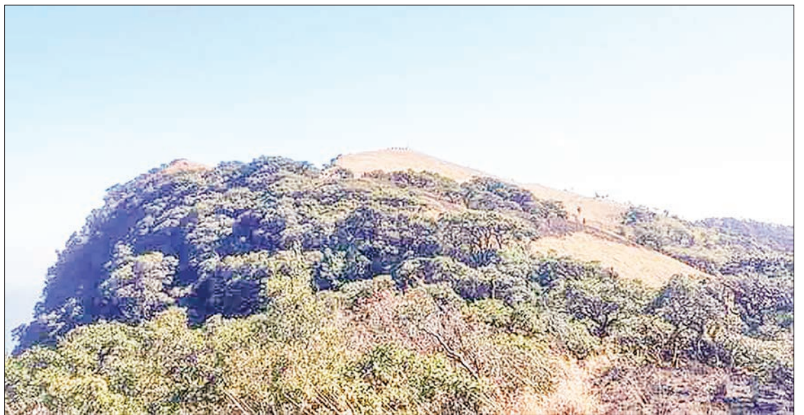
An aerial view of Mount Zinghmuh (Nat Ma Taung).

Mt Zinghmuh through Falam, Haka and Thantlang towns by cars and motorbikes. The gov-