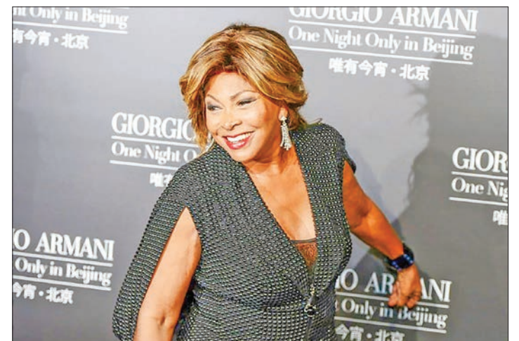
Paired with a musical about her that had its Broadway premiere in 2019 until the pandemic shut it down, the new film is billed as Turner's farewell to her legions of fans.

MUSIC legend Tina Turner is the subject of one of the most successful biopics ever made but she tells the makers of a new documentary there's much more to her story.