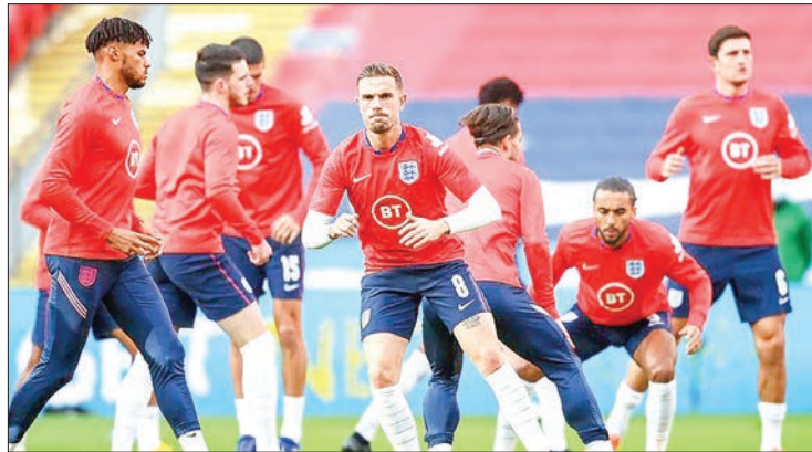
England is ready to host extra matches for this year’s European football championships, British Prime Minister Boris Johnson said in an interview published on Tuesday.

The tabloid said British ministers are holding talks with European football’s governing body UEFA about hosting more games due to rising cases across the continent and the slow roll-out of vaccines.