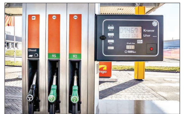
Energy prices fell by 1.7% in February compared to a year ago.

Eurostat said that energy prices fell by 1.7