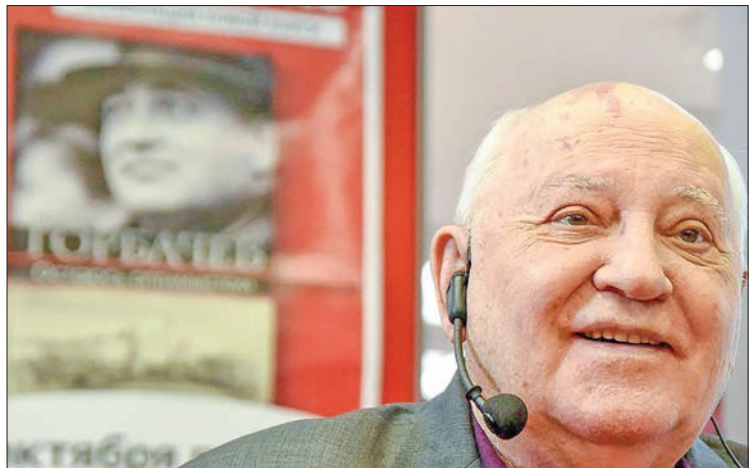
Mikhail Gorbachev, the historic reformer who presided over the collapse of the Soviet Union, marked his 90th birthday in quarantine Tuesday and like everyone else is "tired" of virus restrictions, his spokesman said.