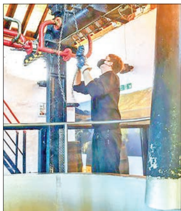
Around 10,000 people are directly employed by the Scottish distilling industry.

IT has survived world wars, Prohibition and The Great Depression but this may very well be the toughest time yet for Scotland's oldest whisky maker.