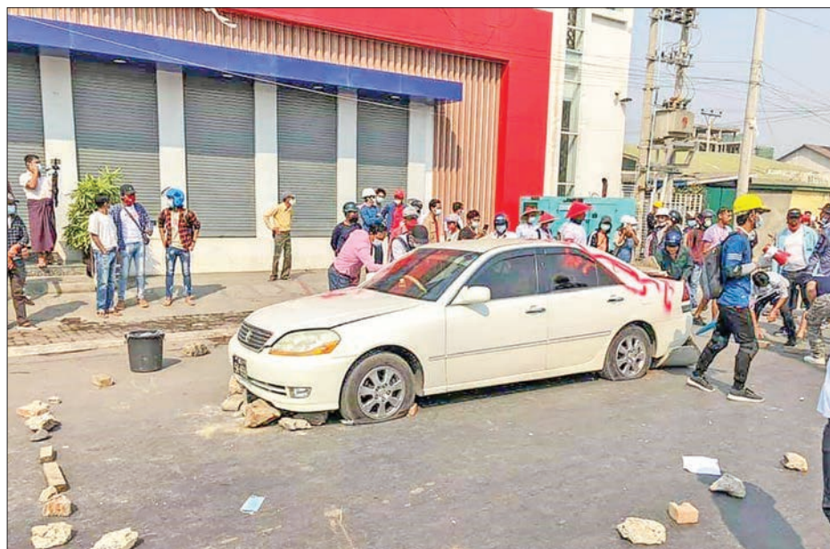
A car damaged by rioters in Chanmyathazi Township.