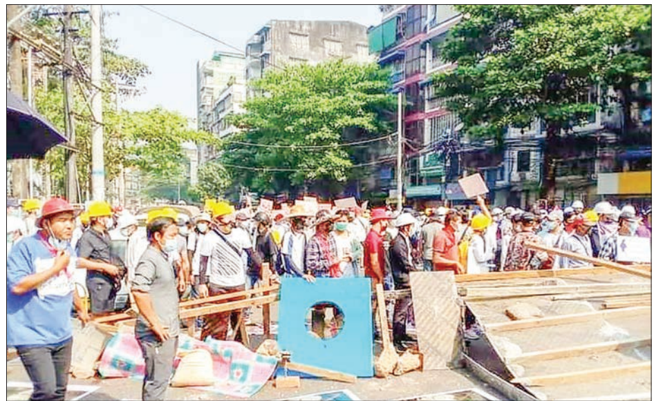
Blockage made by rioters in Yangon.