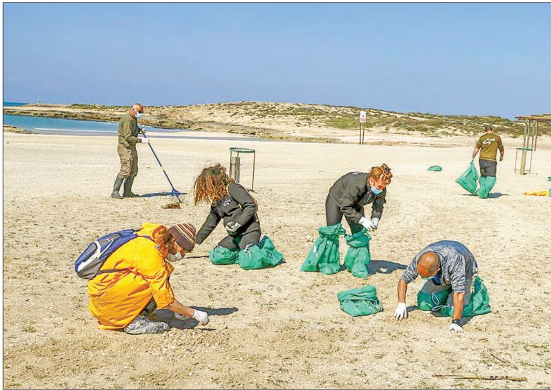
Israel volunteers clean the contaminated HaBonim beach, south the port city of Haifa.

After an Israeli media report had named the Greek oil tanker Minerva Helen as a possible culprit, the ship's owner, Minerva Marine Inc. , firmly denied any involvement. On Sunday, the ministry said that "following an inspection conducted in Greece on the Minerva Helen tanker, it has