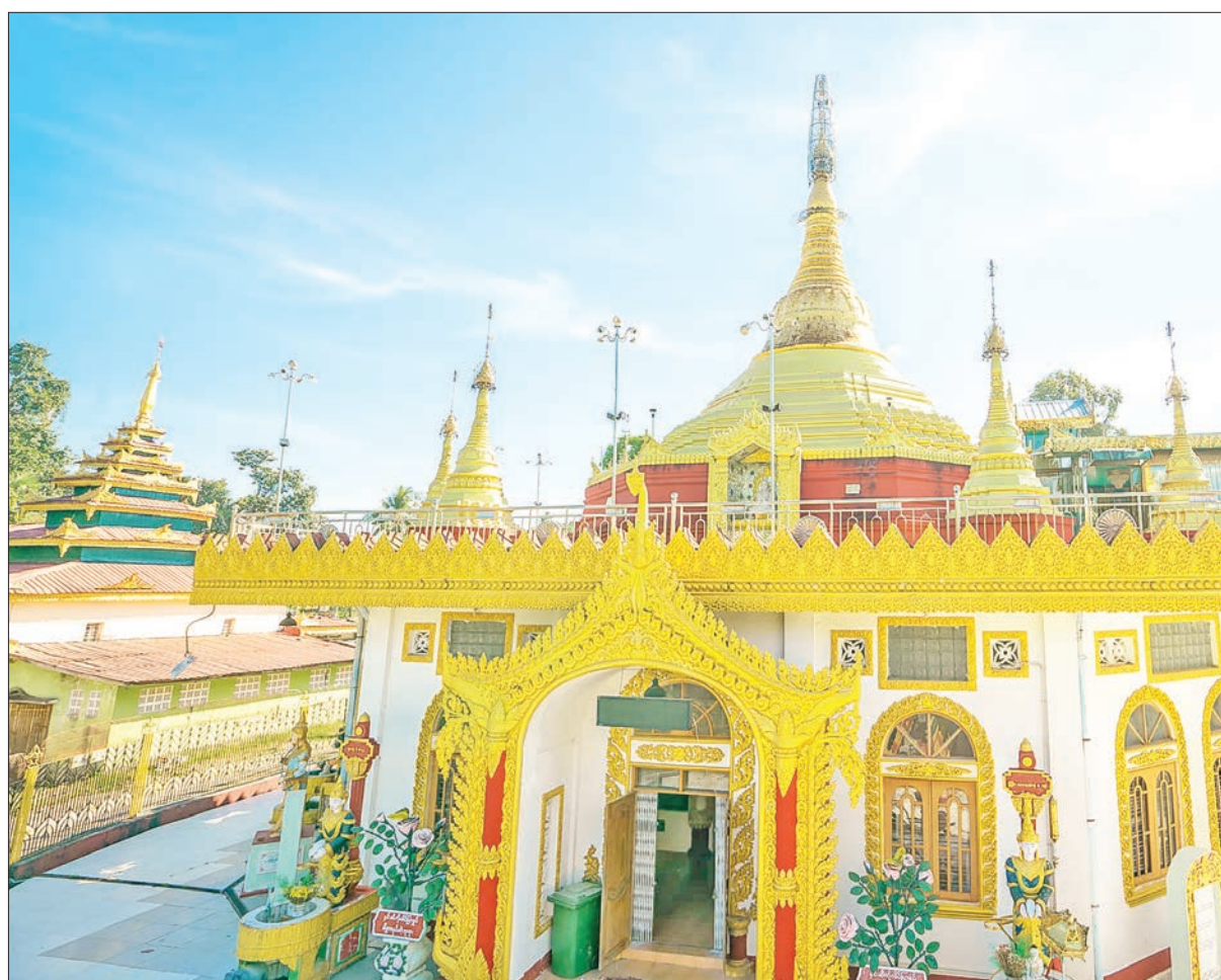
Thar Taw Myar pagoda

wide enough for two cars. There is also cliff. Therefore, walking is the best to get there. If you cannot walk, you can hire motorcycles at K5,000 for a round trip. Although it is not a fair price, you should support the residents. You have to go down to reach the waterfall. There is a small shop and you can order food. The road to waterfall is slippery when it rains. You can slip and fall even this season. The waste issue becomes worse. The visitors easily throw their waste. They even throw the masks which are new waste. If the shop owners and motorcycle taxi drivers collectively collect the garbage or put the dustbins, the environment will be better than before. The visitors also should keep their waste or throw into the dustbins.