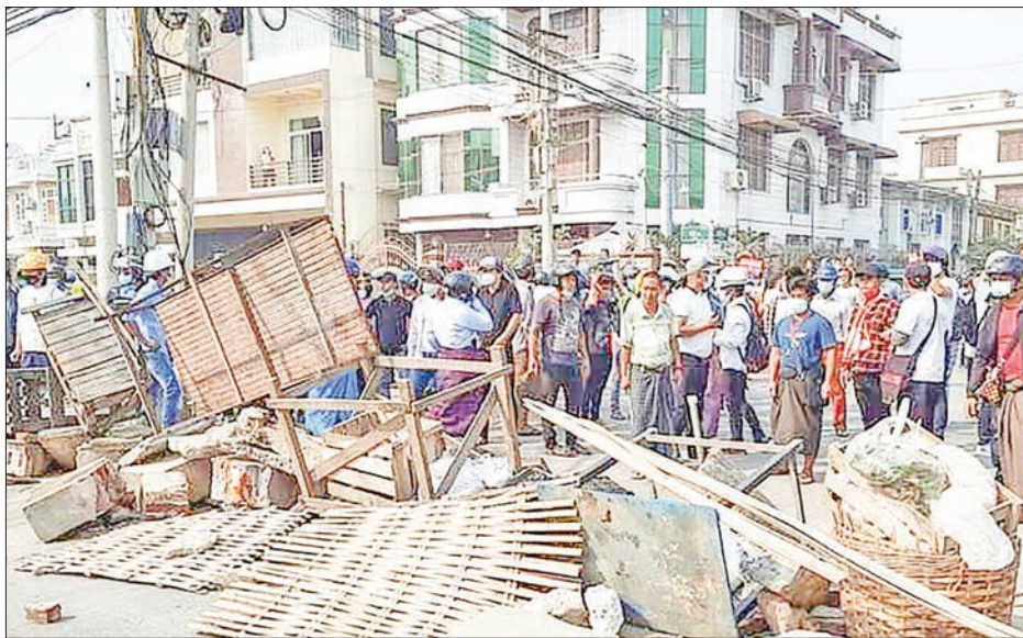
Blockage made by rioters in Mandalay.