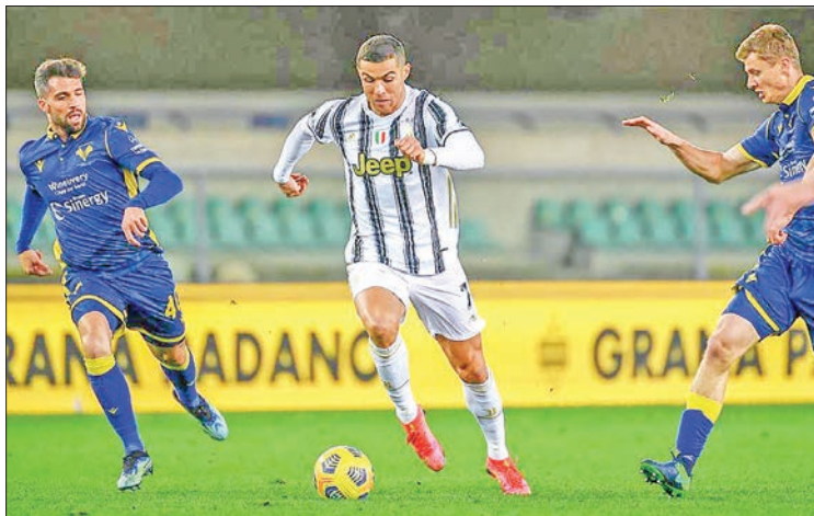
Cristiano Ronaldo scored his 19th goal this campaign but champions Juventus settled for a 1-1 draw at Hellas Verona in Serie A on Saturday.

Cristiano Ronaldo scored his 19th goal this campaign but champions Juventus had to settle for a 1-1 draw at Hellas Verona in Serie A on Saturday.