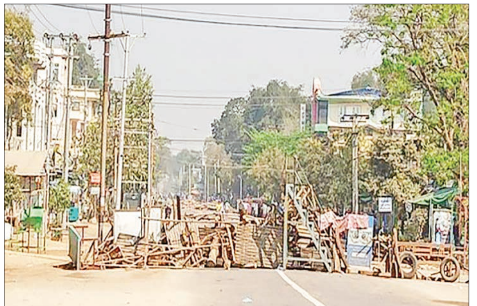
Blockage are seen on a road in Pakokku.