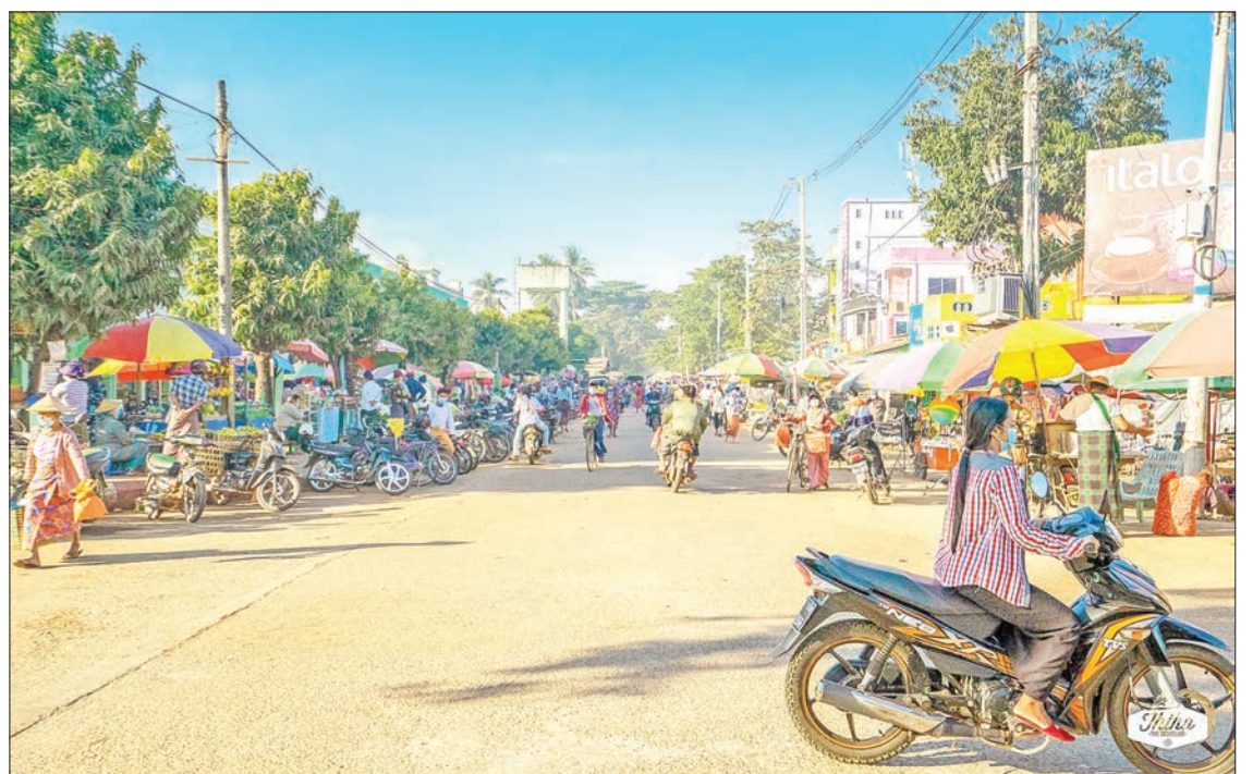
The market is crowded with buyers and vendors in early morning