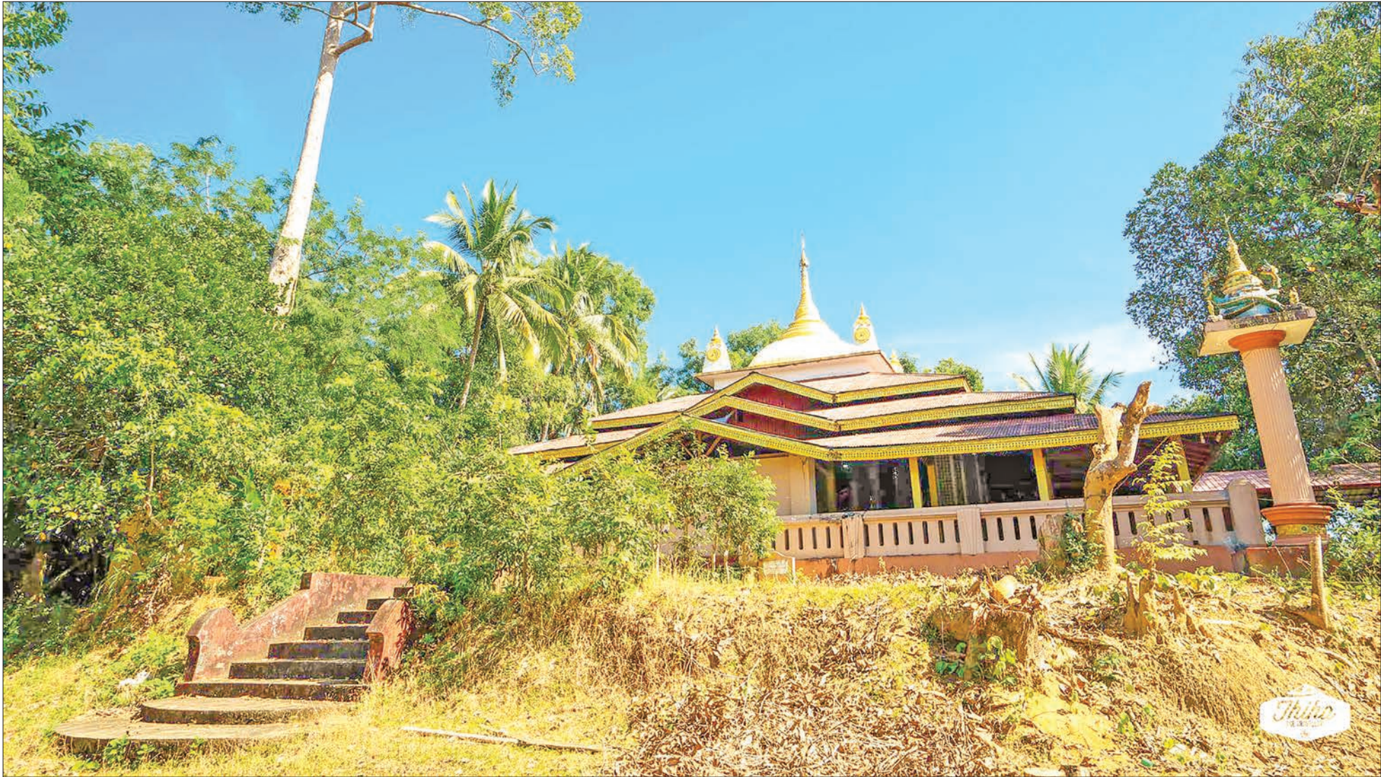
Sal Taung Pyae pagoda