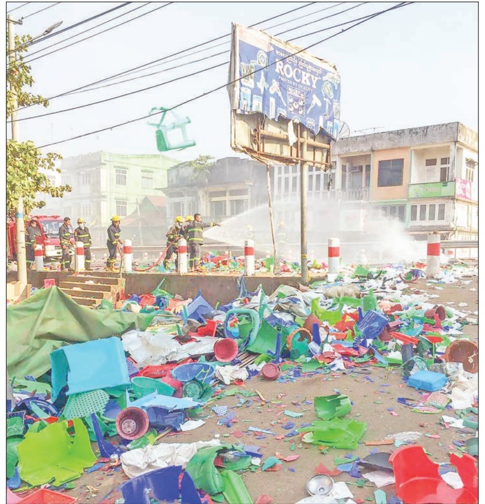
Properties destroyed by rioters in bago.

Moreover, the police used sound bombs, .12V gun and tear gas canisters