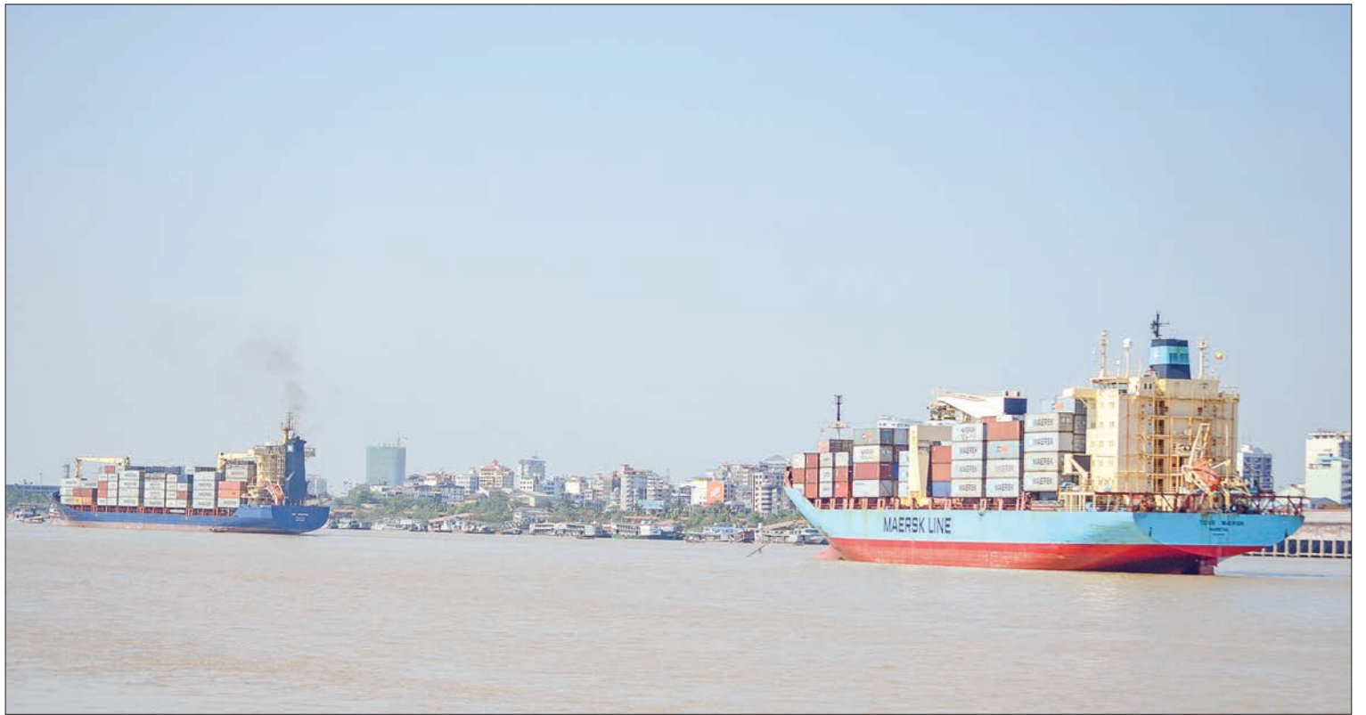
Myanmar's sea trade generated $26 billion from an overall trade value of $36 billion in the last FY2019-2020, the Ministry of Commerce's statistics indicated.

the Myanmar Mercantile Marine Development Association, some ocean liners suspended cargo transport from Myanmar.