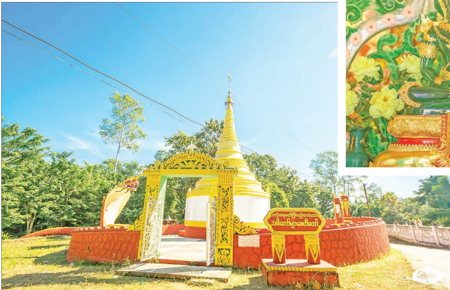
Thamee Taw Myar Pagoda