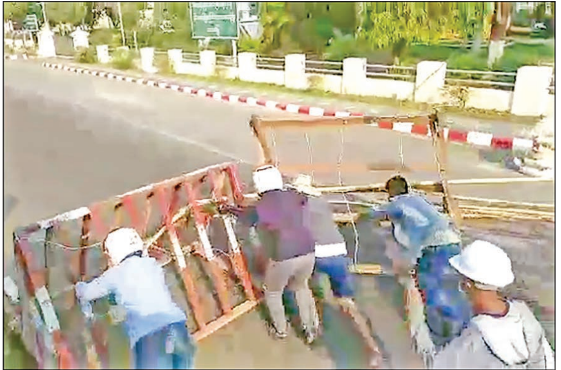
Rioters put blockage on a road in Dawei, Taninthayi Region.

Although the State Administration Council is not willing to take action against the civilians under the existing law, the council released announcements for the public to know the criminal procedures and not to follow the incitement that harm the stability of the state. Therefore, it is requested to the people not to follow the negative incitement of NLD politicians, and to continue to focus on livelihoods.—MNA