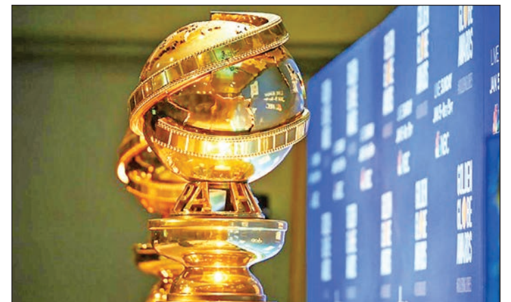
Hollywood's award season kicks off Sunday at a very different Golden Globes, with a mainly virtual ceremony set to boost or dash the Oscars hopes of early frontrunners like "Nomadland" and "The Trial of the Chicago 7." PHOTO: AFP

"Nomadland," Chloe Zhao's paean to a marginalized, older generation of Americans roaming the West in rundown vans, has long been viewed as a frontrunner for the Globes' top prize. —AFP ■