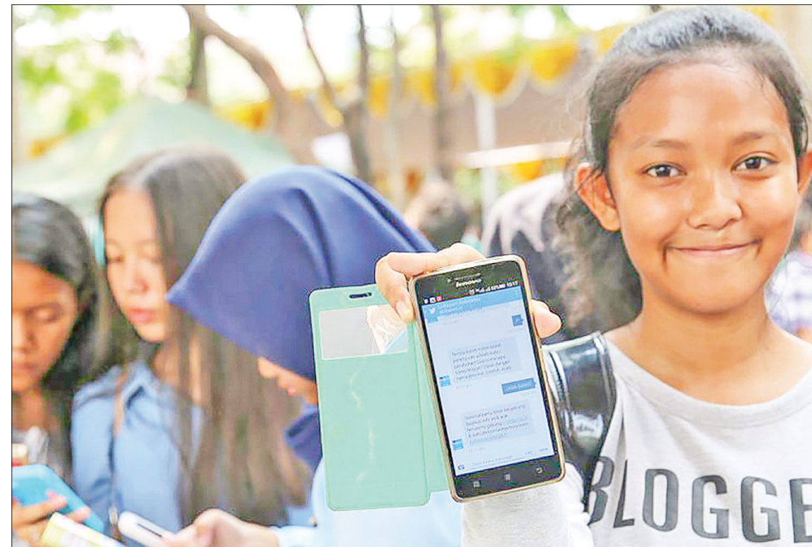
Indonesian adolescent girls use their smartphones.

‘Job polarization’ “The low wages ...for skills