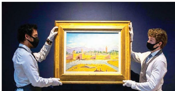
Gallery workers pose with Winston Churchill's 'Tower of Koutoubia Mosque' during a photocall at Christie's auction house in central London.

HOLLYWOOD'S Angelina Jolie and Britain's iconic wartime prime minister Sir Winston Churchill, a keen artist who took inspiration from the Moroccan city of Marrakesh, are combining for a March 1 date at Christie's auction house in London.