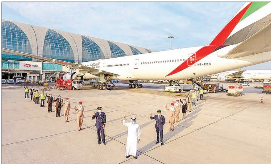
Emirates has become among the first airline in the world to operate a flight with fully-vaccinated frontline teams.

Also supporting the flight's operations were fully-vaccinated aircraft appearance, loading and special handling teams from dnata, as well as