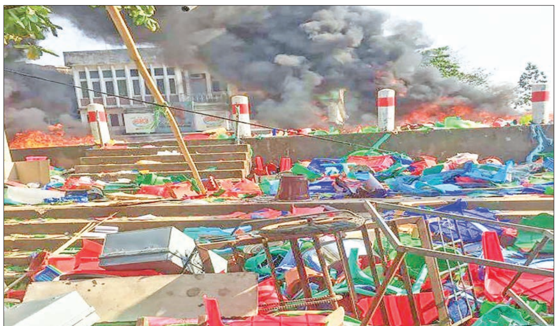
Debris are seen on a road in Bago after rioters destroy a shop.

As the State Administration Council is not willing to take action against the people under the existing laws, the council has issued orders and notifications to the people to understand the criminal laws to ensure that they can avoid from incitement for riots. Hence, the people are requested not to accept the incitement of NLD politicians and to focus on livelihoods.—MNA