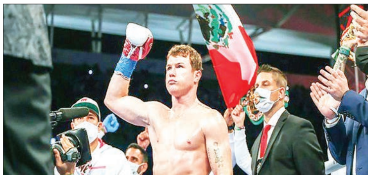
Saul "Canelo" Alvarez celebrates after crushing Turkey's Avni Yildirim in three rounds at Miami's Hard Rock Stadium on Saturday.

The outclassed Yildirim then failed to emerge from his corner for the fourth round as Alvarez once again demonstrated why he is regarded as the