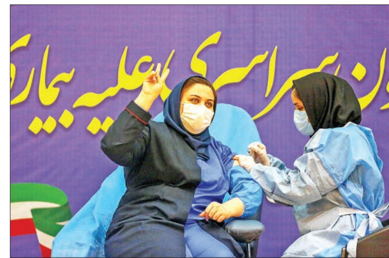
A health official receives a dose of Russia’s Sputnik V vaccine in Tehran, Iran on February 09, 2021.

“In the recent couple of days we read and heard a lot about Chinese vaccines going overseas and being embraced by many developing countries,” Foreign Ministry spokeswoman Hua Chunying said at a press conference on Feb. 19. “Some media reports said the vaccines became Spring Festi-