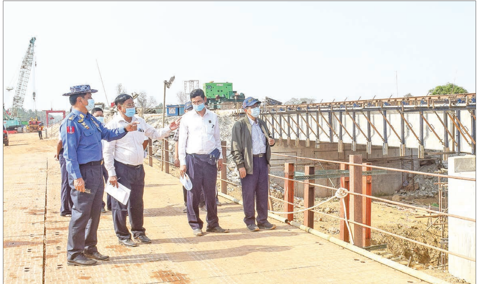
Union Minister Admiral Tin Aung San inspects Yangon-Toungoo Railway section which is being upgraded.

He also highlighted the effective use of budget, chances to learn the techniques of foreign countries, dutiful manners in respective sectors, efforts to run