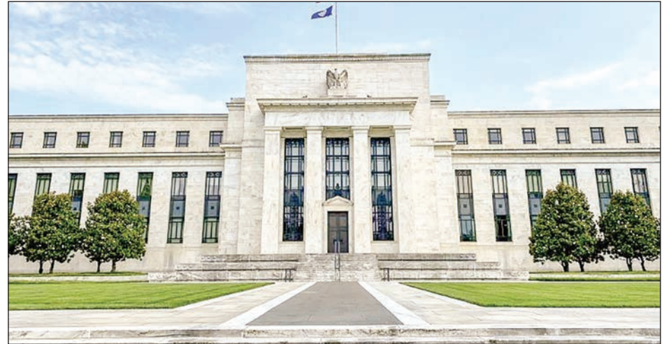
The US Federal Reserve is in the hot seat as investors are edgy about an earlier rise to interest rates than the central bank has indicated.

European inflation data for January showed a jump in prices of 0.9 percent compared to a minus 0.3 percent reading in December, as increased costs of raw materials fed through into services and industrial goods.—AFP