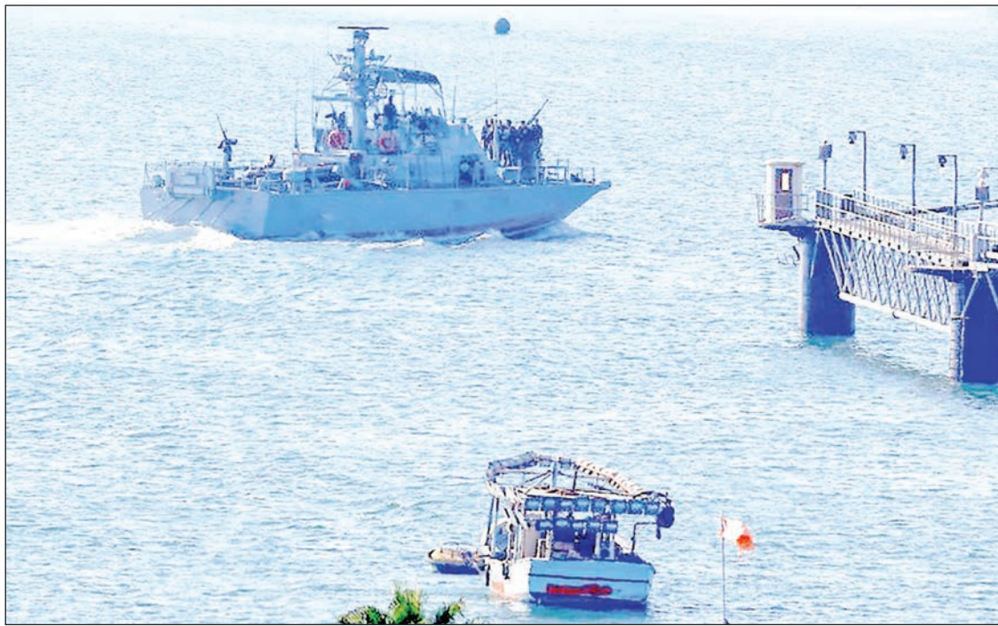
Israeli navy ships manoeuvre at the military port of Ashdod, southern Israel, on July 29, 2018.

AN international intelligence firm pointed to Iran as possibly being behind an explosion that struck an Israeli-owned cargo ship sailing out of the Middle East on Friday, an unexplained blast renewing concerns about ship security amid escalating tensions between the US and Iran.