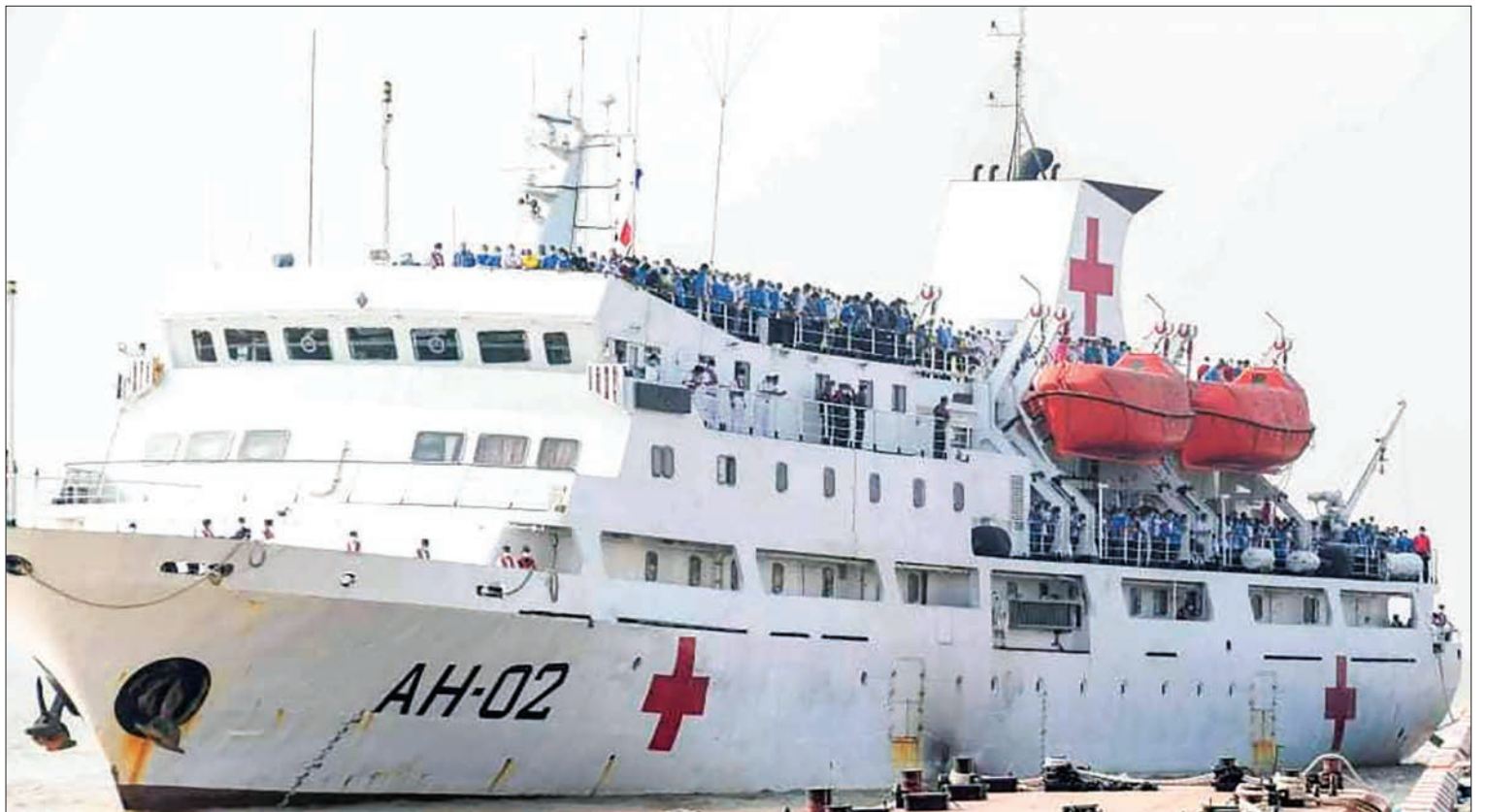
Naval vessels carrying Myanmar nationals are arriving in Myanmar from Malaysia on 27 February 2021.

After arriving in Myanmar, Tatmadaw doctors and nurses provided healthcare services to the returnees who are currently staying at the