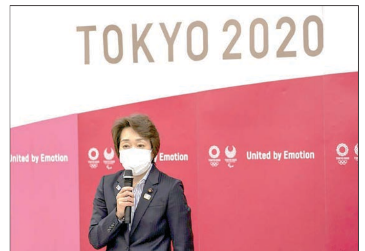
Seiko Hashimoto, who became the Tokyo 2020 president last week, told Japanese media the Games should have spectators just like other major sports.

Olympic officials have said there could be separate decisions made in the coming months about spectators from inside Japan and spectators from abroad. —AFP ■