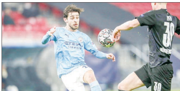
Manchester City have set their sights on a clean sweep of the four major trophies as the runaway Premier League leaders prepare to host high-flying West Ham this weekend.

Manchester City's march to the top of the Premier League was not a surprise given their title-winning pedi-