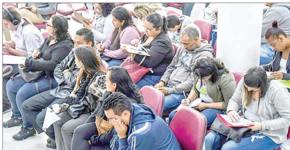
In this file photo taken on June 11, 2019 unemployed people look for job opportunities at a governmental workers service department in Sao Paulo, Brazil.

President Jair Bolsonaro faces criticism for flouting expert advice on handling the pandemic. — AFP ■