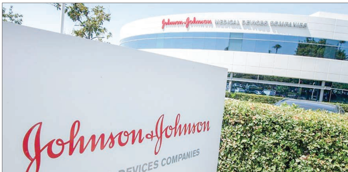
South Africa on Saturday received its second consignment of Johnson & Johnson Covid-19 vaccines, the health minister said, as the continent's hardest-hit country scrambles to shore up its inoculation drive.

SOUTH Africa on Saturday received its second consignment of Johnson & Johnson Covid-19 vaccines, the health minister said, as the continent's hardest-hit country scrambles to shore up its inoculation drive.