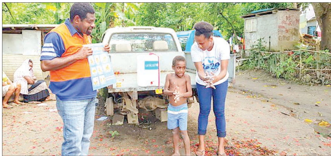
Children on the Pacific Ocean island of Vanuatu are learning, thanks to UNICEF, how to protect themselves against COVID-19 by proper hand-washing.

Vanuatu Prime Minister Bob Loughman told community leaders that priority would initially be given to people travelling on compassionate grounds for healthcare, education, employment, technical assistance