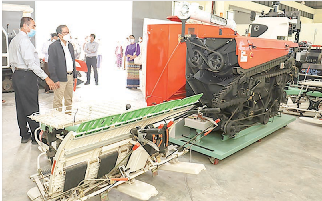
MoALI minister and officials look around the Training school for Agricultural Mechanization in Yezin, Nay Pyi Taw yesterday.

The Ministry of Agriculture, Livestock and Irrigation will integrate all respective departments for the successful transition to mechanized farming; to be able to make full use of the power of the machinery; to increase the productivity