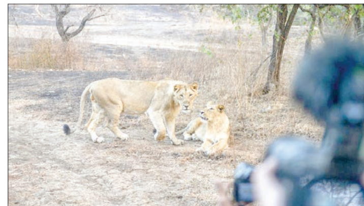
Three years after a deadly virus struck India's endangered Asiatic lions in their last remaining natural habitat, conservationists are hunting for new homes to help booming prides roam free.

The canine distemper virus -- a highly infectious disease -- was detected among dozens of the royal beasts, killing at least 11 of them. —AFP ■