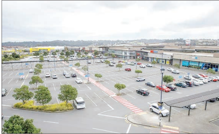
The latest restrictions in Auckland come less than two weeks after a three-day shutdown in the city.

Ardern said there was "cause for concern" that the latest case involved a person who had been infectious for a week but had not been in isolation.