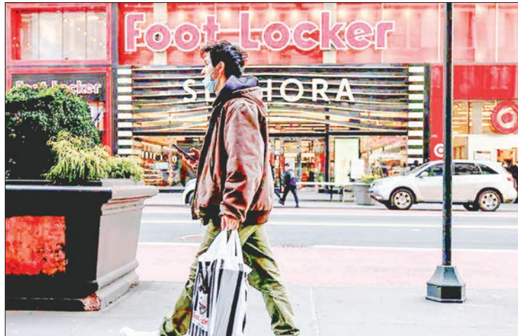
A man walks down 34th Street in midtown Manhattan in New York City on February 26.

"After 12 months of death and despair, the American recovery begins tonight," congressman Brendan Boyle told the House chamber shortly before