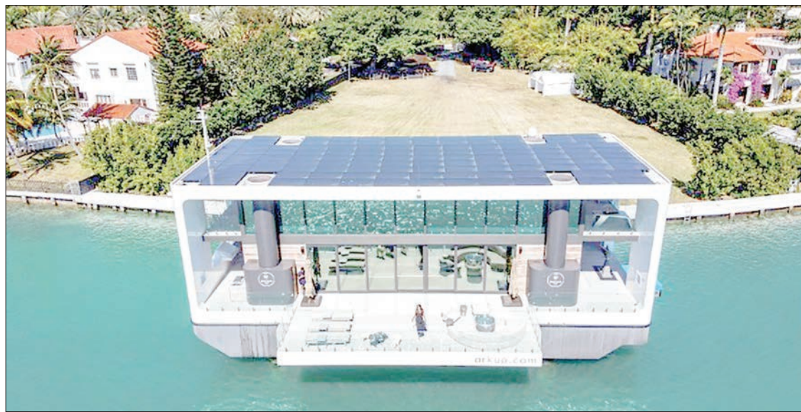
The Arkup luxury floating villa docked at Star Island in Miami Beach, Florida, on February 5, 2021. It costs $5.5 million and fits in with the rising sea levels that are threatening Florida.

She cited "adaptation action areas" as a first priority to be studied, which would include