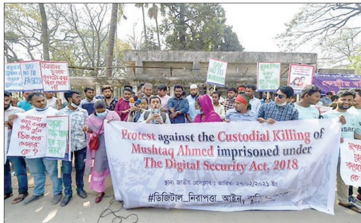
Protesters were out in the Bangladesh capital Dhaka on Saturday demanding the repeal of the country's Digital Security Act.

also not desired that unrest will be created," she said. —AFP ■