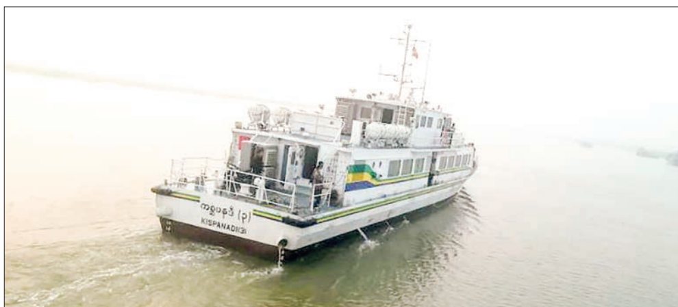
Sittway-Kyaukpyu cruise is seen reopening its services.

THE Sittway-Kyaukpyu (coastal direct) cruise from the Inland Water Transport of the Ministry of Transport and Communications resumed in accordance with the COVID-19 disease prevention regulations yesterday morning.