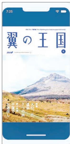
Photo shows the cover of an All Nippon Airways Co. in-flight magazine displayed on a smartphone.

While all passengers will be able to access the digital magazines, the digital newspapers will not be available to those traveling in economy class, the airline said. — Kyodo News ■