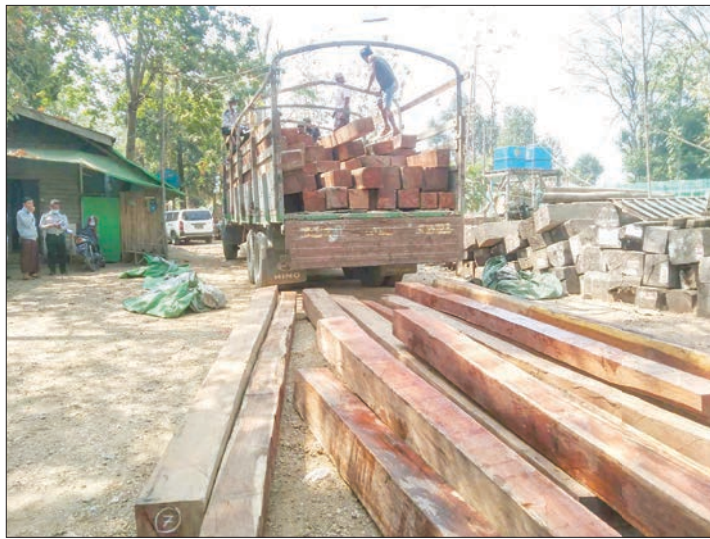
The loggers, the vehicle driver and the helpers, were charged under Section 42(A) of the Forestry Law. PHOTO: AUNG MYINT (PADAUNG)

The police attempted to arrest them. The loggers, the vehicle driver and the helpers, were charged under Section 42(A) of the Forestry Law. —Aung Myint (Padaung)/GNLM