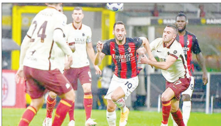
Milan take their title push to Rome on Sunday looking to keep touch with leaders Inter in a top-four clash which could boost champions Juventus's hopes of a 10th consecutive crown.

TURIN — Milan take their title push to Rome on Sunday looking to keep touch with leaders Inter in a top-four clash which could boost champions Juventus's hopes of a 10th consecutive crown.