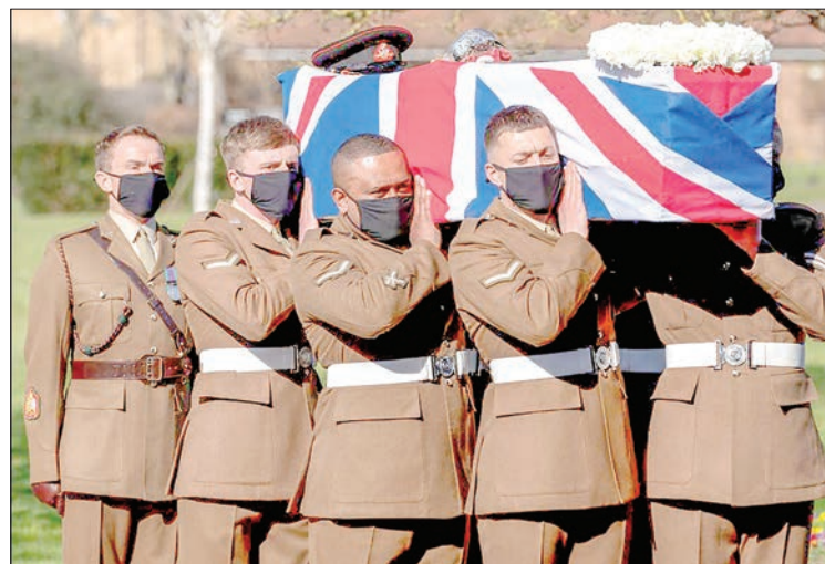
Soldiers from the British Army's Yorkshire Regiment carry the coffin of Captain Tom Moore during his funeral service at Bedford Crematorium in Bedford, north of London.

BRITAIN bid farewell on Saturday to Captain Tom Moore