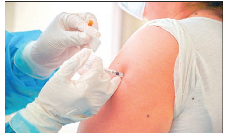
Ecuador's health minister Juan Carlos Zevallos resigned Friday in the latest scandal to hit a South American government over well-connected citizens jumping the queue for coronavirus vaccines.

Zevallos, now under investigation, occupied the health ministry for 11 months. He said he decided to resign "given the current political situation and in order to allow continuity" of the vaccination campaign that began in January. —AFP ■