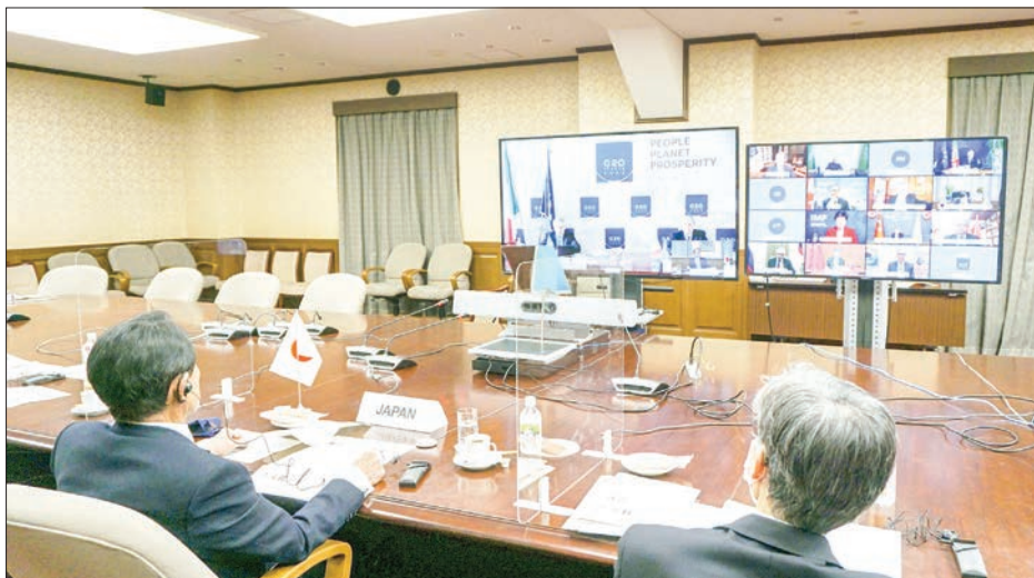
Finance chiefs from the Group of 20 economies attend a virtual meeting on Feb. 26.

ting weaker economies more severely. This risks jeopardizing development prospects, especially in Af-