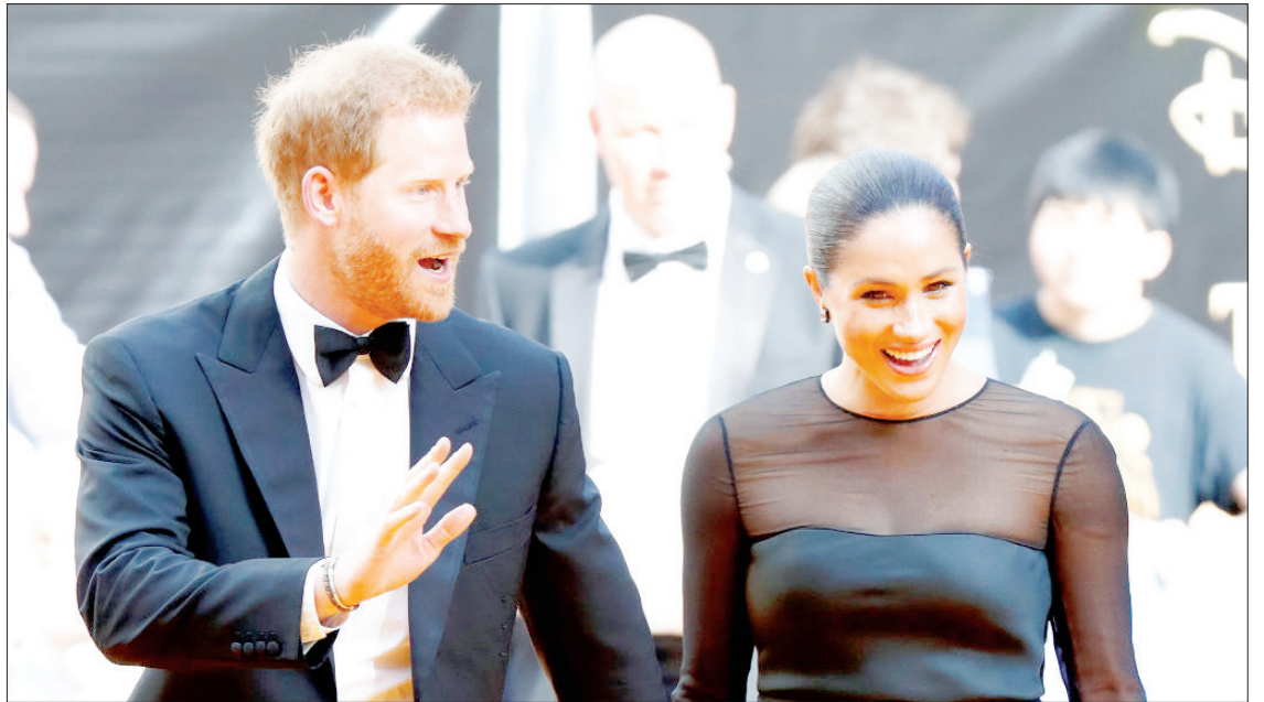
Britain's Prince Harry said in a rare one-on-one interview that he left royal life because the British press was "destroying" his mental health, and revealed he watches "The Crown".