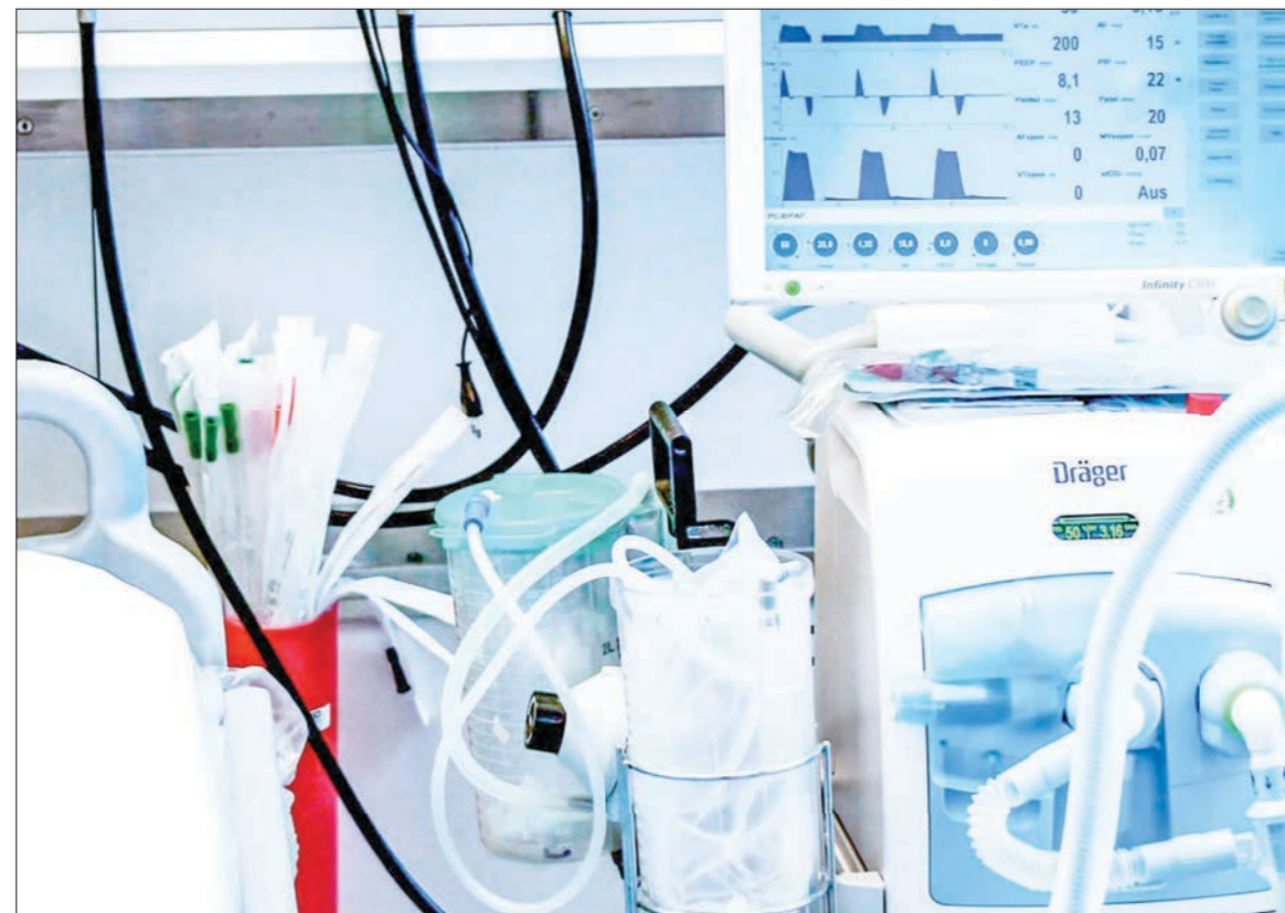
Ventilators are one of the most important tools hospitals have for keeping Covid-19 patients in the most critical condition alive.

Tedros noted that Côte d'Ivoire had received its first doses of the COVID-19 vaccine with more to be shipped to other countries in the days and weeks ahead — with the goal of getting vaccination underway in