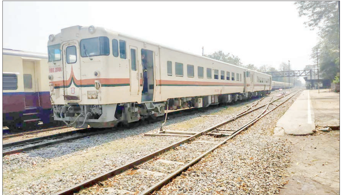
Myanma Railways will soon resume regular services for short-distance and long-distance passenger and cargo trains.

Myanma Railways will soon resume regular services for short-distance and long-distance passenger trains as well as freight trains depending on the strength and durability of important railway lines, transportation system and station conditions. All kinds of railway services in Myanmar have been reduced due to the outbreak of COVID-19.—MNA