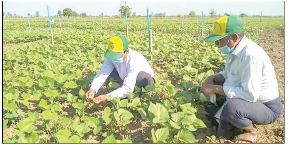
According to the local farmers, the green gram yields abundantly and has a fair price in Minbu (Sagu) township.

ACCORDING to the local farmers, the farmers are happy with the high yield of green grams in U Yin Zin village, Minbu (Sagu) township in the Magway region, and their product's fair prices.