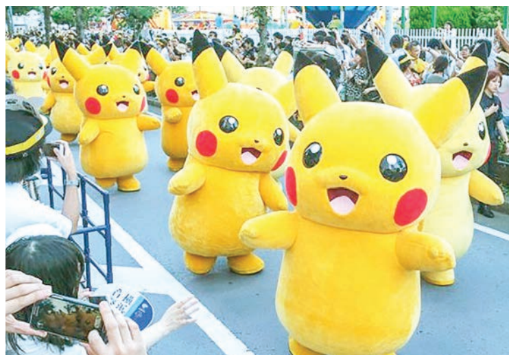
Red-cheeked Pikachu is instantly recognizable around the world as one of the best-known Pokemon.