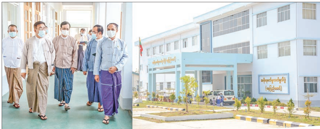
Union Minister Dr Nyunt Pe and officials inspect the preparations for reopening schools in Nay Pyi Taw on 26 February 2021.

During his visit, Union Minister instructed to focus mainly on school buildings, classrooms, teaching materials, toilets, water and electricity for the basic schools and to make preparations to fulfil the needs to reopen the schools across the nation, includ-