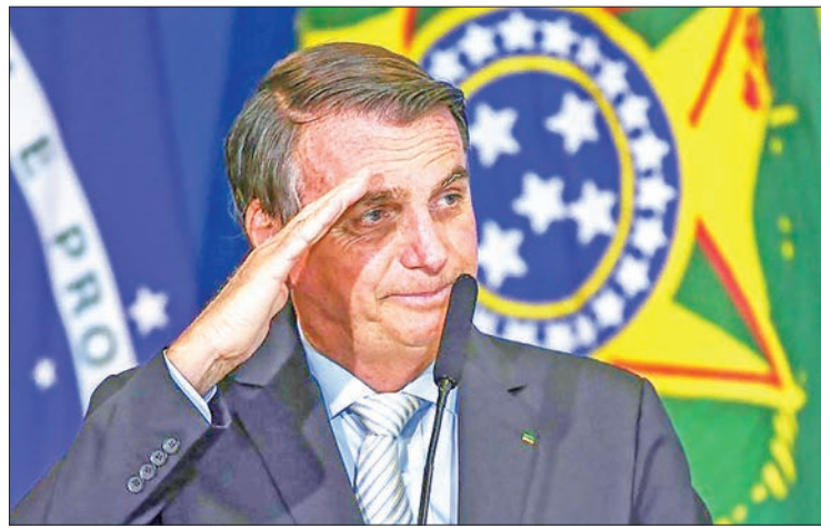
President Jair Bolsonaro’s CEO switch triggered fears that he will try to make Petrobras hold fuel prices artificially low as he eyes re-election next year.

THERE were many questions at Brazilian state-run oil company Petrobras’s annual results conference: is pandemic mayhem behind us for good? Will the incoming chief executive keep the firm on its cost-cutting trajectory?