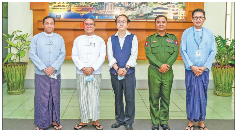
The Union Minister, Deputy Minister and officials are seen receiving the CCTV's Chief Correspondent in Nay Pyi Taw 26 February 2021.