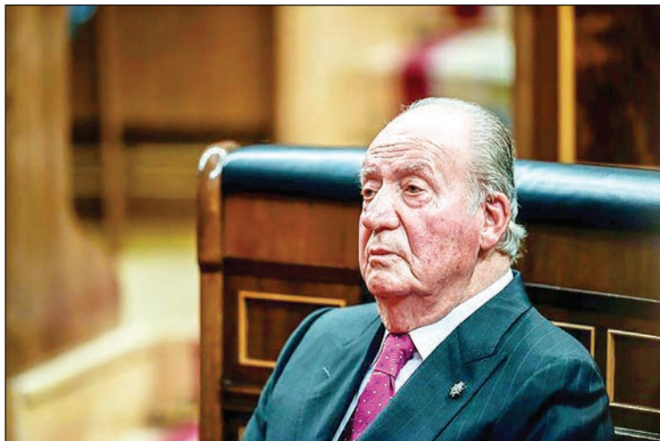
Juan Carlos has since lived in self-imposed exile in the United Arab Emirates since last year.

The back-taxes were due on the value of private jet flights -- worth eight million euros, ac-