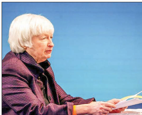
Former Federal Reserve chief Janet Yellen is attending the G20 finance ministers' gathering for the first time as Joe Biden's Treasury Secretary.

"Without access to vaccines, low-income countries in particular will experience further tragic loss of life and needlessly delay their economic recoveries," Yellen wrote in an open letter to her G20 finance counterparts. —AFP ■