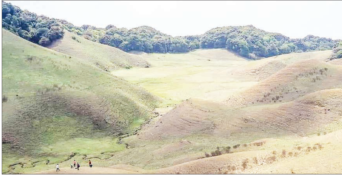
The Buannel Mountain, also known as Leen Nupa mountain, is extraordinary for its hill where there are no trees growing naturally except grasses.

“The mountain is spectacular for those who like to do hiking and for nature lovers. A guide can be available in Monhlwa village at the foot of the mountain. In addition to the lifestyle of the village, natural beauty can also be felt. For those who want to stay over-