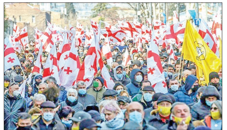
The opposition has staged mass rallies since October.

Opposition members have refused to enter the new parliament in a boycott that weighs heavily on the ruling party's le-