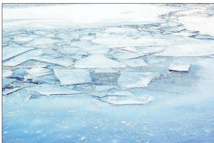
A frozen lake.

FOUR people were killed when they fell through the ice on a lake in southern Sweden on Thursday, police said, as the country experiences a spell of unseasonably mild weather.