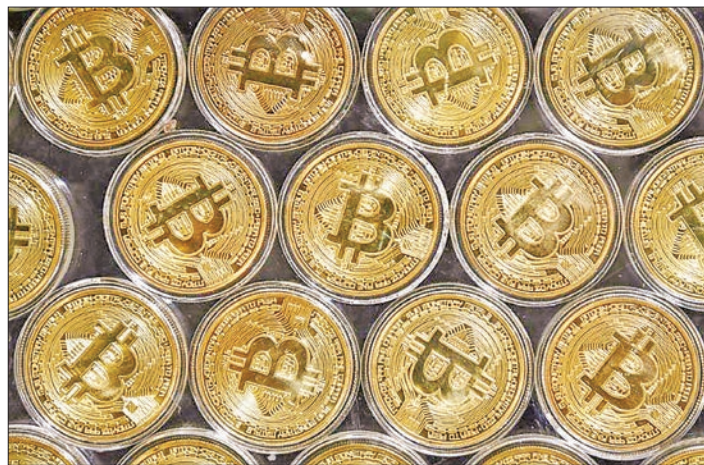
Coinbase filed papers to become publicly traded through a direct listing. PHOTO: AFP

Coinbase had 43 million retail users across 7,000 institutions on its platform in 2020. —AFP ■