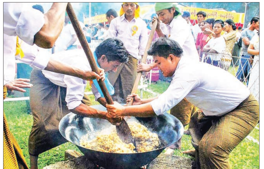
One of the Htamane-making competitions in progress.

After putting water to it, two persons with their paddles and begin kneading, crushing and stirring the Htamane. Then, sesame seeds, peanuts and coconut shavings are mixed with the Htamane and get a seasonal meal of the traditional Myanmar month of Tabodwe.