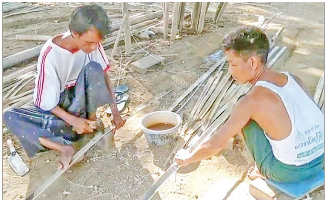
The bamboo wall makers are buying the raw bamboo poles from the woods and bamboo shops in Kyaukse town. Then, they are weaving the bamboo walls for sale.

THE locals from Kyaukse township in Mandalay are earning family income from the bamboo wall weaving industry, said U Myint Swe, a bamboo wall weaver from Ye Su Ward in Kyaukse township.