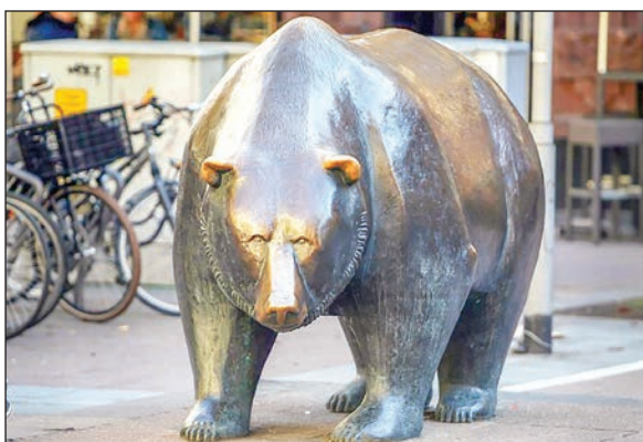
While optimistic about the economic outlook, world markets have turned bearish on concerns about a hike in interest rates coming sooner than expected.

There is a worry that surging inflation could threaten one of the key pillars of the rally on world markets from their March nadir -- record-low borrowing costs. —AFP