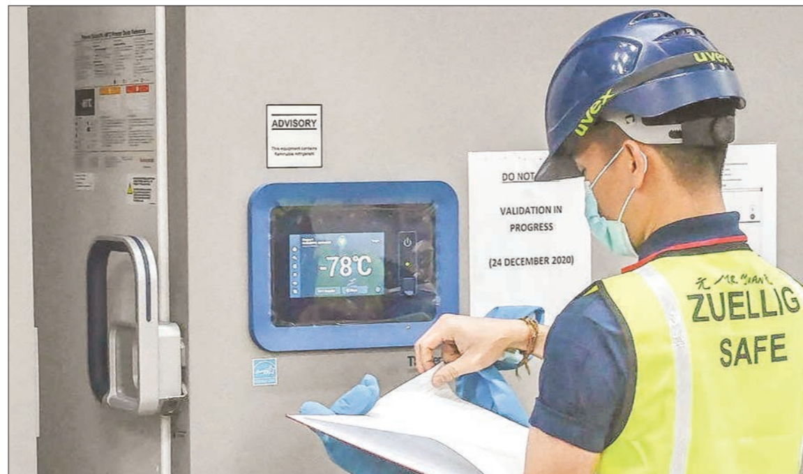
A staff member inspecting a fridge that will be used to store COVID-19 coronavirus vaccines at the Zuellig Pharma facility in Singapore on 20 January, 2020.

The second assumption is that COVID-19 vaccines will aggravate global inequality in 2021. All Organization for Economic Co-operation and Development (OECD) countries except Turkey have procured more doses than their population needs; Canada, for example, has enough for nearly six times its population.