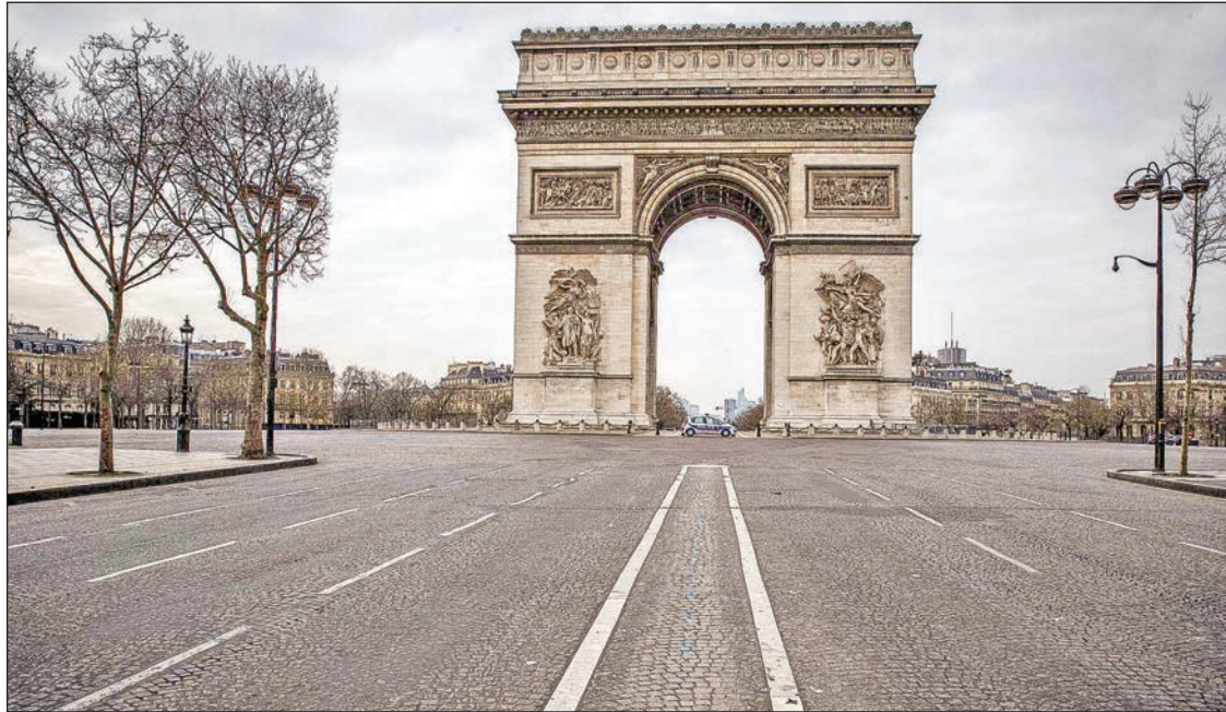
The Arc de Triomphe in Paris on March 17, 2020, as a then strict lockdown came into effect in France to stop the spread of COVID-19.

“You can’t force yourself to live in a semi-prison for months. Now you have to make coura-