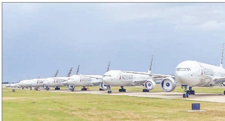
A Boeing 777 airliner on Friday made an emergency landing in Moscow with engine problems, the operating airline said, days after another model rained down engine debris over the United States.

The incident came just days after Boeing confirmed that dozens of its 777 aircraft