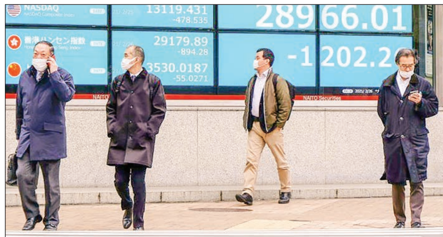
Falls of Wall Street pressed investors in Tokyo to hit the sell button from early in the trading day.

TOKYO'S key Nikkei index tumbled four per cent at the close on Friday after a rout on Wall Street as rising bond yields in the United States and elsewhere stoked inflation fears.