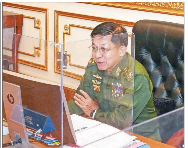
State Administration Council Chairman Senior General Min Aung Hlaing discusses security, stability and the rule of law measures in Nay Pyi Taw on 26 February 2021.

CHAIRMAN of the State Administration Council and Commander-in-Chief of Defence Services Senior General Min Aung Hlaing chaired the first meeting of Security, Stability and Rule of Law Committee yesterday.