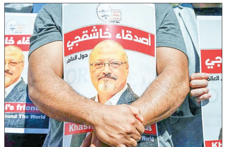
The US director of national intelligence is expected to release a damning report Friday that fingers Saudi Crown Prince Mohammed bin Salman for the brutal murder and dismemberment of dissident journalist Jamal Khashoggi in October 2018.

THE US director of national intelligence is expected to release a damning report Friday that fingers Saudi Crown Prince Mohammed bin Salman for the brutal murder and dismemberment of dissident journalist Jamal Khashoggi in October 2018.