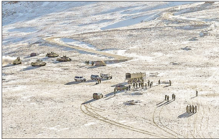
Chinese soldiers undertake a military disengagement along the Line of Actual Control at the India-China border in Ladakh.

Both sides have sent thousands of extra troops and military hardware to the area since the clash.