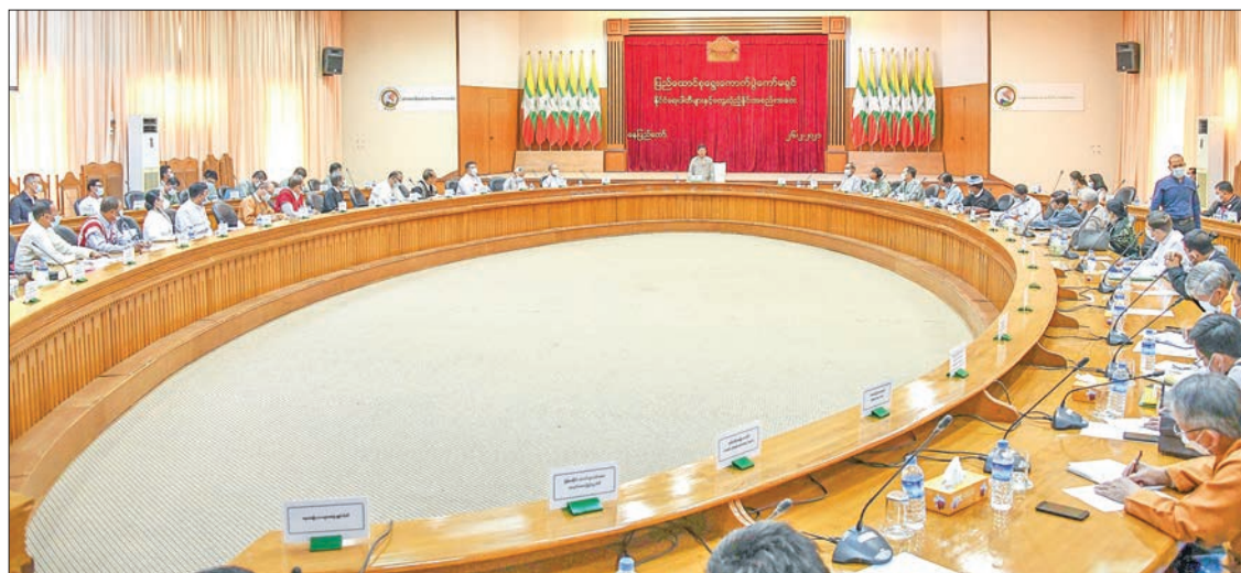
UEC holds meeting with 53 political parties in Nay Pyi Taw on 26 February 2021.

Council also reconstituted the UEC and tasked it with investigating the possible voter fraud, and the new commission began scrutiny on the issue on 5 February.