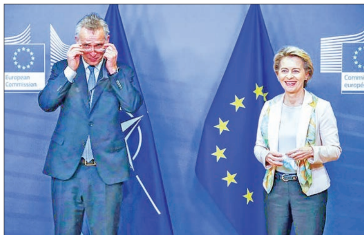
NATO's Jens Stoltenberg will take part in Friday's video summit amid concerns that the EU's defence push could undermine the US-backed alliance.

EU leaders agreed Friday that the bloc should take more responsibility for its own security,