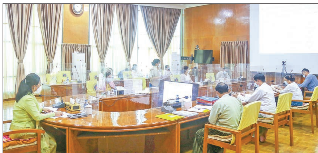
MoSWRR Minister Dr Thet Thet Khine chairs the meeting over the Elders Law (Draft) at her office in Nay Pyi Taw yesterday.

The Government Technical Institute (Nay Pyi Taw) offers regular AGTI courses for students like Civil Engineering, Electronic Engineering, Electrical Power Engineering, Mechanical Engineering and Information Technology. The institute also plans to conduct short-term courses.