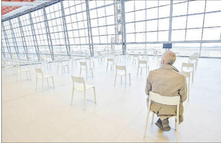
A man waits to receive a COVID-19 vaccine at a vaccination centre in the Zaventem Skyhall in Brussels airport.

THE more contagious British variant of the coronavirus is now the dominant strain in Belgium, authorities said Friday, as they explained why infection numbers have again started to rise.