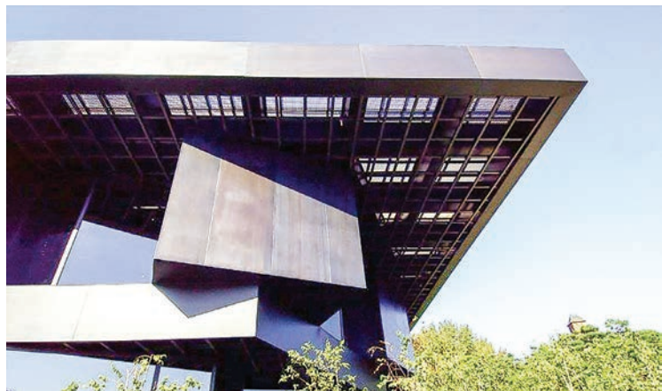
The Samsung group -- South Korea's biggest conglomerate -- founded the Leeum, Samsung Museum of Art in Seoul.

TWO self-made South Korean billionaires have pledged in as many weeks to give away half their fortunes -- a rarity in a country where business is dominated by family-controlled conglomerates and charity often begins and ends