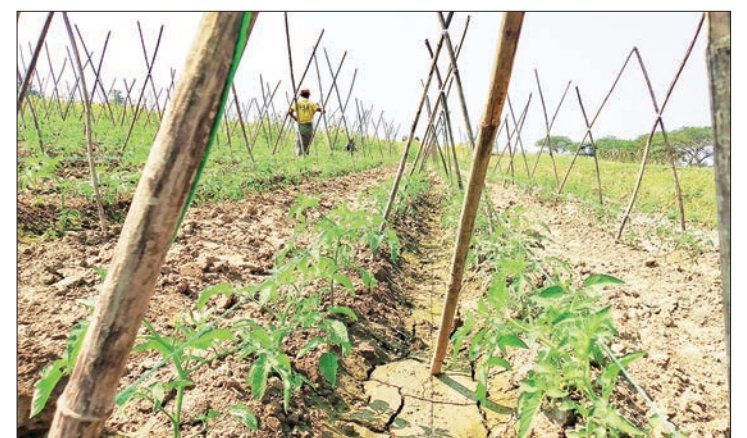
The growers from Paungbyin township are annually cultivating the tomatoes in September. PHOTO: KO TUN

The growers from Paungbyin township are annually cultivating the tomatoes in September. The nursery plants are transplanted to the ground after 15 days, and the fruits could yield after three months. The fruits could be harvested for up to 6 months. The tomato plantations can generate an income of K1.5 million per 1,000 trees, and the cultivation costs K100,000. —Ko Tun (Paungbyin)/GNLM