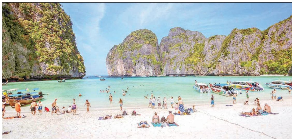
After a disastrous 2020 for tourism caused by the coronavirus pandemic, industry planners hope that clear signs of green shoots will emerge in the international travel trade sometime this year.

AFTER a disastrous 2020 for tourism caused by the coronavirus pandemic, industry planners hope that clear signs of green shoots will emerge in the international travel trade sometime this year.