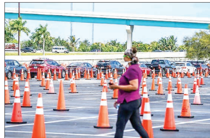
Several COVID-19 testing options are available to City of Miami residents.

THE United States crossed the grim milestone of 500,000 deaths from Covid-19 on Monday, a year since announcing its first known death from the virus on February 29, 2020 in the Seattle area.