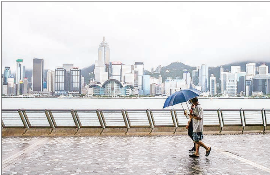
Hong Kong’s government has been forced to shore up its coffers after protests and pandemic hammered the city’s economy.

The economy contacted a record 6.1 percent in 2020 but Hong Kong was already suffering going into the year, having been hit by months of sometimes violent pro-democracy protests that caused much of the city to be shut