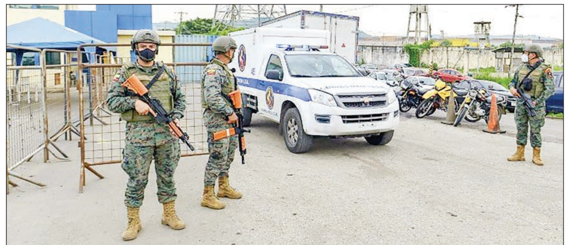
Officials say 37 prisoners died at two jails in the western port city of Guayaquil, 34 at a prison in Cuenca in the south, and eight in the central Andean town of Latacunga.

This still left Ecuador’s prison system, with a capacity to house 29,000 inmates in 60-odd facilities, with a prisoner population of 38,000. —AFP ■