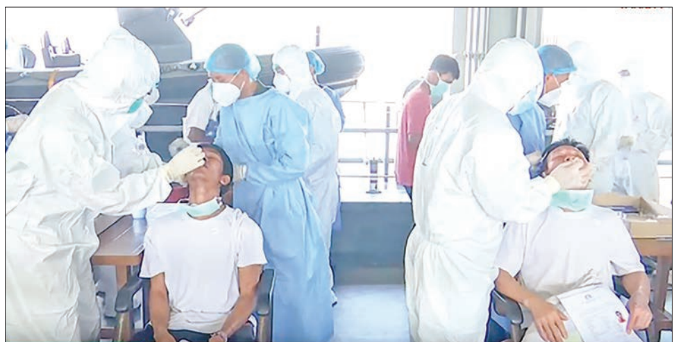
Myanmar returnees are seen undergoing medical treatments onboard the Navy vessels.

ACCORDING to the directives of Chairman of the State Administration Council Senior General Min Aung Hlaing, the Myanmar Navy ships carrying a total of