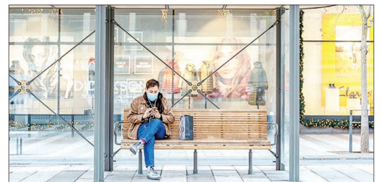
A man wearing a face mask waits for a bus during the COVID-19 pandemic in Stockholm, capital of Sweden, on Nov. 3, 2020.

The statistics revealed that decreased net immigration was the main reason behind the decelerating population growth.