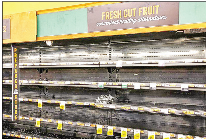
Photo taken on Feb. 19, 2021 shows empty fruit shelves at a Tom Thumb grocery store in Plano, northern suburban city of Dallas, Texas, the United States.

THE United State's energy delivery system, not just in Texas but everywhere, needs a radical overhaul if it is to withstand future shocks and play the role that President Joe Biden has assigned it in the battle against climate change, said The New York Times on Monday in an Opinion article titled "The Les-