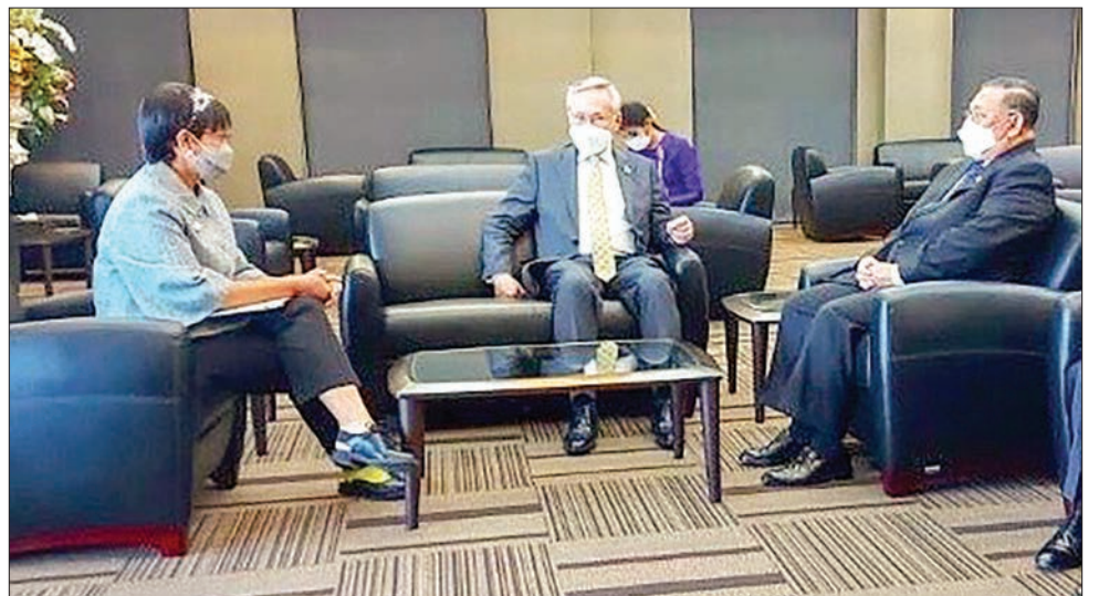
Union Minister U Wunna Maung Lwin meets Mrs Retno Marsudi, Indonesian FM and Thai FM Mr Don Pramudwinai yesterday.