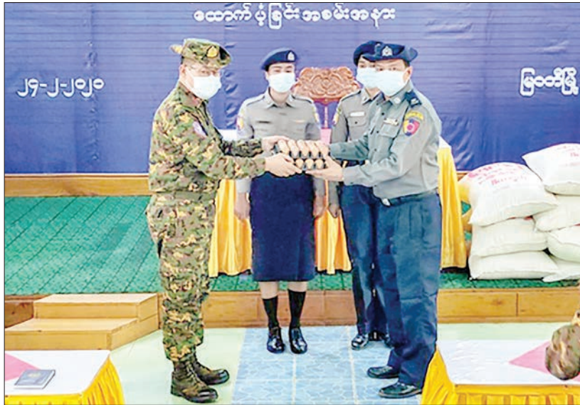
Basic foodstuffs are provided to police members in Myawaddy town.

OFFICIALS of Thingan Nyi Naung region of East Command to police members in Myawaddy of Kayin State.