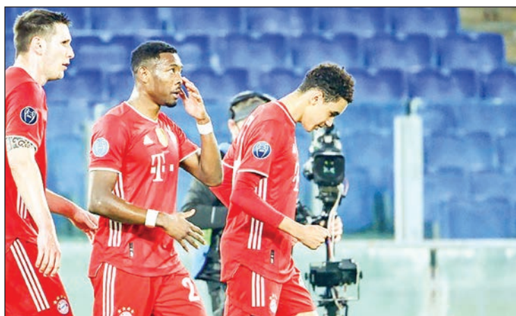
Bayern Munich’s England Under-21 midfielder Jamal Musiala (R) celebrates scoring his first Champions League goal.

coach Hansi Flick told Sky. Joaquin Correa pulled a goal back early in the second half to give the scoreline some respectability for Lazio. —AFP ■