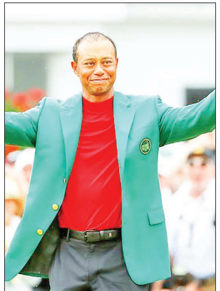
Tiger Woods, celebrating his 15th major title at the 2019 Masters, has been among the world’s most famous athletes for the past 25 years.

LOS ANGELES — The amazing golf career of Tiger Woods, from two-year-old prodigy to his epic comeback 2019 Masters victory, was in jeopardy Tuesday after injuries suffered in a serious solo car crash.