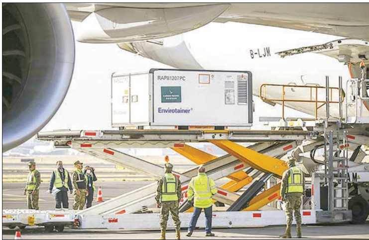
Staff members unload a temperature-controlled cargo container with COVID-19 vaccines from Chinese company Sinovac inside from a plane at the airport in Mexico City, Mexico, Feb. 20, 2021.

Mexican health authorities announced on Sunday that Ecatepec would receive the first batch of the Sinovac vaccine as the country's second-most populous municipality has COVID-19 mortality rates that are above the national average. — Xinhua ■