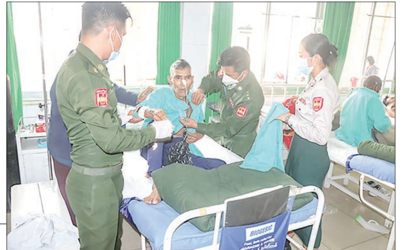
A local patient undergoes treatments at the Tatmadaw hospital in Myitkyina.