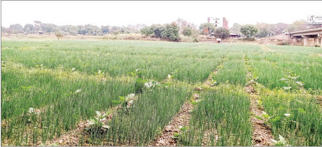
The high demand by foreign markets and a remarkable price rise prompted the growers to expand the onion cultivation in 2020.

ONION growers from Shwetapin village of Minbu Township, Magway Region, expect a fair price in mid-March and April as they cultivated onions on a large scale this winter.