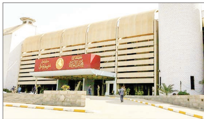
Police in Australia and Canada have arrested four people accused of trying to extort a member of Iraq’s parliament.

Two men in their twenties were arrested in Sydney and a woman and a man in their thirties were arrested in Edmonton, Canada. —AFP ■