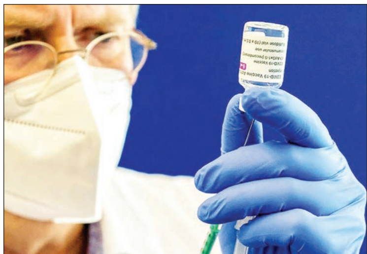
AstraZeneca’s EU supply chains will only be able to provide half of the expected doses for the second quarter, but the shortfall will be made up from its global capacity.

The UK government has vaccinated millions of Britons with the AstraZeneca jab since late last year. —AFP ■