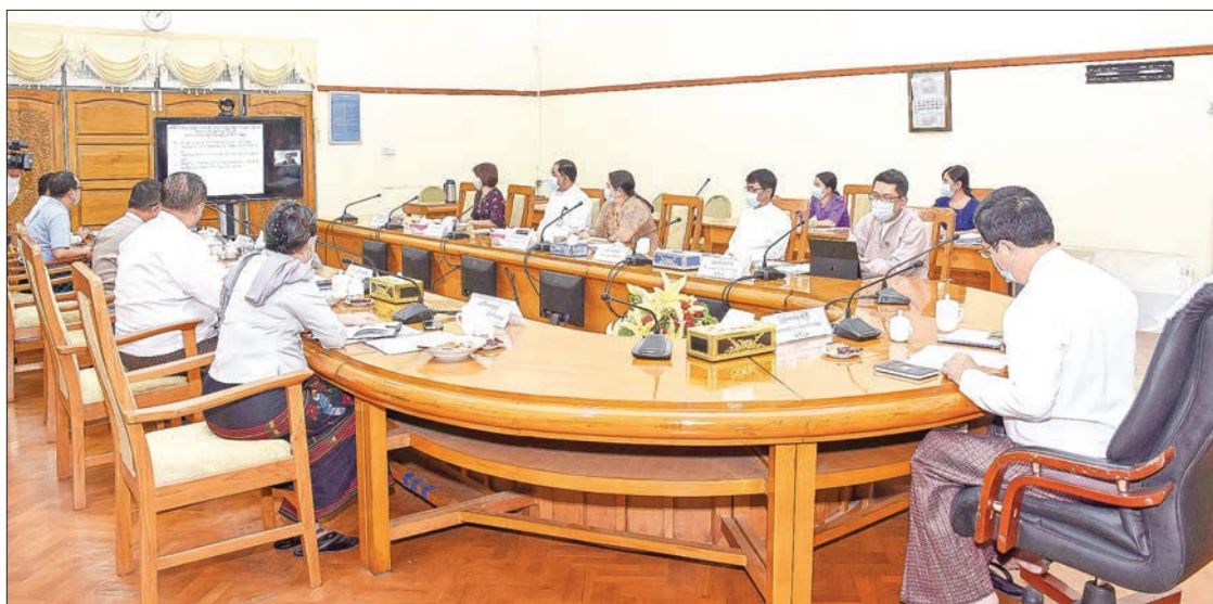
The second-day virtual meeting on trade promotion and export of new items is seen in progress on 24 February 2021.

Union Minister for Agriculture, Livestock and Irriga-