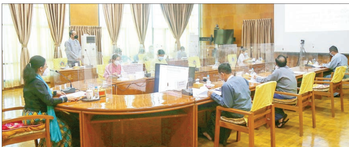
Union Minister Dr Thet Thet Khine chairs the national committee meeting on the rights of persons with disabilities yesterday.

THE Ministry of Social Welfare, Relief and Resettlement held the meeting to explain