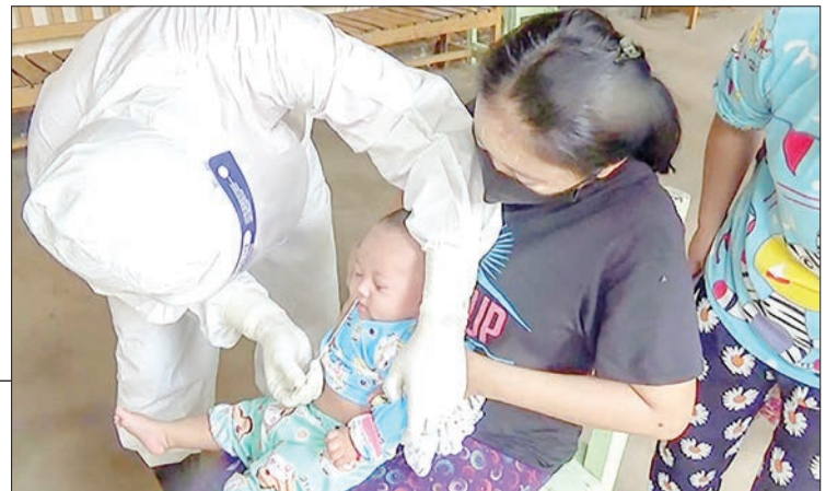
A baby is tested for COVID-19 by military medical corps in Mawlamyine.

Medical doctors and nurses from the local military hospital under the Southeast Command, members of Township Administration Council and civil society organizations jointly performed the medical tests in Mawlamyine Township.