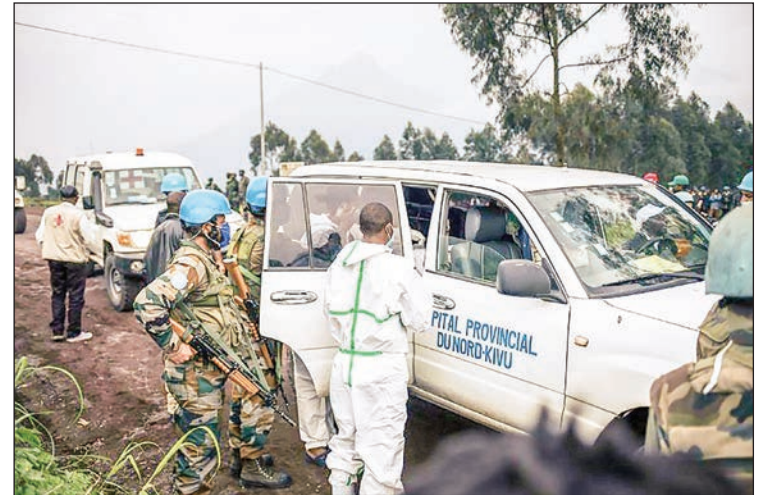
The convoy was ambushed in a dangerous part of the eastern DRC near the border with Rwanda.

Di Maio’s comments came the morning after the bodies of the two Italians were returned by military plane to Rome.