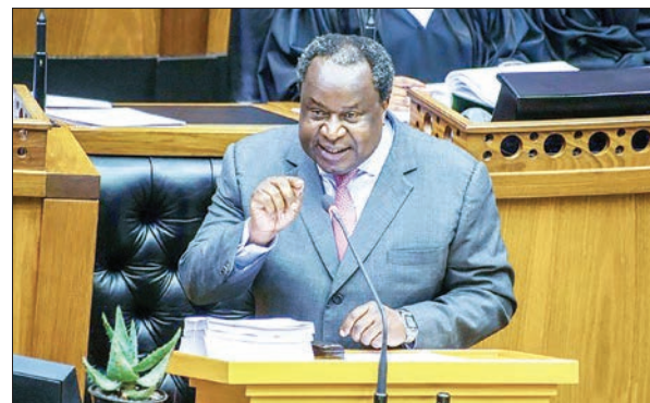
Finance Minister Tito Mboweni usually delivers his budget speech alongside a potted aloe vera plant, highly resistant to drought, to symbolise economic resilience.

Unemployment in South Africa soared to a