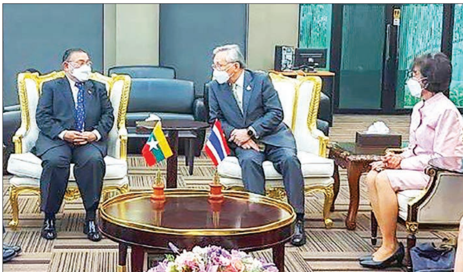
Union Minister U Wunna Maung Lwin holds talks with the Thai Deputy Prime Minister and Foreign Minister yesterday.