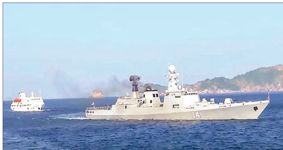
Navy vessels that carry Myanmar citizens from Malaysia, are crossing the international waters.