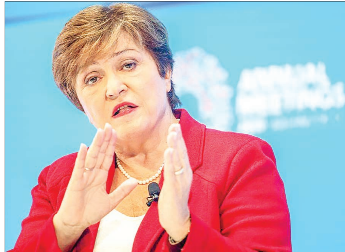
IMF Managing Director Kristalina Georgieva urged G20 officials to accelerate vaccine rollout to poor countries.