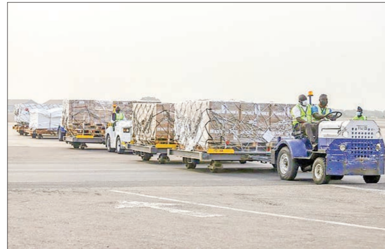
The Oxford/AstraZeneca vaccines were flown from India, where they are made under licence.

"A day to celebrate, but it's just the first step."