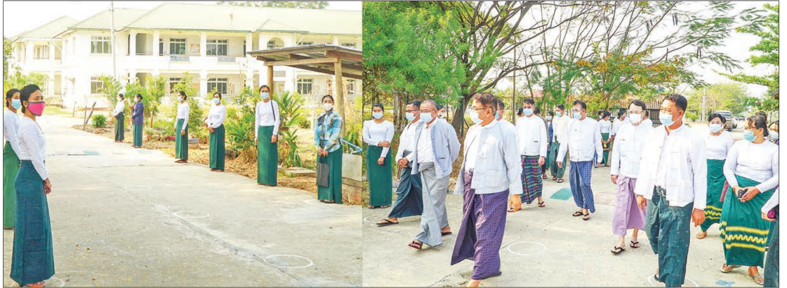
The MoE Union Minister, Deputy Ministers and officials inspect the preparations to reopen the schools in Nay Pyi Taw on 24 February 2021.

He also highlighted the preparedness of schools to reopen in accordance with the COVID-19 health rules, good image of the school, cleanliness of schools' surrounding, upgrade of class-