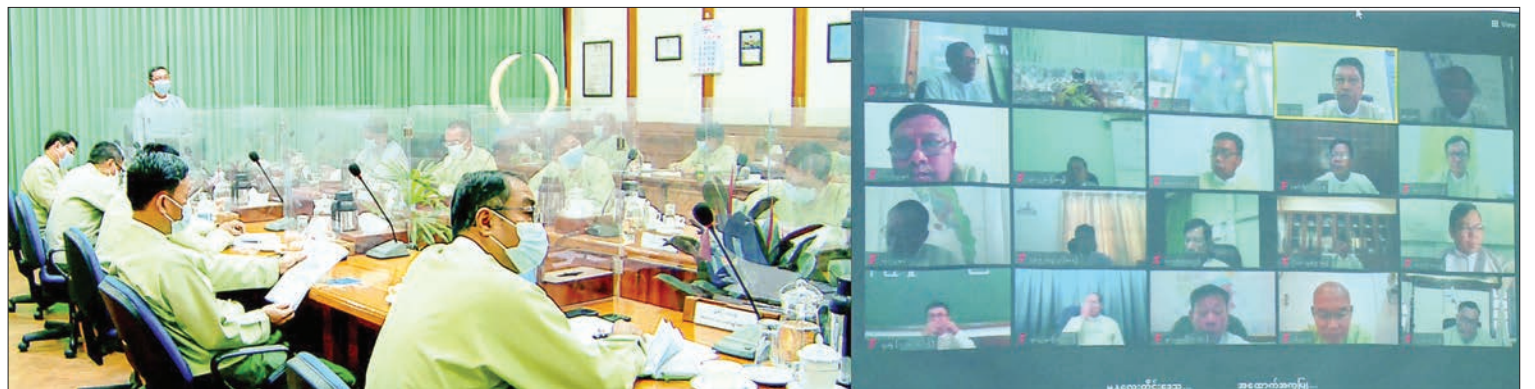
Union Minister U Khin Maung Yi joins the virtual coordination meeting with forest officers from states and regions on 24 February 2021.

Myanmar has adopted the Myanmar Reforestation and Rehabilitation Programme from 2017 to 2027 financial years; selection of land areas for forestation has been complete for 21,540 acres under the