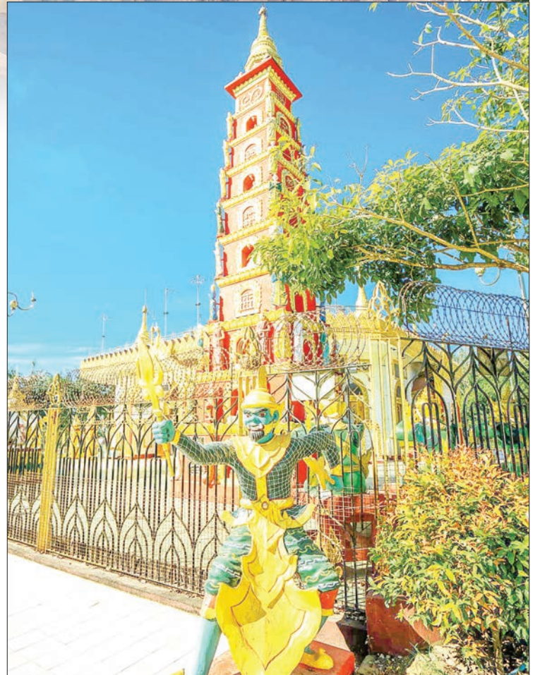
Aphoe Kyaung is a must whenever you arrive at Gyo Phyu reservoir

public, there are places to visit along the way to the reservoir.