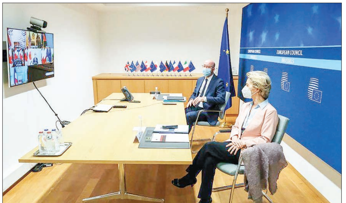
European Council President Charles Michel (L) and European Commission President Ursula von der Leyen are seen for a virtual meeting of the leaders of the Group of Seven in Brussels, Belgium, on Feb. 19, 2021. The European Union (EU) announced on Friday to double its contribution to COVAX, an international program devised to help low and middle-income countries to have more access to COVID-19 vaccines.

The push to bolster vaccine programmes in developing nations comes despite a slow start to the inoculation rollout across the EU that has left the bloc lagging behind countries like the United States, Britain and Israel. —AFP ■