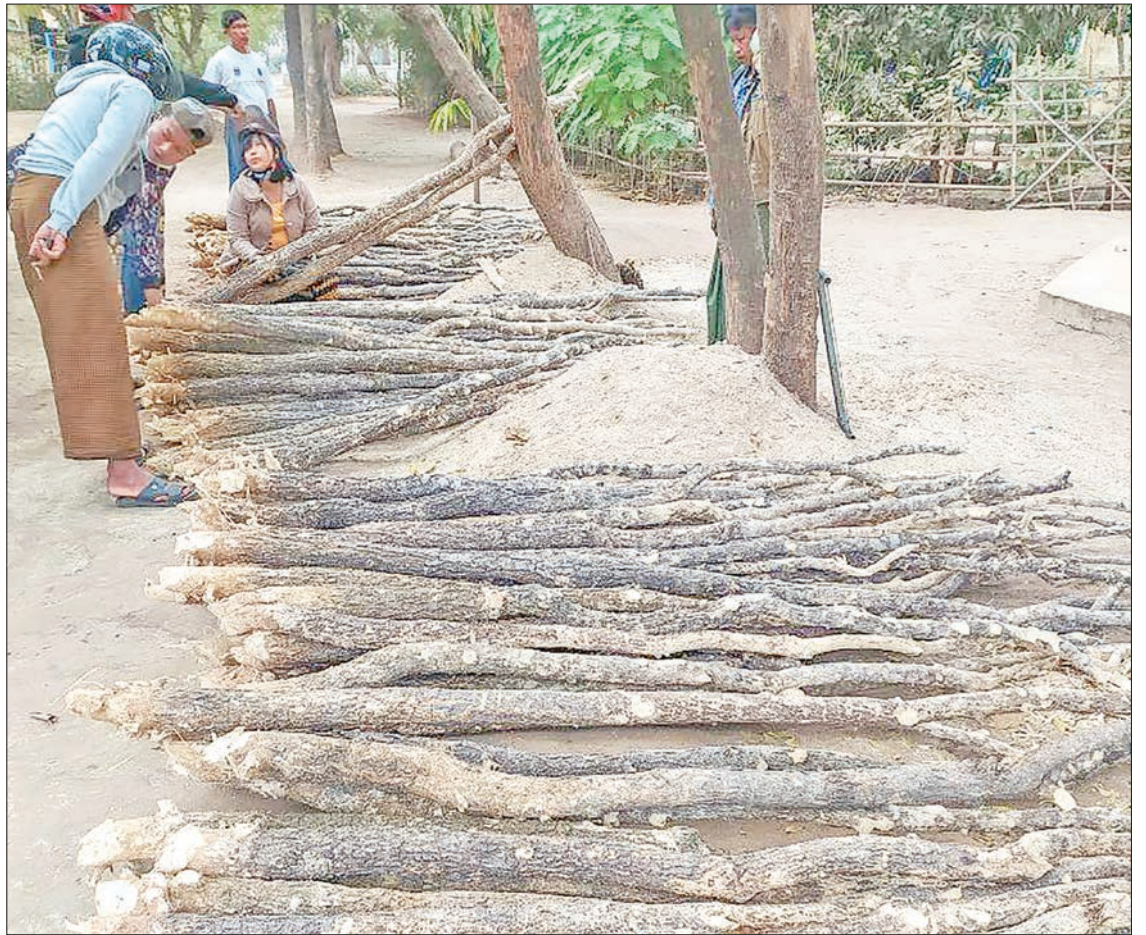
Customers evaluate the price of Thanaka at a roadside shop in Monywa.

Thanaka produced by Ayadaw Township is sent to wholesale depots in Pakokku, Yesagyo, Bago and Kyonpyaw towns. The demand from the Thanaka value chain is relatively low in the meantime. — Wati (IPRD)/GNLM