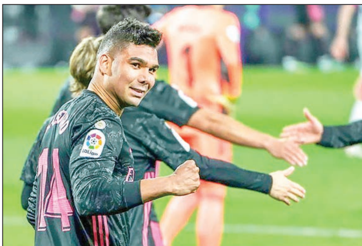
Casemiro scored the winner as Real Madrid beat Real Valladolid on Saturday.

Real Madrid cranked up the pressure again by edging to a win over struggling Real Valladolid, Casemiro's second-half header cutting the gap to just three points, albeit with Atletico still owning a game in hand. "It's not because Atletico lost. We believe we can win the league," said Casemiro. —AFP ■