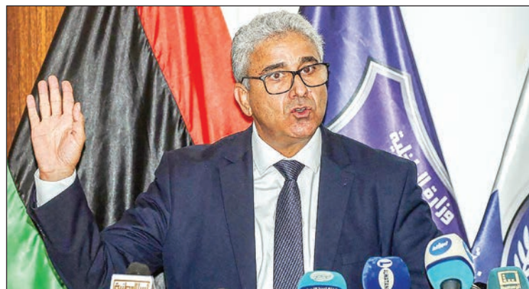
Fathi Bashagha.

The 58-year-old has served as interior minister in the North African country's UN-recognised