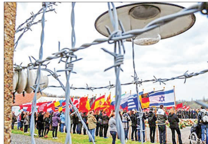
Survivors of the Buchenwald concentration camp, relatives and US veterans take part in celebrations marking the 67th anniversary of the liberation of the Buchenwald Nazi concentration camp outside Weimar, eastern Germany, 15 April, 2012.

THE United States on Saturday deported a 95-year-old former Nazi concentration camp guard to Germany, the Justice Department said.