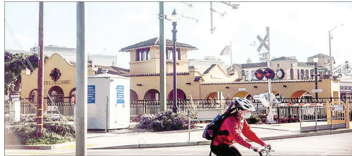
A citizen rides a bicycle near the railway station in Burlingame, California, the United States, Feb. 16, 2021.

sharply for five weeks, hospitalizations for four, and deaths for two, according to the tracking project.