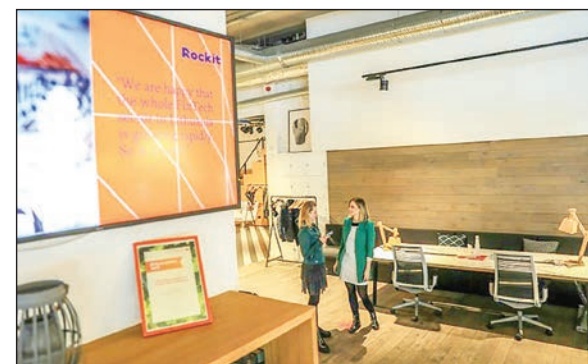
Invest Lithuania estimates that fintech employs more than 4,000 people in the country.

THANKS in part to Brexit, Lithuania is becoming a fintech hub as a growing number of UK-linked digital financial companies are getting licences there so they can continue to operate in the European Union.