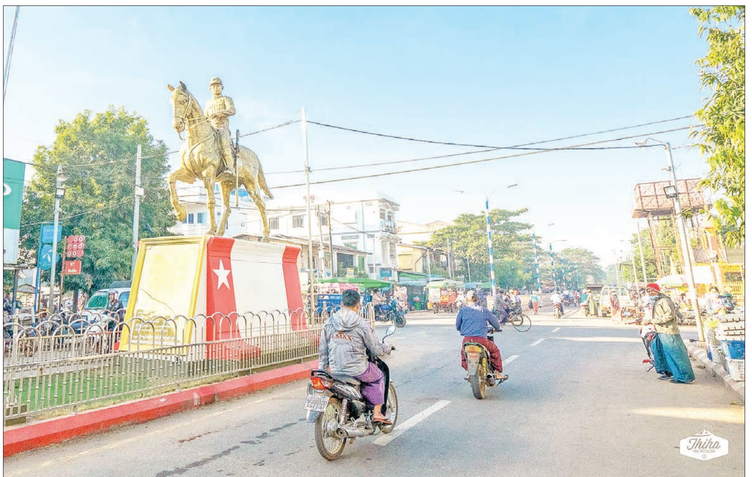
Taikkyi was recognized as a city on 29 December 1908. Therefore, it was 112 years on 29 December 2020.

ed between 1938 and 1939 and completed in 1940 to supply millions of gallons of water to Yangon daily. In fact, outsiders are not usually allowed to enter. It is said that security is tighter during the COVID-19 period. But for a variety of reasons, some can visit. Although it is not easily accessible to the