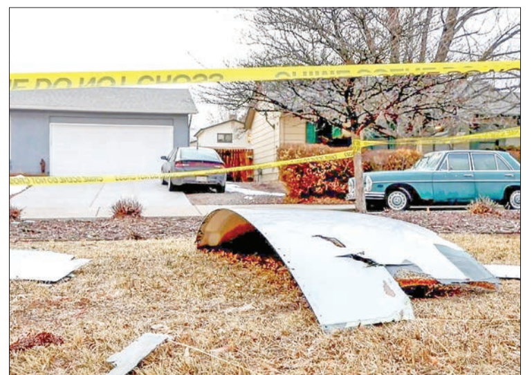
A United Airlines plane suffered a fiery engine failure Saturday shortly after taking off from Denver for Hawaii, dropping massive debris on a residential area before a safe emergency landing, officials said.

"Flight UA328 from Denver to Honolulu experienced an en-