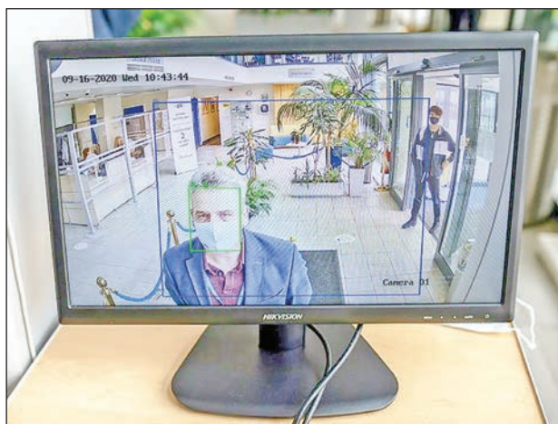
A member of staff at the University of Bolton in northern England has his body temperature checked by an automatic walk-through scanner to help to mitigate the spread of the novel coronavirus.

PEOPLE returning to work following the long pandemic will find an array of tech-infused gadgetry to improve workplace safety but which could pose risks for long-term personal and