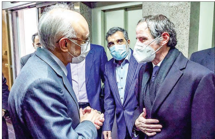
Head of the International Atomic Energy Agency Rafael Grossi, on the right, meets the chief of the Atomic Energy Organisation of Iran, Ali Akbar Salehi, in Tehran.

IRAN said Sunday it had held "fruitful discussions" with UN nuclear watchdog chief Rafael Grossi in Tehran, ahead of a deadline when it is set to restrict the agency's inspections unless the United States lifts painful sanctions.