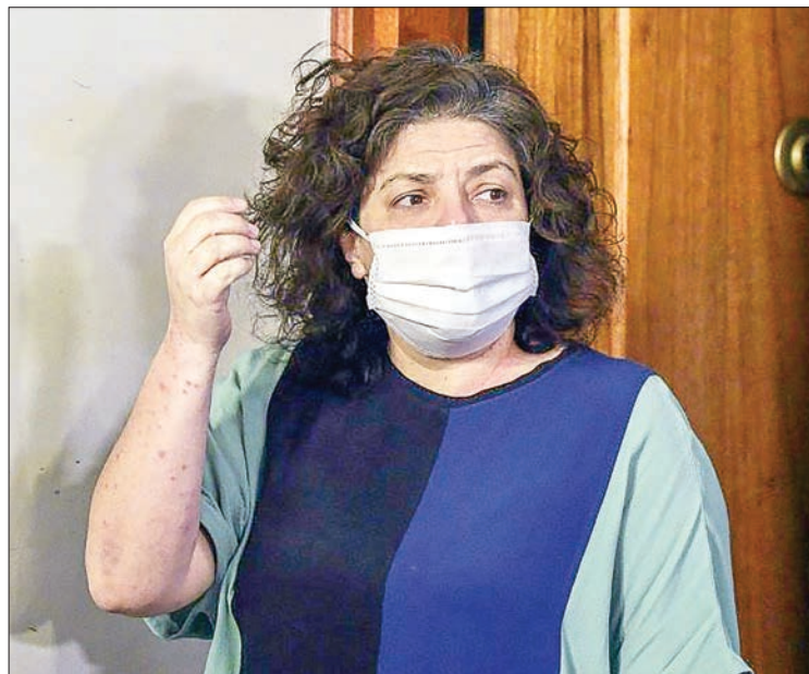
Carla Vizzotti, pictured in August 2020, has been sworn in as Argentina's new health minister.

The scandal broke after a 71-year-old journalist, Horacio Verbitsky, announced on the radio that, owing to his longstanding friendship with the minister, he had been able to get vacci-