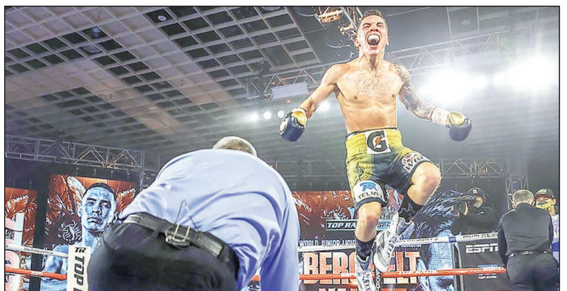
Mexico's Oscar Valdez captured the WBC 130-pound belt with a brutal 10 th round knockout of champion Miguel Berchelt in Las Vegas.

LAS VEGAS — Mexico's Oscar Valdez dethroned Miguel Berchelt on Saturday, knocking him out with one second left on the 10th round in a stunning upset, to claim the World Boxing Council junior lightweight title in Las Vegas.