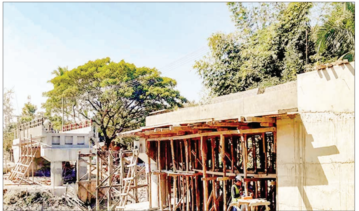
The reinforced concrete bridge seen under construction in Min Tha Taung village, Kyauktaw Township.

WITH a supervision of Border Areas and National Races Development Affairs Department of Ministry of Border Affairs, reinforced concrete bridge in Min Tha Taung village, Kyauktaw Township, Rakhine State is under construction, according to the department.