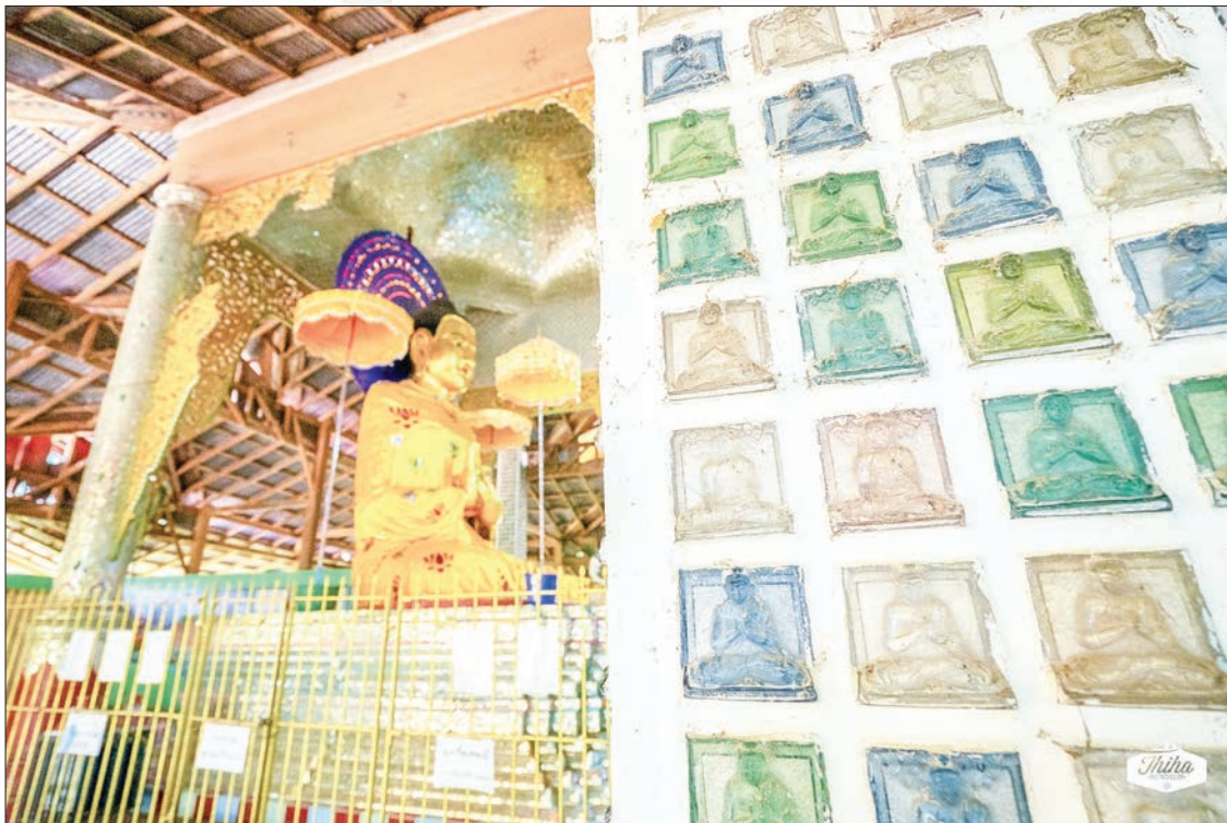
The poles at the pagoda are decorated with small colourful Buddha statues