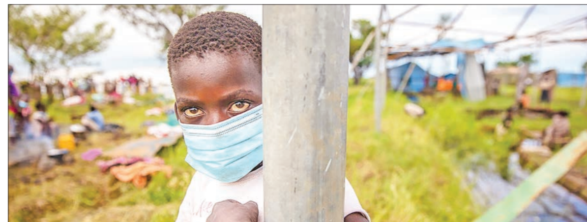
A young boy in Sofala Province, Mozambique. Families were temporarily rehoused at a relocation centre after their homes were destroyed by Cyclone Eloise in January.

The funding was also used to deploy some 191 Emergency Medical Teams, support sero-epidemiological studies in 58 countries, and provide online training