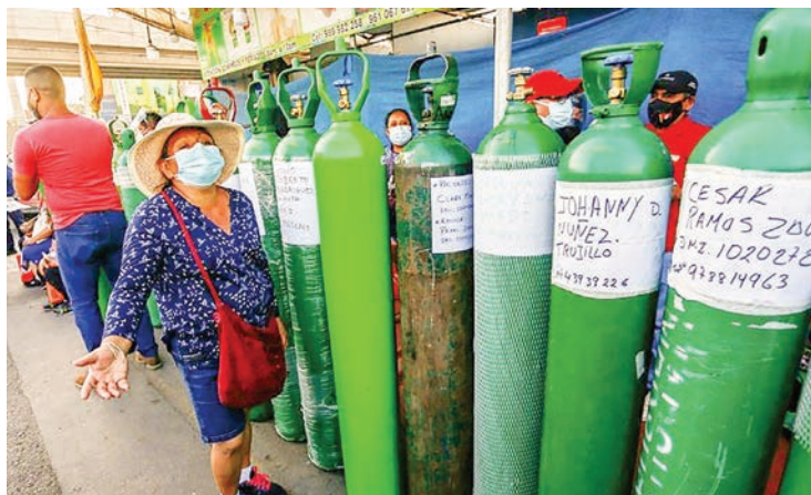
People wait in long lines to get medical oxygen in San Juan de Lurigancho, near Lima, Peru.