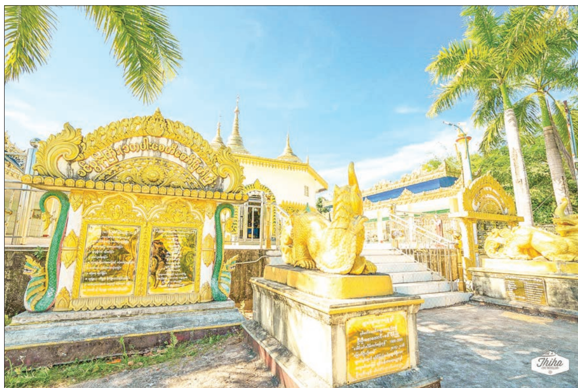
Khin Pon Kyi Sal Par pagoda

As soon as you enter the temple grounds and turn left,