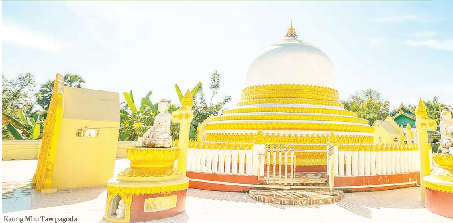
Kaung Mhu Taw pagoda

On Yangon-Pyay Road, you can also visit Min Kyaung on the left side of the road. Inside, you can still see an ancient monastery. You can see Aung Myay Bon San Htut Phone Thar Khaung Yan Myo Aung Pagoda and Shwe Thar Laung