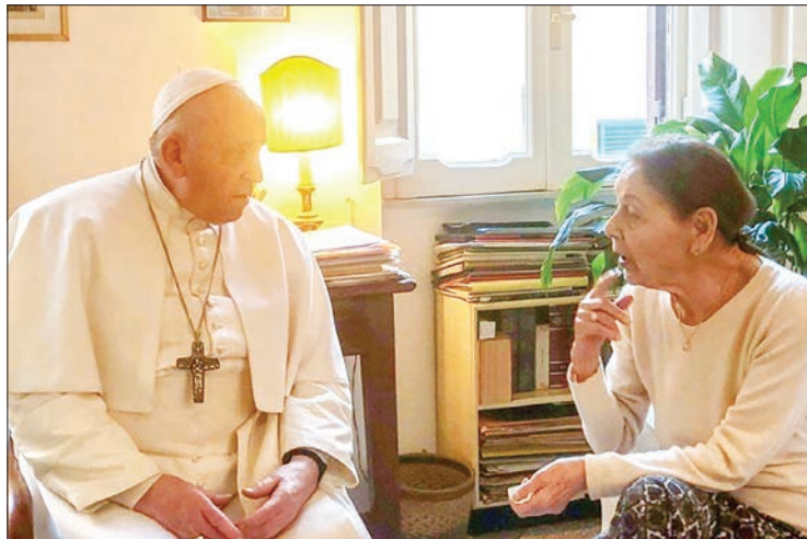
Pope Francis opened the Vatican archives to historians researching Pope Pius XII, long criticised for failing to speak out about the Holocaust that happened while he was pontiff.

THE World Jewish Congress (WJC) on Sunday hailed Pope Francis' "tremendous compassion" after he visited a Holocaust survivor in Rome, praising his "moral integrity and sense of history".