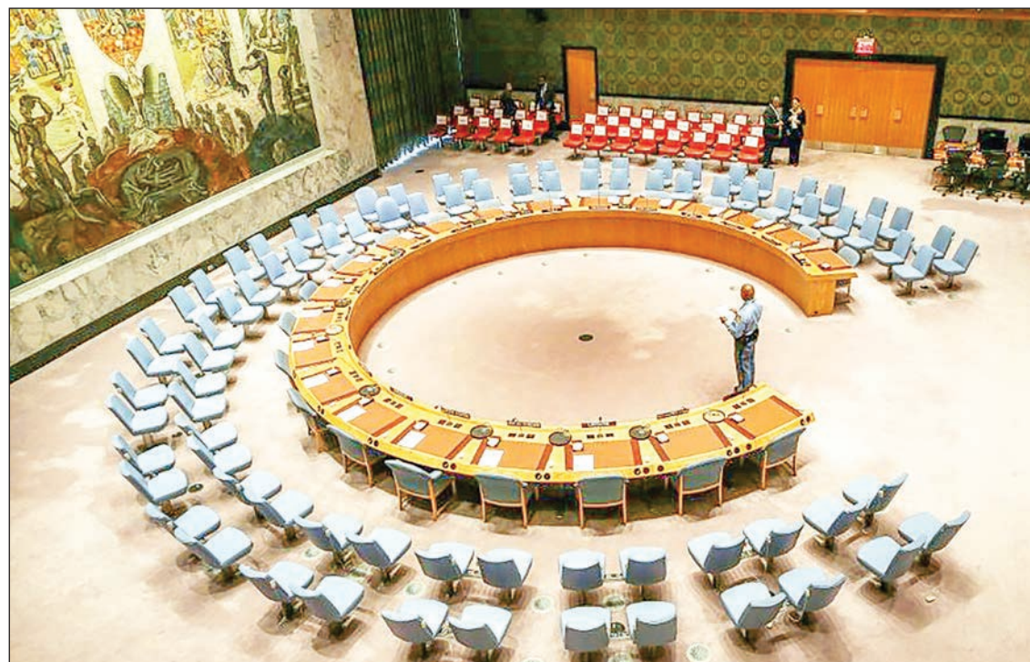
The chamber of the UN Security Council seen on September 20, 2017.

THE UN Security Council will hold a summit of world leaders Tuesday to debate climate change's implications for world peace, an issue on which its 15 members have divergent opinions.