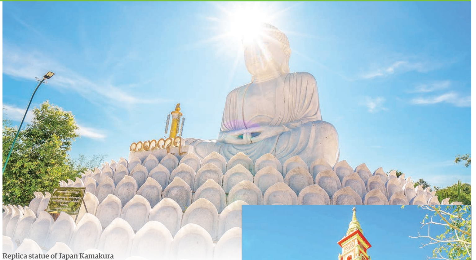
Replica statue of Japan Kamakura