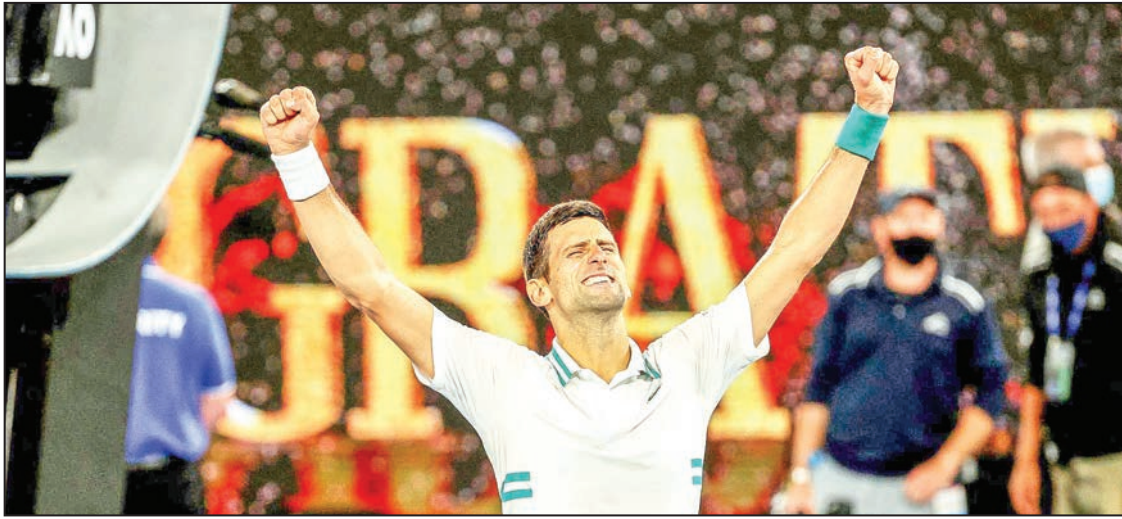
World number one Novak Djokovic beat Russia's Daniil Medvedev in straight sets to win his ninth Australian Open title and extend his record-breaking reign at Melbourne Park Sunday.

MELBOURNE — World number one Novak Djokovic beat Russia's Daniil Medvedev in straight sets to win his ninth Australian Open title and extend his record-breaking reign at Melbourne Park Sunday.