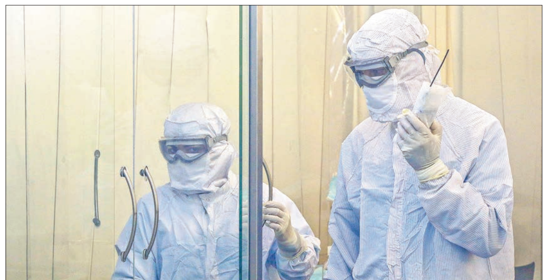
Employees using personal protective equipment (PPE) work during the production of vaccines against Covid-19 at the Osvaldo Cruz Foundation (FIOCRUZ), in Rio de Janeiro, Brazil, on 12 February, 2021. In this phase of the production, the first doses of the vaccine are being bottled and sent to the quality control department before being released for vaccination.

RIO DE JANEIRO — Rio de Janeiro will suspend its Covid-19 vaccination campaign until next week because the Brazilian city has run out of doses, Mayor Eduardo Paes said Monday.