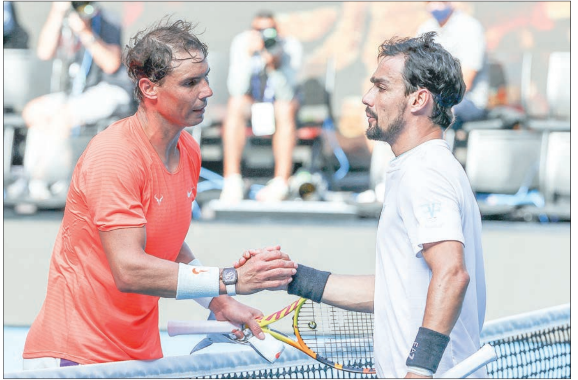
Spain's Rafael Nadal (L) shakes hands with Italy's Fabio Fognini after their men's singles match on day eight of the Australian Open tennis tournament in Melbourne on 15 February 2021.

As the action continued in front of empty stands, top-ranked