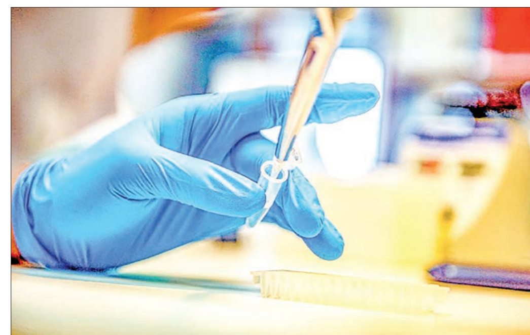
In this file photo taken on 27 June 2020 a scientist works at the Neurobiology laboratory of the Cayetano Heredia University in Lima.