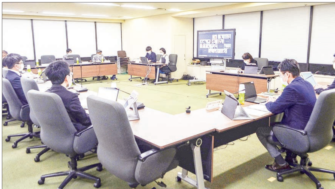
An experts' meeting is held at the health ministry in Tokyo on 15 February 2021.

TOKYO — Japan will survey the potential side effects caused by various coronavirus vaccines after a total of 3 million doses are administered to the general public, the health ministry said Monday.