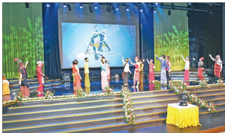
The MRTV staff members are presenting the performance to mark the MRTV 75 th Anniversary in Nay Pyi Taw on 15 February 2021.