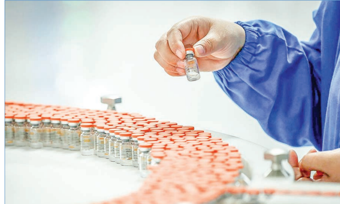
Some high-income countries have snapped up about 70 per cent of coronavirus vaccines that would be available in 2021, which, together with other issues such as production capacity, would largely threaten equal and timely global vaccine provisions, said a recent report on The Lancet.

The Global Times learned from Chinese vaccine producers that the production line of inactivated vaccines contains two