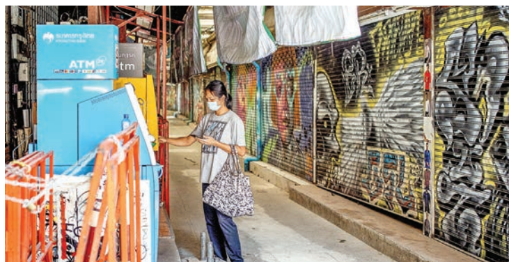
A woman withdraws money from an ATM on Khao San Road, a once popular tourist strip in Bangkok on 15 February, 2021, as Thailand records its worst economic performance in more than two decades.

BANGKOK -- Thailand's pandemic-shattered economy suffered its worst full-year performance in more than two decades, data showed Monday, with officials citing the toll of both a gutted tourism industry and ongoing political upheaval.