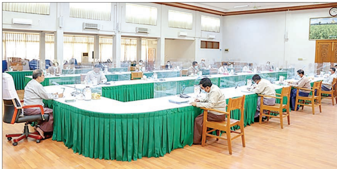
Union Minister U Tin Htut Oo meets the MoALI senior departmental officials on 15 February 2021.

UNION MINISTER for Agriculture, Livestock and Irrigation U Tin Htut Oo held a meeting with the senior officials of departments under his ministry on the future plans yesterday.