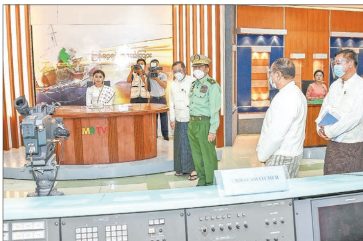
The Senior General looks around the MRTV Museum. The Union Minister and Deputy Ministers are launching the new channel.

The MRTV staff members presented the performance