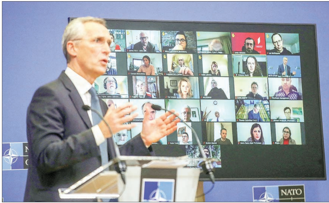
Journalists' appear on a screen during a press conference by NATO Secretary General Jens Stoltenberg ahead of a Nato defence minister council at the Alliance headquarters in Brussels, on 15 February, 2021. NATO defence minister will gather on a videoconference on February 17 and February 18 2021.

BRUSSELS — NATO Secretary General Jens Stoltenberg said Monday the alliance will not withdraw its troops from Afghanistan “before the time is right”, ahead of a discussion