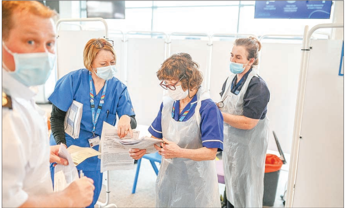
Healthcare professionals work at a Covid-19 vaccination centre set up at Chester Racecourse, in Chester, northwest England, on 15 February 2021.

Once enough people are inoculated, “it’s time for us to take a bold stride into life and start to recover our society and our hu-