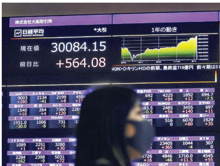
A financial data screen in Osaka shows the Nikkei Stock Average closing above the 30,000 mark for the first time in over 30 years on 15 February 2021.

GDP in the last quarter of 2020 grew a real 3.0 per cent, or