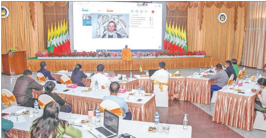
The virtual meeting of the Trade Policy Review Body is in progress on 15 February 2021.

The meeting discussed progress in implementing provisions, rules and pledges made in the trade agreements to inform other member countries about foreign trade poli-