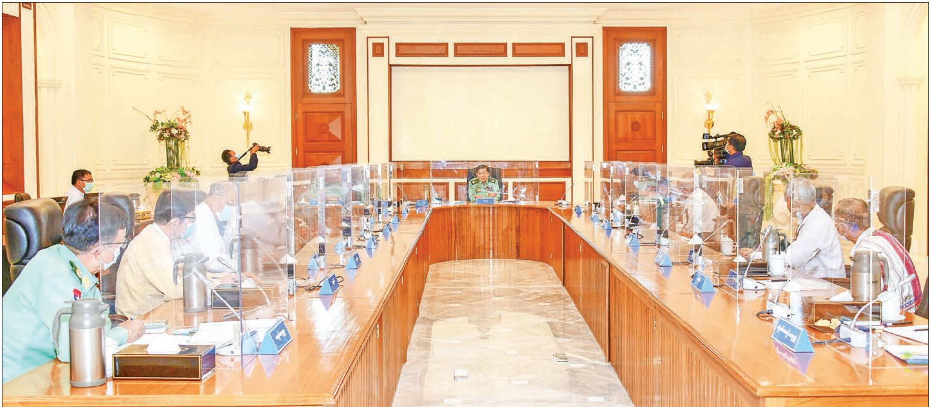
Chairman of the State Administration Council Senior General Min Aung Hlaing presides over the coordination meeting of the State Administration Council in Nay Pyi Taw on 15 February 2021.

Commander-in-Chief of Defence Services Senior General Min Aung Hlaing presided over the coordination meeting of the State Administration Council yesterday morning.