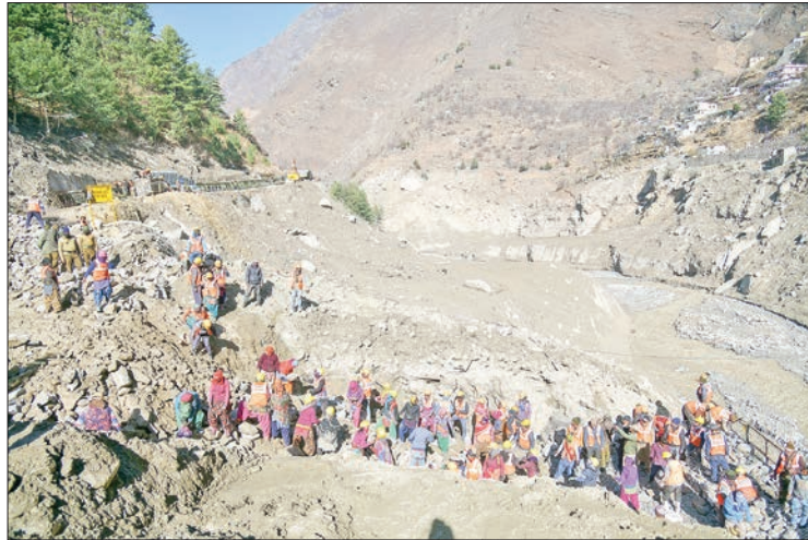
Border Roads Organisation (BRO) workers rebuild the destroyed Raini bridge in Chamoli district on 13 February, 2021 after Raini bridge was washed away by a flash flood thought to have been caused when a glacier burst on 7 February.

The flood is believed to have been triggered by a chunk of gla-