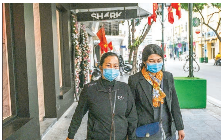
Women wearing protective face masks to prevent the spread of Covid-19 walk along a street in Hanoi on 29 January 2021.

Gatherings of more than two people will be banned, while schools, bars, restaurants and