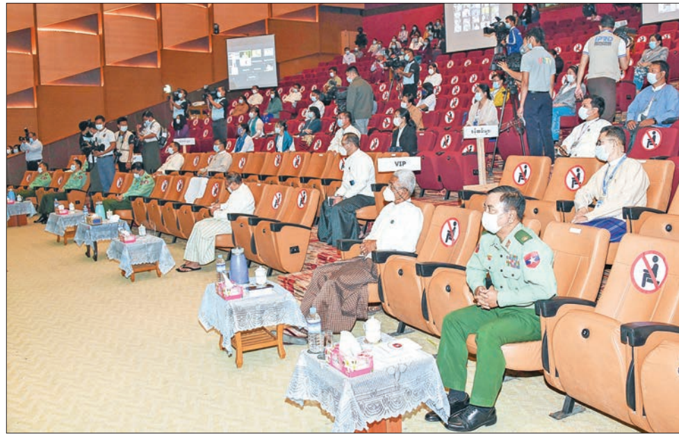
State Administration Council Chairman Senior General Min Aung Hlaing spoke on the occasion of the MRTV 75 th Anniversary, and the dignitaries, officials and staff are seen present at the event yesterday.

COMMANDER-IN-CHIEF of Defence Service and Chairman of the State Administration Council Senior General Min Aung Hlaing attended the celebration of the 75th anniversary of Myanmar Radio and Television yesterday.