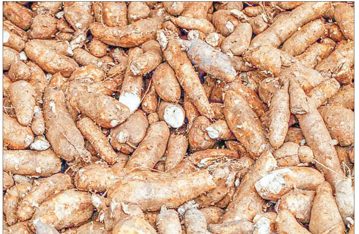
Myanmar's agriculture department issued Agro Digit News stated that Myanmar has the favourable land resource to grow tapioca.

Tapioca can be used in food products, medicines, feedstuff and biofuel. It can receive foreign income from exports. The exports of tapioca starch