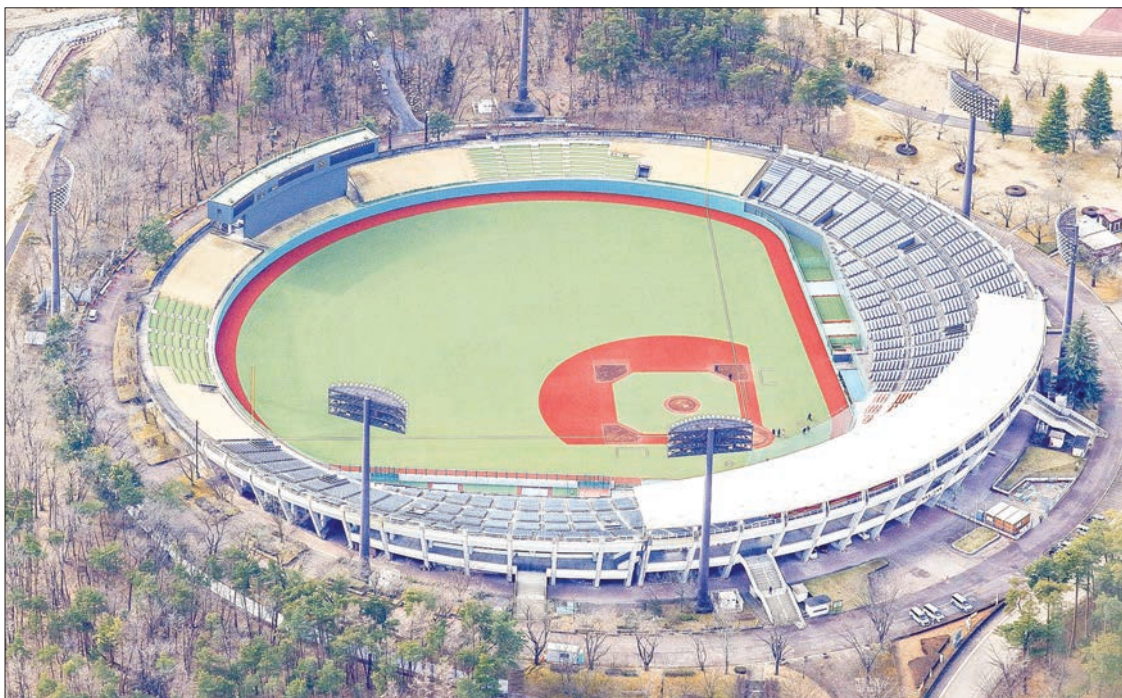
Photo taken 20 January 2020, shows an aerial view of Azuma Stadium in Fukushima, which will host baseball and softball during the Tokyo Olympics.

The torch relay is to commence on March 25 and the committee said it would check on the status of the relay route "as preparations go forward in cooperation with local executive committees." —Kyodo News ■