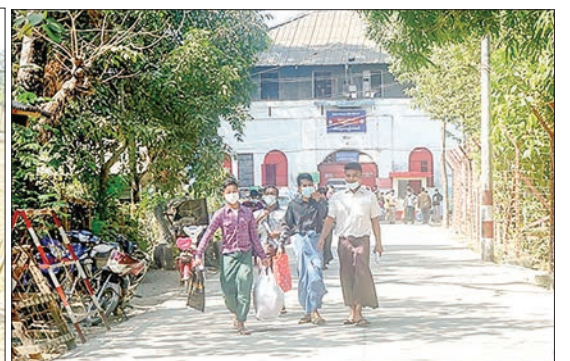
A total of 249 inmates— 218 males and 31 females—, including 1 foreigner were released from Sittway prison on 12 February 2021.

WHILE the Republic of the Union of Myanmar is establishing a new democratic State with peace, development and disciplines, to maintain friendly relations with other countries and to create the humanitarian and compassionate grounds, the State Administration Council,