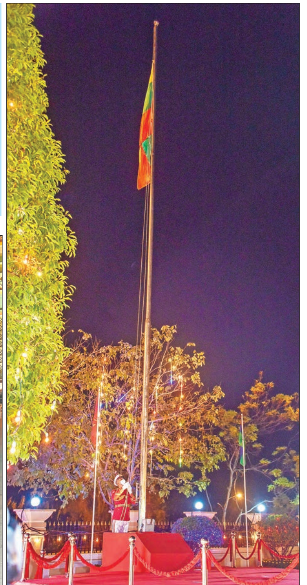
The 74th Anniversary Union Day Celebrations are seen in progress in Nay Pyi Taw on 12 February 2021.