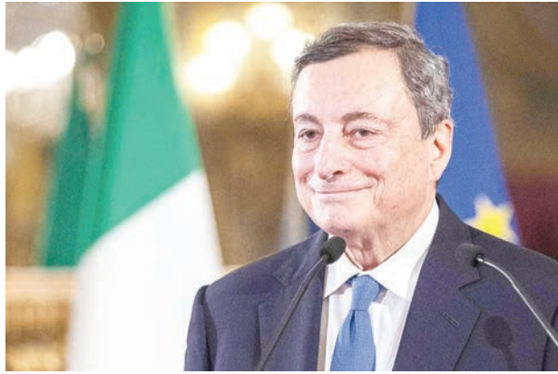
Draghi has spent the last nine days assembling a government of national unity.

Draghi has spent the last nine days assembling a government of national unity to manage the deadly pandemic that hit Italy almost exactly one year