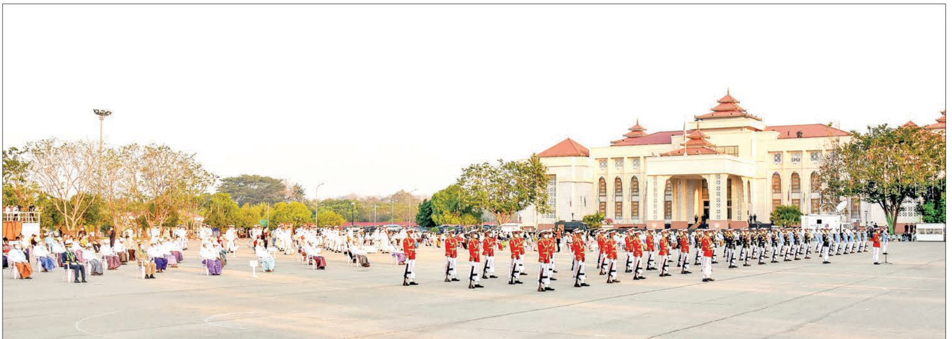
The 74 th Anniversary Union Day Celebrations are seen in progress in Nay Pyi Taw on 12 February 2021.