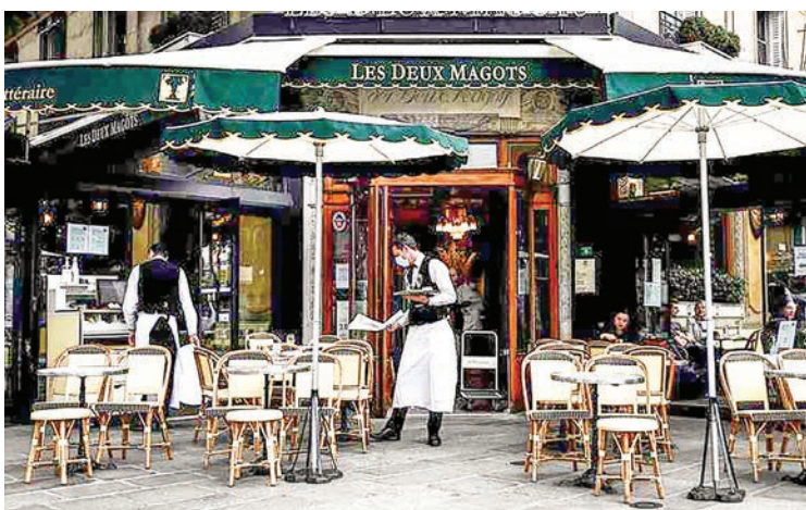
Until the Covid-19 pandemic struck, triggering the closure of restaurants and cafes, a communal midday meal of several courses, perhaps with some wine, was still a feature in the professional life of millions. PHOTO: AFP/FILE

"In other cultures, it's a bit more everyone-for-themselves, but in France it's a moment to eat together, to take time out as a group, among colleagues," said Romain Passelande, who co-founded the Les Petites Tables website devoted to affordable lunching in Paris.—AFP