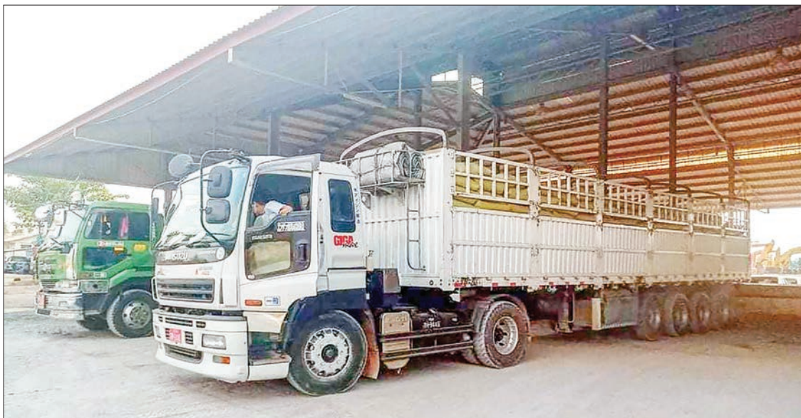
The country mainly sends the corn to the neighbouring countries like China, Laos and Thailand. Corn is also shipped to Singapore, Malaysia and Viet Nam through sea trade.

The country produces 2.5-3 million tonnes of corn annually. —NN/GNLM