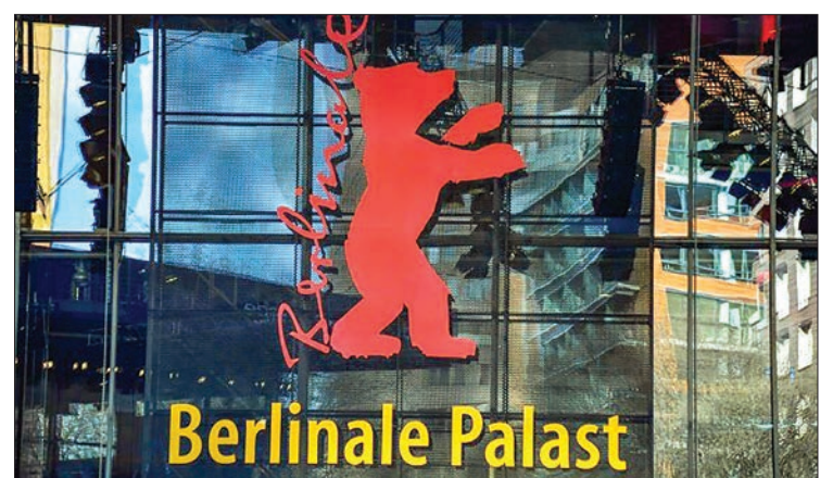
The Berlinale, now in its 71 st edition, is the first major European cinema showcase of the year and ranks with Cannes and Venice among the continent's top film festivals.

In contrast, the UK allows second doses of the vaccine to be delayed up to 12 weeks after the initial jab has been administered. Sahin continued, "I wouldn't delay that further. As a scientist I believe that it is not good to go longer than six weeks."—AFP ■