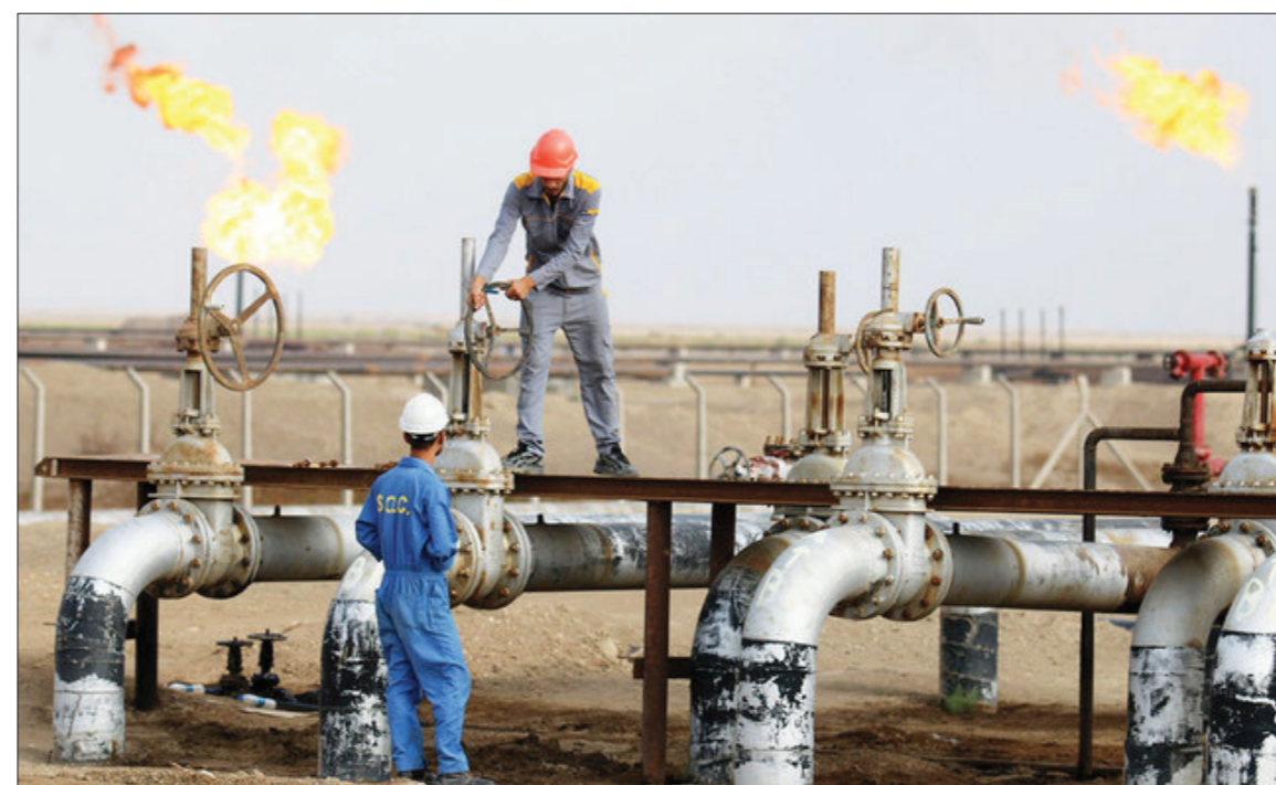
Iraqi laborers work at an oil refinery in the southern town Nassiriya.

"Renewed lockdowns, stringent mobility restrictions and a rather slow vaccine rollout in