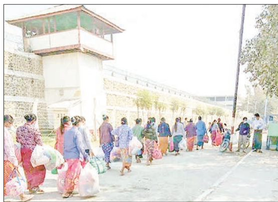
925 male citizen inmates, 5 male foreign inmates, totally 930, and 215 female citizen inmates and 2 female foreign inmates, totally 217, were released from Central Prison (Mandalay) on 12 February 2021.