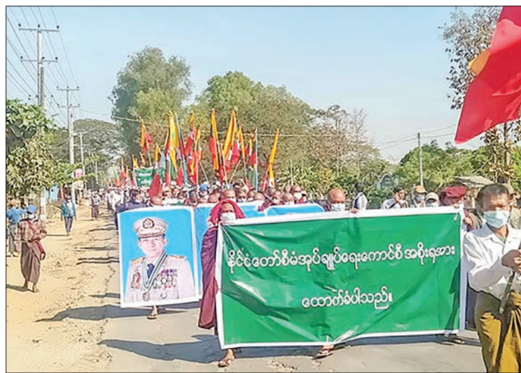
Demonstrations supporting the Tatmadaw are seen in various townships.