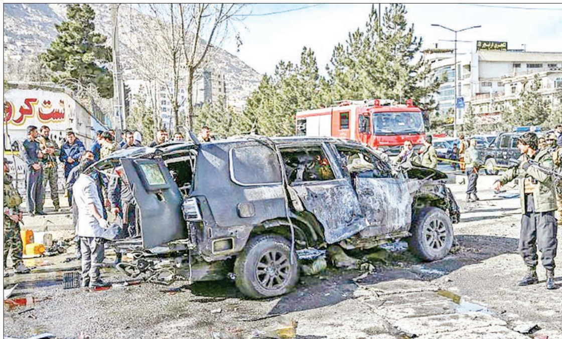
Scarcely a day goes by without a bomb blast, attack on government forces, or targeted assassination somewhere in Afghanistan.

very, very high... which is shocking and deeply disappointing," a senior US State Department official told AFP this week on condition of anonymity.— AFP ■