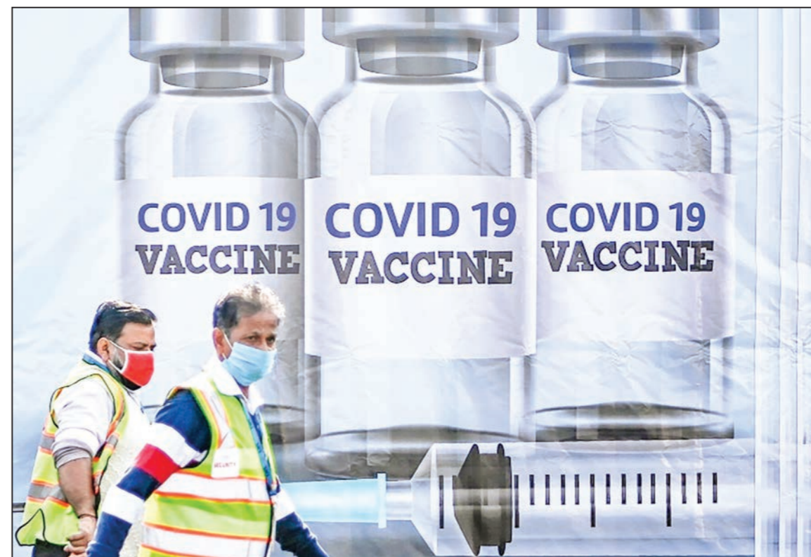
As the world's largest vaccine producer, India is set to be at the forefront of supplying affordable shots against COVID-19 to low- and middle-income countries.

those in the ICU. So, we do know that has happened in patients who are very sick, but also in patients who were not managed inside the hospital...they have had complications and they have had persistent symptoms or new symptoms...or symptoms that waxed and waned, that came and went after their acute illness." To promote a better understanding of post-COVID sickness and support patient care and public health interventions, the WHO has called on clinicians and patients to report data on symptoms to the Organization's Clinical Platform. The case report form - which is available in multiple languages - has been designed to report standardized clinical data from individuals after they have left hospital or after recovering from acute illness. "What we don't know is why it's happening, so what is the pathophysiology... of this condition...the researchers are really working hard to get to