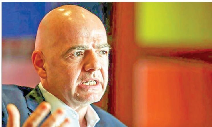
FIFA chief Gianni Infantino gestures during an interview in the Qatari capital Doha.

FIFA president Gianni Infantino said for the first time Thursday coronavirus containment measures could still be in place during the 2022 World Cup in Qatar but he insisted stadiums would be full.