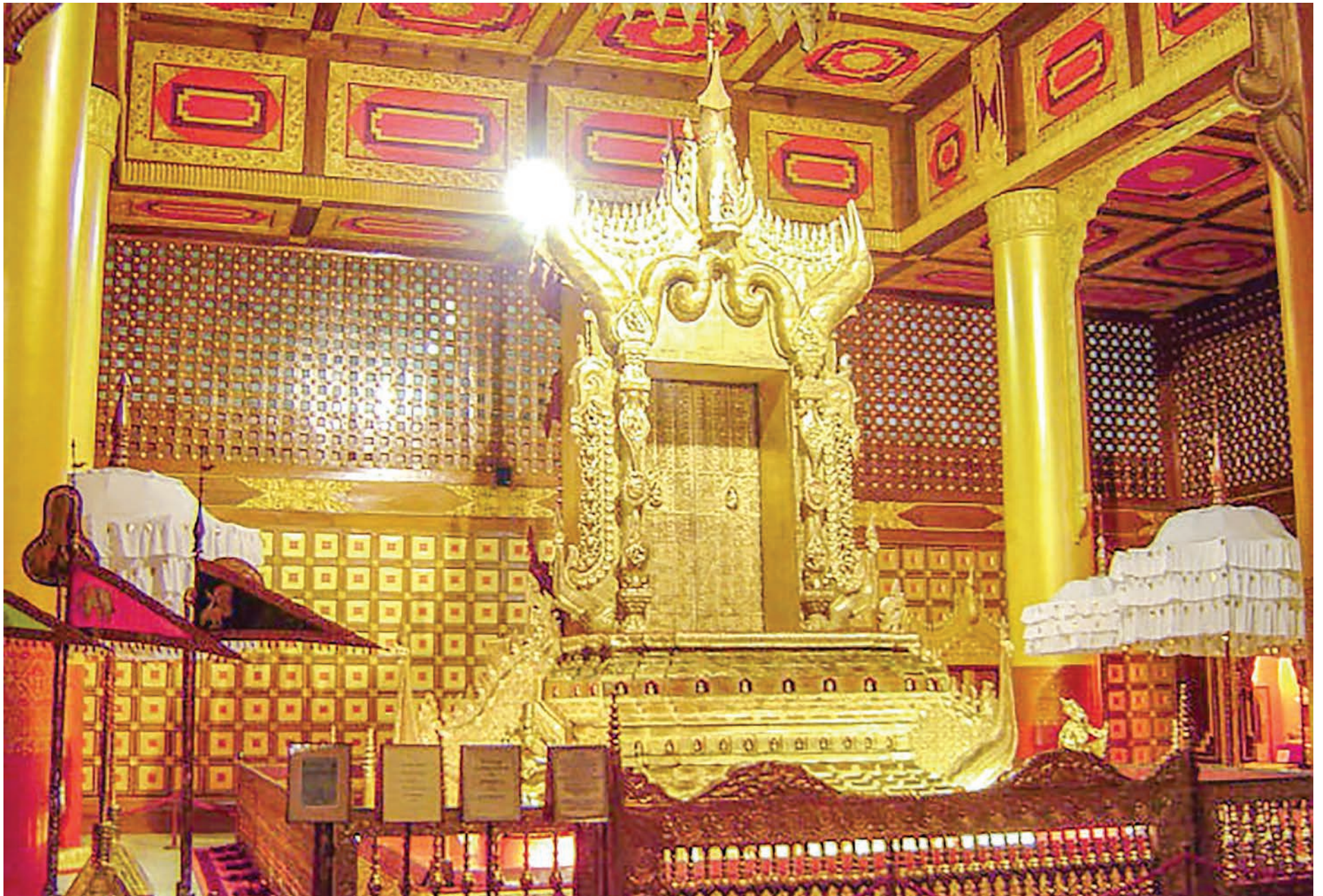
Thiha Thana throne.