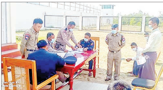
A total of 52 male and female inmates were released from the jail in Nay Pyi Taw on 12 February 2021.