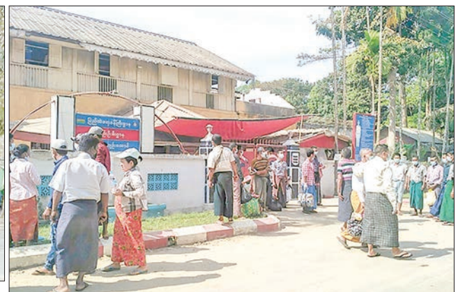
A total of 91 inmates— 84 males and 7 females— were released from Maubin prison on 12 February 2021.