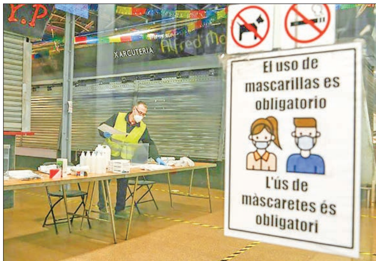
Pandemic conditions could cause large numbers of Catalans to shun polling stations.

And in a highly-controversial move, people with the virus as well as those in quarantine will have the right to cast their ballots in person in the last hour before voting closes at 1900 GMT in the wealthy northeastern region, home to 7.8 million people.