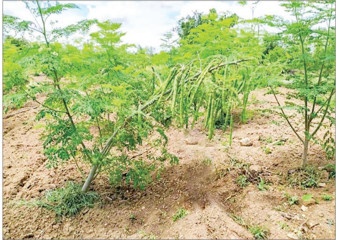
The farmers from Thanbyar Chaung village, Yesagyo township are selling the drumsticks for K2,500 per viss if they are India species and K500 for smaller pieces.

The drumsticks can bear fruits three times per year. Each time, we cut the leaves and branches of the drumstick trees and dry them all. After that, we are selling them in the market. Most of the villagers are growing the drumstick on a commercial