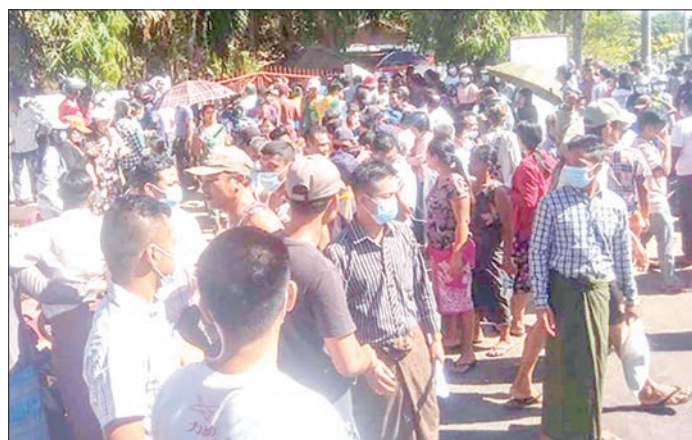
A total of 128 inmates— 119 males and 9 females— were released from Dawei prison on 12 February 2021.