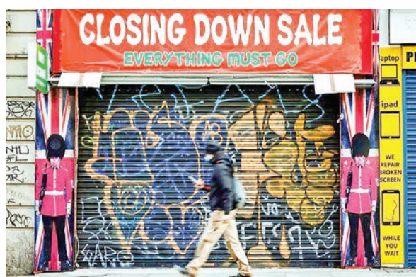
Covid-19 wreaked havoc on the British economy last year, putting thousands out of work and forcing the government to spend billions to offset a record downturn. PHOTO: AFP

But Axi's strategist Stephen Innes said: "With vaccination rollouts on turbo boost and the current lockdown abatement doing what it is supposed to do by taming the virus spread, there is a solid chance that reported Covid-19 cases could shift close to zero in the second quarter."—AFP