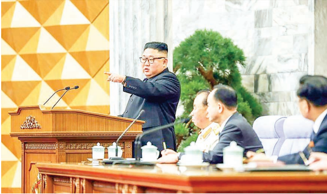
Kim Jong Un was quoted Friday as slamming officials for their lack of "innovative viewpoint and clear tactics" at a top ruling party meeting.

NORTH KOREAN leader Kim Jong Un has accused top officials of "self-protection and defeatism" and largely blamed them for the country's economic plight, state media reported Friday.