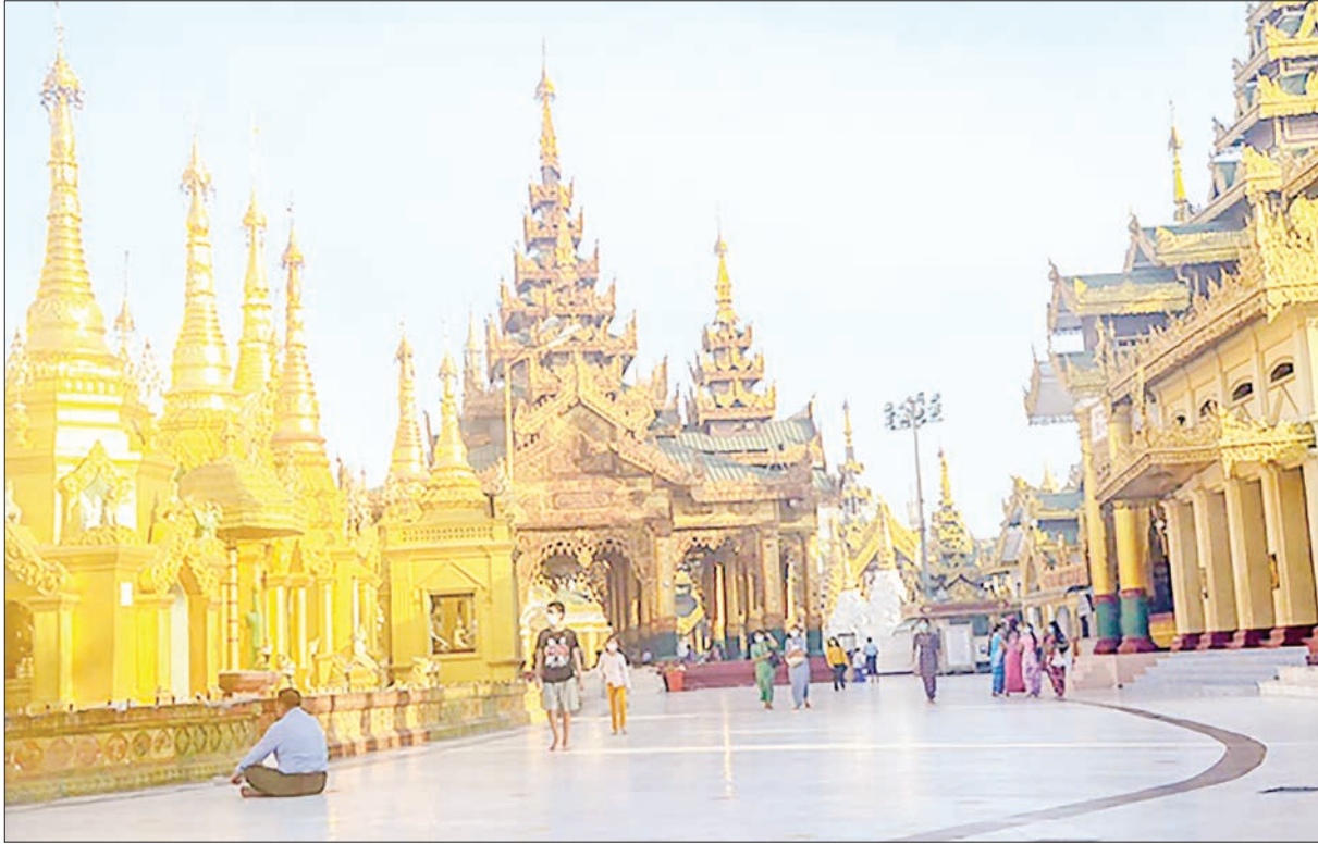
Pilgrims in Yangon.