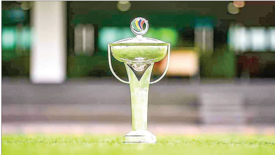
A total of 40 football clubs will compete in this year's AFC Championship.

If Shan United can get through the first round, they