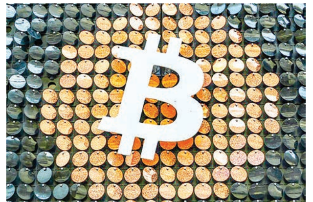
Bitcoin continues to break records as it creeps towards $50,000 but observers have warned about its volatility.

With most of Asia closed for the Lunar New Year holiday, business was limited. Tokyo and Wellington were all in the red, while Sydney was also hit by news of snap lockdown in Melbourne.