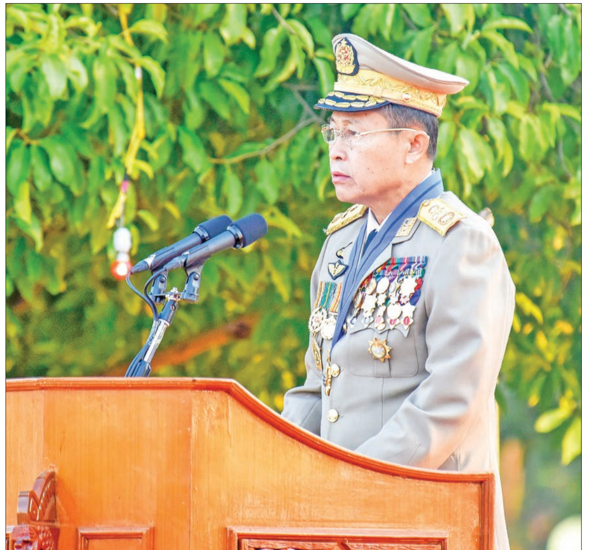
Vice-Senior General Soe Win reads the Union Day message from State Administration Council Chairman Senior General Min Aung Hlaing in Nay Pyi Taw on 12 February 2021.

The ceremonies were also attended by Union Ministers, Union Attorney-General, Auditor-General of the Union, Nay Pyi Taw Council Chairman, senior Tatmadaw officers, judges of Supreme Court of the Union, Commander of Nay Pyi Taw Command, deputy ministers, members of Union Civil Service Board, members of Myanmar National Human Rights Commission, members of Anti-Corruption Commission, Nay Pyi Taw Council members, departmental heads, ministerial staff, ethnic cultural troupes, and representatives of ethnic groups.— MNA/GNLM