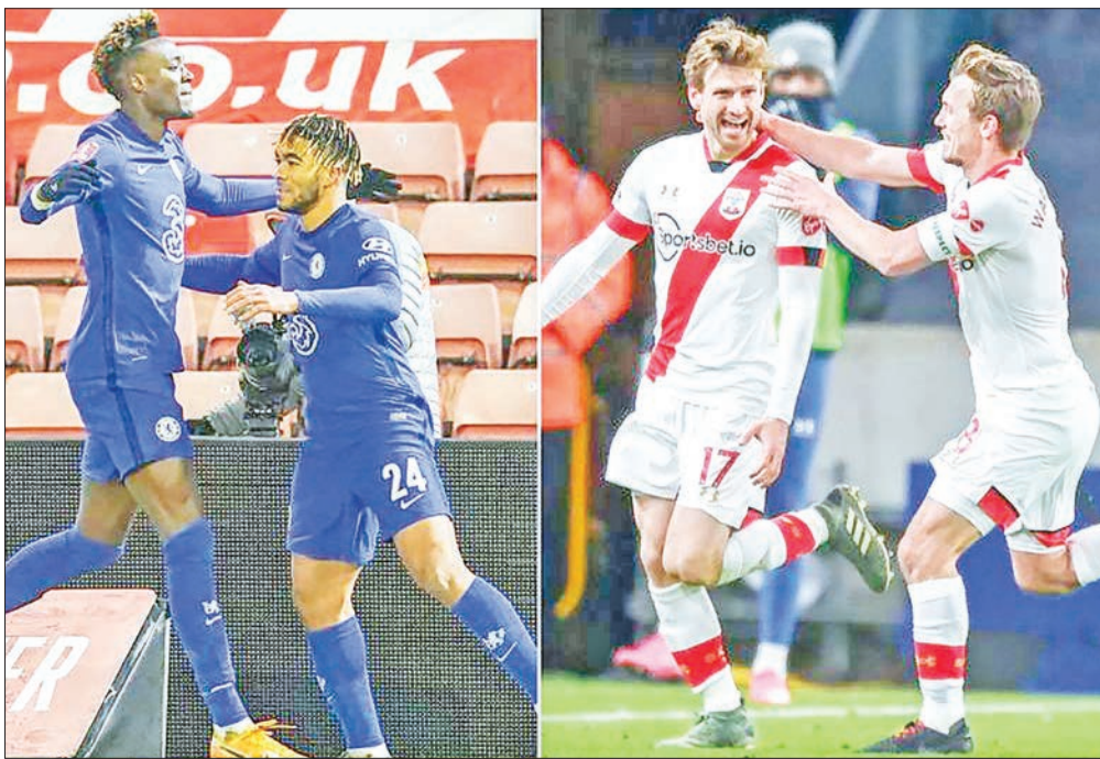
Chelsea clinched a 1-0 win at Barnsley while Southampton saw off Wolves 2-0.

LONDON — Chelsea's impressive start to Thomas Tuchel's reign continued with a 1-0 win at Barnsley to move into the FA Cup quarter-finals on Thursday. Tuchel has won four and drawn one of his five games in charge since replacing the sacked Frank Lampard, but the Blues were lucky to escape after a lacklustre first-half display at Oakwell against the Championship side. "Not enough courage and it was too deep for a long, long time," said Tuchel. "We clearly can play better, so yes I expected more but not in terms that I am frustrated.