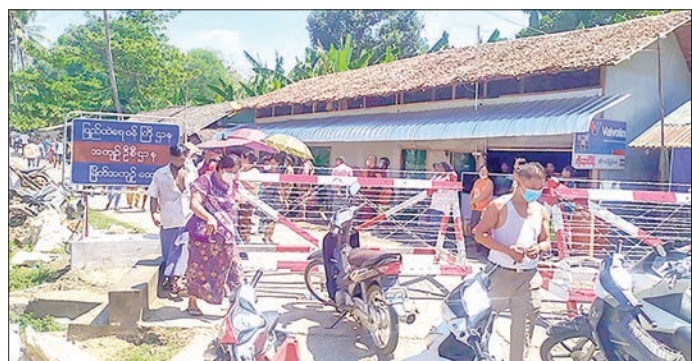
413 prisoners-- 341 males and 72 females-- from Myeik prison, and 189 inmates from Kyaukphyutaung labour camps under the Correction Department, totally 602 persons, were released from prison on 12 February 2021.