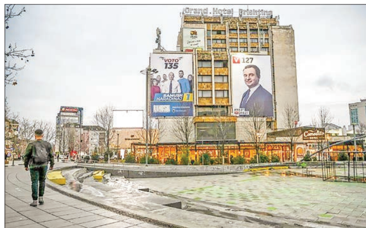
Kosovo holds snap elections Sunday in which a new generation of politicians are vying against the old guard's hold on power.

A court in The Hague has also removed several top former guerrilla leaders from the scene -- including ex-president Hashim Thaci -- after arresting them last year on war crimes charges linked to the 1998-99 conflict. If they were once feted as independence heroes, Kosovo's political elite have now become the face of the social and economic ills plaguing the population of 1.8 million, where