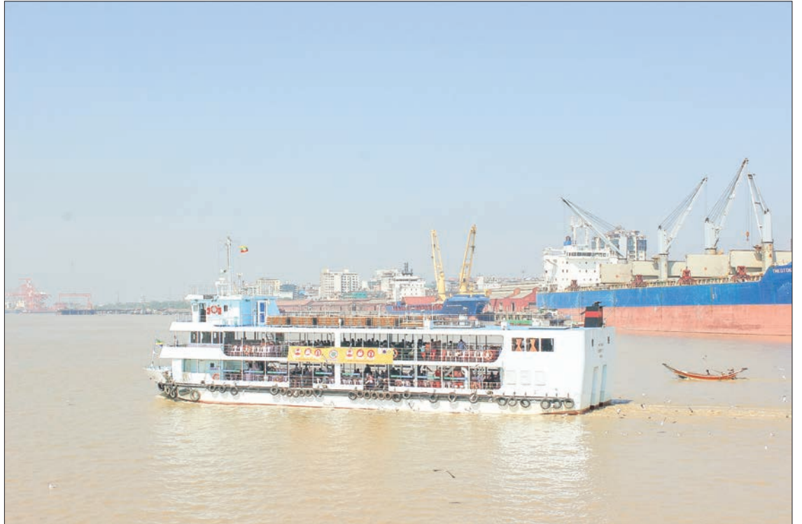
Pansodan-Dala ferry "Cherry" is seen in the Yangon River.

The number of commuters aboard the Pansodan-Dala water ferries is sharply dropping. There were about 12,362 passengers on 1 February, 9,190 passengers on 2 February, 8,578 passengers on 3 February, 9,026 passengers on 4 February, 9,117 passengers on 5 February, 5,253 passengers on 6 February, 5,517 passengers on 7 February and 8,902 passengers on 8 February, according to the Yangon Pansodan-Dala ferry ticket station.