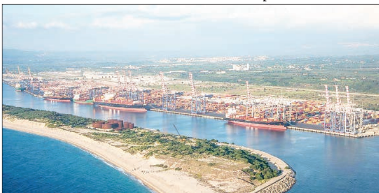
The port of Gioia Tauro. Police used scanners to detect the drugs. PHOTO: AFP

The 'Ndrangheta, which is based in the southern region of Calabria but whose tentacles reach internationally, is now considered Italy's most powerful organized crime group by anti-mafia prosecutors.—AFP