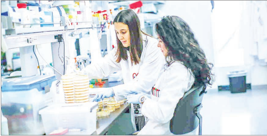
Researchers work in a lab that is developing testing for the COVID-19 coronavirus at the Hackensack Meridian Health Centre on 28 February, 2020 in Nutley, New Jersey.

THE World Health Organization called Tuesday for greater research, recognition and rehabilitation for Long Covid sufferers as it brought experts together to share insights into the little-understood condition.