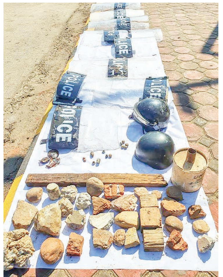
Pieces of brick and stone used by the protestors during the riots and police materials are seen.