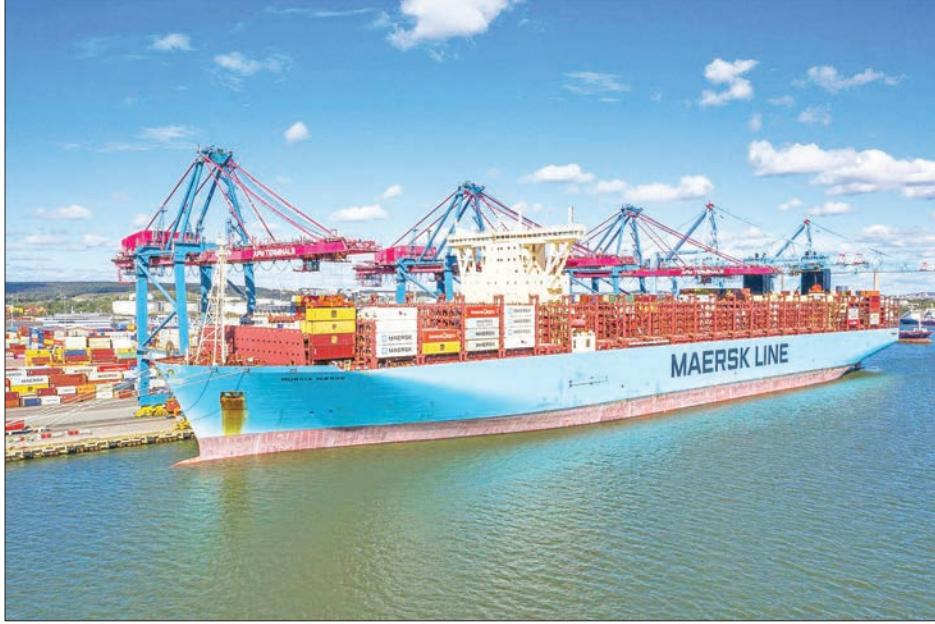
The company operates in 130 countries and employs 80,000 people worldwide.

DANISH shipping giant AP Moller-Maersk on Wednesday posted a near six-fold increase in net profit for 2020, as demand during the coronavirus pandemic rebounded strongly from an initial slump, sending freight rates soaring.