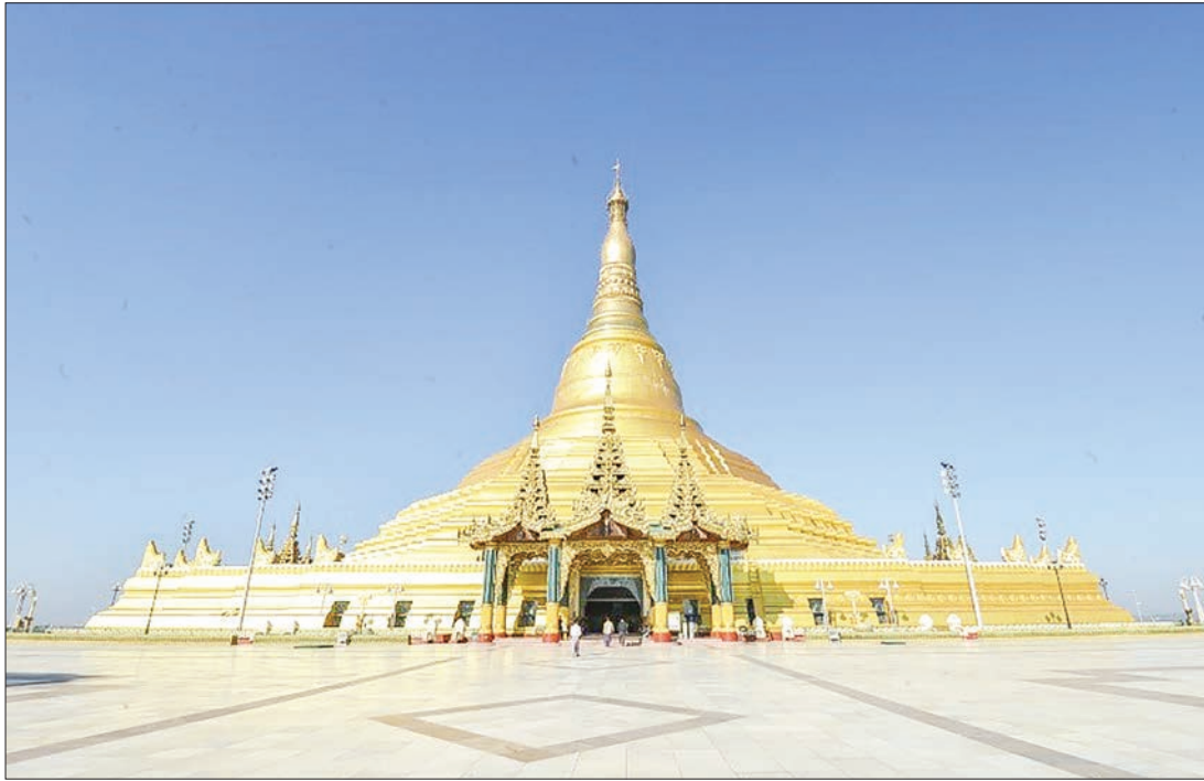
The Uppatasanti Pagoda in Nay Pyi Taw.

FAMOUS pagodas across the nation have reopened to public starting 8 February under the COVID-19 rules.