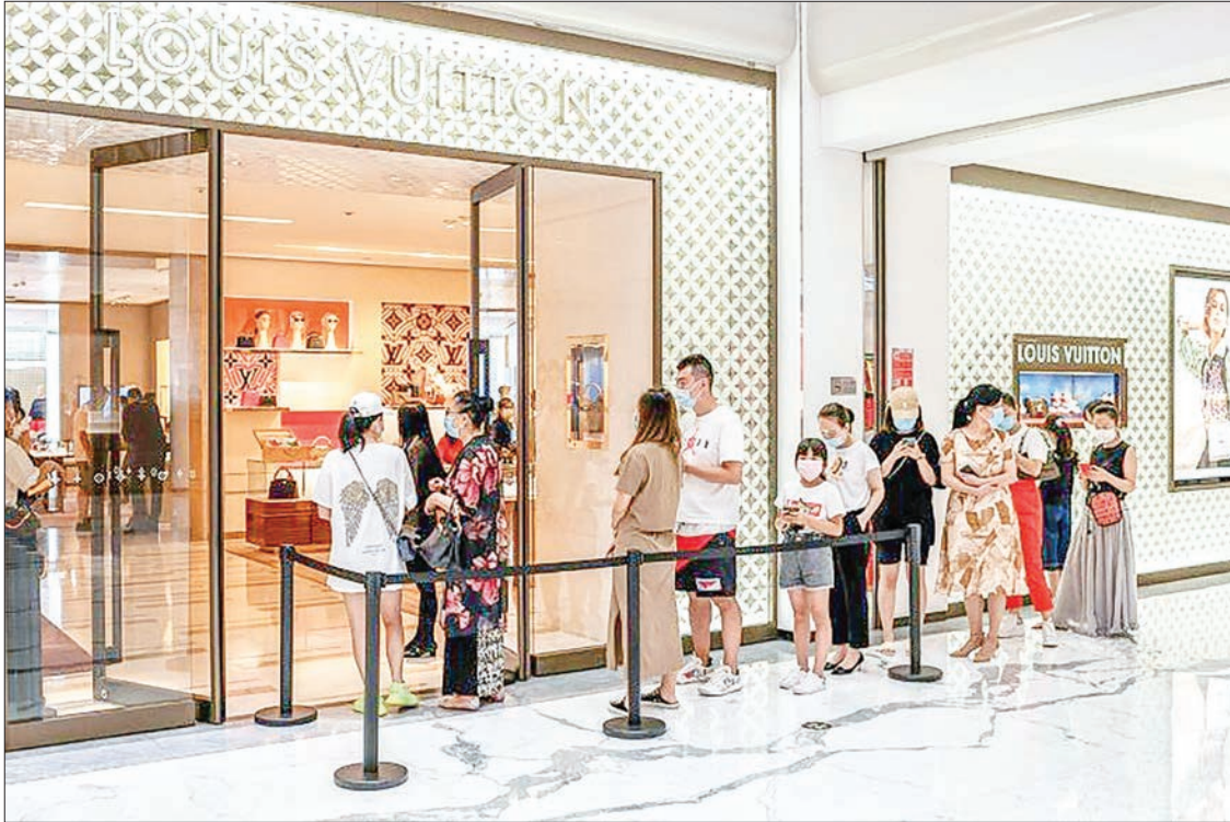
Consumer prices in China fell in January after a brief improvement at the end of last year.

FACTORY prices rose in China for the first time in a year last month as the country's vast industrial sector leads a recovery from the virus pandemic, with analysts hailing the data as a turning point for the world's number two economy.