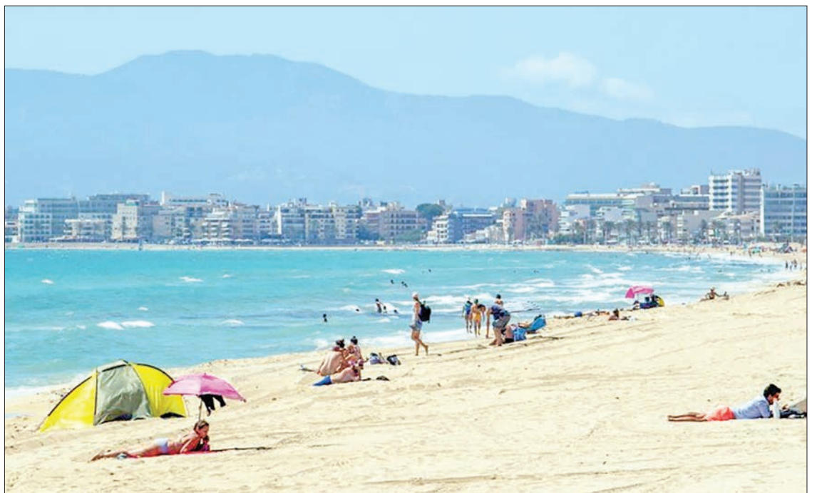
Spain's Mallorca island is a popular destination for digital nomads.