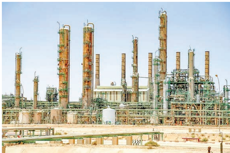
Big oil reserves were first discovered in 1959 in Libya when it was still among the world’s poorest nations. PHOTO: AFP/FILE

After the last upsurge in fighting from 2019-2020, and amid the Covid pandemic, the already struggling economy plummeted by 66.7 per cent last year, initial IMF estimates show.— AFP