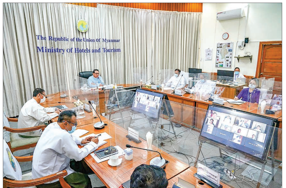
Union Minister U Maung Maung Ohn presides over the online meeting with the Myanmar Tourism Federation and its 11 associated organizations in Nay Pyi Taw on 10 February 2021.

The chairmen and the secretaries attended the online meeting discussed plans for short-term tourism development, the support and interest-free loans by the State to the low-income organizations and staff, the reopening of restaurants in accordance with the rules and regulations issued by the Ministry of Health and Sports, the funding requirements of the federation, holding jewelry exhibition, the negotiation with the bank for loan application and tax payment and work implementation by