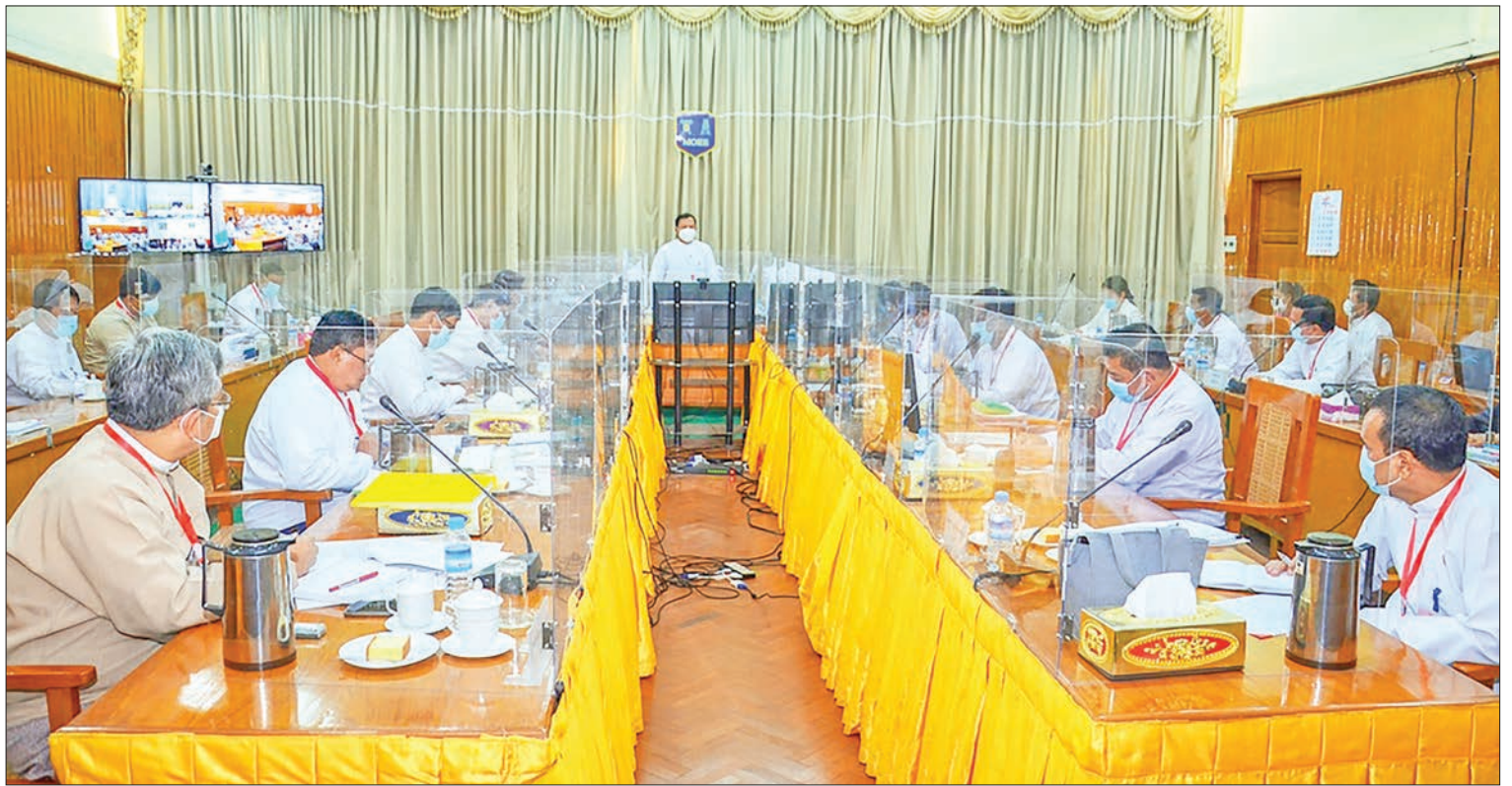
Union Minister U Aung Than Oo chairs the coordination meeting over the ongoing works of the Ministry of Electricity and Energy in Nay Pyi Taw on 10 February 2021.

The Union Minister also coordinated the discussions of officials before concluding the meeting.—MNA