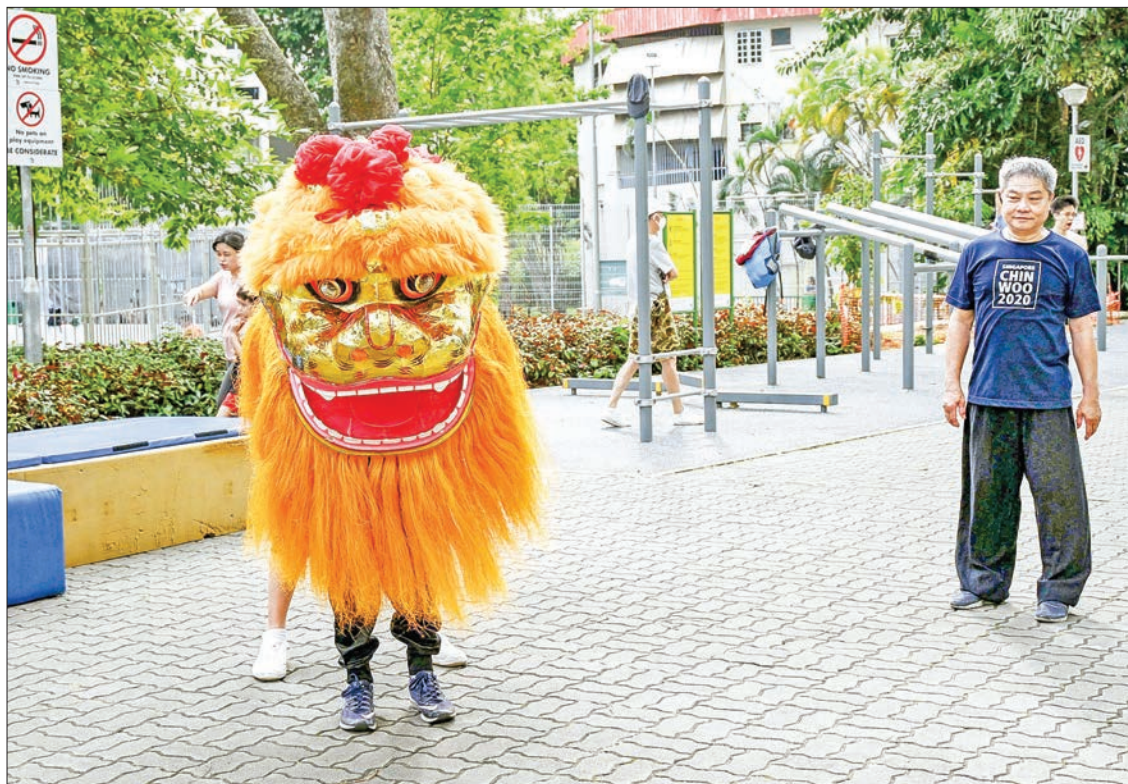
Members of the Singapore Chin Woo (Athletic) Association practise lion dance in a park in Singapore on Jan. 24, 2021.

Restaurants cannot have more than eight diners occupying a table and intermingling between tables is forbidden, with restaurants ordered by the authorities to make sure that large groups of people from different households do not gather at the same restaurant, occupying more than one table and mingling with each other.—Kyodo