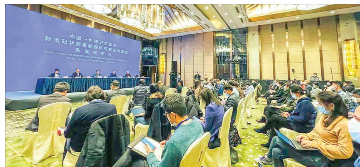
World Health Organization scientists speak at a press conference in Wuhan, China.

"So, there is the potential to continue to follow this lead and further look at the supply chain and animals that were supplied to the markets in frozen and other processed and semi-processed form, or raw