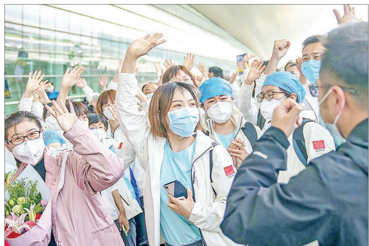
Medics from north China's Tianjin Municipality wave goodbye before their departure in Wuhan, central China's Hubei Province, March 17, 2020.

that (reservoir), it might take some time... but it will be out there without a doubt," he told