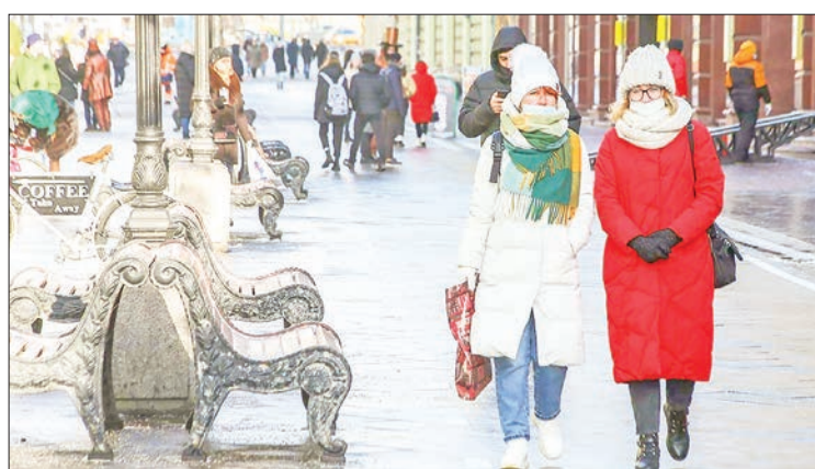
Russia officially surpassed four million coronavirus infections Wednesday, days after the country dramatically revised upwards its fatality rate, cementing its place as one of the world's worst-hit nations.

Russia has frequently come under fire for downplaying the impact of the pandemic and only counting fatalities where coronavirus was found to be the