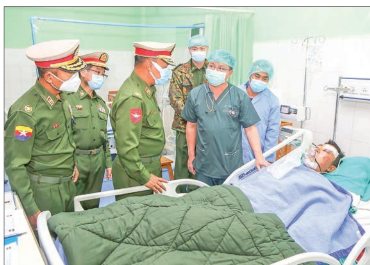
Relevant regional commanders are seen comforting the injured police member in PyinOoLwin on 9 February.

tourism development, and he said he would coordinate with the relevant ministries for the presentation.— MNA / GNLM