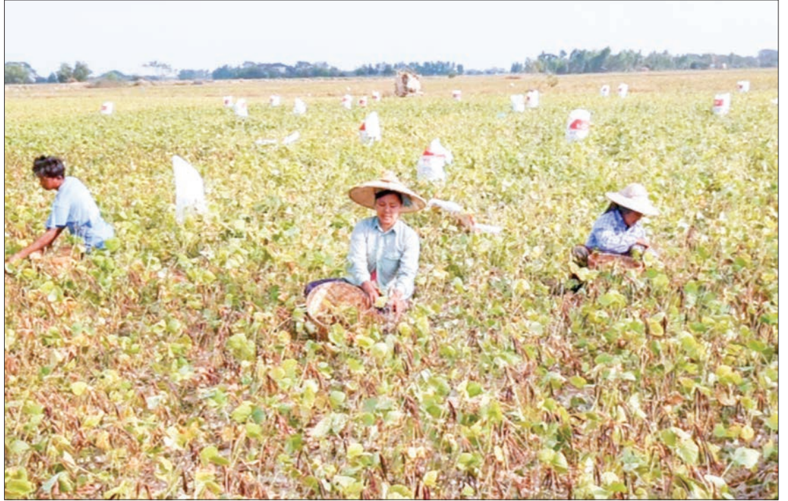
The green grams are also grown on about 323 acres of land in Bagan Htaung village and about 109 acres in Bawt Thabyay Kan village under Good Agricultural Practices (GAP) system.

The green grams are started to harvest in the first week of February. An acre of green gram yields nearly 16 baskets. The harvested beans are priced K 46,000 for 20 visses. The green grams are selling well this year than last year, according to the local bean growers.— The Khaing (Thanlyin)/GNLM