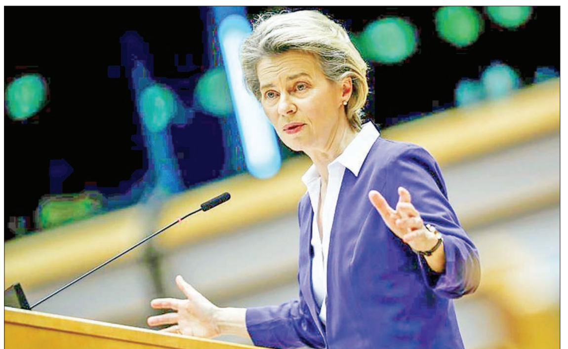
Europe's race to manufacture Covid-19 vaccines must accelerate to catch up to scientific breakthroughs and outpace emerging variants, European Commission chief Ursula von der Leyen said on Wednesday.

"Industry must adapt to the pace of science," she said, noting that vaccines can contain as many as 400 ingredients and manufacturing involve as many as 100 companies. A vaccine production task force under internal market commissioner Thierry Breton was charged with that mission, she said.