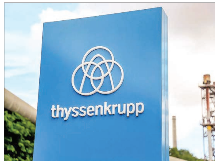
Troubled German industrial giant Thyssenkrupp said Wednesday it narrowed losses in the first quarter, buoyed by a "recovery" in demand for steel and car parts after the initial hit from the pandemic.

TROUBLED German industrial giant Thyssenkrupp said Wednesday it narrowed losses in the first quarter, buoyed by a "recovery" in demand for steel and car parts after the initial hit from the pandemic.