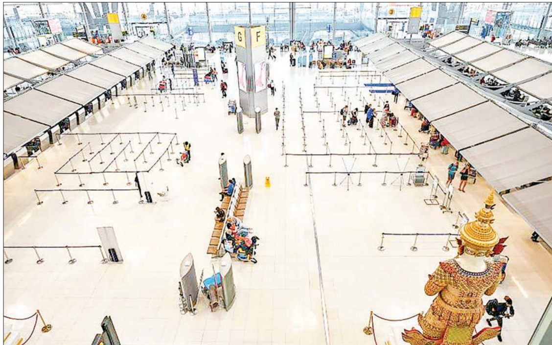
A general view of the almost empty departure hall of Suvarnabhumi Airport in Bangkok on Tuesday, as visitor numbers have plummeted in the region over the spread of the Covid-19 coronavirus.

QUEEN ELIZABETH II's eldest son and heir Prince Charles, who contracted Covid-19 last year, has received a first vaccine dose, his office said on Wednesday.