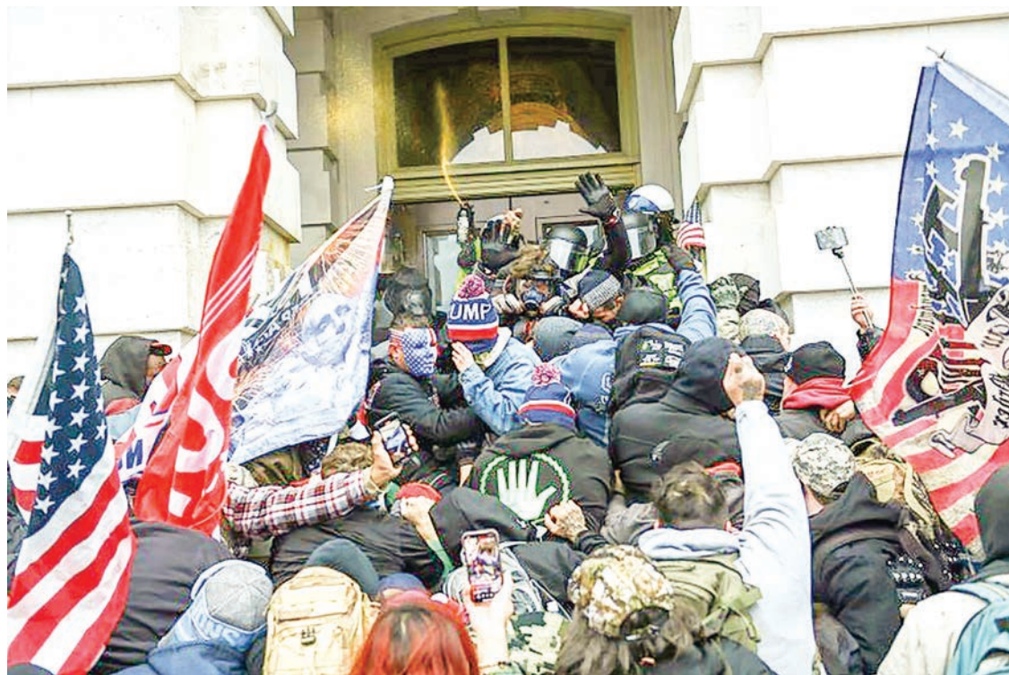
Trump supporters clash with police and security forces as they storm the US Capitol hoping to reverse his loss in the presidential election.