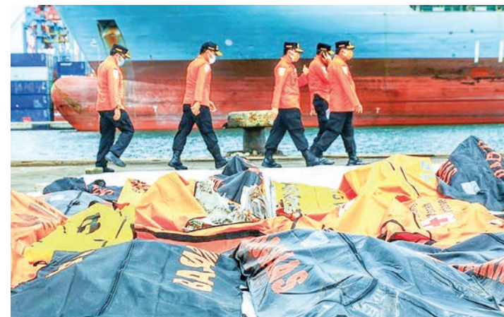
Sriwijaya Air flight SJ182 came down just four minutes after setting off from Jakarta last month. PHOTO: AFP/FILE

“The left (engine throttle) was moving backward too far while the right one was not moving at all -- it was stuck,” said National Transportation Safety Committee investigator Nurcahyo Utomo.— AFP