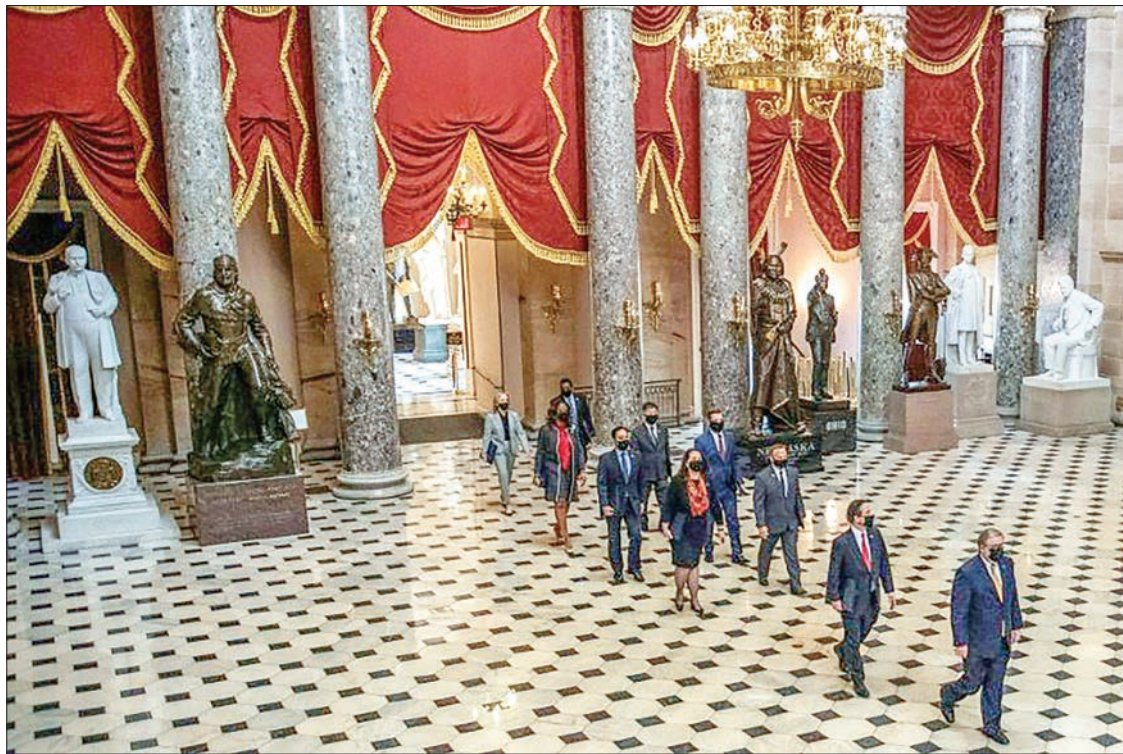
Democratic impeachment managers head to the Senate where former president Donald Trump is on trial.

Impeachment managers, the equivalent of prosecutors in a regular trial, are expected to