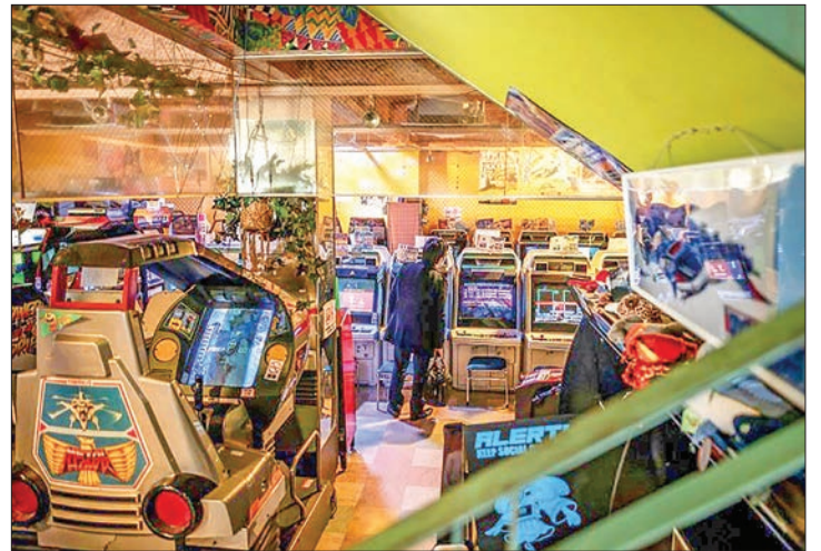
Unlike bars and restaurants, Japan's arcades do not receive government cash as compensation for income lost during the virus-curtailed opening hours. PHOTO: AFP

Several arcades went bust following Japan's first state of emergency last year, which saw most of them close completely for two months, and those that survived are now struggling.—AFP