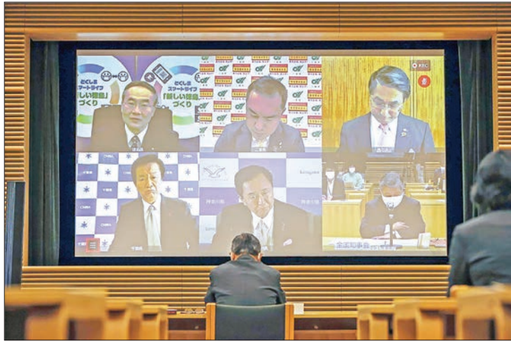
The National Governors' Association holds an online meeting on Feb. 6, 2021. The association called on the Japanese government to come up with realistic vaccination plans for its citizens amid the coronavirus pandemic.

Japan's governors urged the central government on Saturday to present its coronavirus vaccine rollout plan soon as little