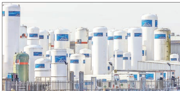
Storage tanks for gas by Linde group in Rotterdam, Netherlands.