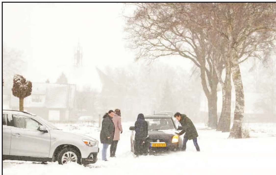
The Netherlands was blanketed on Sunday by the first major snowstorm to hit the country in 10 years, disrupting rail and road traffic, as a cold front pushed through northern Europe.