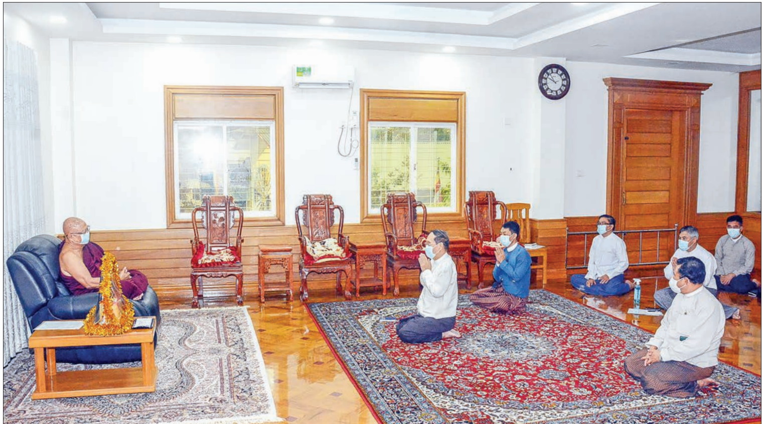
Union Minister U Ko Ko and party pay homage to the State Ovada Cariya Sayadaw of the Shwedagon Pagoda Board of Trustees on 7 February 2021.

party then received the instructions from the Sayadaw.