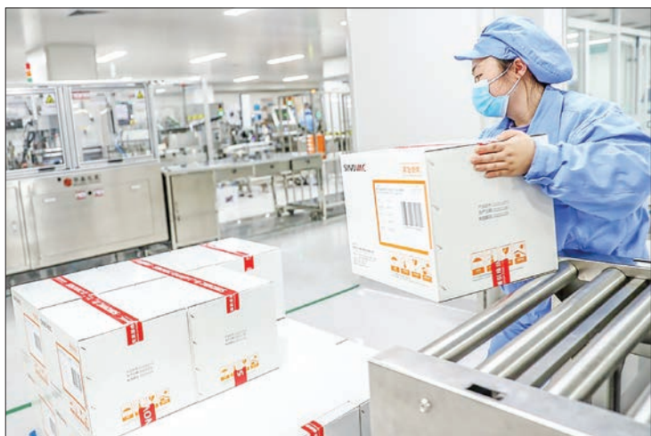
A staff member carries a box of COVID-19 vaccines at a packaging plant of Sinovac Research and Development Co., Ltd. in Beijing, capital of China, Jan. 6, 2021.

for a second COVID-19 vaccine, Sinovac's CoronaVac jab, the pharmaceutical company said Saturday.