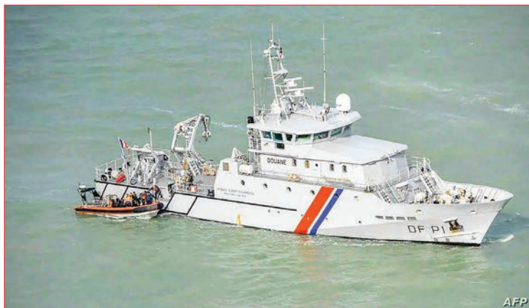
French patrol boat rescued 36 migrants aboard two boats “in difficulty” in the channel, seeking to cross to Britain, maritime authorities said on Saturday.

Later a ferry spotted a boat in trouble in the channel. The same patrol boat picked up the 23 people on board and brought all 36 migrants back to Calais before handing them over to border police. Conditions are currently relatively good for such clandestine departures with the waters unusually calm for winter. Last year, officials recorded a fourfold increase over 2019 in the number of channel crossings or attempted crossings from France, involving 9,551 people. Attempts by migrants to make the journey by sea have soared in recent years, despite the risks of hypothermia and accidents in the choppy waters of the busy shipping