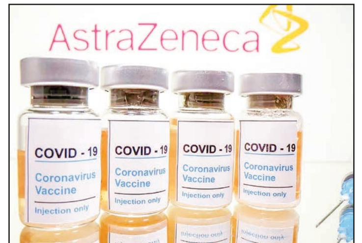
The Oxford/AstraZeneca vaccine fails to prevent mild and moderate cases of the South African coronavirus strain, according to research reported in the Financial Times.

THE Oxford/AstraZeneca vaccine fails to prevent mild and moderate cases of the South African coronavirus strain, according to research reported in the Financial Times.