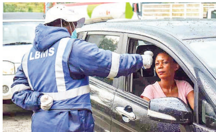
A Lesotho health official takes the temperature of motorists as a preventive measure against the spread of coronavirus.

The biggest decrease was in South Africa, the continent's worst-hit country, where the number of new cases dropped by 49%, at 4,100 new cases per day, confirming a strong deceleration that started the previous week. The country, where a more contagious variant of the coronavirus has been detected, in late 2020 saw an upsurge in cases, which