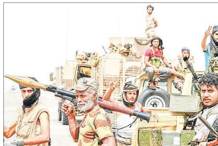
The grinding six-year war in Yemen has killed tens of thousands and displaced millions, triggering what the United Nations calls the world’s worst humanitarian disaster.