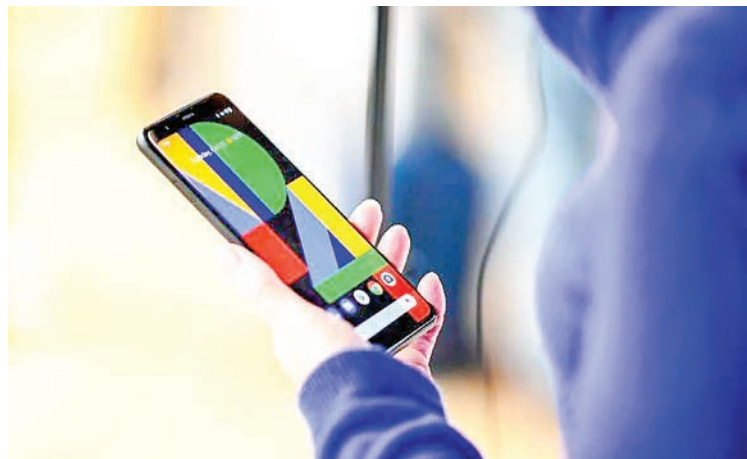
Google is weaning itself off user-tracking "cookies" which allow the web giant to deliver personalized ads but which also have raised the hackles of privacy defenders.

Google is weaning itself off user-tracking "cookies" which allow the web giant to deliver personalized ads but which also