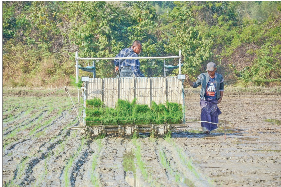
A farmer learn how to use planting machine in Hlegu.

The Food Action Alliance (FAA) led by partners from public, private and civil society, farmer and consumer organizations and academia, works to expedite country and region-led partnership platforms in the Americas, Europe, Africa, India and South-East Asia. A multi-stakeholder approach led by local and regional partners allows each partnership to maintain its uniqueness while harnessing the collective capacity of a significantly wider shared outcome at scale.