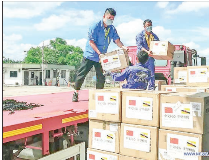
People unload medical materials donated by China in Bandar Seri Begawan, Brunei, on April 23, 2020.