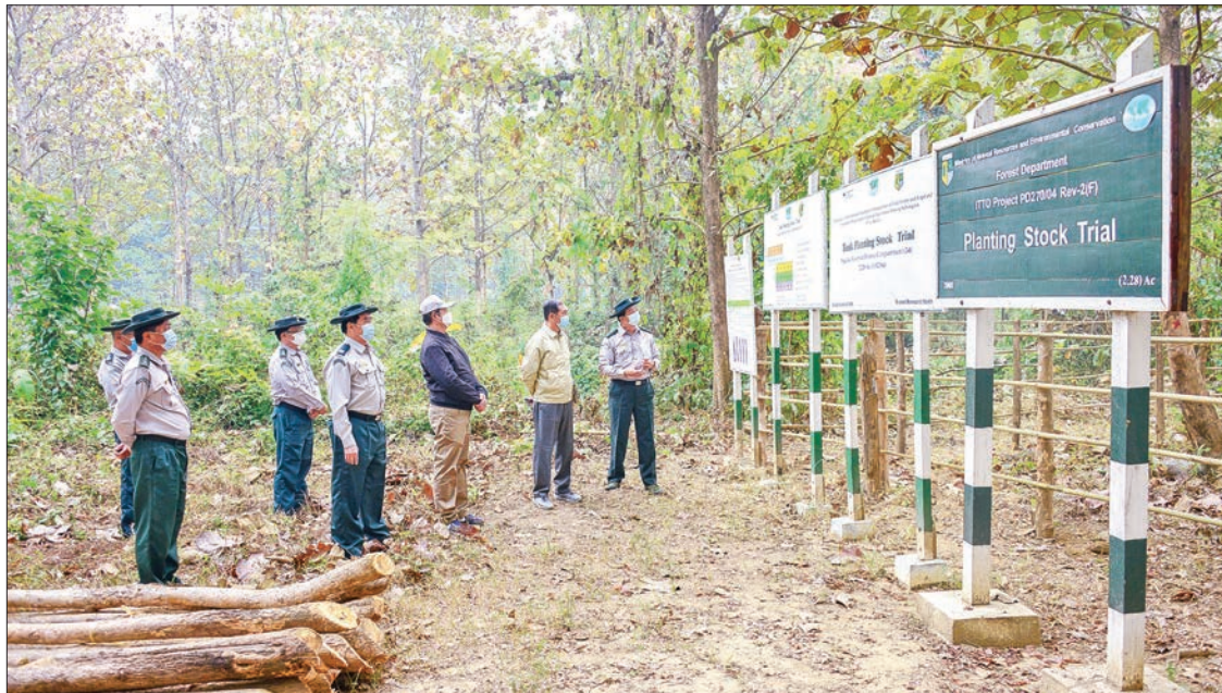
Union Minister U Khin Maung Yi and party are seen looking around Moe Swe forest research camp on 7 February 2021.

During the inspection tour, the Director for the Forest Research Institute explained the set-up of 10 forest research camps, eight of which are implementing the Myanmar Reforestation and Rehabilitation Programme (MRRP); the camps' activities to collect, grow and distribute the seeds of the variety of locally-grown trees; experiment of the 40 acres of eight teak genes from eight major teak growing areas in Myanmar in Moe Swe Camp; the establishment of a Hedge Garden for the genes of Plus Tree Teak throughout Myanmar and the status of staff assignments in 10 camps depending on the number