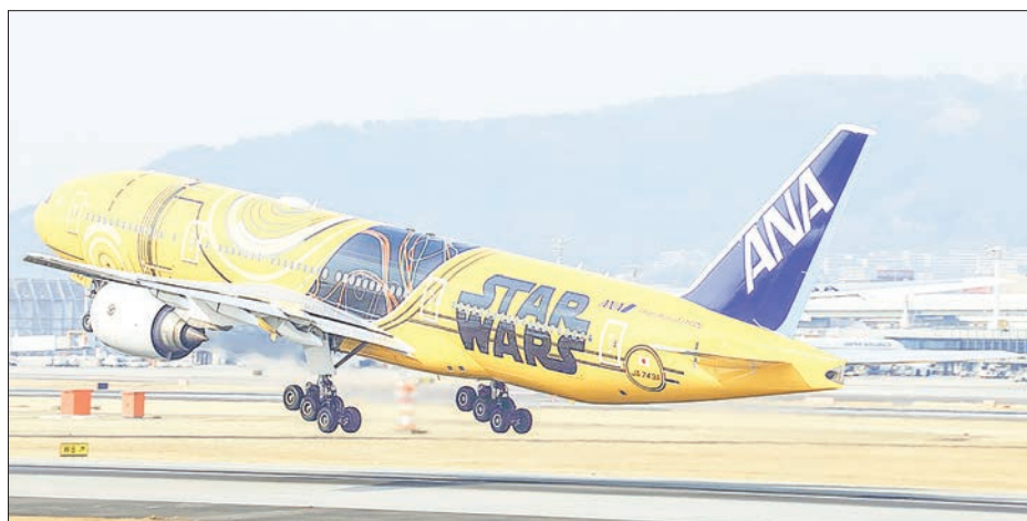
ANA Holdings Inc. plans to reduce its workforce in the aviation business by roughly 20 per cent over the next five years through natural attrition to cut costs and cope with the COVID-19 crisis that has depressed travel demand.

ANA Holdings Inc. plans to reduce its workforce in the aviation business by roughly 20 per cent over the next five years through natural attrition to cut costs and cope with the COVID-19 crisis that has depressed