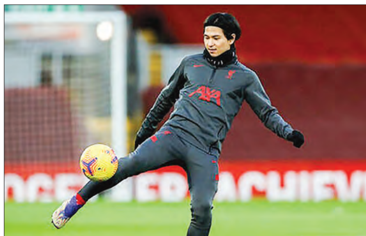
Takumi Minamino can play on the wing or as a second striker.

The 26-year-old Japan international, who can play on the wing or as a second striker, was