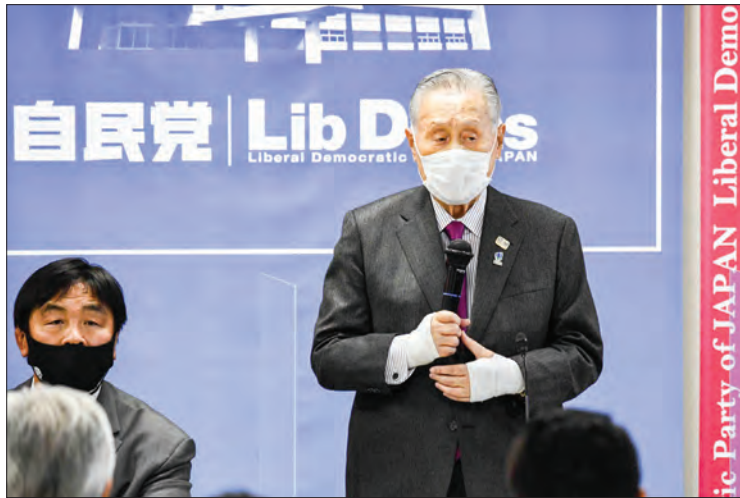
Tokyo 2020 President Yoshiro Mori delivers a speech at a beginning of a meeting on preparations for the Tokyo Olympics and Paralympics at the Liberal Democratic Party headquarters in Tokyo on Tuesday.

“We’ll certainly go ahead however the coronavirus (pandemic) evolves,” he told a meet-