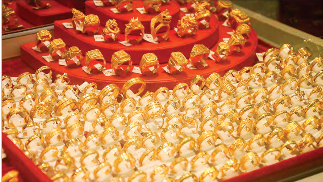
Gold jewellery is seen at one of the gold shops.

Earlier, the daily transaction of 50 visses (a viss equals 1.6 kg) of gold were seen in the market. Now, about five visses are traded per day, according to