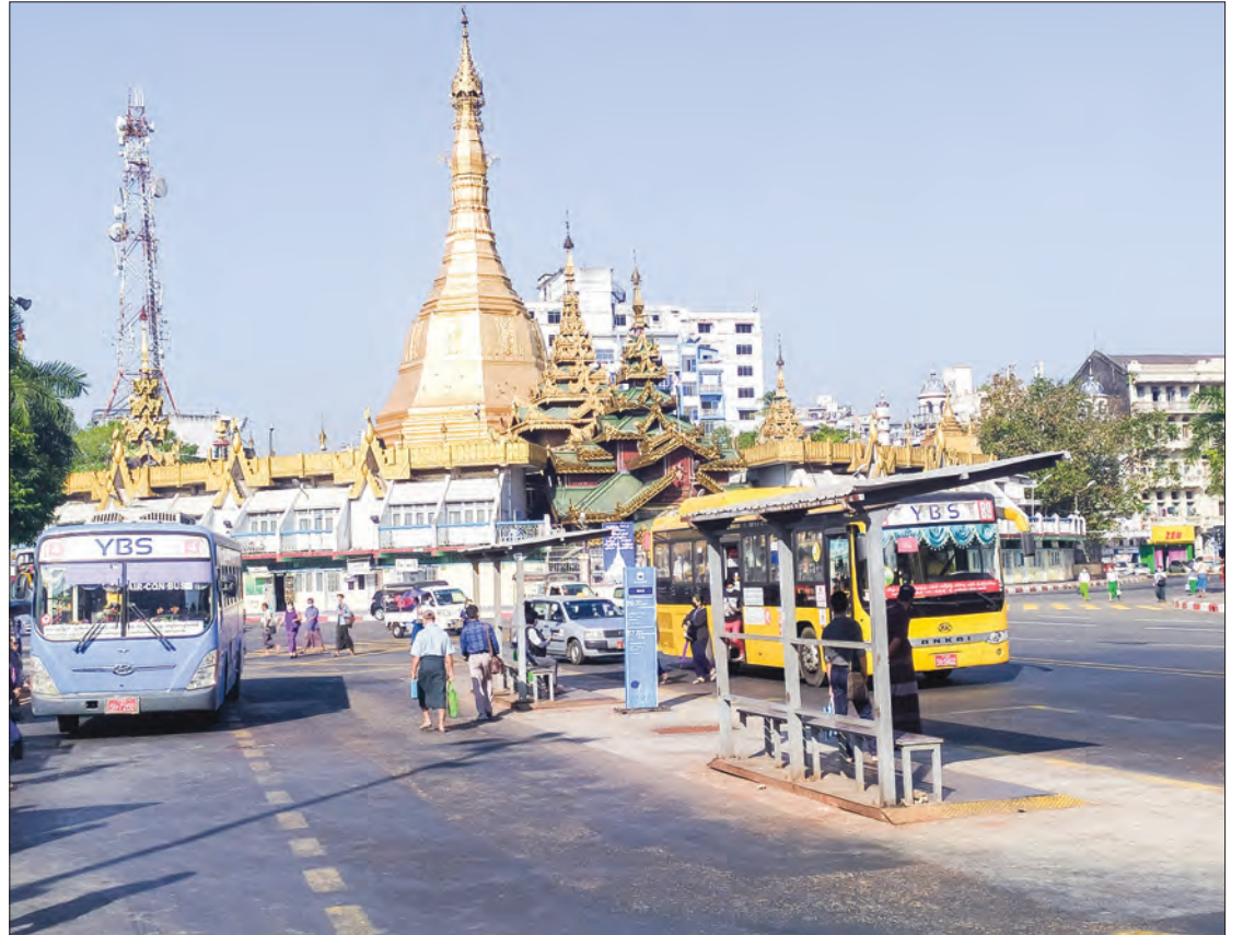
YBS buses are running as usual in Yangon on 2 February.

"Usually, the YBS carries 1.8 million passengers a day. Most people are travelling with YBS buses, particularly in the