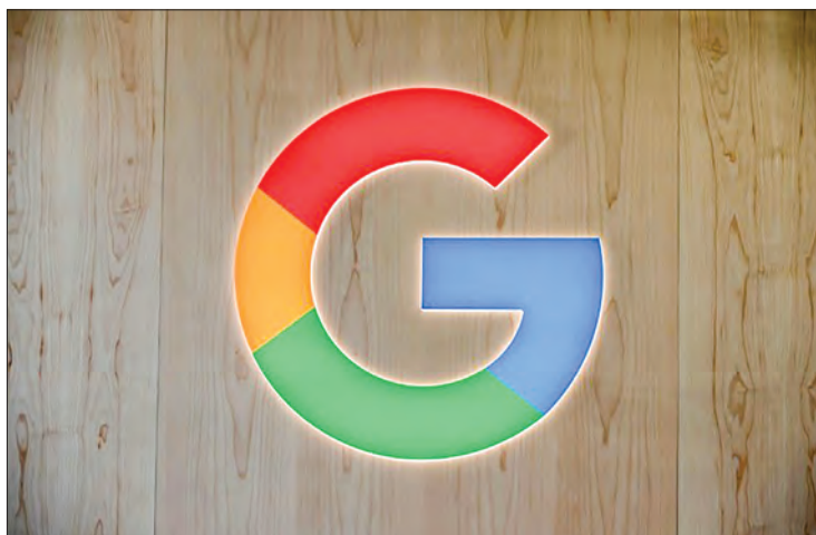
Google, which has dominated the lucrative online advertising market, is the target of a trio of antitrust lawsuits in the US accusing it of abusing its position.