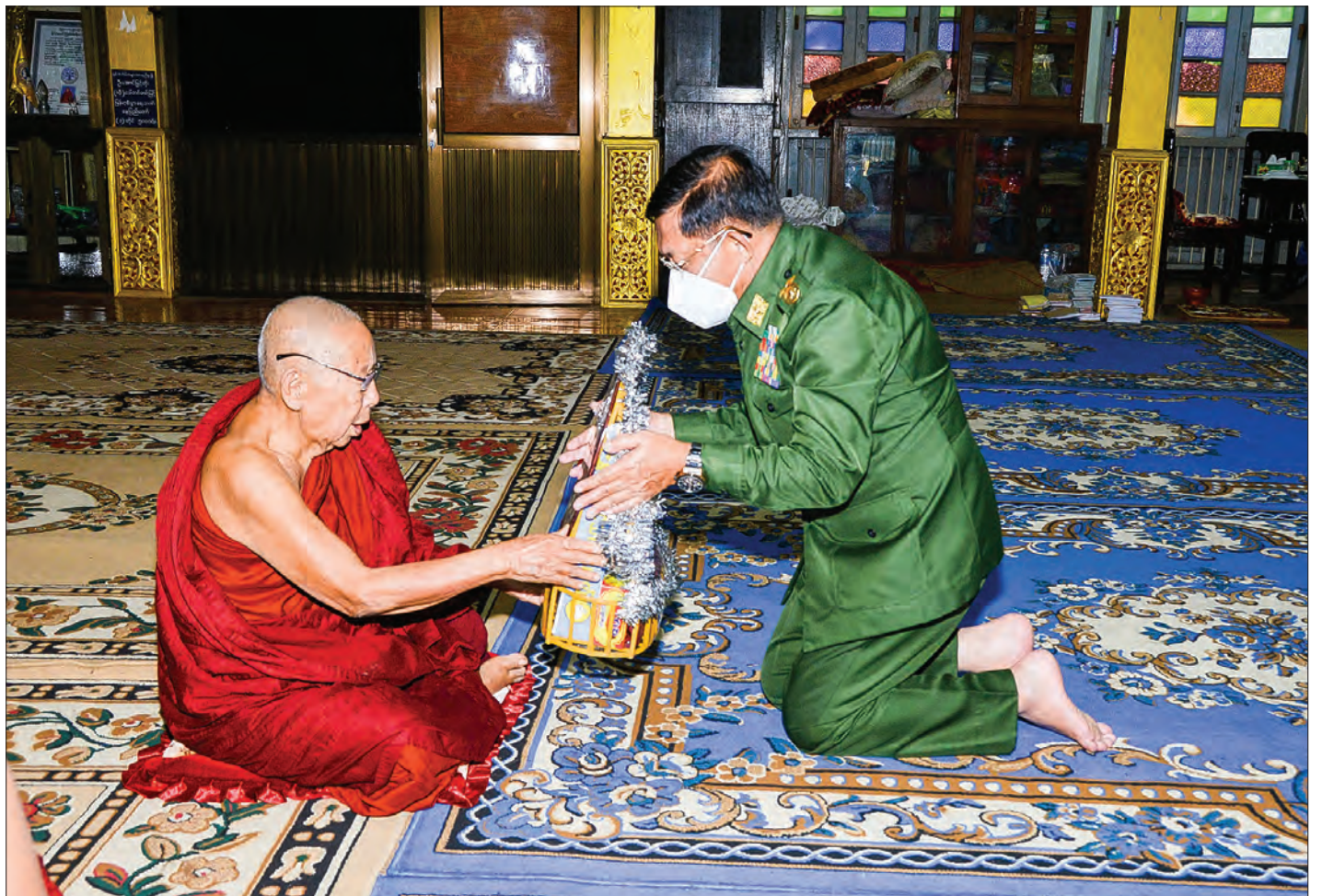
Commander-in-Chief of Defence Services Senior General Min Aung Hlaing, accompanied by Union Minister for Defence General Mya Tun Oo and Nay Pyi Taw Command Commander Major-General Zaw Myo Tin, visits the Zay Kone Buddhist Monastery, Pyinmana and presents offertories to the presiding monk.