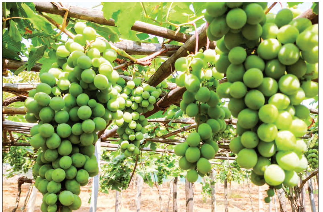
Grapes cultivations are successful in Hmine Pan village, Kyaukse township.

Before growing grapes, the cultivated ground needs to be repaired. The ground needs to be dug one-foot deep and one-foot wide hole and added with natural compost. After fixing the ground, the grape trees could be grown. After six months, we need to plant under the grafting system. Then, the fruits could be picked after another six months. The cultivation of 500 grape trees costs K1.6 million, and it could produce 1,500 visses of grape. The grapes are likely to fetch around K3,000 to K4,000 per viss in the market. All 500