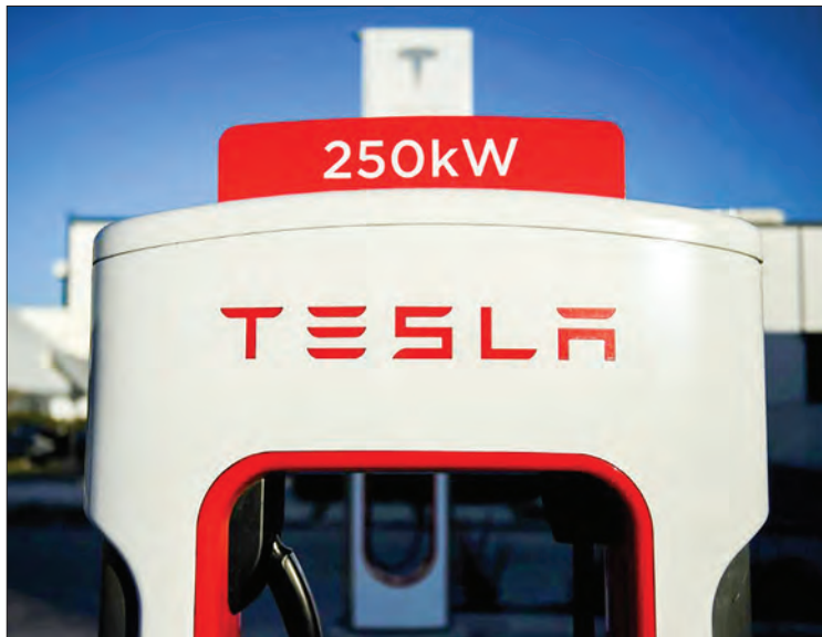
A recharging station for Tesla electric cars in Hawthorne, California.

WITH social media prognostications about Bitcoin or GameStop, Elon Musk has ventured further away from his own businesses and become more like a Wall Street heavyweight who can move markets with just a few words.