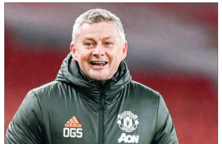
Manchester United manager Ole Gunnar Solskjaer.

LONDON — Ole Gunnar Solskjaer has told his Manchester United stars to “make a fuss” about referees’ decisions after his team were on the wrong end of two key decisions in a damaging defeat against Sheffield United.