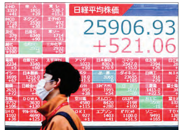
Equity markets rose again on Tuesday, extending the previous day's rally as investors got back in the saddle following last week's global rout, with sentiment buoyed by US stimulus hopes.