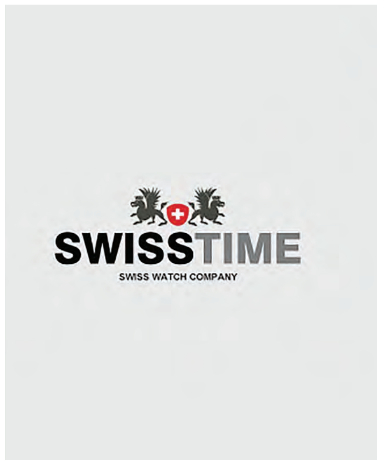
Trademark of SwissTime.

The IP Department of the Ministry of Commerce has urged the entrepreneurs from home and abroad to apply for mark registrations in accordance with the Trademark Law enacted on 30 January in 2019 in order to enjoy equal rights for intellectual property, to prevent against violation of intellectual property rights, to enter a fair market competition, to stand as high-quality products and services and to ensure market expansion.