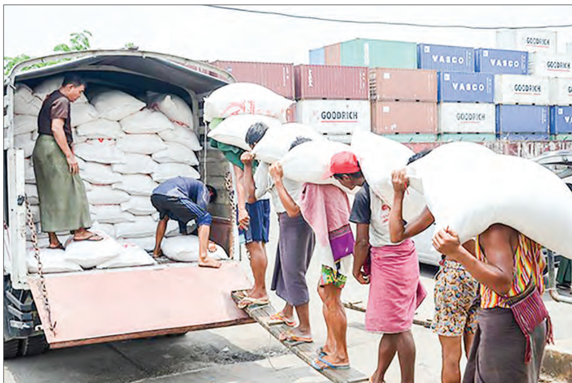
Workers carrying sacks of rice at the Botahtaung Jetty in Yangon.