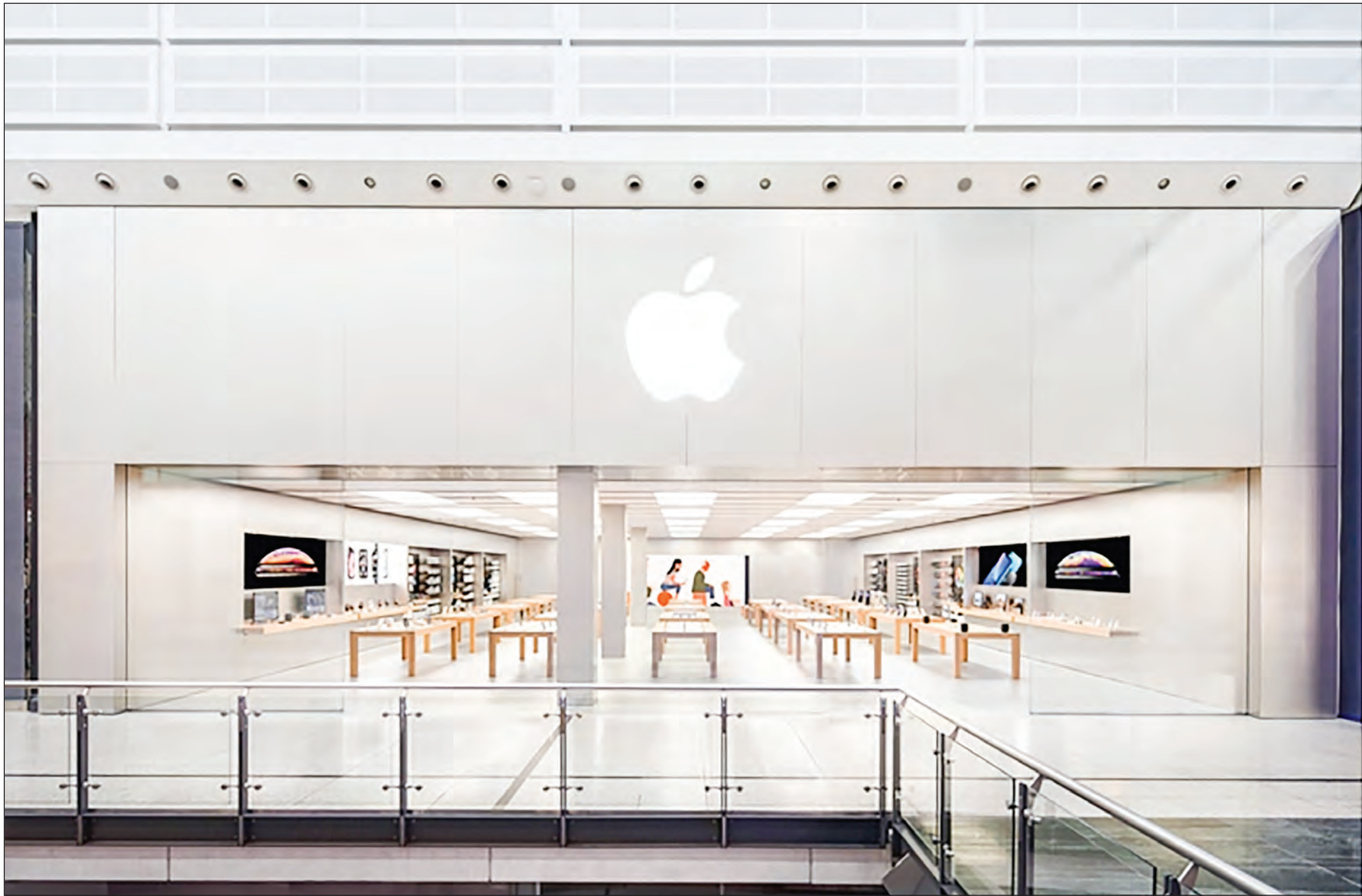
Apple Store with Apple Mark.