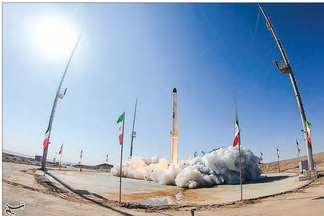
A handout picture provided by Iran's Defence Ministry shows the launch of Iran's newest satellite-carrying rocket, called "Zuljanah," at an undisclosed location on February 1, 2021.

He also said the rocket can be launched from a "mobile platform", which provides it with "special capabilities".