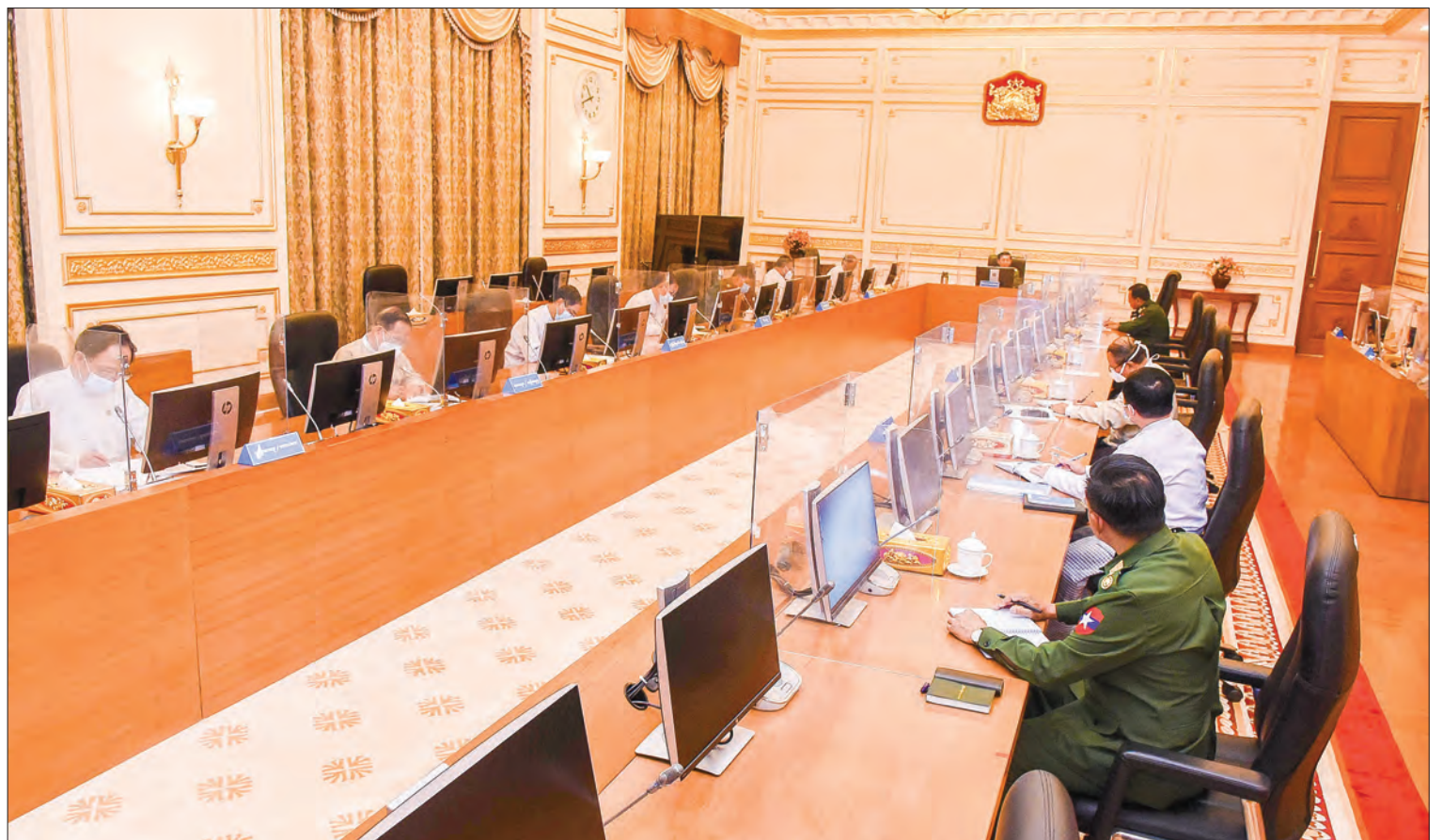
Commander-in-Chief of Defence Services Senior General Min Aung Hlaing chairs the Union Government meeting at the President House in Nay Pyi Taw on 2 February 2021.

He also instructed to take the lessons from two previous democratic governments' experiences and strengthen their advantages as the public and international communities have made their responses to these governments.