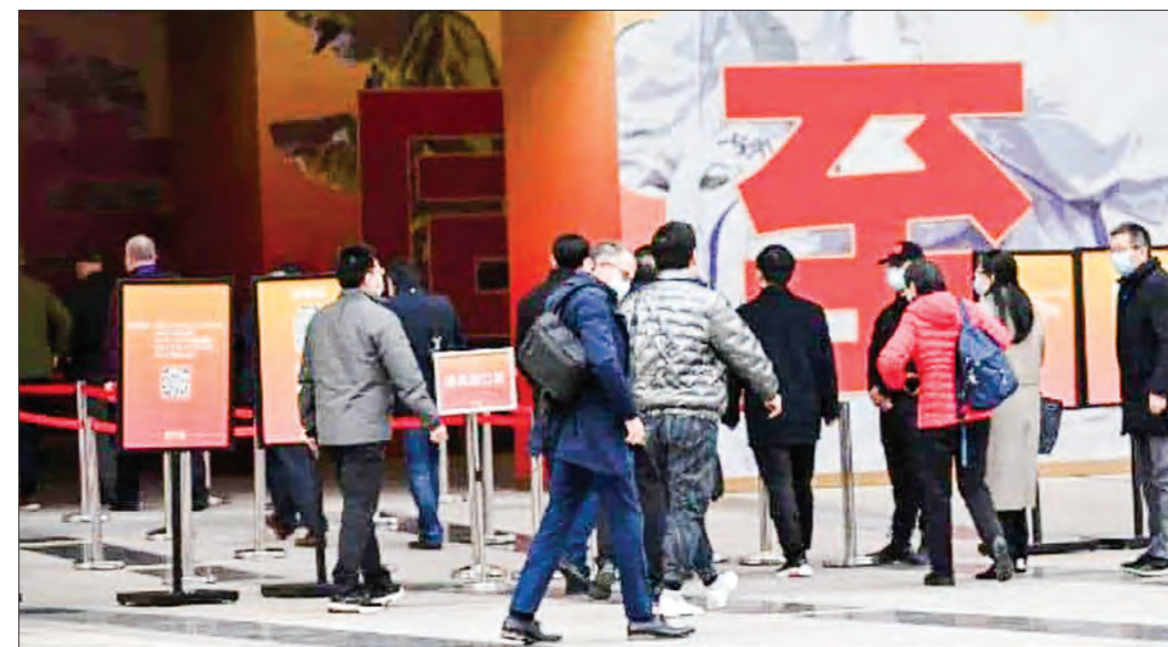
Members of the World Health Organization (WHO) team investigating the origins of the Covid-19 pandemic arrive to visit a museum exhibition about China's fight against Covid-19 in Wuhan, China's central Hubei province on January 30, 2021.

"We still don't fully understand what Long Covid is," Diaz told AFP in an interview outside the WHO's