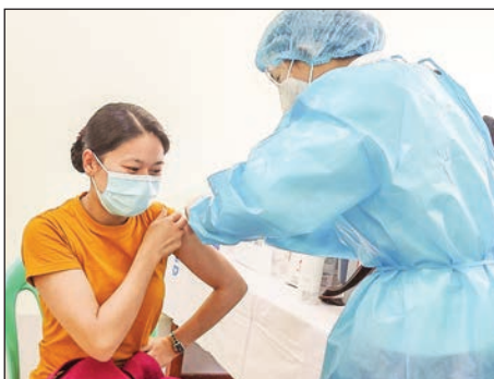
Muse Township, Shan State.