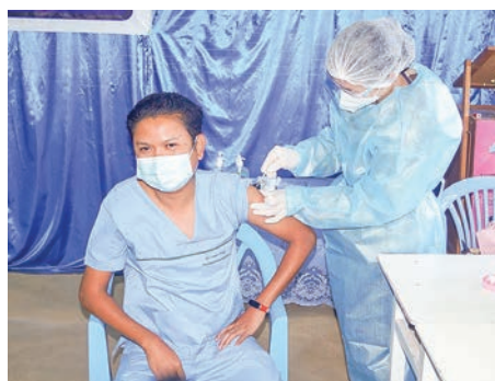
Pekhon Township, Shan State.