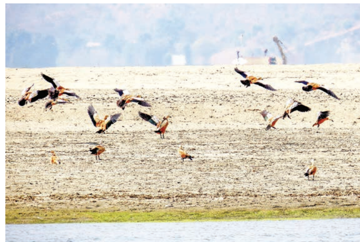
Picture shows migratory birds in Magway Region.