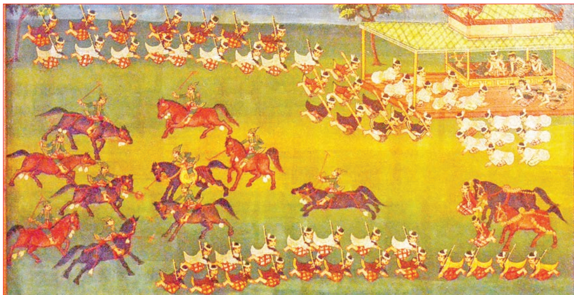
The painting depicts royal princes playing Gulie.

good Gulee Game player where he became Nat Spirit he dance singing the following Gulee game song.