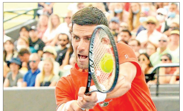
Novak Djokovic played with a large blister on his right hand.

The 17-time Grand Slam winner didn't appear for the first set against young Italian Jannik Sinner at an exhibition in Adelaide, just hours after emerging from two weeks' quarantine, with fellow Serb Filip Krajinovic taking his place. But with a near full crowd at Memorial Drive, Djokovic said he couldn't stay away and came on court for the second set, to huge roars.