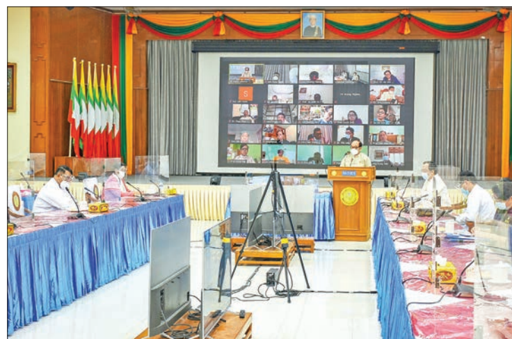
Union Minister Dr Myint Htwe speaks at the Meeting of Myanmar Medical Council on 29 January 2021.

He also highlighted the discussion regarding Myanmar