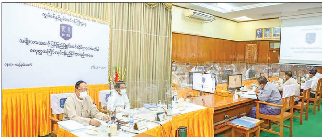
Union Ministers U Win Khaing and Dr Aung Thu attend the 4th coordination meeting of the National Renewable Energy Committee in Nay Pyi Taw on 29 January 2021.

At the meeting, Union Minister U Win Khaing said that the committee has organized three meetings since it was formed in February 2019, and could work for the improvement of renewable energy in Myanmar's Energy Mix, opening the first solar power