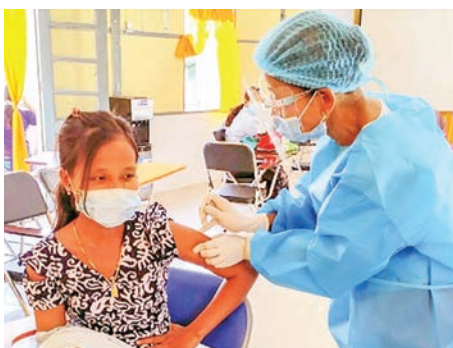
Minbya Township, Rakhine State.