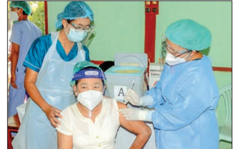
Kyaukpadaung Township, Mandalay Region.