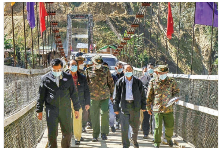
VP U Myint Swe inspects Ridem suspension bridge that crosses Maykha river in Phulone village on 29 January.