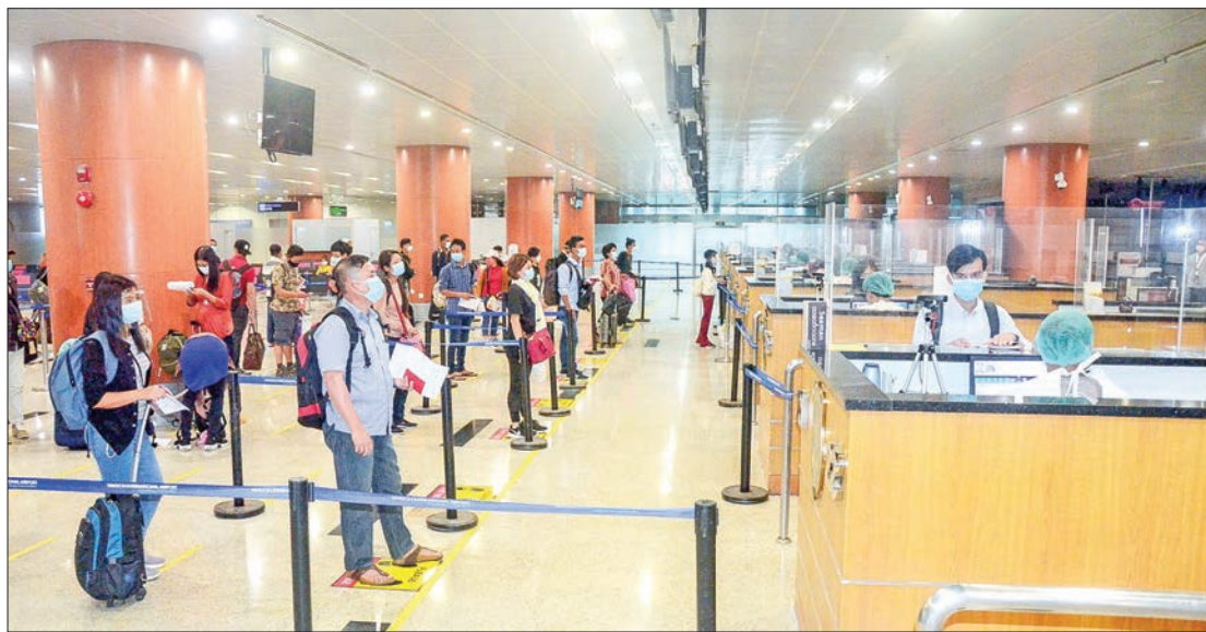
Myanmar returnees are seen at the Yangon International Airport on 29 January 2021.

THE 37th relief flight of Myanmar National Airlines landed at Yangon International Airport yesterday bringing back a total of 144 Myanmar citizens stranded in Singapore.