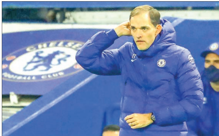
Thomas Tuchel accepts he will be judged on results given Chelsea's history of sacking managers.

"If you are signing for Chelsea you are signing for the hunger of titles," Tuchel said at his unveiling to the media on Thursday. "You are signing for being competitive in every competition you play. I'm totally aware of that.—AFP ■