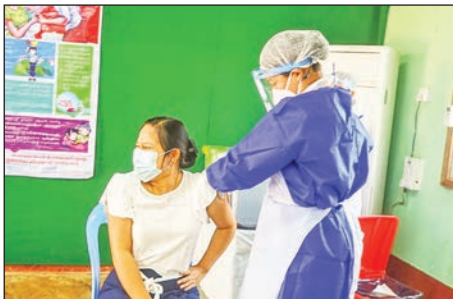
Mongnai Township, Shan State.