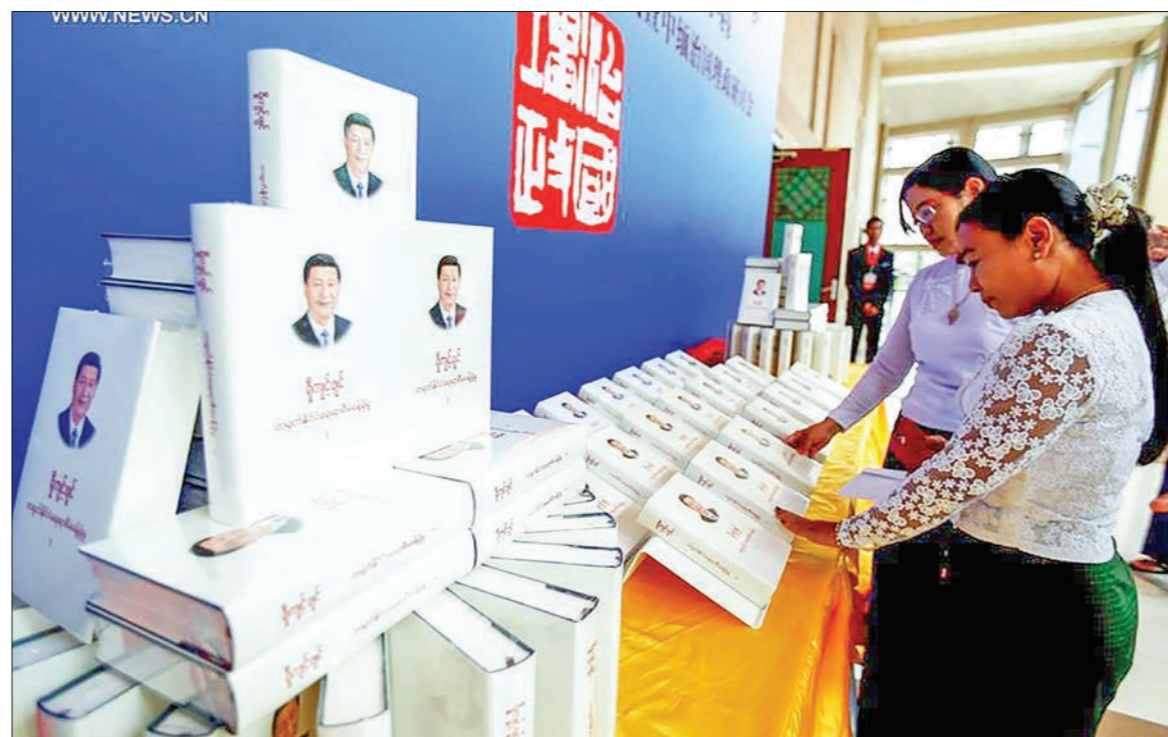
Attendees look at books on display during the release ceremony of the Myanmar edition of the first volume of "Xi Jinping: The Governance of China" in Nay Pyi Taw, Myanmar, July 9, 2018.

The old phrase "time is of essence" is especially true in our present fast-changing world, and time is a resource to be used creatively, innovatively, and smartly for one's country to prosper and enjoy peace and security. China is very fortunate to have successive strong and benevolent leaders in its long history who not only saved the nation and people from chaos and destruction but who have succeeded in bringing up China and its people to the global stage