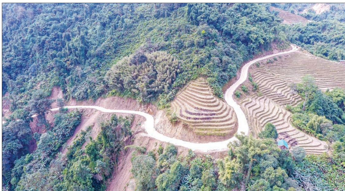
Aerial picture shows Khaunglanphu-Magweza road construction project in Kachin State.

The Vice-President gave guidance and instructions on safety measures to be undertaken in construction projects, transporting construction ma-