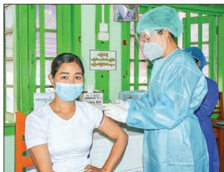
Mongmit Township, Shan State.