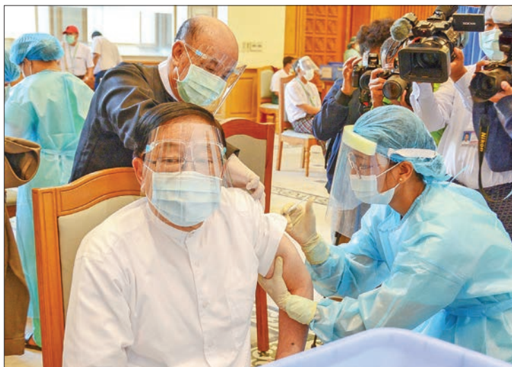
Pyithu Hluttaw Speaker U T Khun Myat receives the COVID-19 vaccine in Nay Pyi Taw on 29 January 2021.