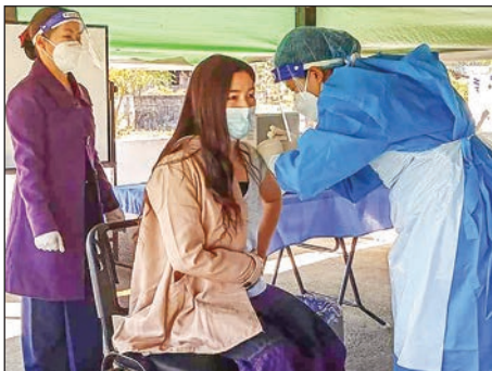
Nagmon Township, Kachin State.