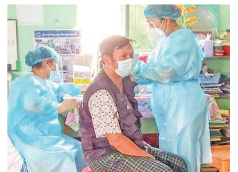
Latpadan Township, Bago Region.