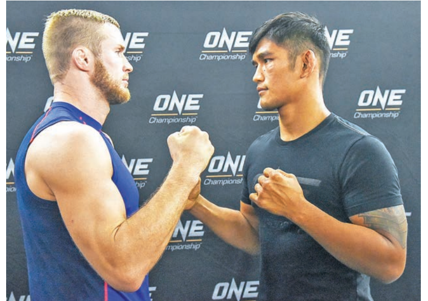
Aung La N Sang (Right) and Vitaly Bigdash are seen during their previous Middle Weight Fight titled 'Light of a Nation' in Yangon in 2017.