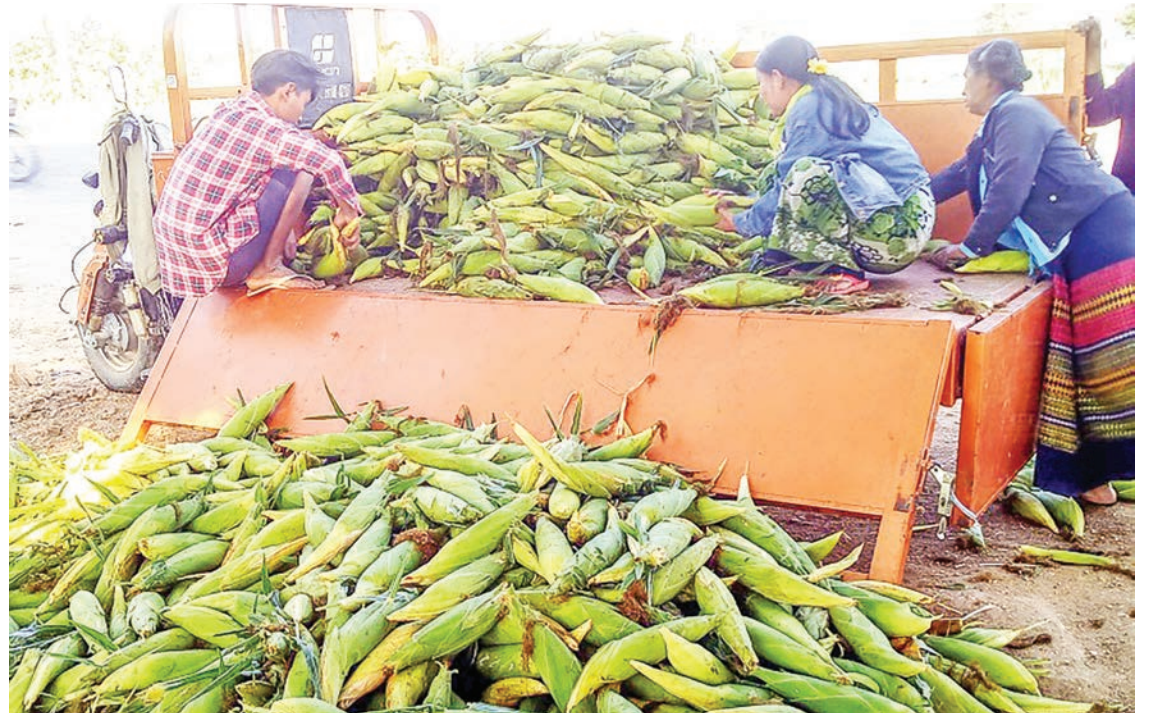
Farmers unload corn from a vehicle.

This year, the association targeted to export 1.6 million tonnes of corn. Last year, Myanmar exported over 2.2 million tonnes of corn to the foreign