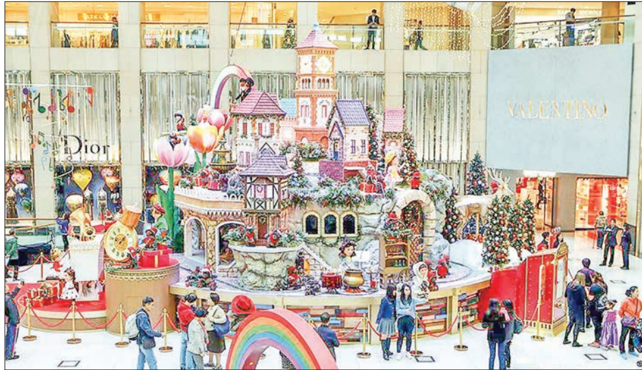
Christmas decorations are seen in a shopping mall in Hong Kong, south China.

HONG KONG'S economy contracted a record of 6.1 per cent in 2020 as the city was battered by the coronavirus pandemic, just months after it was upended by widespread political unrest. The government on Friday said gross domestic product (GDP) declined three per