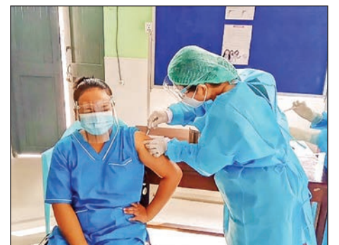
Twantay Township, Yangon Region.