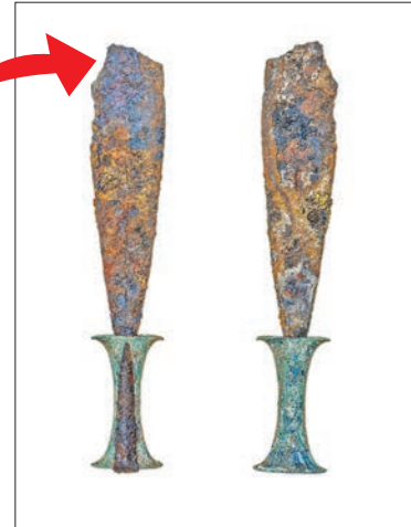
A complete sword of Pyu Era (2BC-9BC)