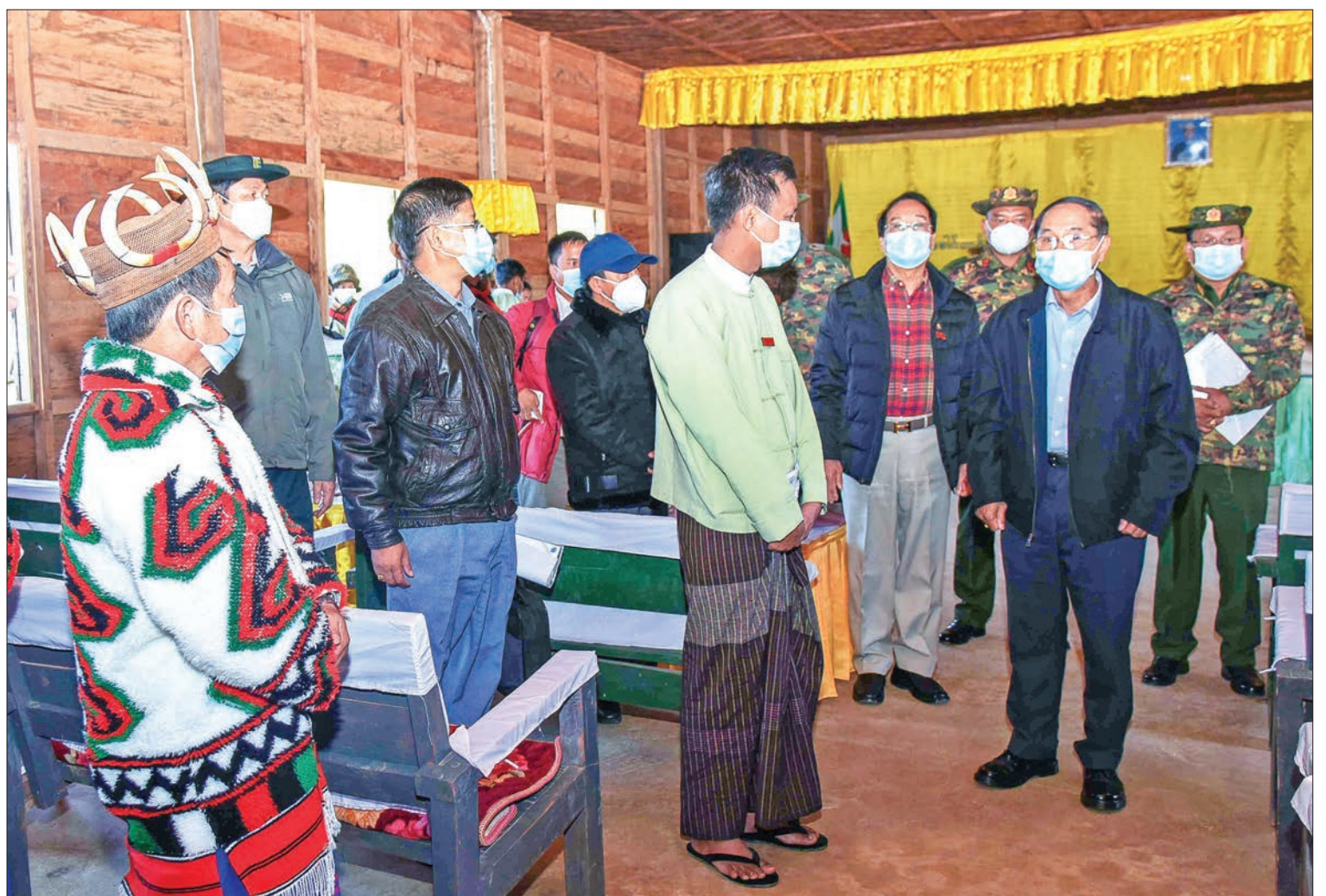
Vice-President U Myint Swe is greeting to the locals in Khaunglanphu Township, Kachin State on 29 January 2021.

At the management office of Hkakaborazi National Park, the Vice-President heard reports on environmental conservation works in the northernmost part of Myanmar, the status of forest coverage area in Putao district, information about the national park, the biodiversity situation, administration and management