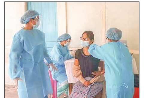
Indaw Township, Sagaing Region. PHOTO: 060