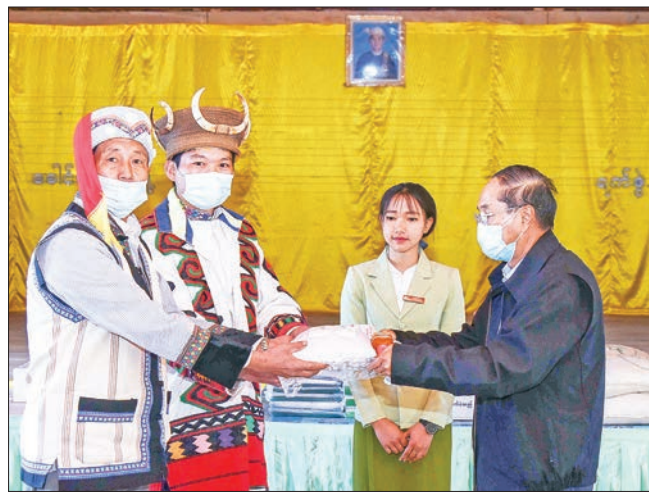
VP U Myint Swe provides foodstuffs to the locals and staff in Khaunglanphu on 29 January 2021.