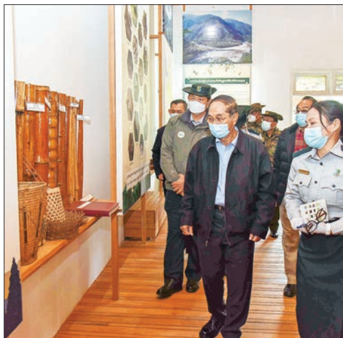
VP U Myint Swe inspects the Biodiversity Conservation Exhibition at Hkakaborazi park in Putao on 29 January 2021.