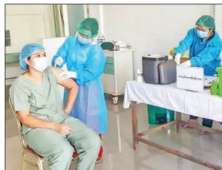
Pantanaw Township, Ayeyawady Region.