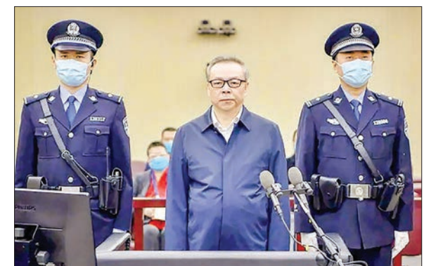
Lai Xiaomin at his trial in August in Tianjin in northern China / © Second Intermediate People's Court of Tianjin. PHOTO: AFP