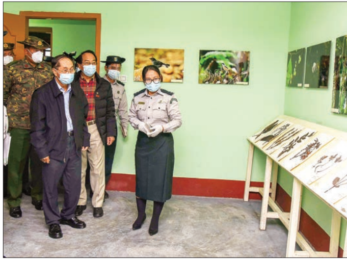
VP U Myint Swe inspects the Biodiversity Conservation Awareness Exhibition at Hkakaborazi National Park in Putao, Kachin State on 29 January 2021.

Deputy Commander of the Northern Command Brig-Gen Aung Myo Oo gave foodstuffs and commodities donated by the Tatmadaw (Army, Navy, Air Force)