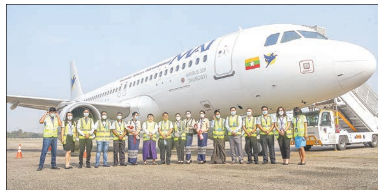
Officials and flight attendants of Myanmar Airways International pose for a group picture with the pilots of Airbus A320-214 XY-ALJ aircraft at the Yangon International Airport on 29 January.