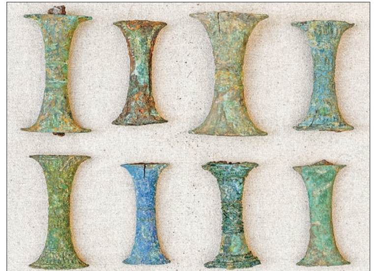
Bronze handles of swords in Pyu Era. BEITHANO GALLERY