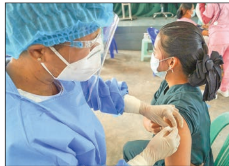
Monghkat Township, Shan State.