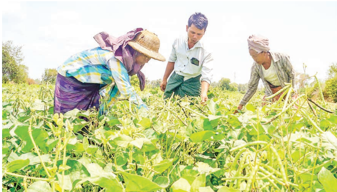
Farmers harvest green gram.