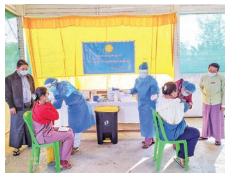
Mabein Township, Shan State.