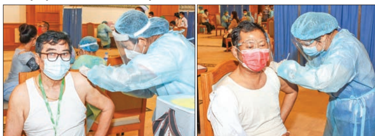
Pyithu Hluttaw MPs receive the vaccination against COVID-19 in Nay Pyi Taw on 29 January 2021.

cines, we first measure their blood pressure, body temperature and blood oxygen level. If needed, they have to see the doctors. We administered vaccines if they are well. The MPs have to return to their rooms only after 30 minutes of the vaccination and if they are safe. Necessary medical covers were provided at their hostels," he added.