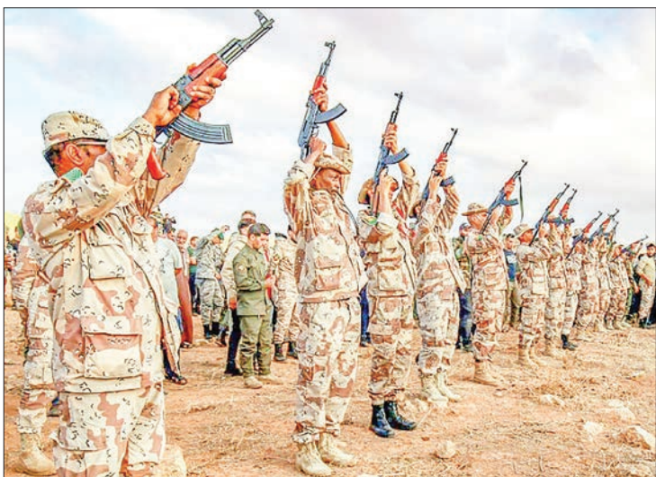
Fighters fire salutatory rounds in the air during a funeral for a commander of the Special Forces of the self-proclaimed Libyan National Army loyal to strongman Khalifa Haftar, in the eastern city of Benghazi on November 1, 2020.

THE United States on Thursday called for the immediate withdrawal of Russian and Turkish forces from Libya, after a deadline for them to leave was ignored.