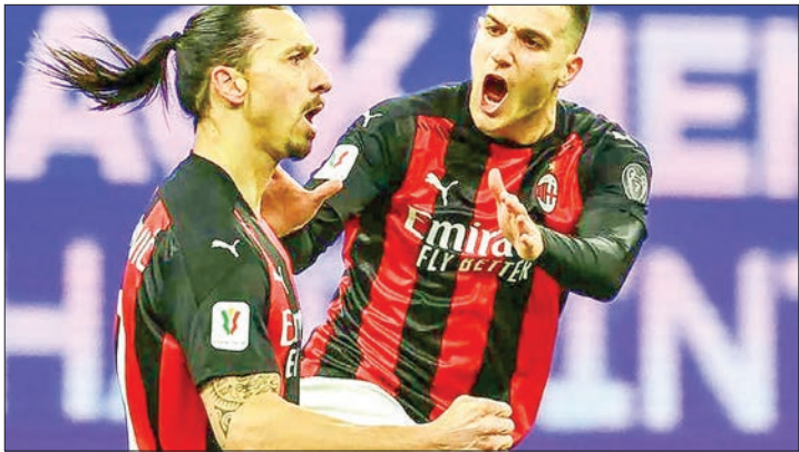
AC Milan forward Zlatan Ibrahimovic (L) has scored 12 goals in Serie A.

MILAN — Leaders AC Milan look for a boost on Saturday at 13th-placed Bologna after a dramatic Italian Cup exit to city rivals Inter days after a league defeat to Atalanta.