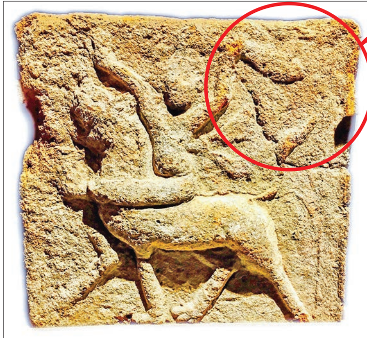
Brick Bearing Relief of a man riding a mythical animal and holding a weapon. NATIONAL MUSEUM IN NAY PYI TAW.

"The finding helps us understand the way people lived in the