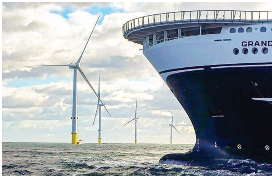
Britain is betting on wind power, particularly those built offshore, to reduce its use of fossil fuels to generate electricity.

RENEWABLE energy beat fossil fuels last year to become the largest source of electricity in Britain, according to a study. Biomass, hydro, solar and wind generated a record 42 per cent of UK electricity in 2020, showed a study this week from climate think tanks Ember and Agora Energiewende. Fossil fuels – mainly gas – accounted for 41 per cent, the pair added in a statement. In 2019, renewables accounted for 37 per cent and fossil fuels 45. The study also revealed that offshore wind turbines generated a record 24 per cent of Britain's electricity last year. That compared with 20 per cent in 2019 and was double the level