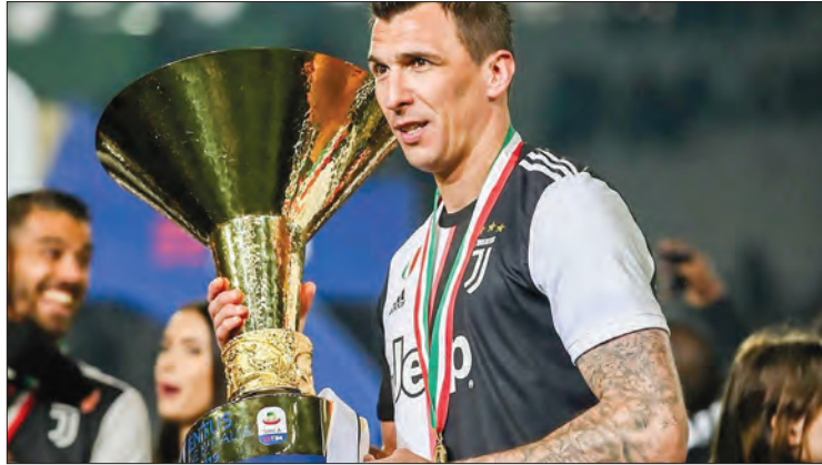
Mario Mandzukic won Serie A four times with Juventus.

arm in attack. The club is ambitious again, the arrival of Mandzukic goes in that direction,” Pioli said after Monday’s win at Cagliari which allowed his outfit to retain top spot.