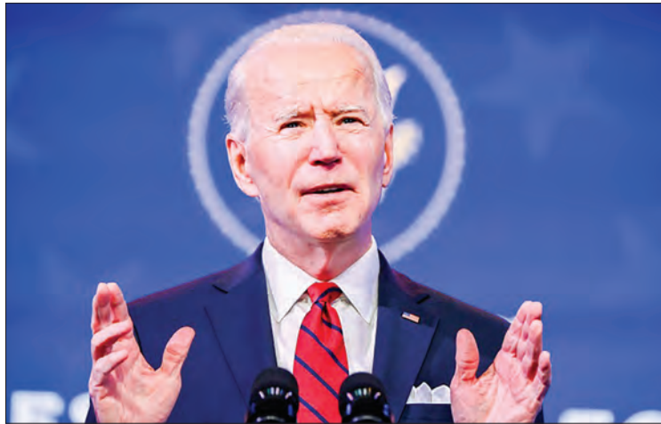
The United States faces a number of 'competing crises' as Joe Biden takes office as president.

A raging pandemic. An economic crisis. A nation divided. Deep racial wounds.