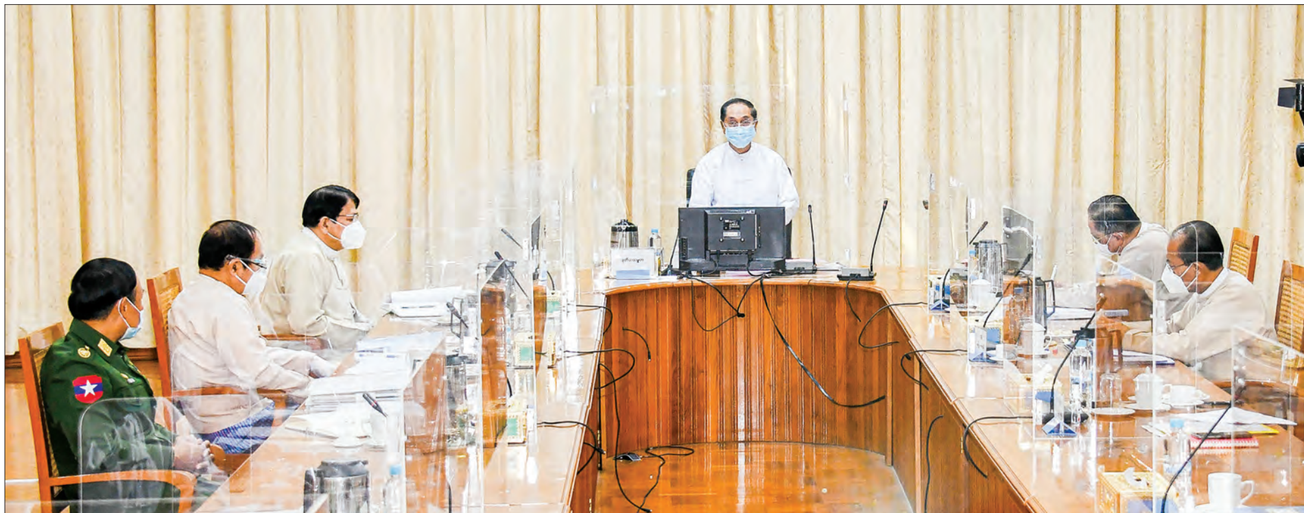
Vice-President U Myint Swe presides over the 2 nd coordination meeting for holding 74 th Union Day celebrations, on 19 January.

Vice-President U Myint Swe, in his capacity as chairman of the 74 th Union Day Central Organizing Committee, discussed preparations of relevant sub-committees to celebrate the annual event that will take place on 12 February 2021.