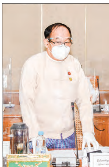
Union Minister for Health and Sports Dr Myint Htwe.

He also emphasized the works of the Information Sub-committee to raise public awareness about the Union Day through state-owned media platforms for national reconciliation, unity, peace, stability and development of the country; the works of the Invitation and Welcoming Sub-committee to finalize the list of invitees and COVID-19 preventive measures for them; the works of the Campaign Poster