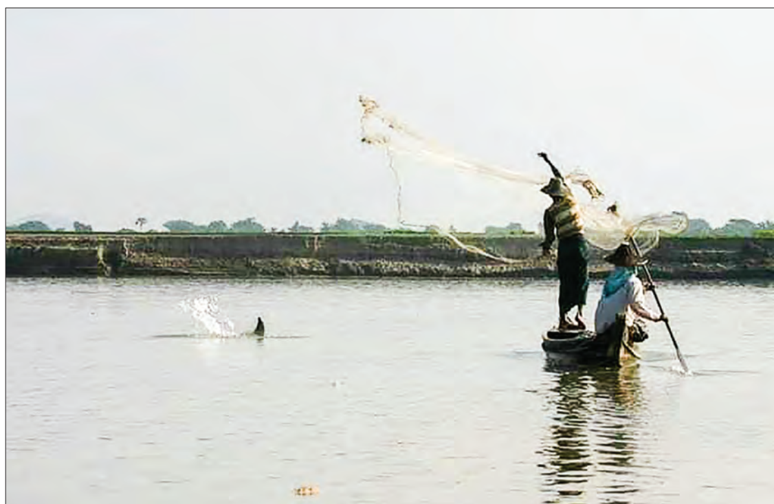
Fishermen catch fish in the Ayeyawady River with the help of a dolphin.