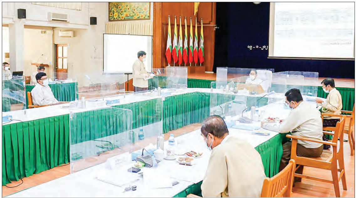
Union Minister Dr Aung Thu attends the 36 th coordination meeting of Central Administrative Body of Farmland on 19 January 2021.