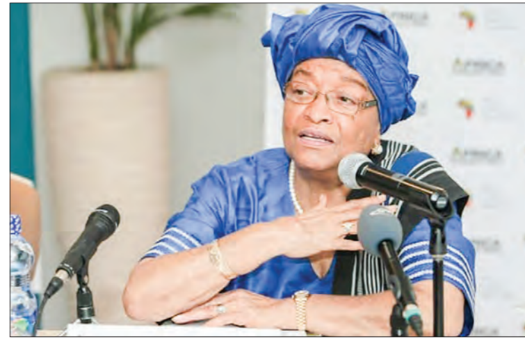
Former Liberian President Ellen Johnson Sirleaf, co-chair of the Independent Panel for Pandemic Preparedness and Response.