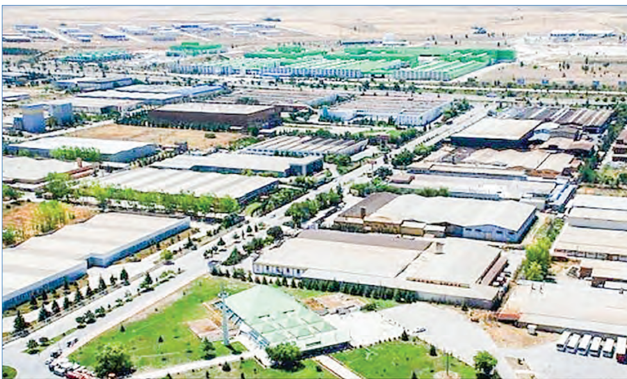
A textile-based industrial zone will be set up in Sagaing at an estimated cost of over US$370 million.

Myanmar is also implementing the National Export Strategy (NES), under which there will be measures like the transition of cut-make-pack (CMP) garment system into free-on-board (FOB) system, adoption of bonded warehouse system and establishment of special textile and garment zone for boosting export. Myanmar launched a national level textile policy with the help of German global development organization GIZ to promote the country's textile industry, attract investment by inviting foreign trade partners, build the necessary