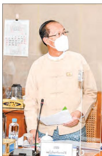
Nay Pyi Taw Council Chairman Dr Myo Aung.

Chairman of Management Committee and Nay Pyi Taw Council Dr Myo Aung briefed on the progress in the implementation of previous decisions; Deputy Minister for Home Affairs Maj-Gen Soe Tint Naing and Deputy Chief of Myanmar Police Force