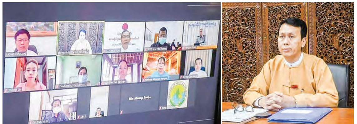
Yangon Region Chief Minister U Phyo Min Thein chairs the regional tourism committee meeting online to approve K2.925 bln worth hotel projects on 19 January 2021.

The regional committee held a videoconference on 19 January and Yangon Region Chief Minister U Phyo Min Thein, in his capacity as chair