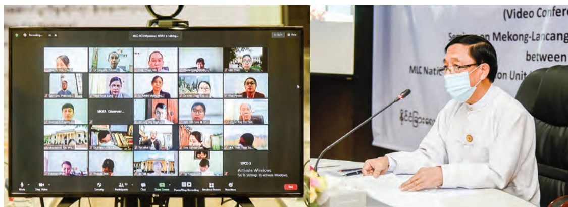
Deputy Minister for International Cooperation U Hau Do Suan makes an opening remark on the “Seminar on Mekong-Lancang Cooperation” on 19 January.

Officially established in 2016, the Mekong-Lancang Cooperation is composed of Cambodia, China, Laos, Myanmar, Thailand and Viet Nam with the aim to assist regional efforts to achieve sustainable inclusive development and narrowing development gaps in the region, while promoting peace and prosperity. The MLC Special Fund has provided funds for implementation of (51) projects in Myanmar to date in support of the National Sustainable Development Strategy of Myanmar with a total value of (16.3) million USD.—MNA