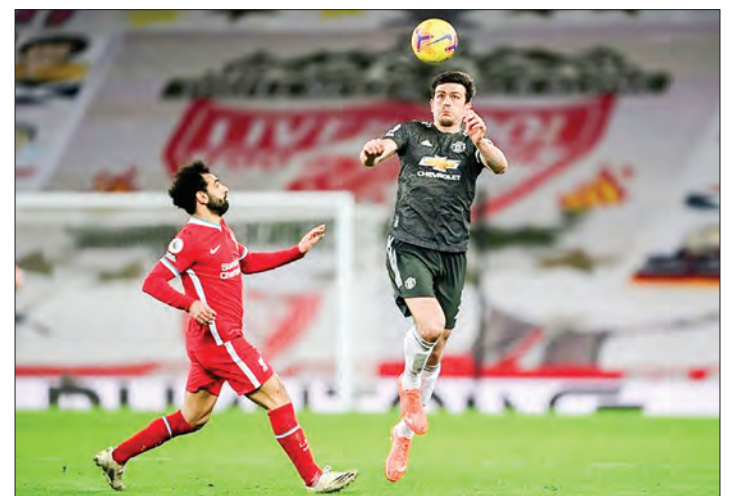
Heading in the right direction: Harry Maguire (right) sees huge progress in his 18 months at Manchester United.

United’s last domestic defeat away from home came at Anfield a year ago, when they were comfortably beaten 2-0.—AFP ■