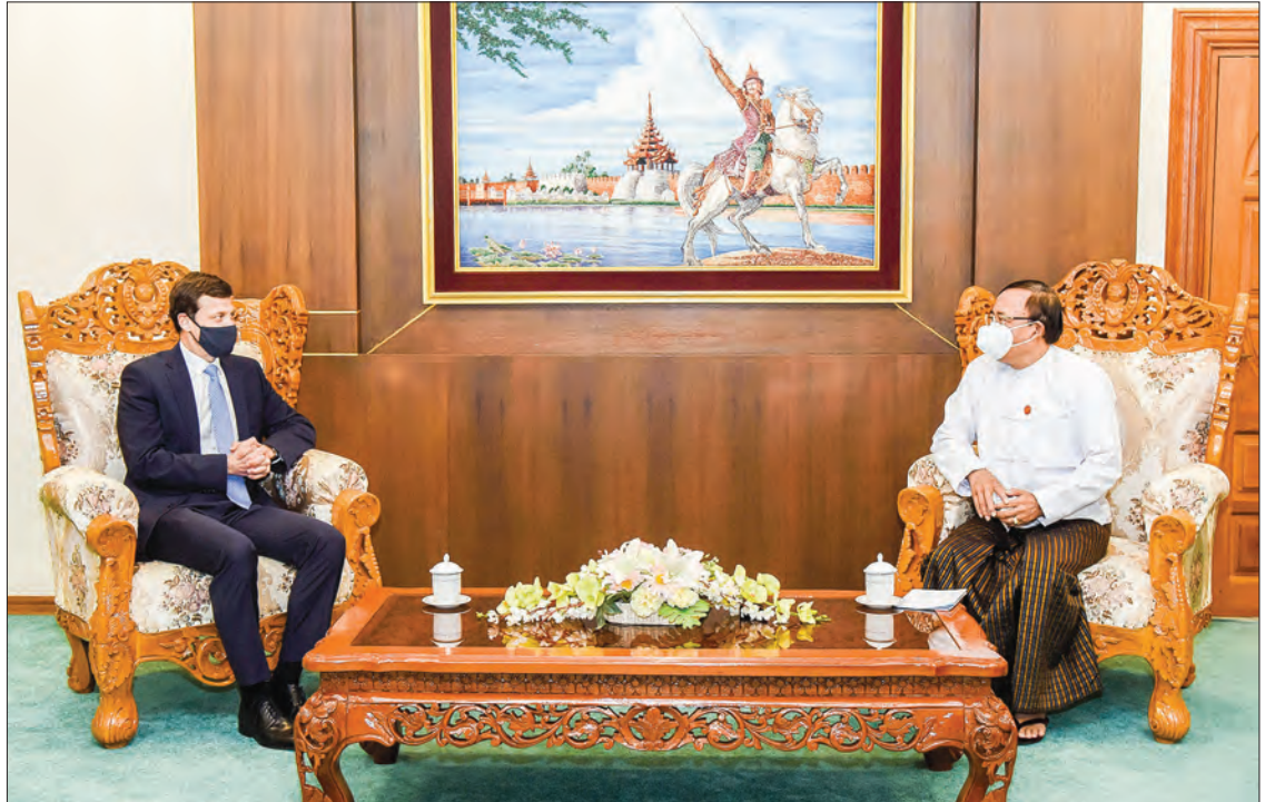
Union Minister U Kyaw Tin receives US Ambassador to Myanmar Mr Thomas Laszlo Vajda at the Ministry of Foreign Affairs in Nay Pyi Taw on 19 January.

the US for lending its support to Myanmar's efforts in promoting democracy, development and human rights. They cordially exchanged views on matters pertaining to the enhancement of the existing bilateral relations and cooperation between Myanmar and the United States of America, the US government's continued support to the democratic transition of Myanmar, expansion of the American businesses and investments in Myanmar and the challenges facing Myanmar in its transition including repatriation of displaced persons from Rakhine State.—MNA