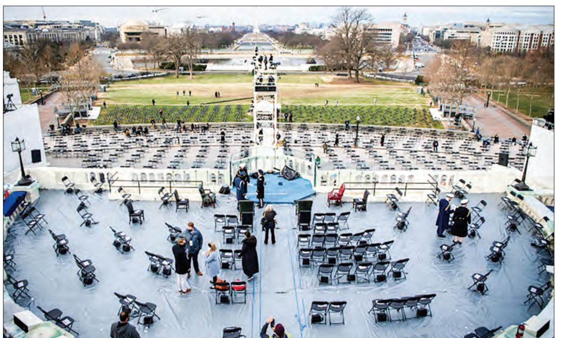
Final preparations are underway at the US Capitol for a socially distanced inauguration.

Banned by Twitter for his stream of inflammatory messages and misinformation, he has largely stopped communicating with the nation. He has also yet to congratulate Biden or invite him for the traditional pre-inaugura-