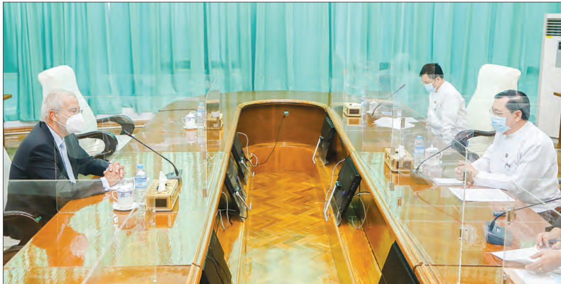
Union Minister U Thein Swe holds a meeting with Brazilian Ambassador to Myanmar on assistance in conducting labour force survey and census on 19 January.