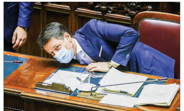
Down but not out. Italian PM Giuseppe Conte