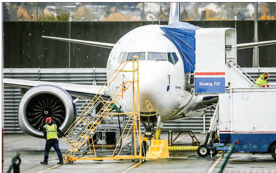
Back in the skies soon.