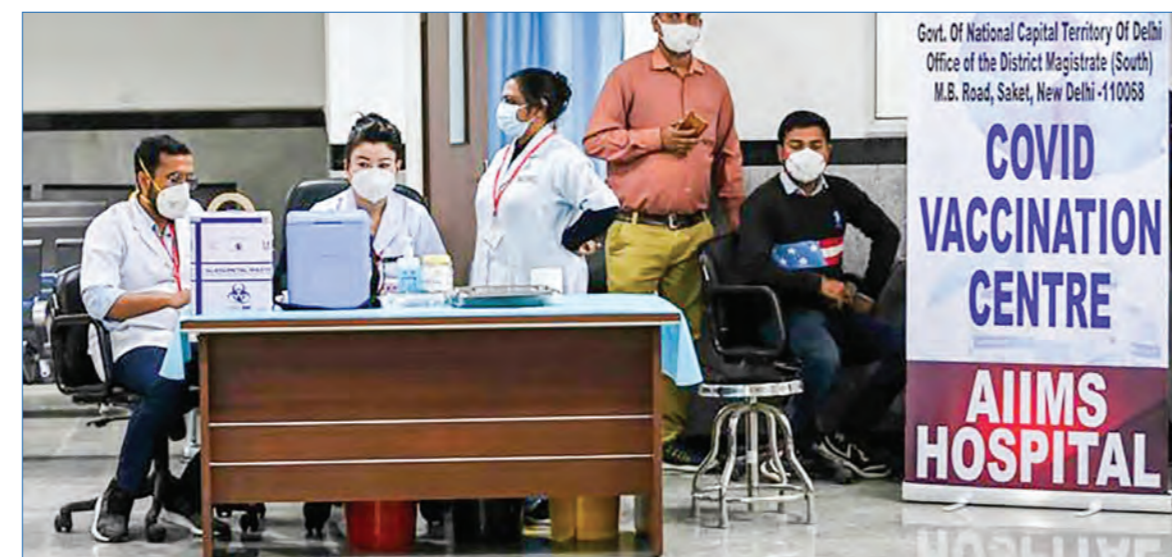
Health workers wait for the start of the Covid-19 coronavirus vaccination drive at the All India Institute of Medical Science (AIIMS) in New Delhi in January 16, 2021.

INDIA begins one of the world's biggest coronavirus vaccination programmes on Saturday, hoping to end a pandemic that has killed 150,000 people in the country and torpedoed the economy.