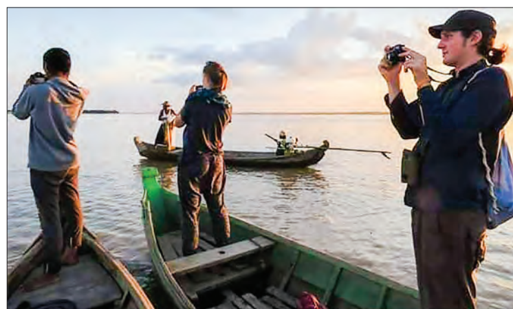
Tourists on a boat while spotting rare Ayeyawady river dolphins.