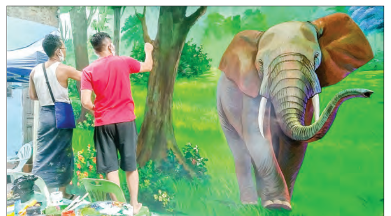
Doh Eain property management company will set up an alley garden and children's playground in Pabedan Township of downtown Yangon.