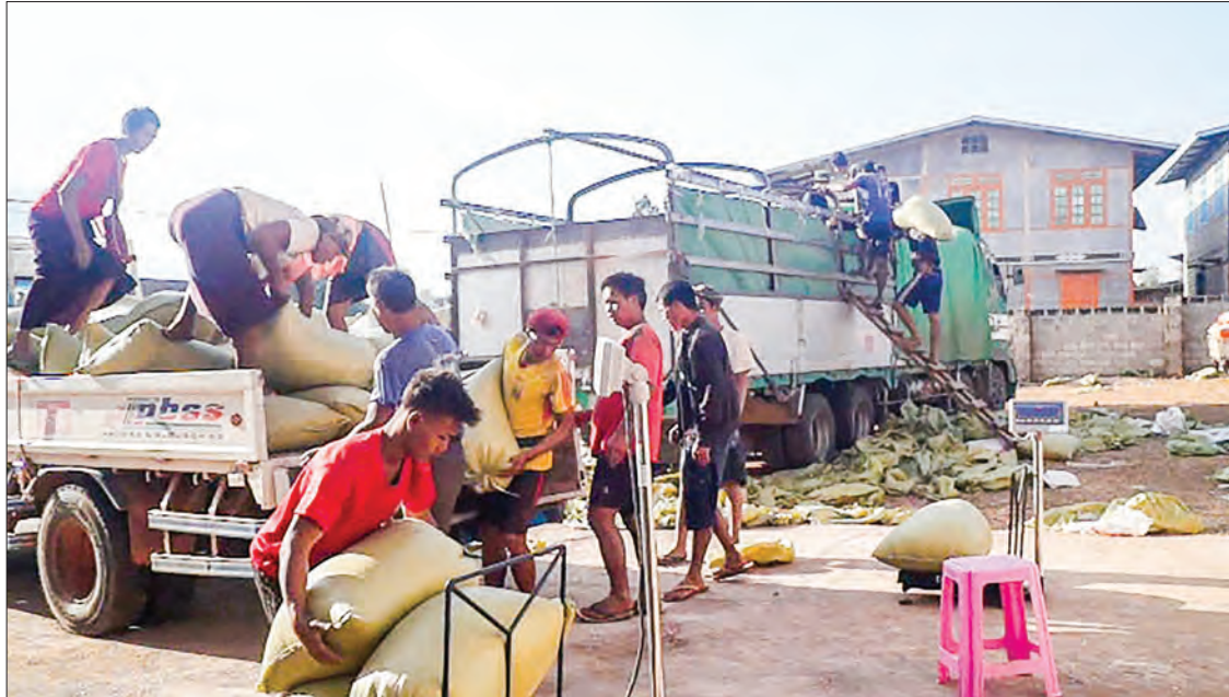
Workers are seen loading corns onto lorries in Pinlaung Township.

“CP Company provided corn seeds and fertilizer with zero interest and also disseminated know-hows of quality corn cultivations. Furthermore, they also share harvesting methods to improve corn standards. The corn procurement department also offered high price to increase the growers’ benefits,” said U Khun