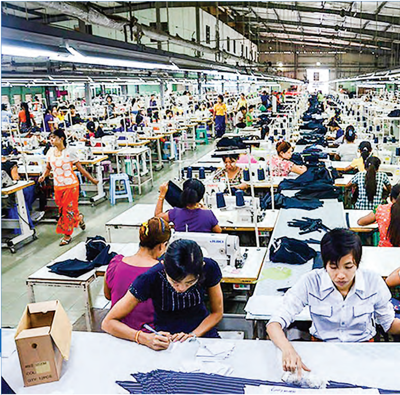
Workers are seen on a production line at a garment factory in Hlinethayar Township on outskirts of Yangon in 2019.

E ASTERN Development International (Myanmar) and Dongzhan Textile Group, a Chinese company, are set to jointly develop a textile industrial cluster worth over US$371 million in Sagaing Region. The two companies will work with the private sector on all stages of construction of the project, making it the first textile-based industrial zone in Myanmar.