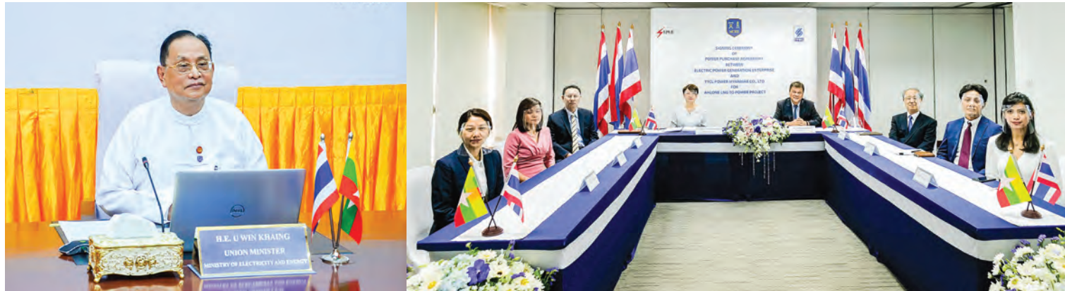
Union Minister U Win Khaing joins the signing ceremony of power purchase agreement with TTCL Power Myanmar Co., Ltd. on 19 January.

MINISTRY of Electricity and Energy signed a power purchase agreement in Nay Pyi Taw for the 365 MW LNG to Power Project to be implemented by TTCL Power Myanmar Co., Ltd in Ahlone Power Plant, Yangon Region, yesterday afternoon.