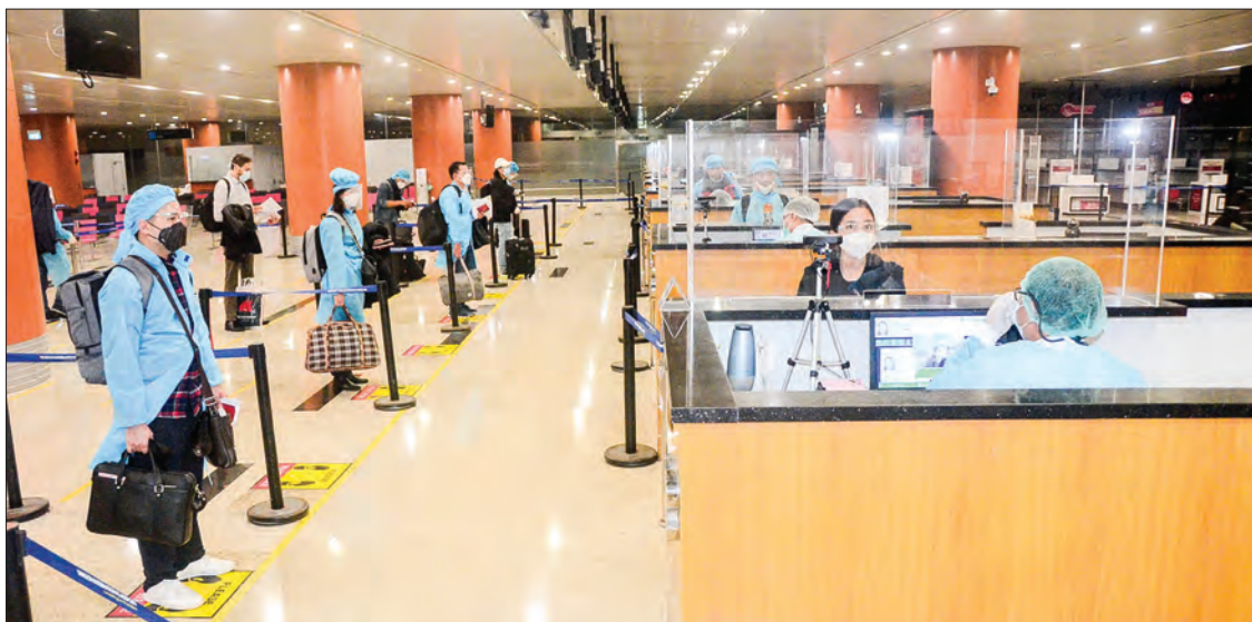
Myanmar returnees are seen at the Yangon International Airport on 19 January 2021.

THE 40th relief flight of Myanmar Airways International (MAI) organized by the Myanmar Embassy in Seoul landed at Yangon International Airport yesterday, carrying a total of 87 Myanmar nationals.