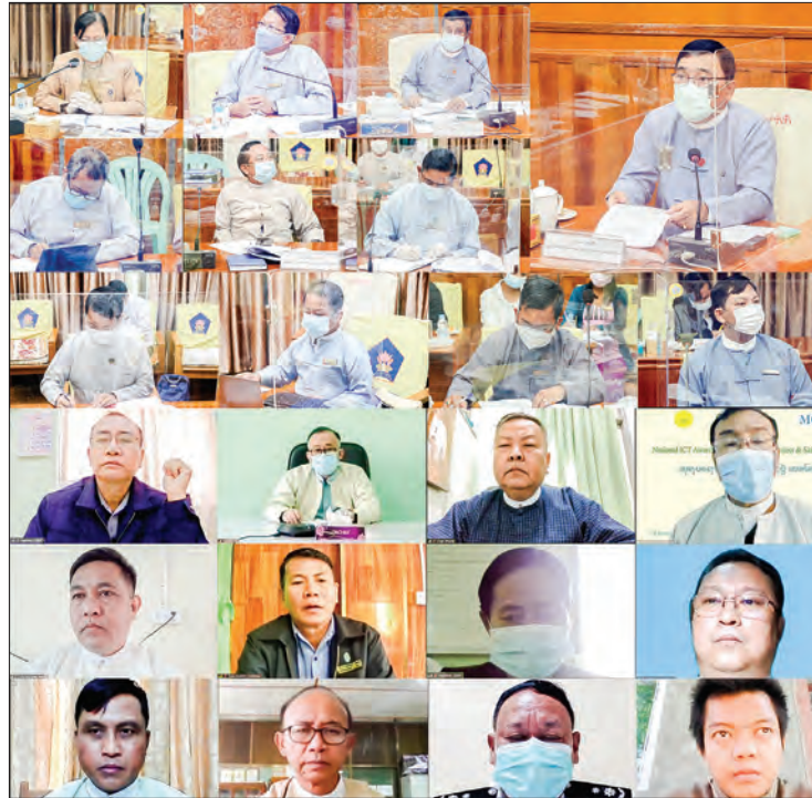
Union Minister Dr Win Myat Aye presides over mine-risk educating programmes meeting for Rakhine State on 18 January.

The Union Minister then discussed mine-risk educating programmes in Comprehensive Education Plan for Rakhine State and National Strategy on Resettlement of Internally Displaced Persons and Closure of IDP Camps, the risks of landmine and the explosive remnants of war and the im-