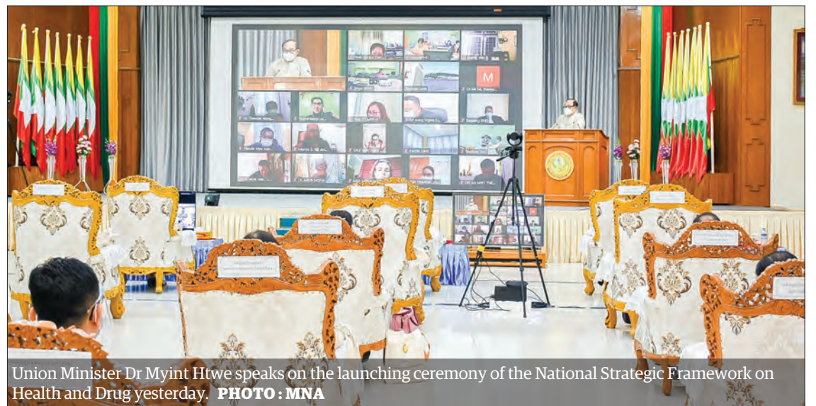
Union Minister Dr Myint Htwe speaks on the launching ceremony of the National Strategic Framework on Health and Drug yesterday.