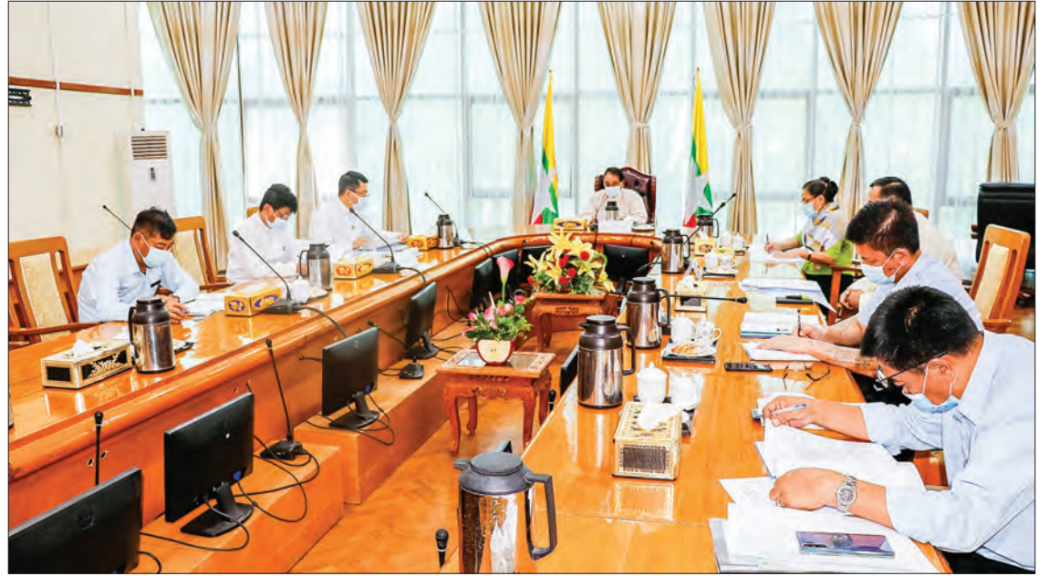
Union Minister Dr Than Myint chairs the first meeting 2021 of Motor Vehicles Importing Supervisory Committee on 12 January 2021.

A total of 123 civil servants were allowed to import vehicles from abroad from 18 December, 2020 to 7 January, 2021 and the Union Minister said to help those people in buying automobiles