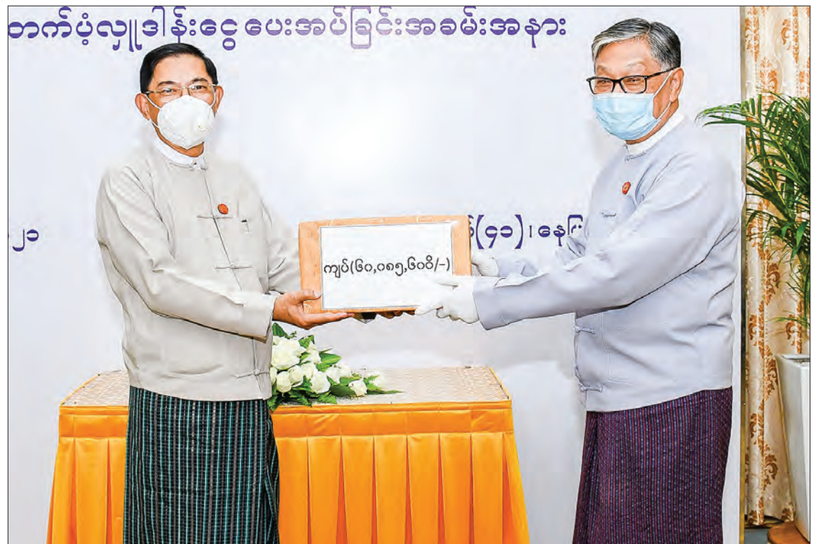
Union Minister U Kyaw Tint Swe presents the cash donation to Union Minister U Min Thu for IDPs in Rakhine State, on 12 January 2021.

He said his Ministry would do the best to implement the administration processes required in IDP camps in other states and regions as well as in the Rakhine State Development processes and expressed words of thanks