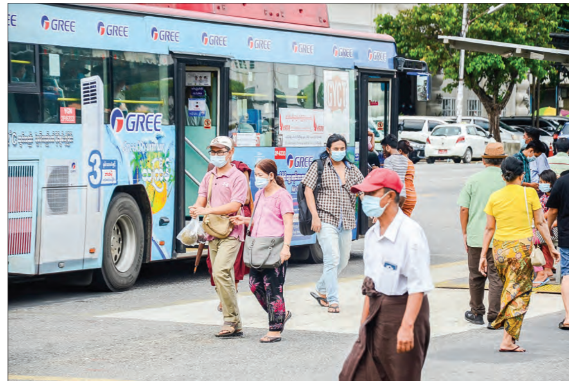
People wearing face masks walk in downtown Yangon, on 10 January, 2021.

With regards to vaccinations patience will be the key word. Developed countries have bought up vaccines in bulk, leaving developing countries like Myanmar at the end of the line.