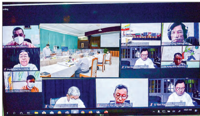
MNREC Union Minister presides over the sixth meeting of the National-level Management on Coastal Resources Work Committee on 12 January 2021.

THE National-level Management on Coastal Resources Work Committee held its 6 th meeting yesterday to discuss conservation of natural resources and ecosystem along the Myanmar coastal areas.