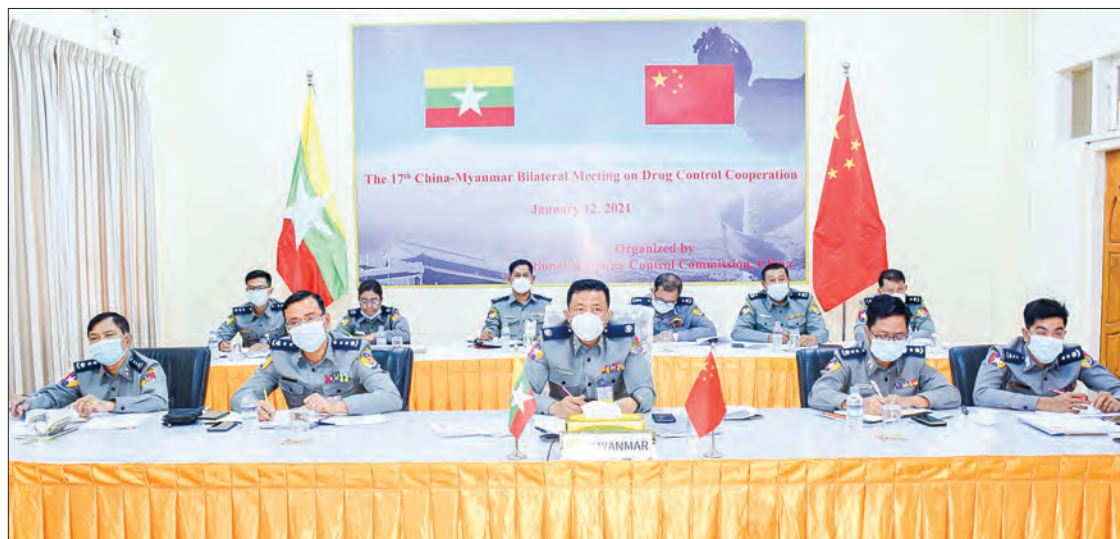
Myanmar and China hold the 17 th bilateral meeting on drug control cooperation through videoconferencing on 12 January 2021.