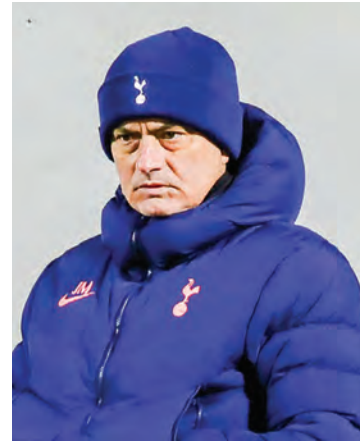
Tottenham boss Jose Mourinho.

The Fulham boss criticised the decision, with their game