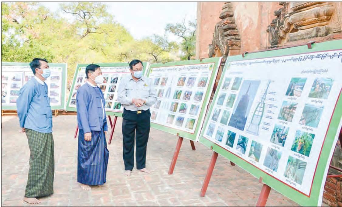
Union Minister Thura U Aung Ko inspects the maintenance and renovation works at Bagan temples on 12 January 2021.

UNION Minister for Religious Affairs and Culture Thura U Aung Ko, along with Directors-General for Department of Religious Affairs and the Department of Archaeology and National Museum,