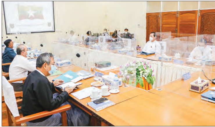
Union Minister U Thein Swe chairs meeting of Permanent Residency Implementation Central Committee on 12 January.

During the meeting, Union Minister U Thein Swe talked