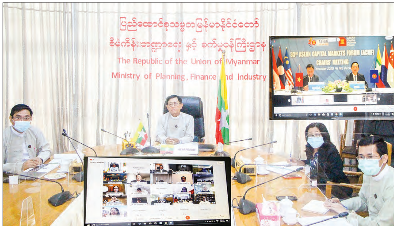
Deputy Minister U Maung Maung Win participates in the 33rd Chairs' Meeting of ACMF on 9 December via videoconference.

The Securities and Exchange Commission of Myanmar