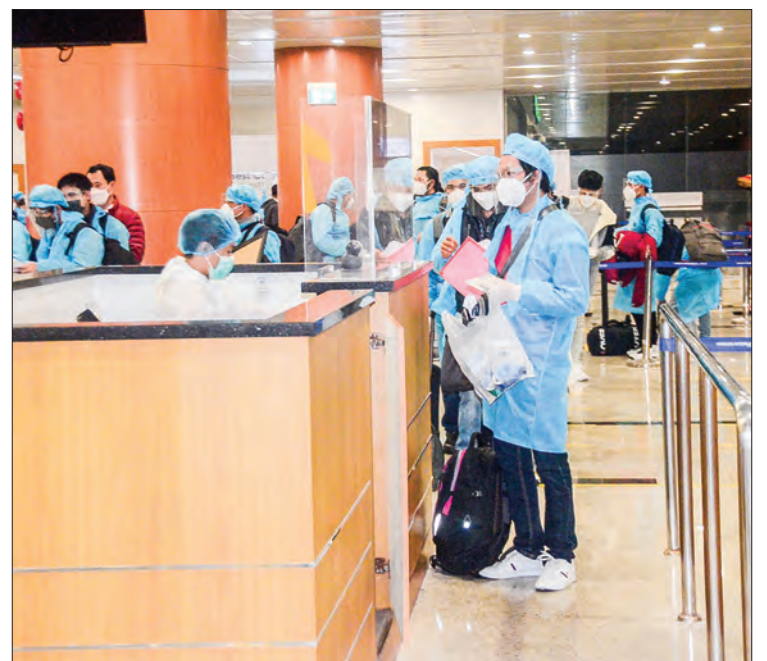
Returnees go through immigration process at the Yangon International Airport yesterday.