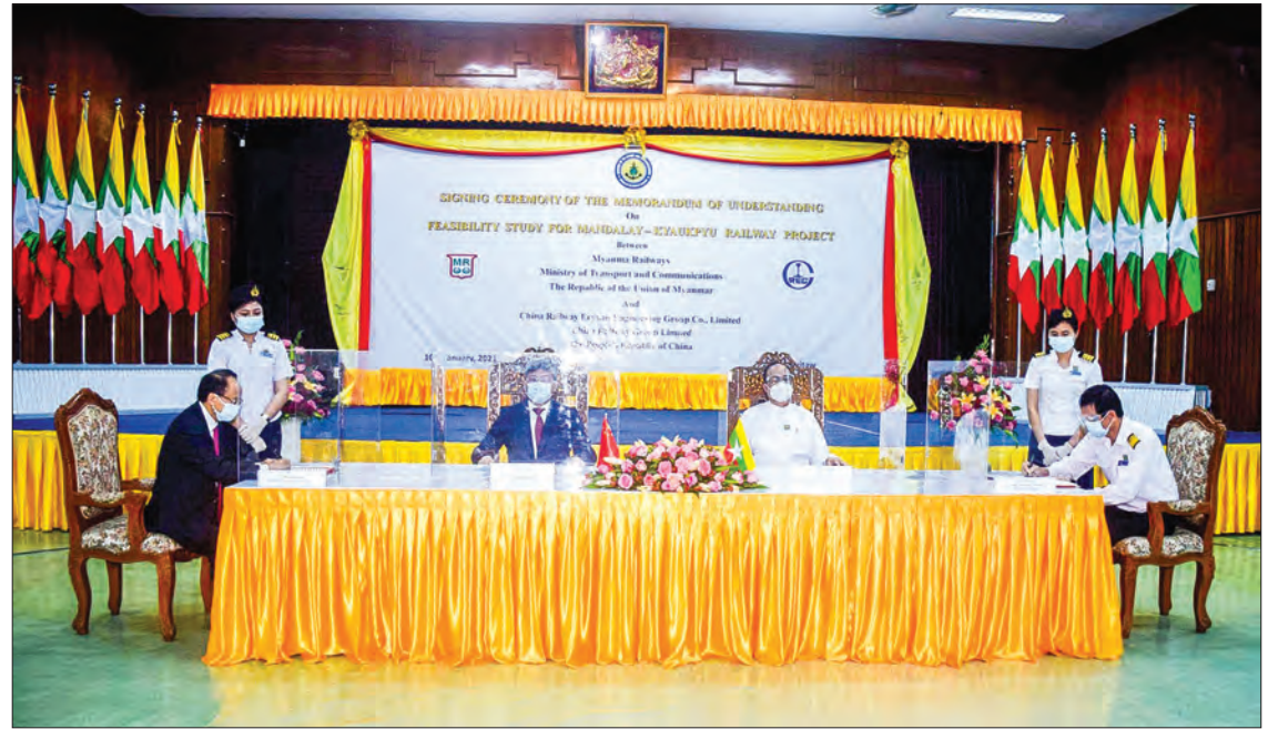
The Myanma Railways acting Managing Director and the Chief Representative of the CREEC Myanmar sign and exchange the MoU to conduct a feasibility study of Mandalay-Kyaukpyu Railway on 10 Jan 2021.

By connecting railways between China and Myanmar by building railroads inside Myanmar, it will connect Myanmar with big Eurasia market of 1.4 billion