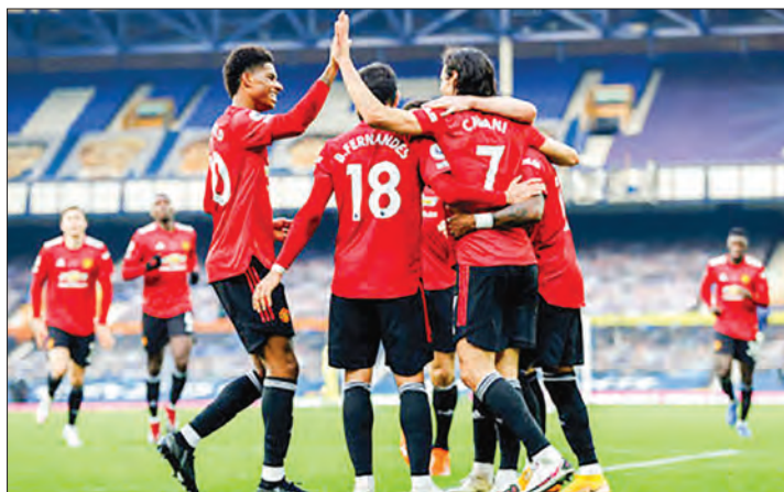
FILE: Manchester United striker Edinson Cavani celebrates scoring his team's third goal with teammates during the English Premier League football match between Everton and Manchester United at Goodison Park in Liverpool, north-west England on 7 November 2020.

The fourth round ties will be played across the weekend of 22 to 25 January with the fifth round taking place between 9 to 11 February.—AFP ■