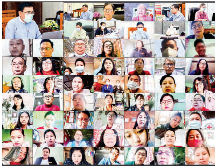
Union Minister Dr Win Myat Aye presides over online training programme for Community COVID Volunteers on 12 January.

MINISTRY of Social Welfare, Relief and Resettlement held an online training programme for Community COVID Volun-