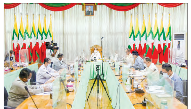
Union Minister Nai Thet Lwin joins the meeting to hold 3 rd Ethnic Culture Festival 2021 online, on 12 January 2021.

Deputy Minister U Hla Maw Oo said he hopes the festival will become more alive through the experience of relevant departments although the ethnic