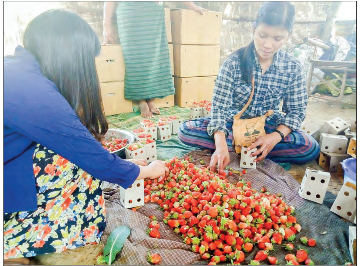
Women are seen sorting and packing strawberries.

"When we looked back the previous years, the price of strawberries plunged to K1,200 in March, and it climbed up