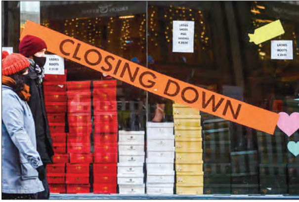
A couple wearing face masks walks past shop windows with ‘Closing Down’ stickers in Dublin, Ireland.

The FSB, meanwhile, said that Britain’s financial support measures