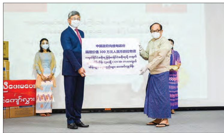
Union Minister accepts the donation of medical devices from the People's Republic of China on 12 January 2021.

THE People's Republic of China donated yuan250,000 worth of COVID-19 medical supplies to the Ministry of Health and Sports