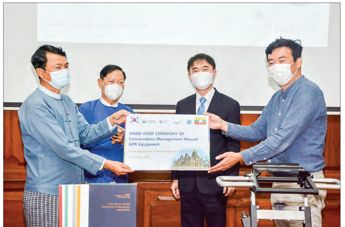
Union Minister Thura U Aung Ko accepts the Conservation Management-Manual GPR Equipment presented by the Republic of Korea on 11 January 2021.

The Union Minister, the ambassador and officials looked into the laboratory of Bagan archae-