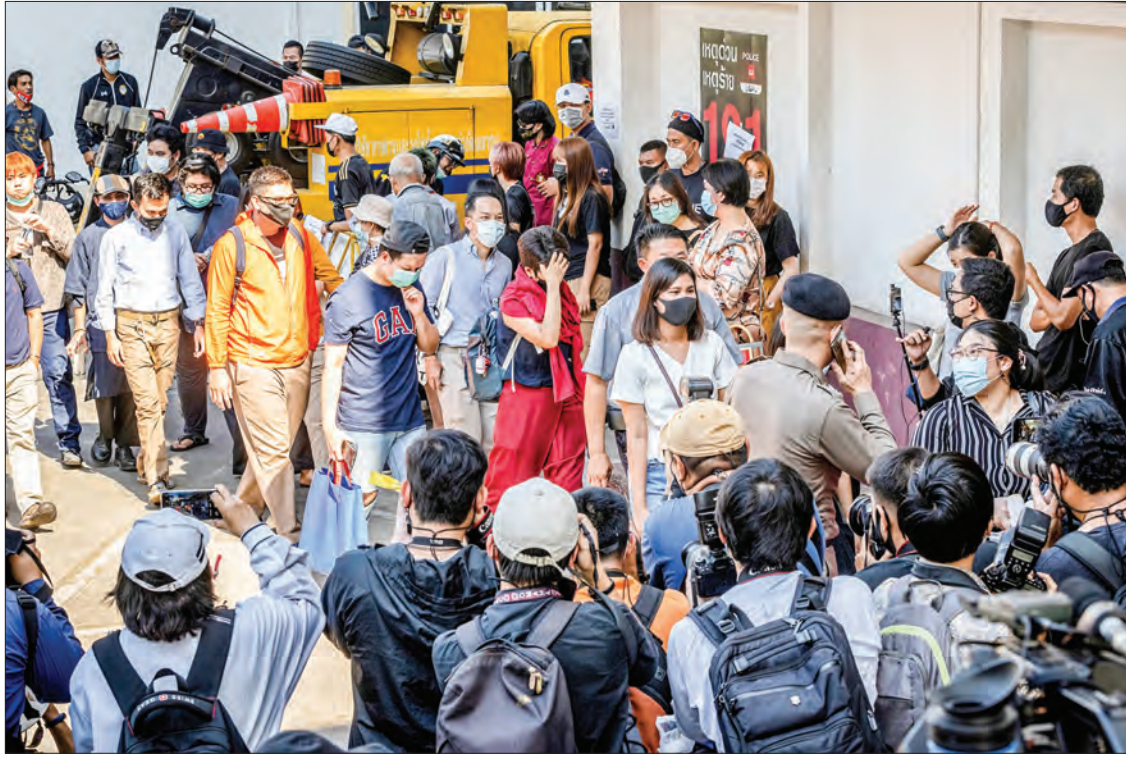
Thai activists who were demanding reforms to the monarchy, arrive at a police station in Bangkok on January 7, 2021, to face charges involving section 112, the kingdom's tough royal defamation law.

THAI authorities on Monday charged four democracy activists with royal defamation, with the protest movement rocking the kingdom put on hold because of a spike in coronavirus cases.