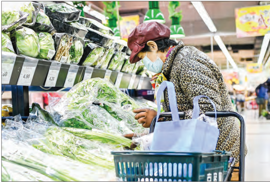
A woman picks up vegetables at a market in Beijing on December 17, 2020.

On Monday, Dong said that consumer demand was picking up due