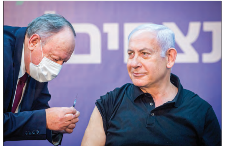
Israeli Prime Minister Benjamin Netanyahu receives the second dose of the coronavirus disease (COVID-19) vaccine at Sheba Medical Centre in Ramat Gan, near the coastal city of Tel Aviv, on January 9, 2021.