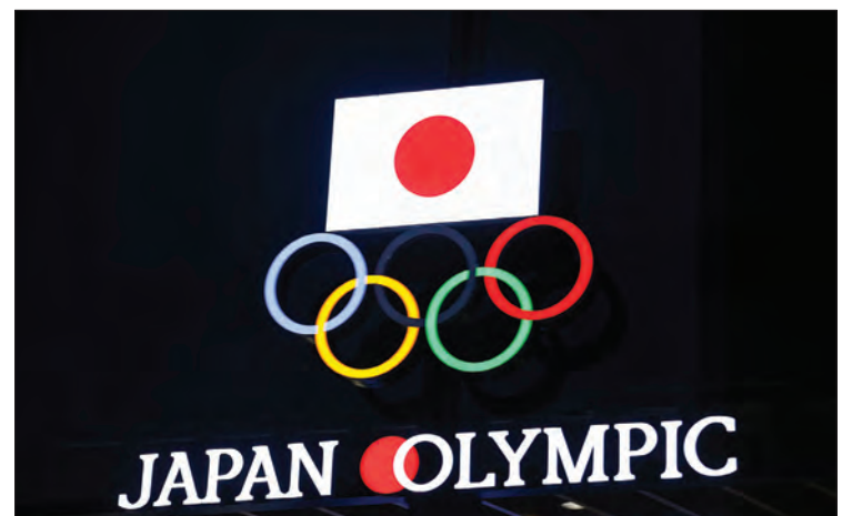
Olympic Rings and a Japan flag are seen on the Japan Olympic Museum building in Tokyo on January 8, 2021, as Tokyo Olympics organizers insisted that the coronavirus-postponed Games will still go ahead despite Japan declaring a state of emergency less than 200 days before the opening ceremony.

The government previously declared a state of emergency covering Tokyo and six other prefectures in early April last year and expanded it to the country's 47 prefectures later that month. It was lifted in steps in May as coronavirus cases subsided.—AFP ■