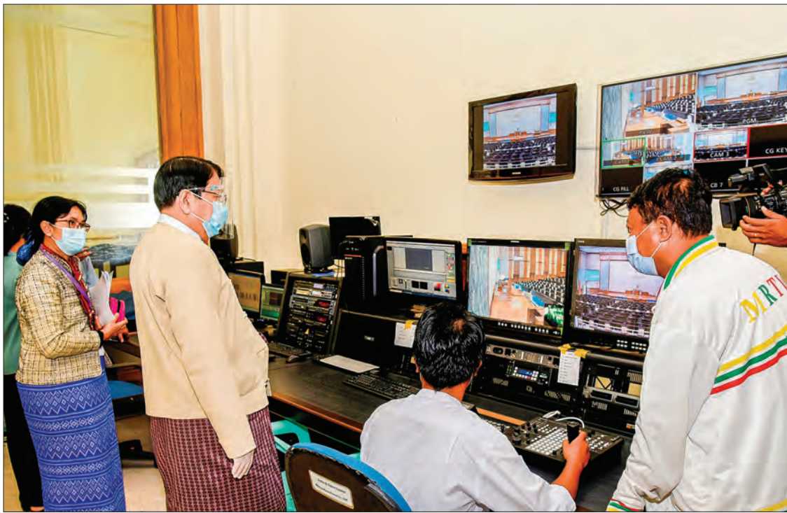
Union Minister Dr Pe Myint inspects the installation of broadcast equipment, control rooms and media corners at the buildings of Amyotha Hluttaw, Pyidaungsu Hluttaw and Pyithu Hluttaw in Nay Pyi Taw on 11 January 2021.