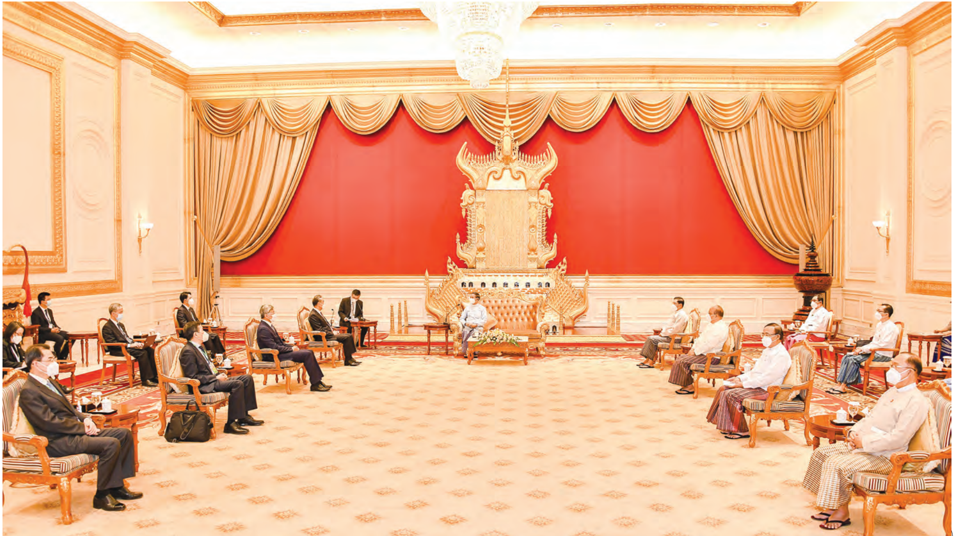
President U Win Myint receives the Chinese delegation led by State Councilor and Foreign Minister Mr Wang Yi at the Hall for Envoys of the Presidential Palace in Nay Pyi Taw.