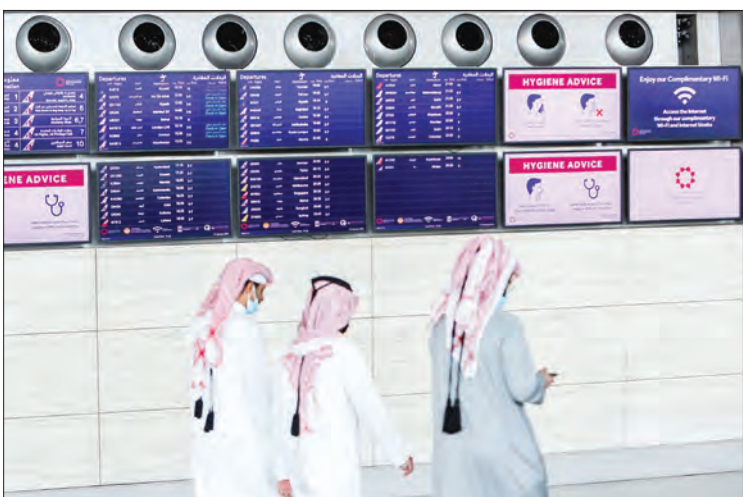
Three men walk past the announcement boards at the departure hall of Qatar's Hamad International Airport near Doha on January 11, 2021.