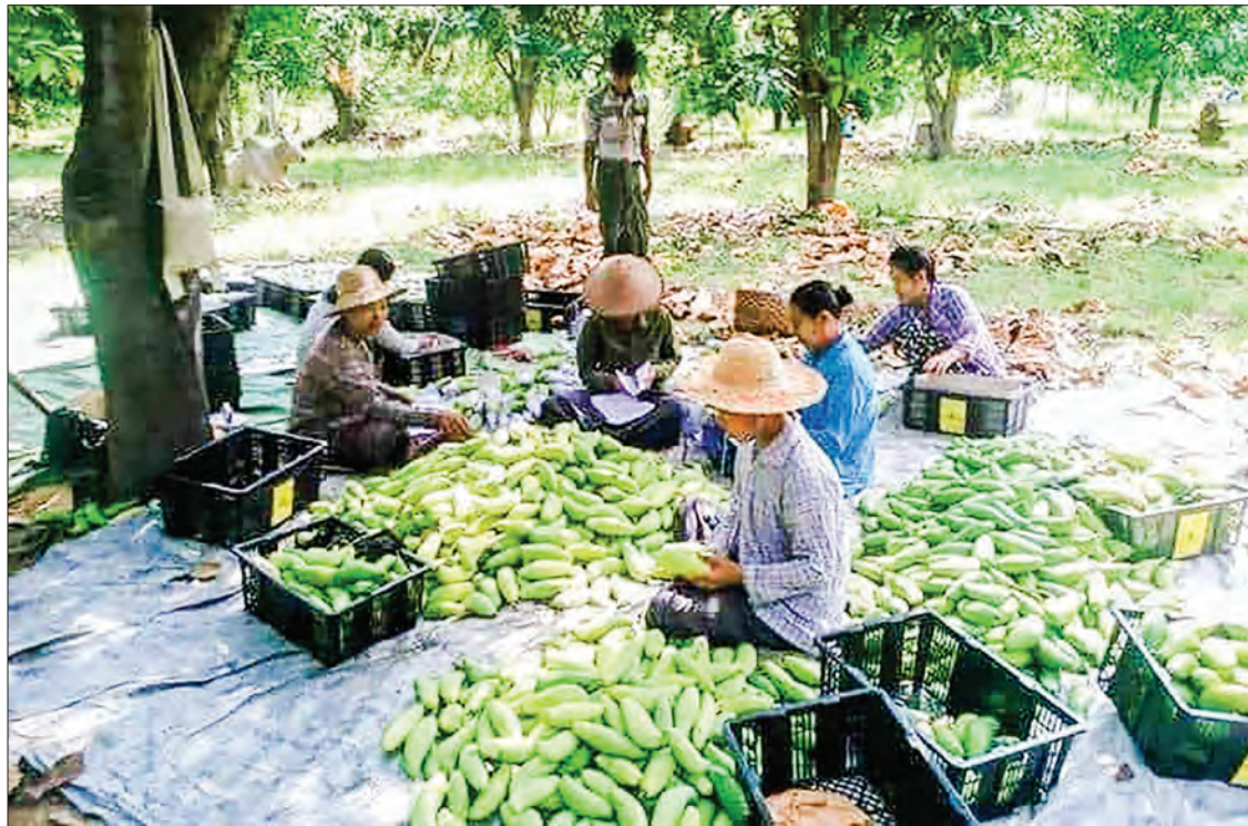
Workers are seen sorting mangoes at a mango farm.