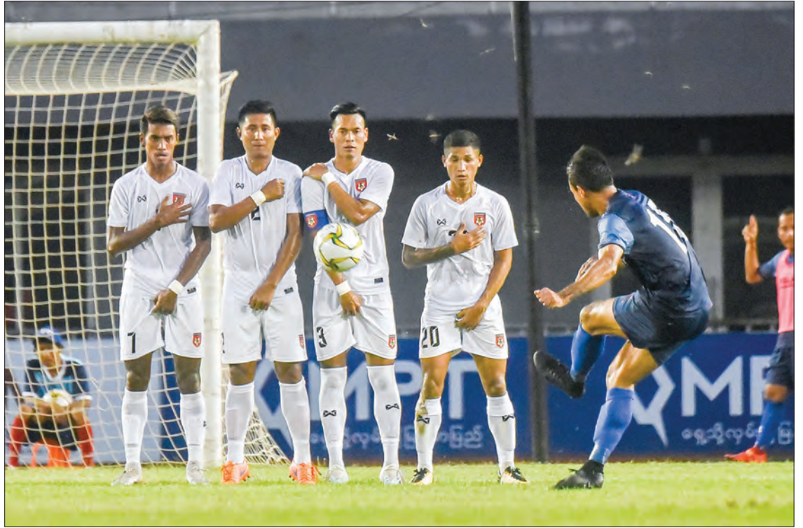
Myanmar national team players (in white) attempt to block the free kick during an international friendly match against Nepal at Mandalay Thiri Stadium in Mandalay on 7 November 2019.