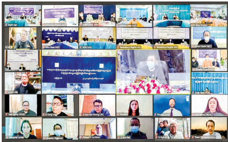
Union Attorney-General U Tun Tun Oo participates in the virtual meeting of the Rule of Law Centre and Justice Sector Coordinating Body on 11 January 2021.