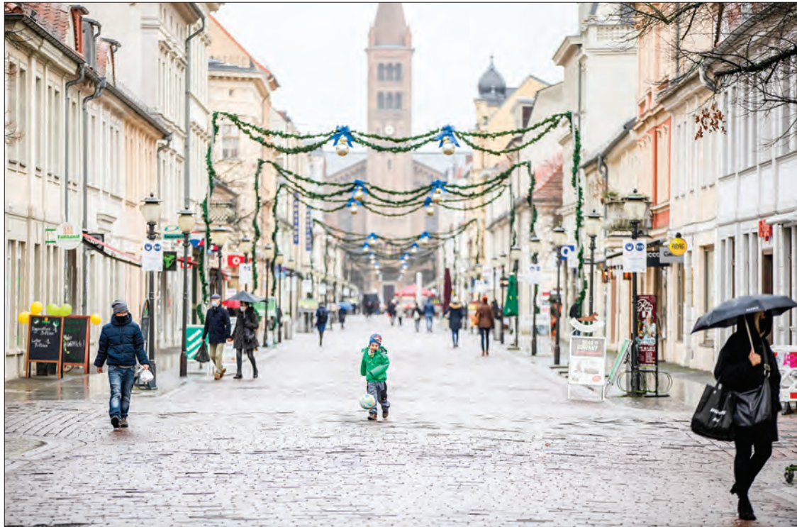
A child plays football as people walk past closed stores on the Brandenburger Strasse pedestrian area in the centre of Potsdam, eastern Germany on January 6, 2021 amid the ongoing novel coronavirus / COVID-19 pandemic.

The pandemic has killed more than 1.9 million people worldwide, according to a tally compiled by AFP using official sources and information from