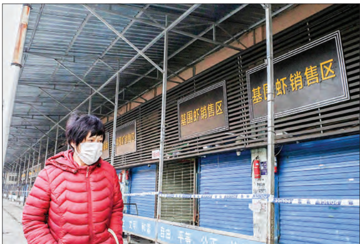
(FILES) This file photos shows a woman walking in front of the closed Huanan wholesale seafood market in the city of Wuhan, Hubei province in China.