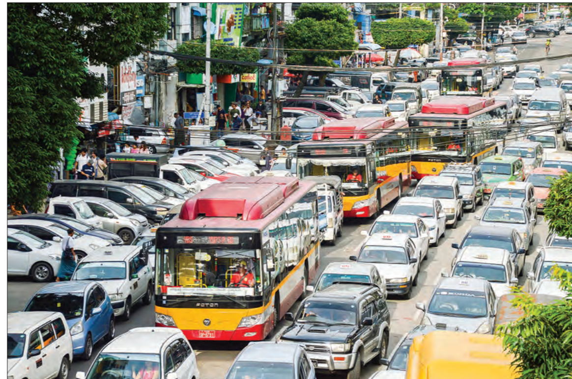
A traffic congestion in Yangon in 2019.

In quite a number of large cities around the World, the "taxes" on owning and operating a private vehicle can be high. This is of course a deterrent to owning private cars. Another is to improve public transportation so that it would be more convenient to travel in the city