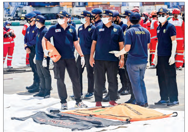
Indonesian police stand by a body bag containing the remains of a victim at Tanjung Priok port, north of Jakarta, on January 11, 2021, during search and rescue operations off the coast for the Sriwijaya Air flight SJ182 Boeing 737-500 passenger jet which crashed into the Java Sea minutes after takeoff on January 9.