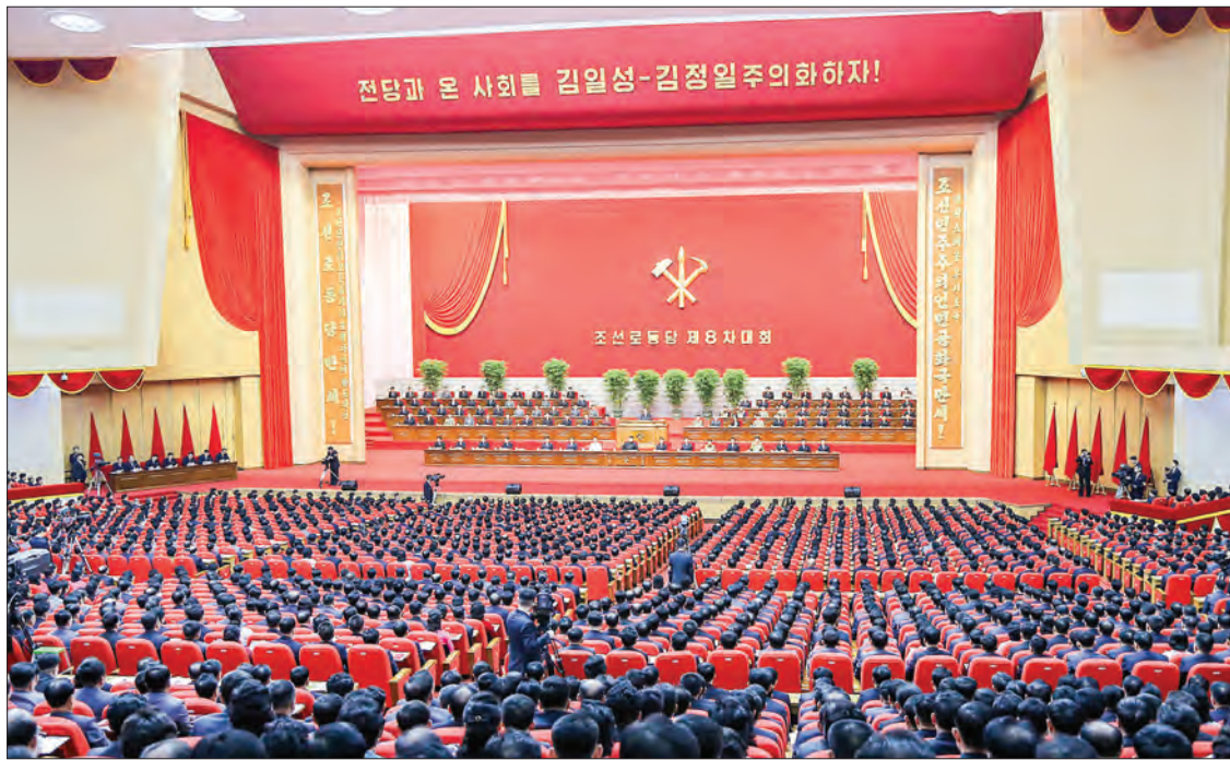
This picture taken on January 10, 2021 released from North Korea's official Korean Central News Agency (KCNA) on January 11, 2021 shows North Korean leader Kim Jong Un (C) attending the 8th Congress of the Workers' Party of Korea (WPK) in Pyongyang.

The last such gathering five years ago had named Kim as party chairman in what was largely seen as a formal corona-