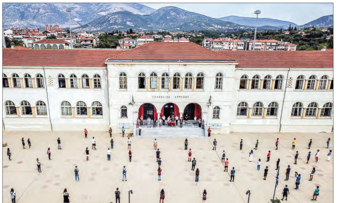
(FILES) High school students keep social distances on the first day of class of the new academic year in Drama, on 14 September 2020, amid the crisis linked with the covid-19 pandemic caused by the novel coronavirus. PHOTO: AFP

said. More than 420,000 doses will be available this month, he said. SOURCE: AFP