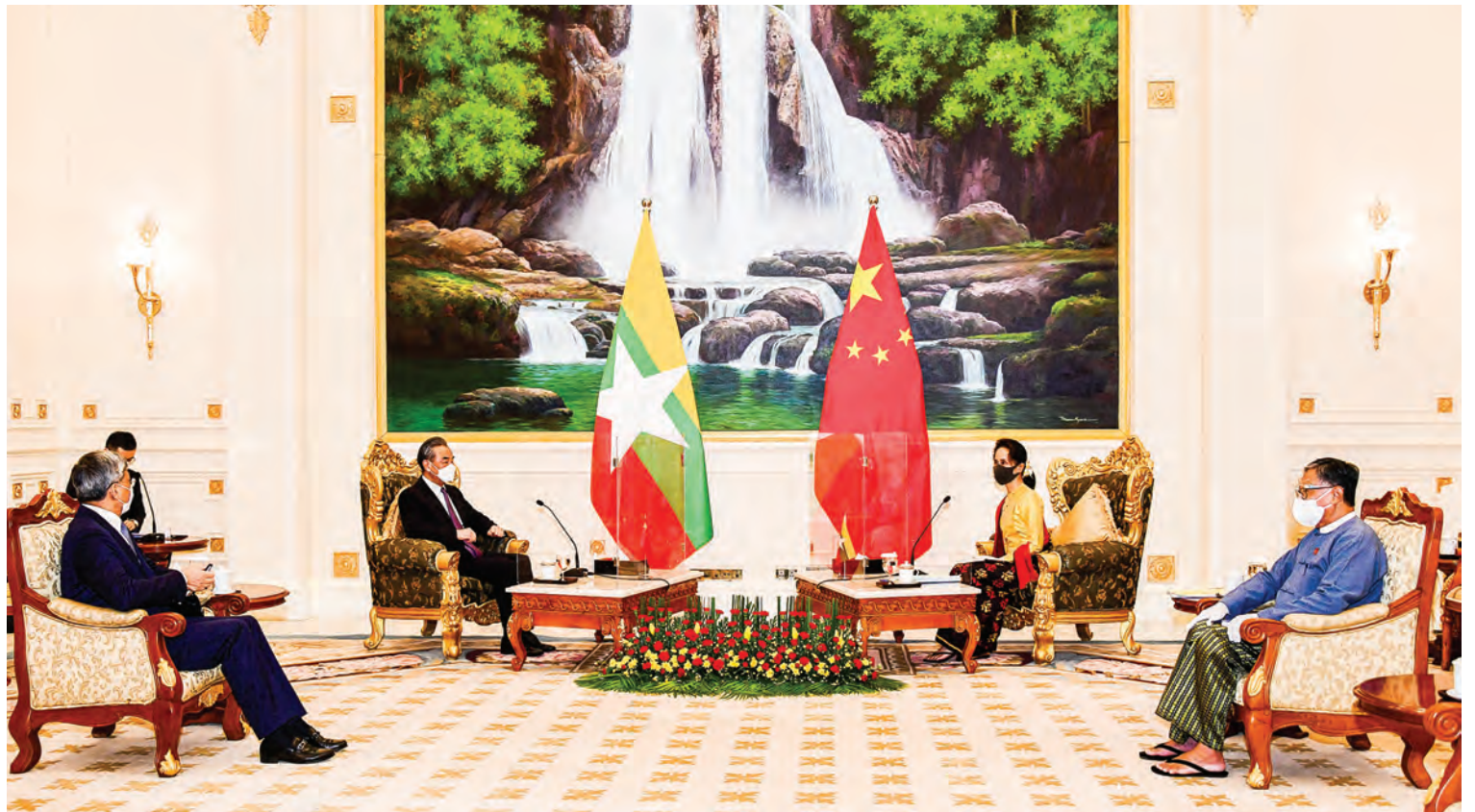
State Counsellor Daw Aung San Suu Kyi receives State Councilor and Foreign Minister Mr Wang Yi and party at the Hall for Envoys of the Presidential Palace in Nay Pyi Taw.

Chinese delegation, the two sides signed and exchanged the Agreement on Economic and Technical