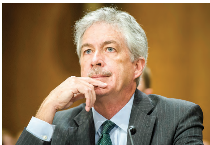
(FILES) In this file photograph taken on March 6, 2014, then Deputy Secretary of State William Burns testifies on the current situation in Syria and the Ukraine to the Senate Foreign Relations Committee on Capitol Hill in Washington, DC.

"But the reality is that after 35 years without sustained