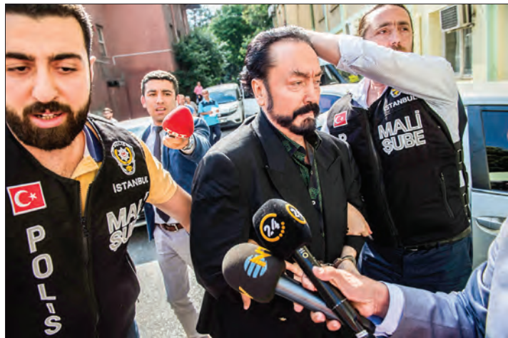
Turkish police officers escort televangelist and leader of a sect, Adnan Oktar (C) on July 11, 2018, in Istanbul, as he is arrested on fraud charges.