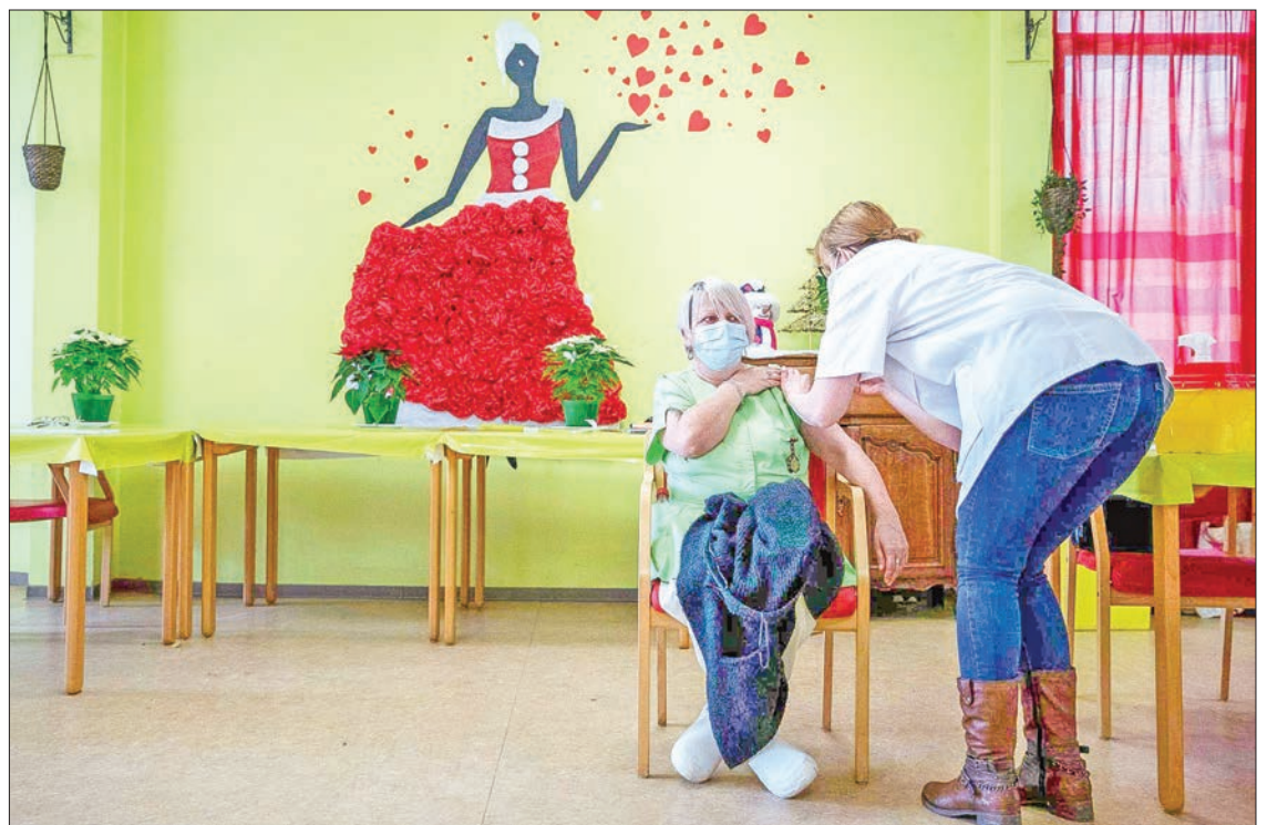
The Belgian government says it is updating its COVID-19 vaccination roll-out plan which has been widely criticized for being slow.

By negotiating on behalf of - and in coordination with - the EU's 27 member countries, "it reduces cost and it gives us a