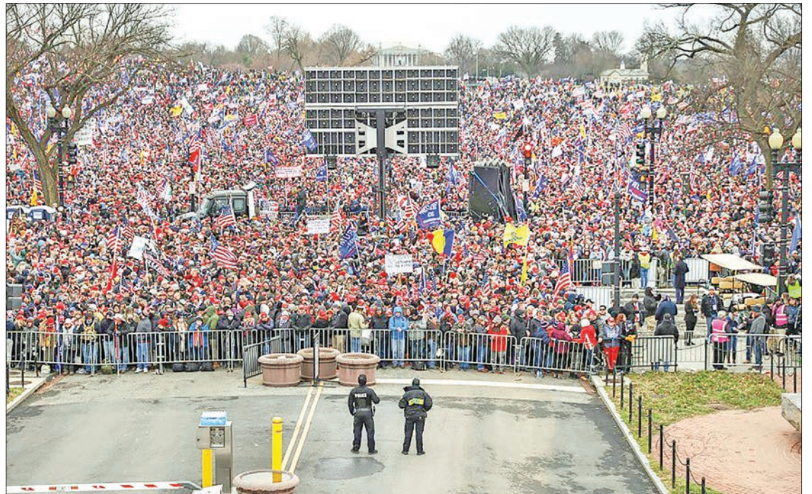
Crowds arrive for the "Stop the Steal" rally on Jan. 6, 2021 in Washington, DC. Trump supporters gather in the nation's capital to protest the ratification of President-elect Joe Biden's Electoral College victory over President Trump in the 2020 election.

Through slavery and segregation, Civil War and Cold War, US presidents have often hailed their democracy as exceptional, what Ronald Reagan called the