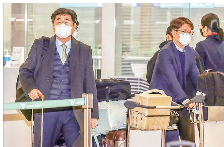
The South Korean delegation led by Koh Kyung-sok (L) is heading to Iran to negotiate the release of an oil tanker and its crew seized in strategic Gulf waters.

"I plan to meet my counterpart at the Iranian foreign ministry and will meet others through various routes if it will help efforts to resolve the issue of the ship's seizure," said Koh Kyung-sok, the chief delegate, before boarding