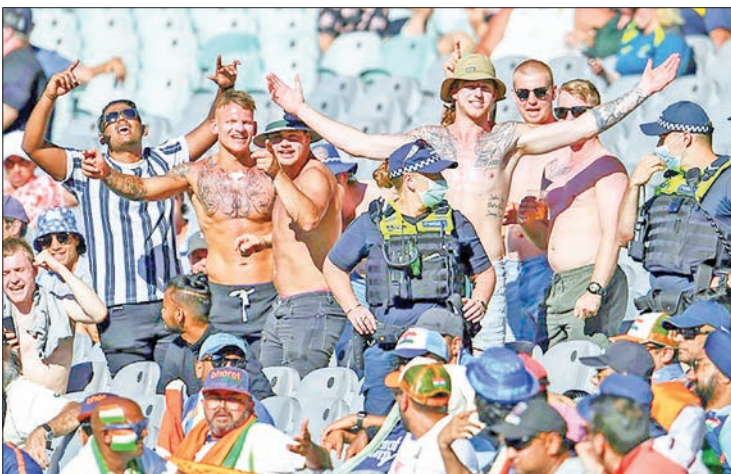
Fans chant at the Melbourne Cricket Ground last month. A spectator who was at the showpiece Boxing Day Australia-India Test has tested positive for coronavirus and fans seated nearby have been urged to get Covid tested and isolate.

“The MCG is being investigated as a potential source for the infection,” Victoria’s Depart-