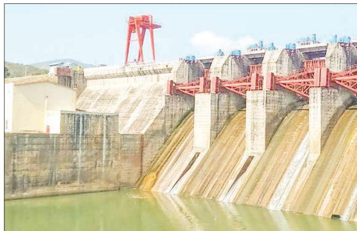
Picture shows Hsedawgyi Dam in Madaya Township, Mandalay Region.

Now, the Hsedawgyi Dam has entirely stored the water. At the end of December, the Hsedawgyi dam has 358,260 acres of remaining water level with 84,000 acres of dead water level and 274,260 acres of usable water. Depending upon the remaining water level, the department targeted to provide full water to 67,053 acres of summer paddy and 295 acres of summer sesame for the