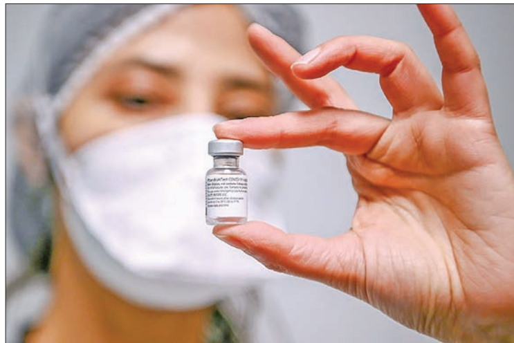
A health worker holds a vial containing the Pfizer/BioNTech Covid-19 vaccine in Aulnay-sous-Bois, France.

By comparison, flu vaccines cause about 1.3 anaphylaxis