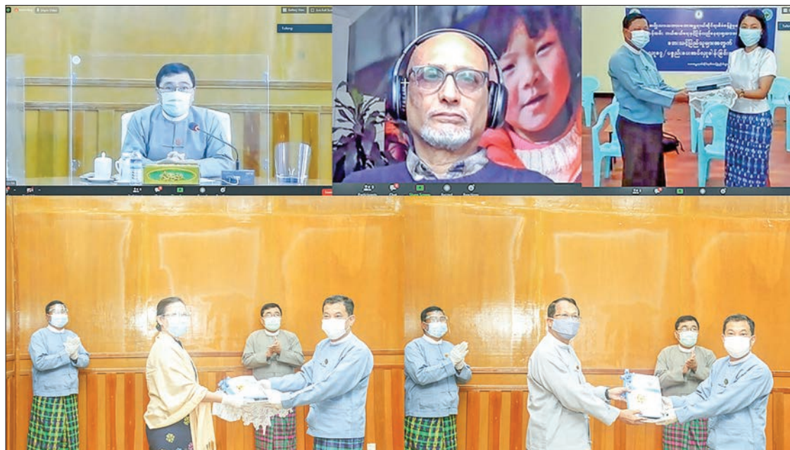
Union Minister Dr Win Myat Aye participates in the handover ceremony of communication tools for visually impaired and hearing impaired persons via videoconferencing on 7 January 2021.

The preventive measures and responses are also being carried out to overcome the