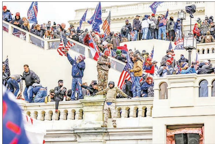
Pro-Trump supporters storm the U.S. Capitol following a rally with President Donald Trump on Jan. 6, 2021 in Washington, D.C. Trump supporters gather in the nation's capital to protest the ratification of President-elect Joe Biden's Electoral College victory over President Trump in the 2020 election.

Lawmakers later resumed the counting of the electoral votes that was halted for hours due to the chaos. They completed early Thursday the country's final step to affirm Biden as the winner of the November presidential election, and he will be sworn in on Jan. 20. But the scenes of protesters smashing windows and vandalizing offices in the Capitol seem to have tarnished the image of the United States, which has championed democracy around the world, putting Trump in the hot seat over his role in inflaming his supporters through unsubstantiated claims aimed at