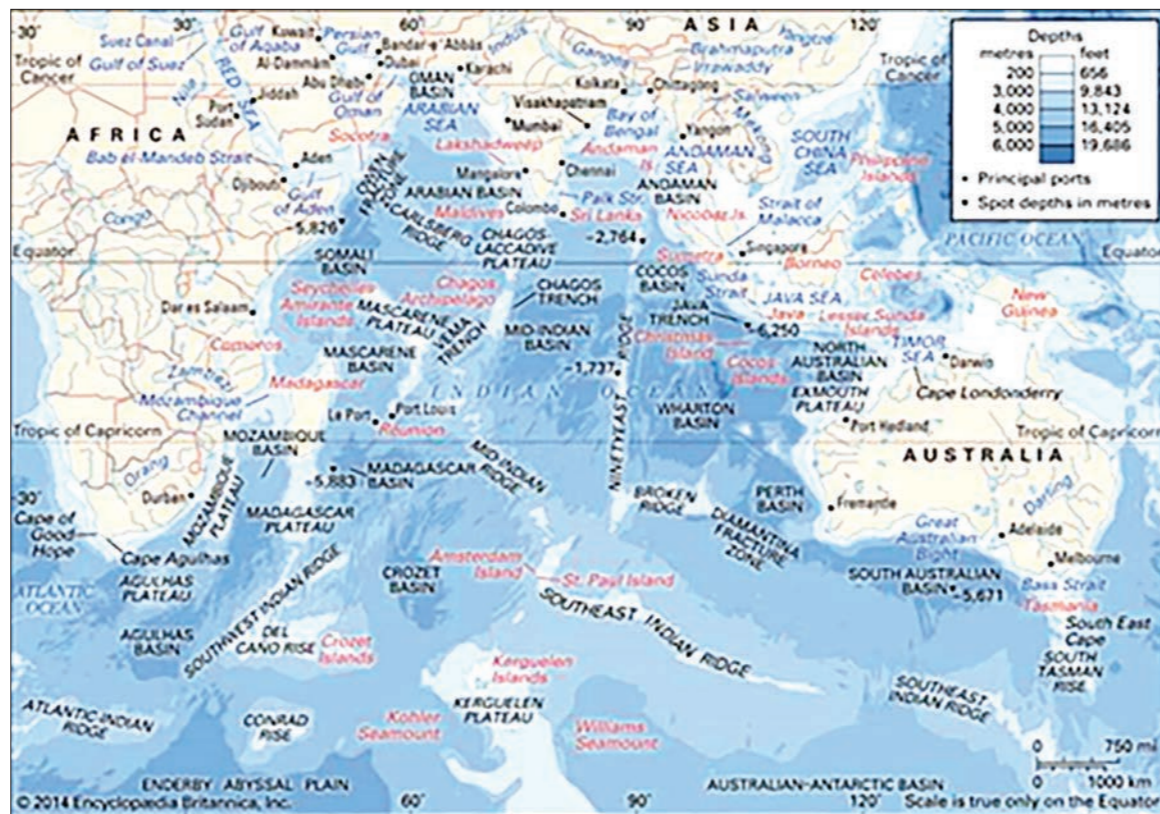
The Indian Ocean, with depth contours and undersea features.

By Than Htun (Myanmar Geosciences Society)