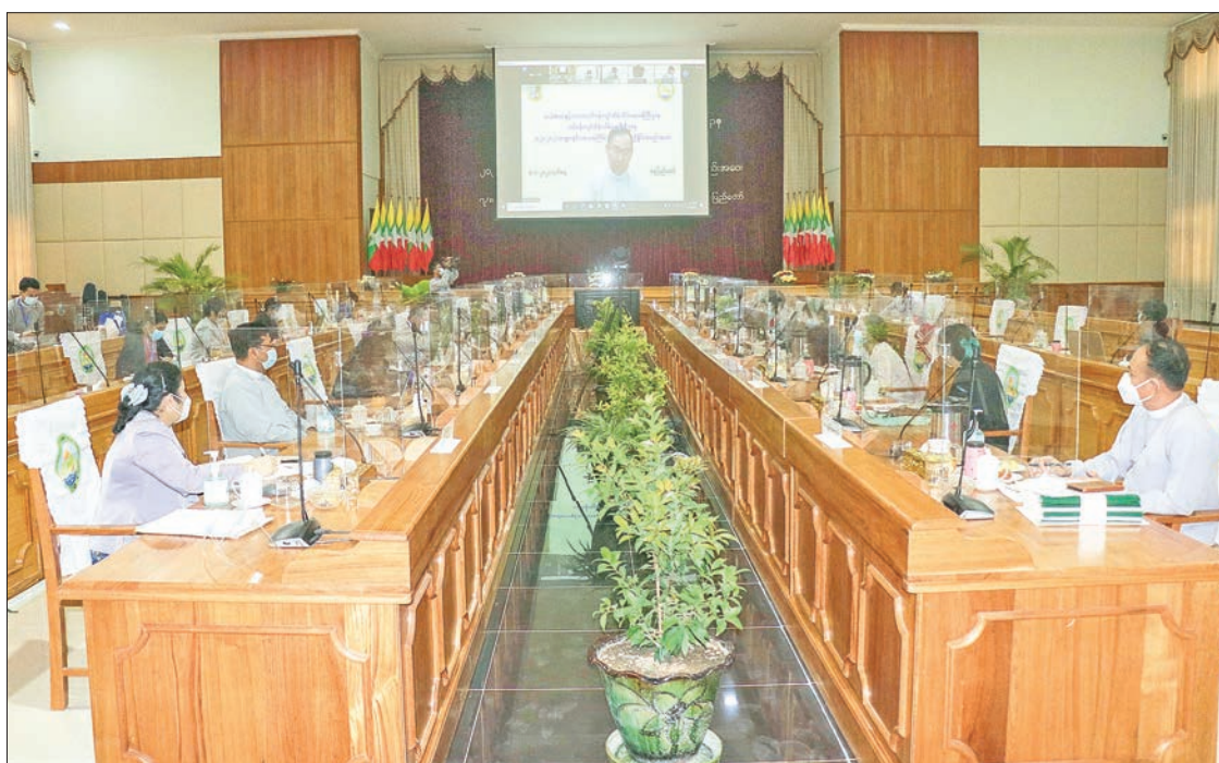
Union Minister U Ohn Win speaks at the virtual meeting of the Environmental Conservation Department on 7 January 2021.

The department was established in 2012-2013FY, it is now being operated with 1,411 staff with 15 Region/State offices, 45 District offices, and 7