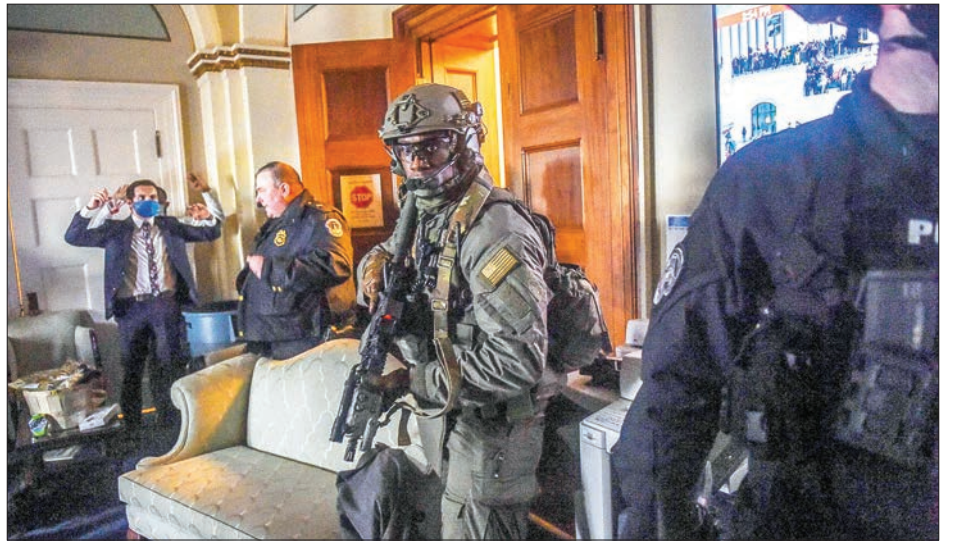
A congressional staffer holds his hands up while police secure the Capitol on Wednesday.

the White House later this month, but the normally ceremonial affair spiralled into mayhem.