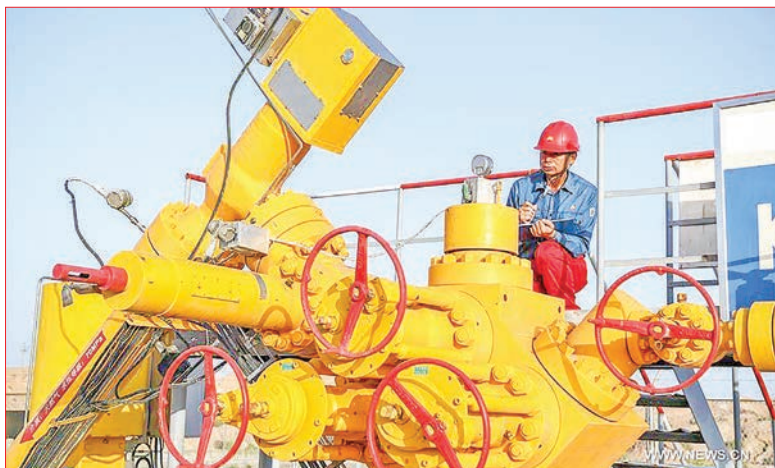
A staff member works at Kela-2 gas field of the Tarim Oilfield in Aksu, northwest China’s Xinjiang Uygur Autonomous Region, July 8, 2017.

THE Tarim oilfield branch of PetroChina, China’s largest oil and gas producer, said it has supplied over 270 billion cubic metres of natural gas to 15 provincial-level regions in China via the country’s West-to-East gas pipeline.