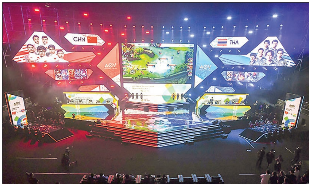
The Chinese e-sports team battles the Thai team at Arena of Valour, one of the six e-sports demonstration events at the 2018 Asian Games, in Jakarta, Indonesia, on August 26, 2018.

SHANGHAI—China has begun building a US$900 million (S$1.18 billion) facility it hopes will be the envy of e-sports and seal its push to make Shanghai the global capital of the fast-growing professional gaming industry.