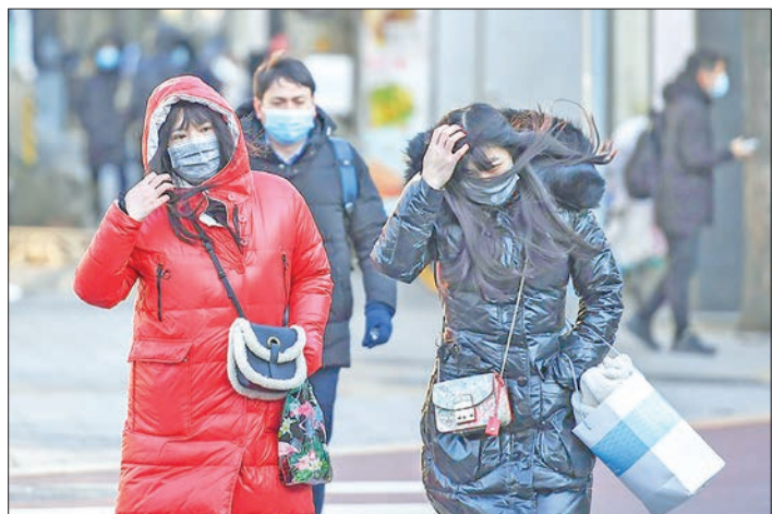
People walk on a street in Chaoyang District, Beijing, capital of China, Jan. 6, 2021.

TEMPERATURES in the Chinese capital plunged to their lowest for more than five decades on Thursday, as Beijing was hit by gale-force winds and bitter conditions.