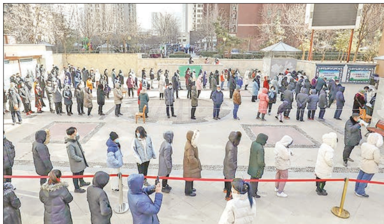
Residents wait in line for nucleic acid tests at a community in Qiaoxi District of Shijiazhuang, capital of north China’s Hebei Province, Jan. 6, 2021.

TRAVEL has been restricted to a northern Chinese city of 11 million people and schools closed as authorities Wednesday moved to snuff out a cluster of Covid-19 after dozens were infected.