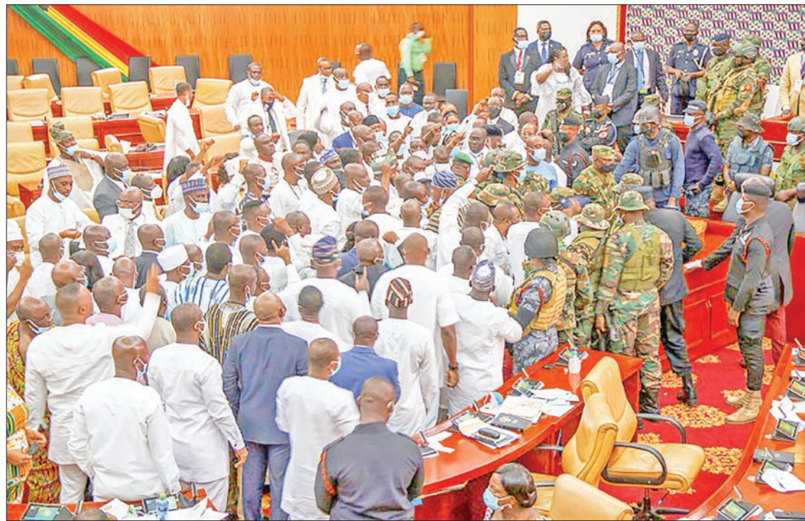
The mayhem erupted after a ruling party deputy tried to seize the ballot box during the vote for Ghana's parliament speaker.

GHANAIAN soldiers intervened in parliament to quell a clash between opposing parties in chaotic scenes overnight ahead of the body's swearing-in on Thursday.