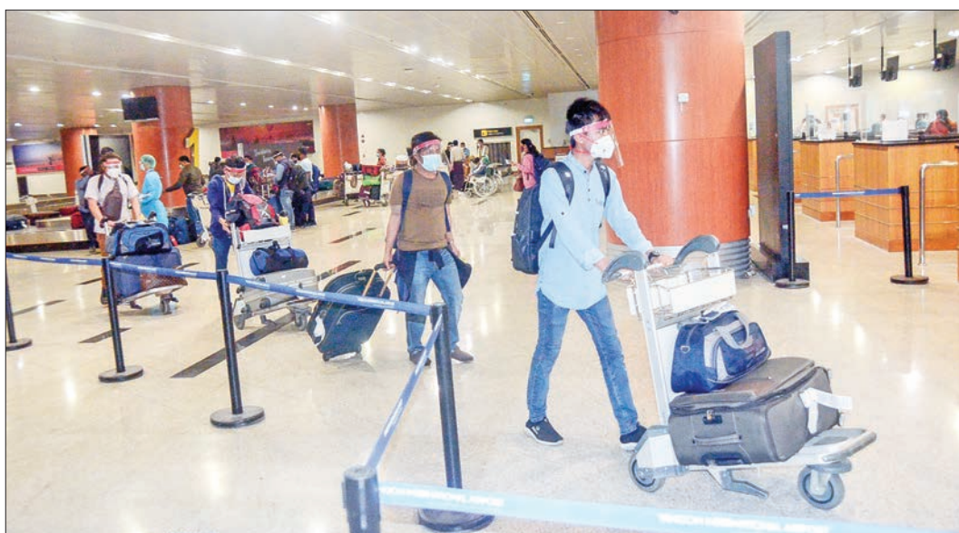
Myanmar returnees are seen at the Yangon International Airport on 7 January 2021.

THE relief flight of Air India organized by the Myanmar Embassy in New Delhi landed at Yangon International Airport bringing back a total of 44 Myanmar nationals after they were stranded in India due to the suspension of international flights, yesterday afternoon.