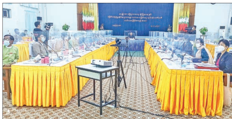
Work Committee on Drafting the National Land Law and Harmonization of Related Laws holds virtual meeting on 7 January 2021.

At the meeting, the committee's Chairperson Union Attorney-General U Tun Tun Oo said that seven sub-work-groups were formed to implement the work plan according to the decision of the second meeting of the committee. He continued that sub-work-groups are unable to conduct field visits and face-to-face meetings because of the COVID-19 pandemic, but are conducting non-face-to-face observations and online discussions. He said that the Work Committee sought