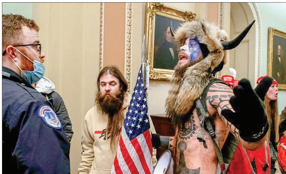
Supporters of outgoing US President Donald Trump stormed the US Capitol delaying certification of the presidential election.