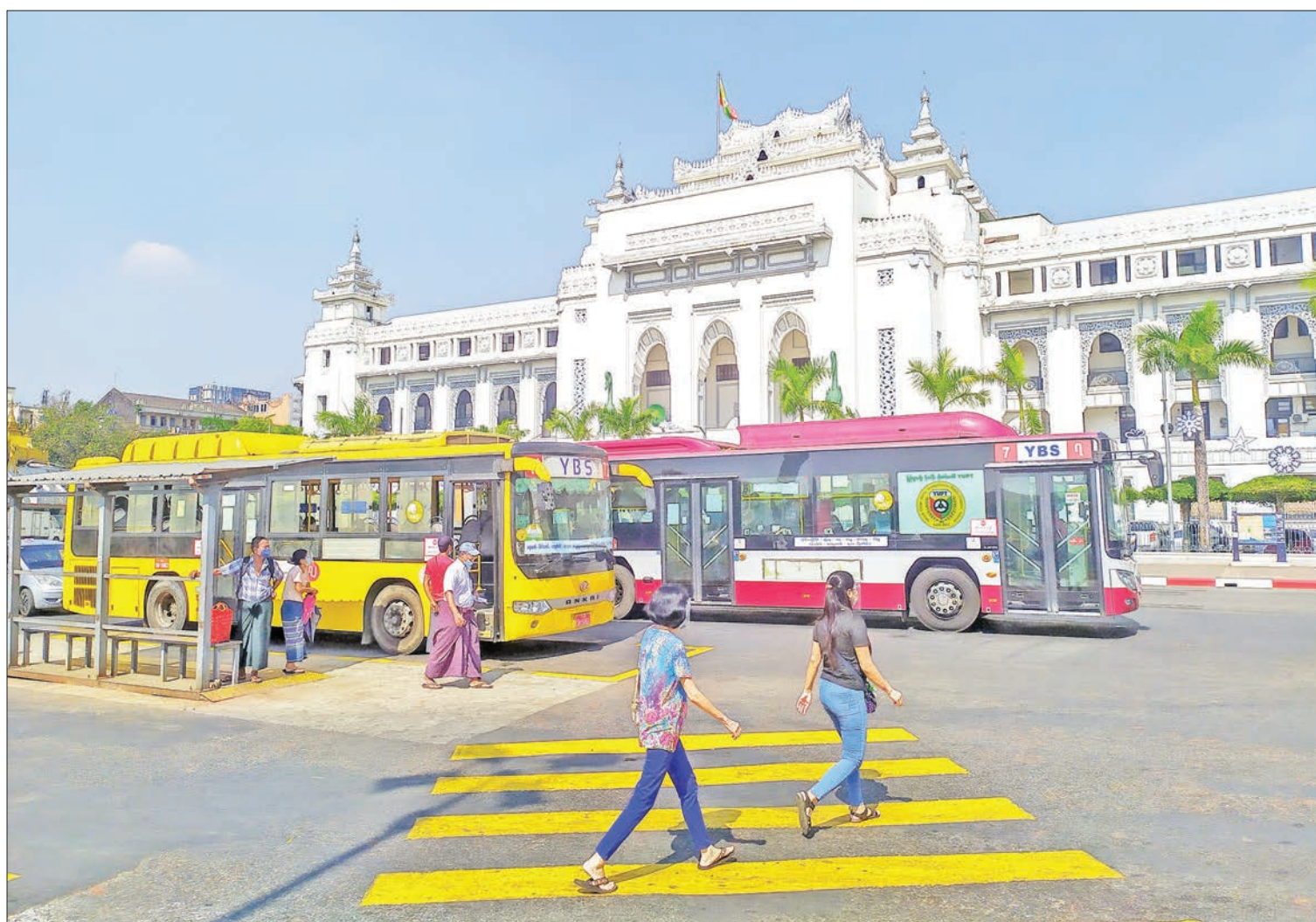
YBS buses are seen in downtown Yangon during the second wave of coronavirus outbreak in Myanmar.

Moreover, YRTA also provided the masks, the stickers to remind the people to wear the