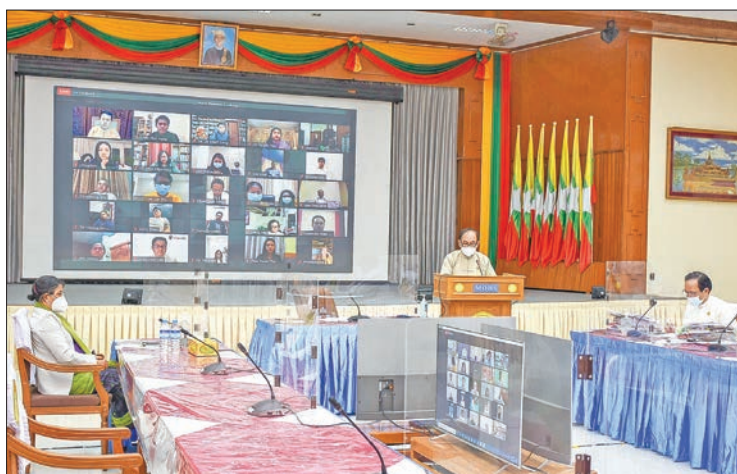
Union Minister Dr Myint Htwe speaks during the virtual meeting with artistes on COVID-19 response efforts on 6 January 2021.

The Union Minister emphasized the crucial role of performers in changing the habits of the general public for control of COVID-19 in a short period. People love performers and are more