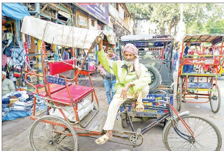
Modi’s government is struggling to kickstart what was once the world’s fastest growing major economy.

“The growth in real GDP during 2020-21 is estimated at -7.7 per cent as compared to the growth rate of 4.2 per cent in 2019-20,” reads a statement released by the National Statistical Office (NSO) of India’s federal ministry of statistics and programme implementa-