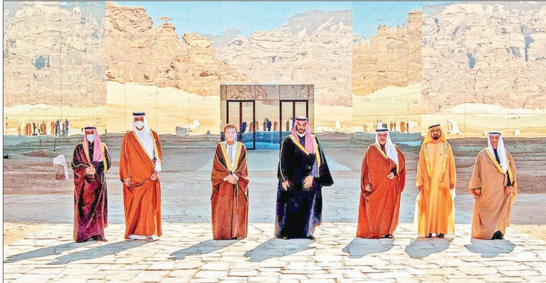
The Gulf states will restore travel, trade and transport links with Qatar within a week, the UAE said Thursday, after a landmark deal to normalize ties ended a damaging rift.

“The practical measures will be within a week... includ-