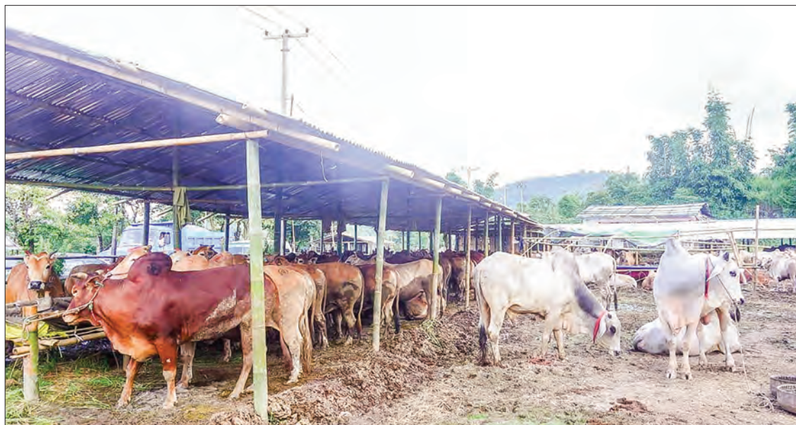
Live cattle export was allowed in late 2017, to eradicate illegal exports, creating more opportunities for breeders and promoting their interests.

"In the meantime, we are concerned about possible market manipulation when the supply is surpassing the demand. Additionally, Myanmar's live cat-