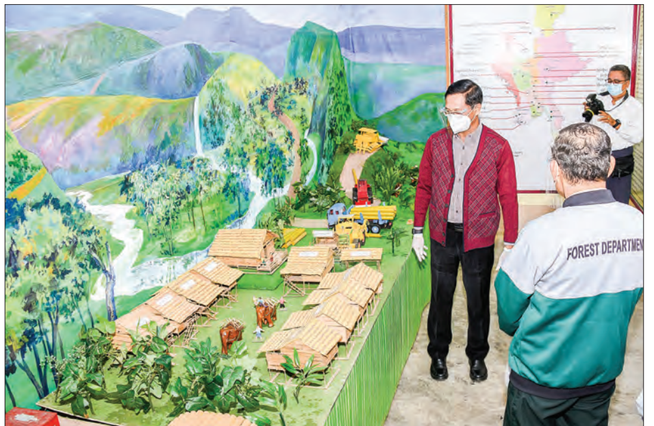
The Vice-President views the miniature of the recreation site for local and foreign visitors on 5 January 2021.