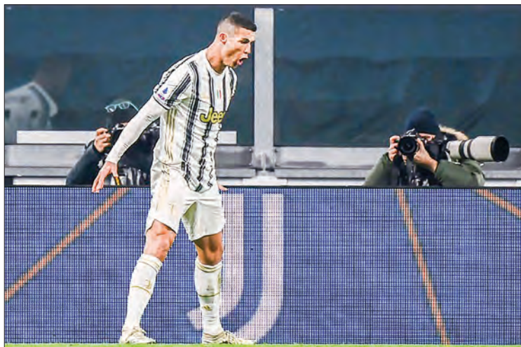
Cristiano Ronaldo has scored 14 of Juventus's 29 league goals this season.

The 39-year-old Swede scored 10 goals in six games played before picking up a muscle problem. —AFP ■