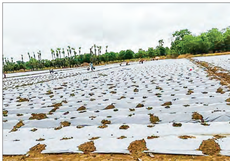
Watermelon plantation in Sagaing Region.