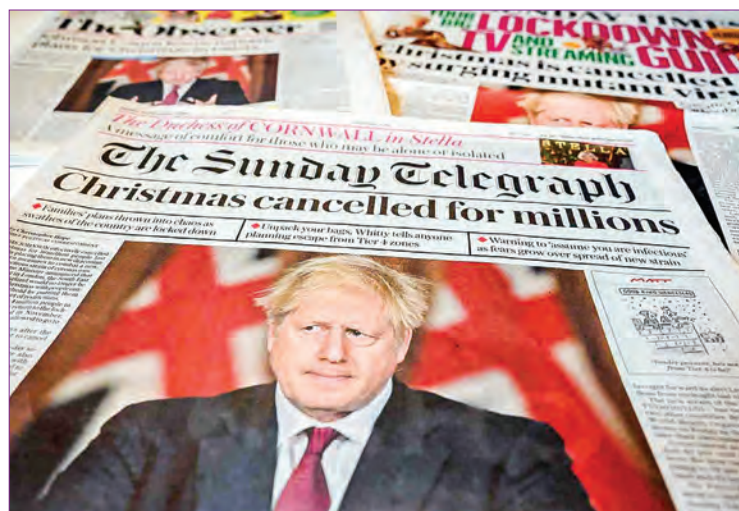
Britain's Prime Minister Boris Johnson looks on during a news conference in response to the ongoing situation with the coronavirus disease (COVID-19) pandemic, inside 10 Downing Street, London, Britain, on 19 December, 2020.

The British leader was due to be a guest at India's annual Republic Day celebrations on