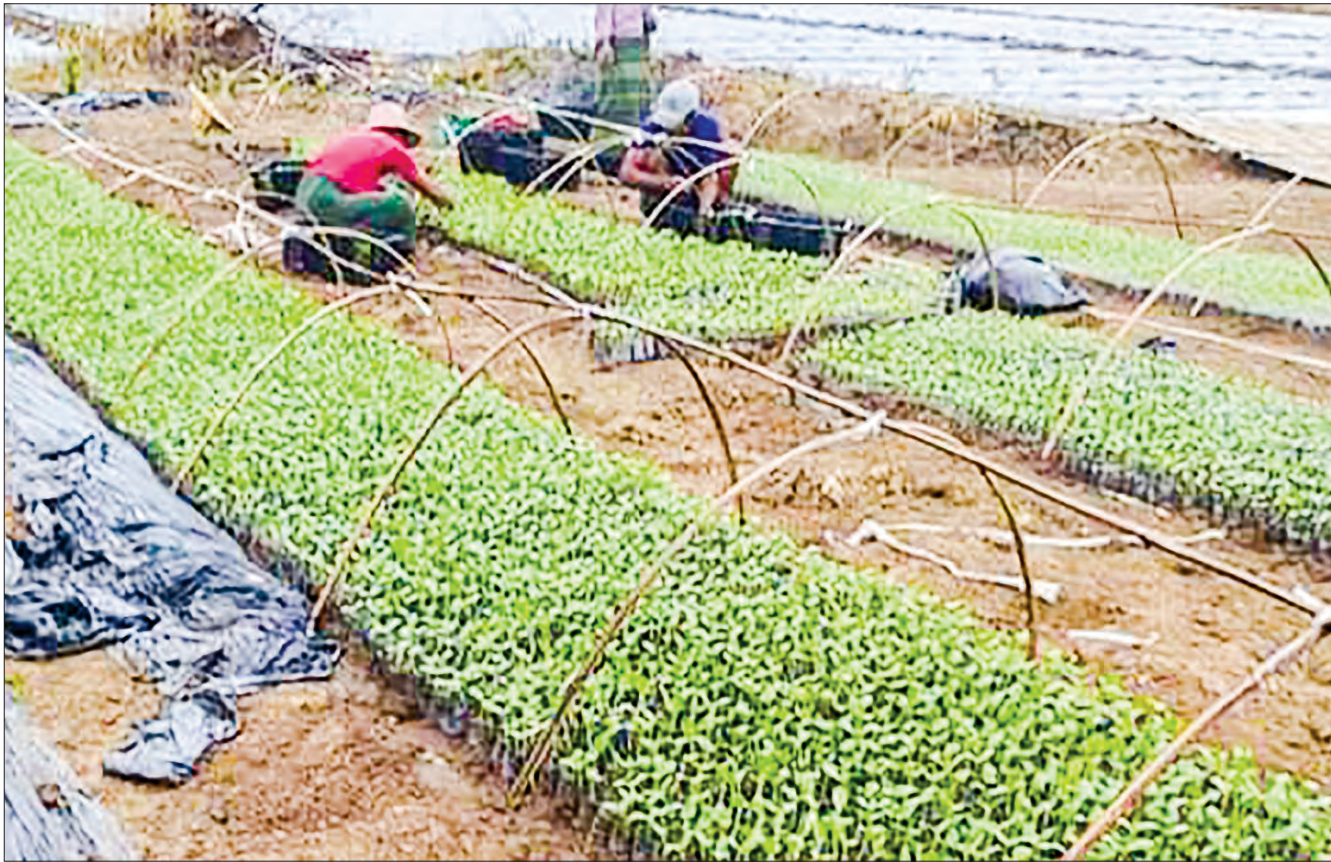
Farmers work at a watermelon nursery in Sagaing Region.