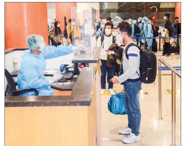
Myanmar returnees are going through immigration process at the Yangon International Airport yesterday.

with the relevant ministries, Myanmar embassies from respective countries, shipping companies and the relevant organizations.—MNA