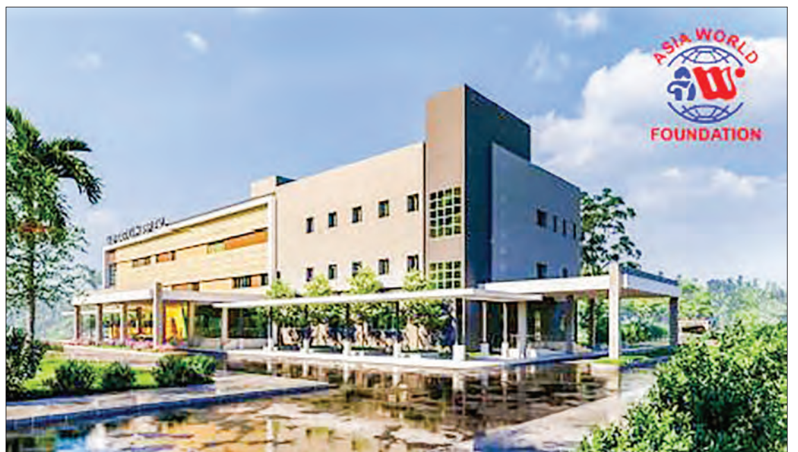
The new 100-bedded Waibargi Hospital's proposed design plan.

of prompt completion of the new hospital this year based on our track record over the years with the construction of a two-lane concrete road (55 km Maungtaw-Angumaw) on the other side of Sittway, Rakhine State, and recently the opening of a two-lane prestressed Reinforced Concrete Cantilever Bridge, spanning over 800 feet in length (elevation of 476 ft) on the Toungoo - Bawgali -Mawchi Road built and donated by Asia World Foundation," said U Htun Myint Naing, Chairman of the Asia World Foundation.—GNLM