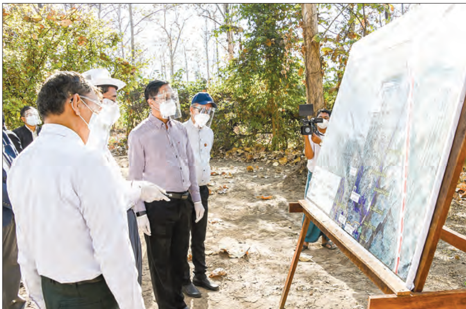
Vice-President U Henry Van Thio inspects the development project near Nay Pyi Taw on 5 January 2021.