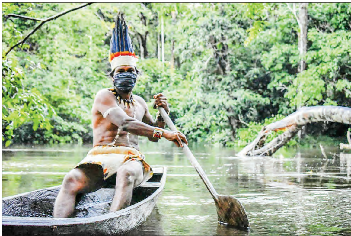
In recent months, the COVID-19 pandemic has reinforced the ills of the Amazon region, the largest tropical forest in the world.

The country has set an ambitious target of vaccinating 300 million of its 1.3 billion people by mid-year.