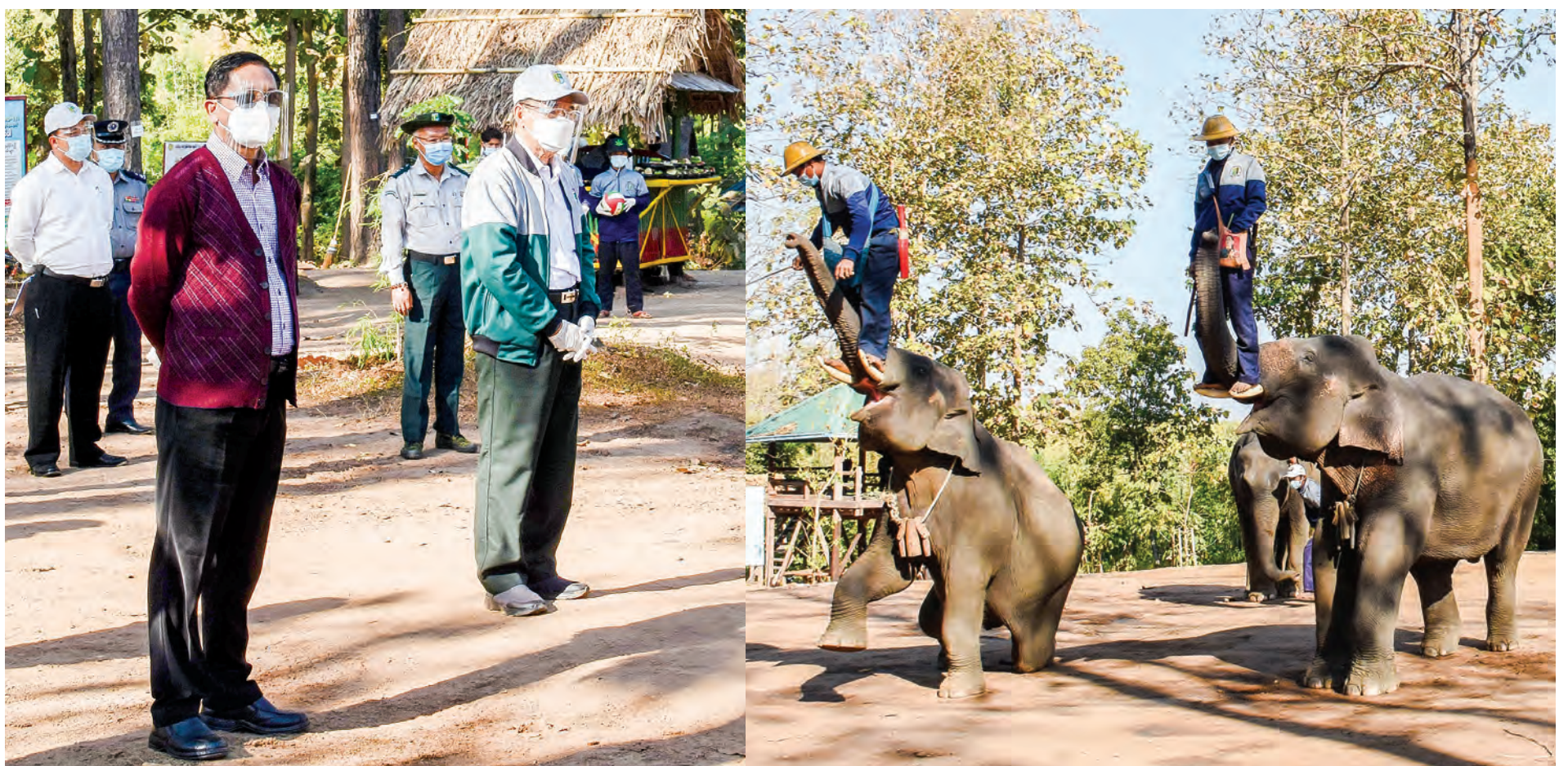
Vice-President U Henry Van Thio and officials are viewing the elephants' shows during his inspection tour near Nay Pyi Taw on 5 January 2021.

I N his capacity as the Chairman of National Tourism Development Central Committee, Vice-President U Henry Van Thio looked into the