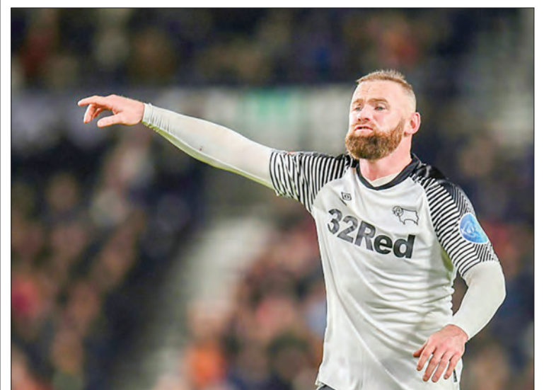
Derby County, with Wayne Rooney in interim charge, have closed their training ground after a coronavirus outbreak.

LONDON — Championship strugglers Derby County have closed their training ground after several first-team staff members and players tested positive for coronavirus, the club said on Tuesday.