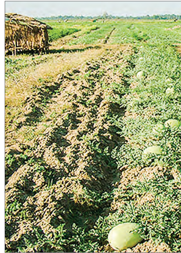
A farmer watering plants in a watermelon farm in Nay Pyi T.