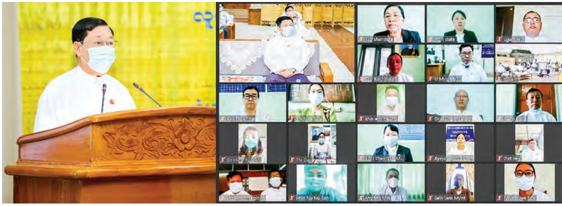
MoLIP Minister addresses the online ToT refresher course in HR development on 5 January 2021.

THE Social Security Board under the Ministry of Labour, Immigration and Population held the opening ceremony of a refresher course on trainers for human resource development under the social welfare project via videoconferencing in Nay Pyi Taw yesterday morning.