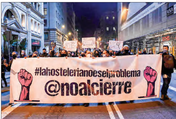
Spanish workers hold a placard reading "Hospitality is not the problem. No to closure".