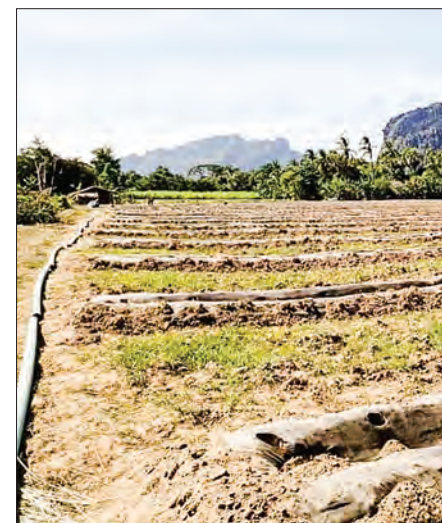
A watermelon cultivation plot in Kayin State.