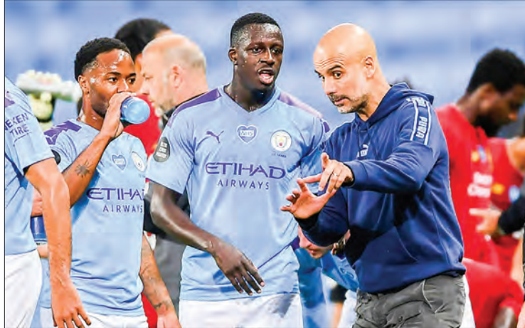
Manchester City's Benjamin Mendy (centre) admitted to breaching coronavirus regulations by hosting a New Year's Eve party.

Twice-weekly testing, used during the Project Restart plan