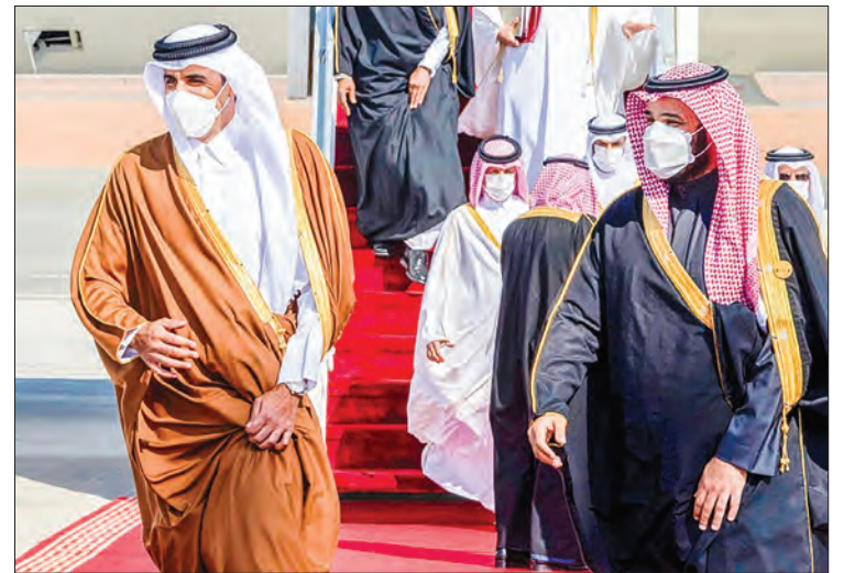
Qatar's ruler Sheikh Tamim bin Hamad Al-Thani is given a warm welcome by Saudi Crown Prince Mohammed bin Salman on his first visit after three and a half years of broken relations, fueling hopes of rapprochement at a Gulf summit.