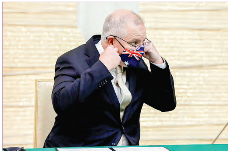
Australian PM Scott Morrison suggested virus-ravaged countries like Britain had been forced to take risks with emergency approvals.

UNDER mounting pressure to speed up coronavirus vaccinations, Australian Prime Minister Scott Morrison on Tuesday said he would not take "unnecessary risks" and emulate Britain's emergency drug approval.