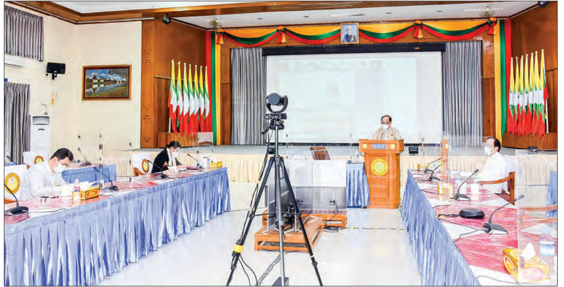
Union Minister Dr Myint Htwe presides over the online discussions to reopen medical courses, on 5 January 2021.