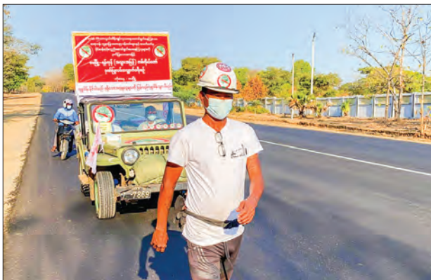
A long-journey walker is walking to honour COVID front-liners, healthcare workers and volunteers.

A 48-year-old man continued his over 1,000-mile journey walking in honour of COVID-19 front-liners, including medical workers and volunteers, as he left Meiktila Township in central Myanmar yesterday morning.