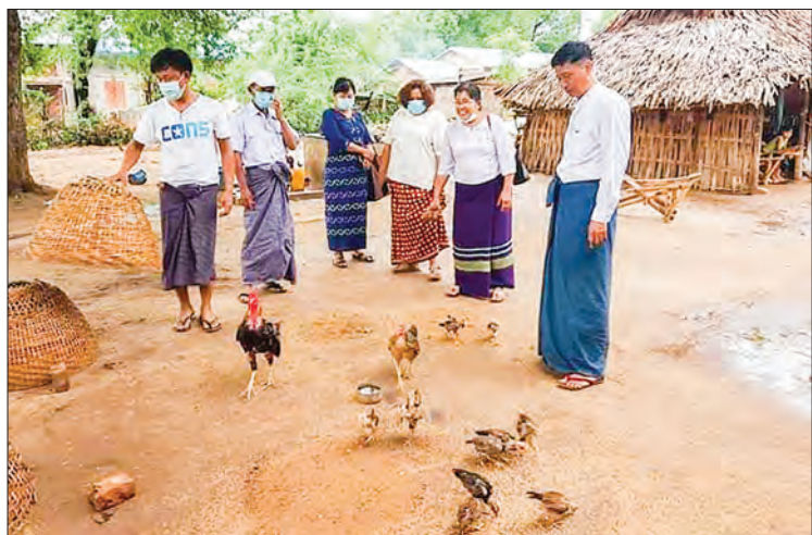
The FSP will provide K500,000 per farm to the breeders of native breeds in three townships in Mandalay Region in the current financial year 2020-2021, to ensure food safety.