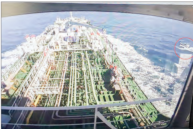
CCTV footage of the Hankuk Chemi, a South Korean-flagged oil tanker, shows a boat from Iran's Revolutionary Guards in a red circle. The footage was shown at tanker owner DM Shipping's offices in Busan on January 4, 2021.

SOUTH Korea will send a delegation to Iran to negotiate the release of a seized oil tanker and its crew, Seoul said Tuesday, as an anti-piracy unit arrived in waters near the Strait of Hormuz.