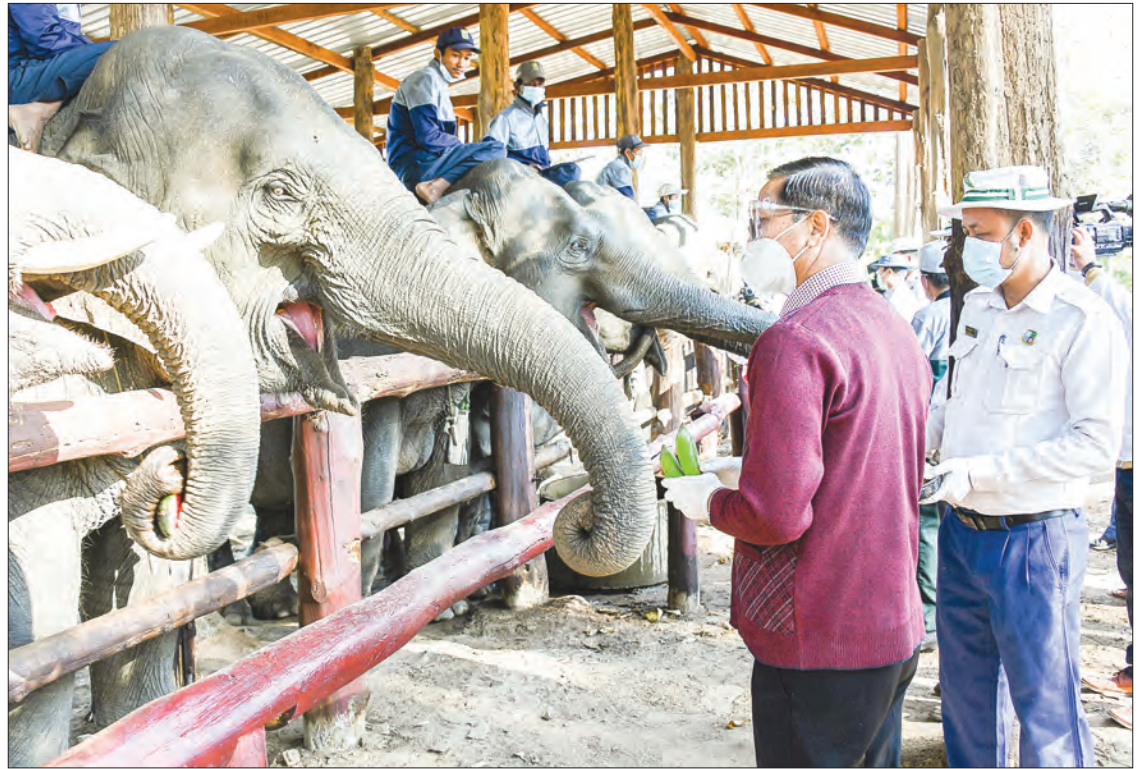
Vice-President U Henry Van Thio feeds the elephants at the Ngalaik Sakanthar elephant camp on 5 January 2021.

At the Shwe Kyun Taw camp, the Vice-President heard reports on the development project which were first intended