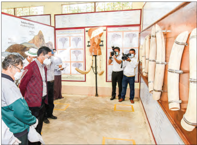
The Vice-President and party look into the displays at the Ngalaik Sakanthar elephant camp yesterday.

for the recreation place of staff members in Nay Pyi Taw and the nearby public.