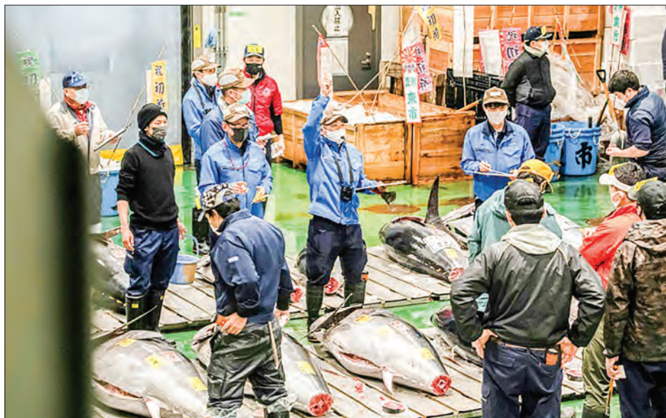
At this year's auction, no spectators were allowed, and buyers and sellers wore masks and sanitized their hands.

TOKYO'S annual New Year tuna auction ended Tuesday without the usual jaw-dropping bidding war, with the country's "Tuna King" holding back on gunning for the top fish, citing