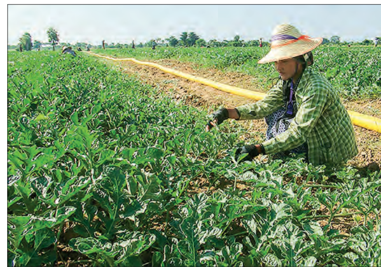
A farmer works in a watermelon farm in Nay Pyi Taw.