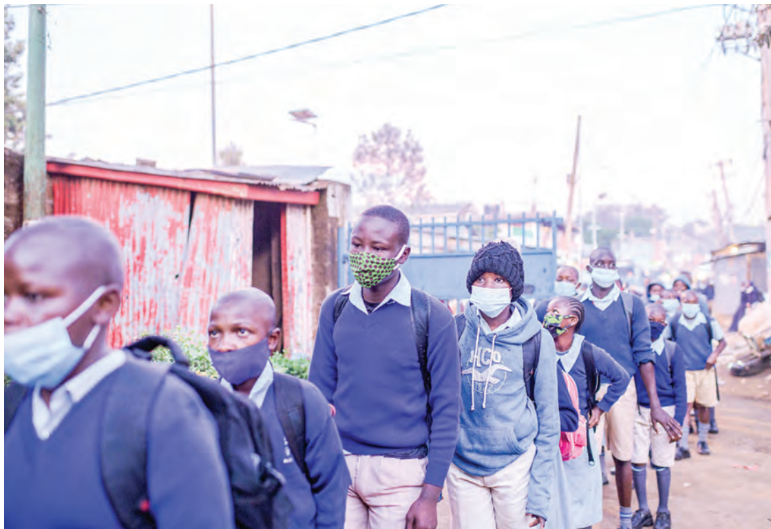
Students of Olympic Primary School wait in a line to have their temperatures measured at the entrance of the school in the early morning of the official re-opening day of public schools on January 4, 2021, in Kibera slum, Kenya, as students return to school following a nine-month closure ordered by the government in March 2020 to curb the spread of the COVID-19 coronavirus.

“We are happy to be back in school, that was a long break,” Mercy Nderi, a pupil at Kasarani