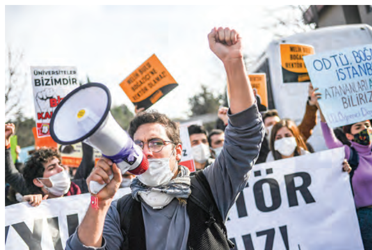
Students chant slogans and hold placards on 4 January 2021 in front of the Bogazici University in Istanbul during a protest against the direct appointment of the new rector to Bogazici university by Turkish President Recep Tayyip Erdogan.