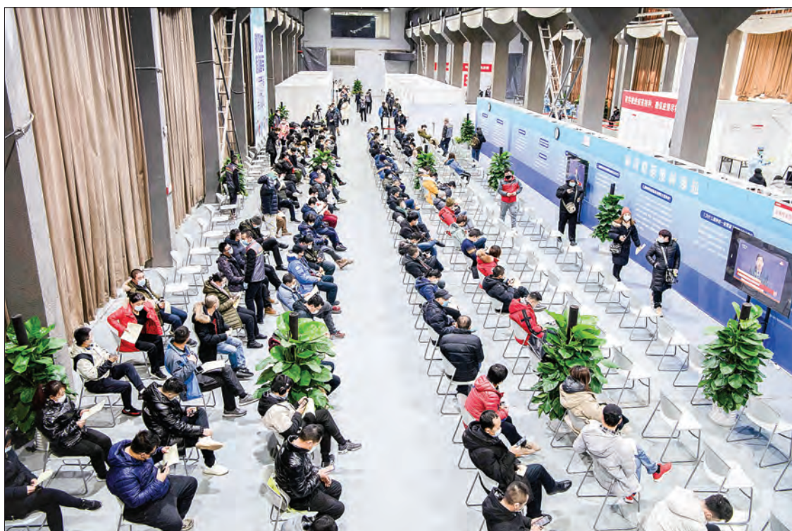
This photo taken on 3 January 2021 shows people waiting to receive COVID-19 coronavirus vaccines at a temporary vaccination centre in Beijing, as China races to inoculate millions before the Chinese New Year mass travel season in February.