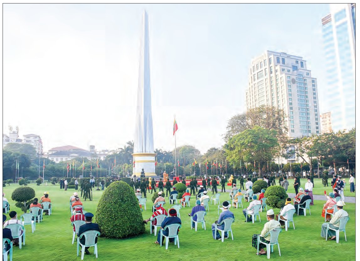
Yangon Region government organizes the flag-hoisting and saluting ceremonies to mark 73 rd Independence Day at Maha Bandoola Park in Yangon on 4 January 2021.