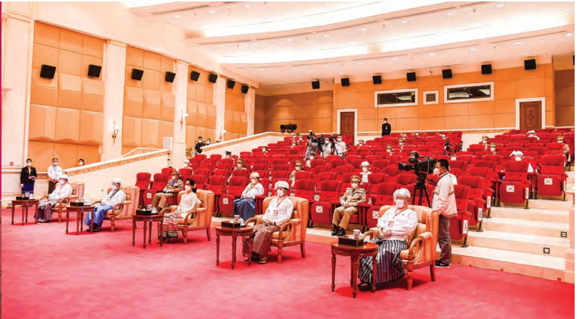
President U Win Myint delivers speech at the ceremony of conferring honorary titles at the Thabin Hall of the Presidential Palace in Nay Pyi Taw on 4 January 2021.