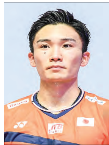
Kento Momota.

aysia Masters. Early the next morning, however, he suffered injuries when the van he was riding in was involved in a fatal crash. He did not return to competition until Japan's national championships in December, when he won his third straight men's singles title. The Yonex Thailand Open was to be his first competition abroad in a year.—Kyodo News ■