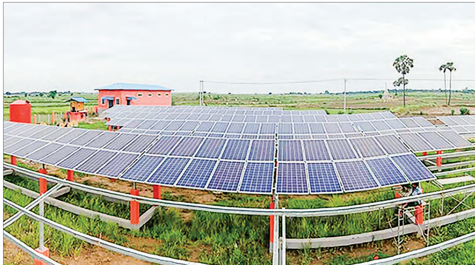
Eight villages between Ayeyawady and Chindwin rivers in Yasagyo Township get access to solar power 2019.

Moreover, amidst an exceptionally challenging year, and despite suffering setbacks, the renewables sector has shown resilience.