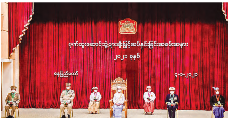
President U Win Myint and honorary title winners pose for a group photo at the ceremony of conferring honorary titles in Nay Pyi Taw on 4 January 2021.

Photo displays of the honorary titles conferring ceremony held in Nay Pyi Taw on the 73 rd Anniversary Independence Day.