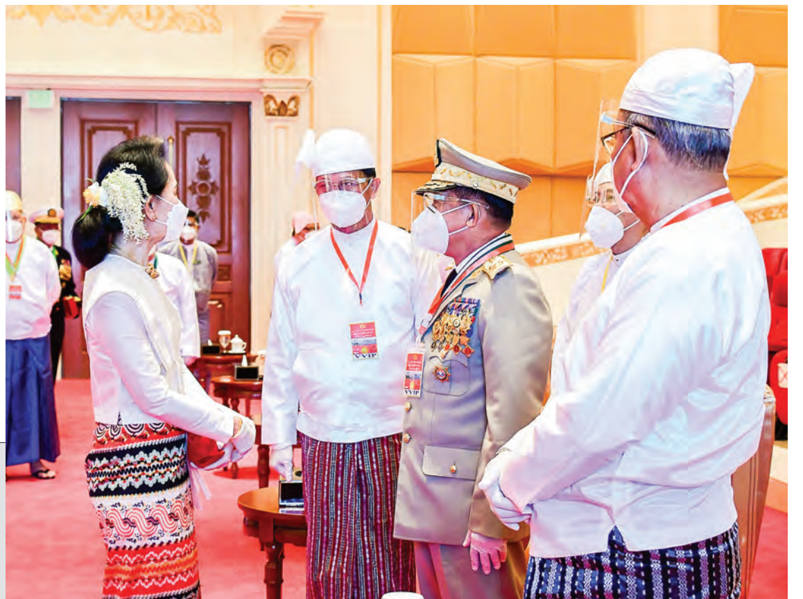
State Counsellor Daw Aung San Suu Kyi greets Senior General Min Aung Hlaing and attendees at the ceremony of conferring honorary titles in Nay Pyi Taw on 4 January 2021.