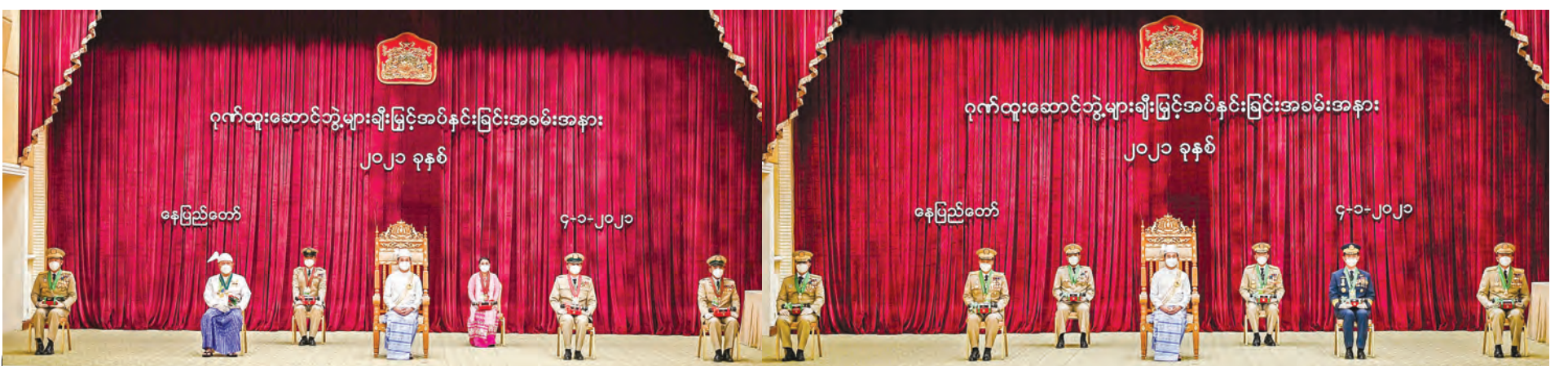
President U Win Myint and honorary title winners pose for documentary photos at the ceremony of conferring honorary titles at the Thabin Hall of the Presidential Palace in Nay Pyi Taw on 4 January 2021.