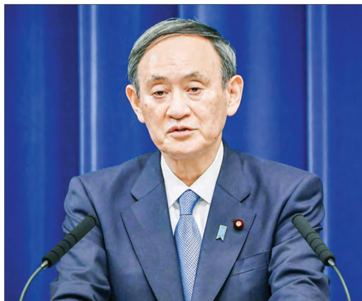
Japanese Prime Minister Yoshihide Suga attends the year's first press conference at his office in Tokyo on 4 January 2021.