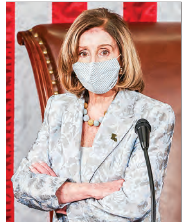
Speaker of the House Nancy Pelosi (D-CA) waits during votes in the first session of the 117th Congress in the House Chamber at the US Capitol on 3 January 2021 in Washington, DC.

One congressman-elect from Louisiana, Luke Letlow, died of complications from Covid-19 last