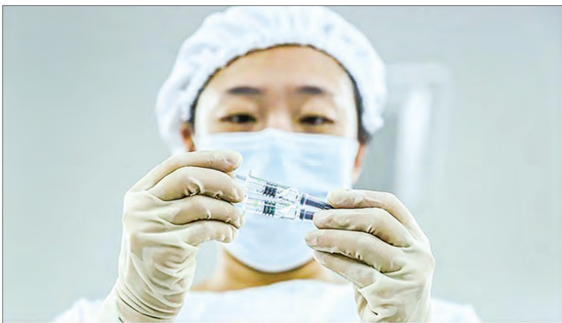
In this Dec 25, 2020 file photo, released by Xinhua News Agency, a staff member inspects syringes of COVID-19 inactivated vaccine products at a packaging plant of the Beijing Biological Products Institute Co Ltd, in Beijing. PHOTO: (ZHANG YUWEI/XINHUA VIA AP)

Hua said the Chinese government always puts safety and effectiveness of COVID-19 vaccines in the first place, and Chinese