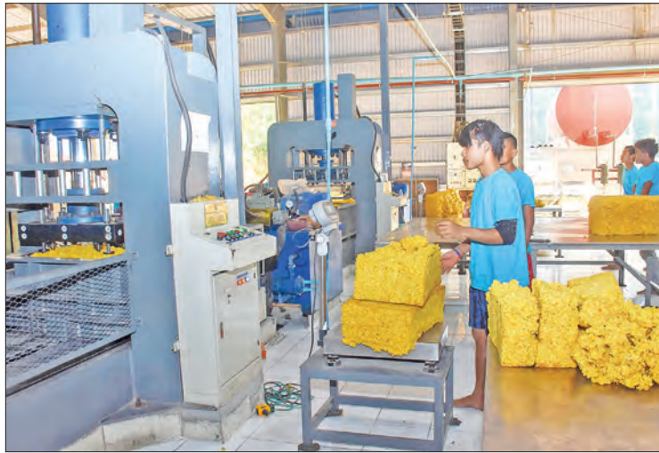
(FILES) Rubber is weighed on a digital scale.

Quality Testing Lab was set up at the Commodity Testing and Quality Management Division (Hlegu Township) of the Consumer Affairs Department under the MOC.