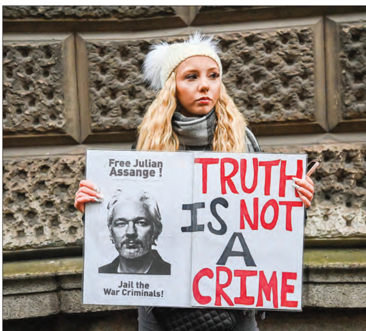
Supporters of Wikileaks founder Julian Assange demonstrate outside the Old Bailey court in central London as the court will rule on his extradition case on 4 January 2021.