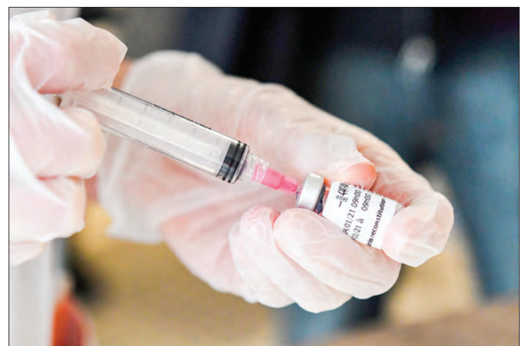
A nurse prepares to administer a dose of the Pfizer coronavirus disease (Covid-19) vaccine to a resident of retirement home, on January 4, 2021 in Saint-Renan, western France.