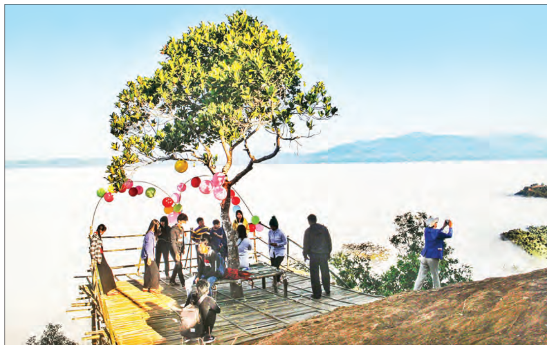
Travellers are seen at the "cloud sea" tourist spot in Mogaung, Kachin State on 4 January 2021.

A new "cloud sea" tourist spot has been set up in Mogaung, Kachin State, and on 4 January, the Independence Day, visitors flocked to Mount Loi Hin Chae and enjoyed the cloud