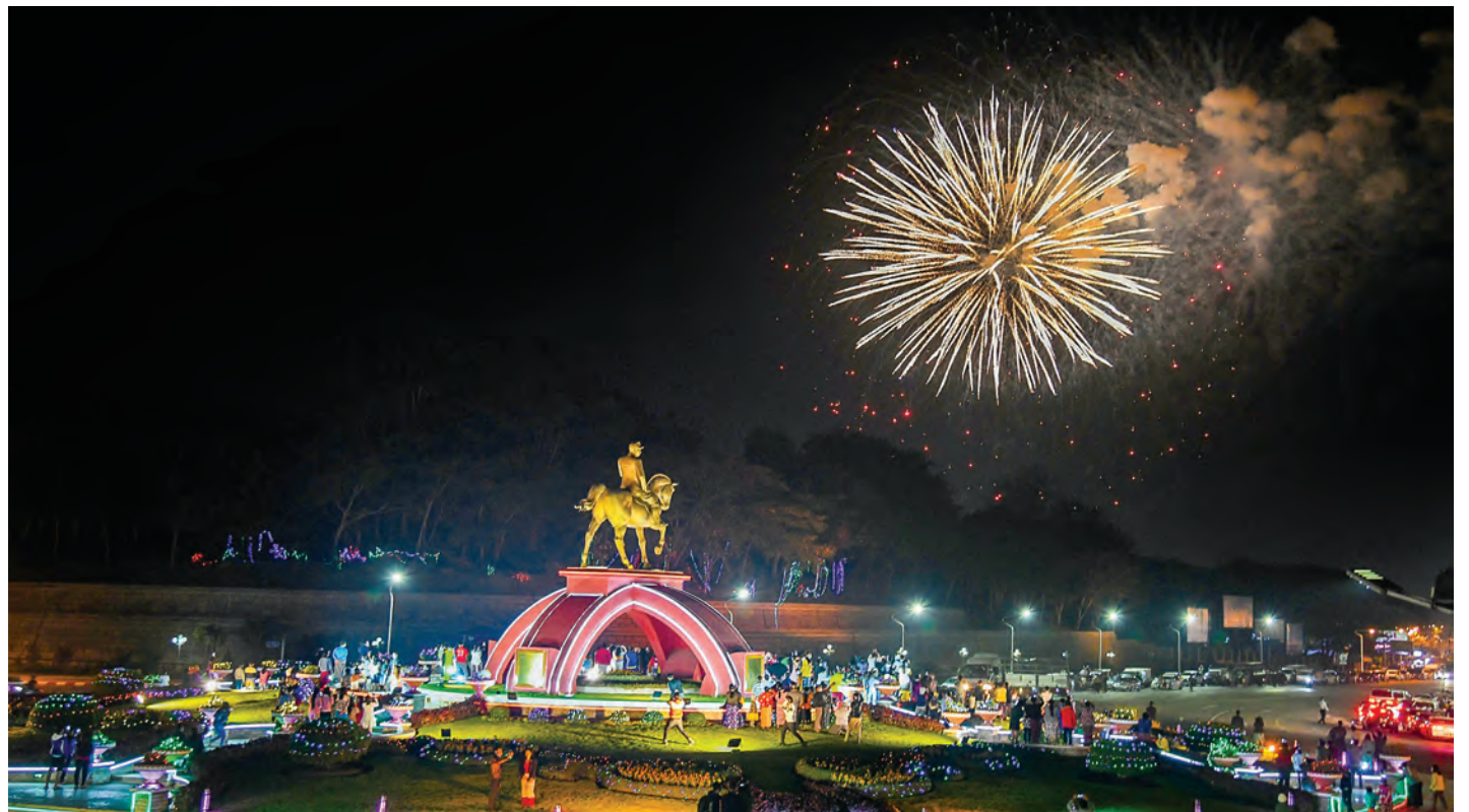
Fireworks set off over the Bogyoke Aung San Bronze Statue in Nay Pyi Taw to celebrate the 73 rd Independence Day on 4 January 2021.