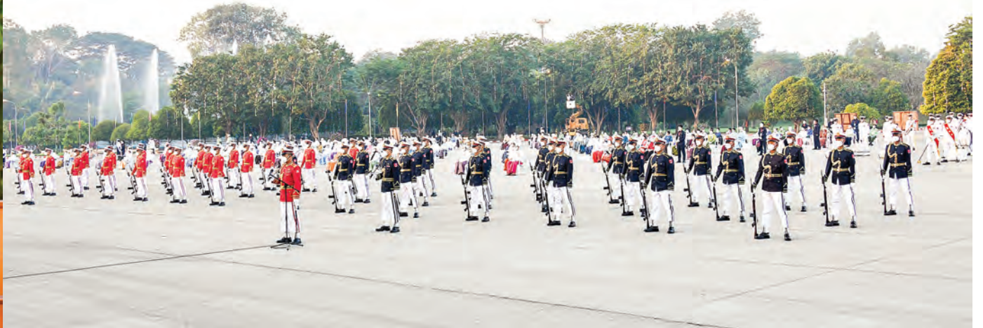
Vice-President U Myint Swe delivers the speech at the ceremony of hoisting and saluting the national flag to mark the 73 rd Independence Day in Nay Pyi Taw on 4 January 2021.