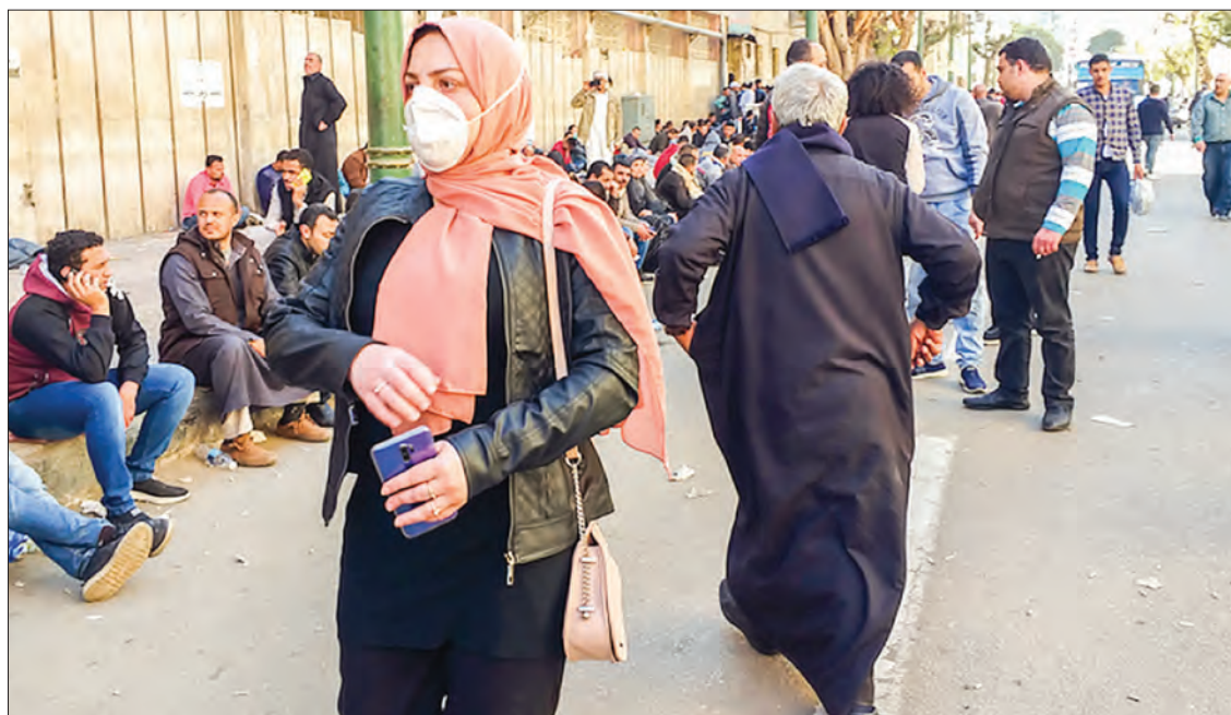
Egyptians gather in front of the Central Public Health Laboratories in downtown Cairo as they wait to get tested for the coronavirus (COVID-19) on March 8, 2020.

“The Egyptian pharmaceutical authority approved on Saturday the Chinese Sinopharm vaccine,” Hala Zayed said late Saturday, on the local MBC Masr channel.