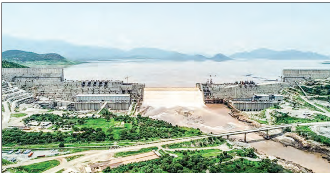
Ethiopia sees the massive dam on the Nile as essential for its electrification and development, but Egypt sees it as an existential threat.