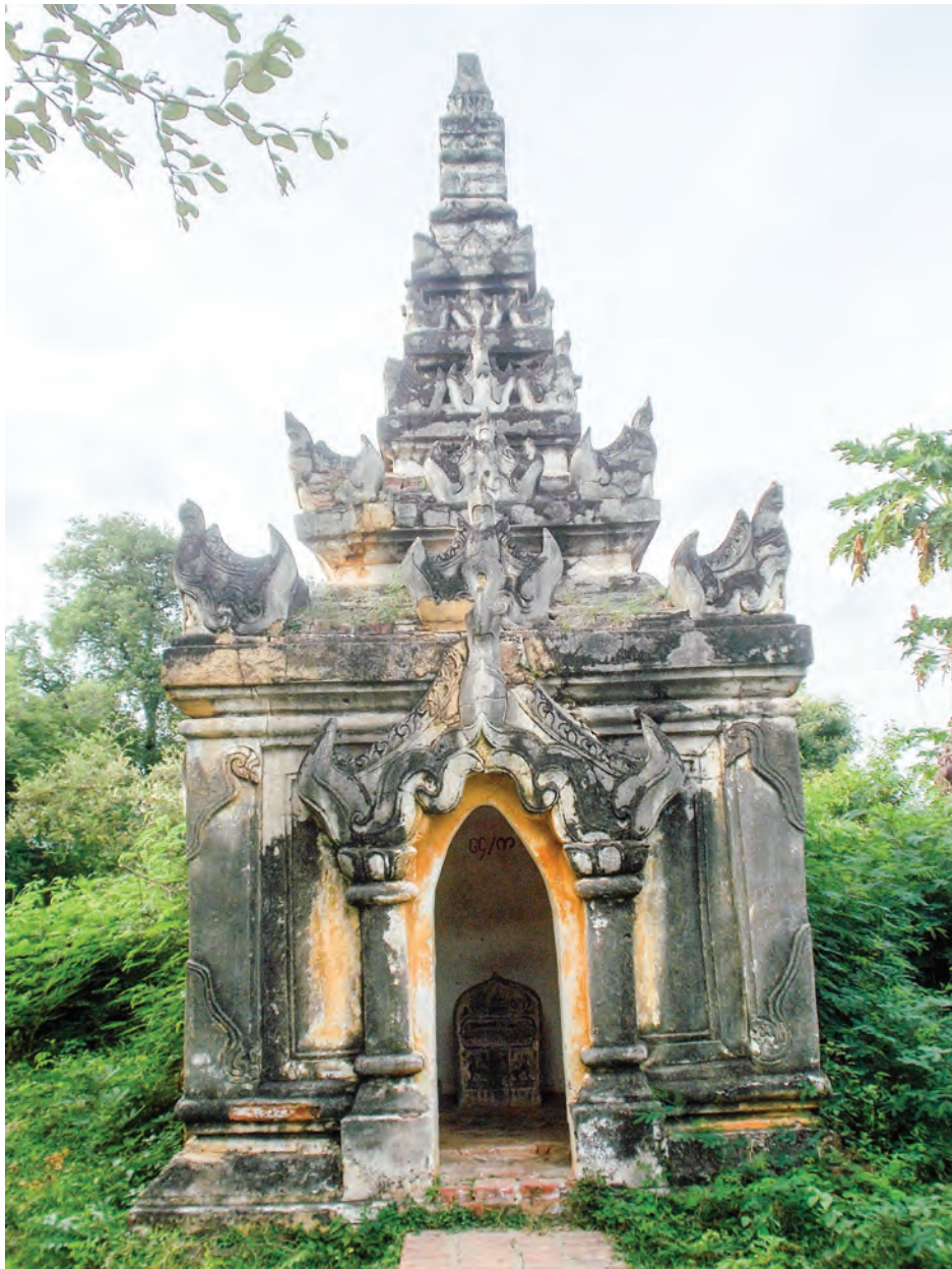
Magnificent architectural masterpieces.