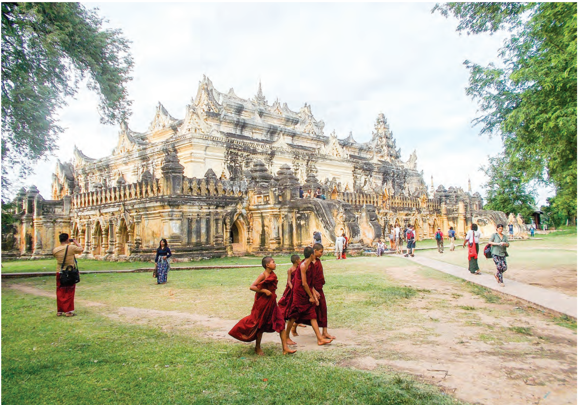
Mae Nu Oak Kyaung.

S TUDYING a historic building is interesting and it is even more valuable to know and experience the past. If you know and study the past, you will always enjoy learning.