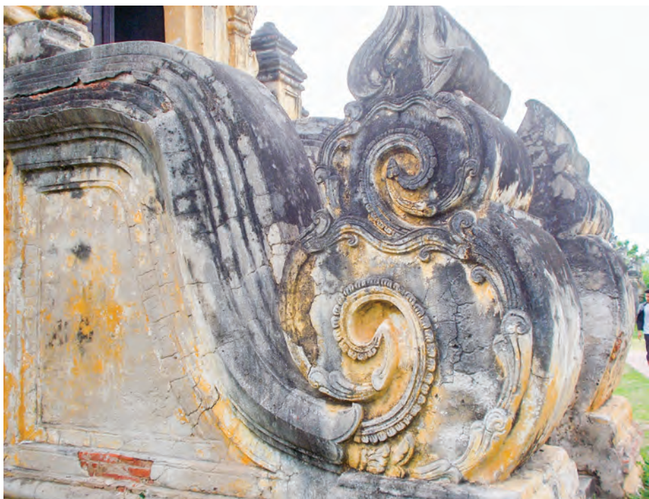
Ancient Artworks. PHOTO: THAYATAN SOE SHWE