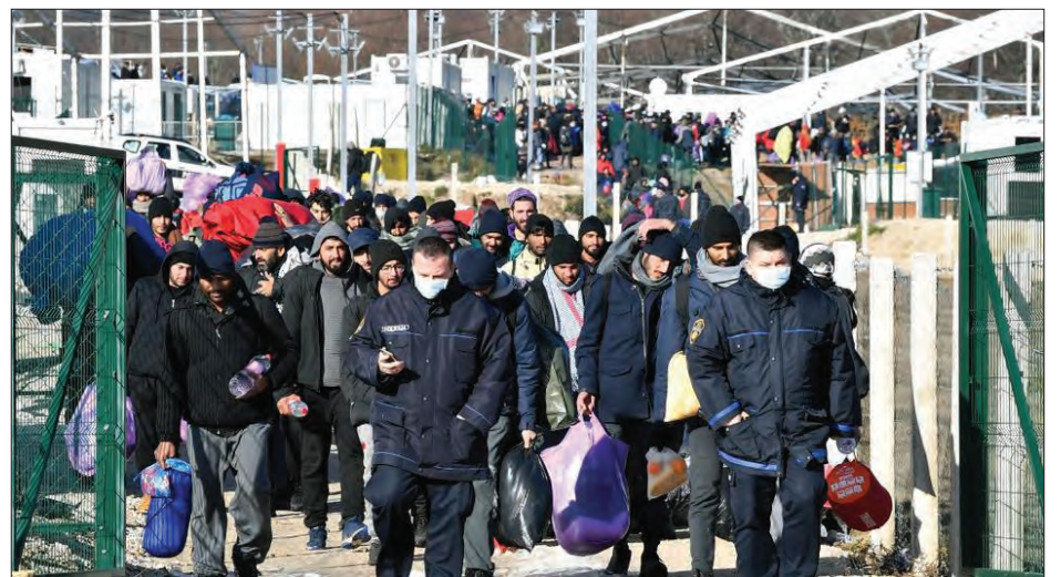
Migrants leave the migrant camp "Lipa", after it was destroyed by a fire, near the northwestern Bosnian town of Bihac, on December 29, 2020.