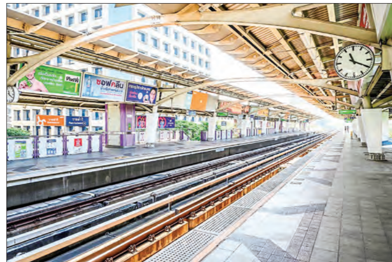
A nearly empty platform is seen at a BTS commuter train station in Bangkok on January 2, 2021.

Public schools in the Thai capital are to close for two weeks. An outbreak last month at a seafood market has led to a resurgence of the virus in Thailand, with infections detected in 53 of the kingdom's 77 provinces.