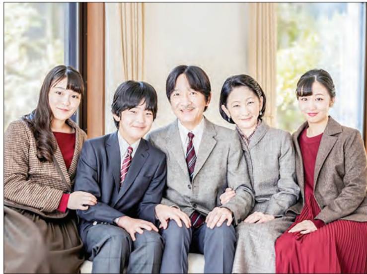
Crown Prince Akishino poses with his wife Crown Princess Kiko (2nd R) and their children, Princess Mako (L), Princess Kako (R) and Prince Hisahito at their Akasaka Estate residence in Tokyo, in this photo taken on Nov 14.