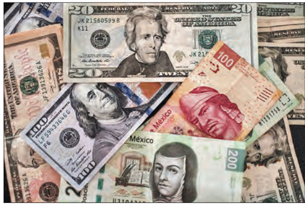
A new US law has closed off a major avenue for global money laundering and tax evasion.