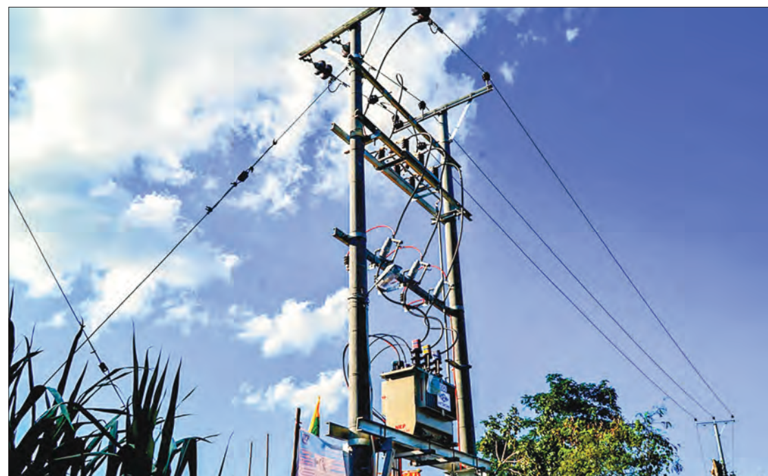
Switch-on Ceremony of Electrifying Kanthit Village in Magway is held on 1 January 2021.

THE ceremony for electrification was held in Kanthit Village in Magway Region on the evening of 1 January.