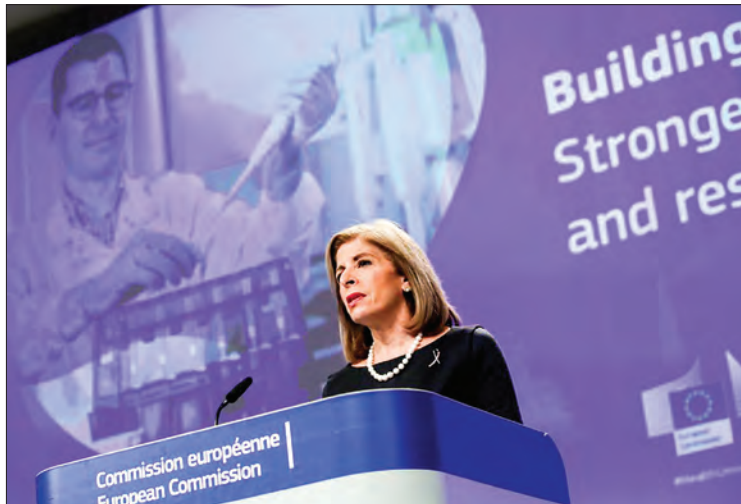
The European health commissioner, Stella Kyriakides, said at a news conference in Brussels.

on a potential alternative from US company Moderna until January 6.