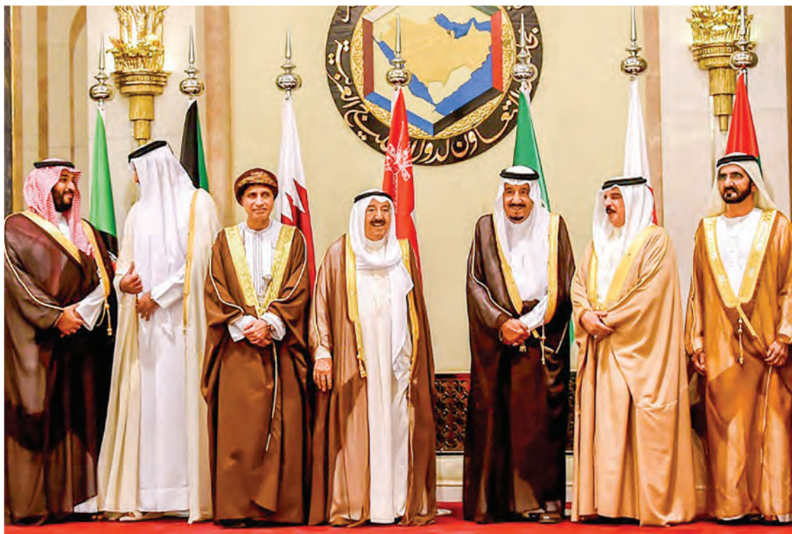
Saudi Arabia led a coalition of countries in the Gulf and beyond in 2017 to cut ties with Qatar over charges it was too close to Tehran and backed radical Islamist groups.

THE Gulf crisis, which has pitted regional players against Qatar, could be moving closer to resolution as the key countries prepare to meet in Saudi Arabia on Tuesday.