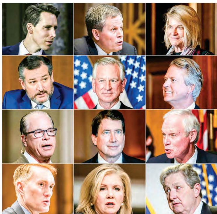
Twelve Republican senators have said they will vote against certifying President-elect Joe Biden’s election win. PHOTO: AFP/FILE

2017, the Saudi-led alliance subsequently forced out Qatari expatriate residents, closed their airspace to Qatari aircraft and sealed their borders and ports, separating some mixed-nationality families. The boycott countries later issued a list of 13 demands for Doha, including the closure of pan-Arab satellite television channel Al Jazeera, undertakings on terror financing, and the shuttering of a Turkish military base in Qatar. Doha has not publicly bowed to any of the demands. SOURCE: AFP