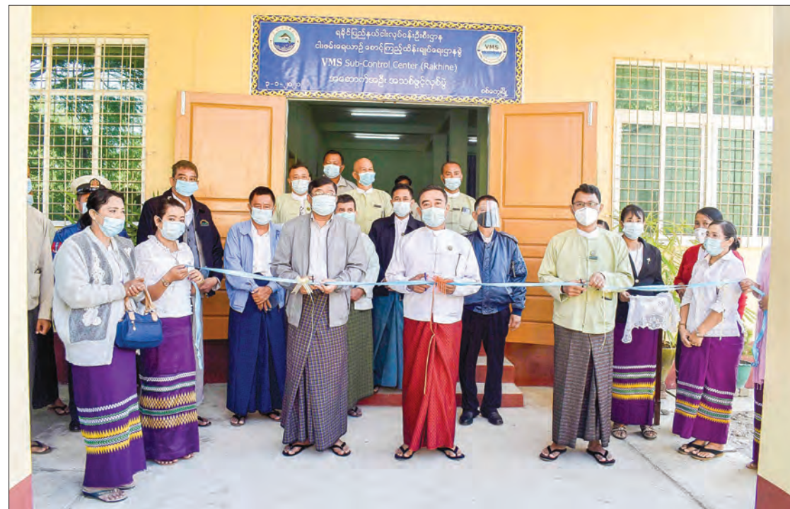
Officials cut ceremonial ribbon to open VMS control sub-centre in Sittway, Rakhine State on 3 January 2021.

THE new Vessel Monitoring System (VMS) control sub-centre in front of Rakhine State Fisheries Department was formally opened at 9 am on 3 January 2021.