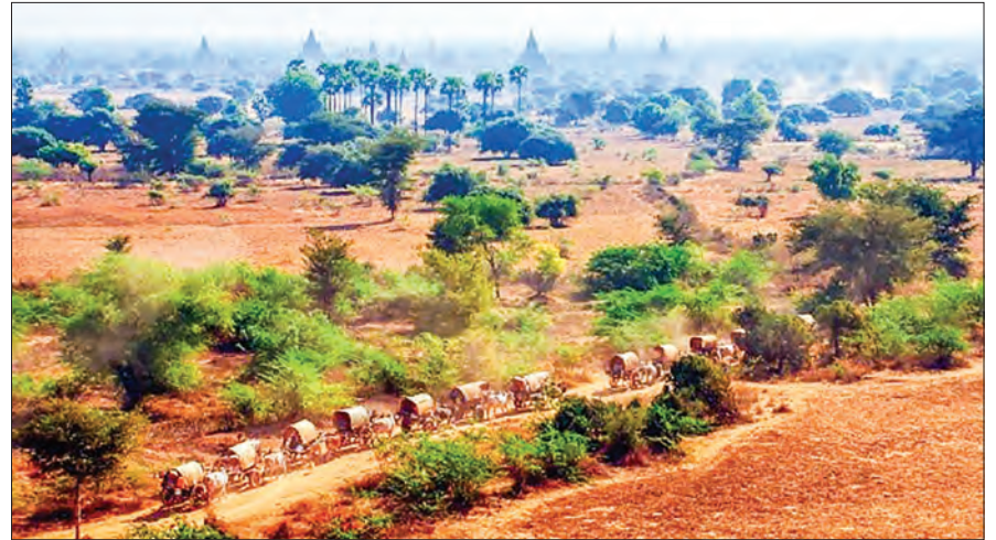
Landscape of Bagan Cultural Heritage Zone.

(Extract from the Message of Greetings sent by President U Win Myint on 4 January 2020 on the occasion of the 72 nd Anniversary of Independence Day.)