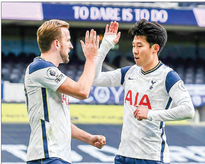
Deadly duo: Harry Kane (left) and Son Heung-min have scored a combined 32 goals this season.

LONDON — Harry Kane and Son Heung-min were again Tottenham's talismans in a 3-0 win over Leeds to revitalise their Premier League title challenge as Arsenal maintained their return to form with a 4-0 thrashing of West Brom.