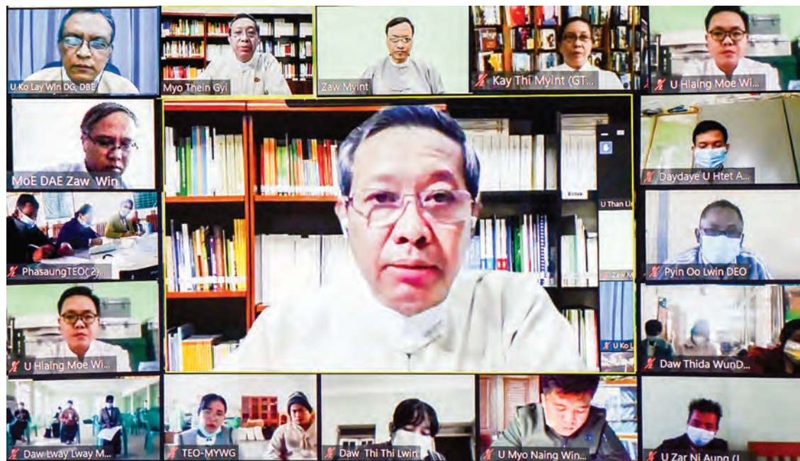
Union Minister Dr Myo Thein Gyi holds a virtual meeting with teachers from basic education and the technological and vocational education sectors on 29 December.