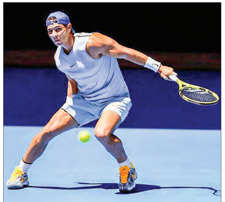
Tennis legend Rafael Nadal has been re-elected to the ATP players' council, whose term runs until June 2022.

Federer and Nadal both spoke out against the proposal when it was announced, calling for "unity, not separation". —AFP ■