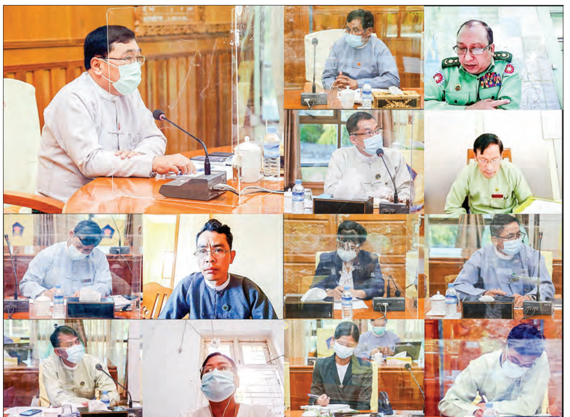
Union Minister Dr Win Myat Aye holds talks with local authorities on providing relief foods to people at IDP camps in Rakhine State.