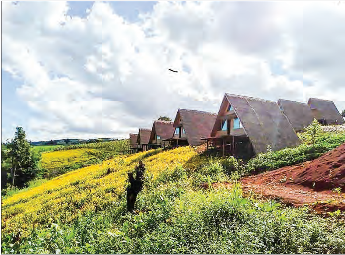
View camps for cloud sea are under preparation in Nawngkhio Township in Shan State .