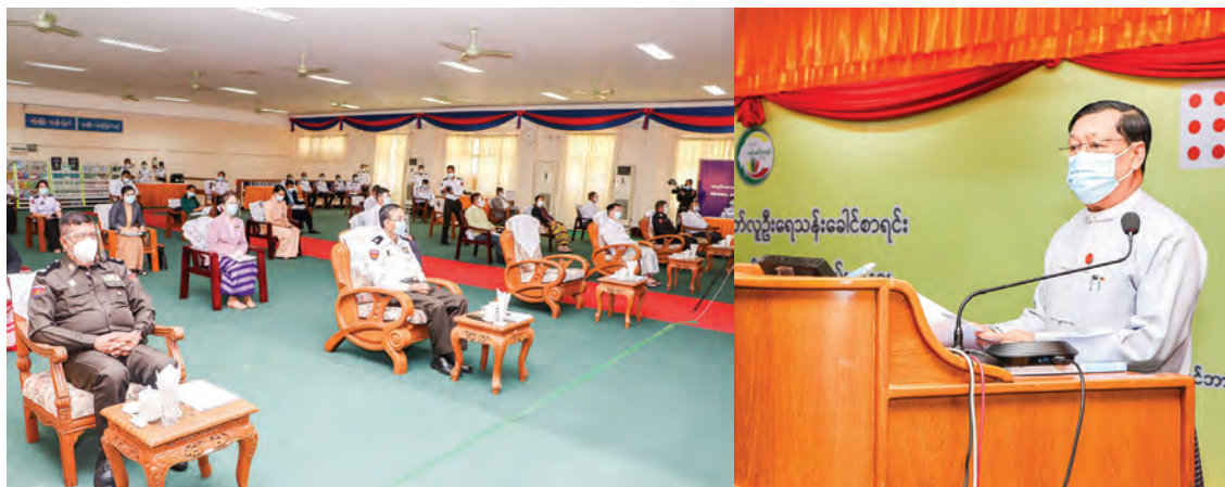
Union Minister U Thein Swe makes a speech at the launching ceremony of core reports of the 2019 Interim Census on 29 December.

The Ministry of Labour, Immigration and Population released its core reports of the 2019 Interim Census at its headquarters in Nay Pyi Taw yesterday afternoon.