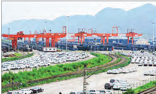
German cars arrive in Southwest China's Chongqing Municipality via the CR Express China-Europe cargo trains en masse on June 1.