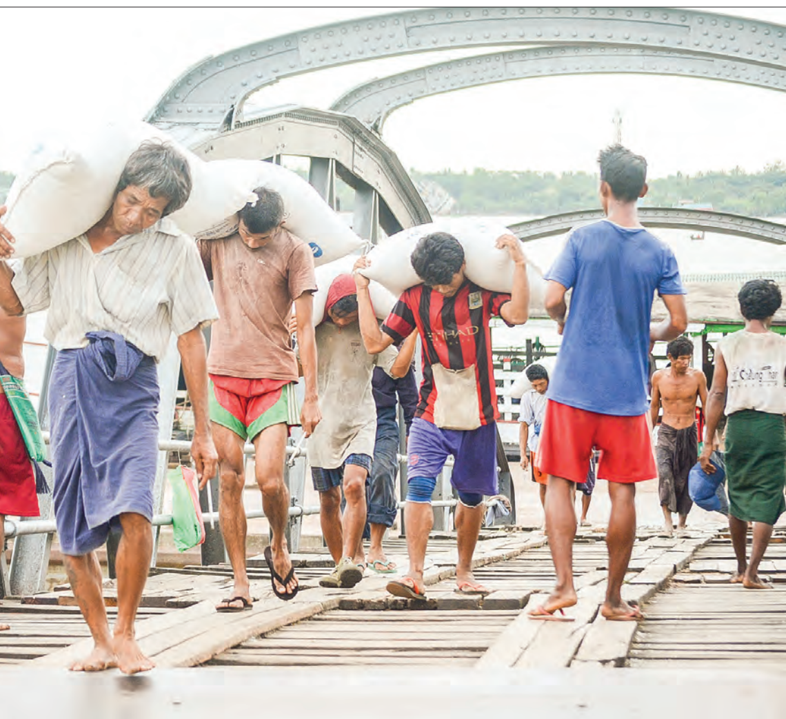
go ship at Botahtaung Jetty in Yangon.