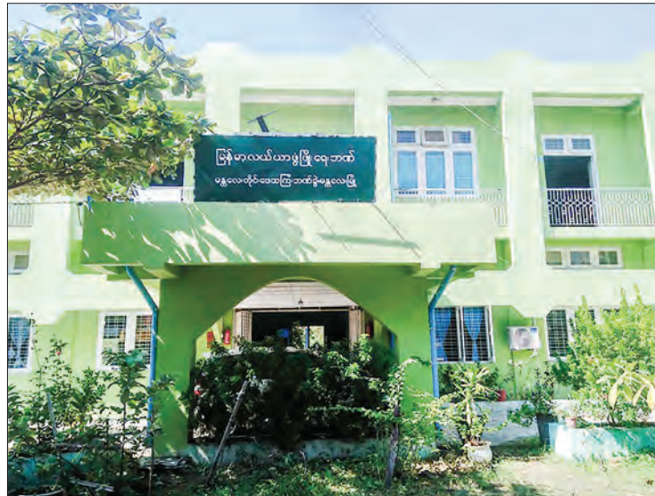
The Myanmar Economic Bank (MEB) provides the loan to local farmers from 23 townships in Mandalay Region annually, through MADB.

The Myanmar Economic Bank (MEB)'s loan programme provides loans to the farmers from 23 townships in Mandalay Region based on agricultural and livestock businesses if they could show substantial document and assurance. Currently, the bank has already allocated K417.16 million to 50 farmers. The bank