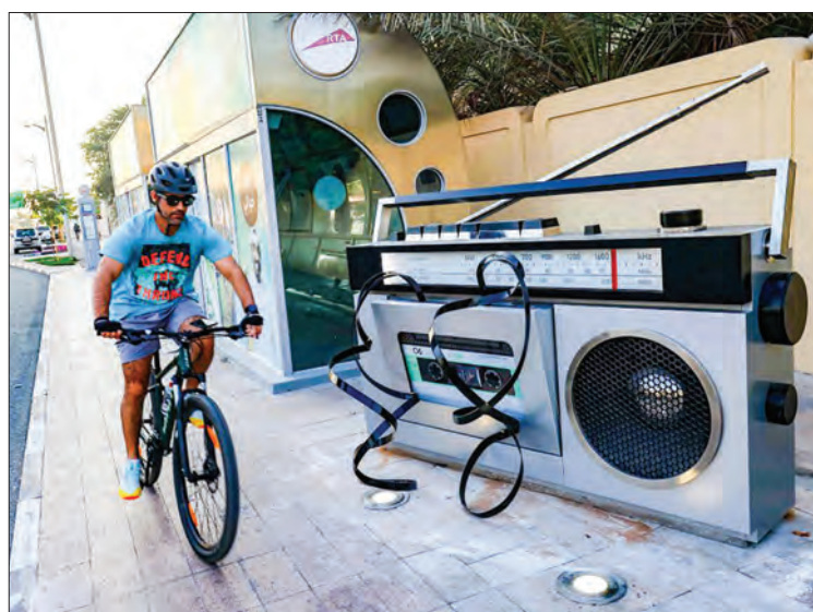
DUBAI: A man rides his bicycle past a giant sculpture representing an old radio-cassette recorder on Jumairah Street on Dec 24, 2020.