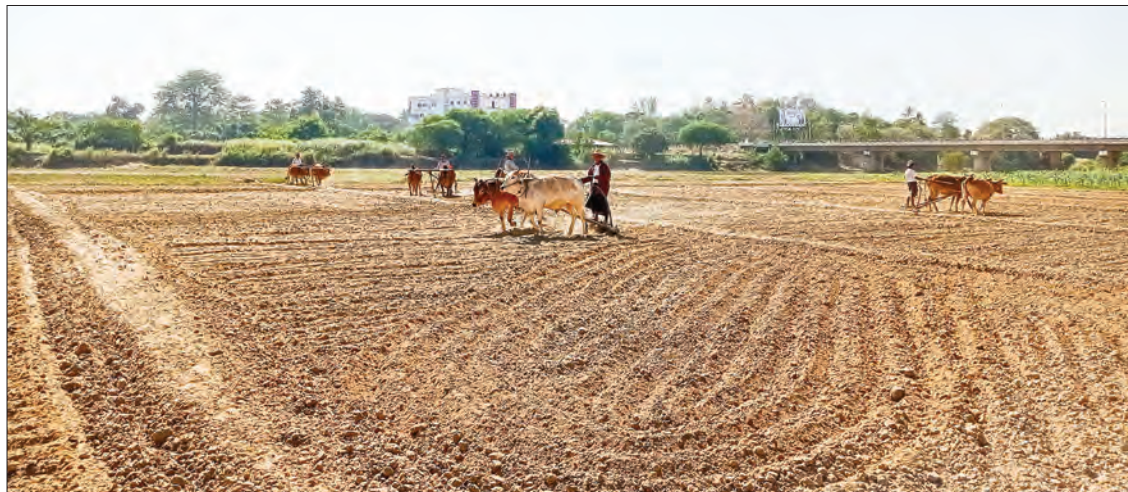
The prices of onions sharply dropped due to the bulk supply and the western border's closure amid the coronavirus resurgence.

The onions are primarily grown in Mandalay, Magway and Yangon regions, Nay Pyi Taw and Shan State.—Zeyar Htet, Ko Htet (Translated by Ei Myat Mon)