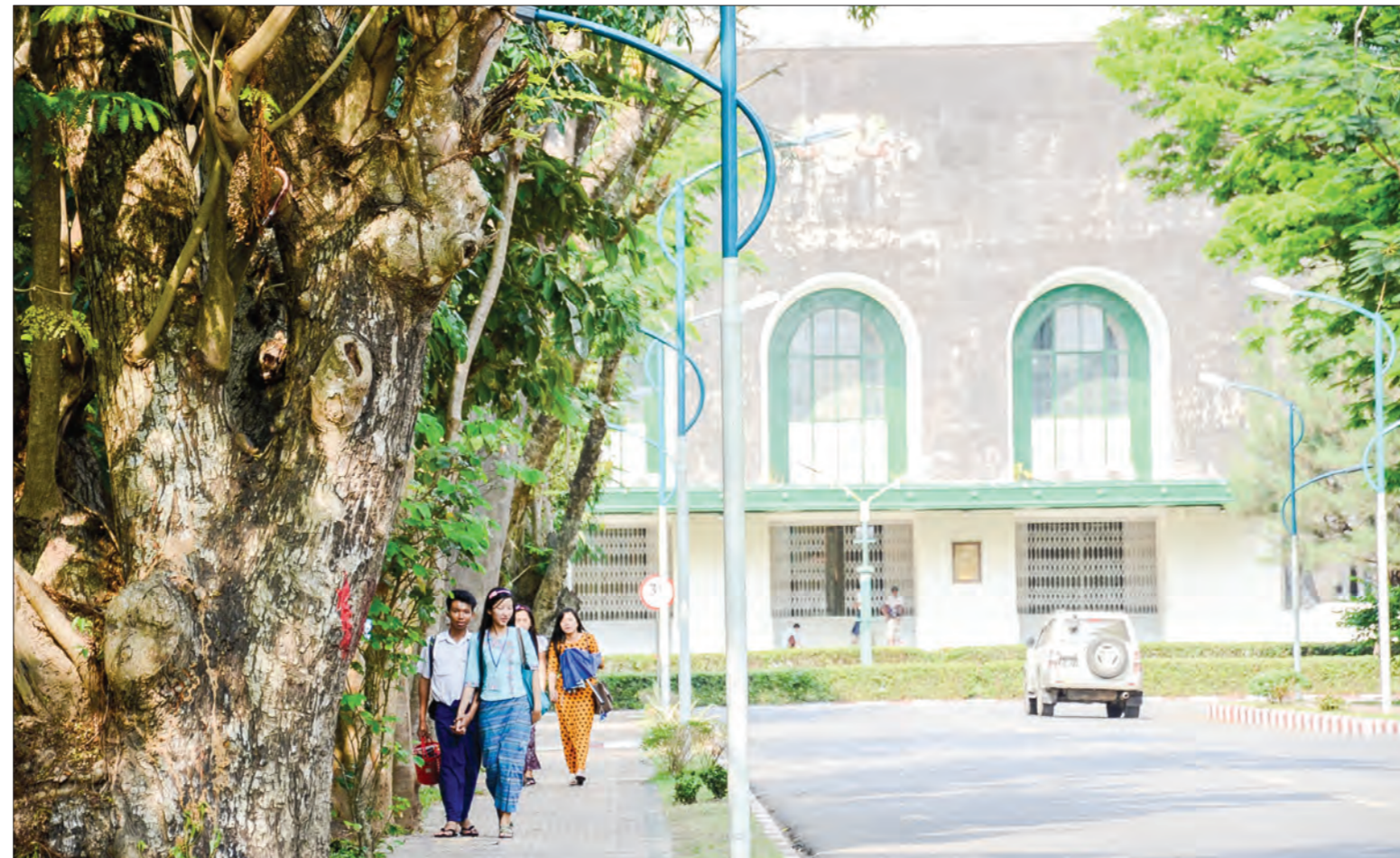
The University of Yangon, the first-ever university of Myanmar, is the greatest and most prestigious university in Myanmar's history.

Another "gentlemanly" behaviour we picked up at the university without anyone teaching us or imposing them on us was the table manners. Being a hostel student throughout my time at the university, I will be discussing this point from that perspective. Within a few days at the hostel most of us came