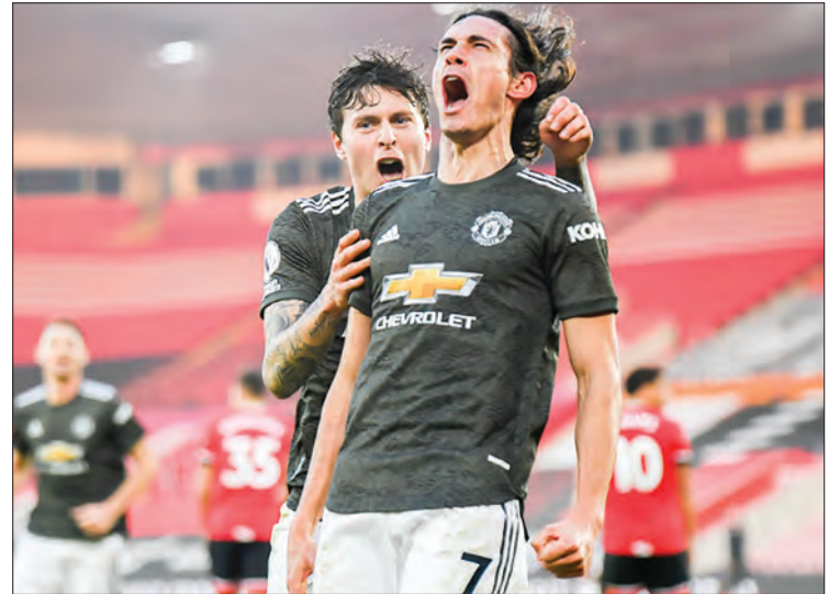
Manchester United manager Ole Gunnar Solskjaer wants to keep Edinson Cavani (right) at Old Trafford for another season.

Cavani will be available for the visit of Wolves to Old Trafford on Tuesday, but could soon be back on the sidelines after being charged by the Football Association with misconduct for a social media post. —AFP ■