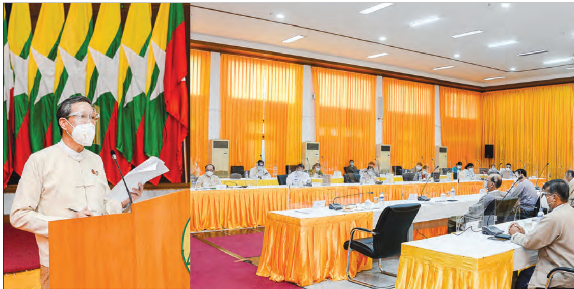
Discussion between Ministry of Education and Ministry of Health and Sports is in progress to prepare for school reopening plans depending on the situation of COVID-19 outbreak.

THE Ministry of Education and the Ministry of Health and Sports held a coordination meeting on preparations for reopening schools depending on the COVID-19 situation yesterday.