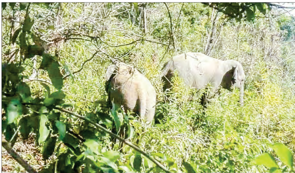
Nature and Wildlife Conservation Division of Forest Department conducted conservation measures in Thandwe and Gwa Townships of Thandwe District by cooperating with the officials of Rakhine Yoma Elephant Sanctuary in 2014.

THE Forest Department and Wildlife Conservation Society Myanmar Programme signed 6 MoUs since 1993 to enhance measures to conserve wild elephants in Rakhine State.