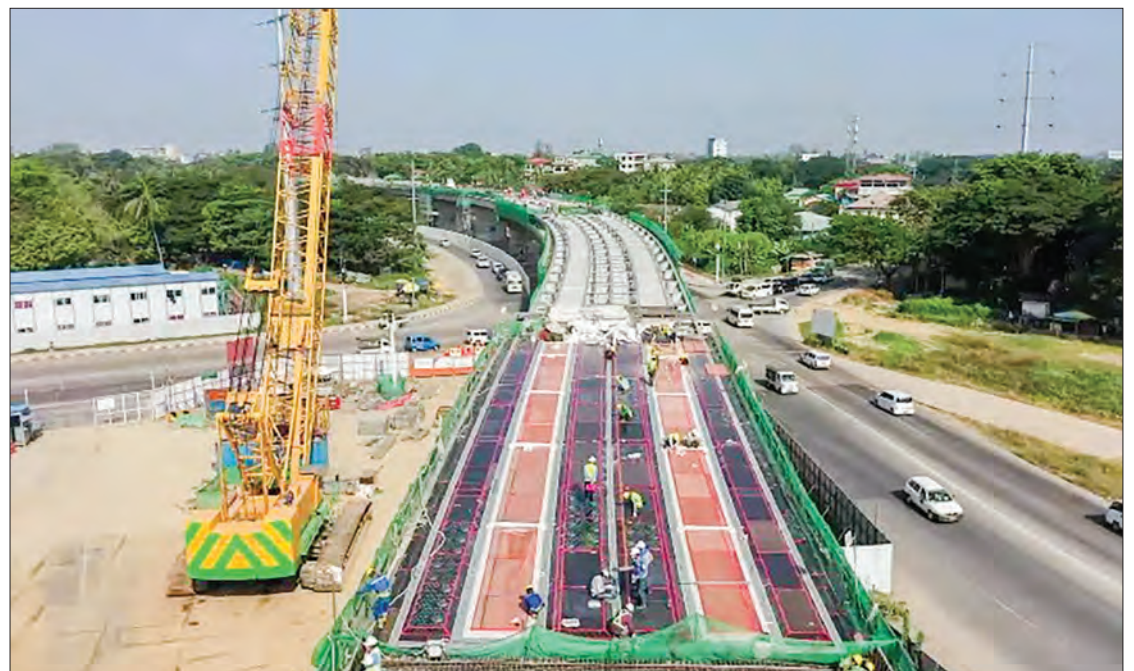
Thanlyin Bridge-3 connecting between Thanlyin and Thakayta townships in Yangon Region is seen under 83 per cent completion.

"This Bago River bridge will help speed up trade flow from Thilawa SEZ. It is the fastest shortcut route to link Yangon urban areas. The trade flow in Thilawa SEZ will tremendously grow in 20 to 30 years. As a result of this, Thanlyin Bridge-3 is being implemented. The bridge is constructed with the help of the Japan government's loan under three phases. Package 3 of the project located in Thakayta land area is nearly finished. The construction work is suspended for a while amid the stay-at-home order. Yet, the construction of Package 3 is completed more than we expected. Package 1 and 2 are located in the river, and the project is temporarily halted due to technical difficulty when Japanese experts cannot come yet amid the pandem-