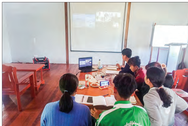
A training course of FFI- Myanmar Programme is in progress.