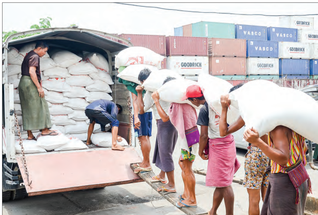
Workers carry rice bags onto a vehicle in Yangon.