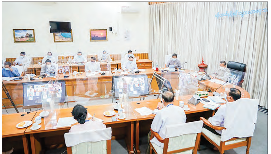
MoHT holds virtual discussions on the tourism recovery roadmap.

The ministry will also allow the ‘Day Trip Flight to Ngapali’, the ‘Day Trip Flight to Bagan’ and the ‘Caravan Tour’ in line with the rules and directives of MoHS after discussions with the relevant ministries, local governments and tourism organizations,