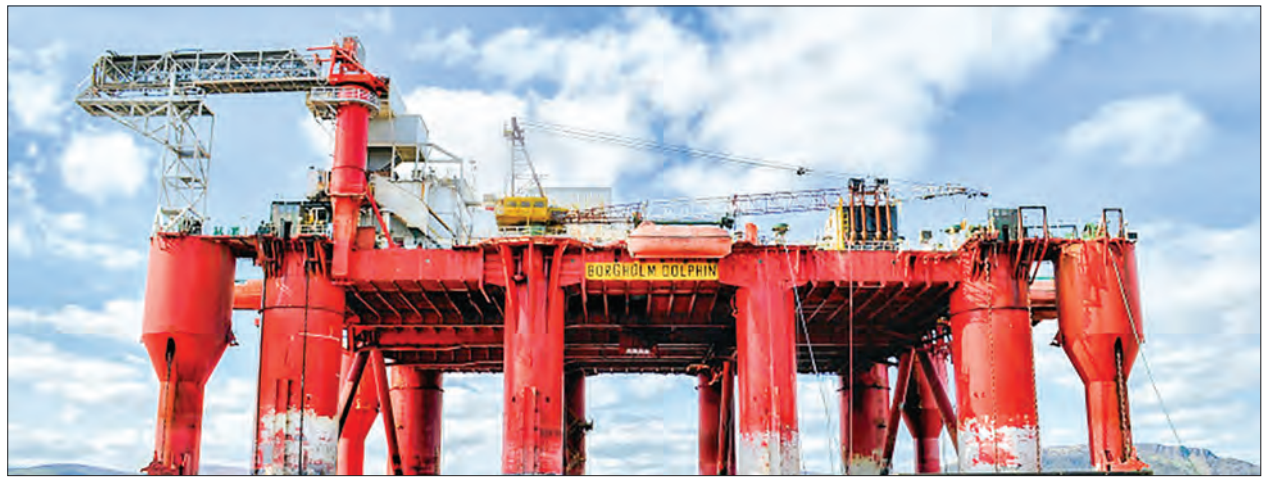
The Gulf of Thailand boasts significant oil deposits, with Chevron first finding proven reserves off Cambodia in 2005

KrisEnergy currently holds a 95 per cent stake of the block where the oil