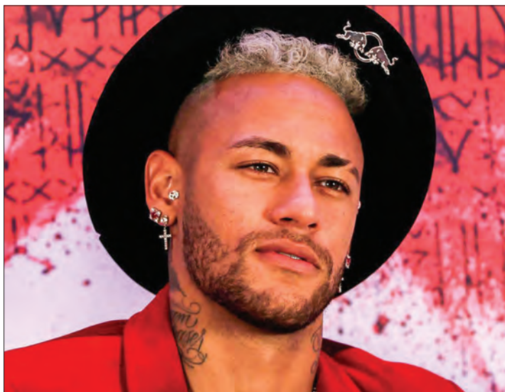
Paris Saint-Germain's Brazilian forward Neymar poses as he arrives at his birthday party in Paris on February 4, 2019.

SAO PAULO — Brazil's star footballer Neymar is at the centre of a new controversy after several Brazilian media reported that he is organizing a huge New Year's Eve party despite the coronavirus pandemic, a claim his lawyers denied.