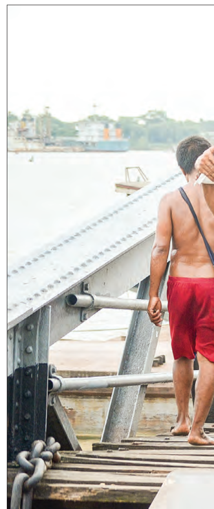
Workers unloading sacks of rice from a cargo ship.

To boost rice production, the country is tackling the challenges of erratic weather, capacity and technical know-how to produce value-added products and dependence on foreign market demand. The Ministry of Commerce recently confirmed that ASEAN countries such as Malaysia, Indonesia and the Philippines express