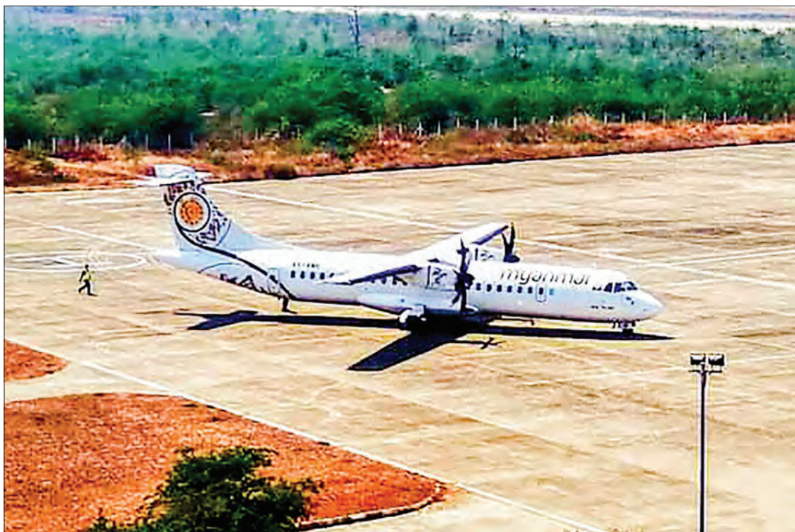
A Myanmar National Airlines (MNA) aircraft is seen at the Magway airport.

“We have submitted to the regional government regarding the tour. The regional government also allowed it after consultation with the Public Health Department.