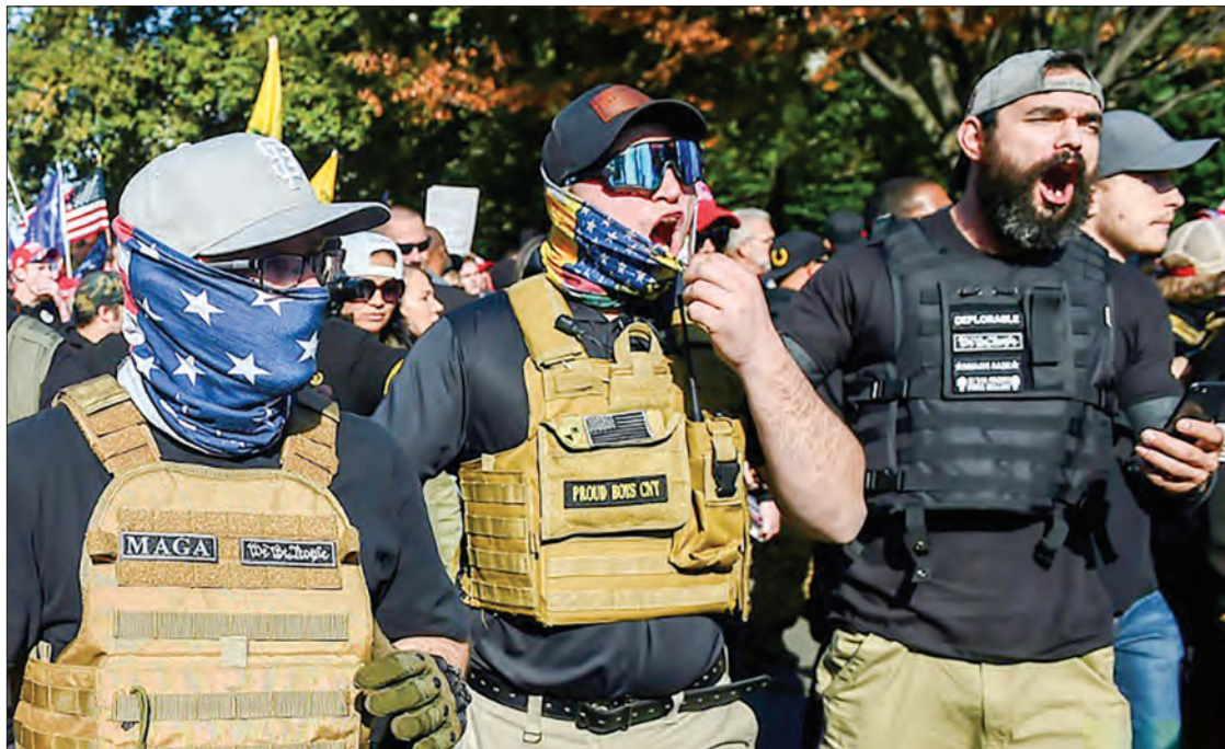
Members of the violent Proud Boys group are expected to attend a last-ditch rally for US President Donald Trump in Washington on January 6.

the protestors could pressure Congress to reject the final count of state-based electors and reverse his election loss.