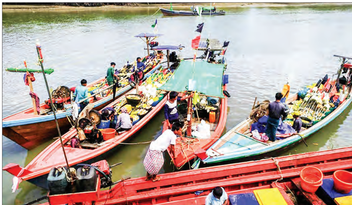
About 150 fishing boats from Maputay village can collect 2,600 kilogrammes of squids.