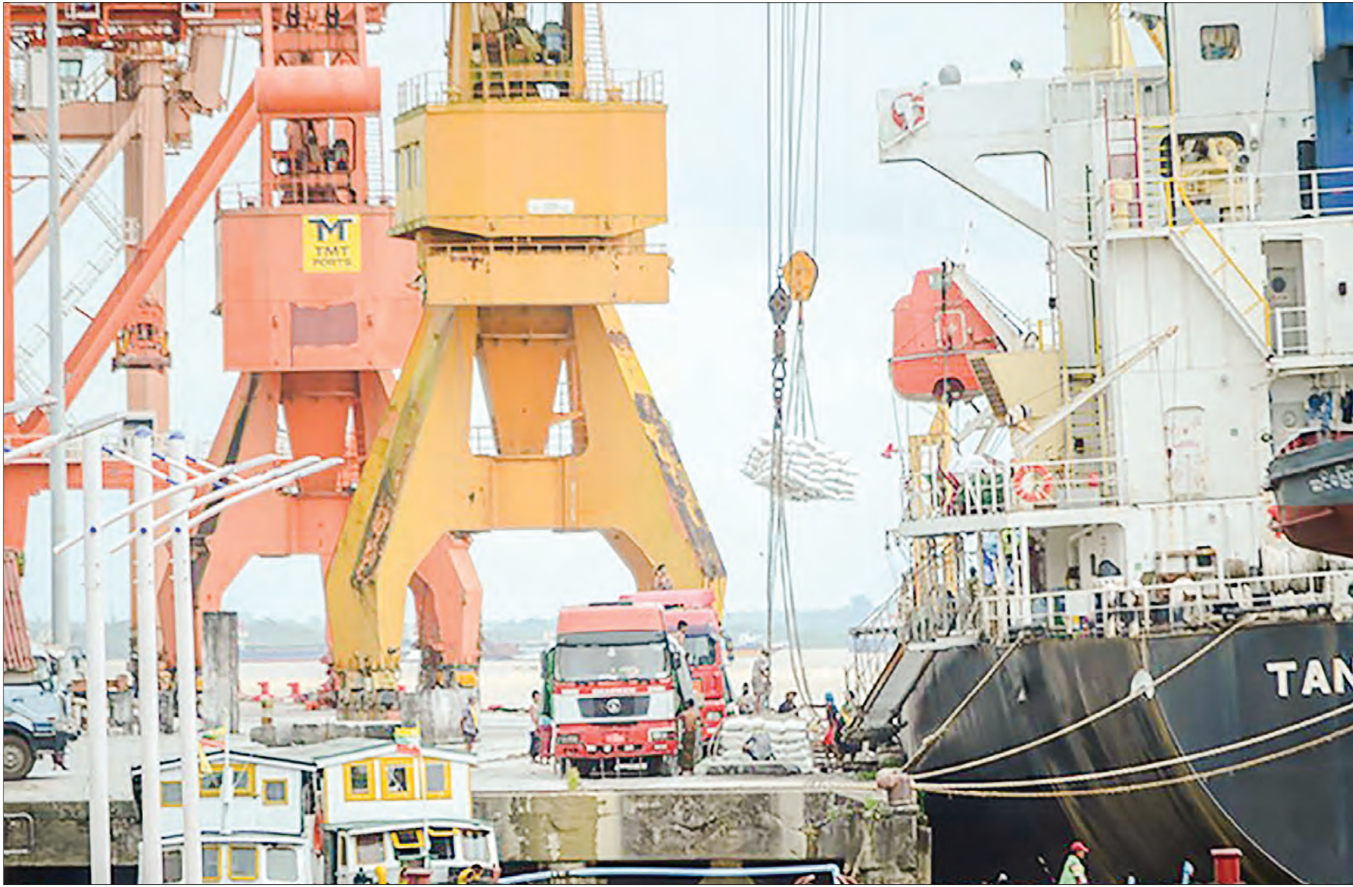
Myanmar ships 277,502 metric tons of rice and broken rice to foreign markets via sea in the current financial year.