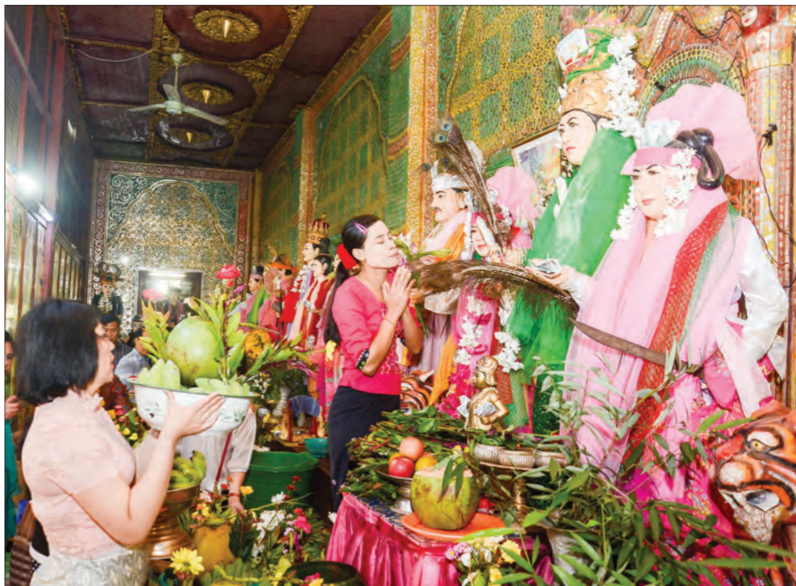
A Nat shrine on Popa Taung Kalat near Bagan.