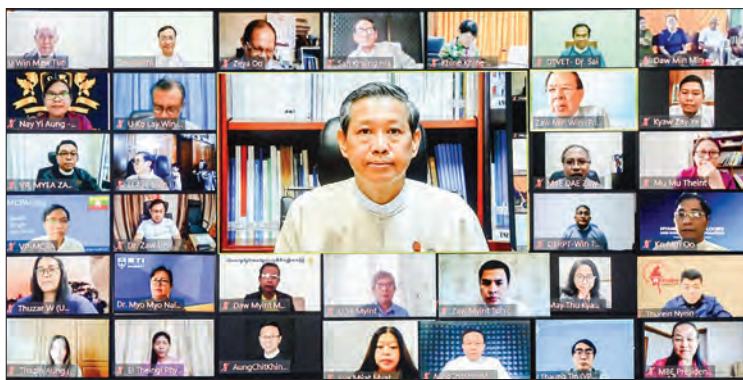
Union Minister Dr Myo Thein Gyi holds virtual meeting with UMFCCI over drafting NESP 2021-2030 on 28 December.

THE Ministry of Education organized a coordination meeting with the Union of Myanmar Federation of Chambers of Commerce and Industry, its partnered associations and individuals from the public-private partnership to discuss drafting the National Education Strategic Plan (2021-2030) yesterday morning via videocon-