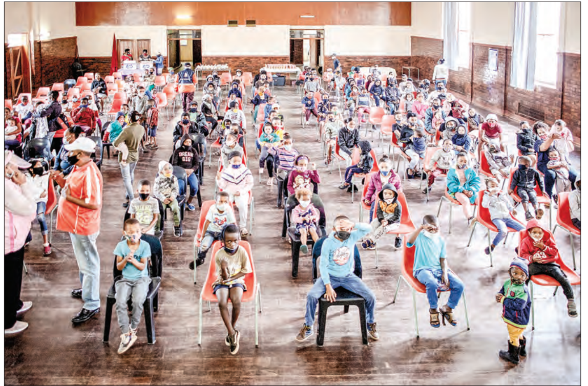
About 300 children gather at Coronationville Secondary School as they wait for a food and goods distribution ahead of Christmas, lead by the grassroots charity Hunger Has No Religion, in Coronationville, Johannesburg, on 23 December 2020.

South Korea became the latest nation Monday to detect the variant, in three individuals