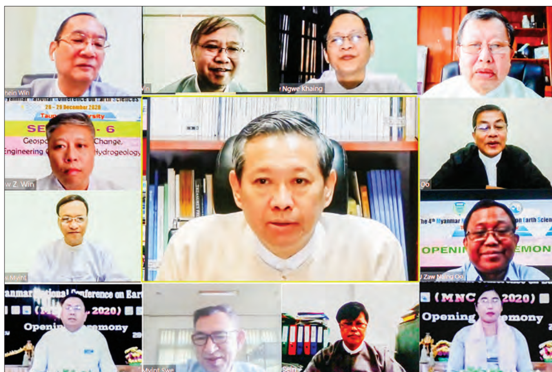
Union Minister Dr Myo Thein Gyi delivers the speech to the 4th Myanmar National Conference on Earth Sciences via videoconferencing on 28 December 2020.

At present, the Ministry of Education has encouraged Myanmar universities to collaborate with experts and international science organizations such as the ASEAN University Network, the Erasmus + University Network in order to build the capacity of teachers and students. He said that the lifeblood of the world is the 17 Sustainable Development