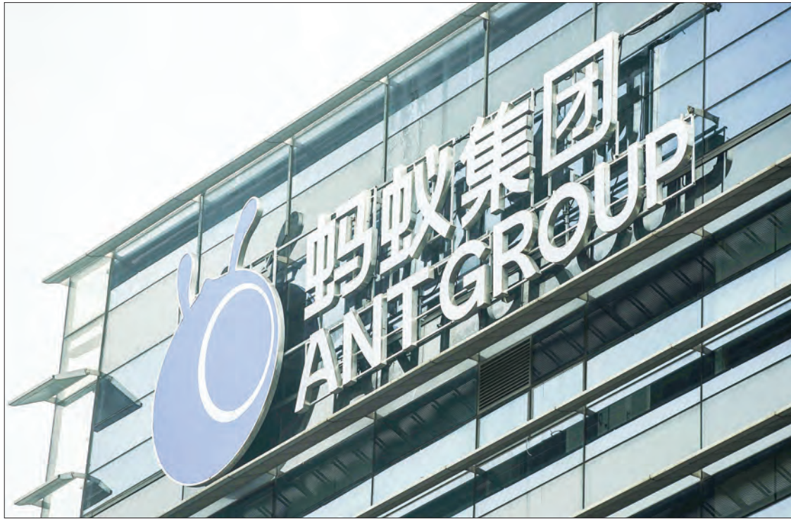
This photo taken on October 13, 2020 shows the Ant Group headquarters in Hangzhou, in China's eastern Zhejiang province.

nine percent in Monday trading in Hong Kong, as investors grow increasingly nervous over a company in the teeth of Beijing's regulators.