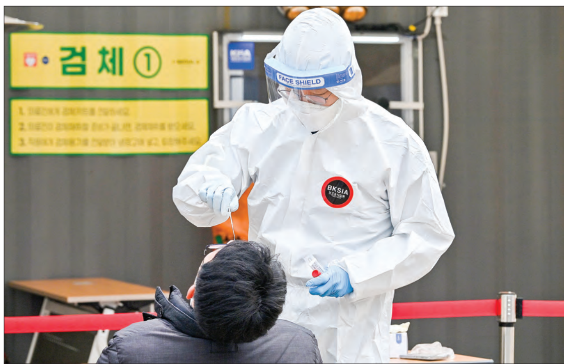
A medical staff member wearing protective gear takes a swab from a visitor to test for the Covid-19 coronavirus at a temporary testing station outside the City Hall in Seoul on 28 December 2020.

them and has barred flights from Britain until January 7. In addition, the country will make it mandatory for passengers travelling from Britain or South Africa to submit negative Covid-19 test results before departure, KDCA chief Jung Eun-kyeong said.