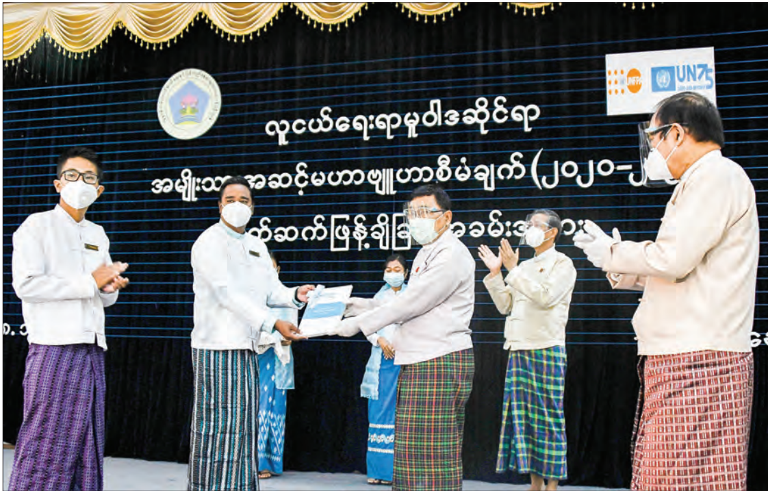
Union Minister Dr Win Myat Aye presents the National Strategic Plan for Youth Policy 2020-2024 to a member of Myanmar Youth Affairs Committee on 28 December 2020.