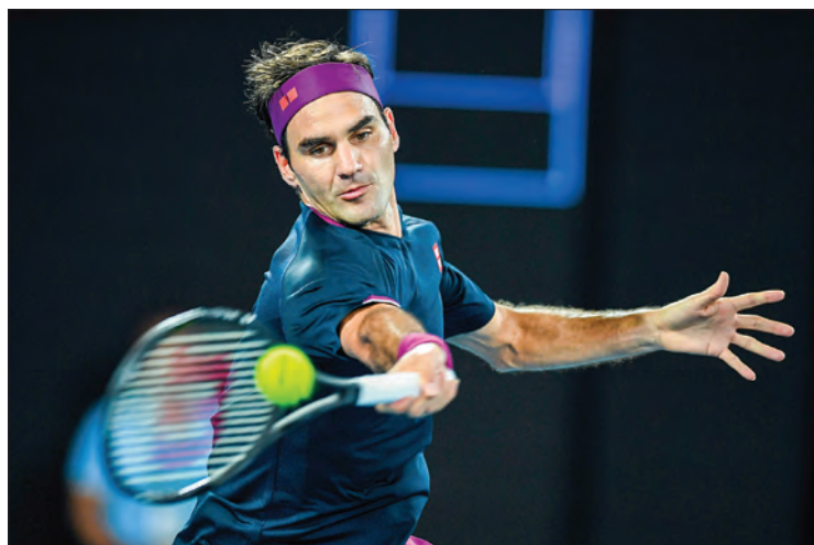
(FILES) In this file photo taken on 30 January 2020 Switzerland's Roger Federer hits a return against Serbia's Novak Djokovic during their men's singles semi-final match on day eleven of the Australian Open tennis tournament in Melbourne.

"Seeing him come back, having undergone major surgery and built himself back up to get onto the tour again, will be a highlight," Tiley said.—AFP ■