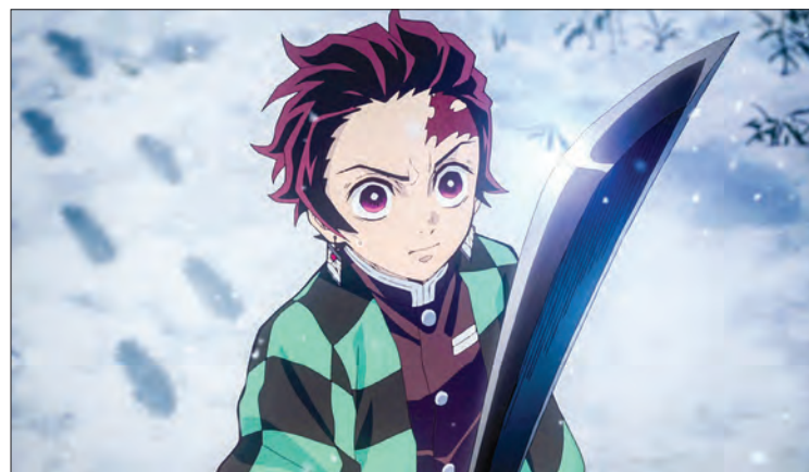
Supplied file photo shows a scene from "Demon Slayer -- Kimetsu no Yaiba -- The Movie: Mugen Train."

The movie directed by Haruo Sotozaki and the sequel to an anime television series aired in Japan last year, became the first film in the country to earn over 10 billion yen within 10 days of its premiere. It overtook "Titanic," the smash-hit 1997 American film about a romance aboard the ill-fated cruise liner of the same name, as the second-highest grossing movie ever in Japan on Nov. 30.