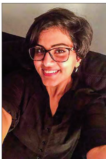
(FILES) In this file handout released on the Facebook page of Saudi activist Loujain al-Hathloul on August 6, 2019 shows her posing for the camera.

Hathloul, 31, was arrested in May 2018 with about a dozen other women activists just weeks before the historic lifting