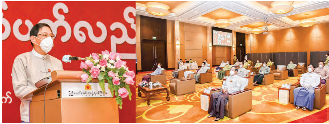
Union Minister U Min Thu speaks during the Anniversary Event of the Ministry of Union Government Office in Nay Pyi Taw on 28 December 2020.

A ceremony marking the second anniversary of the Ministry of the Office of the Union Government (MOUG) was held in Nay Pyi Taw yesterday morning.