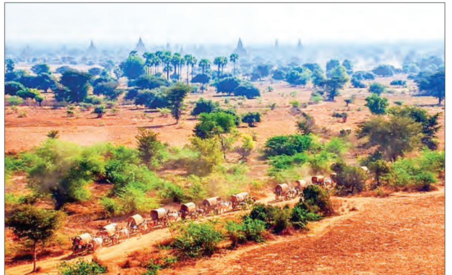
Landscape of Bagan Cultural Heritage Zone.

(Extract from the Message of Greetings sent by President U Win Myint on 4 January 2020 on the occasion of the 72 nd Anniversary of Independence Day.)