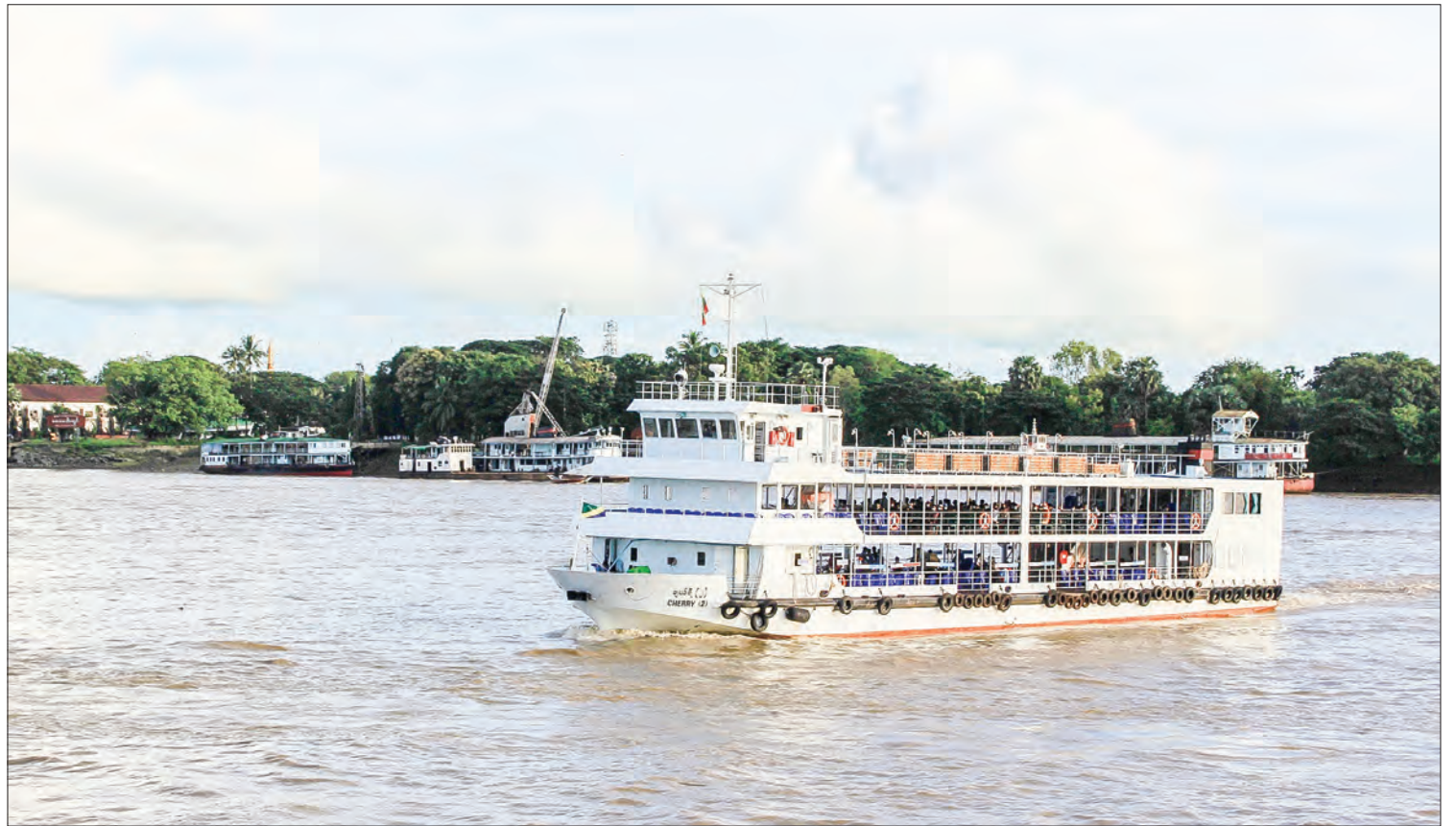
A vessel plying between Pansodan and Dala is seen in Yangon River.

YANGON Pansodan-Dala ferry service increased the schedule times to 34 rounds on 28 December to facilitate the passengers' transport and avoid the unnecessary crowd during rush hour.