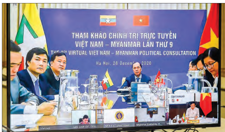
Myanmar and Viet Nam hold 9th Political Consultations via videoconferencing on 28 December 2020.

THE 9th Political Consultations between the Republic of the Union of Myanmar and the Socialist