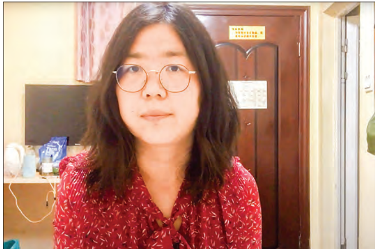
This screengrab taken on 28 December 2020 from an undated video showing former Chinese lawyer and citizen journalist Zhang Zhan as she broadcasts via YouTube, at an unconfirmed location in China.