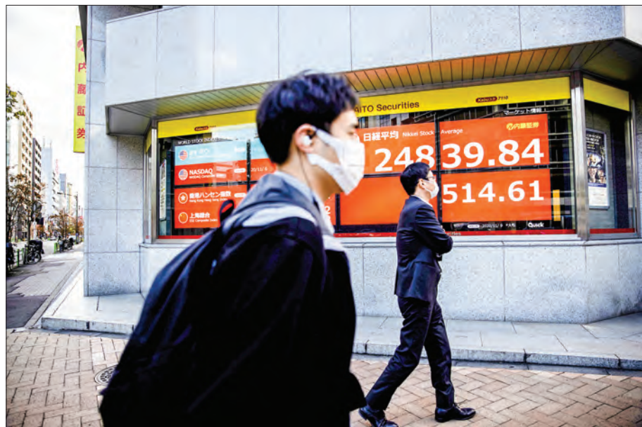
A pedestrian wearing a face mask walks past an electronic board displaying the closing numbers of Nikkei 225 index in Tokyo on November 9, 2020.

ASIAN markets were mixed Monday as US President Donald Trump signed a massive coronavirus relief bill, with a boost in positive sentiment dampened by concern over a new strain of Covid-19.