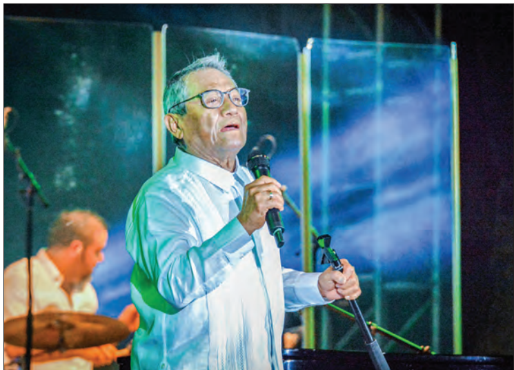
(FILES) In this file photo taken on July 15, 2018, Mexican singer and composer Armando Manzanero performs during his show in Havana.

MEXICAN singer-songwriter Armando Manzanero died Monday at the age of 86 after being hospitalized with the coronavirus, sparking an outpouring of tributes for one of the country's best-loved musicians.