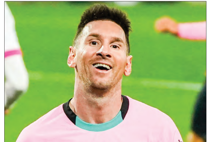
Barcelona's Argentine forward Lionel Messi smiles during the Spanish league football match between Real Valladolid FC and FC Barcelona at the Jose Zorrilla stadium in Valladolid on 22 December 2020.

MADRID (Spain) — Lionel Messi remained coy on his future at Barcelona in a long interview broadcast on Sunday in which he called the Catalan giants "my life".