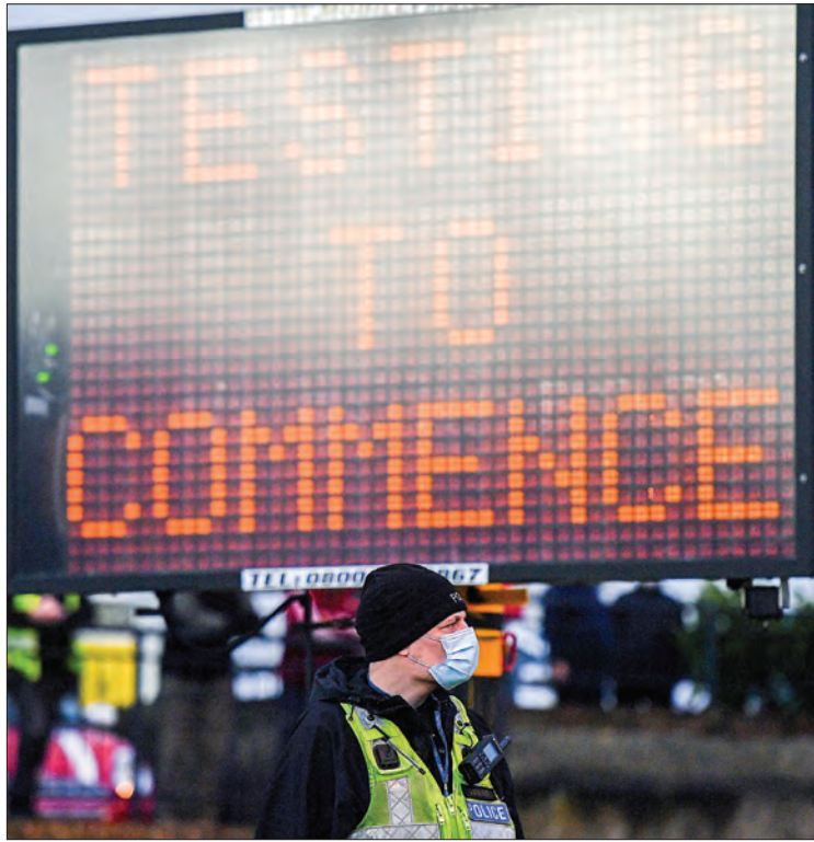
Police officers stand on duty at beneath a sign reading "Testing to Commence", at the entrance to the Port of Dover in Kent, south east England, on December 23, 2020, where COVID-19 testing is set to begin on drivers who have been queueing to leave the UK.

HERE are the latest developments in the coronavirus crisis: