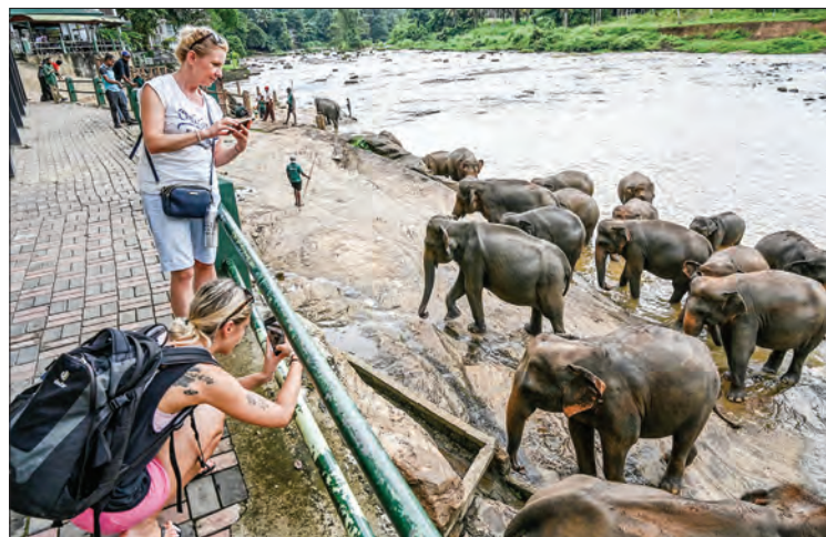
In this photograph taken on 20 November 2019, tourists take pictures of a herd of elephants from the Pinnawala Elephant Orphanage walking near a river in Pinnawala about 90 kms from the capital city Colombo.

SRI Lanka welcomed its first foreign tourists in nine months Monday even as a new deadlier strain of the coronavirus gripped the island.