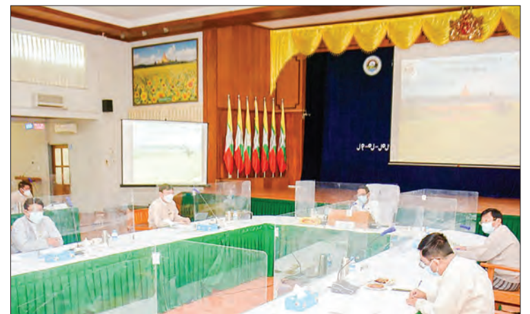
Central Farmland Management Body organizes its 35th Coordination Meeting on 28 December 2020.

meeting also focussed on farmland procedure law Section 30 (A) of 34, 35 and 36, rules and regulations. The Central Farmland Management Body scrutinized the application of central bodies from Nay Pyi Taw Council and regions/states on the application of land use in accordance with the rules and laws.—MNA (Translated by Aung Khin)