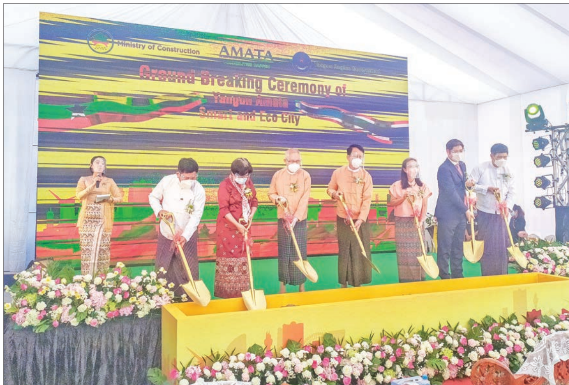
Yangon Region Chief Minister U Phyo Min Thein participates in the groundbreaking ceremony of Yangon Amata Smart and Eco City in Dagon Myothit on 27 December 2020.

THE groundbreaking ceremony marked yesterday Thailand-backed Yangon Amata Smart and Eco City project on 2,000 acres of land near Dagon Myothit (East) and (South) townships.