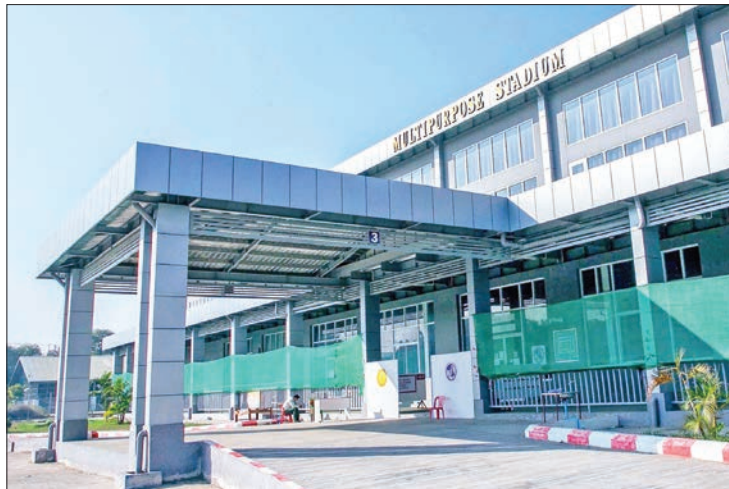
The front view of the multi-purpose stadium in Mandalay.

The Ayeyarwaddy Foundation has been testing people in Mandalay District since 22 December at the Ayeyarwady Centre (Mandalay).