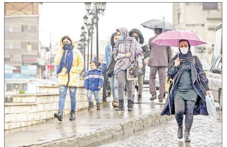
People wearing face masks walk on a street in Tonnekabon, northern Iran, Dec. 6, 2020.