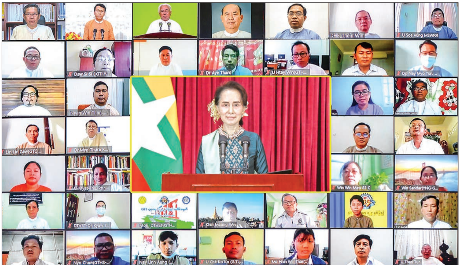
State Counsellor Daw Aung San Suu Kyi delivers the virtual message to the 125 th anniversary online celebration of GTI.

Union Minister for Education Dr Myo Thein Gyi, Yangon Region Chief Minister U Phyo Min Thein, Deputy Minister U Win Maw Tun, Deputy Ministers from ministries related to the Technical Vocational Education and Training (TVET) sector, the Permanent Secretary and Directors General from the Ministry of Education, TVET Stakeholders; heads of Govern-