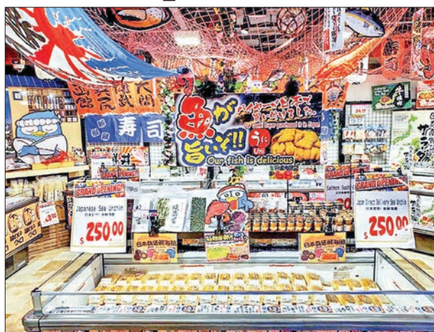
Undated supplied photo shows Japanese sea urchin and other seafood exported to and sold in Hong Kong by Pan Pacific International Holdings Corp.

JAPAN has drawn up an action plan to achieve its goal of boosting farm exports to 2 trillion yen ($19 billion) by 2025, aiming to make products such as "wagyu" beef and sake more competitive in the global market.