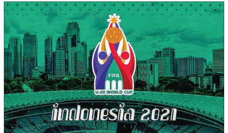
FIFA has postponed next year's U-20 World Cup in Indonesia and U-17 tournament in Peru until 2023 due to coronavirus.

The two events follow other international football competitions to fall victim to the virus, with Euro 2020 held over until next June, the Copa America moved to the same date, and the Africa Cup of Nations, held over until January 2022.—AFP ■