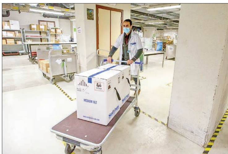
Several EU nations were set to begin vaccinating their most vulnerable groups Sunday as a new coronavirus variant spread internationally and the WHO warned the current pandemic will not be the last.

"History tells us that this will not be the last pandemic, and epidemics are a fact of life,"