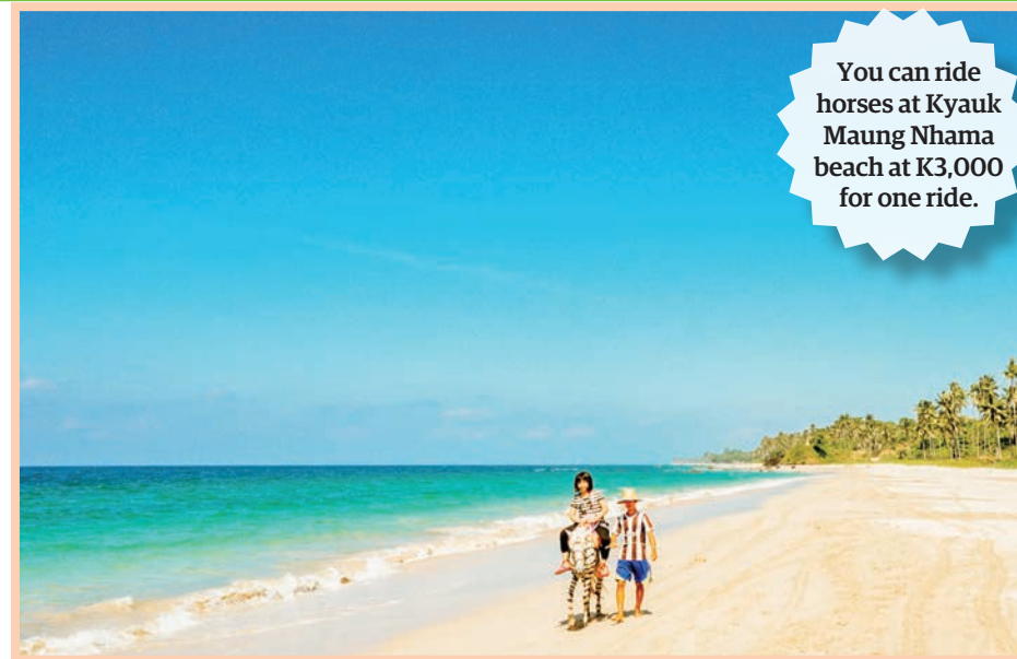
You can ride horses at Kyauk Maung Nhama beach at K3,000 for one ride.

It would be best if you did not say it could be done only with money. I think you