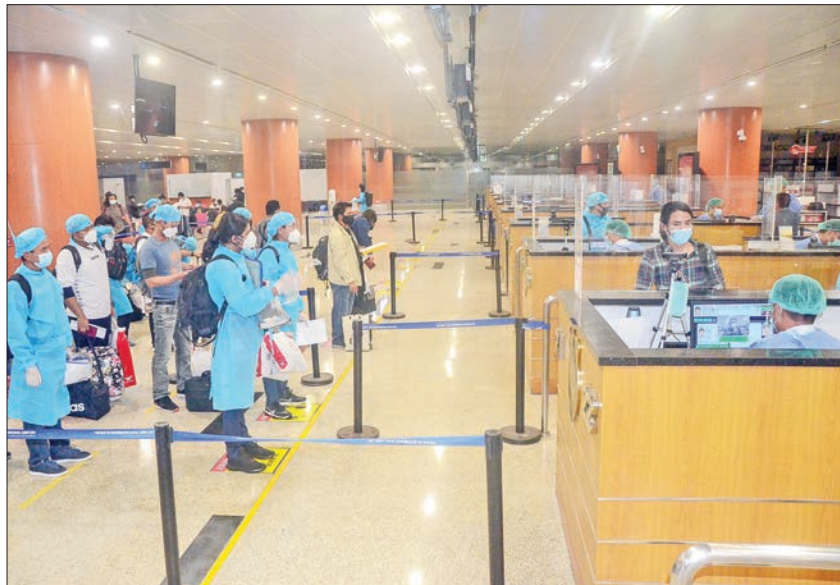
Myanmar returnees are seen at the Yangon International Airport on 27 December 2020.

A total of 170 Myanmar citizens including seamen who were stranded in foreign countries – 40 from Bangladesh and 130 from the Republic of Korea – because of the suspension of commercial flights returned home by relief flight yesterday.