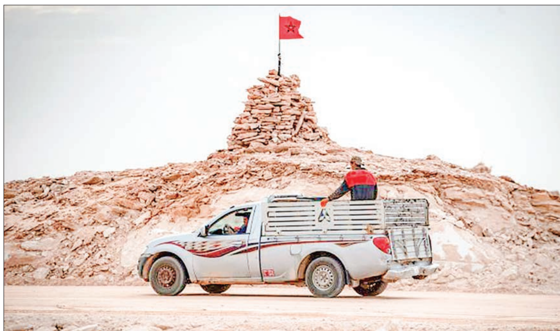
A hilltop manned by Moroccan soldiers in the Western Sahara. The Polisario Front said it was returning to war because Morocco had breached a 1991 ceasefire agreement by sending forces into a demilitarized area.

Britain becomes the first country to leave the European Union on January 31 following its 2016 Brexit referendum.