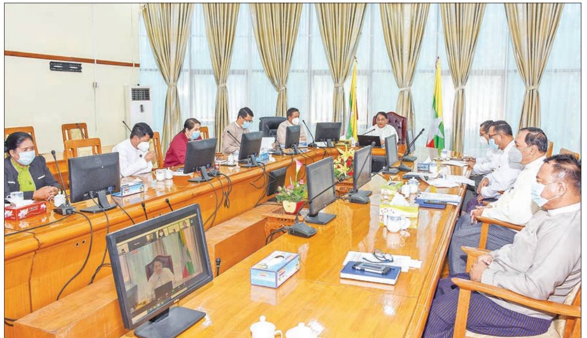
Union Minister for Commerce Dr Than Myint participates in the third Annual General Assembly of Myanmar Avocado Producer and Exporter Association on 27 December 2020.

Commercial Attaché from the Myanmar Embassy in Singapore explained about the avocado market, and officials from the association presented their