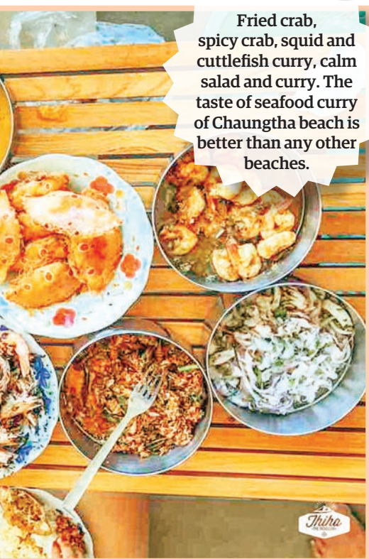
Fried crab, spicy crab, squid and cuttlefish curry, calm salad and curry. The taste of seafood curry of Chaungtha beach is better than any other beaches.

I think Chaungtha is the best place for seafood in Myanmar. Supposing it offers cheap and delicious seafood. You can choose various types of seafood. Most of the beaches are not perfect like this. Whenever I stay there, I order food for lunch and dinner. I eat a lot of baked, roasted, fried or cooked seafood including salad and curry. In the past, I ordered