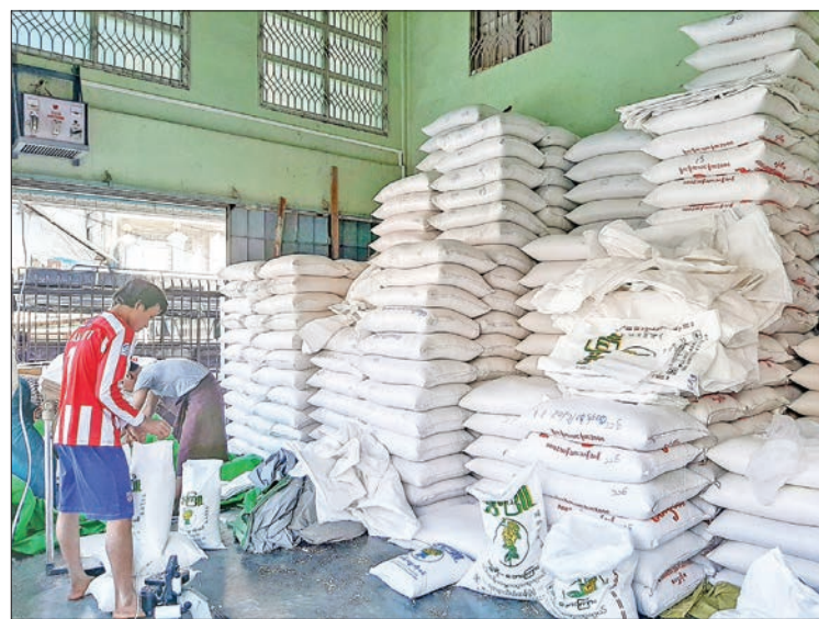
(FILES) Workers bag rice at a warehouse.

The export price of Myanmar's rice is relatively lower than the rates of Thailand and Viet Nam. Yet, the prices are higher than those of India and Pakistan's market prices,