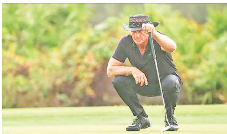
Australian golf champion Greg Norman says he is quarantining at home after spending Christmas in the hospital with Covid-19 symptoms.

ed a photo of himself with medical equipment in the background, an NFL Pittsburgh Steelers mask over his lower face and the caption: “This sums it all up. My Christmas Day.”—AFP ■