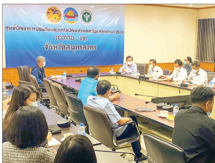
Myanmar Ambassador to Thailand holds meeting with Thai authorities on providing necessary assistance for Myanmar migrant workers on 24 December 2020.

MYANMAR Ambassador to Thailand and party visited Myanmar migrant workers in Mahachai seafood market in Samut Sakhon Province, Thailand, where the coronavirus outbreak was occurring, on 24 December.