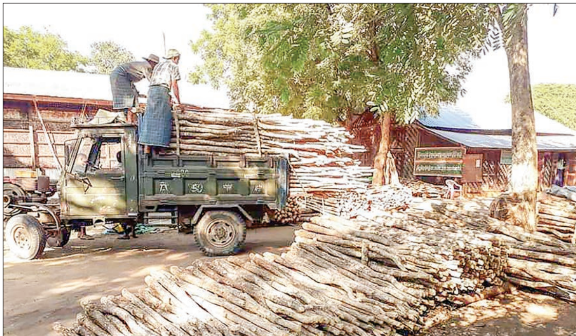
Two men unload Thanaka wood blocks from a vehicle.

Thanaka produced by Ayadaw Township is sent to wholesale depots in Pakokku, Yesagyo, Bago and Kyonpyaw towns. The demand from the Thanaka val-