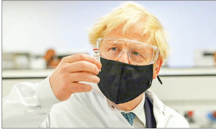
Britain's government under Boris Johnson has bet big on the AstraZeneca vaccine.

The UK government announced on December 23 that the developers of the Oxford-AstraZeneca vaccine had submitted their data to the Medicines and Healthcare products Regu-