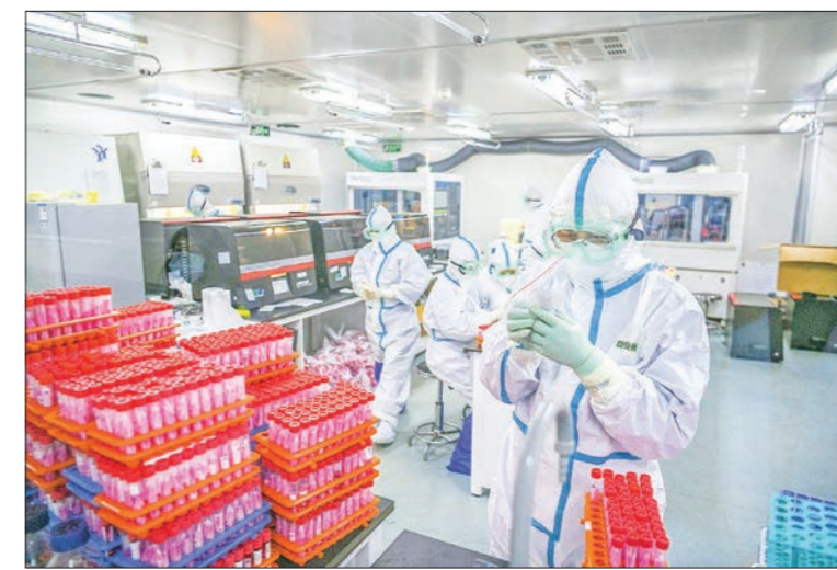
Technicians process COVID-19 coronavirus tests at a laboratory in Tianjin, China.

According to the FDA, the Pfizer-BioNTech vaccine can result in painful reactions on the arm