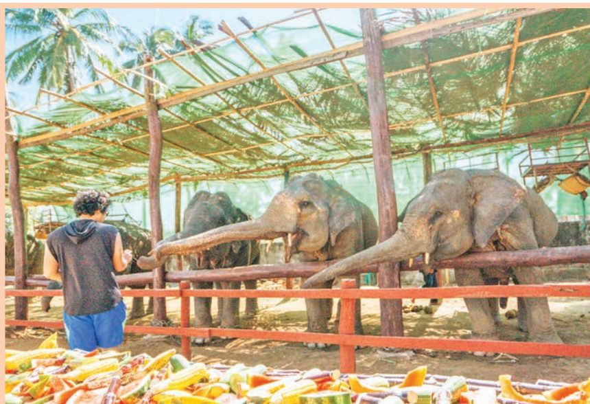
Elephant camp just before entering Chaungtha township. Now, there is an elephant camp at Kyauk Maung Nhama beach between Chaungtha and Shwe Thaug Yan beaches. It is easier to get there.

Chaungtha offers many beach games. A banana boat ride will give excitement, and so most of the youths enjoy it. Those do not dare to ride can watch the riders just from the Speed Boat that pulls the Banana Boat. Even if you cannot swim, the life jackets will keep you afloat. I did not ride it as I have a fear of water.