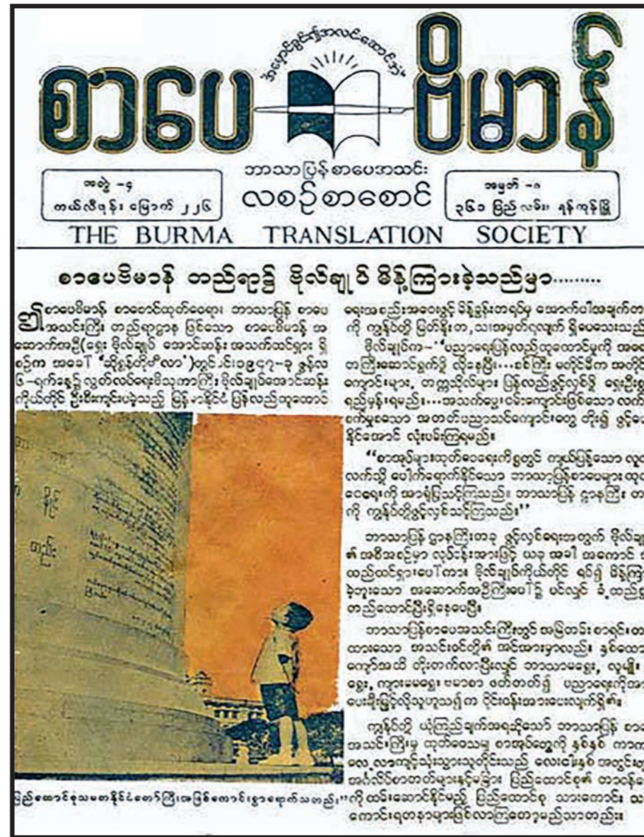
A periodical of The Burma Translation Society. The Burma Translation Society was renamed "Sarpay Beikman" (Palace of Literature) in 1963.

Another equally important aspect of translation is the need for translating informative material from Myanmar language to English and other foreign languages for the benefit of