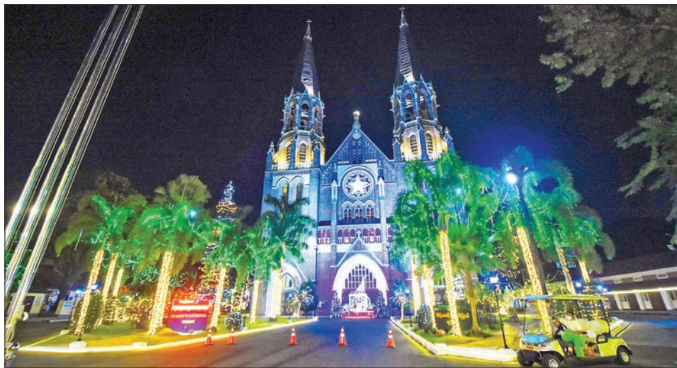
Christmas lights illuminate St. Mary's Cathedral in Yangon on 25 December 2020.