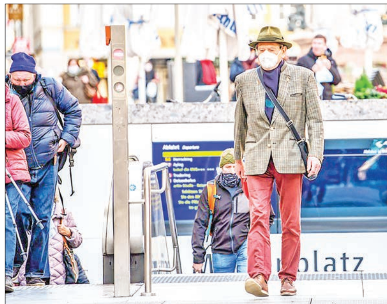
Pedestrians wearing face masks are seen in Munich, Germany, on Nov. 13, 2020.

MORE than 25 million coronavirus cases have been officially recorded in Europe, according to an AFP tally based on official health statistics at 1100 GMT on Friday.