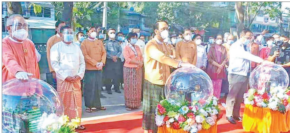
Yangon Region Chief Minister U Phyo Min Thein inaugurates Pyi Taw Thit Public Housing in Yangon on 25 December 2020.

"The project is jointly conducted by the government and private sector. The Ministry of Construction and regional government cooperates for the redevelopment project. We will develop the mindset to relocate the original apartment owners at the housing and continue carrying out the urban