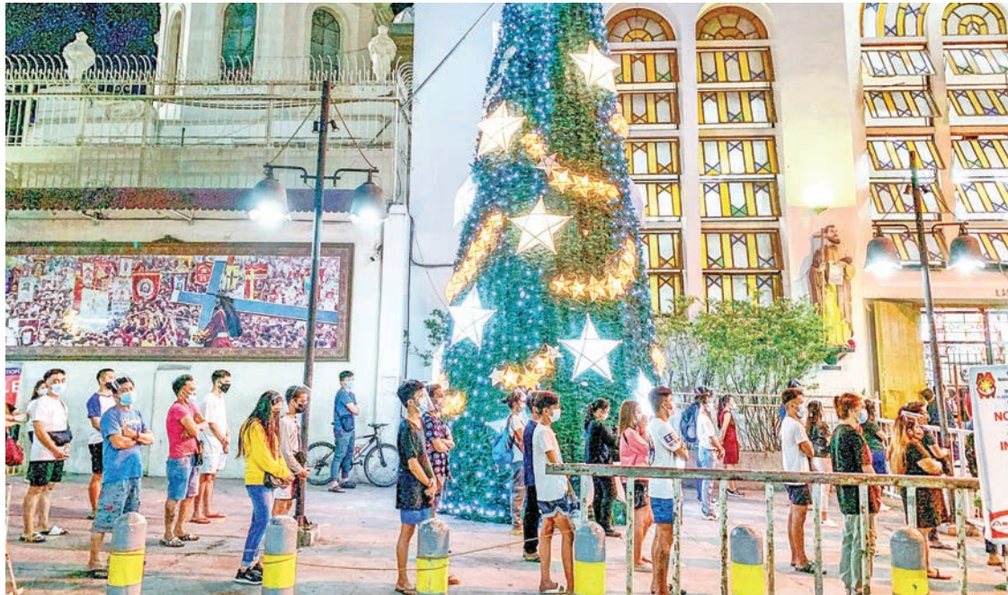
Catholic devotees attend a Christmas eve mass maintaining social distancing to prevent the spread of the Covid-19 coronavirus, outside the Quiapo church in Manila.

"I call on everyone, on leaders of states, on businesses, on international organizations, to promote cooperation and not competition, to find a solution for everyone: vaccines for all, especially the most vulnerable and most in need in all regions of the planet." The pandemic had come at a "moment in history, marked by the ecological crisis and grave