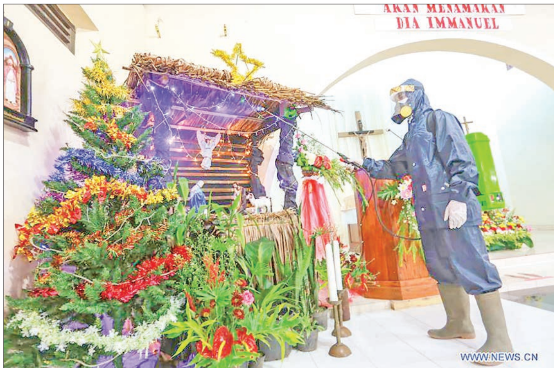
A man wearing protective suit sprays disinfectant as preparation for the upcoming Christmas amid the COVID-19 outbreak at a Church in Yogyakarta, Indonesia, Dec. 24, 2020.

THE sacrifices made to protect people during the coronavirus pandemic must not be squandered over the festive period, the World Health Organization's chief said in a Christmas message.