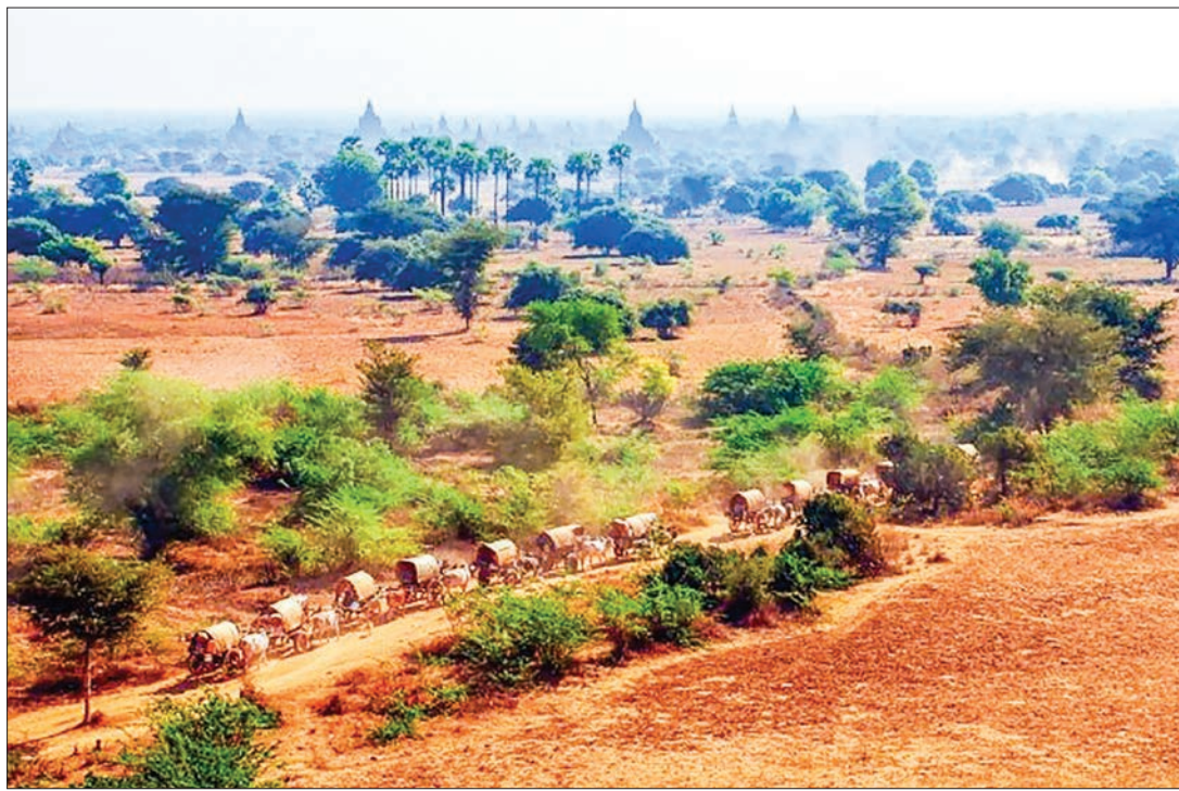
Landscape of Bagan Cultural Heritage Zone.

(Extract from the Message of Greetings sent by President U Win Myint on 4 January 2020 on the occasion of the 72 nd Anniversary of Independence Day.)