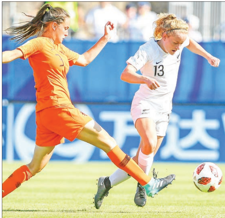
Members from the Asian Football Confederation (AFC) will have six direct slots for the 32-team 2023 FIFA Women's World Cup which will be held in Australia and New Zealand.

Thus, China will compete with other Asian teams for the remaining five direct tickets to the event.—Xinhua ■