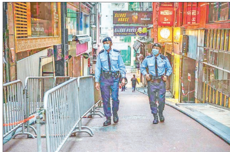
Police patrol a party district making sure bars are abiding by Covid-19 coronavirus restrictions in Hong Kong on December 24, 2020.

dents returned to Hong Kong from the UK might have been