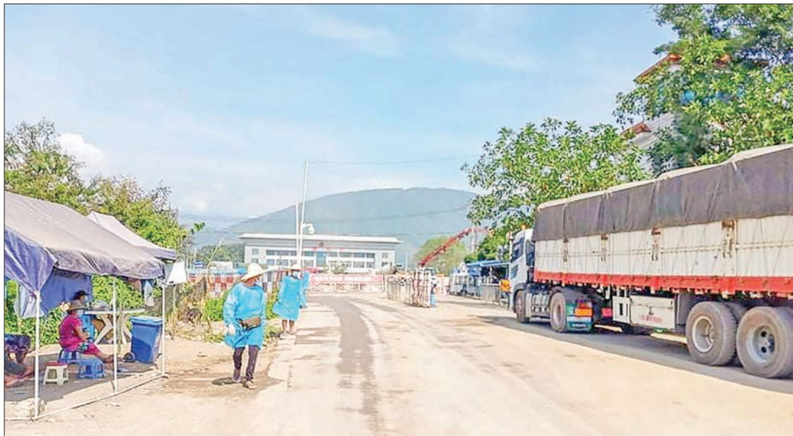
Picture shows a lorry at a border checkpoint between Myanmar and China.

"The border authorities' requirements from the Myanmar