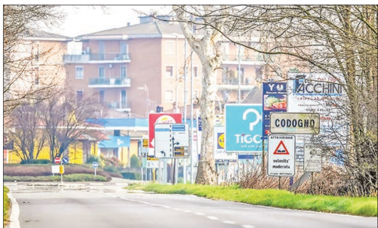
At the start of the year, Italy has become the first European country to take drastic isolation measures as it grapples to get its COVID-19 outbreak under control. The town of Codogno, one of 11 under coronavirus lockdown in northern Italy.

ITALY on Thursday entered a nationwide red zone of very high risks forced by a spike in COVID-19, which is set to remain in place through Christmas and New Year’s Day to Jan. 6.