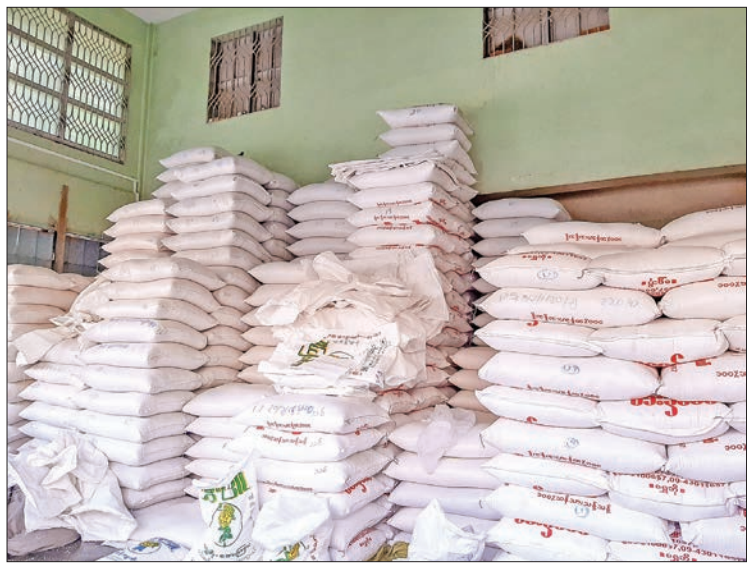
Rice bags are stored in piles at a warehouse.