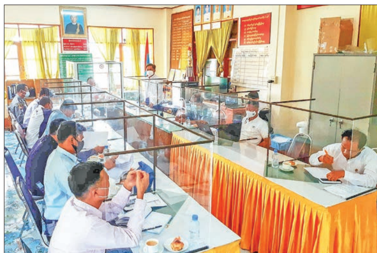
Kawthoung District-Level Destination Management Organization organizes meeting on tourism revival on 25 December.

KAWTHOUNG District-Level Destination Management Organization (DMO) held a coordination meeting on tourism revival in accordance with the health directives of the Ministry of Health and Sports yesterday in Kawthoung.