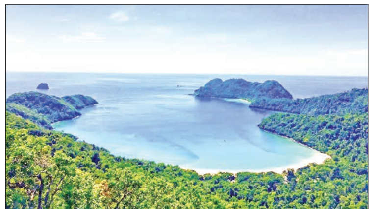
Kawthoung District DMO aims to develop tourism destination based on the traditional culture and natural resources of the region.