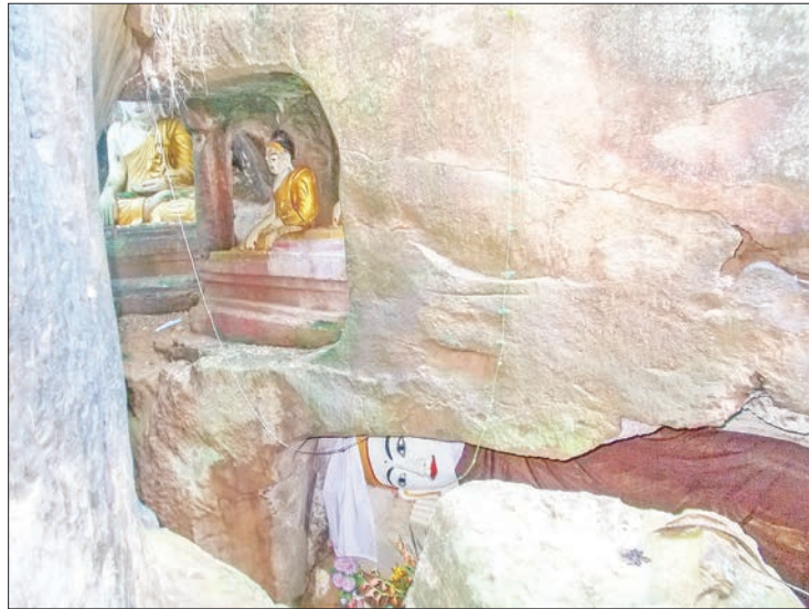
Artistic Buddha statues are seen at the Myinkhwataung (Horseshoe Mountain) in Kanbalu Township.

MYINKHWATAUNG (Horseshoe mountain), located near Wattoe village in Kanbalu District, is an exciting place to visit in Sagaing Region. The mountain is also next to the Kin Tat Dam, the main