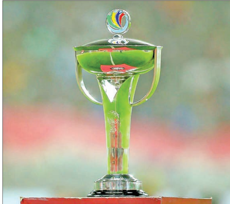
AFC tournaments are the highest level of competitions at the Asian level. Two Myanmar football teams: Shan United and Hanthawaddy United will join the AFC tournaments next year.

THE drawing ceremony and workshop for the 2021 AFC Champions League (ACL) and AFC Cup (ACC) group stages will be held in January and February 2021 via video conferencing, according to an official statement with the AFC.