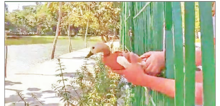
A Hintha (Ruddy Shelduck) is released into Kandawgyi Lake in Yangon.

They also released 200 ducks during last weeks at the Kandawgyi Lake. Although there are many rare species of plants and birds at the lake, the water clean-up operation for the water birds has been slow.—Thant Zin Win (Translated by Ei Phyu Phyu Aung)