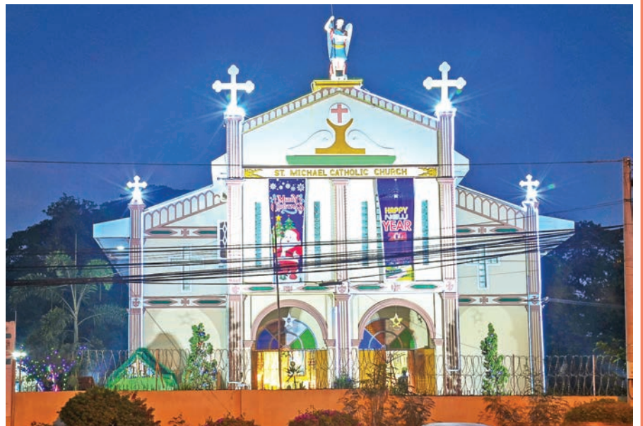
St. Michael Catholic Church in Pyinmana is seen on Christmas, 25 December 2020.