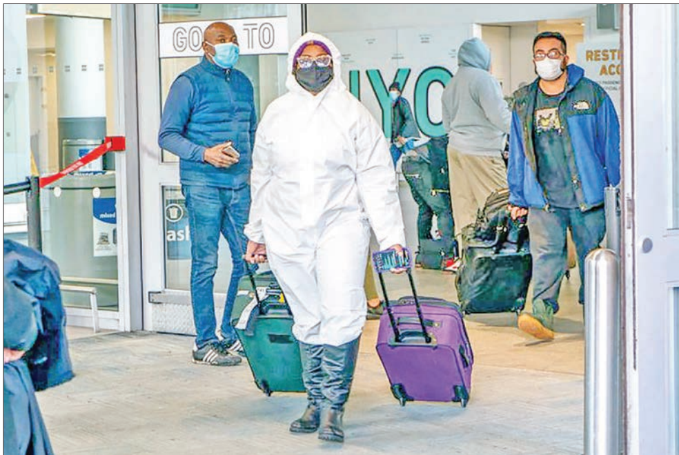
Travellers arrive at terminal 4 at JFK International airport in New York on December 22, 2020.