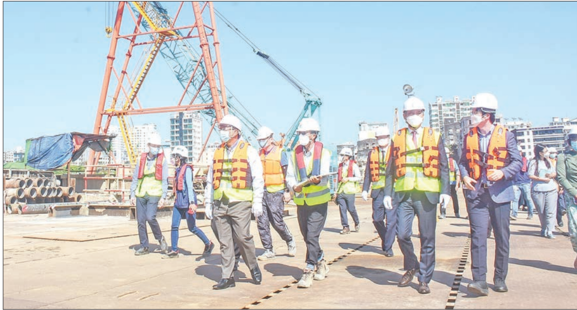
A delegation from the Republic of Korea visits the Myanmar-Korea Friendship Bridge (Dala) Project in Yangon on 25 December 2020.

Chairman of the Presidential Committee on NSP Mr Park Bokyeong said that despite a bridge that links between Yangon and Dala, it can be said that the one that links between ROK and Myanmar, adding that people who cross