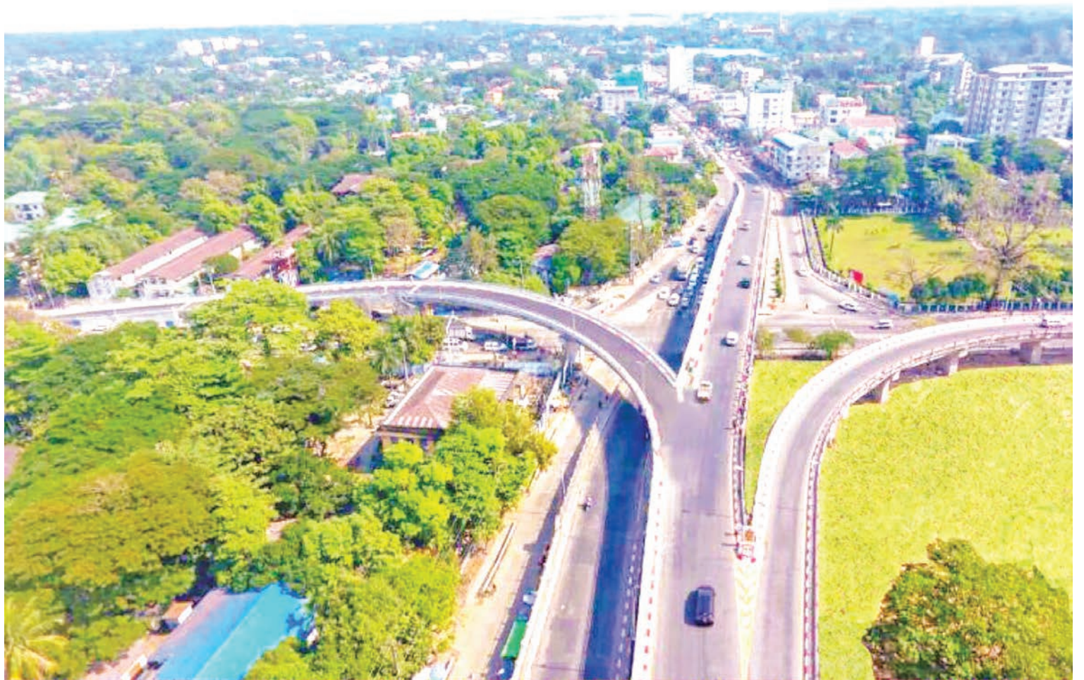
Picture shows aerial view of Insein Railway Flyover 2 at the corner of Lan Thit Road and Mingyi Road in Insein Township, Yangon Region.

It is reported that the new bridge (2) will have direct access to Insein Hospital, Government Technological Institute (Insein), District