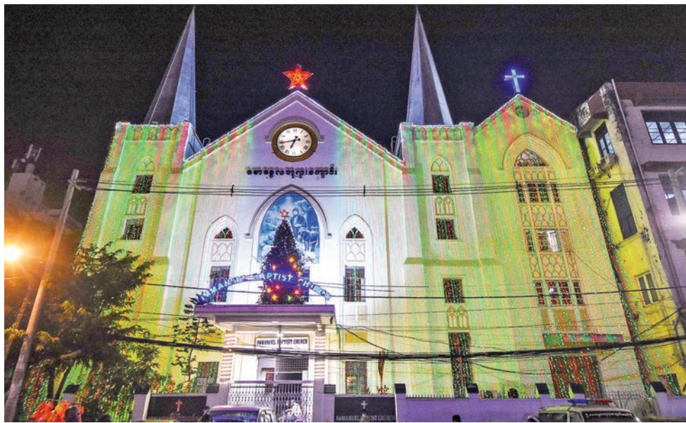
Emmanuel Baptist Church in downtown Yangon is decorated with Christmas lights on 25 December 2020.