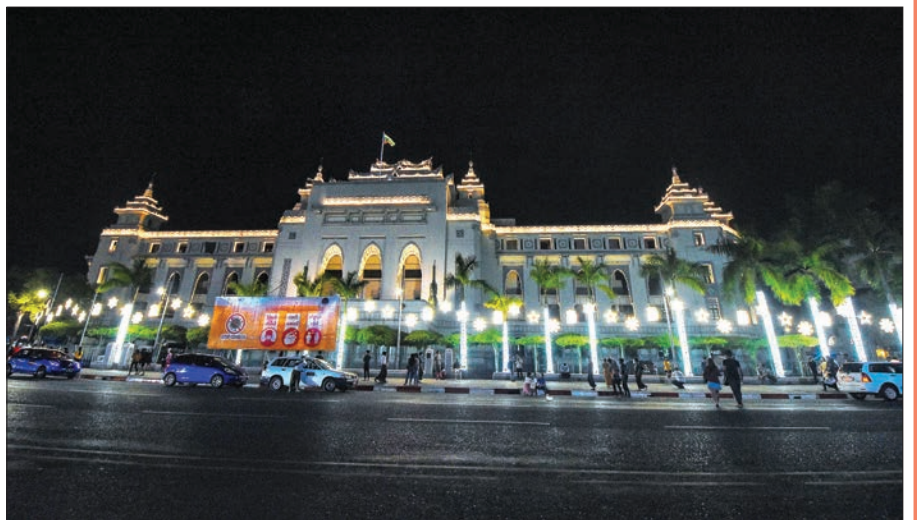
Yangon City Hall decorated with lights is seen on 25 December 2020.