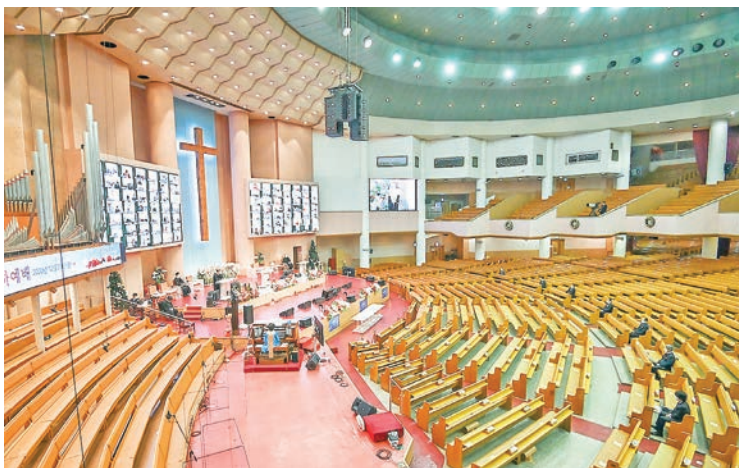
Followers on the screen attend an online Christmas service at the Yoido Full Gospel Church in Seoul on December 25, 2020, amid precautions due to the Covid-19 coronavirus.