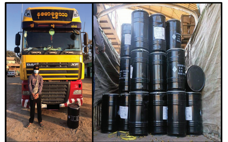
Suspect Zaw Htet is seen with confiscated Sodium Cyanide.