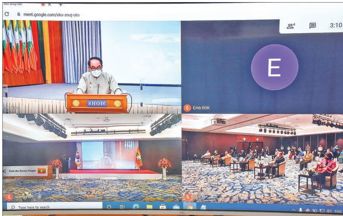
Union Minister Dr Myint Htwe speaks at the virtual ceremony of ROK and UNHCR donating face masks and ambulances to MoHS on 25 December 2020.

He also highlighted the more substantial bilateral relation between Myanmar and ROK through donations and planned to cooperate with ROK to reduce the impact of COVID-19 on businesses and