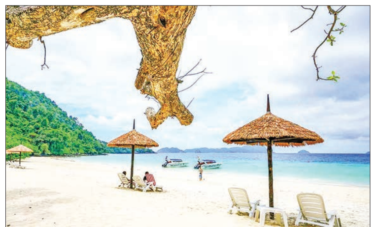
(FILES) Visitors are seen on a beach in Kawthoung.