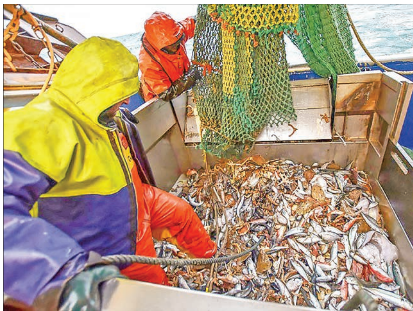
Fishing had been the subject of bitter last-minute wrangling in the post-Brexit trade deal.