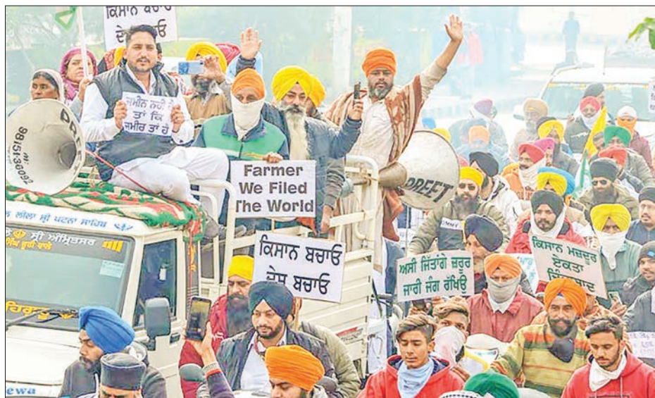
Farmers hold placards and shout slogans against Narendra Modi during a protest in Amritsar on 13 December.

INDIAN Prime Minister Narendra Modi on Friday offered to hold fresh talks to end a stalemate over new agricultural reforms, in his latest push to win over farmers protesting for almost a month against