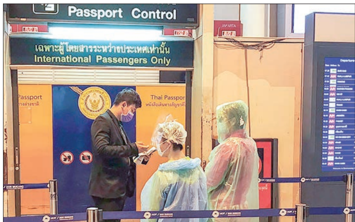
Passengers wearing face masks and disposable ponchos get their passports checked at Don Mueang International Airport in Bangkok, Thailand.

COVID-19 is everywhere, literally, and during 2020 its spread and resulting impact has led to a global crisis of unprecedented reach and proportion. In a six-part series closing out this tumultuous year, UN News looks at the impact on people in every part of the world and some of the solutions that the United Nations has proposed to deal with the fall-out of the pandemic. In this first feature, we lay out some of the key events of the past 12 months. As 2020 comes to an end and people around the world try to make sense of how the world has changed, they are faced with one stark and brutal statistic. The number of people who have died after catching COVID-19, is creeping towards the two million mark. Early in the year, international travel was severely restricted, and people like these travellers in Thailand learnt of the importance of PPE, an acronym which quickly entered the global lexicon (which is short for personal protective equipment). Soon, there were concerns about a global shortage of PPE and the UN supported various countries in the procurement of supplies, including China where the virus first emerged. As COVID-19 took hold, countries and cities across the world entered lockdown with the closure of schools, cultural and sports venues and all non-essential businesses. Normally bustling city centres, like the Kenyan capital Nairobi, were eerily quiet as people stayed at home.