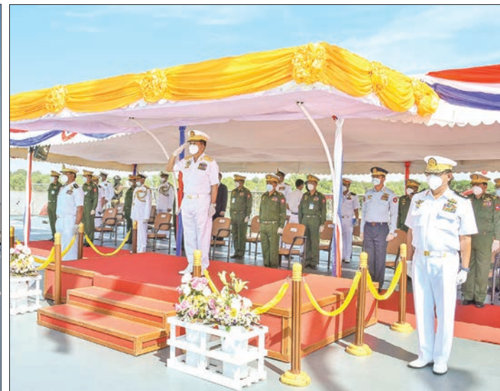
Commander-in-Chief of Defence Services Senior General Min Aung Hlaing attends the commissioning ceremony of naval vessels at the No 3 Naval Jetty in Yangon to mark the 73 rd Anniversary of Tatmadaw Navy on 24 December 2020.