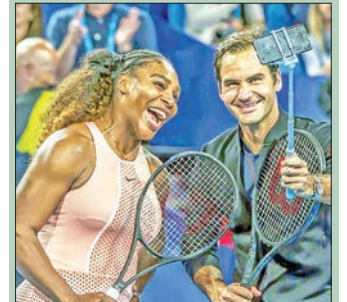
Roger Federer and Serena Williams are among the entries for the delayed Australian Open, which will begin three weeks later than scheduled on February 8.