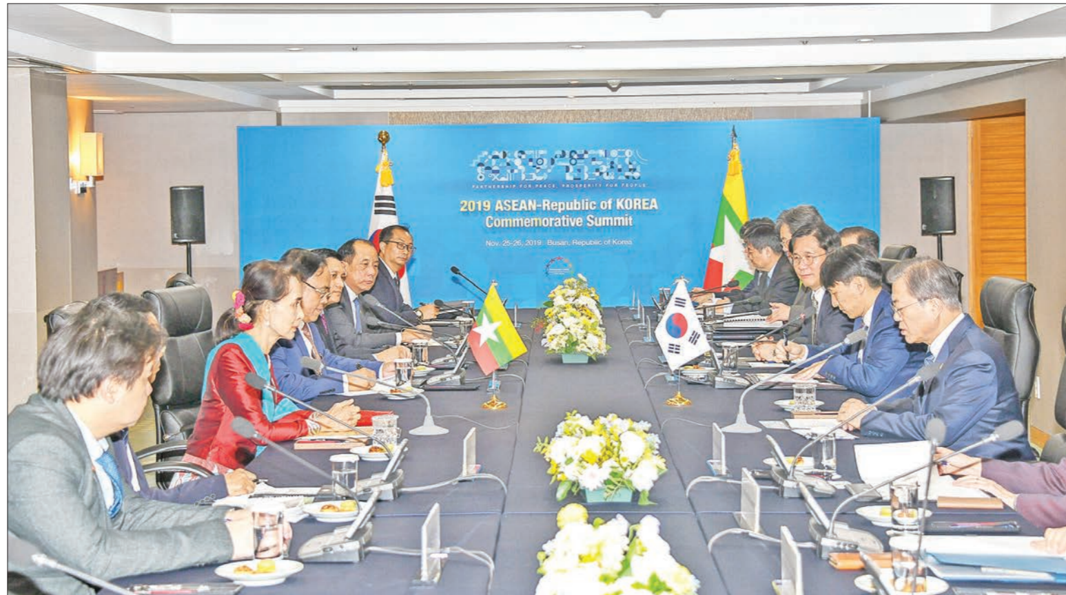
State Counsellor Daw Aung San Suu Kyi and President of Korea Mr Moon Jae-in hold the bilateral meeting between Myanmar and ROK at the Westin Chosun Busan Hotel on 26 November 2019.

In the context of business partnership, KMIC will serve as a new, powerful engine for Korean investment in Myanmar. As a Korean government-led industrial complex, the first of such nature and scale in Myanmar, KMIC is highly expected to strengthen Myanmar's industrial sector and in return, contribute positively in creating new jobs. Ever since Myanmar started its arduous journey for democracy and economic reform, the country has been considered as the last frontier market in the region. Such perception has since been gaining more traction and momentum, especially under the COVID-19 context, which served as a wake-up call for restructuring global value chains. As the most resourceful country in the Mekong