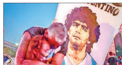
After his death, Maradona's coffin was taken to the presidential palace to lie in state as thousands of fans flocked to say their farewells.

At the end of his life he was suffering from a variety of illnesses including cirrhosis, heart disease and kidney failure.—AFP ■