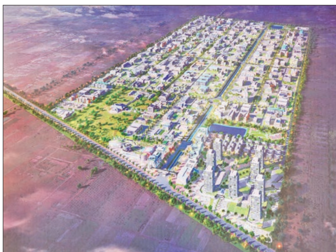
Picture shows Conceptual Design of Korea-Myanmar Industrial Complex.