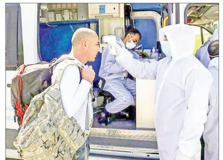
A Palestinian worker gets his temperature checked as he returns home from working at an Israeli settlement via the Mitara checkpoint in the occupied West Bank city of Hebron on March 25.