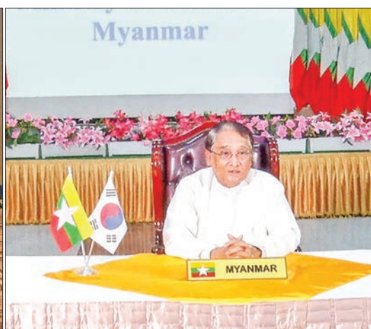
Union Minister Dr Than Myint delivers video message to the Myanmar Korea Desk in Lotte Hotel, Yangon on 24 December 2020.

UNION Minister for Commerce Dr Than Myint addressed the opening ceremony of Myanmar Korea Desk held in Lotte Hotel, Yangon, through a video message