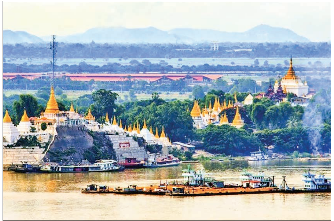
Shwe-Kyet-Yet and Shwe-Kyet-Kya Pagoda.

(Extract from a speech delivered by General Aung San on 11 February 1947 in Panglong at a dinner with Sawbwas)