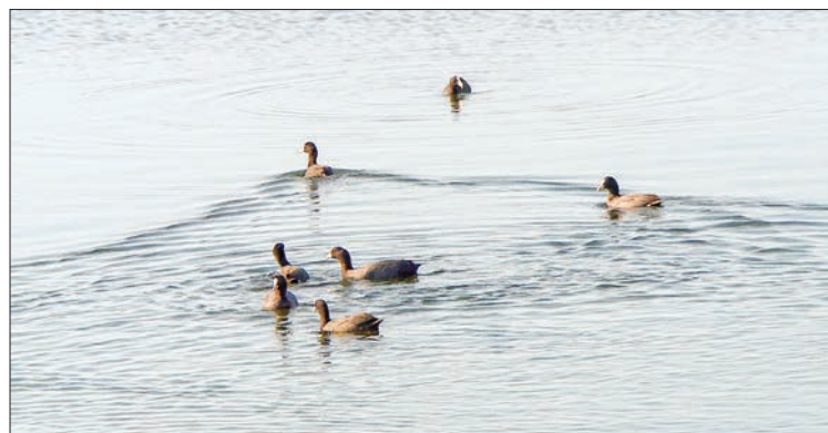
Numbers of migratory birds visiting wetlands of Mandalay Region decline this year.

“According to the nature of migratory birds, they inhabit in the lakes depending on the food. The number of birds is decreasing this year. We can see only 3 or 4 Baer's Pochard in Paleik Lake and Pyu Lake. The numbers of birds and species also drop in Taungthaman Lake. The birds are slow to arrive this year. Although there were between 50 and 100 Common Myna ( Acridotheres tristis ) in previous years,