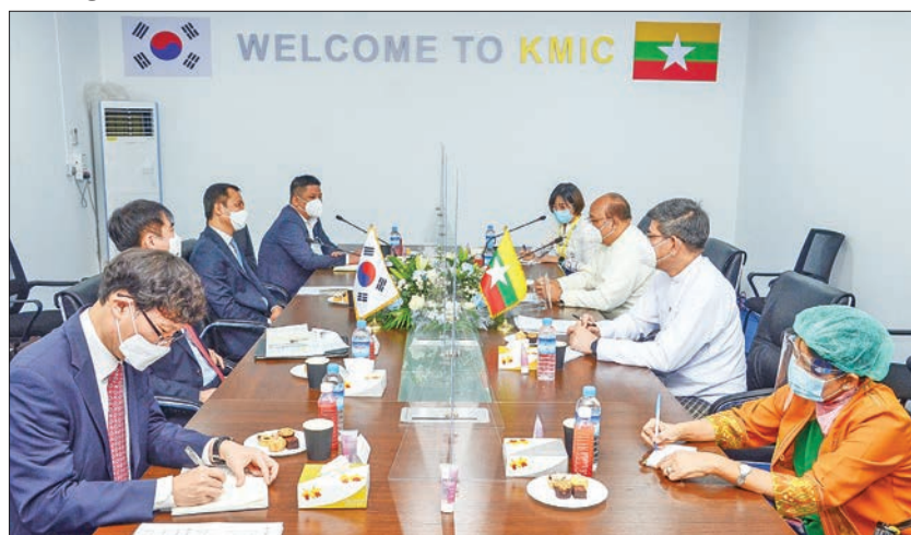
Union Minister U Thaung Tun holds talks with ROK's Chairman of the Presidential Committee on New Southern Policy Mr Park Bok-yeong on 24 December 2020.

The ceremony was also attended by Speaker U Tin Maung Tun of the Yangon Region Hluttaw, the cabinet ministers of the Yangon Region, Korea Am-