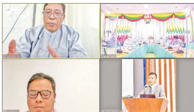
Ministry of Ethnic Affairs holds virtual meeting on organizing Myanmar Ethnic Culture Festival 2021 on 24 December.

The Union Minister recommended the need to avoid mass gatherings in holding the festival, although it is held in accord-