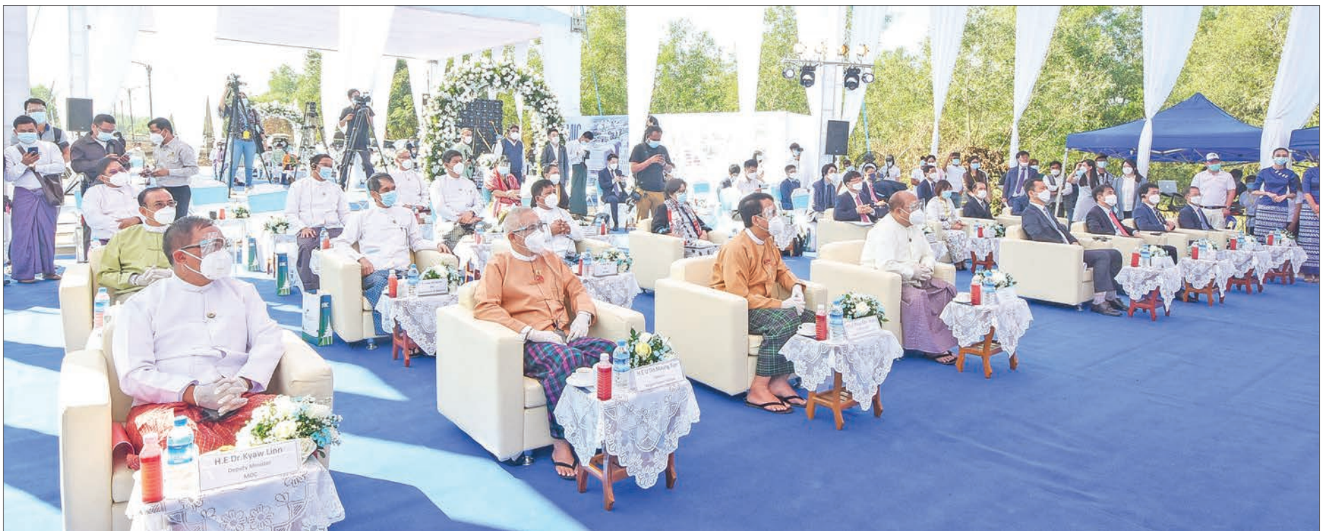
State Counsellor Daw Aung San Suu Kyi delivers the video message to the groundbreaking ceremony of Korea-Myanmar Industrial Complex in Hlegu Township, Yangon Region on 24 December 2020.