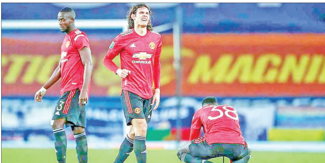
Manchester United's Uruguayan striker Edinson Cavani (centre) reacts at the final whistle during their English League Cup quarter final match against Everton at Goodison Park on December 23, 2020. Manchester United won 2-0.

LONDON—Manchester United will face bitter rivals Manchester City in the League Cup semi-finals after a dramatic 2-0 win at Everton, while Tottenham joined