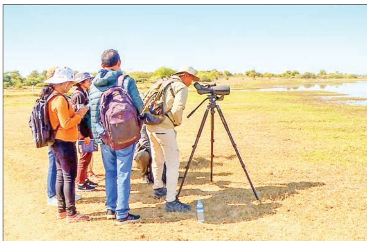
People watch birds with telescope at a wetland of Mandalay Region.

The birds migrate in mid-October and stay in Myanmar until March. The number of migratory birds to Paleik Lake, Taungthaman Lake, Manaw Lake, Sont Ye Lake and Pyu Lake drop this year due to climate change, illegal poaching and changing ecosystem.