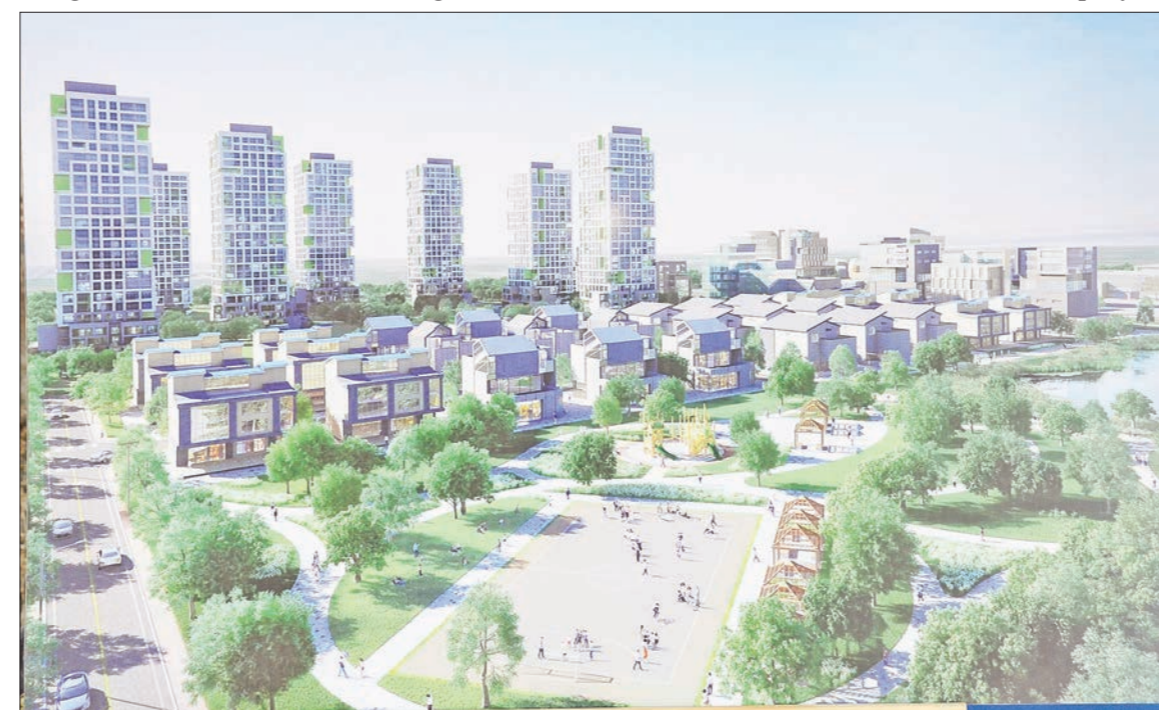
Conceptual Design of KMIC.

The opinions expressed in this article are those of the author.—Ed.