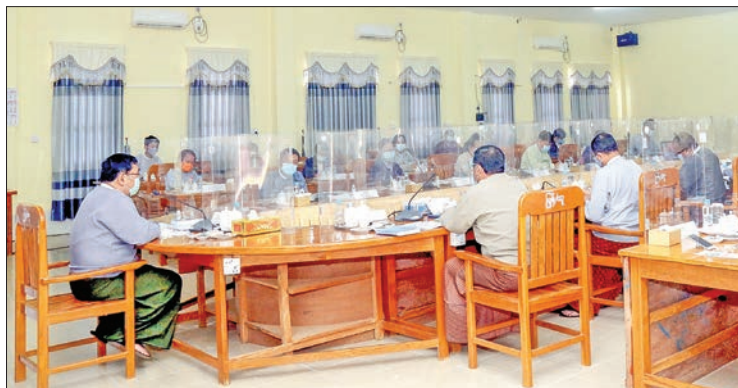
Union Minister Dr Win Myat Aye discusses rehabilitation procedures and effective work plans on 24 December.

He said the Department of Rehabilitation needs to conduct