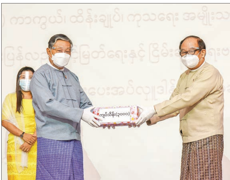
Union Minister U Kyaw Tint Swe (centre) presents K300 million cash to Union Minister Dr Myint Htwe (left) on 24 December.

National Reconciliation and Peace Centre- NRPC donated cash assistance to the National-Level Central Committee on Prevention, Control and Treatment of COVID-19, yesterday morning in Nay Pyi Taw.