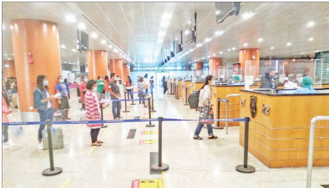
Myanmar returnees are seen at the Yangon International Airport on 24 December 2020.

MYANMAR nationals stranded in Japan and Singapore because of the suspension of commercial flights returned home by relief flights yesterday.