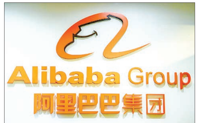
China has launched an anti-monopoly investigation into e-commerce giant Alibaba.