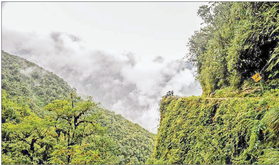
A view of Bolivia's ominous Death Road just outside La Paz, which is popular amongst thrill seeking tourists.