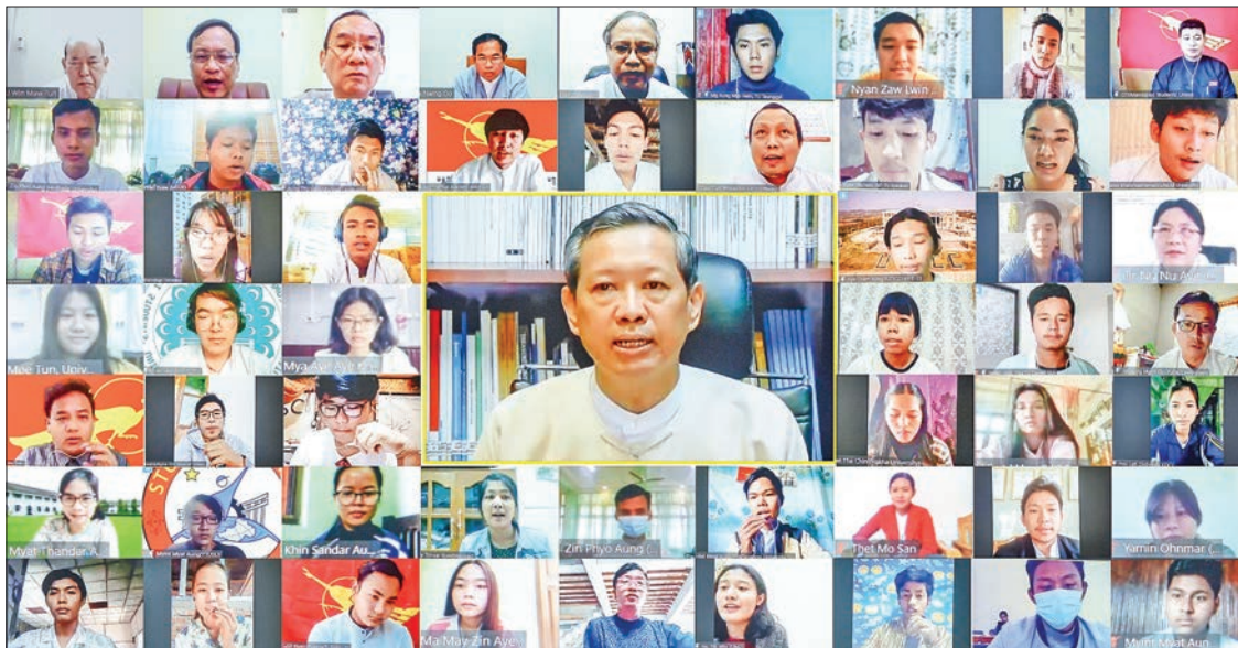
Union Minister Dr Myo Thein Gyi participates in the virtual meeting with students' unions and students on drafting of National Education Strategic Plan 2021-2030 on 24 December 2020.

Speaking at the meeting, the Union Minister said that economic and job opportunities have been changing due to the technical developments of the 21st Century. The skills of 20th Century wouldn't guarantee the jobs of 21st Century.