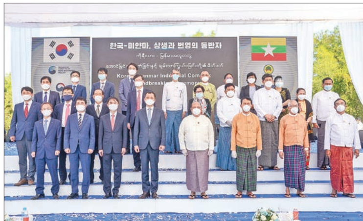
ROK-Myanmar dignitaries are seen at the KMIC groundbreaking event.

The KMIC Easy Service Centre will be set up to help companies conveniently handle tasks such as obtaining permits and licences. A variety