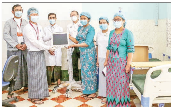
Ayeyarwady Foundation donates COVID-19 medical supplies for hospitals in Ayeyawady Region.

AYEYARWADY Foundation donated COVID-19 medical supplies including one oxygen plant worth K350 million in total for the district/township hospitals in Ayeyawady Region on 23 and 24 December.