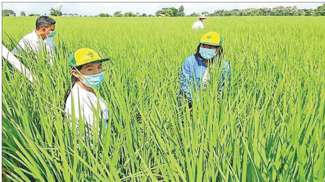
Nearly 4,000 acres of Shwebo Paw San paddy are cultivated under the Good Agricultural Practices (GAP) system in Dabayin Township, Shwebo District in Sagaing Region.

"The local farmers have already known the quality and market condition of the crops grown normally or with the GAP system. So, we are supporting them to cultivate their crops under the GAP system. The department staff are also providing the local farmers' awareness on their farmlands and providing them the agricultural method, necessary high-yield seeds and