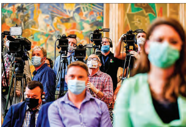
A record number of reporters were in jail in 2020, the Committee to Protect Journalists said.

A record number of journalists were behind bars this year, a US-based watchdog said Tuesday, accusing governments worldwide of suppressing the media and fuelling the misinformation amid the Covid-19 pandemic.