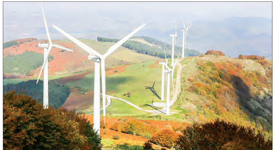
Macron's referendum plan comes from a citizens' convention he called in response to pressure for more "direct democracy". The photo shows the Merdelou-Fontanelles wind farm in southern France.

They made a series of practical proposals from reducing speed limits to improving home insu-