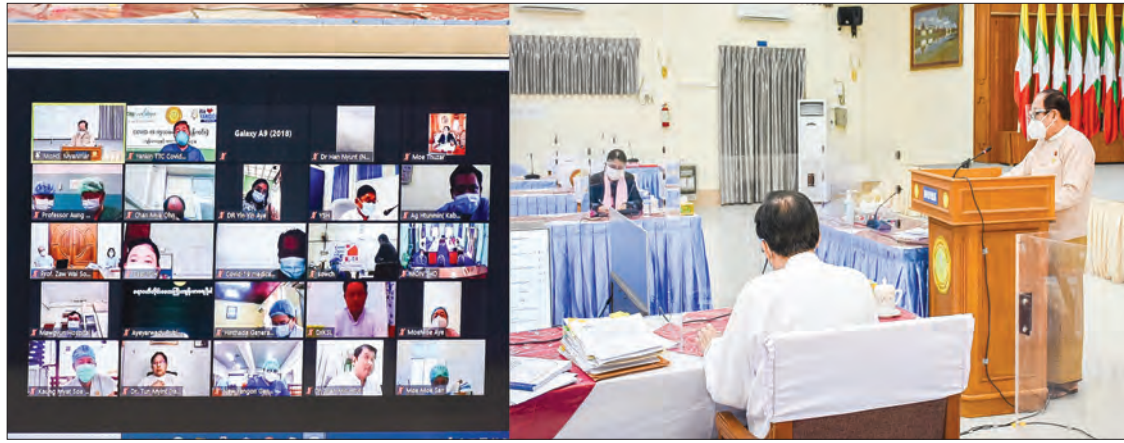
Union Minister Dr Myint Htwe holds online meeting with head medical experts from 14 treatment centres of COVID-19 in Yangon Region.

He stressed the preparations at the hospitals for COVID-19 patients, efforts of Yangon Region government in establishing the COVID-19 centres, infection rate and death rate across the world including Myanmar, the instruction for the people to follow the COVID-19 health rules while the specialist and nurses are hardly fighting the COVID-19, health