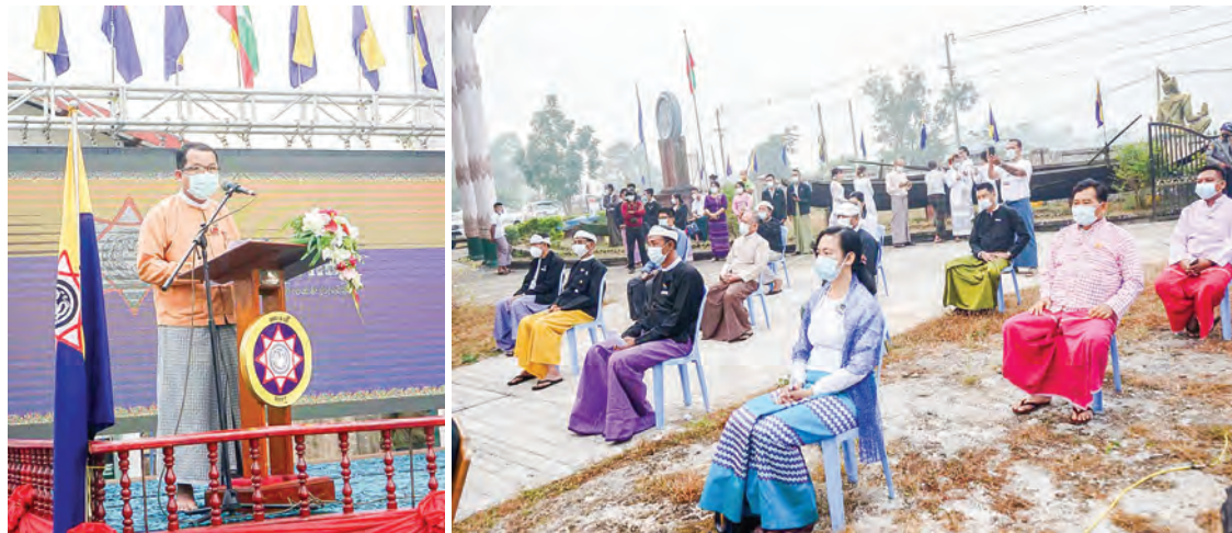
The 3 rd Dawei National Day is in progress in capital city of Taninthayi Region on 15 December.