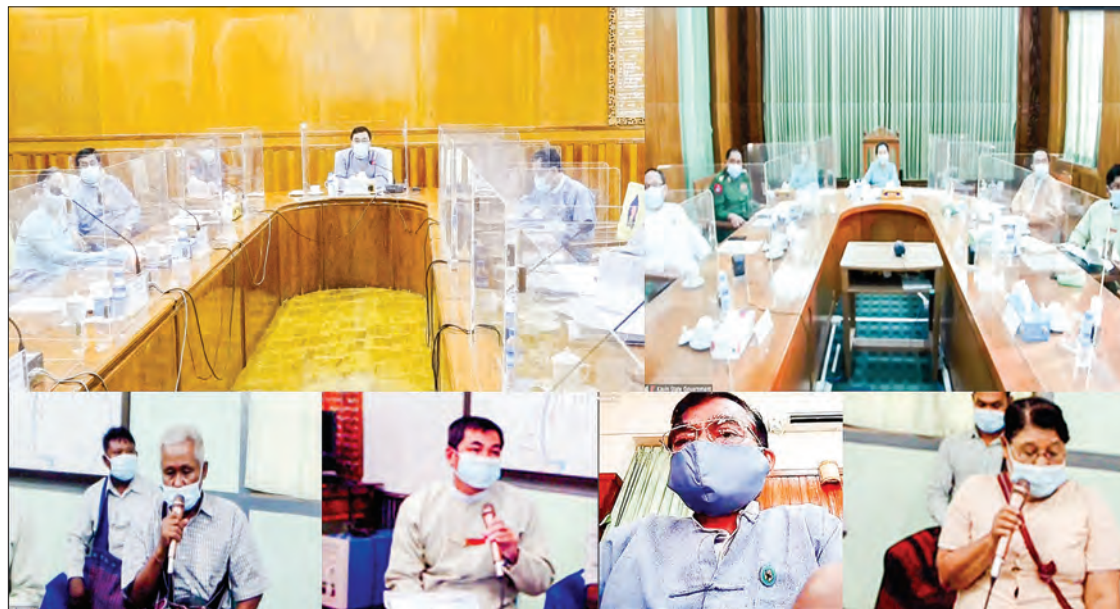
Union Minister Dr Win Myat Aye discusses resettlement of internally displaced persons and closure of their camps in Myaing Gyi Ngu Special Zone in Kayin State on 15 December.

He said that in the social sector of the Union Accord adopted by the Union Peace