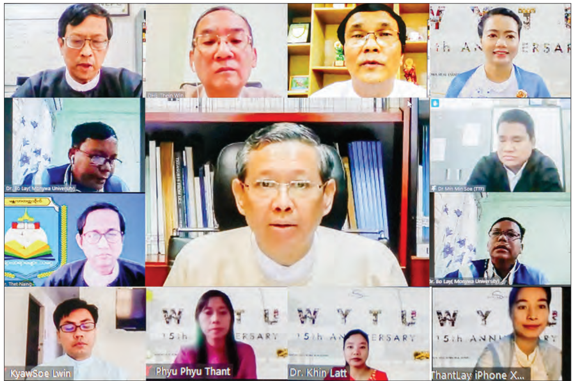
Union Minister Dr Myo Thein Gyi joins opening ceremony to celebrate 15 th anniversary of West Yangon Technological University on 15 December.

He also urged the alumni to discuss and suggest the need of stakeholders, technologies and modern equipment used in the workplace and lessons taught at the university and the require-