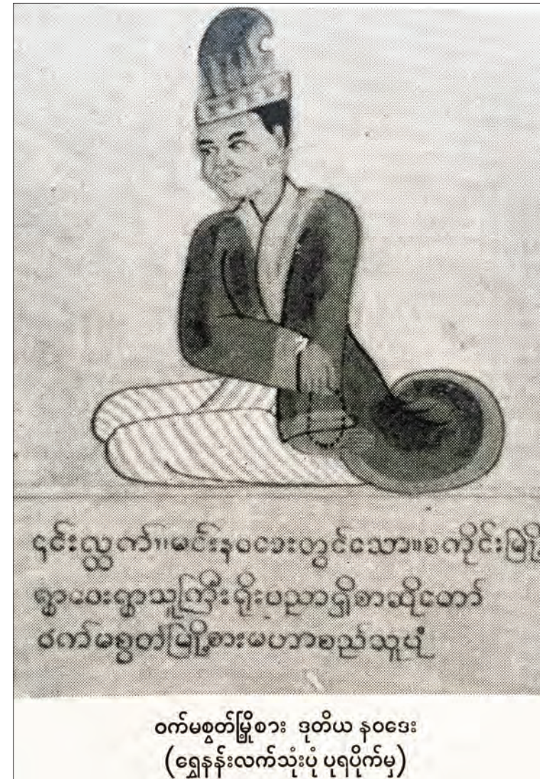
Nawade is a title given by the Burmese kings to the poet laureates of ancient Burma. Whereas there were at least five court poets who were given the title of Nawade only two are frequently discussed in academic circles.

The writer never fails to catch the chance of such a literary journey home or abroad. Even in the early 90s he still has the stamina for such activities.