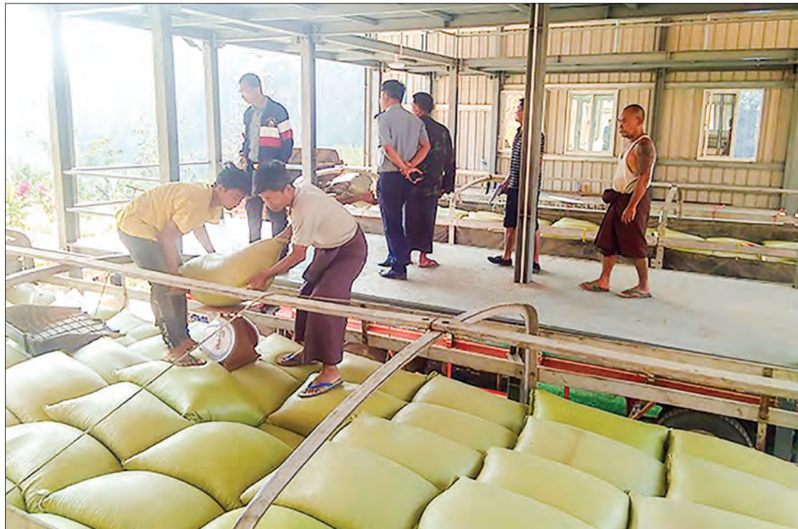
Myanmar exported 2.2 million tonnes of corns to the foreign market in the past FY2019-2020, with an estimated value of $360 million.

export is heavily relying on border trade. The country mainly sends the corn to the neighbouring countries China, Laos and Thailand. It is also shipped to Singapore, Malaysia and Viet Nam through sea trade. The corn fetched US$230-240 per tonne.