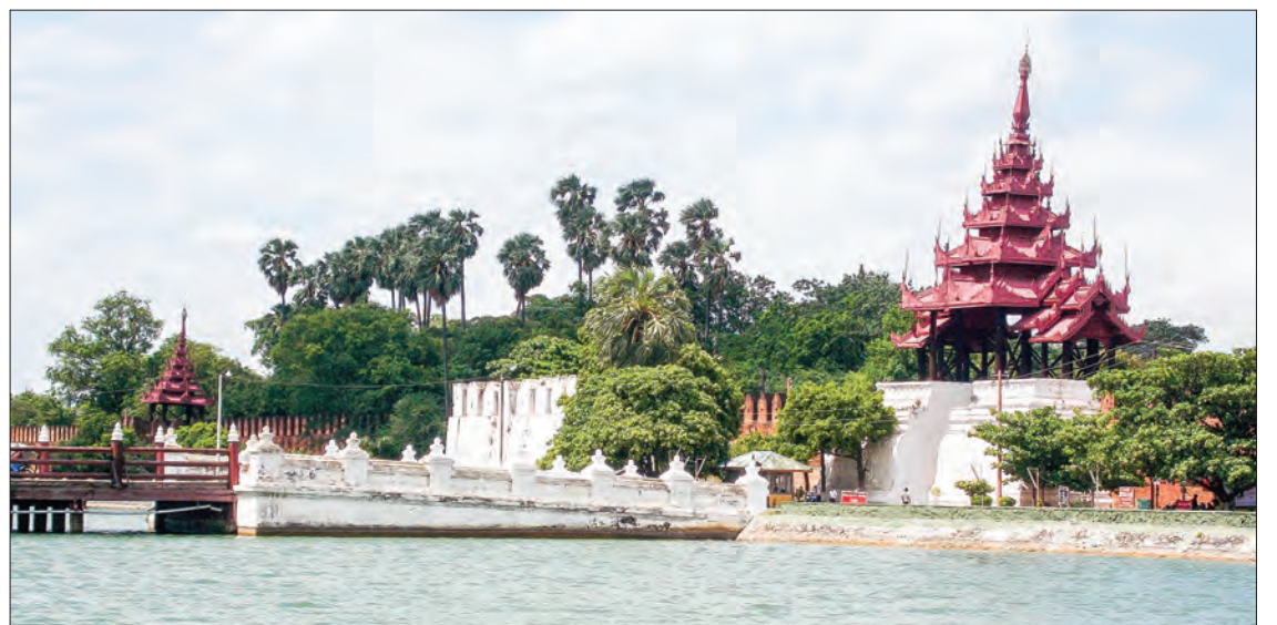
Picture shows a gate of Mandalay Royal Palace.