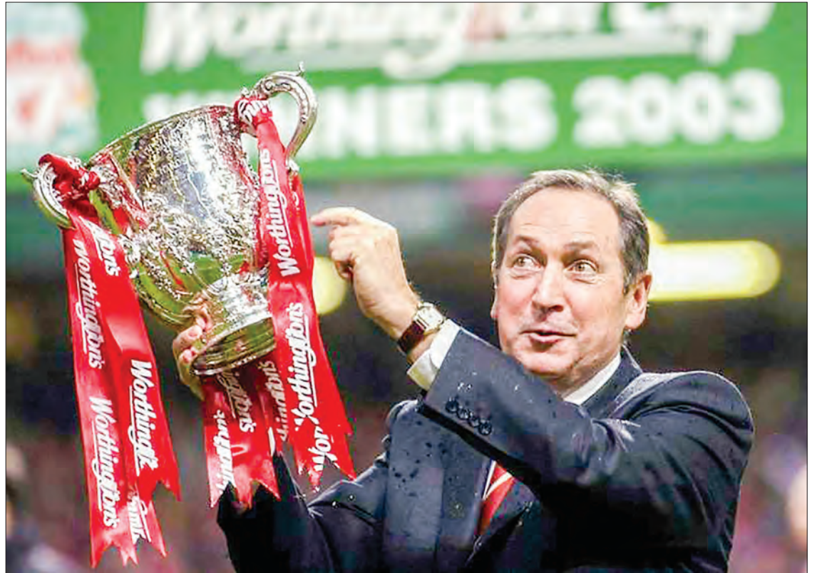
Houllier won his fourth major trophy at Liverpool with a League Cup final victory over Manchester United in 2003.

Last season's Premier League triumph under Klopp ended a 30-year wait for a top-