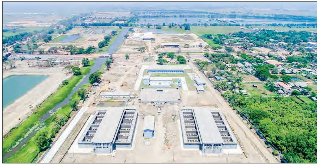
A bird's eye view of the Lagunpyin water supply project is seen under implementation.