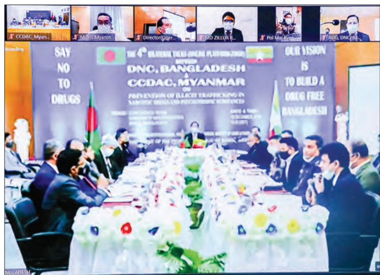
The 4 th Myanmar-Bangladesh Director-General Level Meeting on Narcotics Drug Control is in progress on 15 December.

BANGLADESHI government hosted the 4 th Myanmar-Bangladesh Director-General Level Meeting on Narcotics Drug Control via videoconferencing yesterday morning.