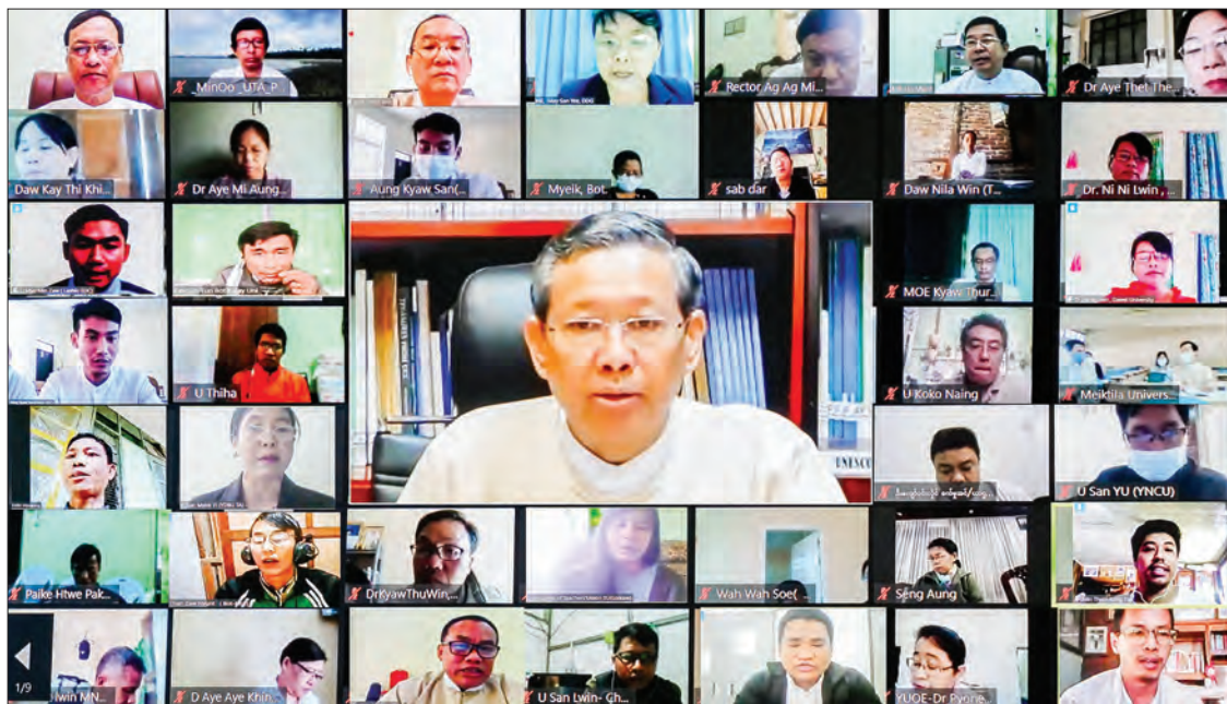
Union Minister Dr Myo Thein Gyi makes discussions on second-day seminar for drafting National Education Strategic Plan(2021-2030).

THE Ministry of Education held the second day of National Education Strategic Plan(2021-