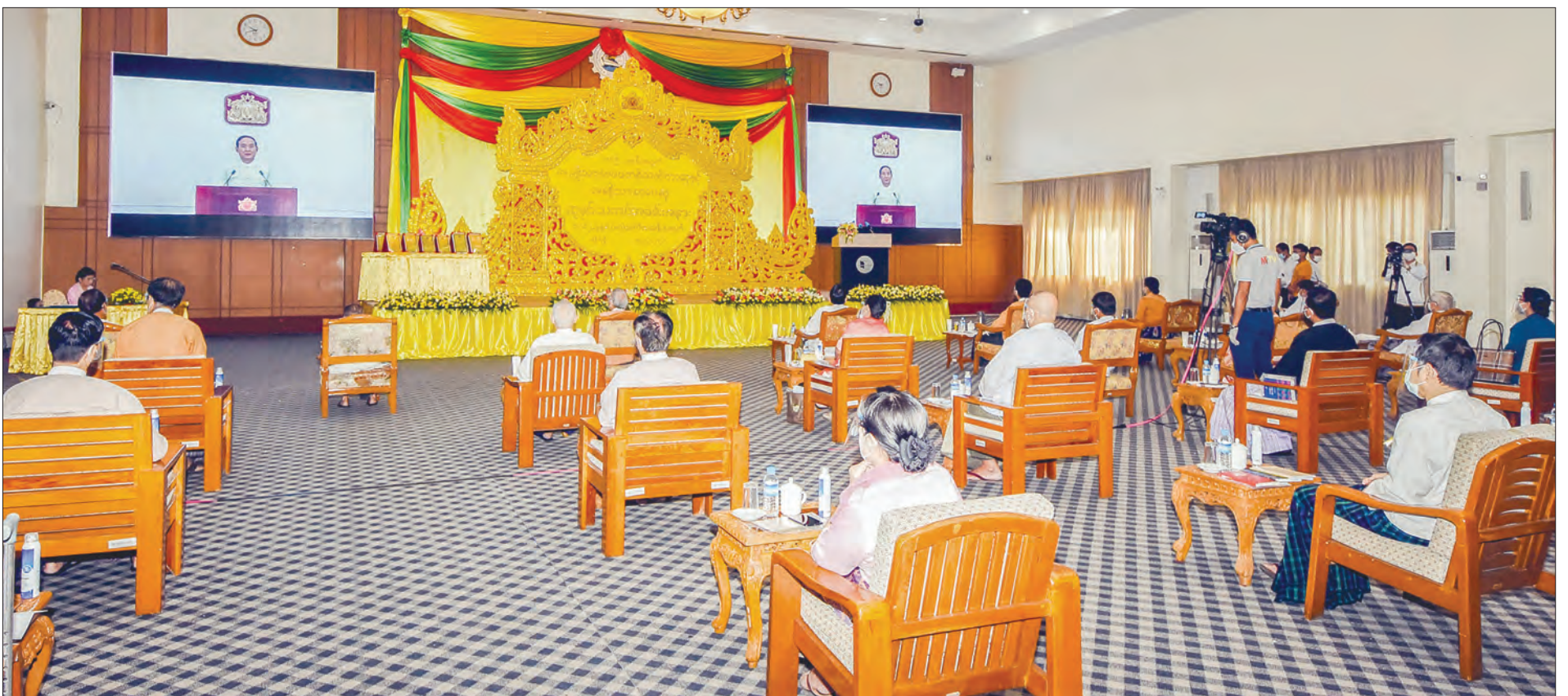
President U Win Myint delivers a video speech on presenting National Lifetime Award for Literary Achievement and the National Literary Awards for 2019, on 15 December.

T HE Ministry of Information organized a ceremony to present the National Lifetime Award for Literary Achievement and the National Literary Awards for 2019 at the Union of Myanmar Federation of Chambers of Commerce and Industry in Yangon yesterday.