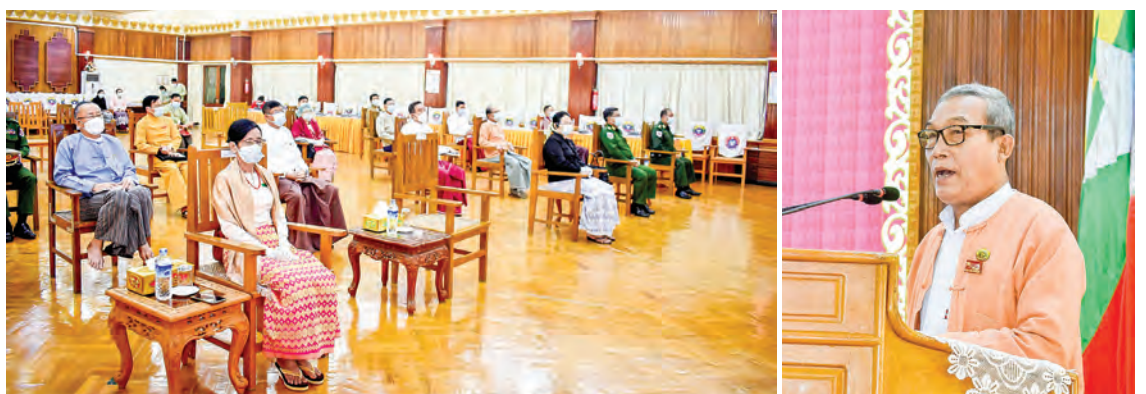
Rakhine State Chief Minister U Nyi Pu reads out the Message of Greetings sent by President U Win Myint.

THE 46 th Rakhine State Day was held in Sittway Township yesterday morning.