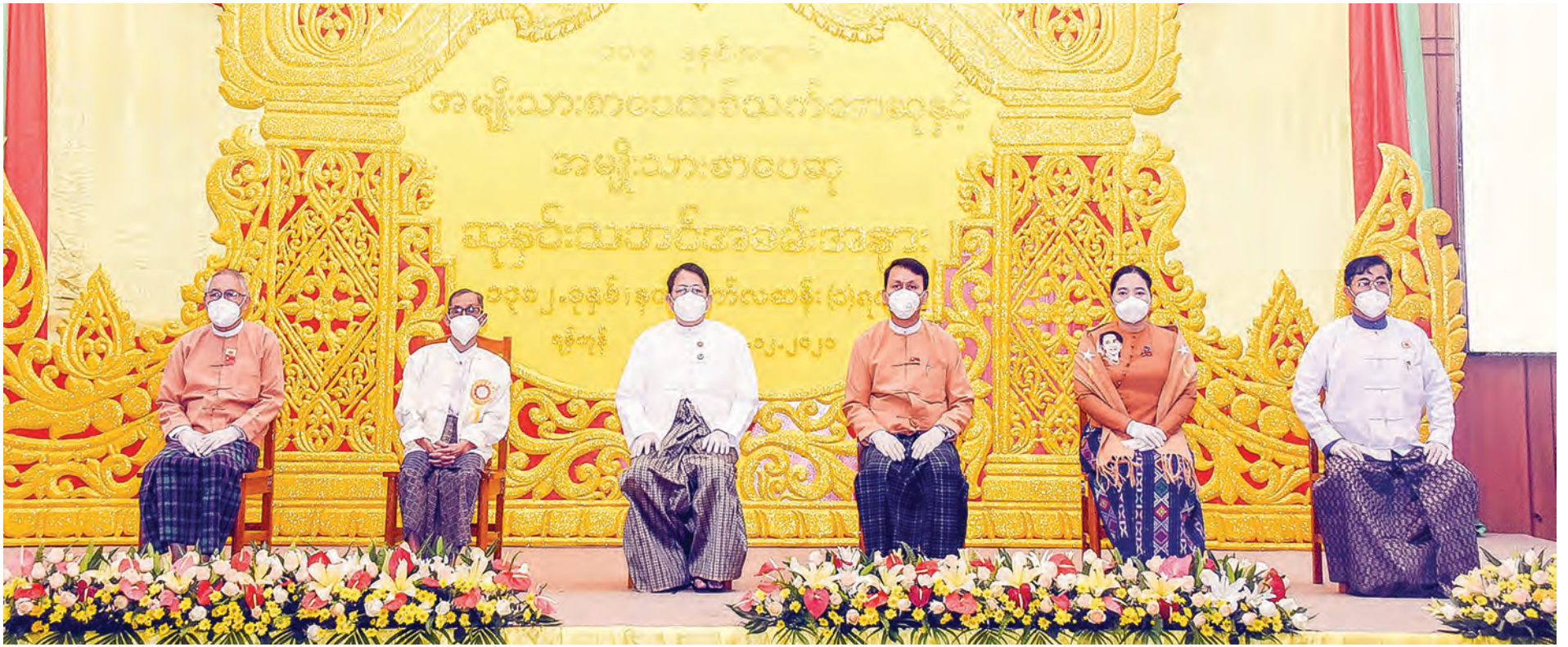
Union Minister Dr Pe Myint, Yangon Region Chief Minister U Phyo Min Thein, Yangon Region Hluttaw Speaker U Tin Maung Tun and Ministers of Yangon Region Government pose for a documentary photo together with winners of National Lifetime Award for Literary Achievement in Yangon yesterday.