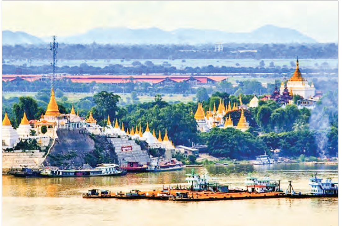
Shwe-Kyet-Yet and Shwe-Kyet-Kya Pagoda.

(Extract from a speech delivered by General Aung San on 11 February 1947 in Panglong at a dinner with Sawbwas)