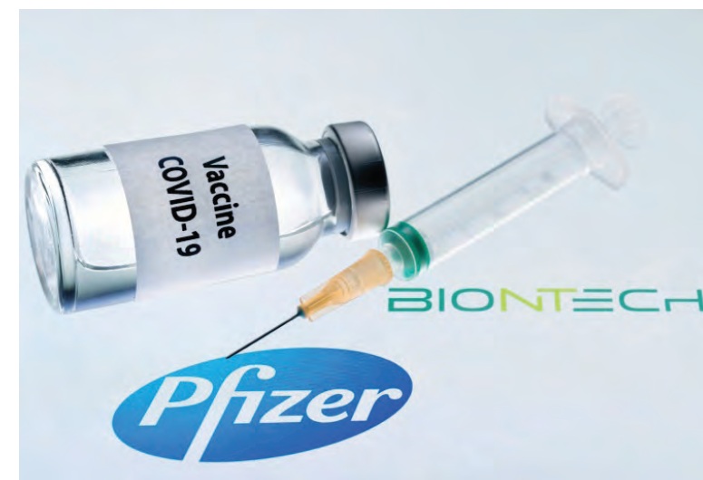
The European Medicines Agency said on Tuesday it had moved forward a meeting to decide on authorization for the Pfizer-BioNTech vaccine by more than a week to 21 December.

THE Amsterdam-based agency said it had received "additional data" from the company on Monday that was requested by the EMA committee that examines medicines for human use.