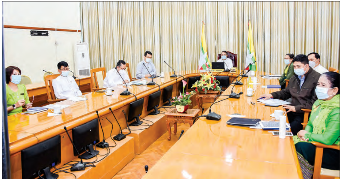
Union Minister Dr Than Myint joins opening ceremony of Partnership Summit 2020 on 15 December.

He said Myanmar, as an agricultural country, has great potential for trade and investment in agriculture and food production including other important sectors such as fisheries, energy, tourism, manufacturing, handicraft processing (CMP), infrastructure and information