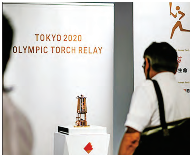
The Olympic flame is currently on display in Tokyo.

TOKYO — Tokyo 2020 organizers said Tuesday they will press ahead with a nationwide, socially distanced torch relay — 100 days before the Olympic flame begins its coronavirus-delayed journey around Japan.