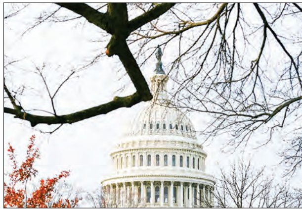
The $908 billion relief proposal backed by a bipartisan group of lawmakers faces uncertain prospects.

The proposal would follow up on the $2.2 trillion CARES Act rescue package passed in the Covid-19 pandemic's early days, which was credited with keeping the US economy from a more severe downturn. But its main provisions expired in recent months, and as the United States faces skyrocketing