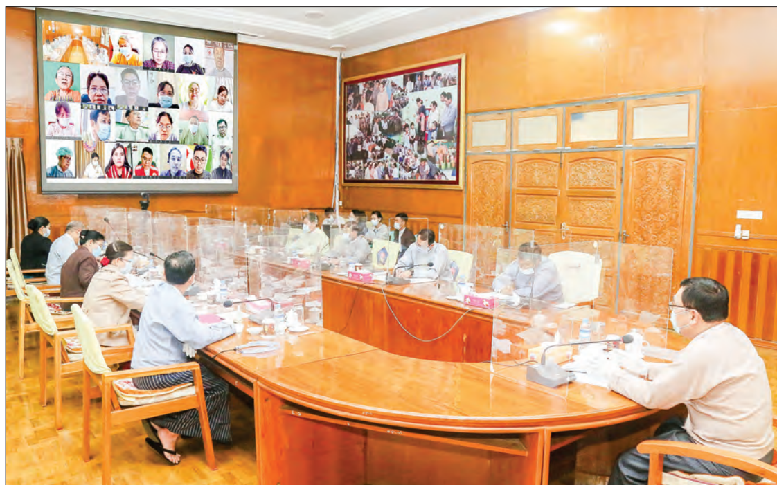
Union Minister Dr Win Myat Aye participates in the virtual meeting on community-based COVID-19 response efforts on 14 December 2020.

Regarding changing strategies, the Ministry of Health and Sports is coordinating with