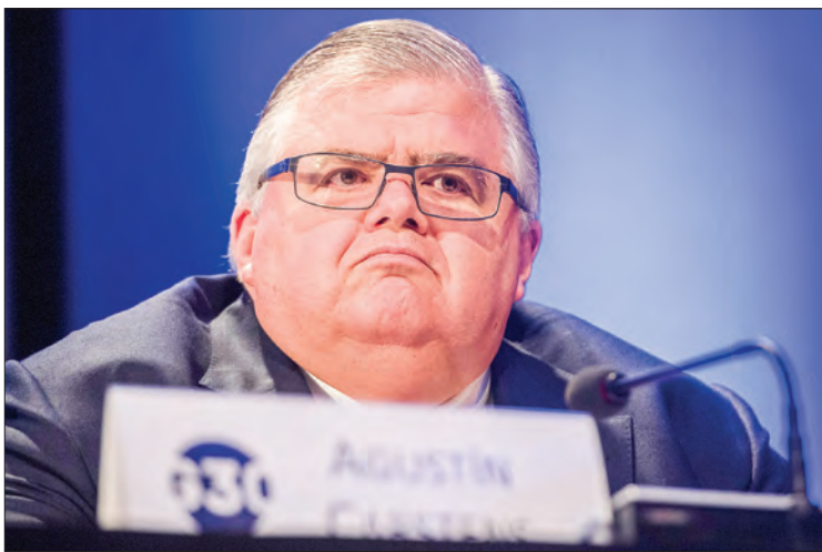
(FILES) Agustin Carstens, Governor of the Bank of Mexico and Chairman of the International Monetary and Financial Committee, speaks during the 32nd Annual Group of 30 (G30) International Banking Seminar in Washington, DC, on October 15, 2017.

NEW YORK (United State) — Figuring out which companies to save and which to let die will be a key challenge facing governments after the pandemic, according to a G30 report released Monday.