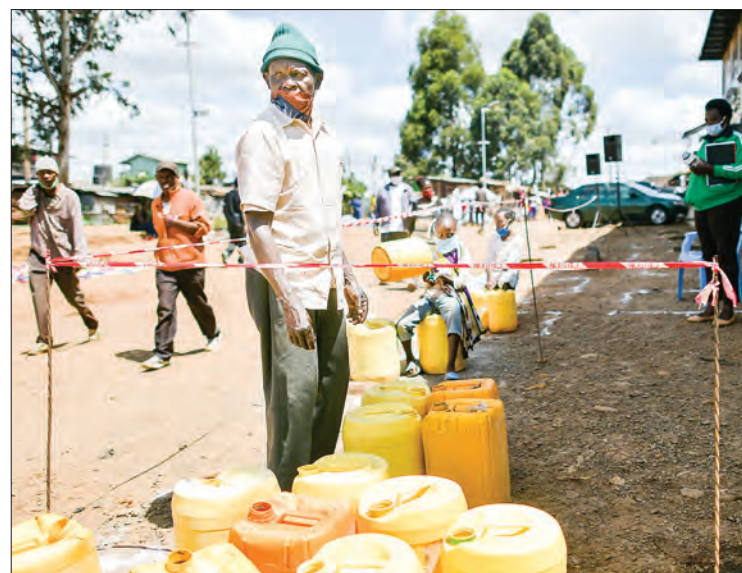
Residents observe social distancing as they wait in a queue to fetch clean drinking water at a dispensing point at Kibera Town Centre in Nairobi on 29 May 2020.