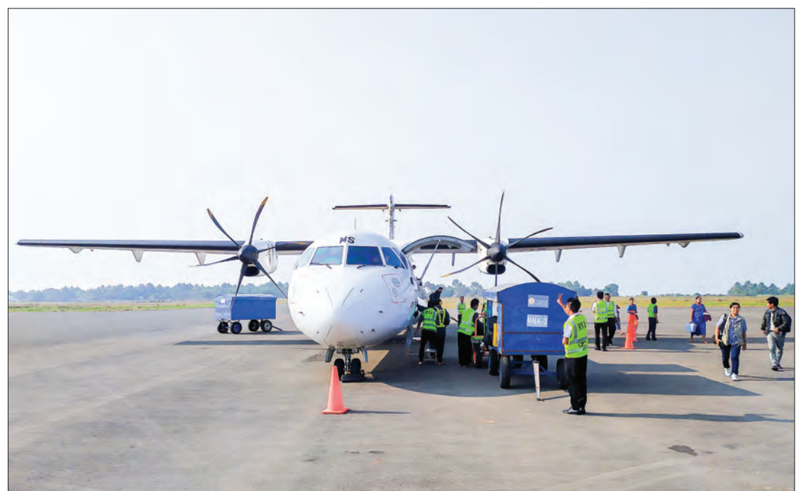
Myanmar National Airlines plans to restart the operation of its domestic flights on 16 December 2020.

Therefore, the Department informed the airlines to prepare for necessary measures to reopen the domestic flights be-