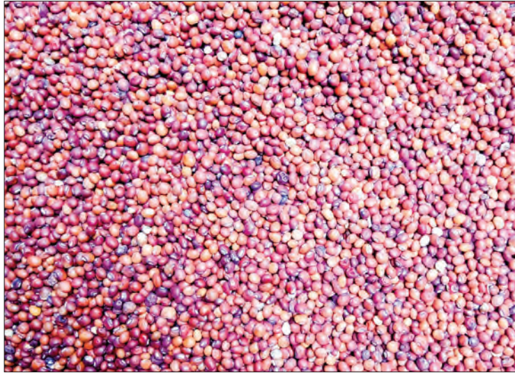
Pigeon pea price goes down because India stops buying.

"Earlier, the pigeon peas (red grams) stockpiled in Monywa were delivered to India, and about 75 per cent of stocks were cleared at that time. As there is no demand by India so far, the traders are keeping them for