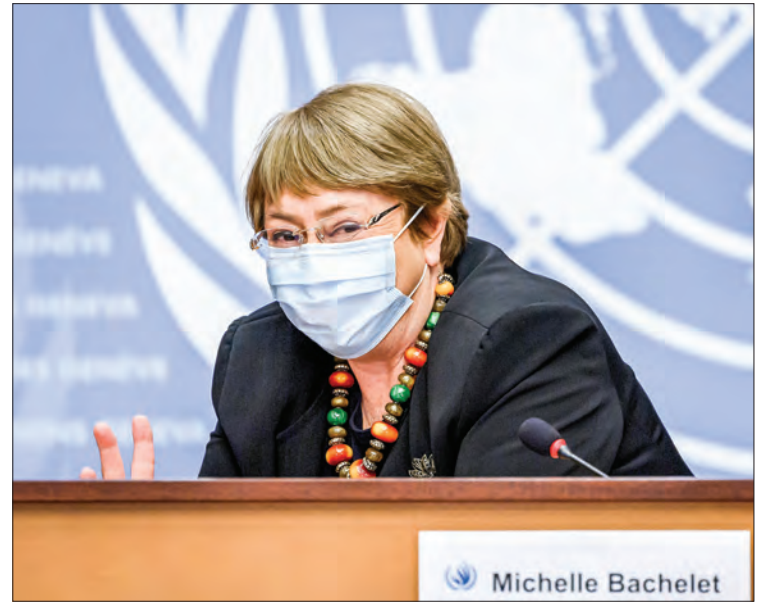
UN High Commissioner for Human Rights Michelle Bachelet wearing a protective face mask gestures prior to a press conference on December 9, 2020 in Geneva.

the penalty, she stressed that under international law, it can only be applied for the most serious crimes, and only after a fair trial and access to appeal and the