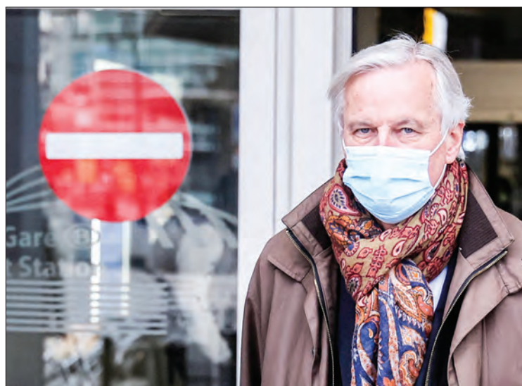
EU chief negotiator Michel Barnier, wearing a protective face mask, arrives at Brussels Midi station, after the last round of Brexit talks in London, on 5 December 2020.

EU chief Ursula von der Leyen and British Prime Minister Boris Johnson pledged to “go the extra mile” on Sunday as they side-stepped a self-im-