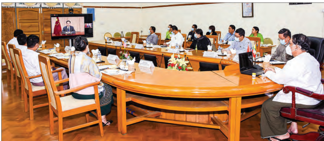
Union Minister Dr Than Myint speaks during the opening ceremony of 19 th Myanmar-China Border Trade Fair (Online) via videoconferencing on 14 December 2020.