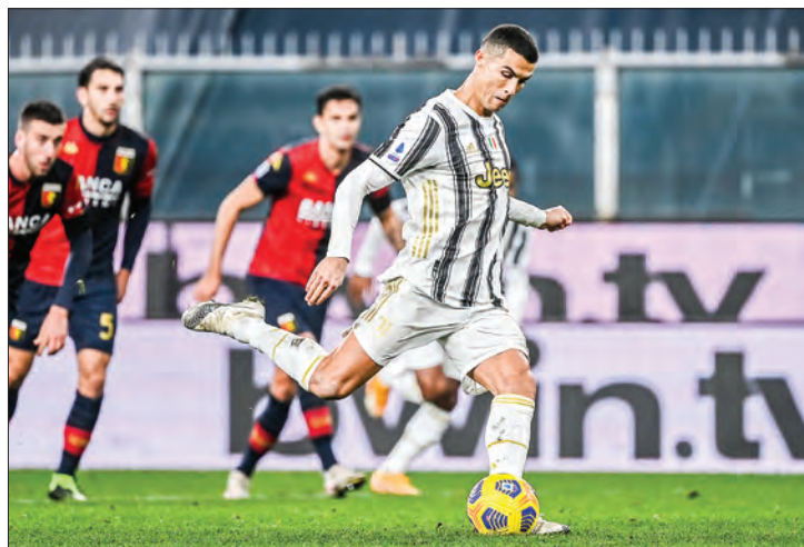
Juventus' Portuguese forward Cristiano Ronaldo shoots to score a penalty during the Italian Serie A football match Genoa vs Juventus on 13 December 2020 at the Luigi-Ferraris stadium in Genoa.

Conte's side are out of Europe with their focus now on a first Serie A title since 2010. —AFP ■