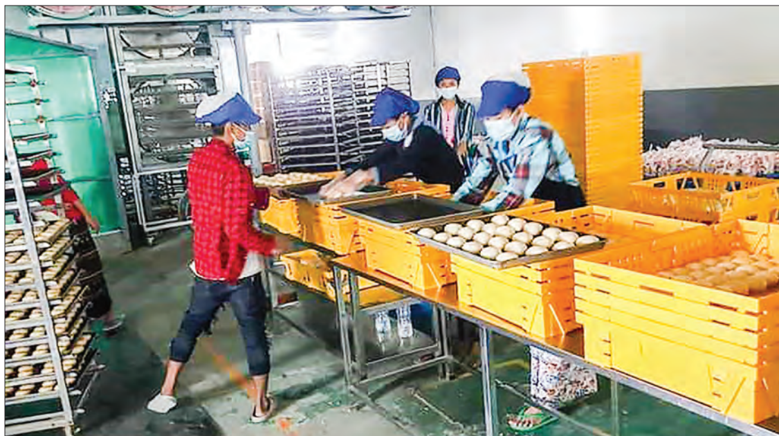
Workers wearing face masks make baozi, which is called Pauksi in Myanmar, at a workplace in Mandalay.