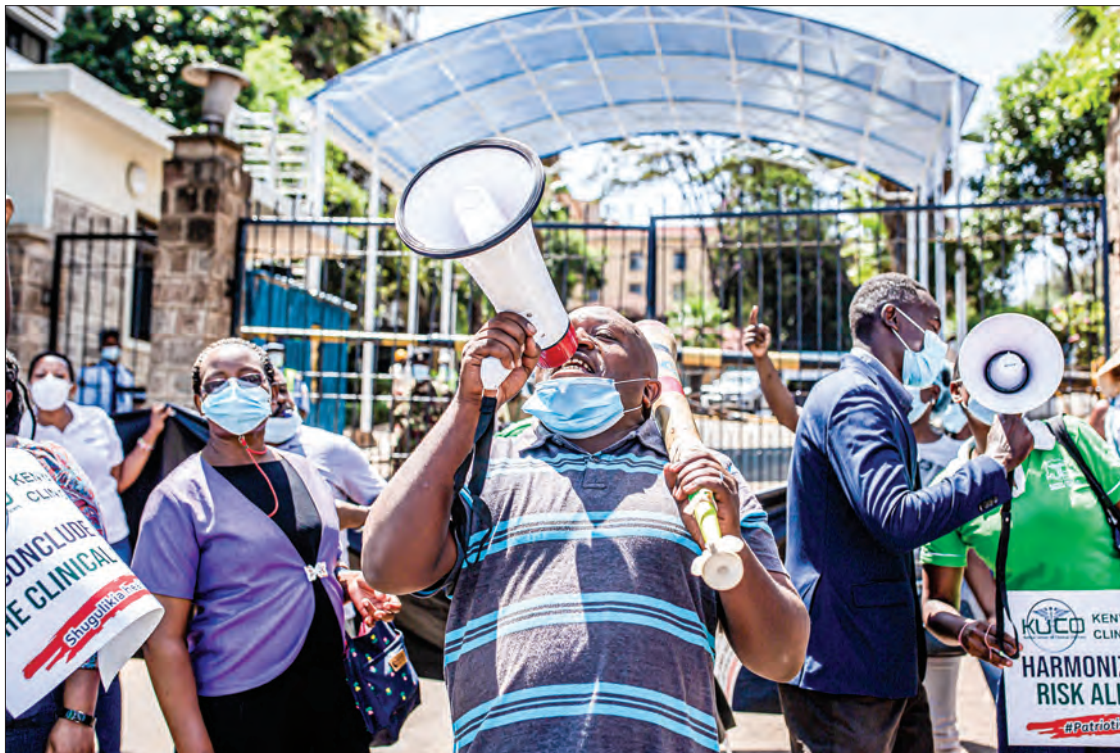
A man shouts into a megaphone in front of the Ministry of Health during a protests organized by Nurses and Clinical Officers in Nairobi on 14 December 2020.

The Netherlands mulls closing non-essential shops, theatres, museums and amusement parks, as the number of infections as its death toll passes 10,000.