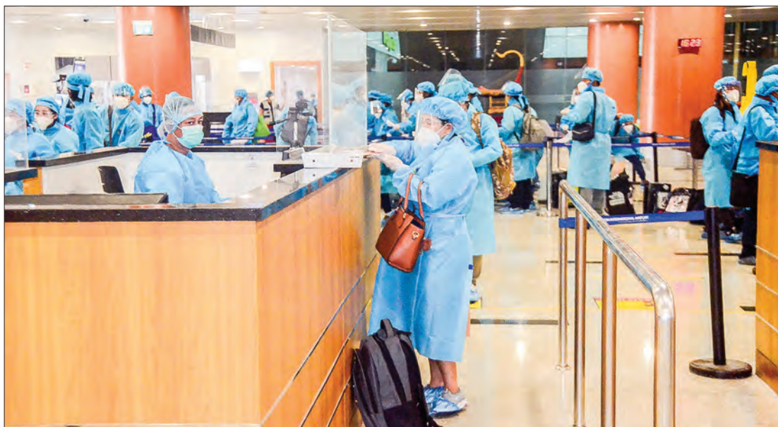
Myanmar returnees from foreign countries are seen at the Yangon International Airport on 14 December 2020.

The Ministry of Labour, Immigration and Population,