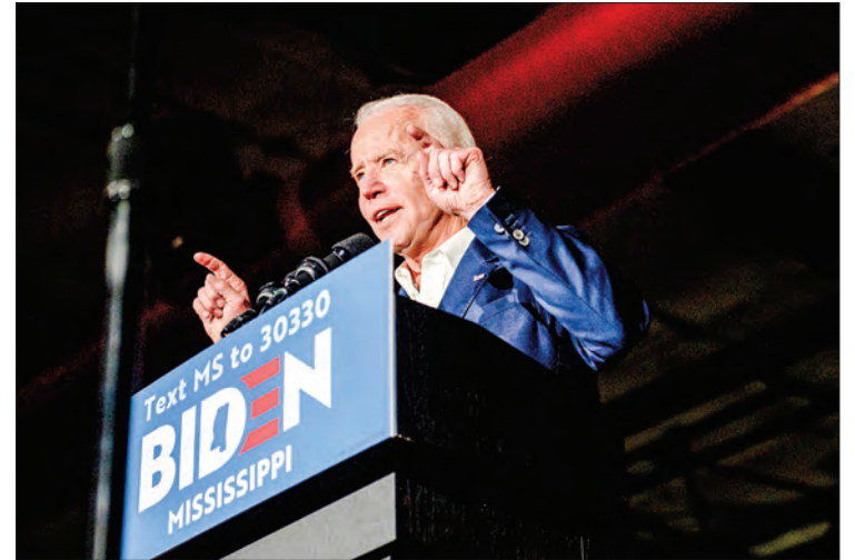
Democratic presidential candidate Joe Biden speaks during a rally at Tougaloo College in Tougaloo, Mississippi on 8 March 2020.

meet Monday to formalize the process, though the electors actually meet separately in each state.