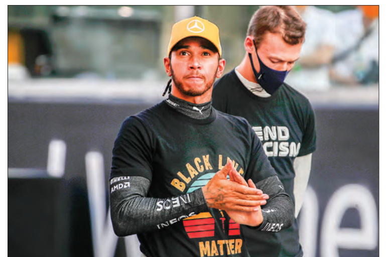
Mercedes' British driver Lewis Hamilton (C) takes part in the End Racism event ahead of the Abu Dhabi Formula One Grand Prix at the Yas Marina Circuit in the Emirati city of Abu Dhabi on 13 December 2020.

ABU DHABI (United Arab Emirates) — Lewis Hamilton ended speculation about future intentions on Sunday when he made clear he expects to sign a new contract with Mercedes before Christmas.