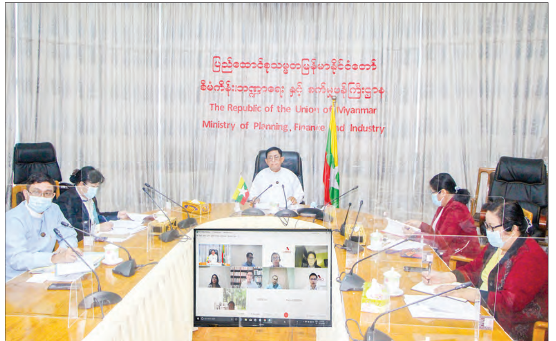
Deputy Minister U Maung Maung Win holds virtual talks with ASEAN + 3 Macroeconomic Research Office (AMRO) Mission Chief Dr Lee Lae Young on 14 December 2020.

He said that the COVID-19 Economic Relief Plan (CERP) and the Myanmar Economic Resilience and Reform Plan