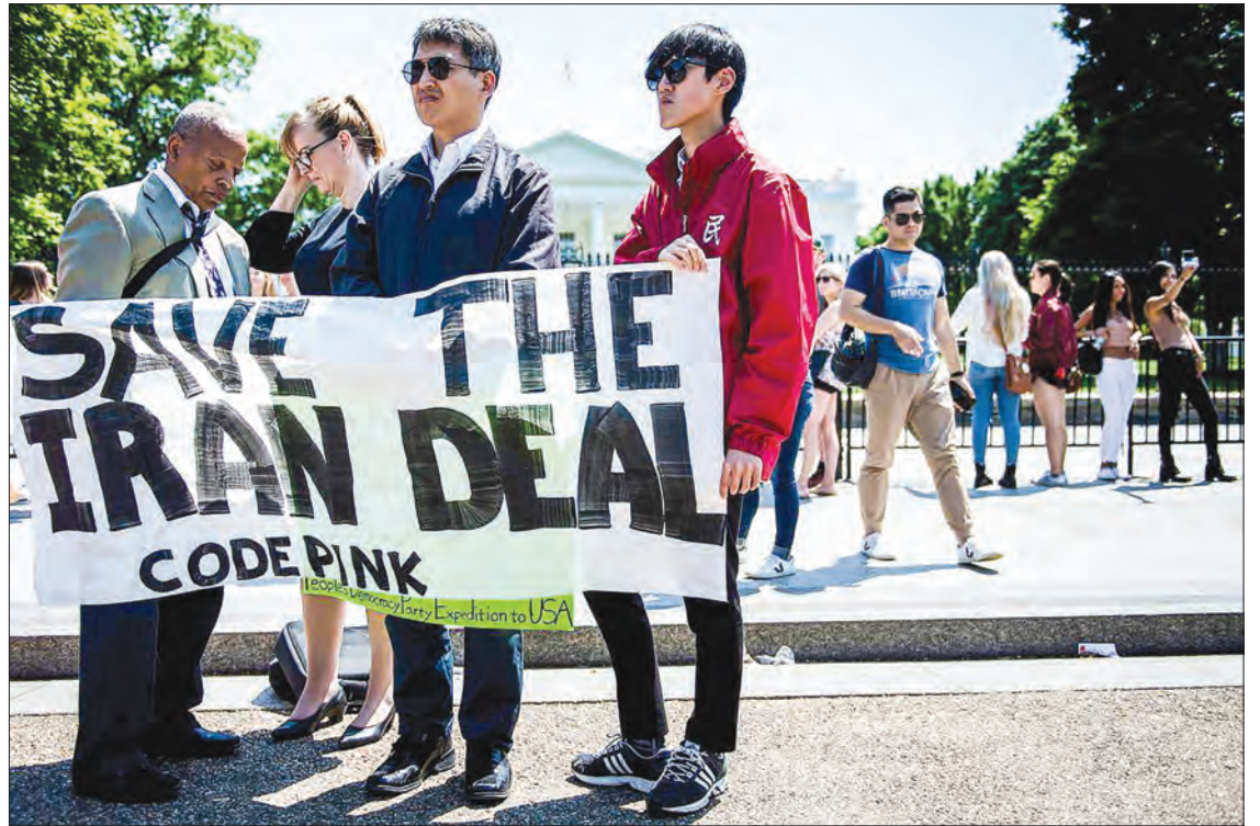
Protesters stand outside the White House as U.S. President Donald Trump announces the United State's withdrawal from the Iran nuclear deal May 8, 2018 in Washington, DC.

IRAN is ready to return to full compliance with a 2015 nuclear deal with major powers as soon as the other parties honour their commitments, President Hassan Rouhani said Wednesday.