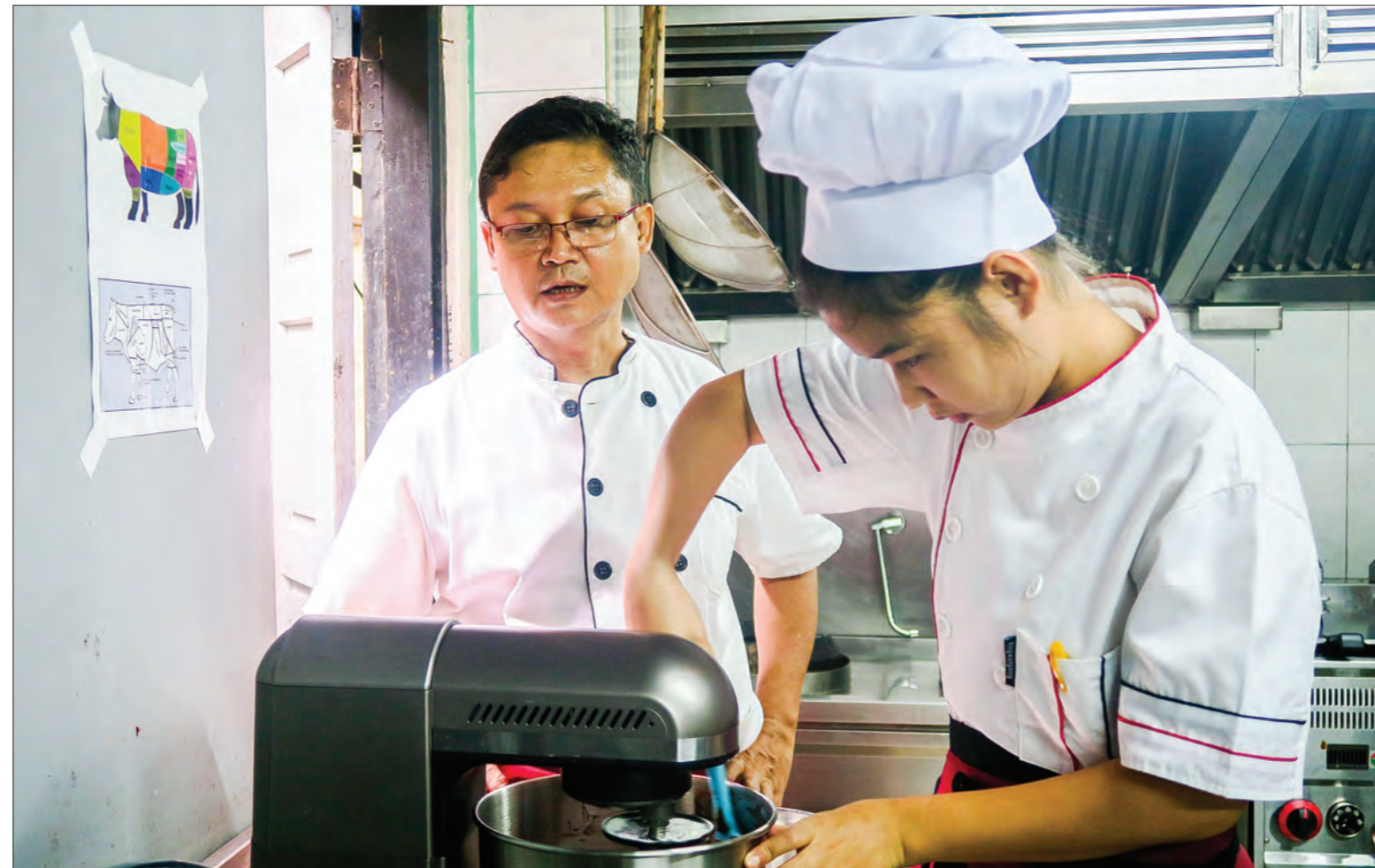
There are over 4 million Myanmar nationals working abroad, a third of whom are women but many more migrate outside official routes.

By Akio Nakayama, Donglin Li and Nicolas Burniat, representatives of IOM, ILO and UN Women in Myanmar.