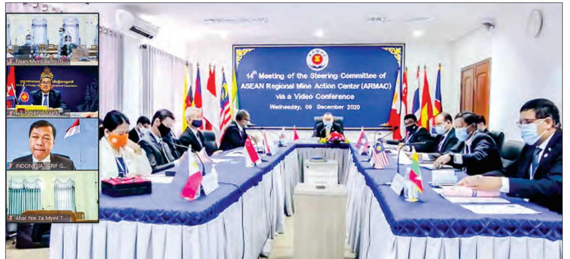
Myanmar Ambassador to Cambodia U Thit Lin Ohn and officials attend the 14 th meeting of ARMAC steering committee via videoconferencing on 9 December.