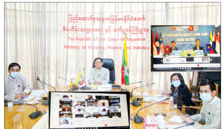
Deputy Minister U Maung Maung Win participates in the 33 rd Chairs' Meeting of ACMF on 9 December via videoconference.

The 34 th Chairs' Meeting of the ASEAN Capital Markets Forum will be held in Brunei. —MNA (Translated by Khine Thazin Han)