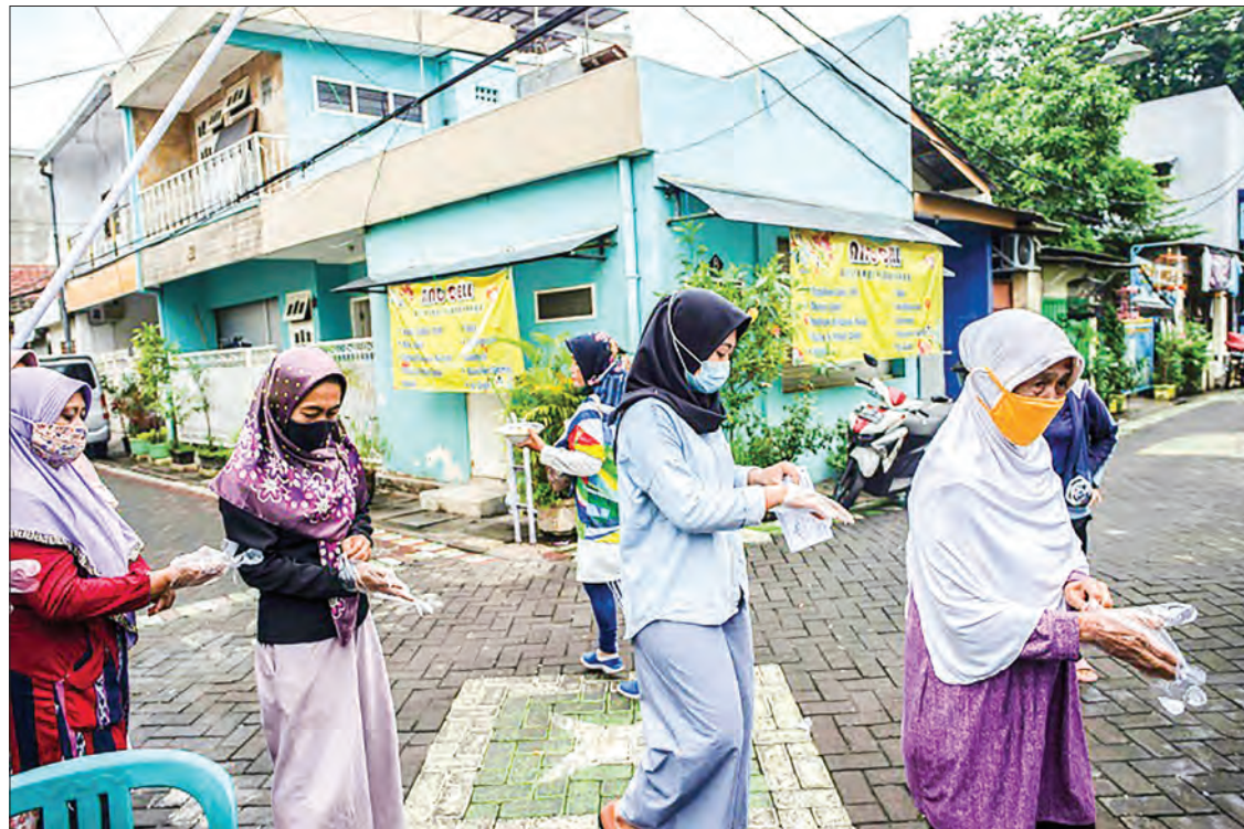
More than 100 million Indonesians were eligible to cast a ballot, despite warnings the poll would worsen the nation's Covid-19 crisis.

INDONESIA held nationwide regional elections Wednesday with more than 100 million voters eligible to cast a ballot, despite warnings the poll would worsen the nation's Covid-19 crisis.