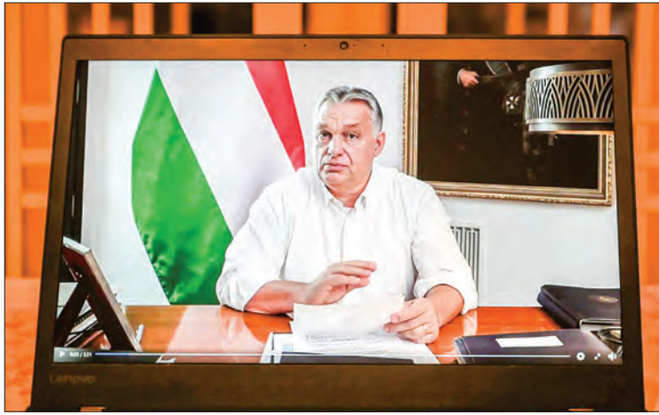
Hungarian Prime Minister Viktor Orbán.

POLAND'S deputy prime minister said on Wednesday that a new proposed agreement on the future EU budget meant that the reasons for Warsaw and Budapest to veto it have "practically disappeared".