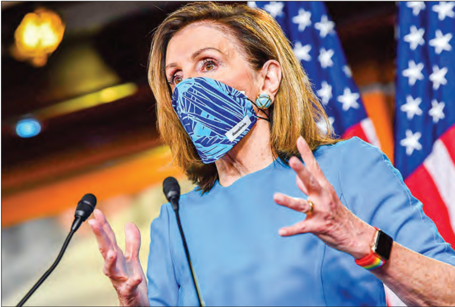
Mnuchin said he presented the package to Democratic House Speaker Nancy Pelosi, and had reviewed it with Trump and Republican Senate Majority Leader Mitch McConnell. Speaker of the House Nancy Pelosi speaks on Capitol Hill on Nov. 6.

Those elements have been key sticking points in negotiations between Democratic and Republican lawmakers. The proposal comes weeks before Trump is set to hand over power to President-elect Joe Biden and a new Congress takes office, and as the country struggles with the world's worst Covid-19