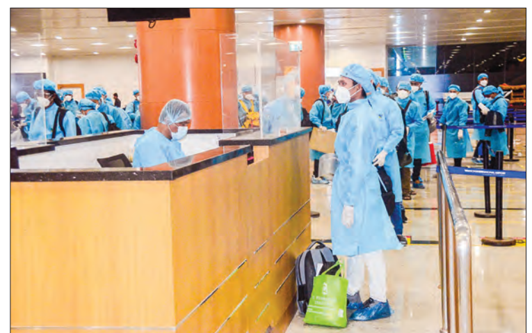
Returnees are in the Immigration process.