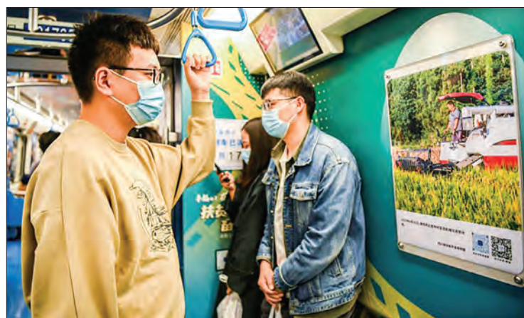
A passenger looks at a photo on a train of the Line 1 of Chengdu Metro in Chengdu, southwest China's Sichuan Province, Oct. 17, 2020.

CHINA has tested more than a quarter of a million people for the coronavirus after a handful of new cases were detected in the southern city of Chengdu.