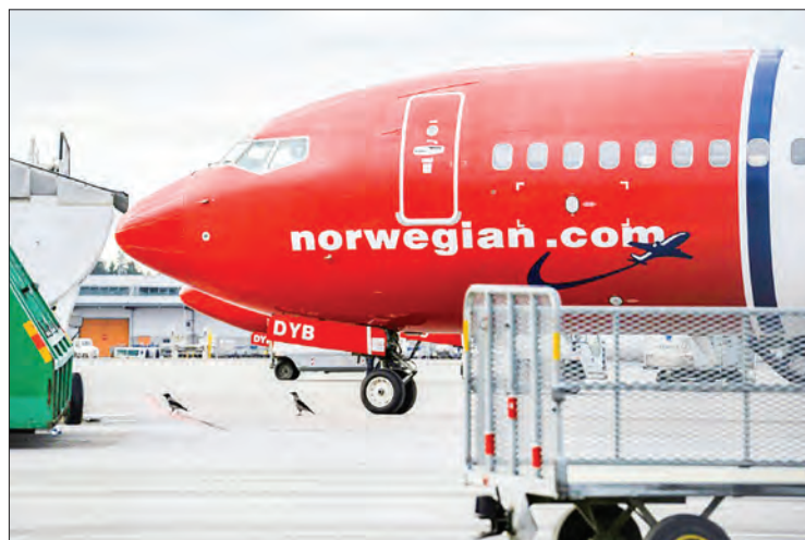
Just six of the 140 aircraft Norwegian was operating at the start of 2020 are still flying.

Pending a worldwide roll-out of Covid vaccines that could