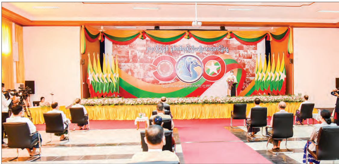
The 100 th Anniversary of National Victory Day celebrations are in progress in Nay Pyi Taw on 9 December.

A ceremony to mark the 100 th Anniversary of National Victory Day was held at the Ministry of Education in Nay Pyi Taw yesterday, in accordance with the healthcare rules for COVID-19 prevention.