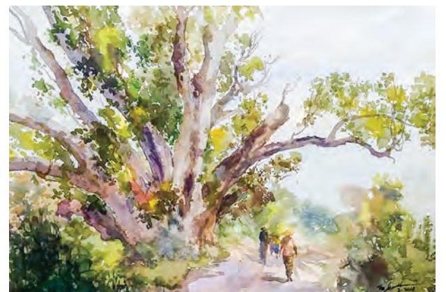
Watercolour paintings to be shown in an upcoming online exhibition of Myanmar Watercolour Society.