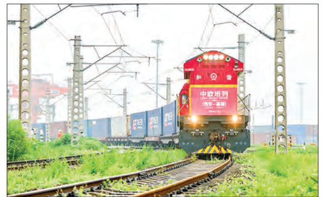
A China Railway Express freight train leaves from Xi'an, Shaanxi province, to Kyiv, the capital of Ukraine, in July this year.

A new China-Europe freight train route has been launched, linking the city of Ankang in northwest China's Shaanxi Province with Central Asian and European cities.