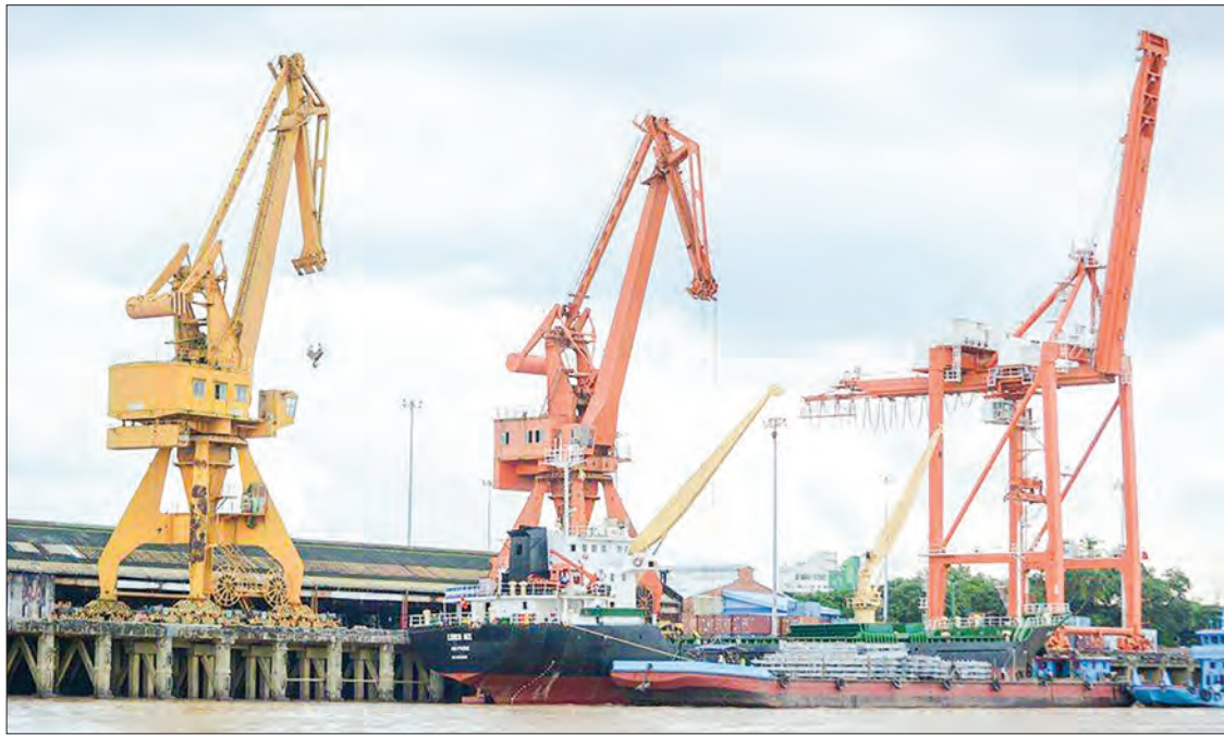
Myanmar's rice export by sea generated an estimated income of US$77.08 million as of 27 November in the current financial year, and the figures reflect a decrease of $74.67 million compared with a year-ago period.

However, rice exports via land border rose in the current