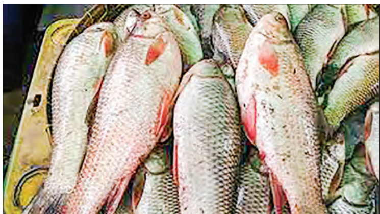
Myanmar mainly exports to India fruits and vegetables, fishery and forestry products.