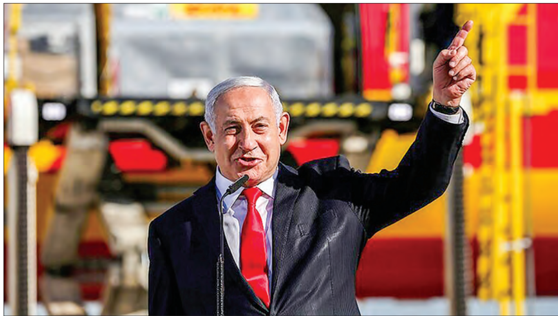
Prime Minister Benjamin Netanyahu vows to set an example to fellow Israelis by being the first to be inoculated as US pharmaceutical giant Pfizer BioNTech delivers a first planeload of its coronavirus vaccine.

ISRAEL received its first batch of Pfizer’s coronavirus vaccine on Wednesday, with Prime Minister Benjamin Netanyahu declaring the pandemic’s end was “in sight” and vowing to get the first jab.