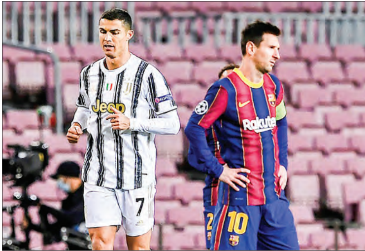
Cristiano Ronaldo and Lionel Messi met for the first time since the Portugal forward left Real Madrid in 2018.

BARCELONA — CRISTIANO Ronaldo struck twice from the penalty spot to win his battle with rival Lionel Messi and guide Juventus to a 3-0 win over Barcelona on Tuesday, earning the Italians top spot in Champions League Group G.