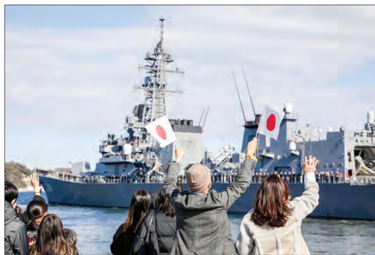
Japan's pacifist constitution strictly limits the country's military to self-defence, leaving it heavily dependent on the United States for security.