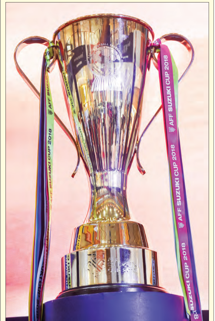
The trophy for the AFF Suzuki Cup Football Tournament.