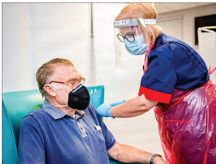
British health officials on Wednesday warned that anyone with a history of significant allergic reactions should not have the Pfizer-BioNTech Covid jab for the time being.

BRITISH health officials on Wednesday warned that anyone with a history of significant allergic reactions should not have the Pfizer-BioNTech Covid jab for the time being.