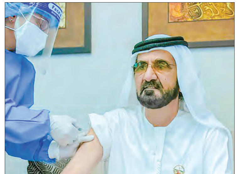
UAE PM Sheikh Mohammed Bin Rashid Al Maktoum receives Covid vaccine shot.

This means they only need to be refrigerated and can be easily distributed compared to jabs