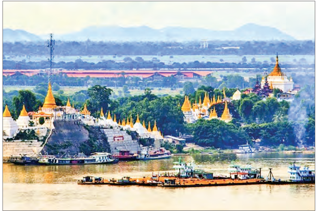
Shwe-Kyet-Yet and Shwe-Kyet-Kya Pagoda.

(Extract from a speech delivered by General Aung San on 11 February 1947 in Panglong at a dinner with Sawbwas)