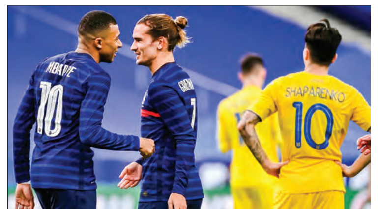
Kylian Mbappé and Antoine Griezmann during the last game against Ukraine, October 7 th 2020.

in a group of just five teams because they will be involved in the finals of the UEFA Nations League in Italy in October next year.