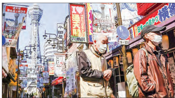
Japan's economy in the July-September period grew an annualized real 22.9 per cent from the previous quarter, the government said in a report on Tuesday.