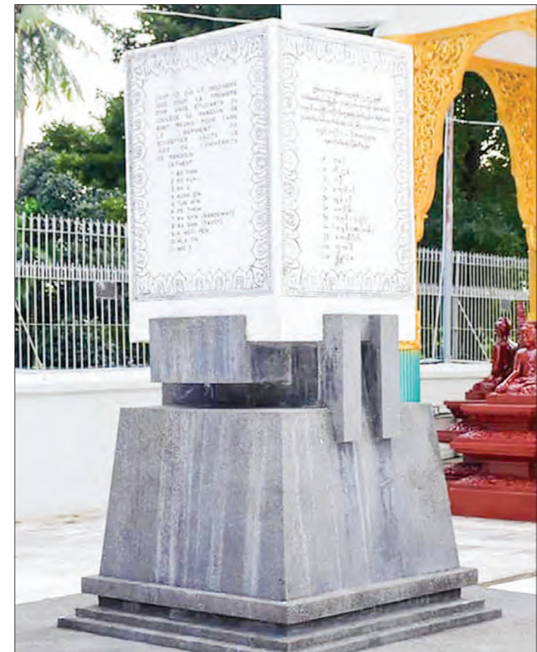
On 5 December, 1920, the unpopular new British regulations led the students at Yangon University to protest. Marble stone slab inscribed the names of the eleven students.