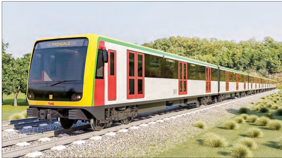
Myanmar will receive 246 new carriages for Yangon circular railway and Yangon-Mandalay Railway Project between 2023 and 2025..

THE Japanese government provides its assistance to Myanmar under the Official Development Assistance (ODA), including the upgrade of railway projects in coordination