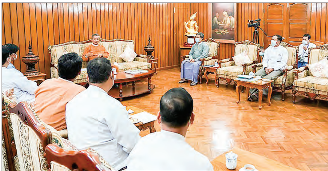
Union Minister U Ohn Maung discusses the development of the tourism sector in Nay Pyi Taw.

During the meeting, they discussed Community-Based Tourism in Nay Pyi Taw areas for local and foreign travellers and plans to follow the criteria of ministry in implementing the Community-Based Tour-