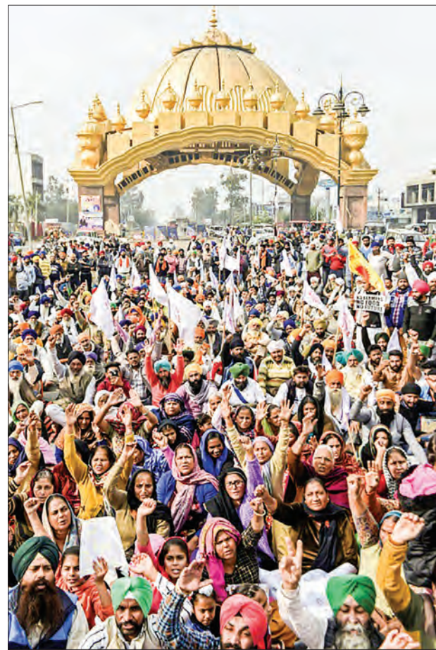
Workers have mobilized across India in protest against the reforms.

Delhi Chief Minister Arvind Kejriwal's Common Man Party said he had