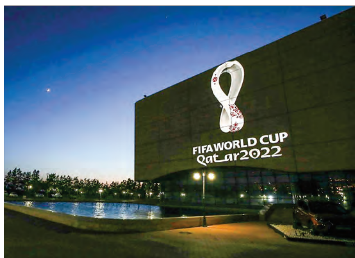
Qatar will inaugurate its latest completed World Cup stadium with a domestic fixture at which half of tickets will be reserved for fans who have recovered from coronavirus.

Fans will then be eligible for a non-transferable ticket once they receive the required test result.—AFP ■