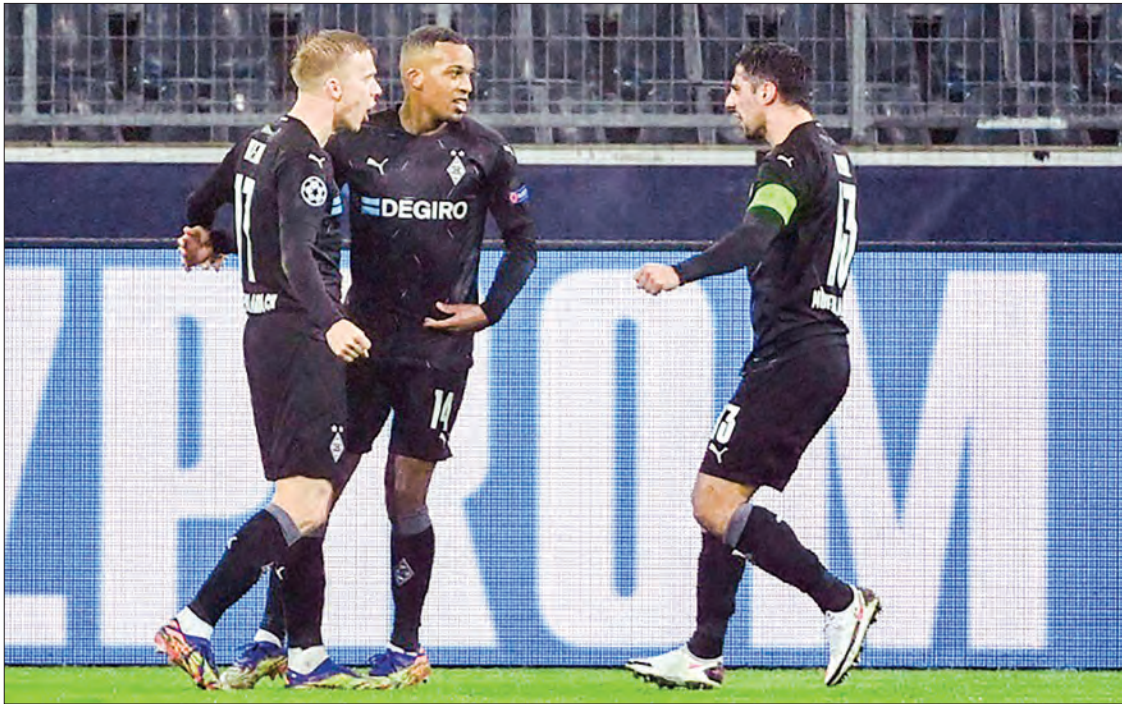
Moenchengladbach forward Alassane Plea (C) has scored five Champions League goals in as many games this season.

BERLIN — Borussia Mönchengladbach are out to wreck Real Madrid's last 16 hopes in the Champions League on Wednesday with the German visitors chasing a place in the knock-out stages of Europe for the first time since the 70s.