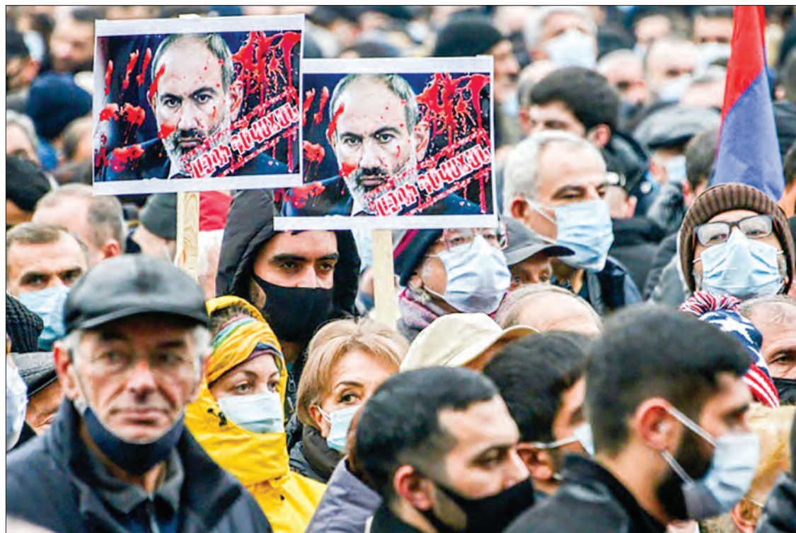
Protesters have since staged near daily demonstrations in Yerevan, urging the resignation of Armenia's Prime Minister Nikol Pashinyan.