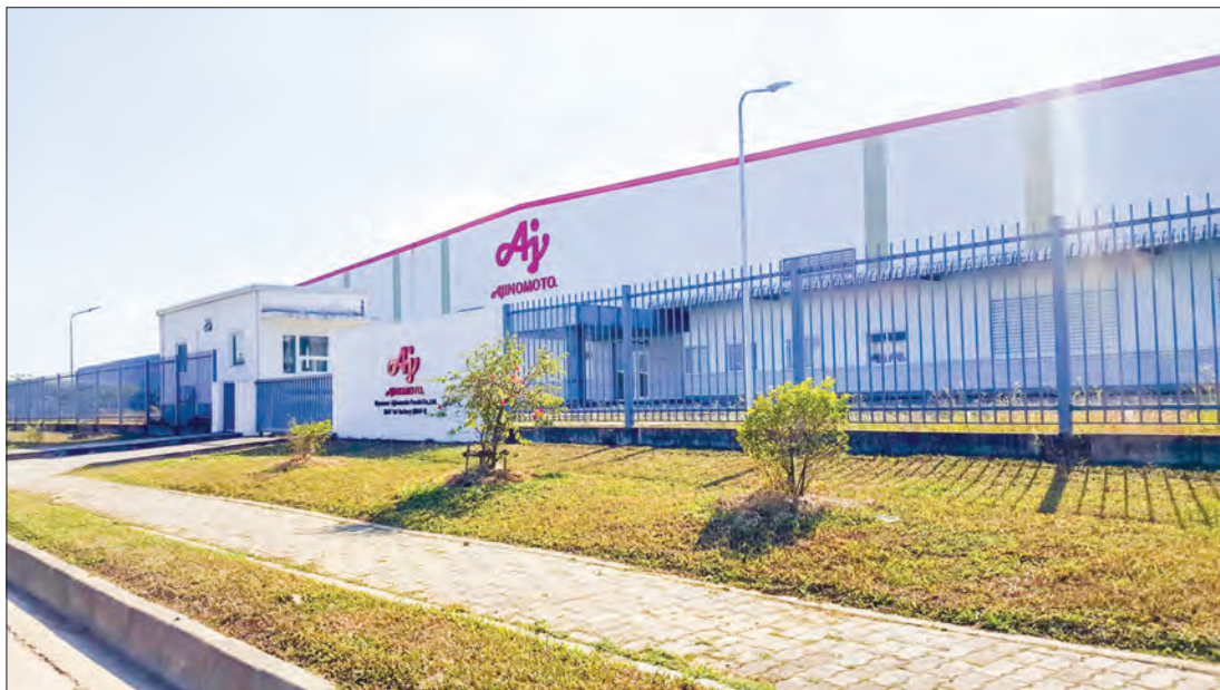
Myanmar Ajinomoto Foods CO., LTD.