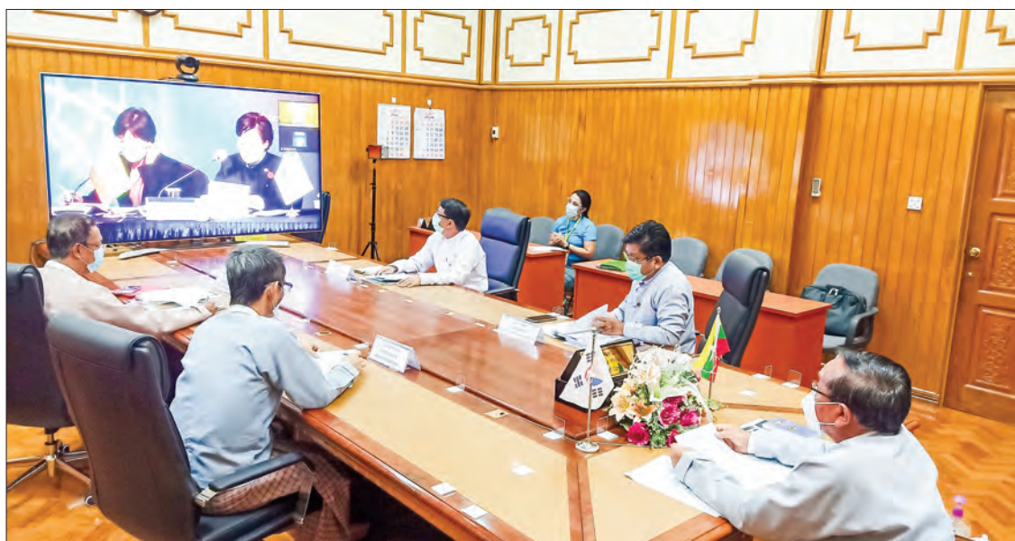
Union Minister U Han Zaw joins 8 th Global Infrastructure Cooperation Conference online on 8 December

UNION Minister for Construction U Han Zaw attended the 8 th Global Infrastructure Cooperation Conference (GICC2020) organized by the Ministry of Land, Infrastructure and Transport of the Republic of Korea yesterday.