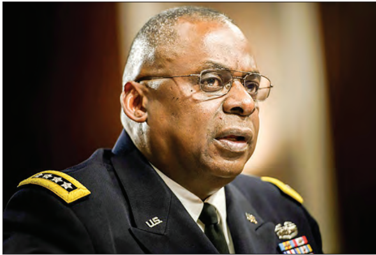
Retired army general Lloyd Austin, shown here in 2016 when he was still in the service, has been chosen by President-elect Joe Biden to be secretary of defence, US media reported.

PRESIDENT-ELECT Joe Biden has chosen Lloyd Austin, who led US troops into Baghdad in 2003 and rose to head the US Central Command, as the first