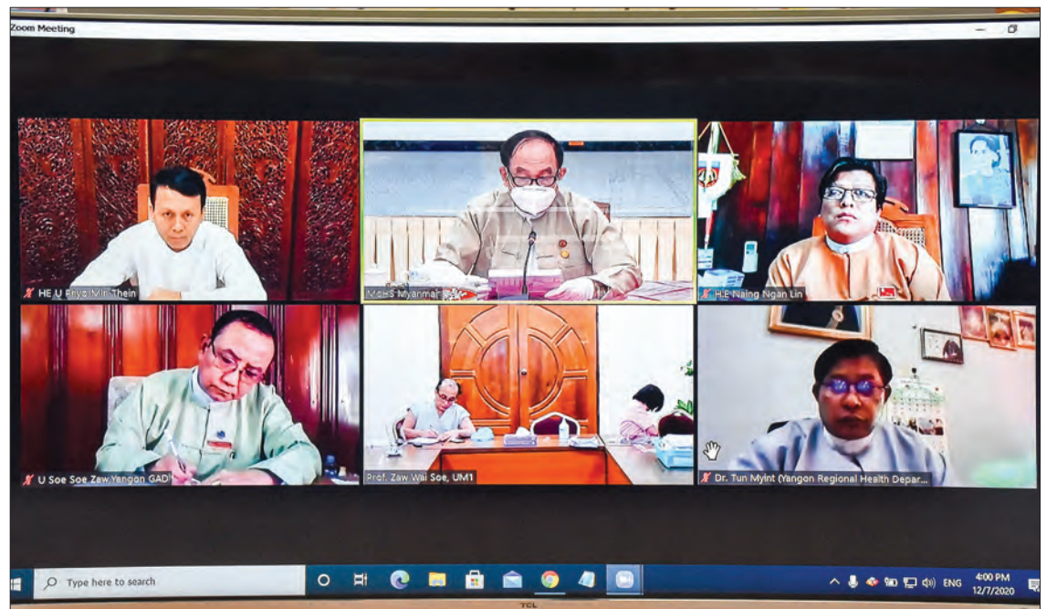
Union Minister Dr Myint Htwe holds talks on COVID-19 response measures in Yangon Region on 7 December.

Yangon Region Chief Minister U Phyo Min Thein said that the regional government is trying to balance COVID-19