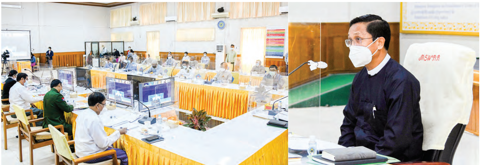
Vice-President U Henry Van Thio presides over the 2/2020 meeting of the National Committee on the Rights of Persons with Disabilities on 8 December.

T HE National Committee on the Rights of Persons with Disabilities, chaired by Vice-President U Henry Van Thio, held its second meeting this year yesterday.