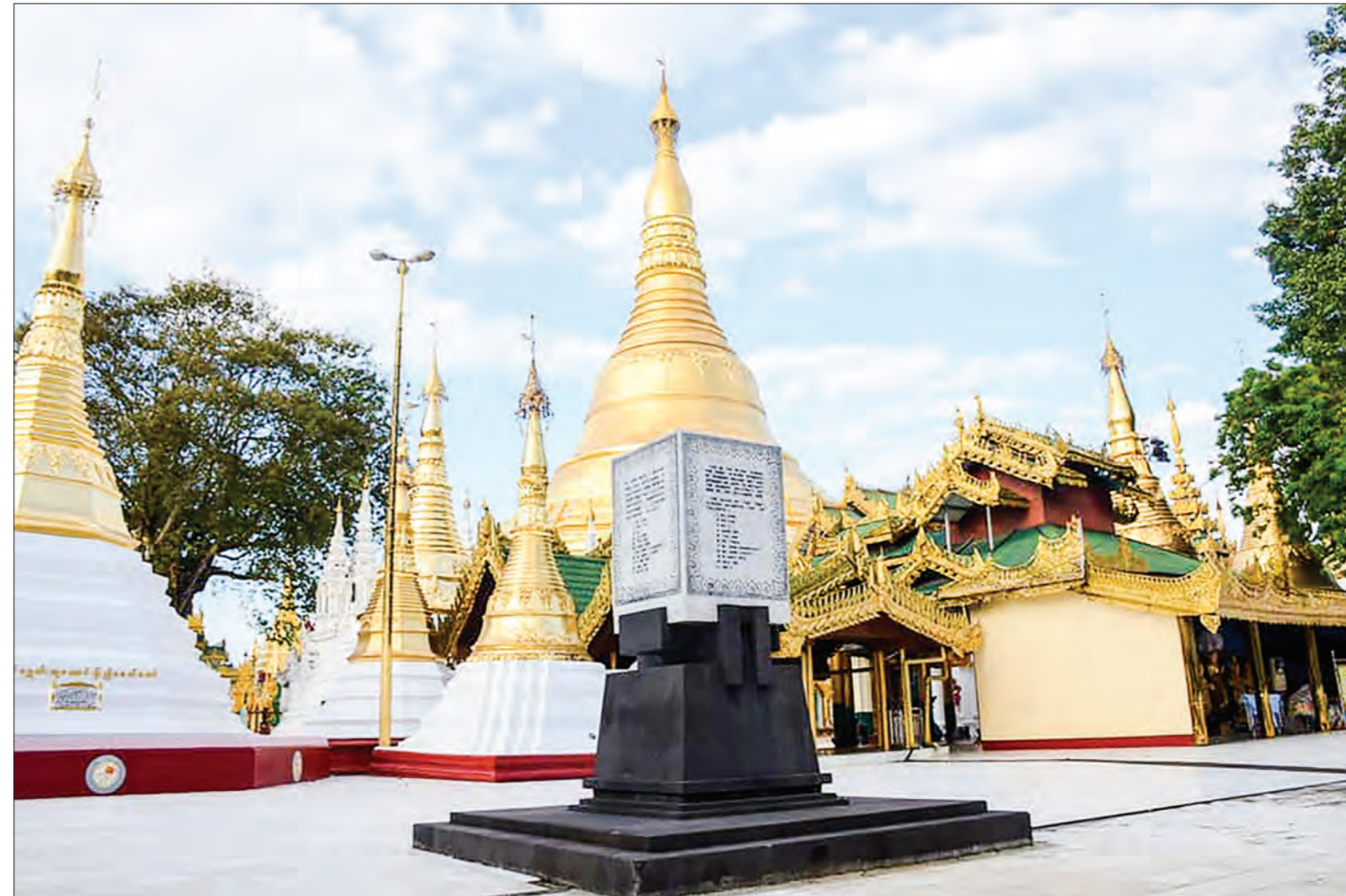
Marble stone slab inscribed the names of the eleven students at the Shwedagon Pagoda.

All students know National Victory Day အမျိုးသားအောင်ပွဲနေ့ is the red letter in Tazaungmon month (December). But not all students of old and new generations know its history let alone entire Myanmar people. Perhaps many or some have attended public talks