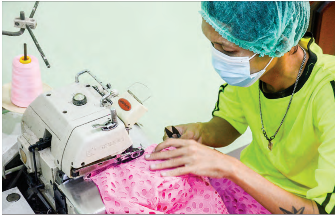
A garment worker sews clothes at a workplace in Yangon.

sector is primarily concentrated in garment and textiles produced on the Cutting, Making, and Packing basis, and it con-