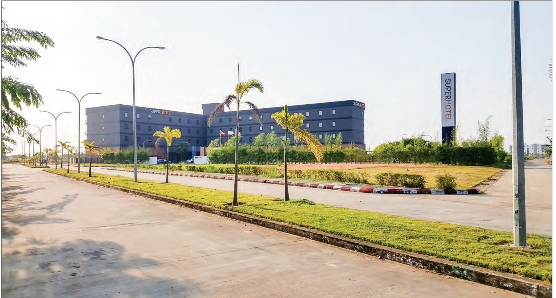
Super Hotel in Thilawa SEZ.