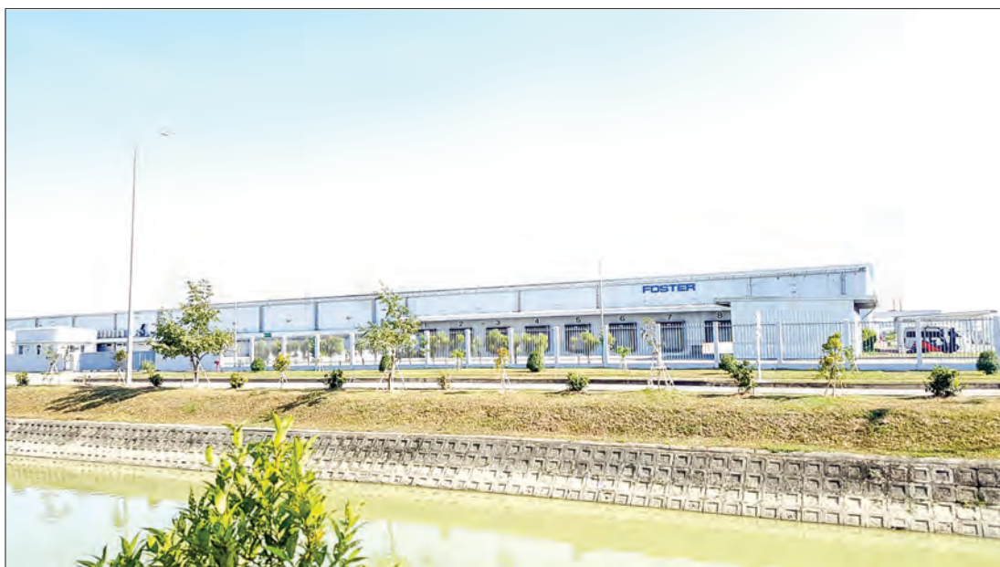
FOSTER ELECTRIC (THILAWA) CO., LTD.

with social and economic reforms, opened its door and paved the way for foreign investment in 2010, Japan has been actively involved in infrastructural projects in the country ranging from industrial sector to railway and road networks. Japanese government and private firms are keen to invest in Myanmar and help boost Myanmar's SMEs and agricultural sector. Japan's direct investment in Myanmar has been steadily rising in recent years. The