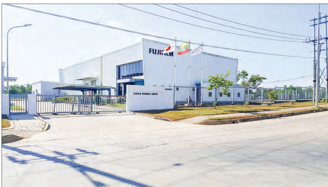
FUJIFILM MYANMAR INVESTMENT CO., LTD.