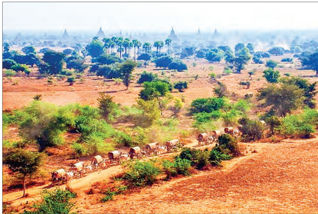
Landscape of Bagan Cultural Heritage Zone.

(Extract from the Message of Greetings sent by President U Win Myint on 4 January 2020 on the occasion of the 72 nd Anniversary of Independence Day.)