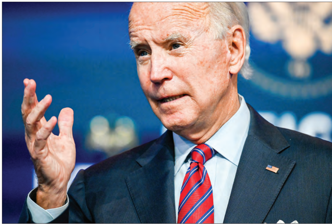
US President-elect Joe Biden speaks at The Queen in Wilmington, Delaware on 4 December 2020.

fended the immigrant rights programme DACA in front of the Supreme Court. According to the Times, Becerra's nomination comes after complaints from the Congressional Hispanic Caucus about a lack of Latinos in