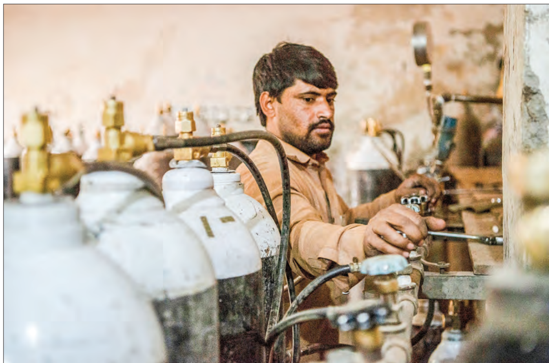
A worker fills oxygen cylinders for hospital use in Peshawar December 7, 2020. Seven workers at a Pakistan hospital who left scores of Covid-19 patients without sufficient oxygen for hours have been suspended after several of their charges died, authorities said.

"The hospital was low on oxygen from around 8 pm in the evening, how come they couldn't manage to solve the issue until after 12 pm?" Jhagra said.