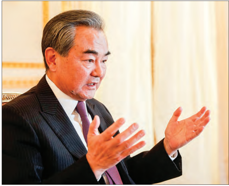
Chinese Foreign Minister Wang Yi gestures during an interview with AFP in Paris on 21 October 2019.

BEIJING (China) — China's top diplomat on Monday called for the resumption of talks with the incoming US administration of president-elect Joe Biden, as relations between the world's two largest economies continued to nosedive.