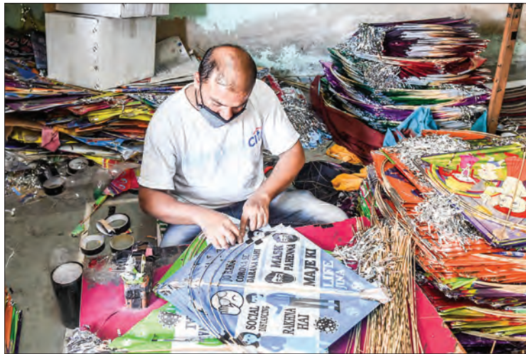
A kite maker gives finishing touches to kites with a design displaying Covid-19 prevention guidelines, at a workshop ahead of Makarsankranti or Festival of Kites, in Ahmedabad on December 7, 2020.

The world-first rollout of the Pfizer-BioNTech vaccine is due to start on Tuesday in the UK. Dubbed "V-Day" by Health Secretary Matt Hancock, he has