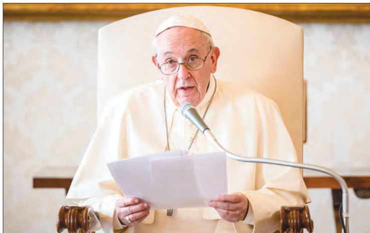
This photo taken and handout by the Vatican Media on November 25, 2020 shows Pope Francis holding a weekly private and live TV-streaming audience from the library of the apostolic palace in The Vatican, during the COVID-19 pandemic caused by the novel coronavirus. PHOTO: AFP

The pope’s visit to the ancient city of Mosul in northern Iraq will be particularly signifi-