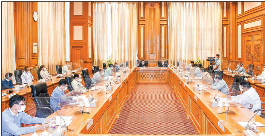
Central Committee on Organizing Hluttaw Meetings and the work committees hold meeting 4/2020 in Nay Pyi Taw on 7 December 2020.

PYIDAUNGSSU Hluttaw and Pyithu Hluttaw Speaker U Tun Aung said that the 1 st regular session of 3 rd Hluttaws is scheduled for the first week in February 2021.