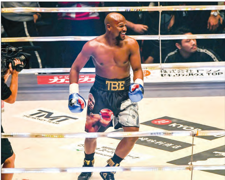
(FILES) In this file photo taken on 31 December 2018, US boxing legend Floyd Mayweather celebrates after winning an exhibition fight against kickboxer Tenshin Nasukawa of Japan at Saitama Super Arena in Saitama.

Mayweather will be giving up six inches in height to the six-foot-two Paul. Tickets are priced between $25 and $70. — AFP ■