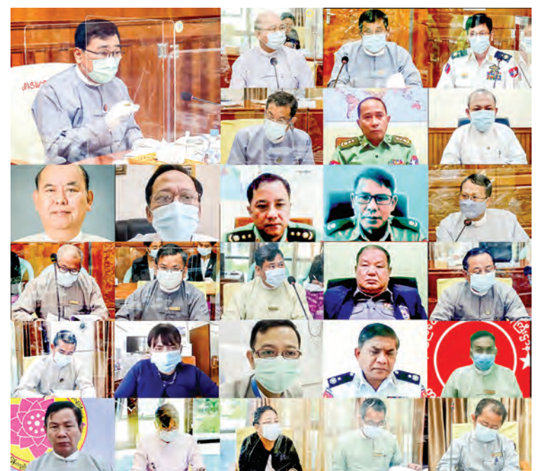
Union Minister Dr Win Myat Aye presides over the virtual meeting on protection of children from involvement in armed conflict on 7 December 2020.

The meeting was also attended by senior officers from the Ministry of Defence, the Ministry of Foreign Affairs, the Ministry of Labour, Immigration and Population, the Ministry of Health and Sports, the Union Attorney-General Office, the Ministry