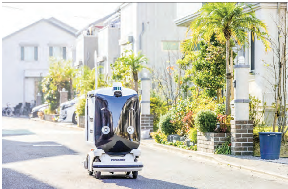
Undated supplied photo shows Panasonic Corp.'s self-driving robot in Kanagawa Prefecture.

Self-driving robots have gained renewed attention amid the global coronavirus pandemic, which has raised the need