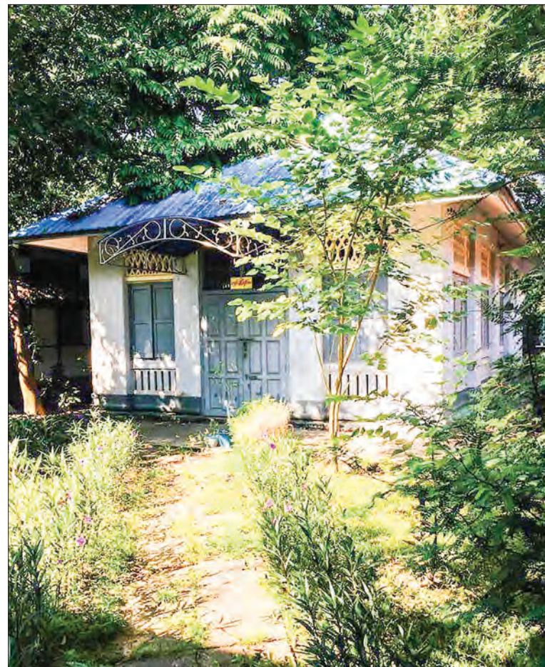
The Art Centre of the Rangoon Arts and Science University.

After the first year Art course was completed, the fifth Art Exhibition sponsored by the Arts Section of the University Art Association was held, and I was overjoyed to have my pencil drawings on display in the exhibition. My fear of mixing with the crowd and my unsociable nature subsided. The Art Centre opened at the week-ends only, but because I was informed that I could come and practise my skills in my free time, and because I had to take lectures in an AE (Art Extension) classroom, which is located beside the Art Centre, luck was on my side: just four or five steps, and there you are, at the Art Centre. Sometimes, reading the Billboard Writings of students displayed over there, I even forgot to resume taking lectures. But I had a hundred percent attendance on the students' roll call because my trustworthy pals kindly did forging my signature on it. Thus, I continued to study the second year Art course, and was taught the Water Colour painting. I had a great opportunity to participate in the Sixth Art and Sculpture Exhibition of Rangoon Arts and Science