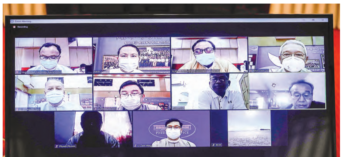
Government officials and delegates of Karenni National Progressive Party hold virtual meeting on peacemaking processes on 7 December 2020.