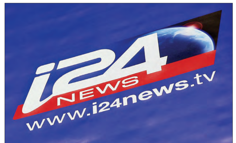
A picture taken on March 12, 2014 in Paris shows the logo of International 24-hour news television channel "i24 News".