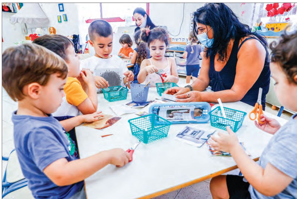
Israeli children take part in activities at a kindergarten in the central city of Shoham, on October 18, 2020.