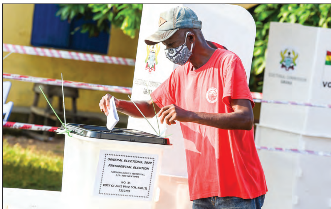
A man casts his vote at a polling station in the Eastern Region district of Kyebi on December 7, 2020 during Ghana’s presidential and parliamentary elections.

“I hope that there will be no incidents and I hope that voting will go smoothly,” he added.