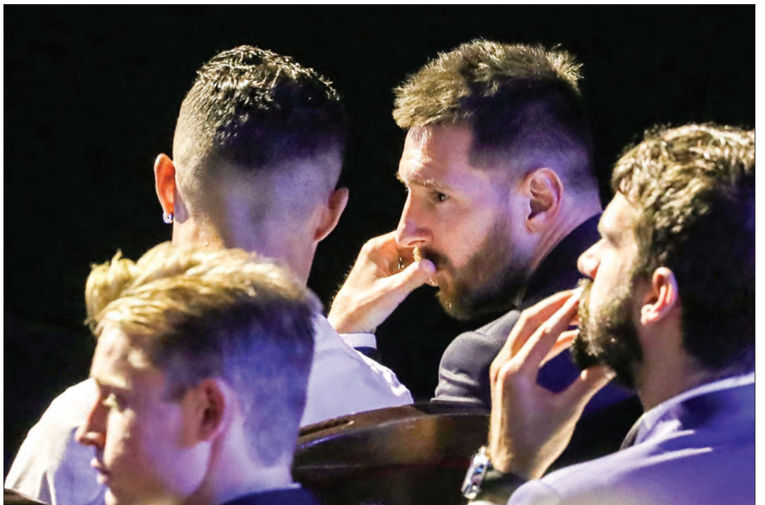
(FILES) Argentine forward Lionel Messi (R) speaks with Portuguese forward Cristiano Ronaldo (L) during the UEFA Champions League football group stage draw ceremony in Monaco on August 29, 2019.

MADRID (Spain) — Lionel Messi's rivalry with Cristiano Ronaldo has enthralled football for the better part of a decade, and the pair will duel for potentially the final time when Barcelona host Juventus in the Champions League on Tuesday.