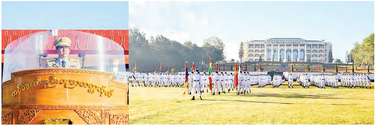
Senior General Min Aung Hlaing speaks during the Passing-out Parade of Defence Services Technological Academy in PyinOoLwin on 7 December 2020.

cadet companies, the Senior General presented awards to outstanding cadets.