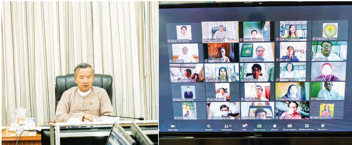
Union Minister U Ohn Maung participates in the opening ceremony of the ‘COVID-19 Safe Service Master Trainer’ and ‘Inspector Training for Inspection’ via videoconference on 7 December 2020.

THE Ministry of Hotels and Tourism yesterday morning organized an opening ceremony of the ‘COVID-19 Safe Service Master Trainer’ and ‘Inspector Training for Inspection’ via videoconferencing yesterday morning.