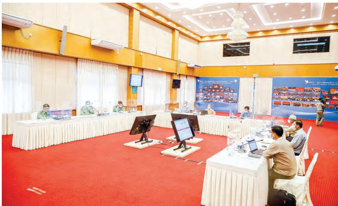
Coordination meeting on amendment to political dialogue framework is in progress at the National Reconciliation and Peace Centre in Nay Pyi Taw on 7 December 2020.