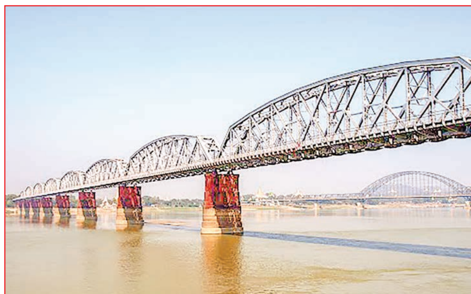
Inwa Bridge built in 1934

Myanmar Encyclopaedia Volumes I, IV Twinthin New History (Maha Sithu U Tun Nyo) History of Sagaing Kaung- hmutaw Temple (Einphyu Tawya Sayadaw)