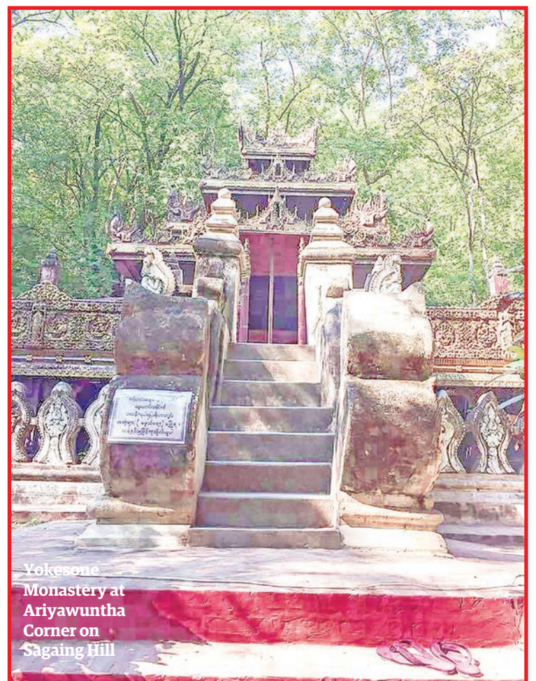
Yokesone Monastery at Ariyawuntha Corner on Sagaing Hill