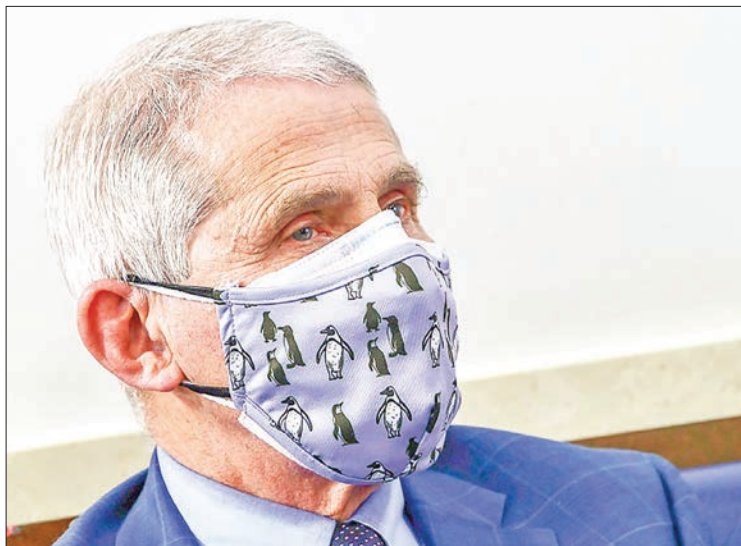
Anthony Fauci, who leads the US National Institute of Allergy and Infectious Diseases had been seen as criticizing the British drugs regulator on their swiftness to approve a coronavirus vaccine for widespread use.

LEADING American infectious disease scientist Anthony Fauci on Thursday walked back his criticism of Britain's drug regulator after saying it had rushed through its coronavirus