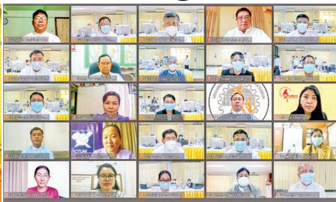
Union Minister U Thein Swe speaks during the National-Level Social Security Board Meeting (1/2020) on 4 December 2020.

The Union Minister said that his office is focusing on implementing the four main pillars: to revive the economy and employment sector in response to the COVID-19 crisis based on international labour standards, to support work departments for employment and income generation, to protect workers in the workplace and to continue the social dialogue for solutions.