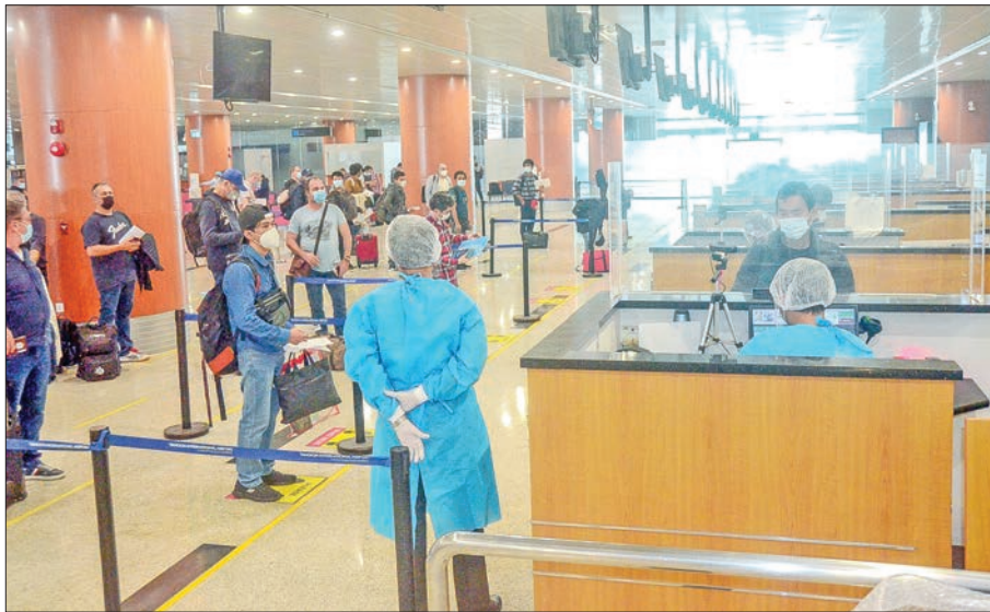
Myanmar returnees are seen at the Yangon International Airport on 4 December 2020.

A total of 181 Myanmar citizens stranded in foreign countries – 31 from France, Spain and neighbouring areas and 150 from Singapore –because of suspension of commercial flights returned home by relief flights yesterday.