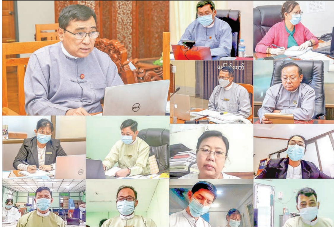
Union Minister Dr Win Myat Aye joins the virtual meeting on the establishment of Patheingyi Youth Training School in Mandalay on 4 December 2020.

The Union Minister discussed the plans to accept more youths under 18 years old at the centre according to the Child Rights Law which defines a child as anyone at 18 years old, the management system of Patheingyi Youth Training Centre like 16 staff members for 211 youths, challenges amid COVID-19 pandemic, efforts of ministry for the centre including healthcare service, security and buildings in the first quarter of 2020-2021FY, plans to follow the COVID-19 health rules in the