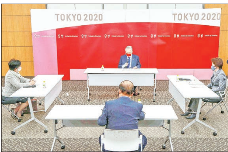
Tokyo Games organizing committee President Yoshiro Mori (back) holds talks with Tokyo Gov. Yuriko Koike (L) and Olympic minister Seiko Hashimoto (R) on Dec. 4, 2020, in Tokyo.

TOKYO—The organizers of the Tokyo Olympics and Paralympics reached an agreement Friday with the Tokyo metropolitan and central governments on splitting an extra 294 billion yen ($2.83 billion) in costs arising from the one-year postponement of the games, along with countermeasures for the novel coronavirus.