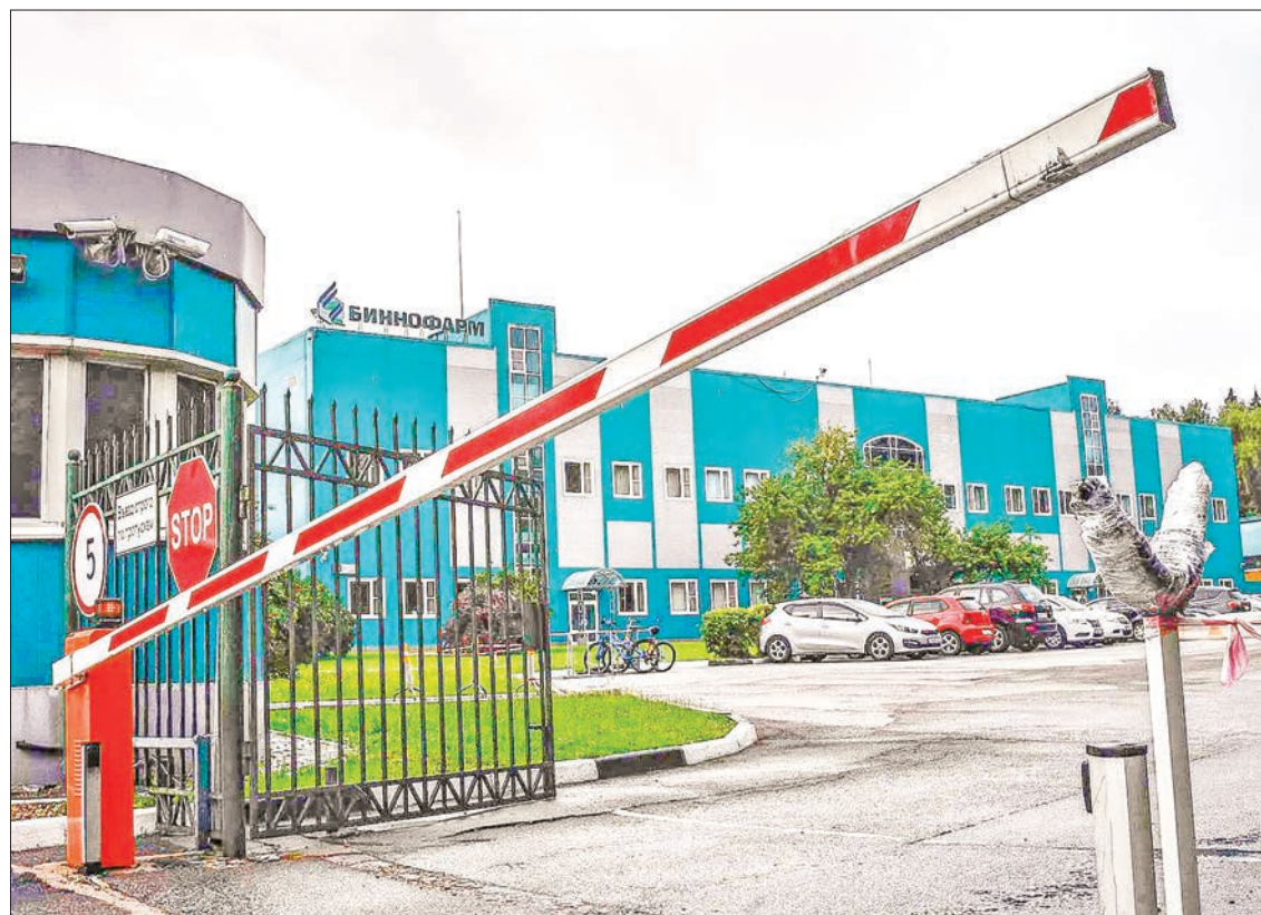
The Russian coronavirus vaccine has gone into production at the Binnofarm pharmaceutical factory in the town of Zelenograd outside Moscow.

The vaccine will be first made available to people in