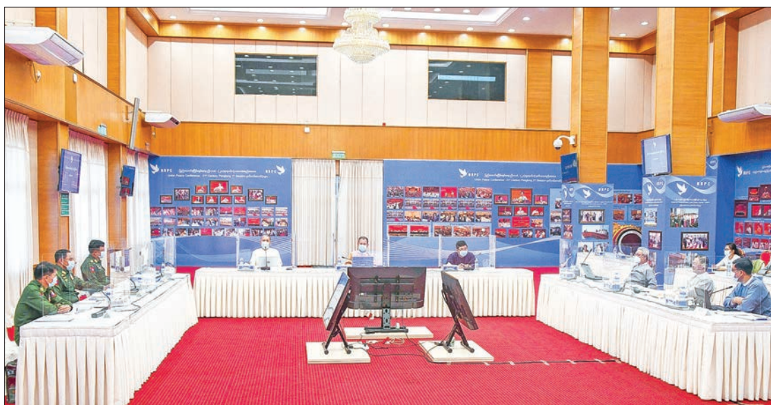
Second day of coordination meeting on making peace with EAOs is in progress at the National Reconciliation and Peace Centre in Nay Pyi Taw on 4 December 2020.