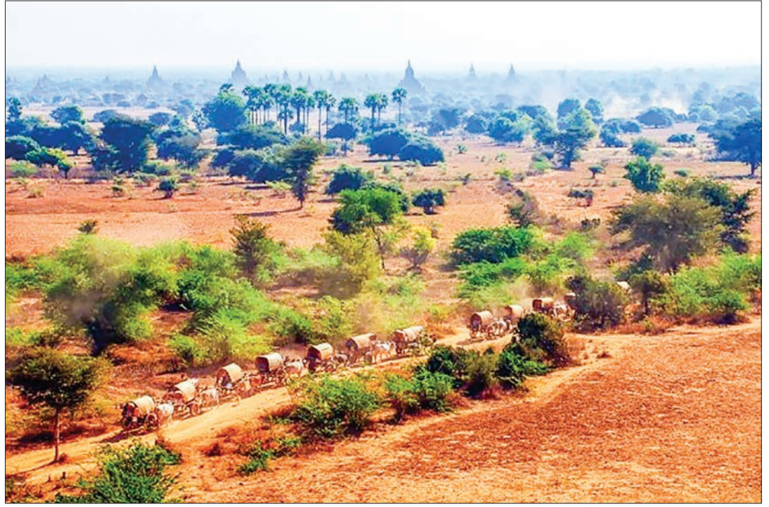
Landscape of Bagan Cultural Heritage Zone.

(Extract from the Message of Greetings sent by President U Win Myint on 4 January 2020 on the occasion of the 72 nd Anniversary of Independence Day.)