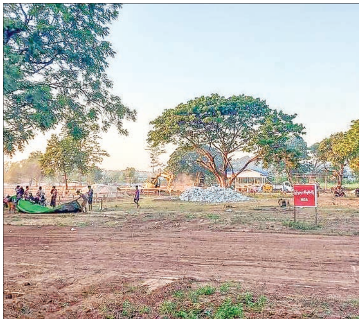
Picture shows the site where We Love Yangon Group will construct a hospital in Dagon Myothit (South) Township.

The hospital will be built with the organization of We Love Yangon and with the spending of the fund from the public on the land owned by Yangon City