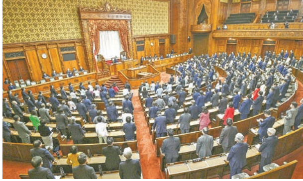
The House of Councillors holds a plenary session in Tokyo on Dec. 4, 2020.

Trade Secretary Liz Truss in Tokyo in October, passed the upper house following its approval by the lower house last month. Britain still needs to complete its domestic ratification procedures for the pact to enter into force. The two countries needed to wrap up the deal as the existing Japan-EU pact will not cover Britain after the completion of the