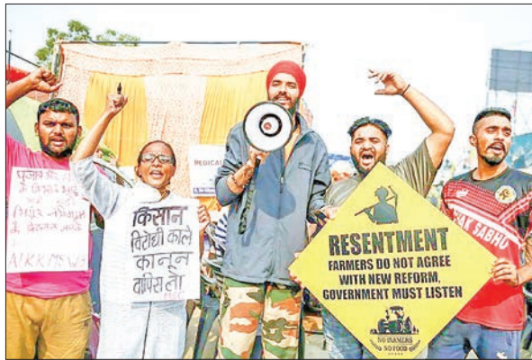
Farmers hold placards and shout slogans during a protest at the Delhi-Haryana state border.

India's External Affairs Ministry on Friday summoned the High Commissioner of Canada in India and informed him that comments by Canadian Prime Minister Justin Trudeau, cabinet ministers and lawmakers on issues related to the Indian farmers constitute "an unacceptable interference in our internal affairs".