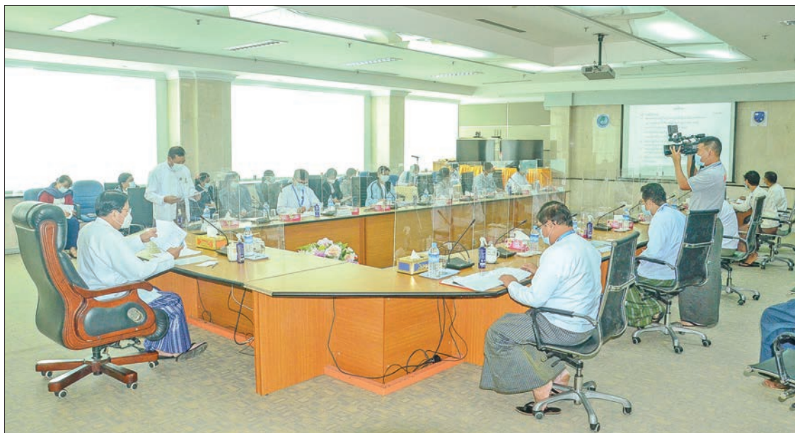
Union Minister Dr Pe Myint holds meeting with MRTV officials at the MRTV Office in Tatkon Township, Nay Pyi Taw on 4 December 2020.

UNION Minister for Information Dr Pe Myint inspected the works of the Myanmar Radio and Television in Tatkon Township, Nay Pyi Taw yesterday.