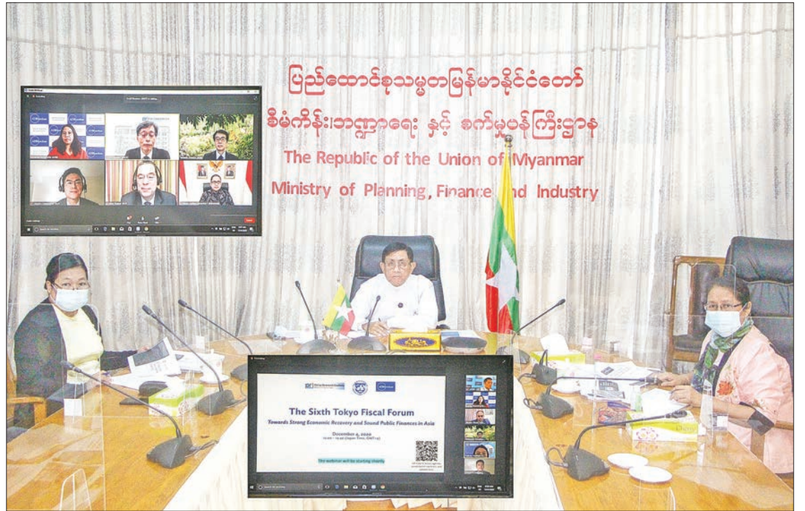
Deputy Minister U Maung Maung Win participates in the Sixth Tokyo Fiscal Forum via videoconference on 4 December 2020.