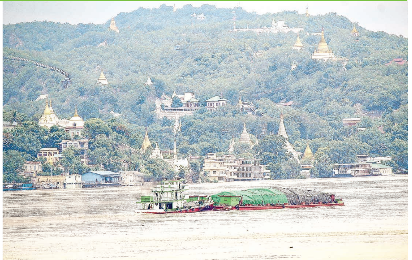
Sagaing Hill and Ayeyawady River

King Badon who established Amarapura Royal Palace started construction of Pahtodawgyi Temple in 1152 Myanmar Era but could not finish it. The folded paper from the golden treasury proved Pahtodawgyi was purposed to build the one with 293 elbows in diameter and 352 elbows in height. But, veteran historian Dr Than Tun wrote that construction of the Pahtodawgyi reaching 160 feet in height collapsed. King Badon built the 15 feet