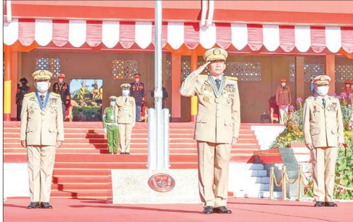
Senior General Min Aung Hlaing attends the 62nd intake graduation parade of the Defence Services Academy in PyinOoLwin on 4 December 2020.

Hlaing first took their salute, and presented prizes to the outstanding cadets.