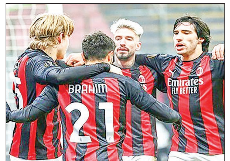
AC Milan are five points clear at the top of Serie A.

The Premier League has committed to cover up to £15 million in interest and arrangement fees to enable a £200 million loan to be secured for clubs in the second-tier Championship.—AFP ■