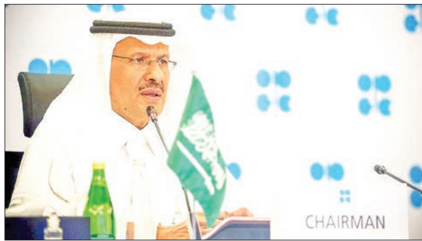
Saudi Arabia's Minister of Energy Prince Abdulaziz bin Salman Al-Saud speaks via video link during a virtual emergency meeting of OPEC and non-OPEC countries, following the outbreak of the coronavirus disease (COVID-19), in Riyadh, Saudi Arabia April 9, 2020.

THE members of the Organization of the Petroleum Exporting Countries (OPEC) cartel of oil producers are meeting with their allies on Thursday to see if they can reach an accord on extending production cuts over the coming months.