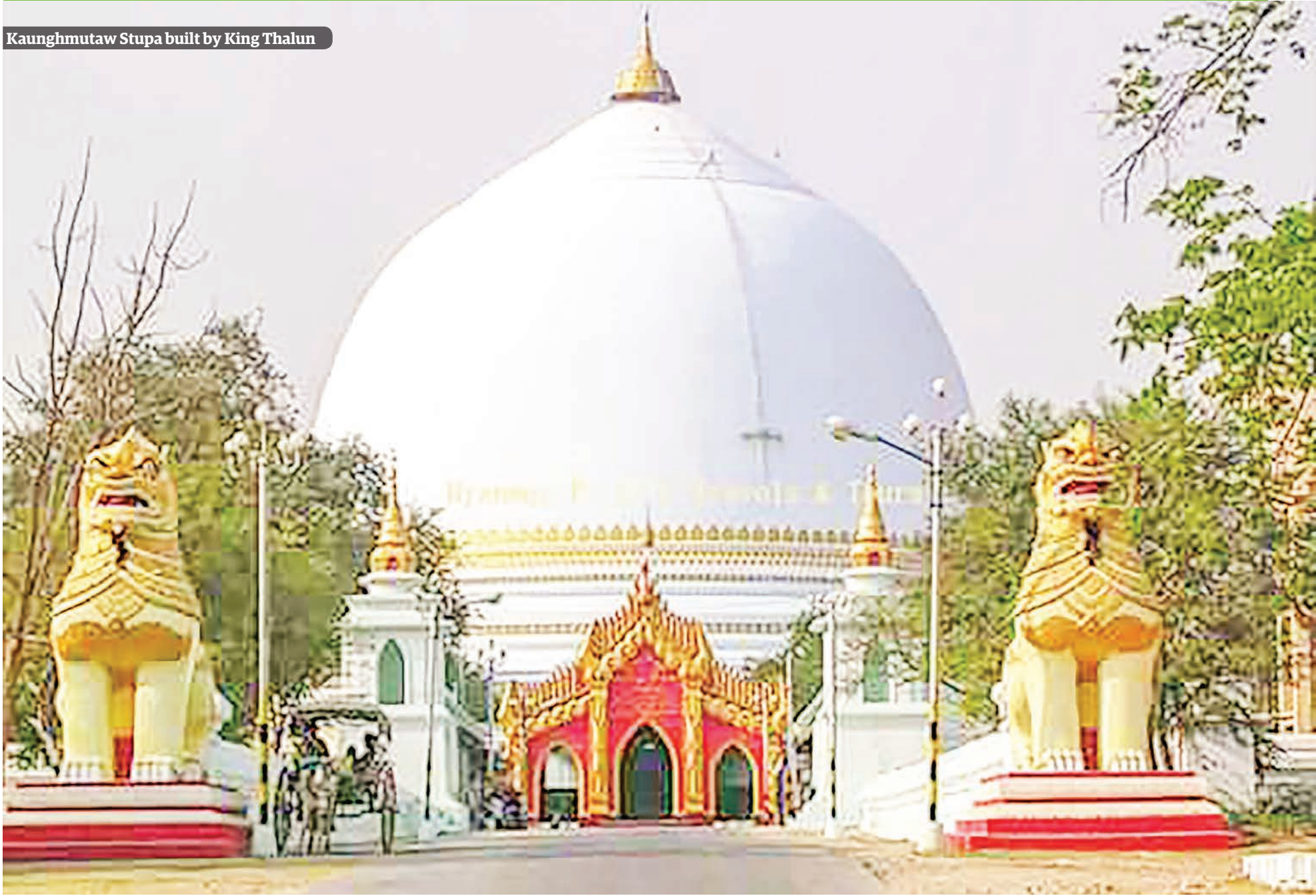
Kaunghmutaw Stupa built by King Thalun