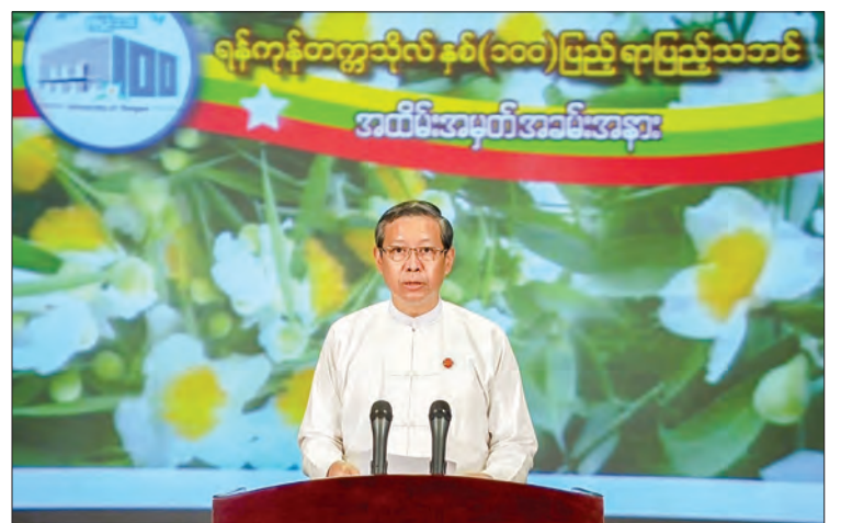
Union Minister Dr Myo Thein Gyi makes the congratulatory remark in the 100 th anniversary of Yangon University.

A video clip of quiz competition was shown, and awards were given to the winners, and