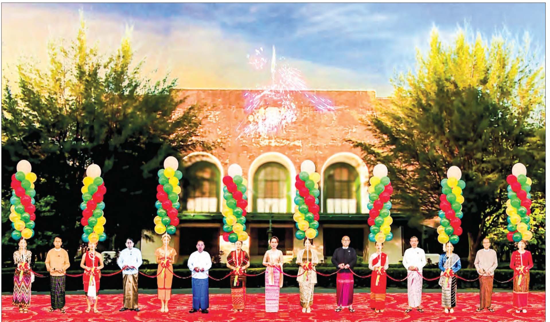
State Counsellor Daw Aung San Suu Kyi, Vice-President U Myint Swe, Amyotha Hluttaw Speaker Mahn Win Khaing Than, Union Ministers, Yangon Region Chief Minister and YU Rector are virtually cutting the ceremonial ribbon for 100 th anniversary of Yangon University.

T HE 100 th anniversary of University of Yangon was held on virtual celebrations yesterday.