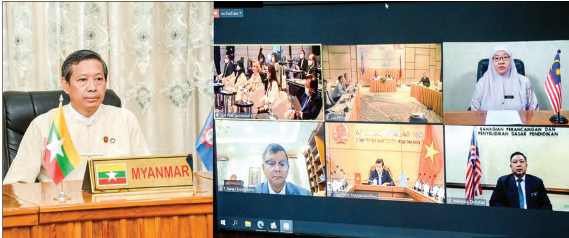
Union Minister Dr Myo Thein Gyi participates in the launching ceremony of Southeast Asia PLM 2019 Results online on 1 December.

UNION Minister for Education Dr Myo Thein Gyi joined the launching ceremony of Southeast Asia Primary Learning Metrics (SEA-PLM) 2019 Results organized by UNICEF and SEAMEO was held online yesterday morning.