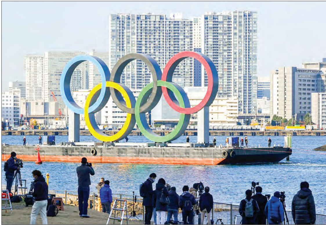
The Olympic rings are reinstalled in Tokyo Bay on Dec. 1, 2020, after undergoing safety inspections and maintenance.

TOKYO — A giant floating monument of the Olympic rings was reinstalled in Tokyo Bay on Tuesday after undergoing safety inspections and maintenance since the summer.