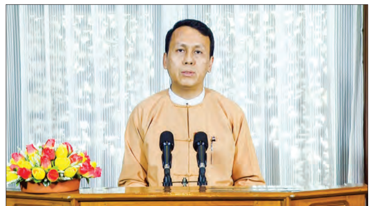
Yangon Region Chief Minister U Phyo Min Thein makes the speech to honour the dignity of Yangon University.