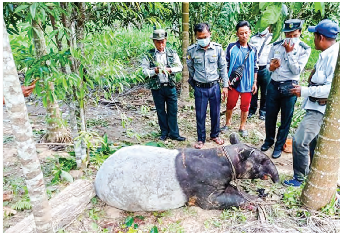
An injured female Tapir was found on 22 November and is now undergoing medical treatment.

A rare rhino (Tapir) was found near Nine Village in Mawtaung Town in Taninthayi Township