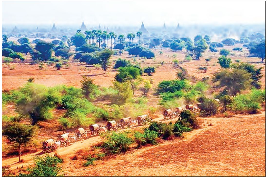
Landscape of Bagan Cultural Heritage Zone.

Extract from the Message of Greetings sent by President U Win Myint on 4 January 2020 on the occasion of the 72 nd Anniversary of Independence Day.)