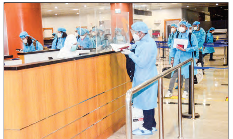
The returnees are seen in the Immigration process at the Yangon International Airport.

The Ministry of Labour, Immigration and Population, the Ministry of Health and Sports and the Yangon Region government arranged 7-day quarantine