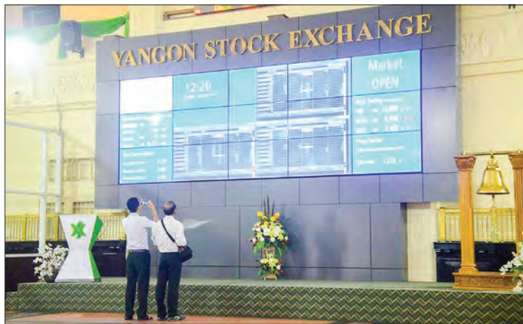
The Securities and Exchange Commission of Myanmar (SECM) has allowed foreigners to invest in the local equity market from 20 March 2020.

FOREIGN investors have purchased 4,460,060 shares of First Myanmar Investment (FMI) on the Yangon Stock Exchange (YSX) as of November-end, holding 13.47 per cent of shares, according to statistics released by the exchange.