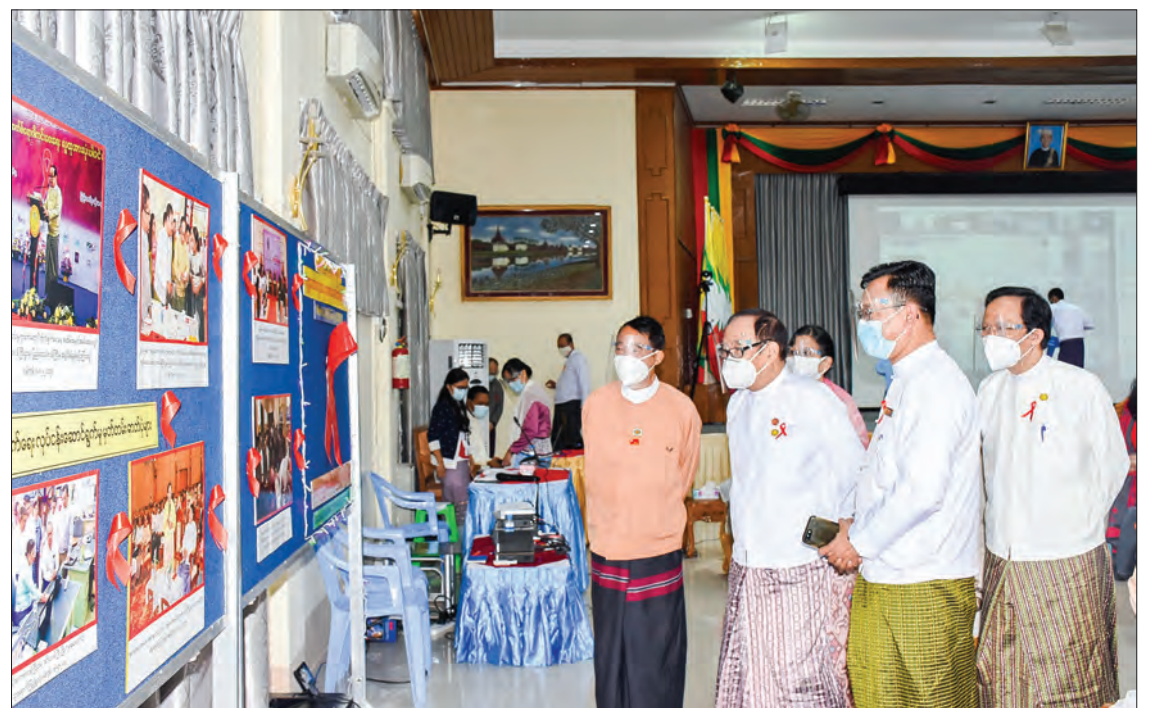
Union Minister Dr Myint Htwe and officials are looking into the commemorative display on World AIDS Day on 1 December.

Director Dr Tun Nyunt Oo explained the National Strategic Plan on HIV and AIDS, and the Union Minister and officials observed the commemorative exhibition after the event.—MNA (Translated by Zaw Htet Oo)