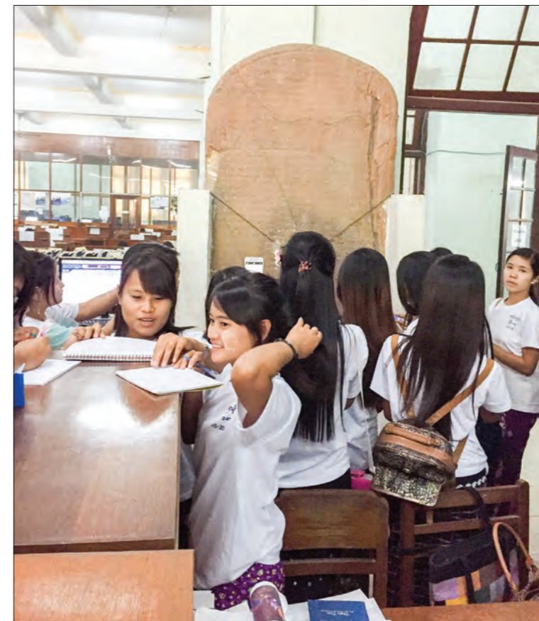
The Myanmar Language specialization students from Ma-U-Bin University observing the Inscription.