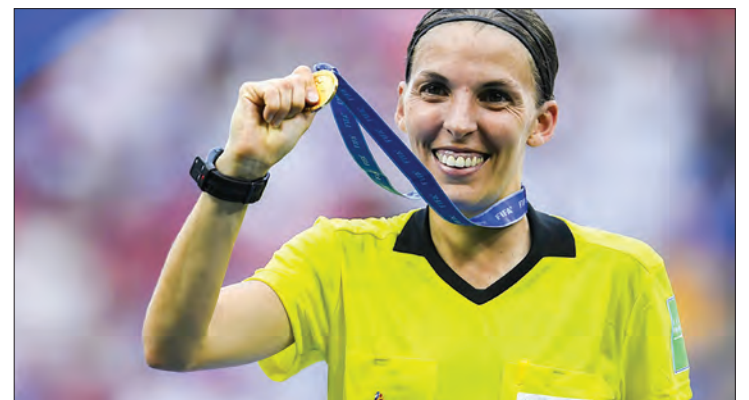
Stephanie Frappart will become the first woman to referee a men's Champions League match between Juventus and Dynamo Kiev.

Juventus, second in the group, are already through to the last 16 along with leaders Barcelona, with two games to play.—AFP ■