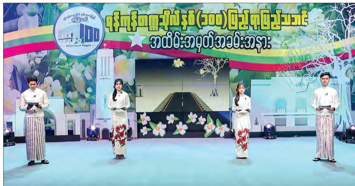
The virtual celebrations of the 100 th Anniversary of Yangon University are held on 1 December 2020.

then Mayor of Yangon City Development Committee extended greeting.