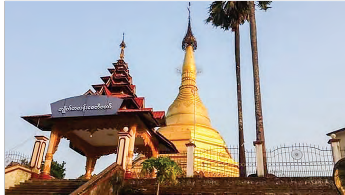
The Kyaik Ta Lan Pagoda.

itage of King Kyansittha preserved in University of Yangon Library? How did it find way into this house of knowledge? What historical values and essence have been immortalized in it? As a visitor entering the Library, he may be attracted by a huge stone inscription, erected on a cement base, next to the Loan Section on the right side of the entrance. It is over seven feet high and over three feet in breadth. There it stands tall and heavy but many might have failed to notice its existence.