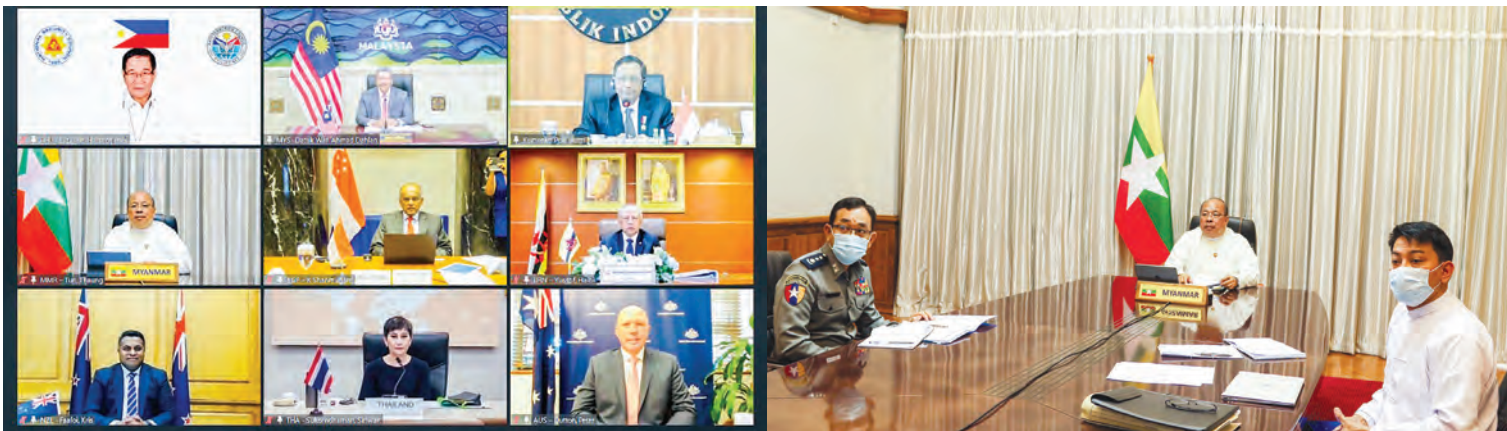
Union Minister U Thaung Tun addresses the Third Sub-Regional Meeting on Counterterrorism and Transnational Security via videoconference on 1 December.

UNION Minister for Investment and Foreign Economic Relations and National Security Advisor to the Union Government, U Thaung Tun yesterday attended the Third Sub-Regional Meeting on Counterterrorism and Transnational Security jointly chaired by Mr Mohammad Mahfud, Coordinating Minister for Political Legal and Security Affairs of the Republic of Indonesia, and the Honourable Peter Dutton MP, Minister for Home Affairs of Australia.