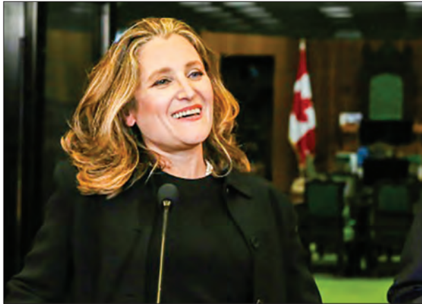
Canadian Finance Minister Chrystia Freeland - here with Prime Minister Justin Trudeau - said the government was preparing to spend up to Can$100 billion over three years to jolt the economy once the pandemic is over.

CANADA'S budget deficit is projected to balloon to a record Can$382 billion (US$284 billion) as government spending skyrockets to combat the spread of the novel coronavirus, the fi-