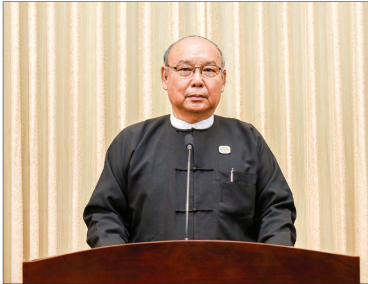
Amyotha Hluttaw Speaker Mahn Win Khaing Than gives the video speech to congratulate the 100 th Anniversary of Yangon University.

In tracing the history of the University of Yangon back, Myanmar did not have its own university for national people before 1920, except Yangon college under the University of Calcutta and Baptist College of the American Baptist Missionaries in the country. The name of Baptist College was changed into Judson College (Yudathan College). Our country had not a