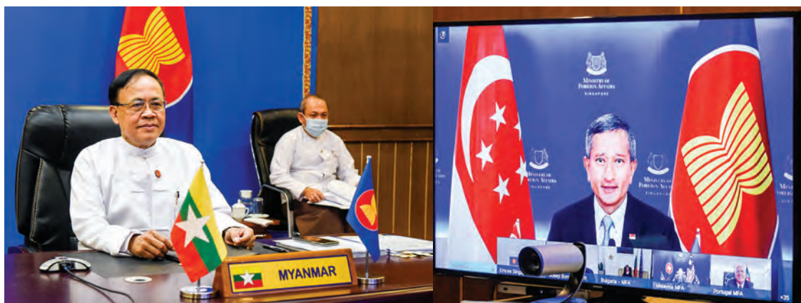
Union Minister U Kyaw Tin joins the 23 rd ASEAN-EU Ministerial Meeting via videoconference on 1 December from Nay Pyi Taw.

The Ministers exchanged views on matters relating to strengthening ASEAN-EU Di-