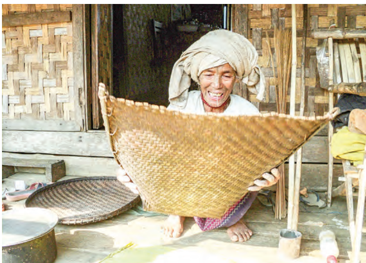
A Chin ethnic woman winnowing rice.

rare orchid species and living biodiversity and thriving plants. As Number of tourist arrivals has been increasing in the national park as of 2012-13 financial year, environmental conservation can green hilly and forestry areas with creation of job opportunities for local people while earning income of foreign exchange in tourism industry. White-browed Nuthatch, a rare bird species across the world can be seen in Natma Hill national park only in Myanmar. Such kind of bird can attract international bird enthusiasts. The park was also home to rare animal species such as tiger, leopard, clouded leopard and wild