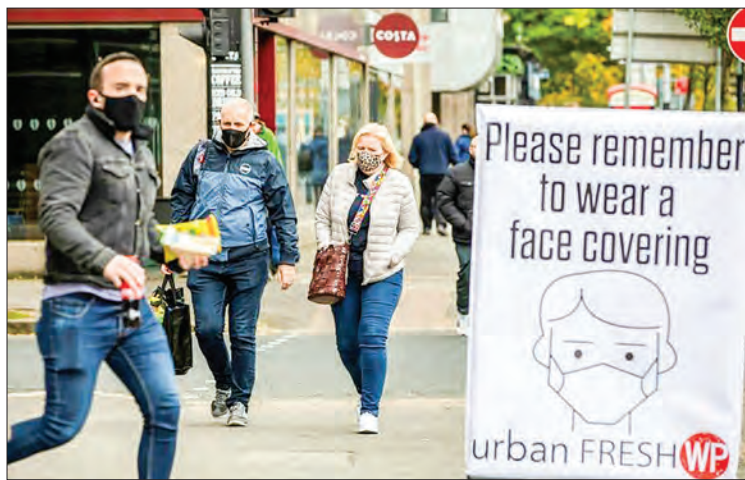
Northern Ireland shops, pubs and restaurants will shut for two weeks in efforts to curb the coronavirus.

NORTHERN Ireland shops, pubs and restaurants will shut for two weeks in efforts to curb the coronavirus, the British province announced, on the eve of Friday’s partial reopening of businesses.