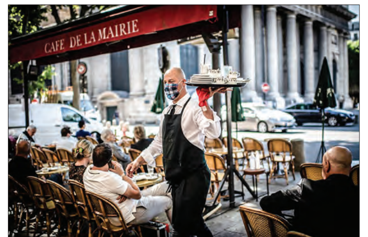
France is preparing to reopen stores for the crucial Christmas shopping season, encouraged by new data suggesting the country is past the worst of its second wave of infections.