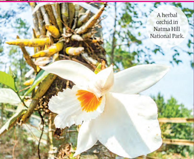
A herbal orchid in Natma Hill National Park.

mar's Ginseng stands the fourth positions across the world. Japanese conducted observation at the park for the second time and ended in December 2013. The research team collected data on more than thousands of plant species from the park and estimated over 2,500 species in the park. Over ten species of herbal Dendrobium orchid can be seen in the park. China and Thailand purchase such kinds of orchid species to produce tonic drug. Among them, Chin's red orchid can attract travelers. So, visitors from France and England ob-