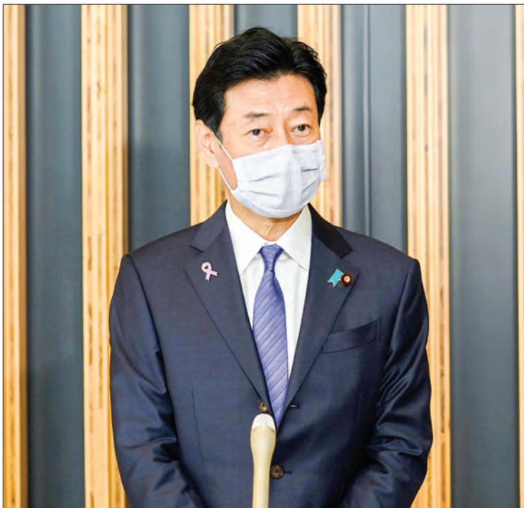
Japan's economic revitalization minister Yasutoshi Nishimura meets the press in Tokyo on Nov. 22, 2020. The government plans to unveil in the next few days the specifics of how its "Go To Travel" subsidy program will be suspended in areas with high numbers of coronavirus cases.

JAPAN will try to unveil in the next few days the specifics of how its "Go To Travel" subsidy program will be suspended in areas with high numbers of coronavirus cases, a senior government official said Sunday.