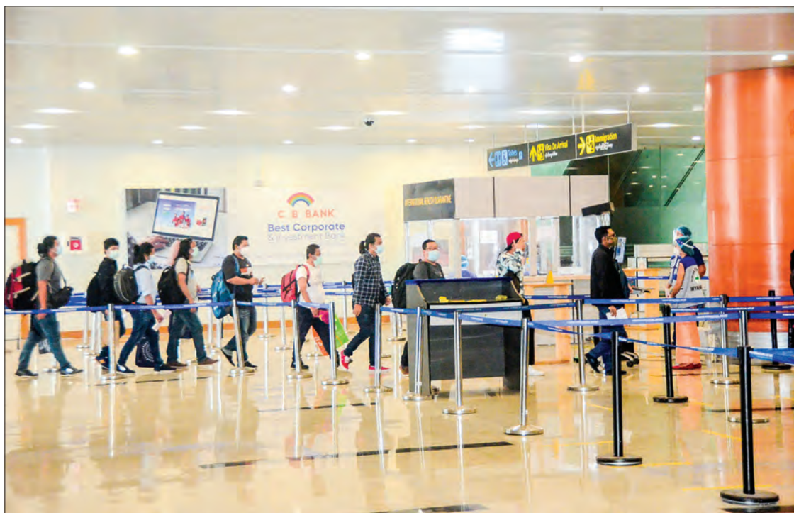
Myanmar returnees from foreign countries arrive at the Yangon International Airport on 22 November 2020.

A TOTAL OF 129 Myanmar nationals who were stranded in Taiwan (Chinese Taipei) because of suspension of commercial flights — 120 seamen and other 9 nationals — returned home yesterday morning by the 7 th relief flight of China Airlines organized by the Consulate-General of Myanmar in Hong Kong.