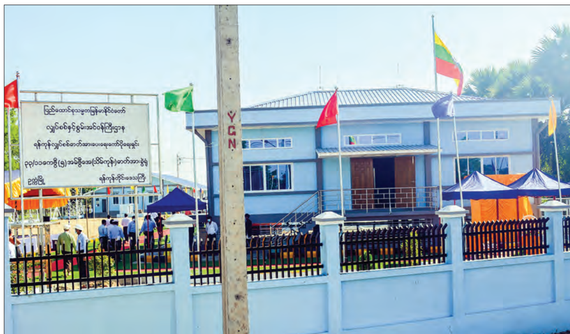
Picture shows 33/11kV, 5MVA Theingon Power Sub-station in Okkan Town, Yangon Region in November 2020.

Out of the six stations, the two power sub-stations of Yekyaw and Warnet Chaung in Hmawbi Township, and another two of Kyutaw and Theththikyun in Htantabin Township have been commissioned into service, and the last two of Gyobyu and Theingon were