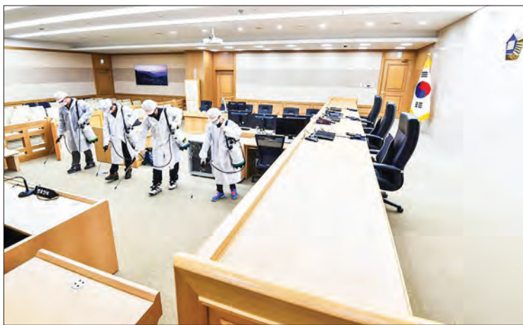
Workers wearing protective gear spray disinfectant as part of preventive measures against the spread of the COVID-19 coronavirus, in a courtroom at Suwon High Court in Suwon, South Korea