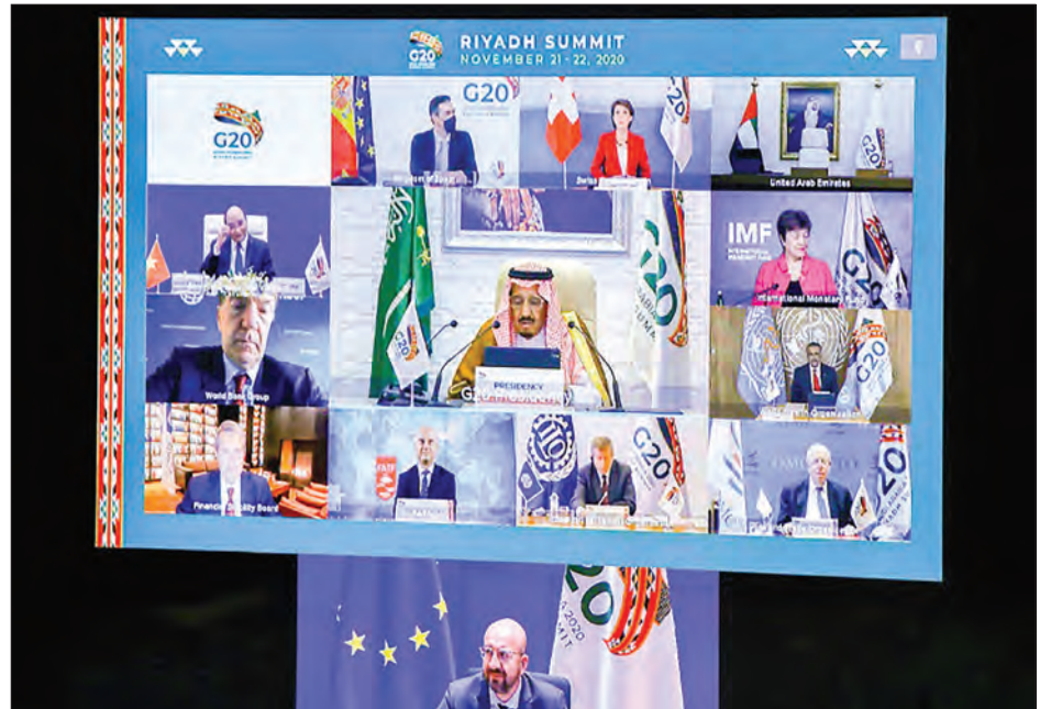
Saudi Arabia hosts a G20 summit in a first for an Arab nation, with the virtual forum dominated by efforts to tackle the coronavirus pandemic and the worst global recession in decades.