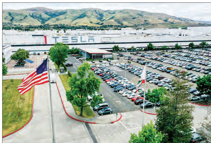
Workers at Tesla's factory in Alameda County in California have been exempted from a new curfew because they are deemed essential.