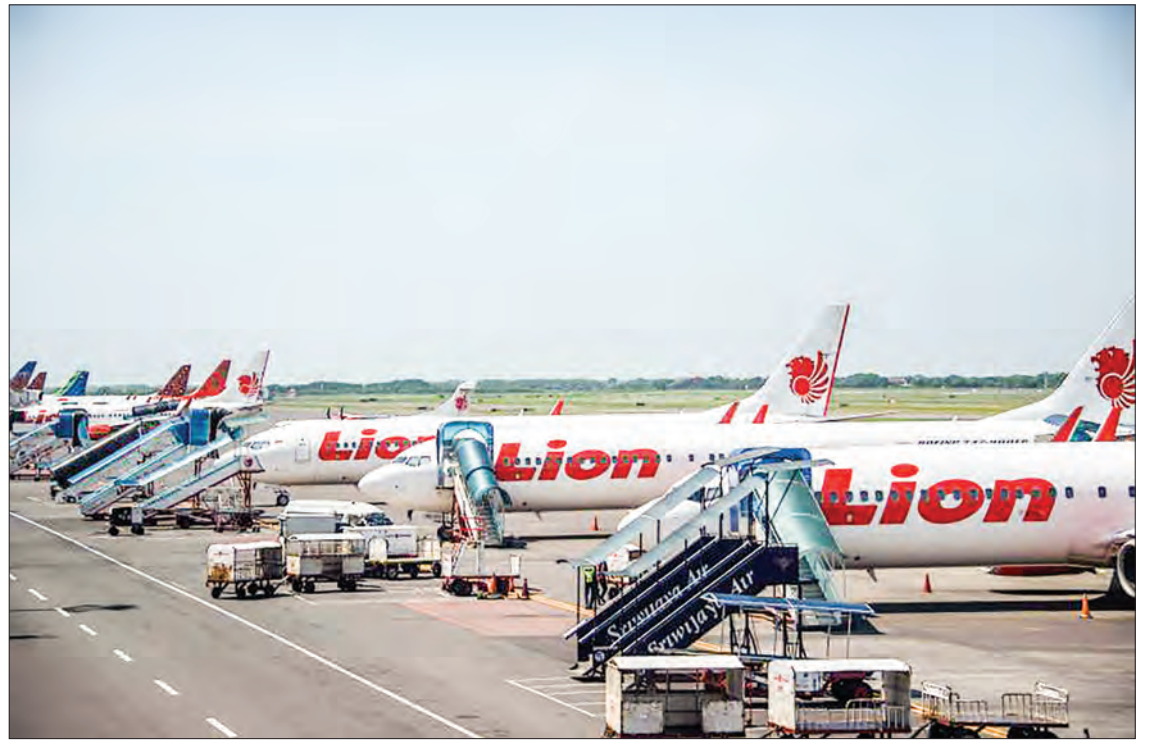
Lion Air aircraft are parked on the tarmac at Juanda International airport in Surabaya, East Java on April 24, 2020.