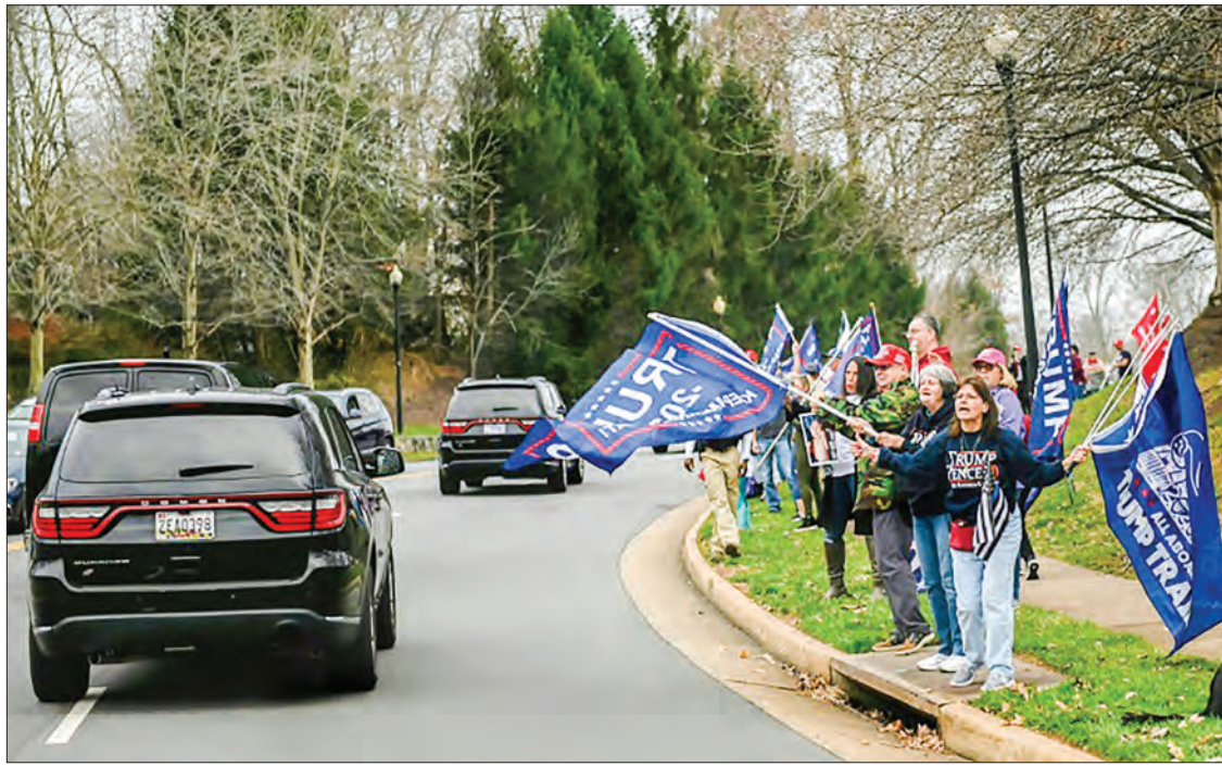
Supporters of US President Donald Trump cheer as he passes in the motorcade after golfing in Sterling, Virginia on November 21, 2020.