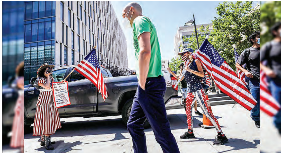
Protesters rally against county's shelter-at-home order at Los Angeles City Hall, California, U.S.

Latin America and the Caribbean overall has 433,865 deaths