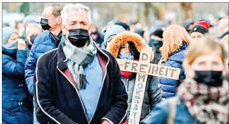
Protests against anti-virus measures continued Sunday in Berlin.

GERMAN Foreign Minister Heiko Maas on Sunday lashed out at anti-mask protesters comparing themselves to Nazi victims, accusing them of trivialising the Holocaust and "making a mockery" of the courage shown by resistance fighters.