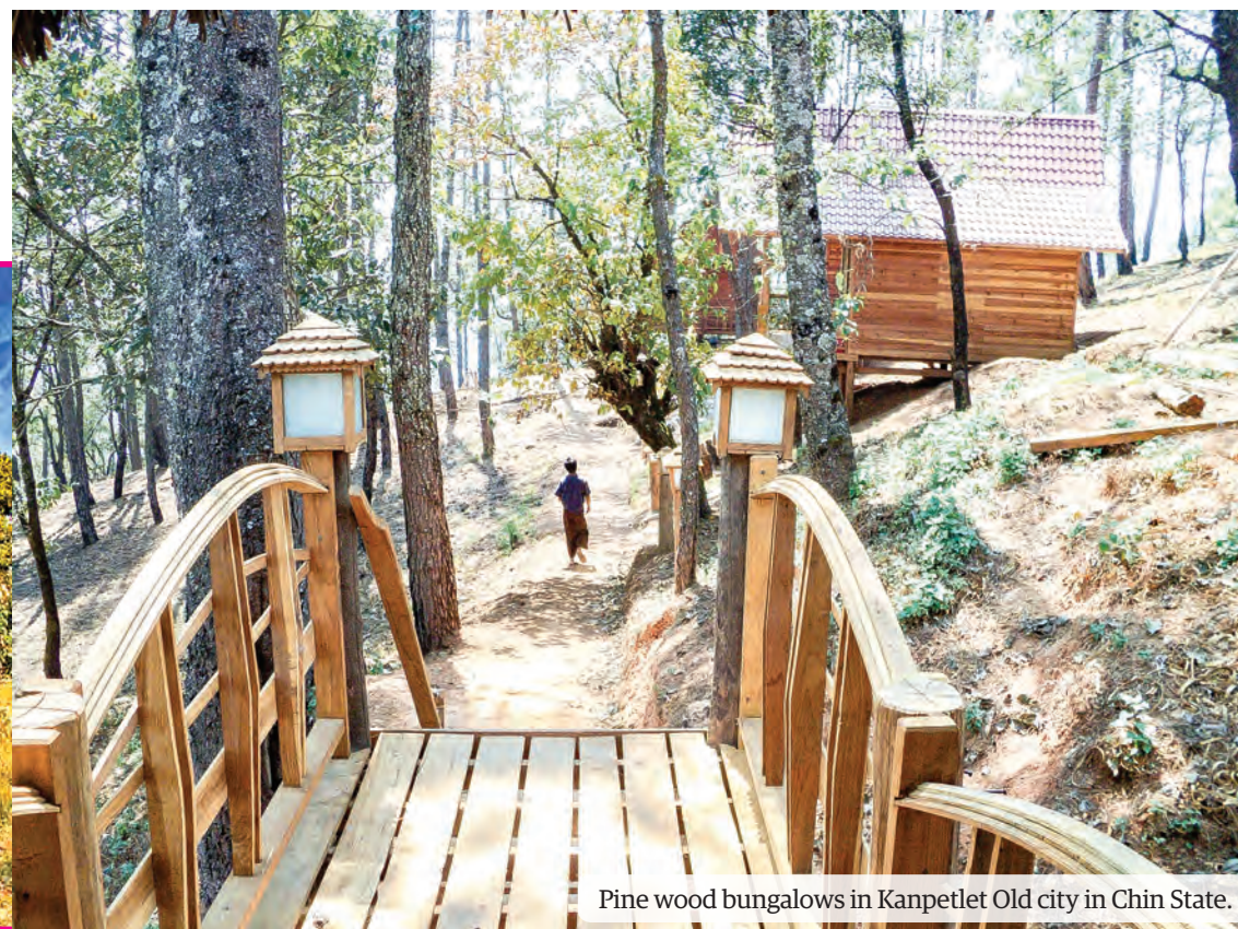
Pine wood bungalows in Kanpetlet Old city in Chin State.

spectabilis, cherry and Artocarpus chaplasha plants from ever green forest and herbal orchid species and other herbal plants are thriving in the national park. A total of 552 species of butterflies have been recorded. In fact, Natma Hill (Mount Victoria) is a watershed of Myittha and Lemyo rivers, Mone, Maw and Yaw creeks.