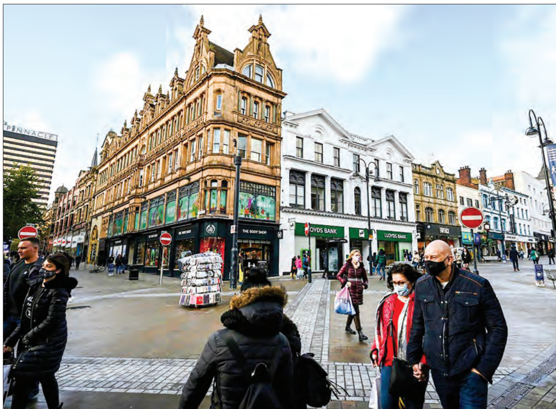
Shoppers walk at a near-deserted city centre in Leeds, Yorkshire on October 31, 2020, as the number of cases of the novel coronavirus COVID-19 rises.