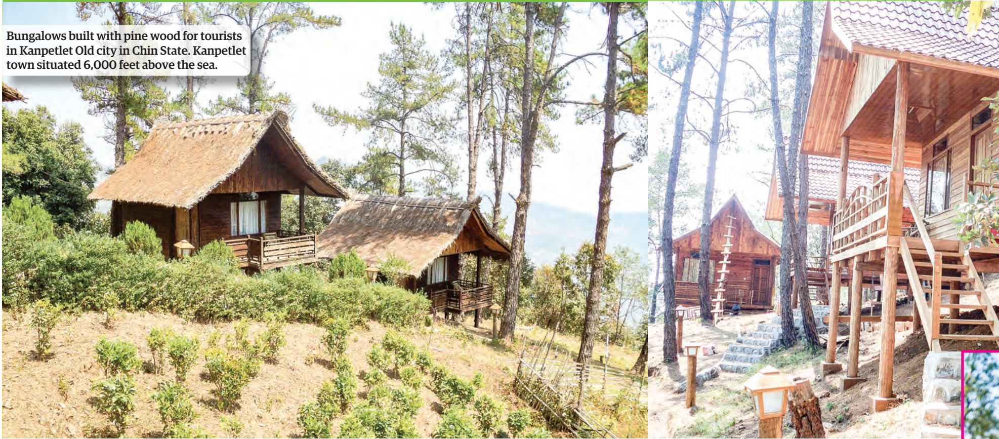
Bungalows built with pine wood for tourists in Kanpetlet Old city in Chin State. Kanpetlet town situated 6,000 feet above the sea.