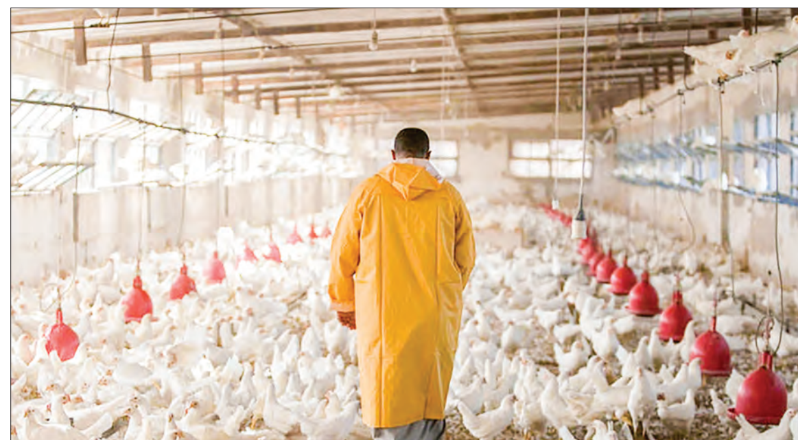
Good hygiene on farms can help stem the rise of antimicrobial resistance that comes from the over-reliance of antibiotics.

Aligning with World Antimicrobial Awareness Week, which kicked off on Wednesday, the WHO chief launched a new report —along with the Food and Agriculture Organization (FAO) and the World Organization for Animal Health — that exam-