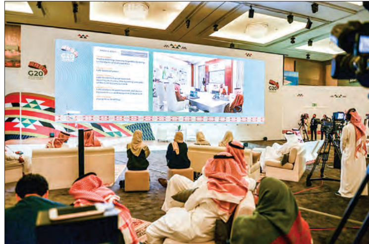
Saudi Arabia opened the G20 summit on November 21 in a first for an Arab nation.

Turkish President Recep Tayyip Erdogan also addressed the summit, where sources said climate change was among the issues topping the agenda.