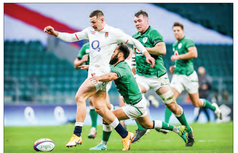
At the double - England wing Jonny May (L) kicks ahead to score his second try against Ireland at Twickenham on Saturday.

Both teams kicked off on the back of decisive home pool wins, England thrashing Georgia 40-0 in a dour, forward-dominated display last week when Ireland overwhelmed Wales 32-9.—AFP ■