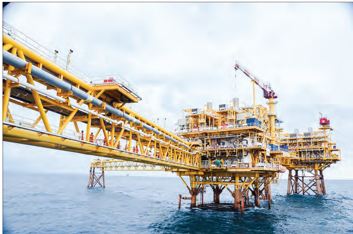
Natural gas export of Myanmar has fetched US$3.5 billion in the past financial year.

MYANMAR'S exports of natural gas in the past financial year 2019-2020 amounted to US$3.5 billion, the Commerce Ministry's data showed.