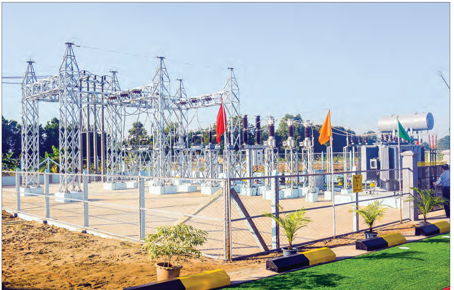
Power lines of 33/11kV, 5MVA Gyobyu power sub-station are pictured in Taikkyi Township, Yangon Region on 22 November 2020.