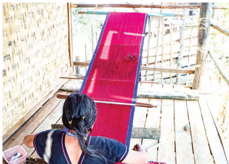
A Chin ethnic woman weaving cloth.