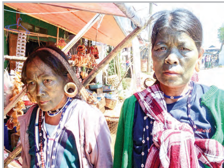
Chin ethnic women.

Four model villages in Kanpetlet Township were designated as bio horticultural villages and provided seeds of coffee, tea, elephant foot yam and avocado