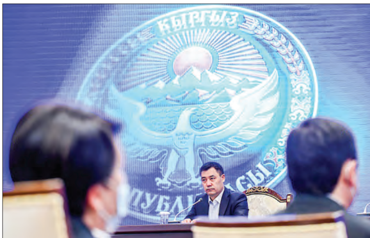
Japarov has spoken in favour of the constitution and is widely believed to be its driving force.

HUNDREDS took to the streets in Kyrgyzstan Sunday to protest a proposed constitution that critics say would empower the presidency and damage freedom of speech.