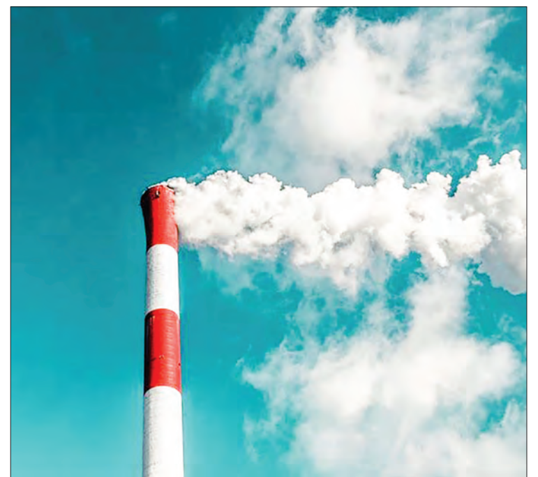
France will make serious intentional damage to the environment punishable by up to 10 years in prison as part of planned "eco-cide" law, government ministers said in remarks published Sunday.

The French constitution did not allow the qualification of such actions as "crimes", just