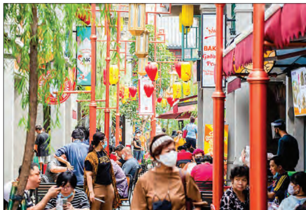
People visit a new China Town in Pantjoran PIK, Jakarta, Indonesia, Nov. 18, 2020. The new China Town in north Jakarta opened this month.

THE Regional Comprehensive Economic Partnership (RCEP) is expected to play a large role in promoting economic and trade relations between Indonesia and China, Indonesian experts said.