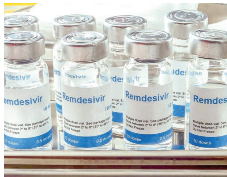
Remdesivir has received global attention in treating severe coronavirus cases and is increasingly being used for hospitalized patients. But its role in clinical practice has remained uncertain.