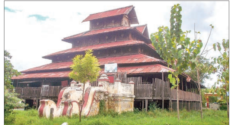
Picture shows the outside view of Maha Min Htin Monastery in Mandalay.

After completion of the construction, the monastery was offered to venerable monk U Tissa. As the saying goes, Min Htin for its monastic structures, Moe Tar for its Buddhist ordination hall