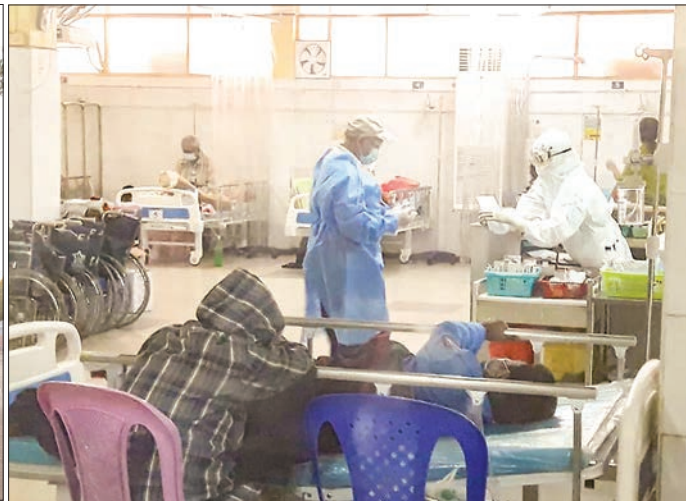
Doctors wearing PPE are providing medical services for COVID-19 patients at Yangon General Hospital.