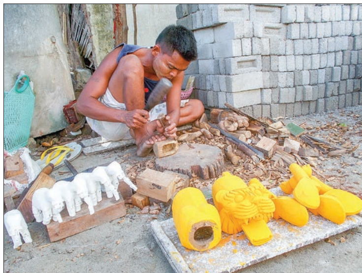
A man is making puppets with wood at a stall in Amarapura Township, Mandalay Region.

LOW income in wooden puppet production has failed to attract new generations in this business, and most puppet crafting markets have been shut down in Amarapura Township of Mandalay Region amid the current COVID-19 crisis.