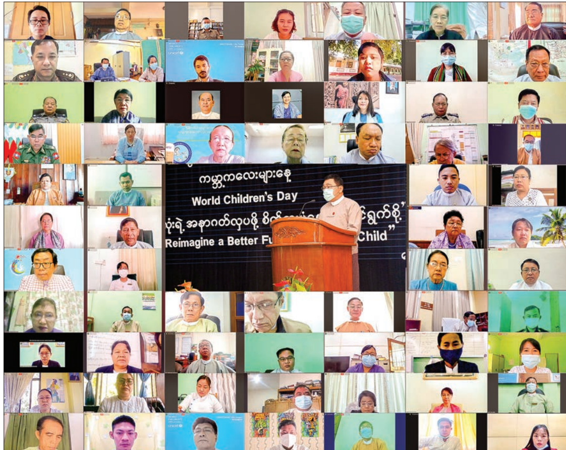
Union Minister Dr Win Myat Aye speaks during the virtual ceremony to commemorate World Children's Day on 20 November 2020.

At the ceremony, Union Minister Dr Win Myat Aye, in his capacity as the chairman of National Committee on Rights of Child discussed the Declaration of the Rights of the Child by the 44th UN General Assembly on 20 November 1989, and this year has been 31st-anniversary of annual celebration, acceding of Myanmar to the UN Convention on the Rights of the Child on 15 August 1991, the celebration of Myanmar Children's Day on 13 February (Bogyoke Aung San's Birthday) in addition to World