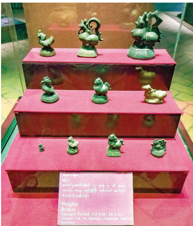
Bronze weights in Toungoo era.

Myanmar encyclopaedia Volume VII stated the museum is the buildings to store various kinds of objects contributing to observers in all aspects. Likewise, Myanmar dictionary defined the museum as the building