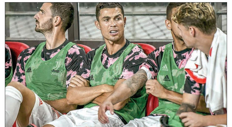
Cristiano Ronaldo (C) stayed on the bench during the exhibition match in Seoul last year.

SEOUL—A South Korean promoter was ordered to compensate fans on Friday after Juventus superstar Cristiano Ronaldo failed to play an exhibition match as promised.