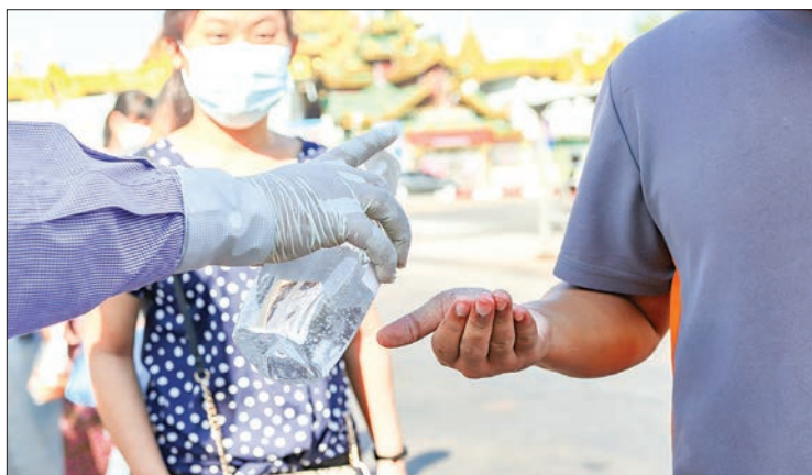
A volunteer provides hand sanitizer to passengers before entering a bus in downtown Yangon on 20 November 2020.

transportation for many Yangon citizens. During the normal time before COVID19 pandemic occurred, around 1.6 million people used YBS every day to go to