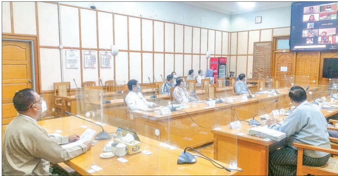
Department of Highway and KOICA Myanmar launch Central Backbone Expressway in Myanmar Project on 20 November 2020.

The project conforms to the plans and procedures of MSDP and listed in the project Bank. As the Myanmar Investment Law, new rules and regulations are being adopted in the country, and there would be need for infrastructure and private investment for some limitation of the