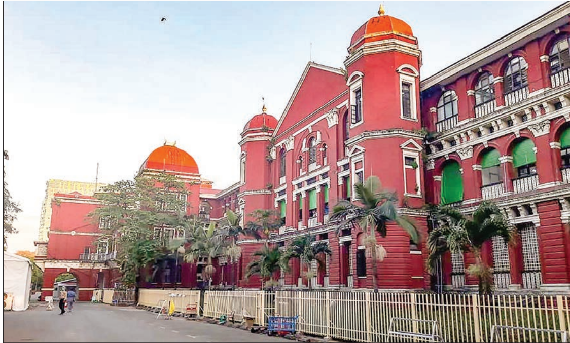
Picture shows the outer view of a building inside the compound of Yangon General Hospital.

Answer: It's very important for the patients to receive sufficient treatment and hospitals have prepared for adequate treatment. Patients are only aware of the critical situation due to the delay at home. They came late to the hospital, and later they were dead. In this situation, the hospitals are fully prepared. Since the whole world is facing COVID-19 disease, including Myanmar,