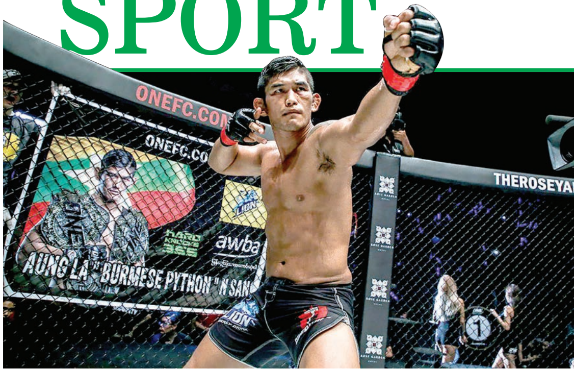
The fighting and challenging styles of Aung La N Sang are featured in the mobile action game named "The Burmese Python Strikes" on the ONE Application.