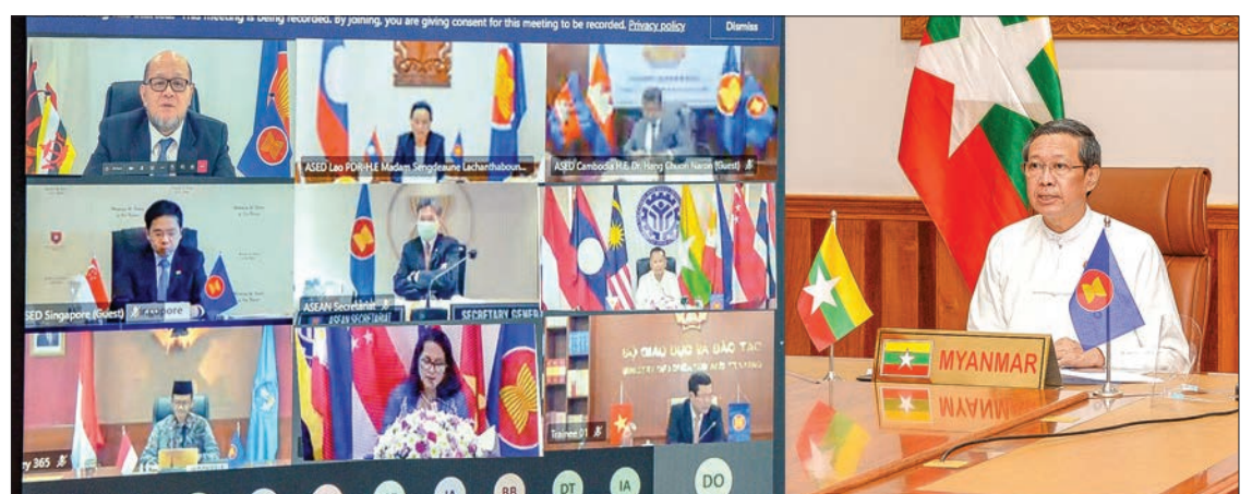
Union Minister Dr Myo Thein Gyi joins the 11th ASEAN Education Ministers (ASEED) Meeting via videoconference on 20 November 2020.

The Union Minister presented the works for drafting National Education Strategic Plan (2021-2030) based on the 2020 Election Manifesto of the National League for Democracy, the Myanmar Sustainable Development Plan (2018-2030), the Sustainable Development Goals (2030), the National Education Law (2014), the Science, Technology and Innovation Law (2018), the Comprehensive Education Sector Review