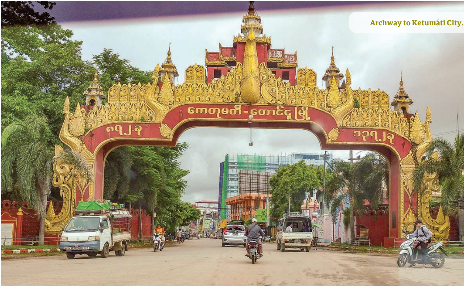
Archway to Ketumati City.