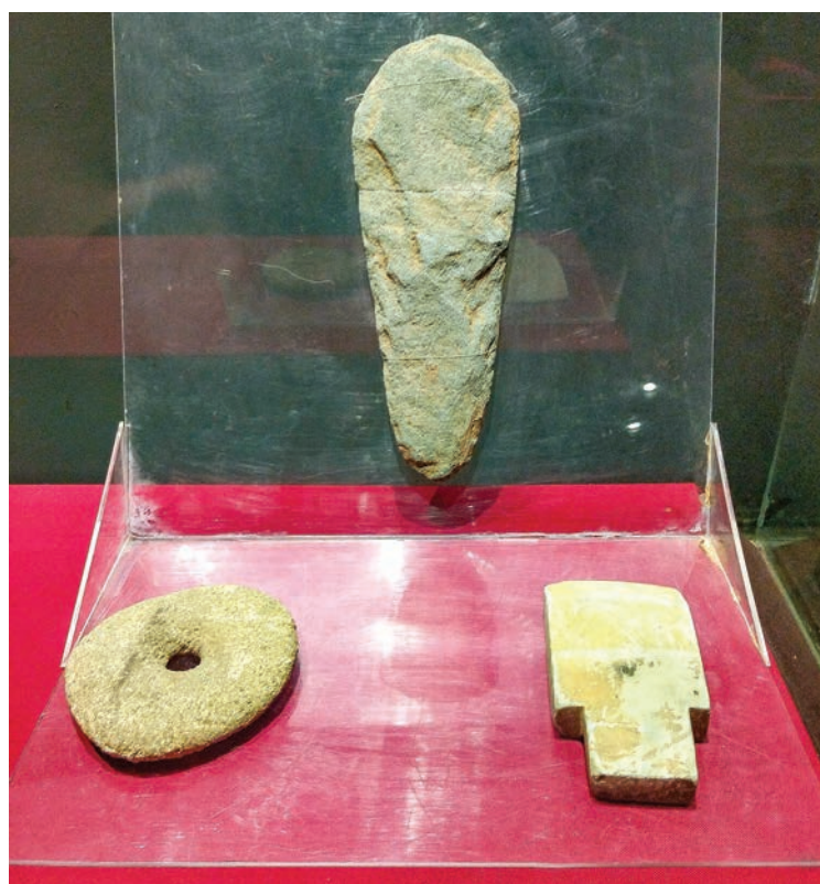
Stone weapons displayed at the museum.