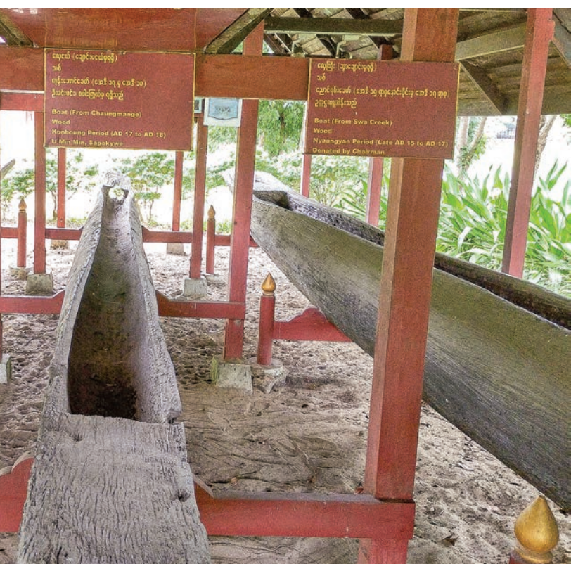
Boats carved in logs found from Swa Creek and Chaungmange Creek.