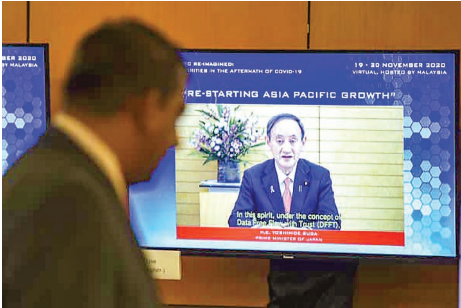
In this photo released by Malaysia's Department of Information, a screen shows Japan's Prime Minister Yoshihide Suga delivering a speech via a virtual meeting during the APEC CEO Dialogues 2020, ahead of the Asia-Pacific Economic Cooperation (APEC) leaders' summit in Kuala Lumpur, Malaysia, on Nov. 20, 2020.

JAPANESE Prime Minister Yoshihide Suga said Friday that the promotion of digital transformation and realization of a green society are the key priorities of his administration amid the continuing COVID-19 pandemic.