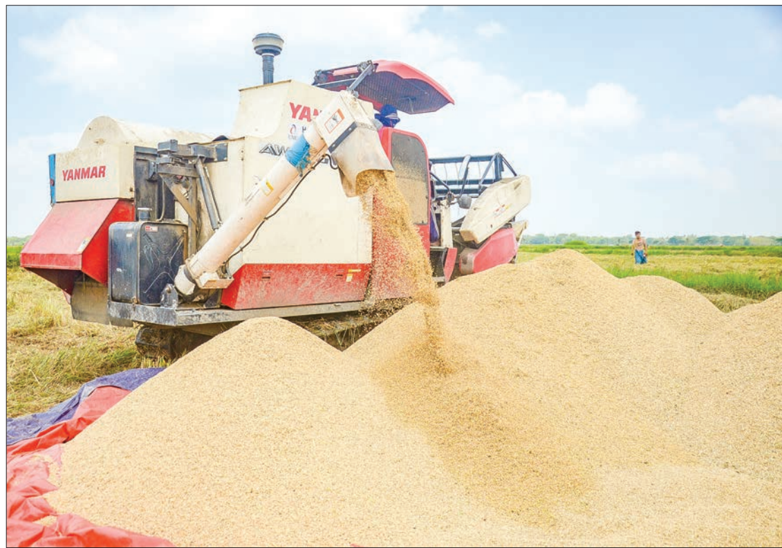
(FILES) A combine harvester is working at a paddy field in Kangyidaunt Township, Ayeyawady Region.