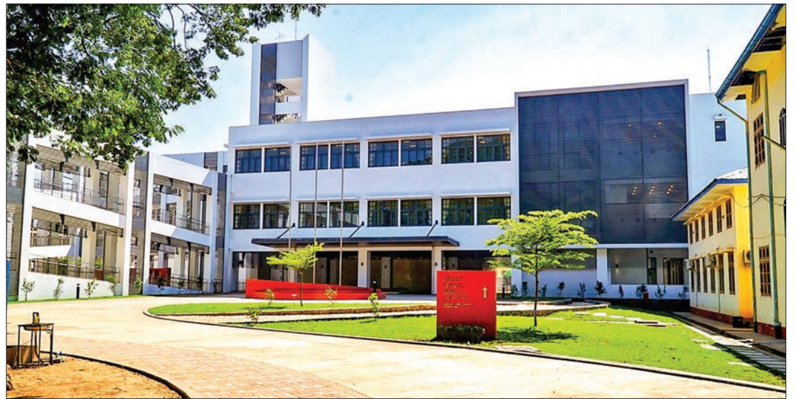
Picture shows the newly-constructed Obstetrics, Gynaecology and Neonatal Ward at the Magway General Hospital in Magway.