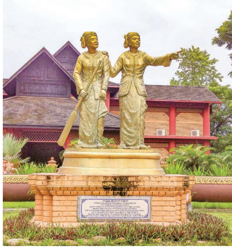
Royal Ketumati Cultural Museum.

Three bronze tattooing devices, broken glaze pieces, glaze coated earthen plate, bronze spoons and an earthen plate