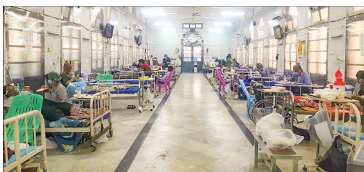
Yangon General Hospital is treating COVID-19 patients.

The Union Minister for Health and Sports has repeatedly warned the public not to