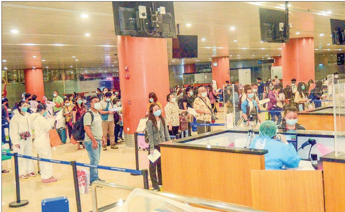
Myanmar returnees from Singapore and ROK queue for immigration service at the Yangon International Airport on 20 November 2020.

A total of 283 Myanmar citizens – 152 from Singapore and 131 from the Republic of Korea – stranded in foreign countries because of the suspension of commercial flights returned home by relief flights yesterday.