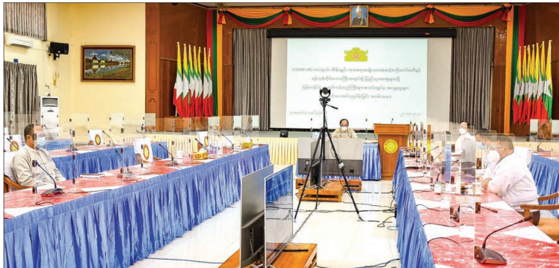
Union Minister Dr Myint Htwe participates in the virtual event to accept cash assistance from the Myanmar Chinese Chamber of Commerce via videoconference on 20 November.