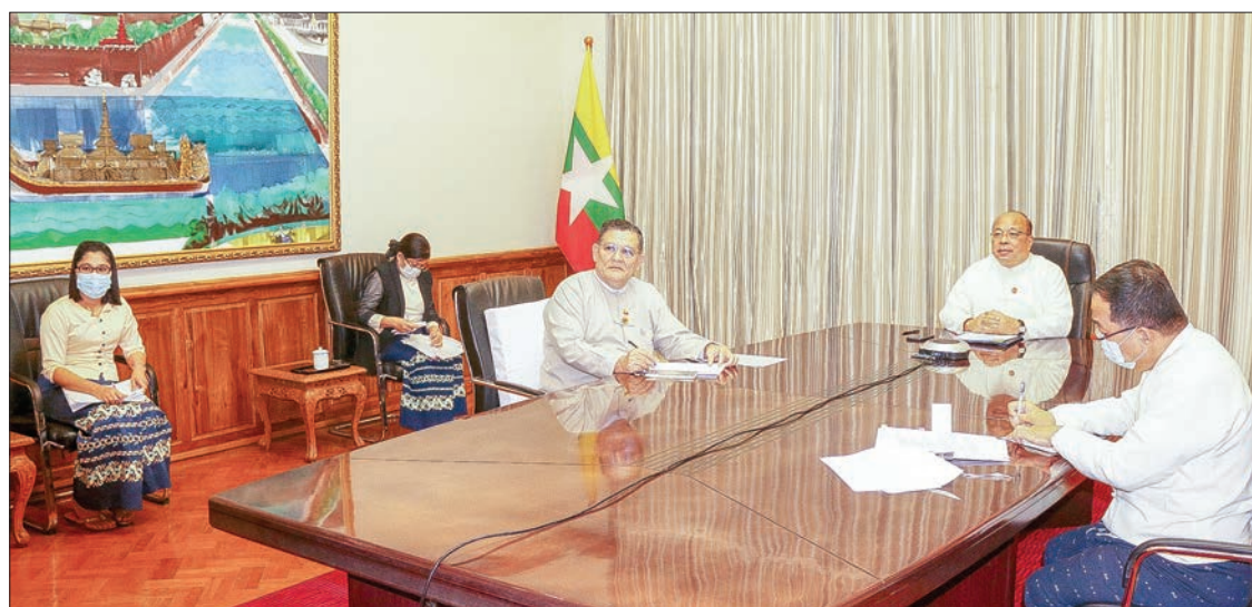
Union Minister U Thaung Tun holds talks with Ambassador of Finland Ms Riikka Laatu via videoconference on 20 November 2020.

The Ambassador informed the Union Minister of Finland's plan to extend the development cooperation programme to Myanmar beyond the current end date. She apprised him of the draft Country Programme for Myanmar for the period 2021 to 2024 and affirmed that Finland is committed to expand its development cooperation