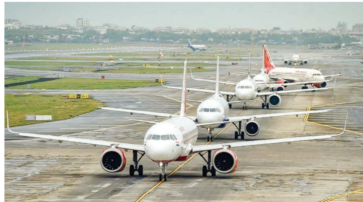
Parked planes at Mumbai airport, where traffic has fallen dramatically due to the Covid-19 pandemic.

Travel restrictions imposed during the first wave of the crisis