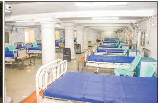
CCTVs are installed to monitor patients from the video surveillance rooms at the Yangon General Hospital.

we are taking a step-by-step approach to these experiences. In doing so, we keep a close eye on the situation in countries around the world that were hit hard by the first wave of COVID-19. For this, we have prepared things in our country.