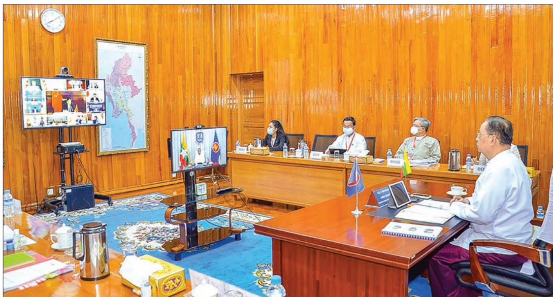
Union Minister U Win Khaing participates in the 38th ASEAN Ministers on Energy Meeting and Associated Meetings via videoconference on 20 November 2020.

The meeting discussed technical assistance and capacity development programme relating to energy security and energy efficiency and conservation and cooperation on the energy sector for post-COVID economic recovery.