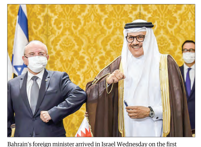
official visit from the Gulf kingdom, which normalized relations with the Jewish state in September.

BAHRAIN'S foreign minister 15, pacts that were condemned arrived in Israel Wednesday on as a "betrayal" by the Palestinithe first official visit from the Gulf kingdom, which normalized relations with the Jewish state in September.