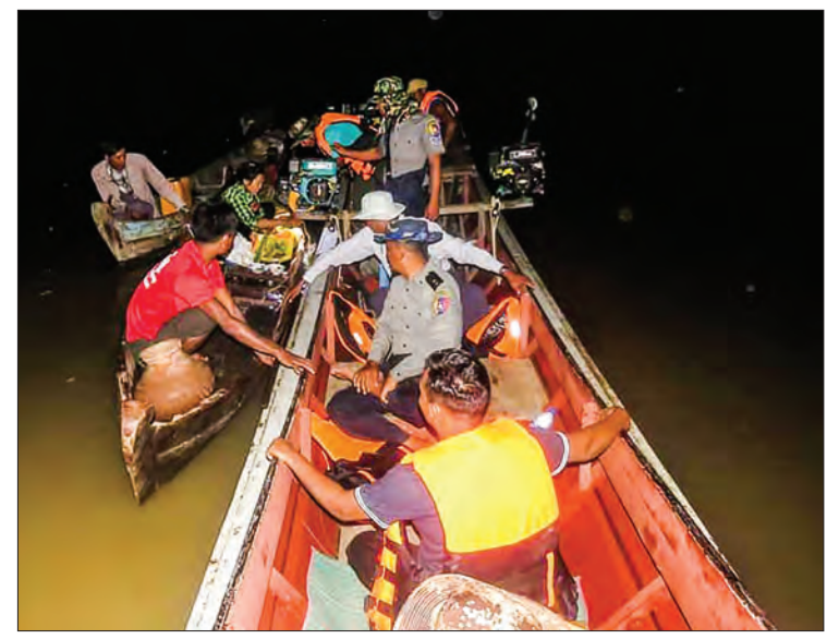
Patrolling team is checking fishers as part of efforts to prevent Ayeyawady dolphins from extinction.

The patrolling was conducted near Nyaung Bin Thar village in Singu Township, Mandalay Region on 3 November, near Pauk Gone village on 10 November and near Sei Thae Taung village on 12 November. The team confiscated the illegal electrofishing equipment and the accessories as well as