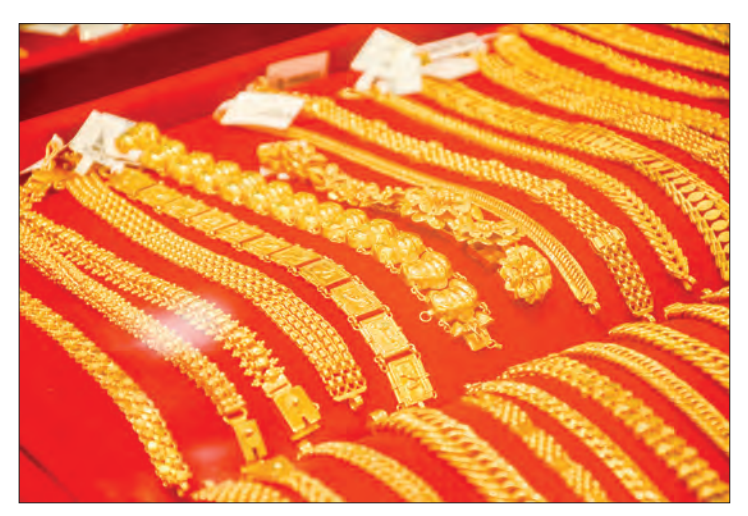
Yangon Region gold market, which was temporarily suspended amid the COVID-19 resurgence, was back into business on 26 October.

Nevertheless, local market relying on international gold pric-