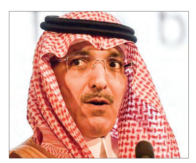
Saudi Finance Minister Mohammed al-Jadaan.

SAUDI Arabia hosts the G20 summit Saturday in a first for an Arab nation, but the scaled-down virtual format could limit debate on a resurgent coronavirus pandemic and crippling economic crisis.