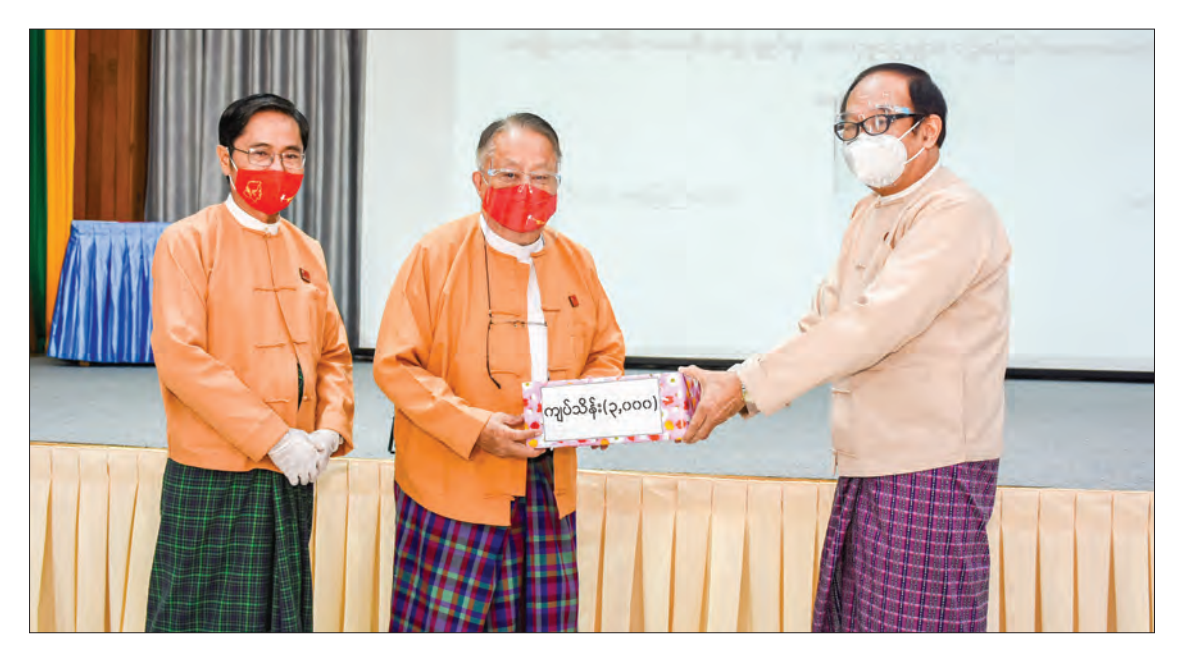
Union Minister Dr Myint Htwe receives K300 million donation of National League for Democracy on 18 November.

towards none and therefore, courteous relations with immediate neighbours remain important. She also reaffirmed inter alia the Bangladeshi Government readiness to engage in deeper cooperation with Myanmar for better understandings and prosperity of both peoples and to work together with all neighbours, including Myanmar to achieve peace, stability, and progress in the region.