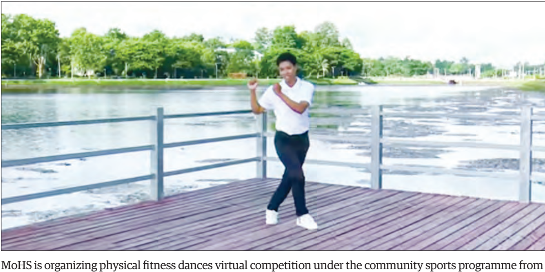
11 November 2020 to 19 February 2021.

The winners will receive K2 million for the first price,