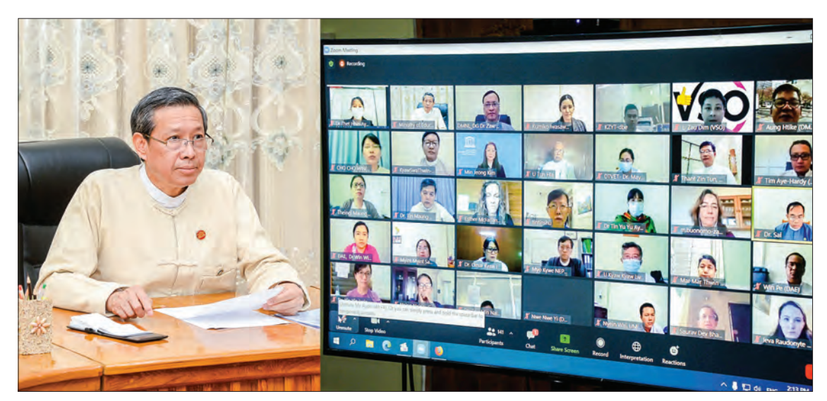
Union Minister Dr Myo Thein Gyi takes part in Education Sector Analysis meeting on 18 November.