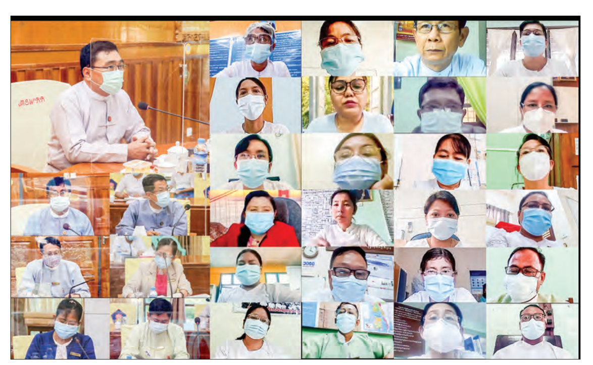
Union Minister Dr Win Myat Aye discusses preventive measures against COVID-19 at training schools and departments of social welfare on 18 November.

UNION Minister for Social Welfare, Relief and Resettlement Dr Win Myat Aye attended the coor-