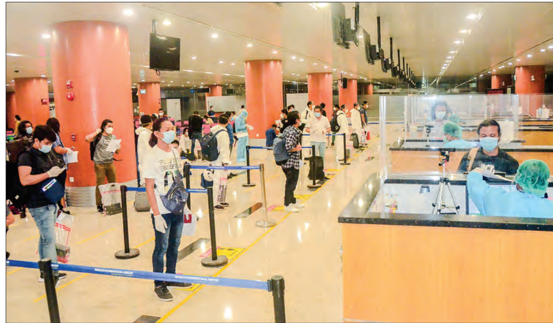
Myanmar nationals arrive at Yangon International Airport on 18 November.

The Ministry of Foreign Affairs is coordinating with the relevant ministries, Myanmar embassies from respective countries, shipping companies and seamen organizations to bring back the Myanmar citizens and seamen in accordance with the instructions from National-Level Central Committee on Coronavirus Disease 2019 (COVID-19). —MNA