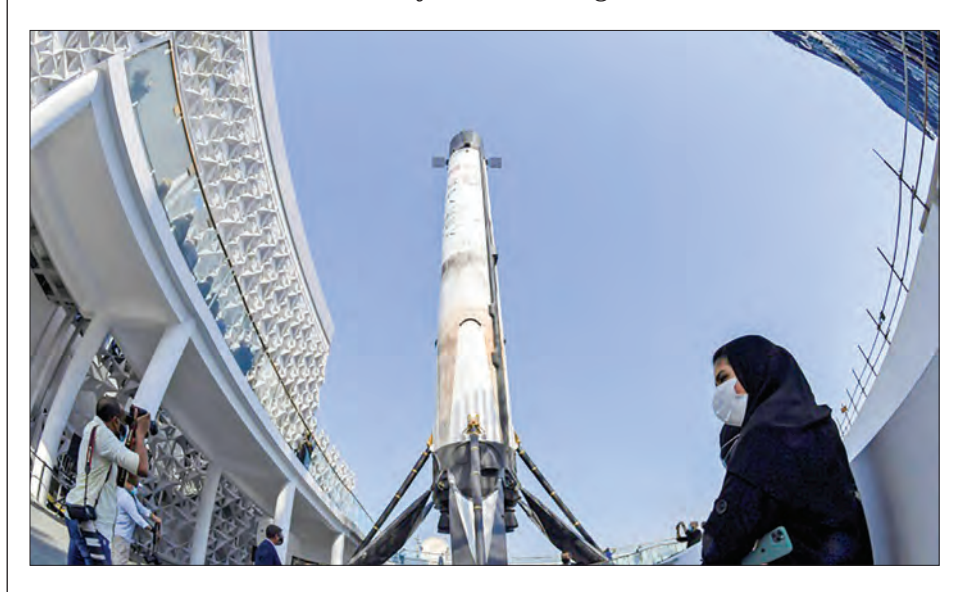
The US government turned to the fair's host, the United Arab Emirates, for funding for the pavilion after failing to find financing at home.