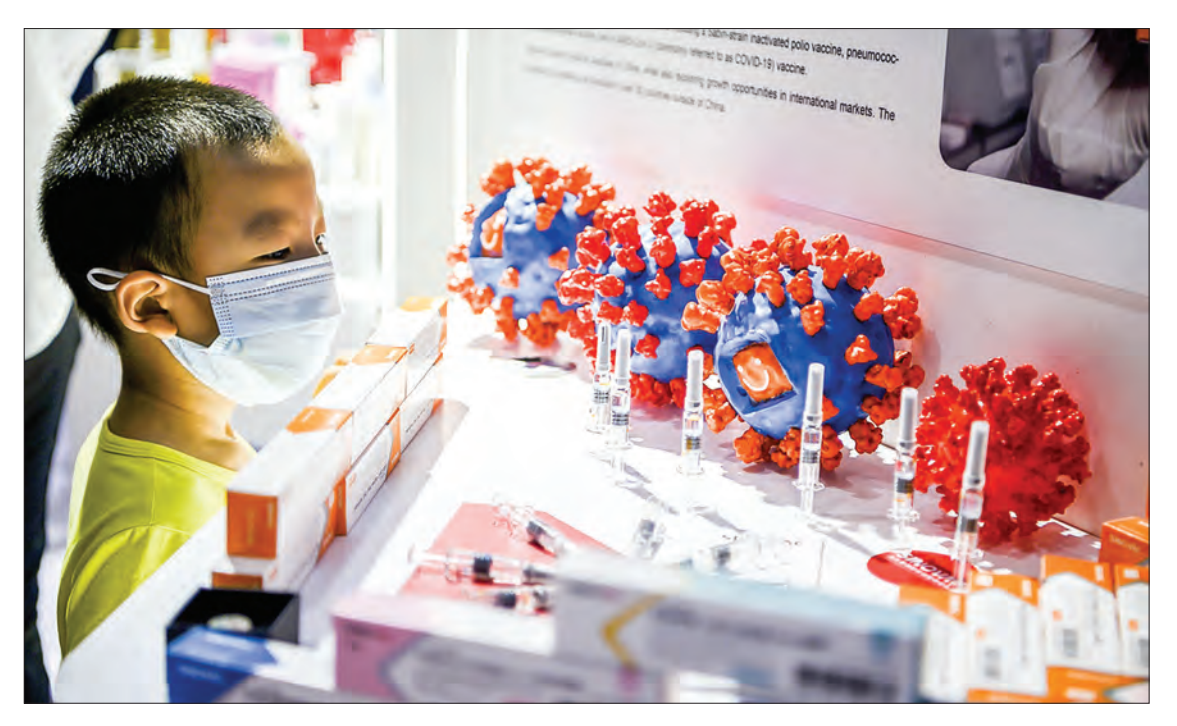
A boy looks at Sinovac Biotech LTD's vaccine candidate for COVID-19 on display at the China International Fair for Trade in Services (CIFTIS) in Beijing on September 6, 2020.