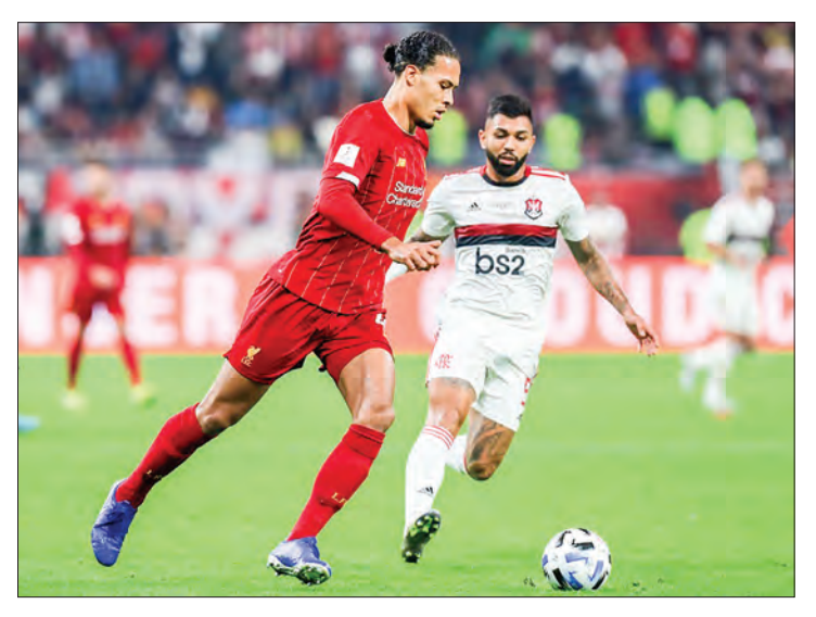
Liverpool's Dutch defender Virgil van Dijk (left) is closed down by Flamengo's forward Gabriel Barbosa during the 2019 FIFA Club World Cup Final football match between England's Liverpool and Brazil's Flamengo at the Khalifa International Stadium in the Qatari capital Doha.

sporting calendar into chaos with organizers forced to postpone flagship events like the Olympics and Euro 2020, while other events have been cancelled outright.