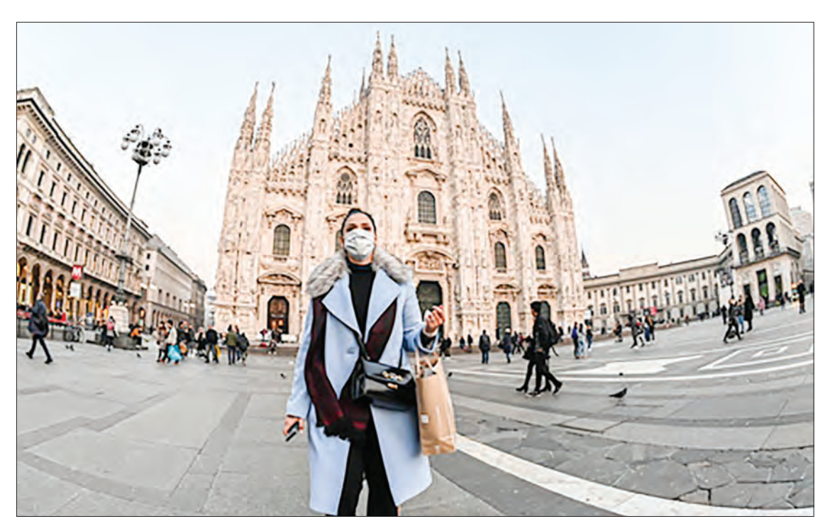
Reports indicated that the coronavirus could have been circulating in Italy since September 2019, five months before the first case emerged in Italy, according to a study released recently by the National Cancer Institute (INT) in Milan, Italy. A woman with a protective face mask walks across the Piazza del Duomo in central Milan.