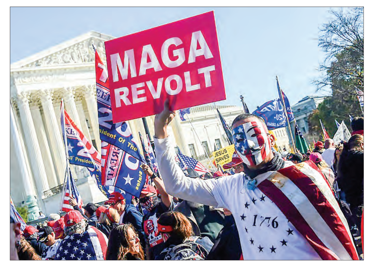
Trump supporters were disillusioned with Fox News, which they believe was wrong to make the outgoing president's defeat official and failed to support him enough.

Herring told AFP that former Fox viewers have written to OAN to express their frustration over the network's apparent leftward turn. Trump himself has encouraged followers to switch to OAN and Newsmax, saying he considered "the biggest difference" between the 2016 election and 2020 was Fox's stance.