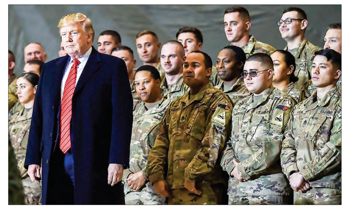
US President Donald Trump addresses troops at Bagram airbase outside Kabul, Afghanistan, on November 28, 2019.

The announcement came iust weeks before Trump cedes the White House in the wake of