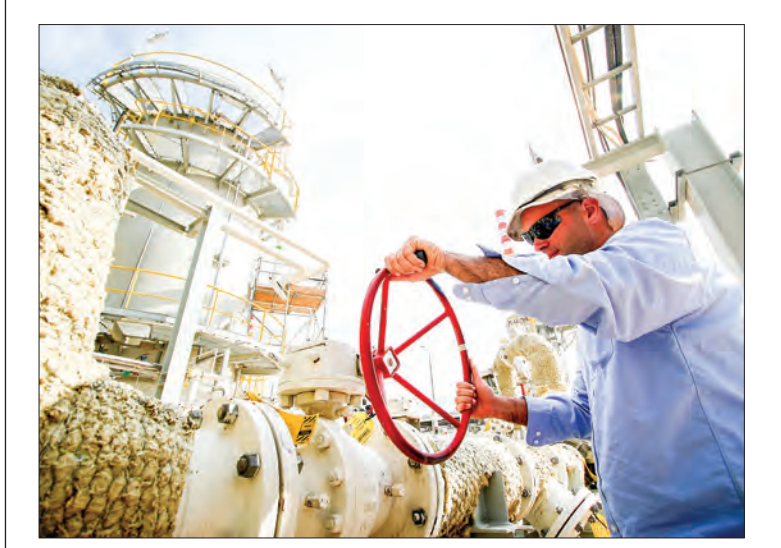
The payments are suspected of being used to secure contracts to build onshore and offshore oil pipelines.