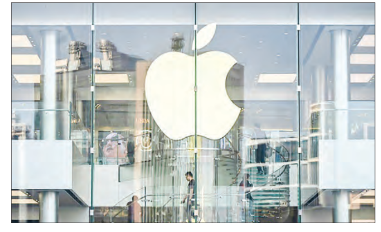
Apple said the 'vast majority' of developers will benefit from its App Store Small Business Programme.

APPLE is to slash the commission it takes from small businesses selling programmes on its App Store, the company said