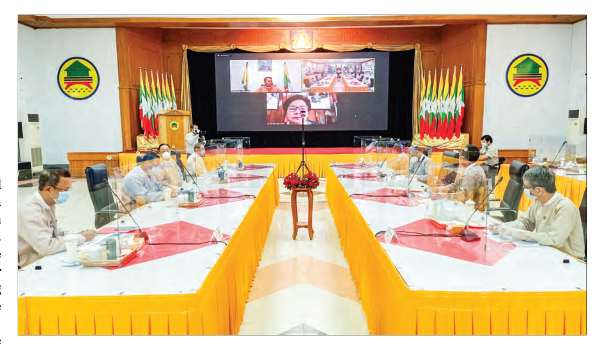
Announcement on preferred bidder for elevated expressway project in Yangon discussed via Zoom meeting on 18 November.

project will be implemented by the Ministry of Construction and the Yangon Region Government under the public-private partnership system.