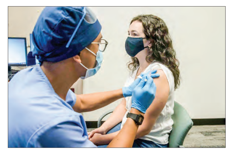
A volunteer receives a Moderna injection in a clinical trial involving more than 30,000 participants.

Global hopes of vanquishing the coronavirus pandemic were high after US biotech firm Moderna said its vaccine candidate was nearly 95 per cent effective in a trial, a week after similar results announced by pharma giant Pfizer and its German partner BioNTech.