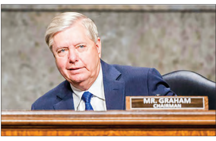
Senator Lindsey Graham takes his seat during a Senate Judiciary Committee hearing titled, "Breaking the News: Censorship, Suppression, and the 2020 Election," on Facebook and Twitter's content moderation practices.

"It seems like you're the ultimate editor," the Republican senator said at the opening as he took aim at decisions by both platforms to limit the distribution of a New York Post