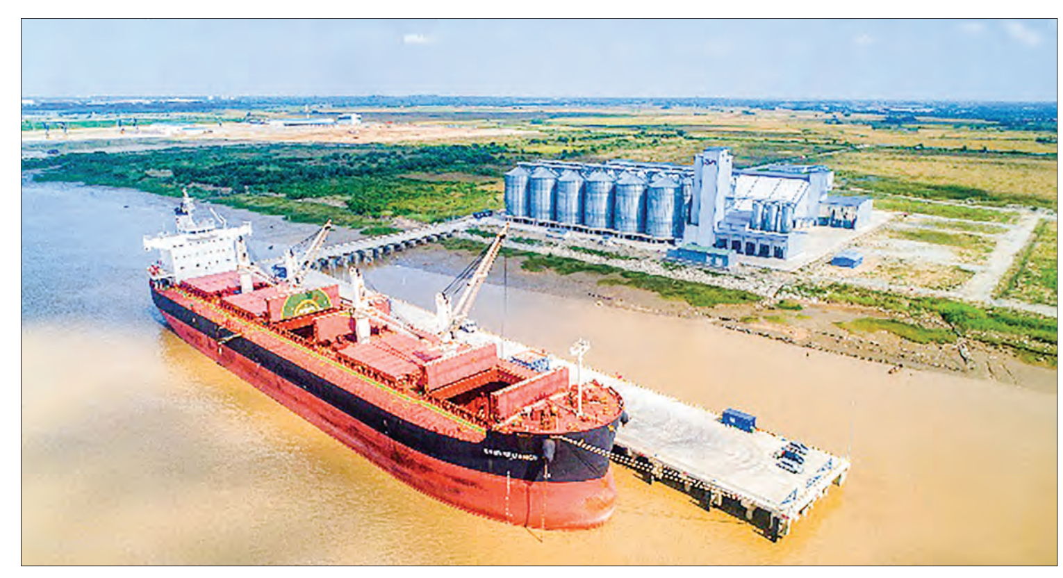
International Bulk Terminal Thilawa (IBTT).

A total of nine new jetties, which can dock the international ships, were built in four years in Yangon, includin Thilawa area. There are now a total of 42 jetties in Yangon Port, according to the official statistics of Myanma Port Authority (MPA).