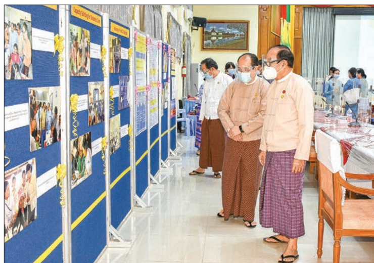
Union Minister Dr Myint Htwe views the mini-exhibition on diabetes prevention on 12 November 2020.

A WHO STEPS Survey conducted in Myanmar in 2014 states 10.5% of individuals between the ages of 15 to 64 have diabetes, and 19.7% of them die due to diabetes-related incidents. Diabetes and other non-communicable diseases are increasingly caused by our lax attitude to maintaining health and changes in diet and lifestyle, and as a result, a WHO conference in 2006 decided to