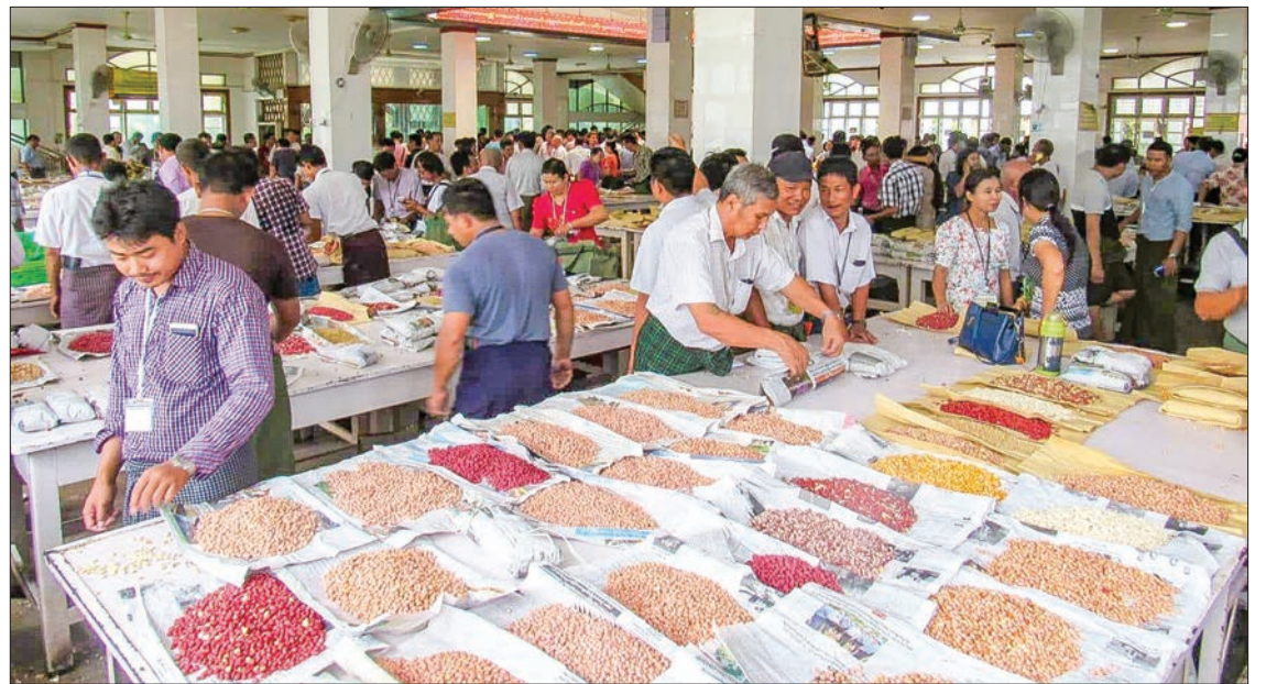
Merchants evaluate the quality of beans and pulses.

Although the bean body asked to extend the August-end deadline, India still has not responded to the request. Myanmar exported only 100,000 tonnes of