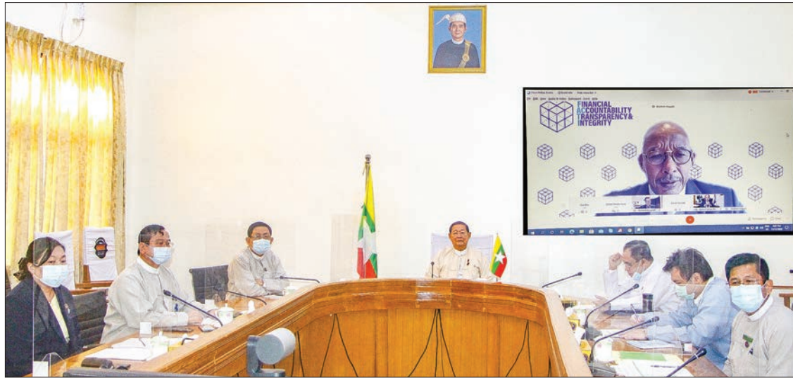
Union Minister U Soe Win participates in the Online Panel on Financial Accountability, Transparency and Integrity Panel for Archiving the 2030 Agenda on 12 November.

UNION Minister for Planning, Finance and Industry U Soe Win participated in an online panel discussion of the High-level Regional Consultation on International Financial Accountability, Transparency and Integrity for Archiving the 2030 Agenda (FACTI Panel).