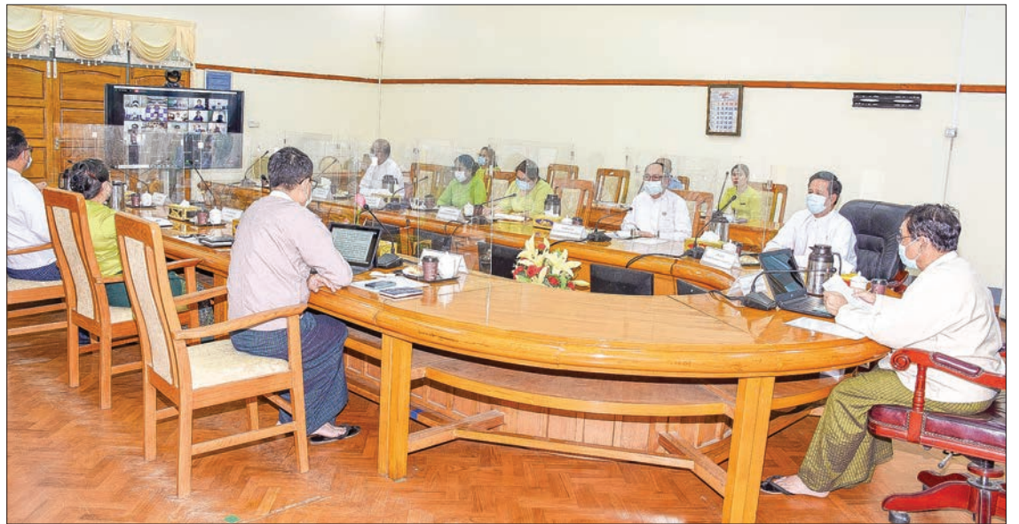
Union Minister Dr Than Myint joins the soft launch ceremony of upgraded Myanmar Tradenet 2.0 system on 12 November 2020.

mation Matrix Co., Ltd helped the Ministry to implement the Myanmar Tradenet 2.0 system.