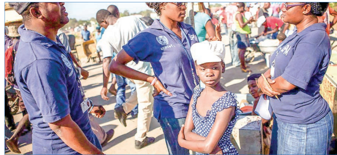
A girl waits with officers from the Haitian Police's Brigade for the Protection of Minors (BPM) in the city of Ouanaminthe, on the north-eastern border with the Dominican Republic. BPM is a UNICEF partner in combatting child trafficking.

It urged the online platforms to use their "big data,