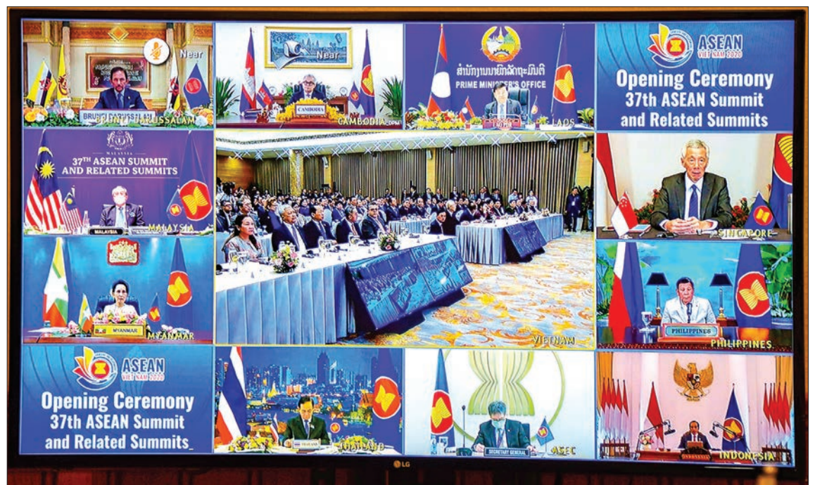
State Counsellor Daw Aung San Suu Kyi participates in the Opening Ceremony of 37 th ASEAN Summit and Related Summits via videoconference on 12 November 2020.

Daw Aung San Suu Kyi, State Counsellor of the Republic of the Union of Myanmar participated in the Opening Ceremony of the 37th ASEAN Summit and the Plenary Session of the 37th ASEAN Summit which were held via videoconferences yesterday at 8 am from the Ministry of Foreign Affairs, Nay Pyi Taw.