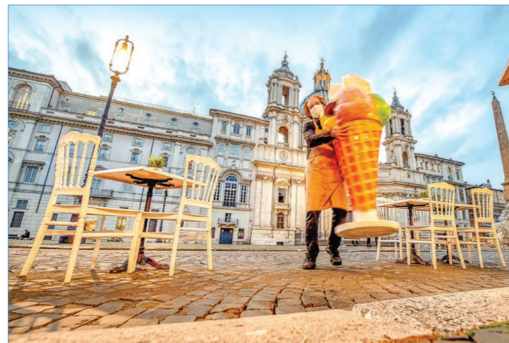
A restaurant prepares to close in Rome, Italy, on Oct 26 as the country battles a second wave of COVID-19.

A vaccine is seen as the best chance to break the cycle of deadly virus surges and severe restrictions across much of the world since COVID-19 first emerged in late 2019.