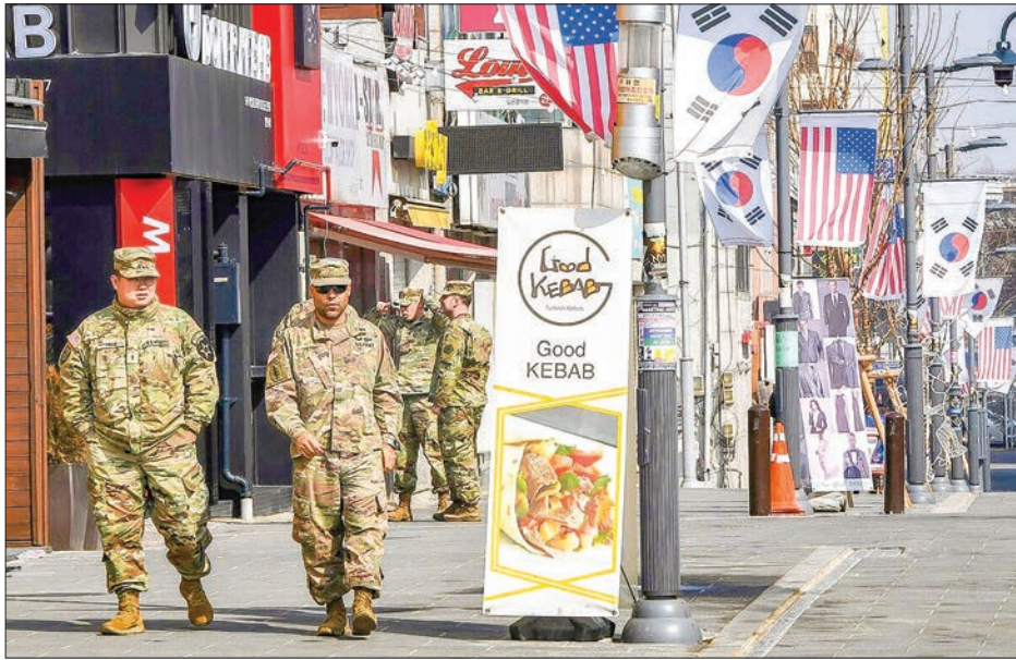
U.S. soldiers walk at a shopping zone outside Camp Humphreys in Pyeongtaek, South Korea, on Feb. 21, 2019.

Biden's call with Suga included a stark warning from the Japanese prime minister that the "security situation is increasingly severe" around the region, according to an account of the call from