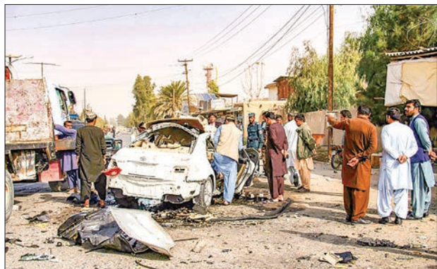
An Afghan journalist working for a US-funded radio network was killed in a blast in southern Afghanistan.

AN Afghan journalist working for a US-funded radio network was killed in a blast in southern Afghanistan on Thursday, officials said, just days after a former television presenter was murdered in Kabul.