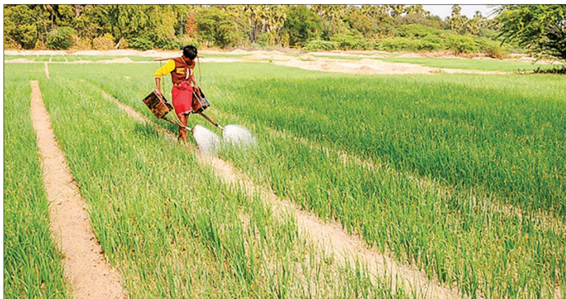
A farmer waters onions at an onion farm.

Sagaing Region is planning to grow about 600 more acres of onion and garlic as winter crops, according to the local farmers.