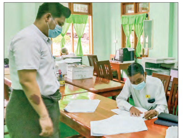
Hpa-an Township in Kayin State: PHOTO: SAW MYO THEIN (IPRD)