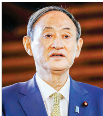
Japanese Prime Minister Yoshihide Suga on Nov. 9, 2020.

TOKYO — Japanese Prime Minister Yoshihide Suga said Monday he hopes to work with U.S. President-elect Joe Biden to further strengthen their coun-