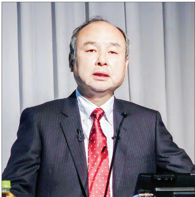
SoftBank Group Corp. Chairman and CEO Masayoshi Son meets the press in Tokyo on Nov. 9, 2020, releasing a 4.5-fold net profit jump to a record 1.88 trillion yen in the April-September period from a year earlier.

TOKYO — SoftBank Group Corp. said Monday its net profit surged more than four-fold to a record 1.88 trillion yen ($18 billion) in the April-September period from a year earlier thanks to large-scale asset sales aimed at improving