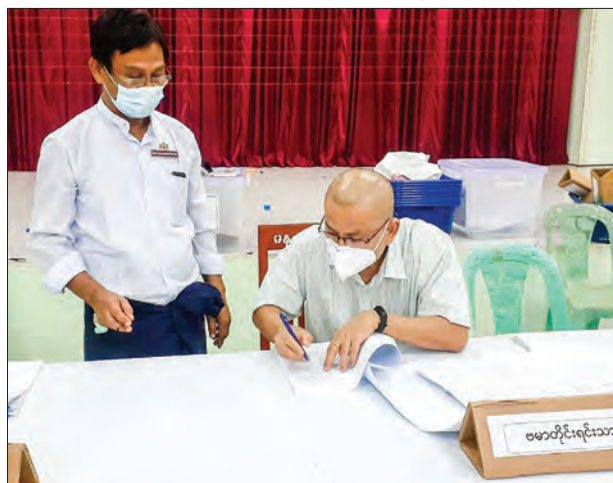
Hlaingbwe Township in Kayin State.