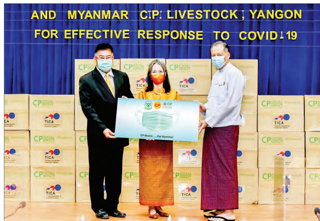
Myanmar CP Livestock donates surgical masks to the Ministry of Health and Sports on 28 October 2020.

MYANMAR C.P. Livestock Company Limited has donated 1 million surgical masks to the Myanmar Ministry of Health and Sports to support frontline medical professionals in