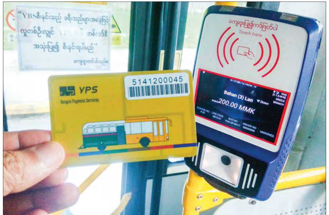
A passenger uses YPS card to pay bus fare in Yangon.

The passengers have to touch the machine while get-