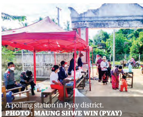
A polling station in Pyay district.