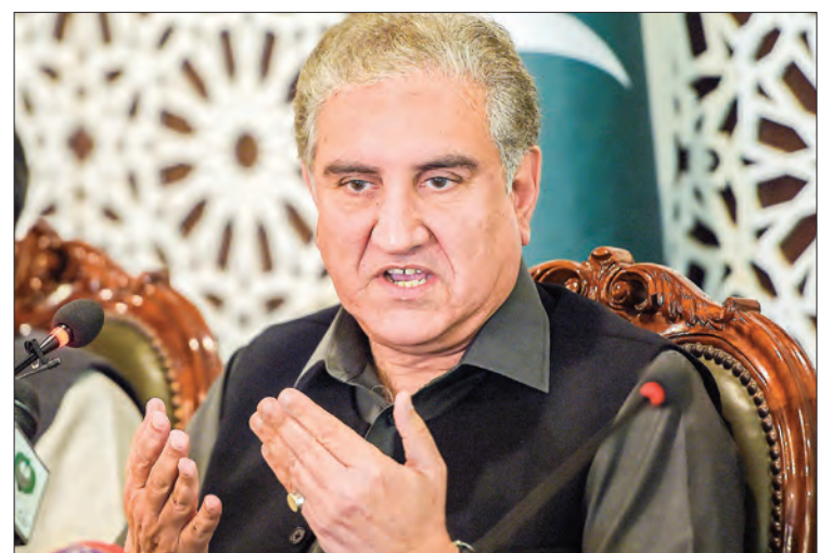
Pakistan's Foreign Minister Shah Mahmood Qureshi briefs to media representatives in Islamabad on March 1, 2020, after his return from the signing ceremony of the US-Taliban agreement in the Qatari capital Doha.

Days after the release of prisoners, peace talks between the Taliban and Afghan government to end the war were launched in the Qatari capital Doha. —AFP ■