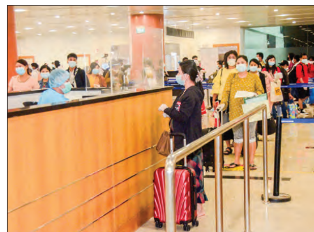
Myanmar returnees from Malaysia are seen at the Yangon International Airport on 9 November 2020.

In accordance with the instructions of the Ministry of Foreign Affairs, the Myanmar Embassy in Kuala Lumpur is cooperating with the relevant organizations in Malaysia for the repatriation of citizens after verifying the nationality.—MNA