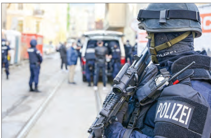
In this handout picture released by the Austrian interior ministry, Austrian policemen stand guard a street near a mosque in Vienna on November 6, 2020.

VIENNA (Austria) — Austrian police on Monday raided more than 60 addresses allegedly linked to radical Islamists and seized millions of euros in cash, with orders for 30 suspects to be questioned.