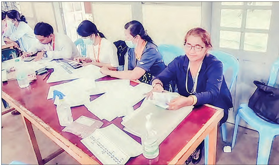
Kyaikmaraw Township in Mon State.