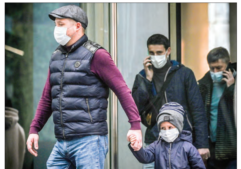
Pedestrians wearing face masks walk in Moscow's International Business Centre (Moskva City) in Moscow on 9 November 2020, amid the ongoing coronavirus disease pandemic.

France's central bank says it expects economic activity to