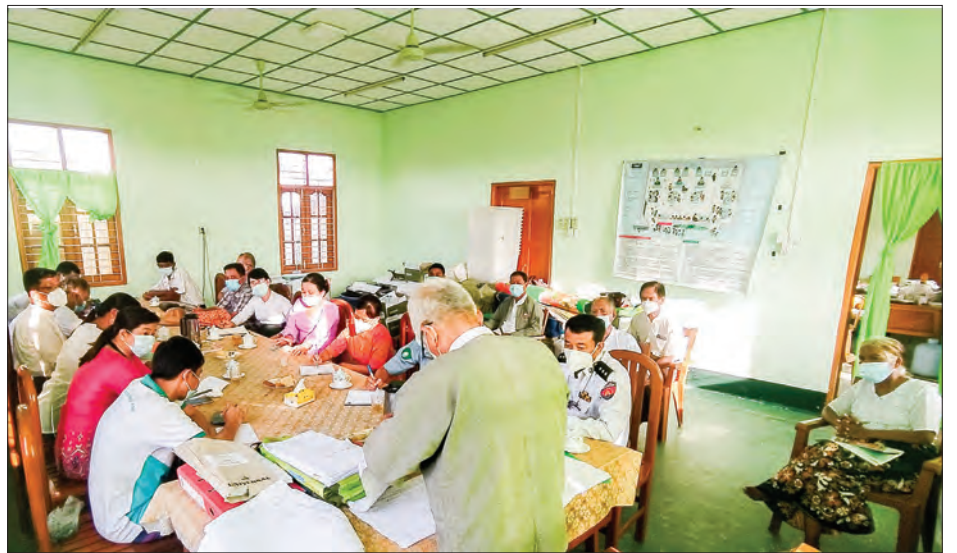
Kangyidaunt Township in Ayeyawady Region.