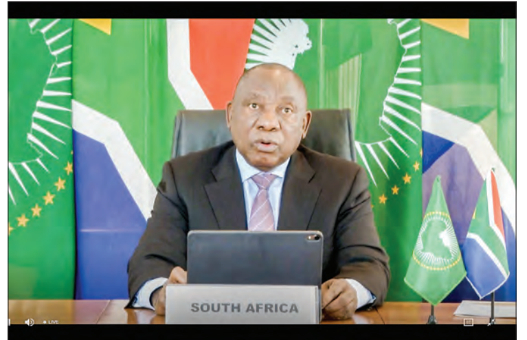
This video grab taken on May 18, 2020 from the website of the World Health Organization shows South African President Cyril Ramaphosa delivering a speech via video link at the opening of the World Health Assembly virtual meeting from the WHO headquarters in Geneva, amid the COVID-19 pandemic, caused by the novel coronavirus.

JOHANNESBURG (South Africa) — South Africa's President Cyril Ramaphosa on Monday warned of the risk of a second wave of coronavirus infections that would "choke the green shoots of economic recovery" if citizens dropped their guard.