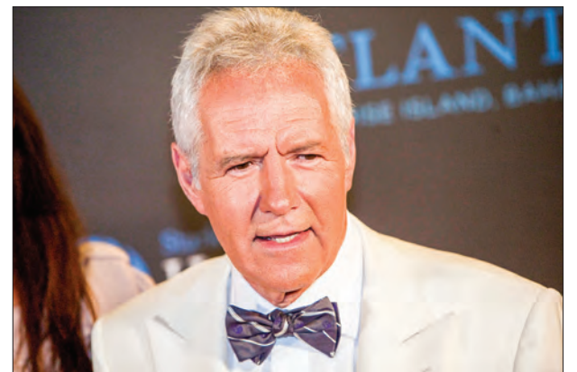
(FILES) In this file photo Alex Trebek arrives at the 38 th Annual Daytime Emmy Awards show in Las Vegas, Nevada, on 19 June 2011.

CNN media analyst Brian Stelter called Trebek