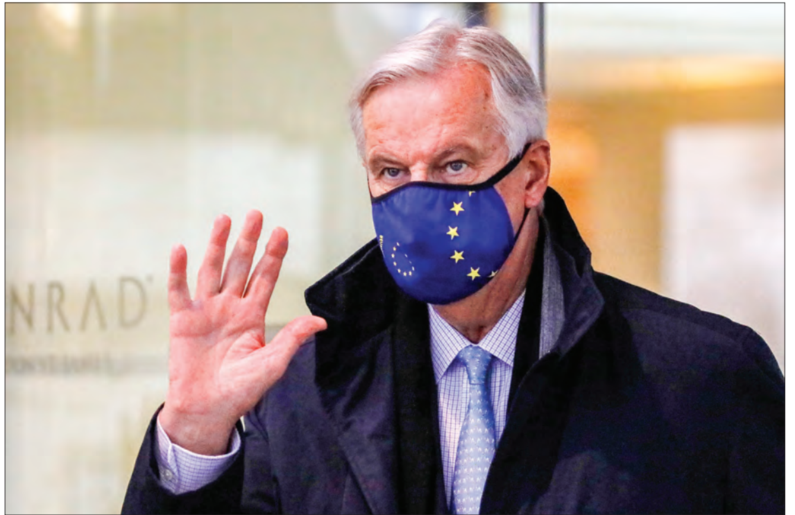
EU chief Brexit negotiator Michel Barnier, wearing an EU flag-themed facemask due to the novel coronavirus pandemic, leaves a hotel in London on 27 October 2020 to attend the latest round of Brexit trade talks with the UK.

But the coronavirus pandemic strained the already ambitious timetable, while the most divisive issues have stalled the