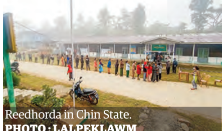
Reedhorda in Chin State.