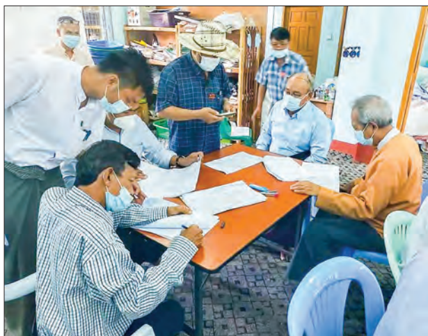
Myawady Township in Kayin State.