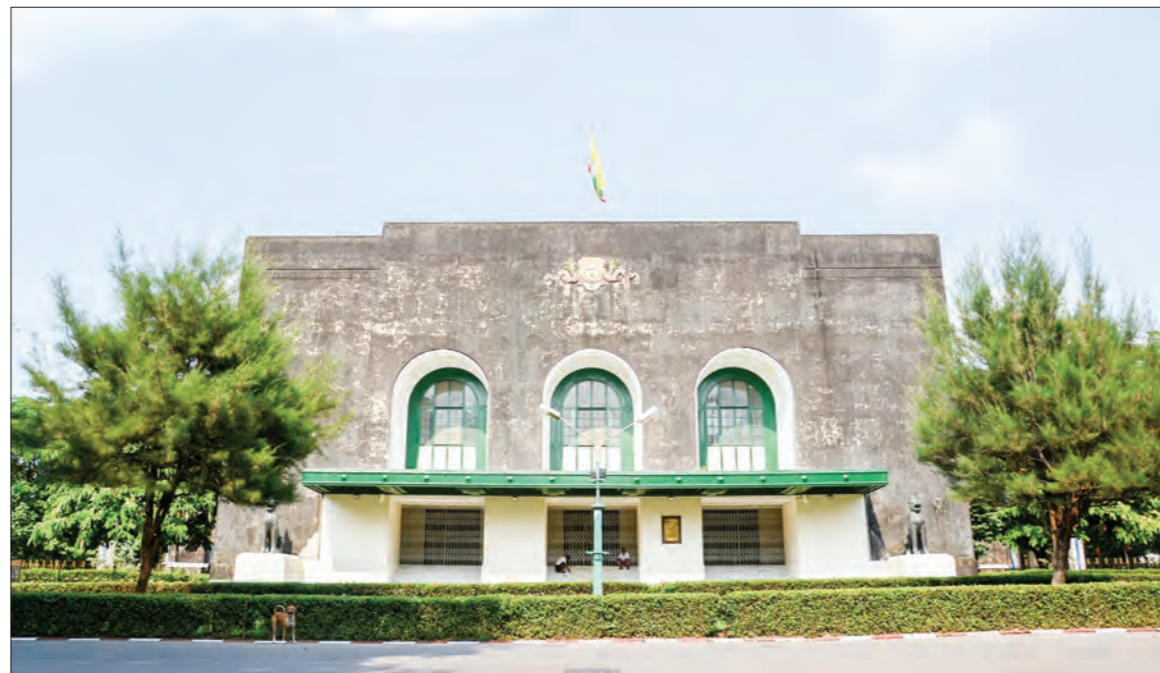
Covocation building of Yangon University.