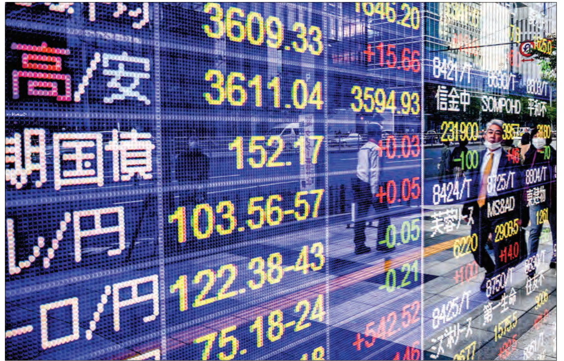
Pedestrians are seen reflected in a quotation board displaying stock prices on the Tokyo Stock Exchange in Tokyo on November 6, 2020.

Hong Kong, Shanghai, Sydney, Singapore and Seoul all gained more than one per cent, while Bangkok rose over two per cent.