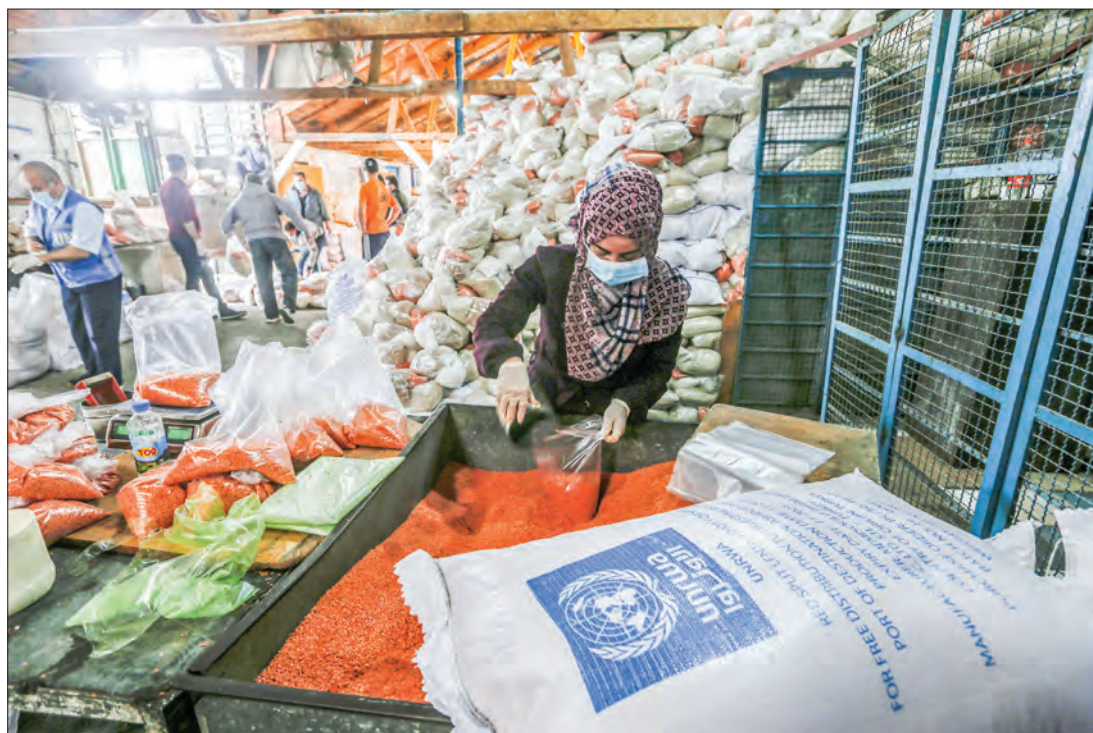
Palestinian employees at the United Nations Relief and Works Agency for Palestinian Refugees (UNRWA) wearing protective masks and gloves, prepare food aid rations to be henceforth delivered to refugee family homes rather than distributed at a UN center, in Gaza City, on March 31, 2020, due to the COVID-19 pandemic.

The Jewish state has also criticised rules under which Palestinians can hand down refugee status to their children. —AFP ■