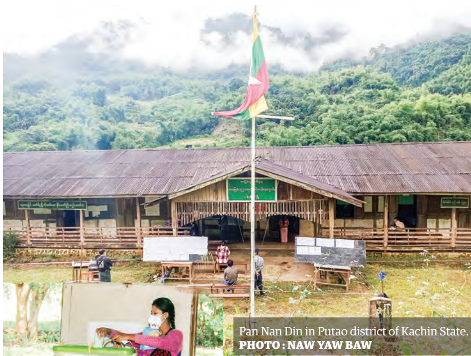
Pan Nan Din in Putao district of Kachin State.