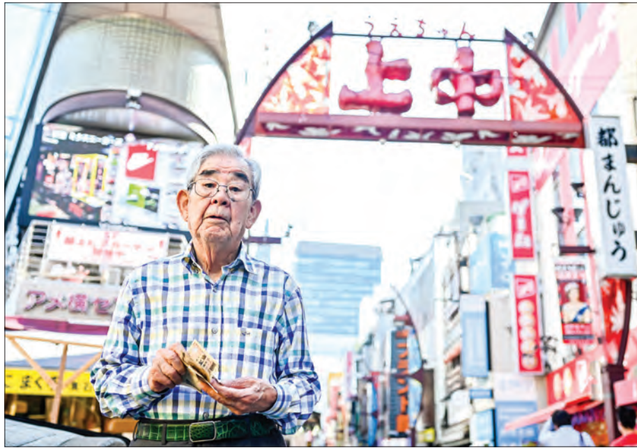
An elderly man holds money in Tokyo's Ueno area on September 28, 2020.

TOKYO — Japan will prioritize administering coronavirus vaccines to the elderly over those with chronic diseases when they become available, as the former face a higher risk of contracting a severe form of the COVID-19 respiratory illness, the health ministry said Monday.