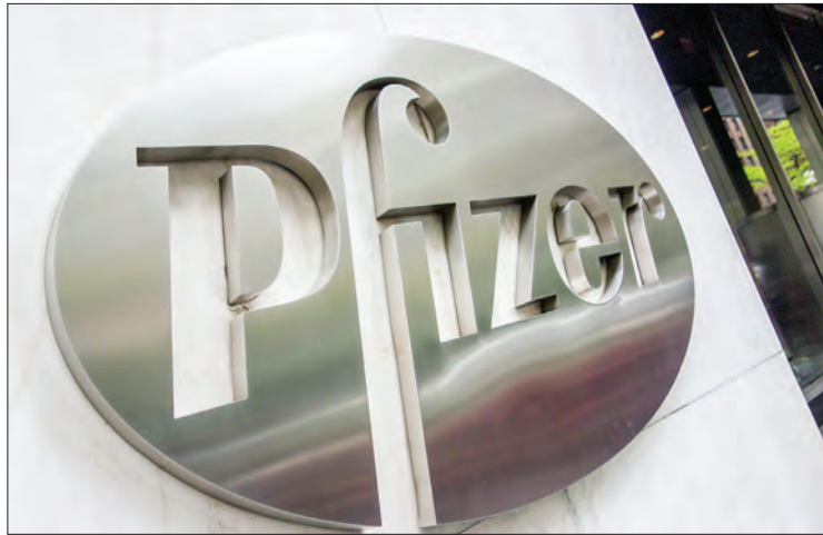
(FILES) In this file photo the Pfizer company logo is seen in front of Pfizer's headquarters on 27 April 2016 in New York.

The companies said they expect to supply up to 50 million vaccine doses globally in 2020, and up to 1.3 billion doses in 2021.