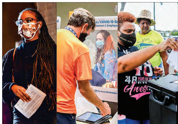
A close election could result in litigation over voting and ballot-counting procedures in battleground states. PHOTO: AFP

“The counting will not stop. It will continue until every duly cast vote is counted,” it vowed. SOURCE: AFP