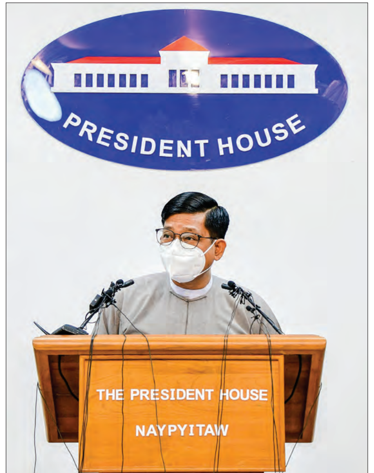
Director-General U Zaw Htay from the Ministry of Office of the State Counsellor.

He also confirmed the announcement of UEC on 30 October 2020 in line with Section 66 (d) of Hluttaw Election Law, and such announcement was also made by the previous commission on 1 No-