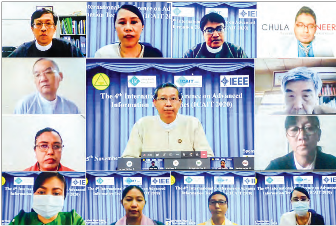
Union Minister Dr Myo Thein Gyi joins the first day online event of 4 th International Conference on Advanced Information Technologies on 4 November.

UNION Minister for Education Dr Myo Thein Gyi took part in the first-day event of the 4 th International Conference on Advanced Information Technologies through videoconferencing