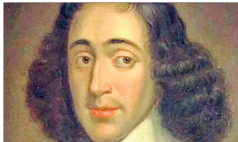
Painting of Spinoza.

Spinoza categorized two ways or modes of viewing the world or the human condition, using the Latin phrases sub specie durationis (viewing it from the viewpoint of duration, temporality) and sub specie aeternitatis (viewing it from the viewpoint of eternity). Not elaborating on what 'eternity' means, in the context of Spinoza's philosophy this writer's humble take would be that a certain mode of thinking and cognition is necessary for people to overcome or