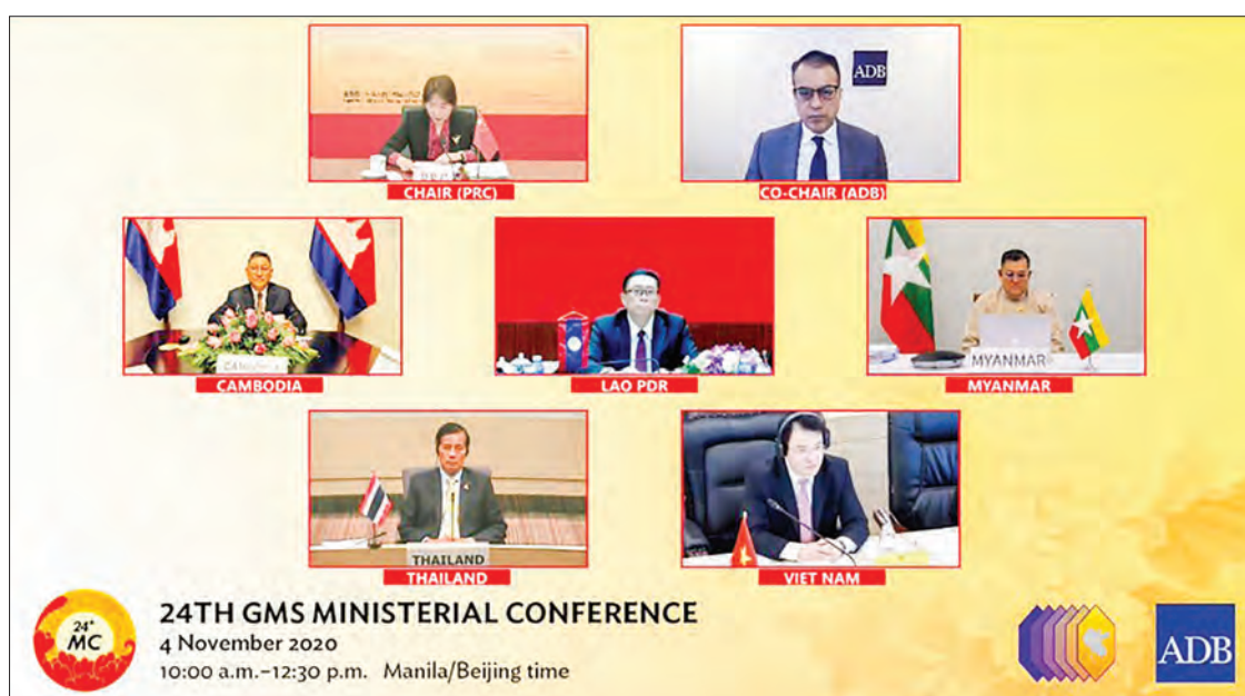
Deputy Minister U Bharat Singh takes part in 24 th GMS Ministerial Conference online on 4 November.

Deputy Minister for Investment and Foreign Economic Relations U Bharat Singh attended the 24 th Ministerial Conference of the Greater Mekong Subregion