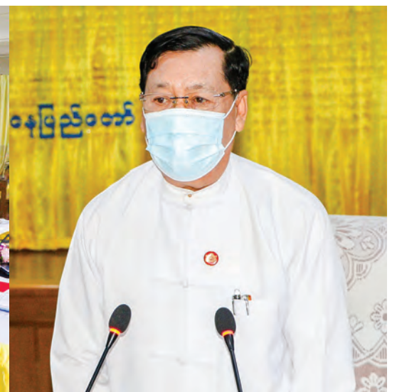
Union Minister U Thein Swe discusses distribution of COVID-19 medical devices for 2020 General Election on 4 November.