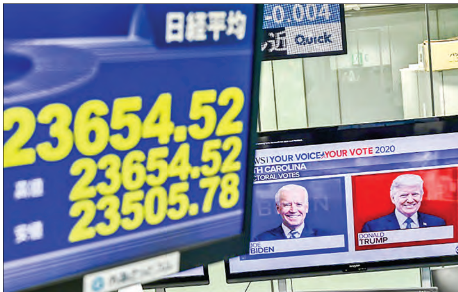
The Tokyo market may react heavily to election-related headlines that heavily influence algorithm trading.

"Tokyo shares are expected to show a technical rebound on the back of gains on Wall Street