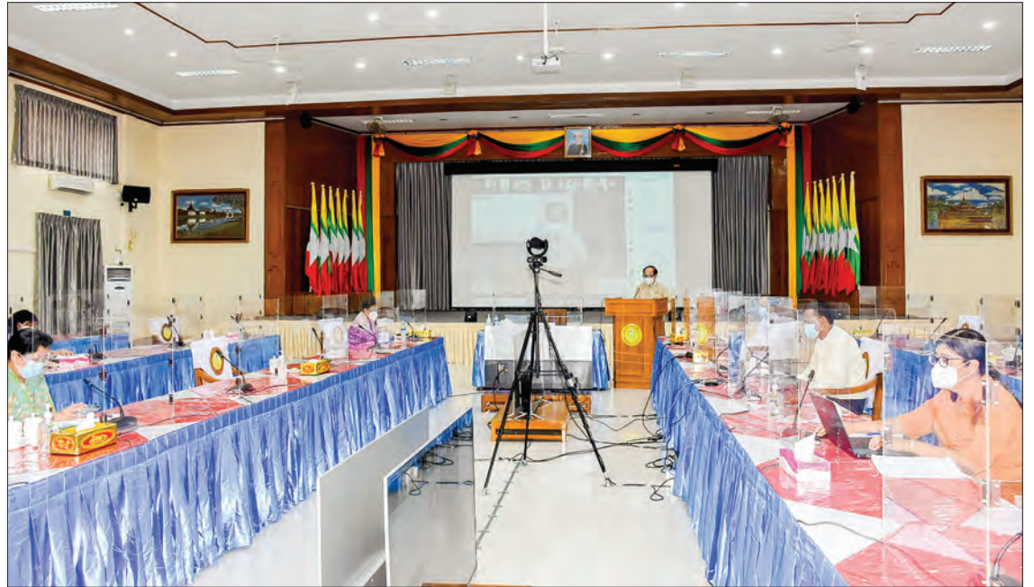
Union Minister Dr Myint Htwe discusses COVID-19 control measures with volunteering groups online on 4 November.

Deputy Minister Dr Mya Lay Sein said that the ministry would provide more N95-masks and personal protective equip-