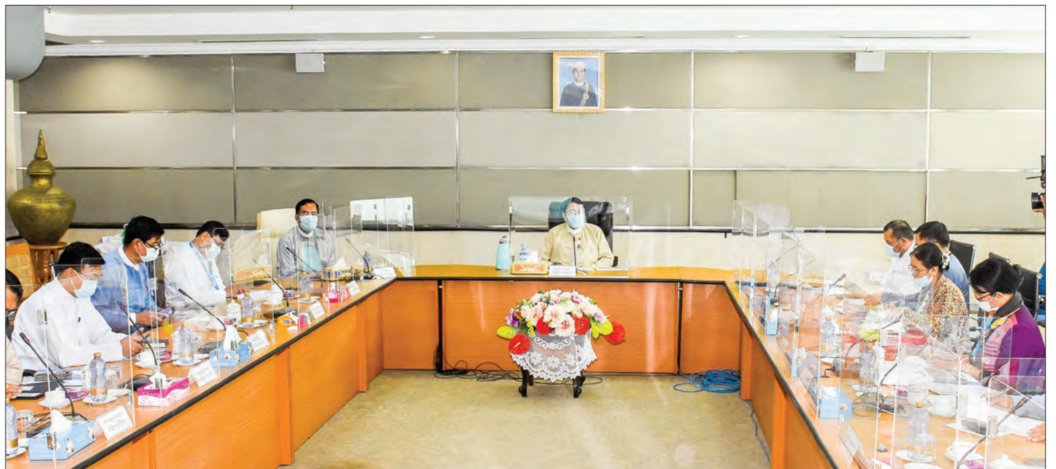
Union Minister Dr Pe Myint holds meeting at MRTV in Tatkon Township on its broadcast programmes.

In the afternoon, the Union Minister and his entourage ar-