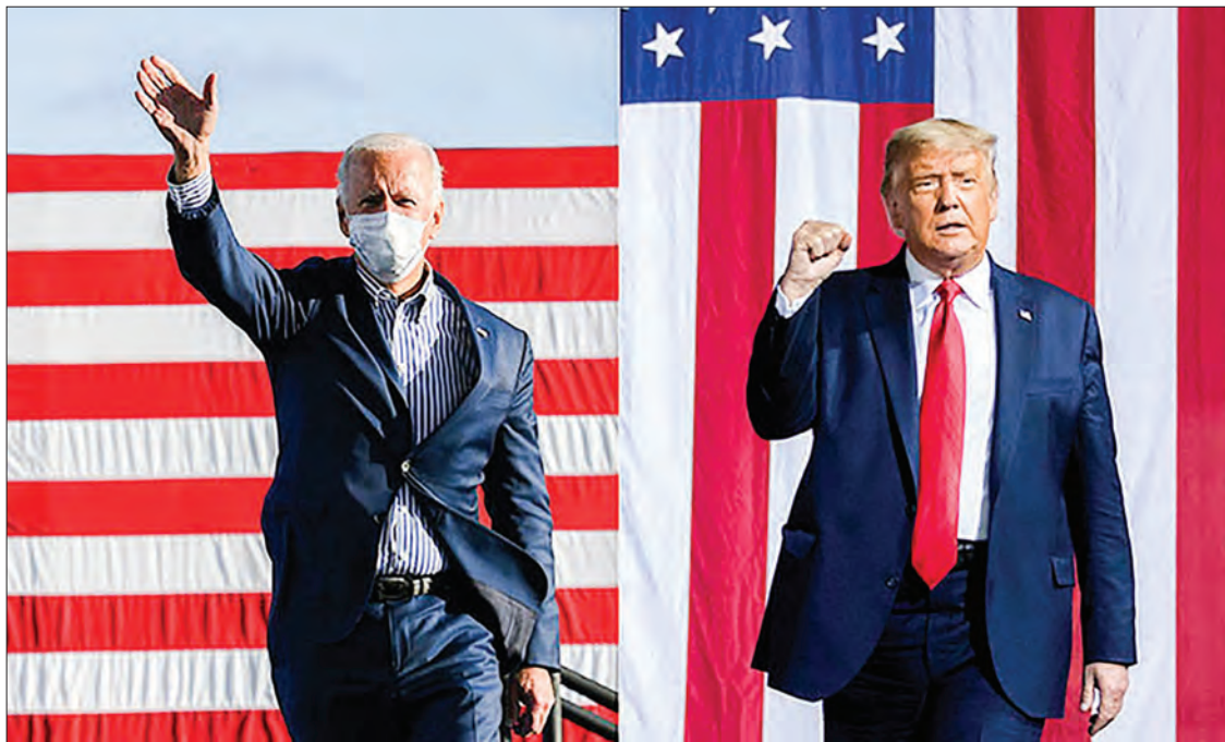
Democratic presidential nominee and former Vice President Joe Biden and US President Donald Trump.

Mail-in ballots, sent due to health concerns during the Covid-19 health crisis, are expected to favour Biden and in some states were being counted later.