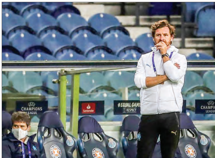
Andre Villas-Boas's Marseille were well beaten by Porto and have now lost 12 consecutive matches in the Champions League.

PORTO (Portugal) — Marseille matched the longest losing streak in UEFA Champions League history with their 3-0 defeat away to Porto in Portugal on Tuesday.