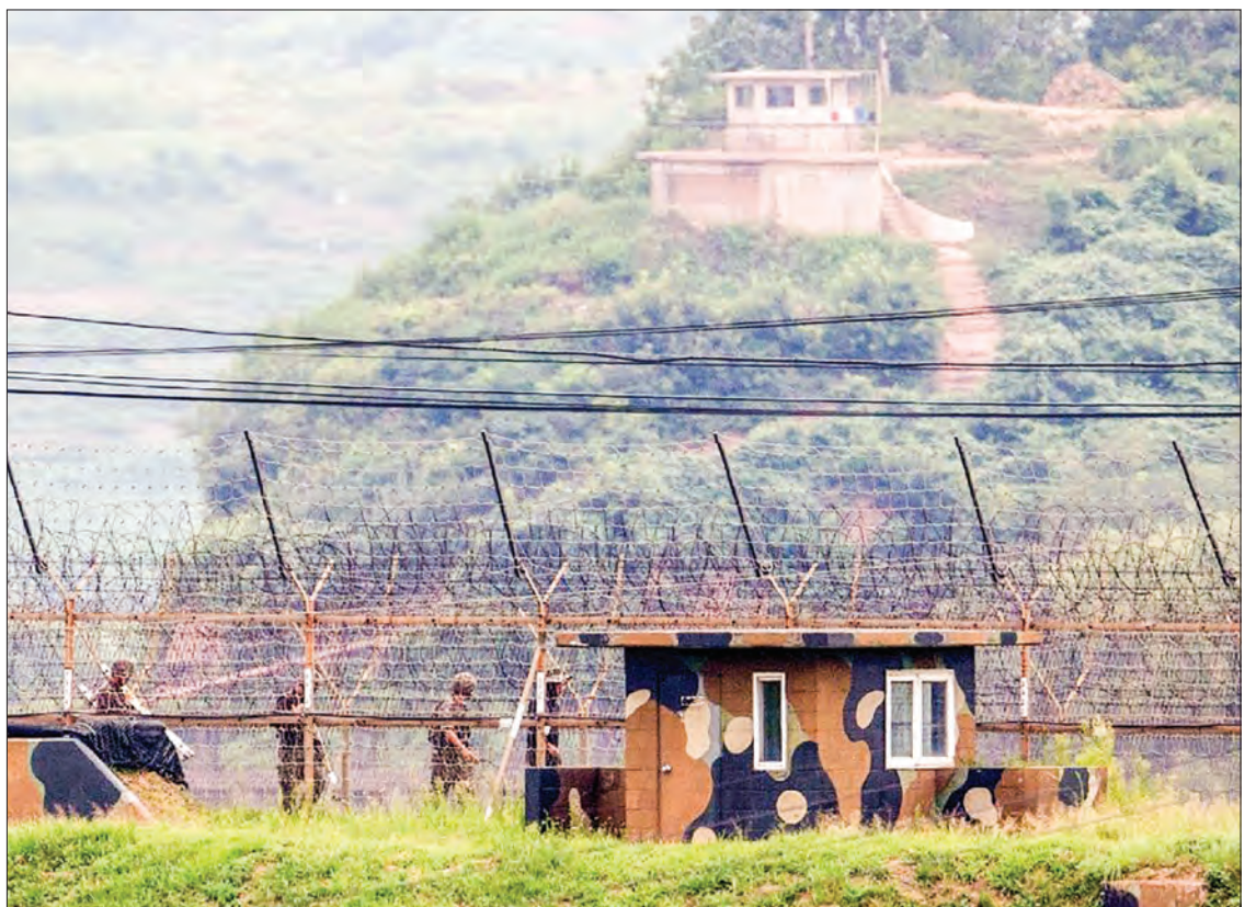
South Korean (bottom) and North Korean (top) guard posts are seen on either side of the Demilitarized Zone between North and South Korea in Paju on August 24, 2015.