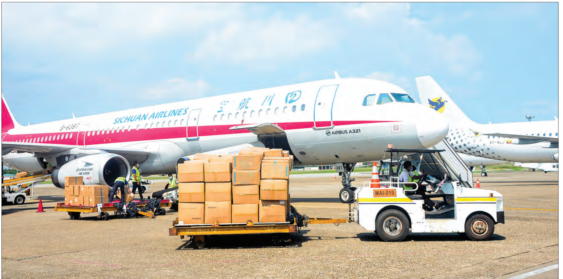
Medical devices imported from China are being unloaded at Yangon International Airport on 4 November.

M YANMAR is importing COVID-19 medical devices from China for the November 8 Gen-