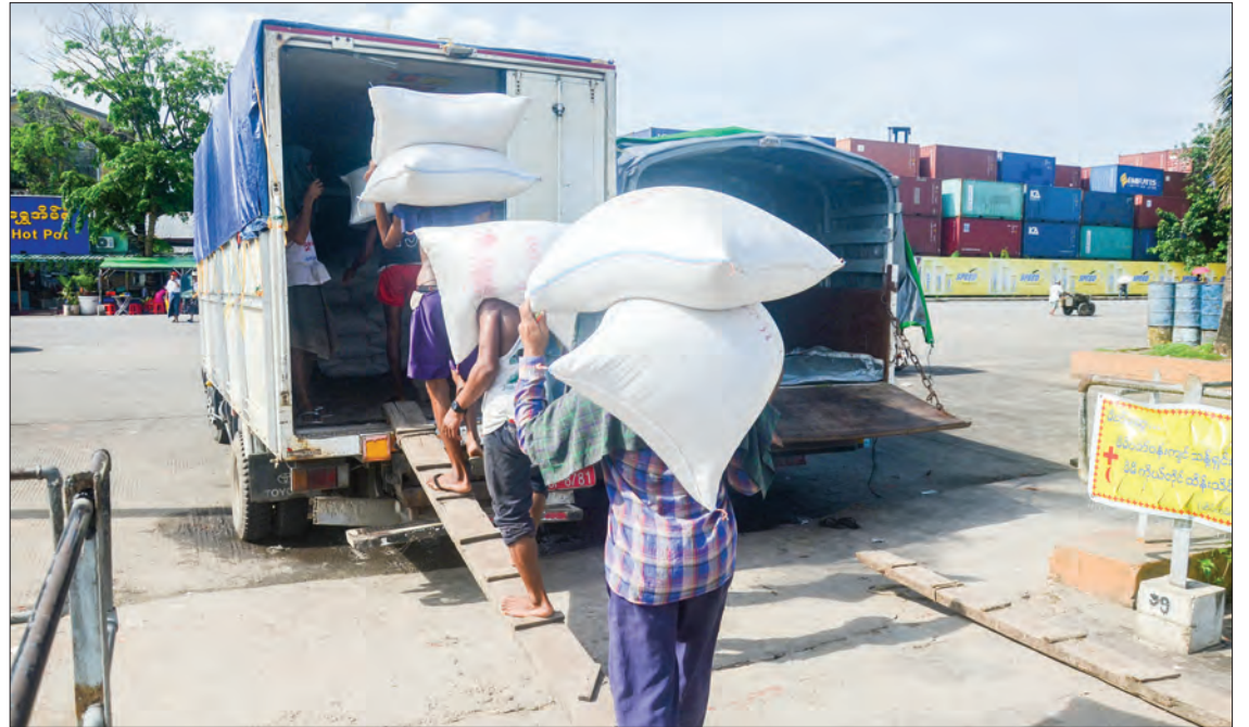
Myanmar exported over 426,611 metric tons of rice to neighbouring countries in previous financial year.

THE volume of rice and broken rice exported between 1 and 16 October in the current financial year 2020-2021 reached 35,637 metric tonnes, worth over US$14 million, according to an announcement from the Myanmar Rice Federation (MRF).