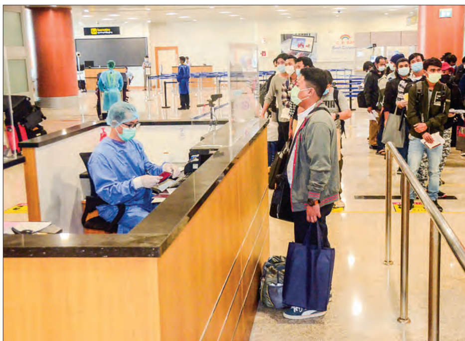
Myanmar nationals arrive at Yangon International Airport by China Airlines on 4 November.

national commercial flights, in accordance with the guidance of the National-Level Central Committee on Prevention, Control and Treatment of COVID-19. —MNA (Translated by Khine Thazin Han)