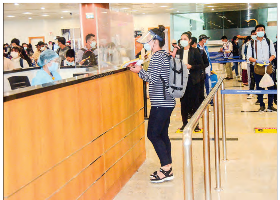
Myanmar returnees from Malaysia queuing for immigration process at Yangon International Airport on 4 November.