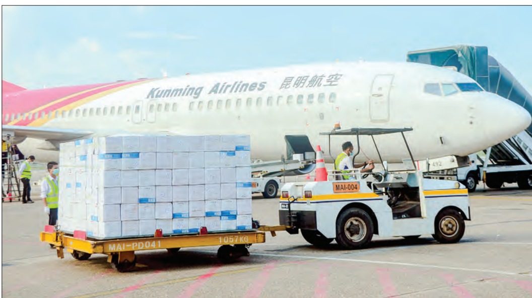
COVID-19 medical devices from China are being unloaded in Yangon on 4 November. (NEWS ON PAGE-1)