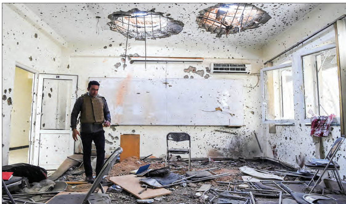
A journalist walks inside a damaged classroom of the National Legal Training centre, a day after gunmen stormed Kabul University in Kabul, Afghanistan on Tuesday. Stunned students demonstrated outside Kabul University on Tuesday after at least 22 people were killed in a brutal, on-campus attack claimed by the Islamic State group.