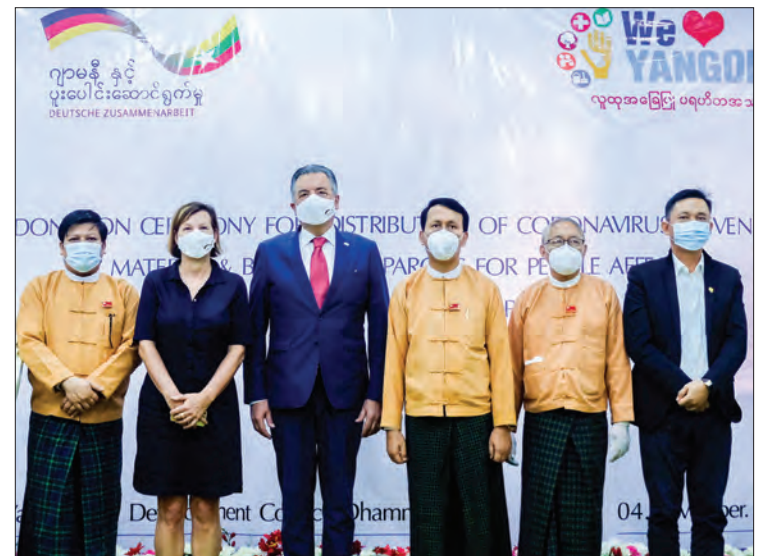
Germany presents cash assistance to the ‘We Love Yangon’ for volunteering works in COVID-19 measures.

Germany has supported the United Nations organizations as well as other health and humanitarian partners in the fight against COVID-19 both globally and in Myanmar.—GNLM