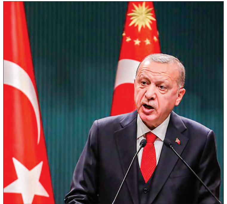
Turkish President Recep Tayyip Erdogan makes a speech after cabinet meeting at Presidential Complex in Ankara, on Nov. 3, 2020.