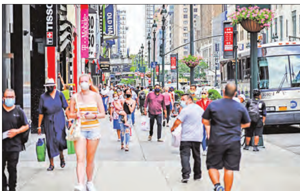
People wearing face masks carry shopping bags as they walk near Herald Square in New York City, the US on June 25.