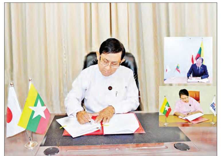
Deputy Minister U Maung Maung Win signs Exchange of Notes and Financing Agreements with Japan on 4 November.