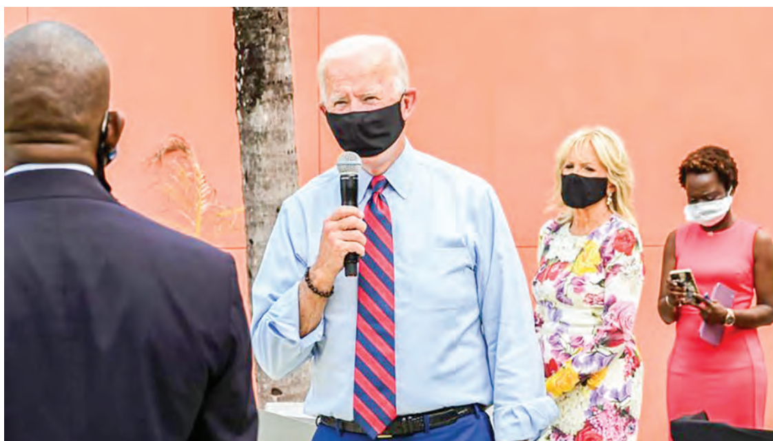
Democratic presidential nominee and former Vice President Joe Biden speaks at the Little Haiti Cultural Complex in Miami, Florida on October 5, 2020.

An average of national polls by the RealClearPolitics (RCP) website gives Biden a 6.7 point