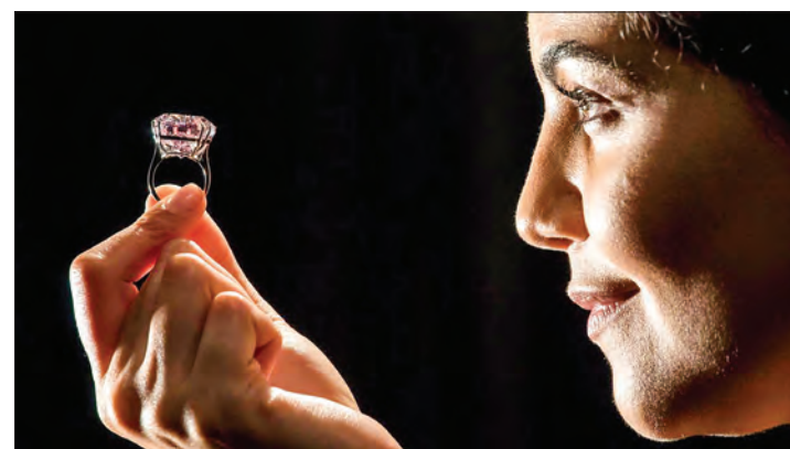
The Argyle mine, in the remote Kimberley region of Western Australia, churned out more than 90 per cent of the world's pink diamonds -- sought after for their incredible rarity.

THE world's largest pink diamond mine has shut its doors after exhausting its reserves of the expensive gems, global mining giant Rio Tinto said Tuesday.