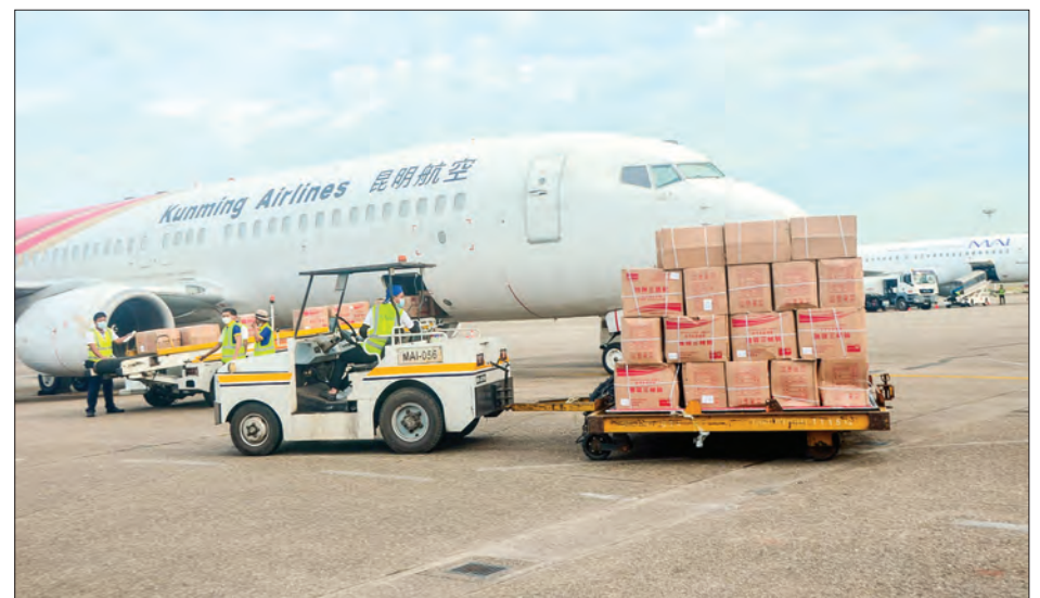
COVID-19 medical devices imported from China arrive in Yangon on 3 November.