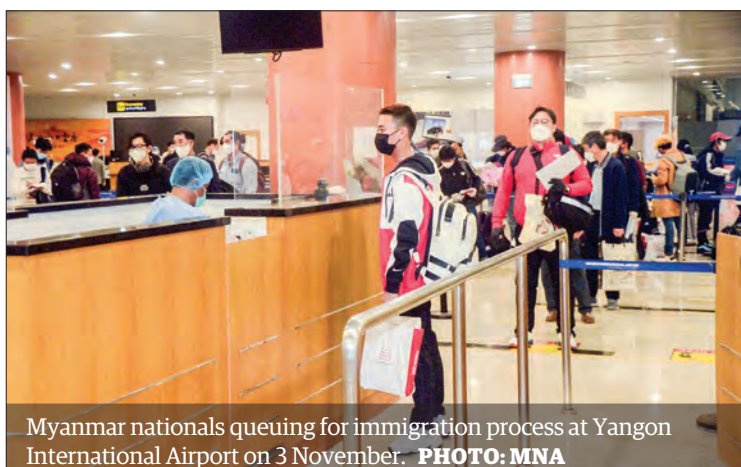
Myanmar nationals queuing for immigration process at Yangon International Airport on 3 November.

MYANMAR Airways International flew 103 Myanmar nationals back home by its 29 th relief flight, organized by Myanmar Embassy in Seoul, yesterday evening.