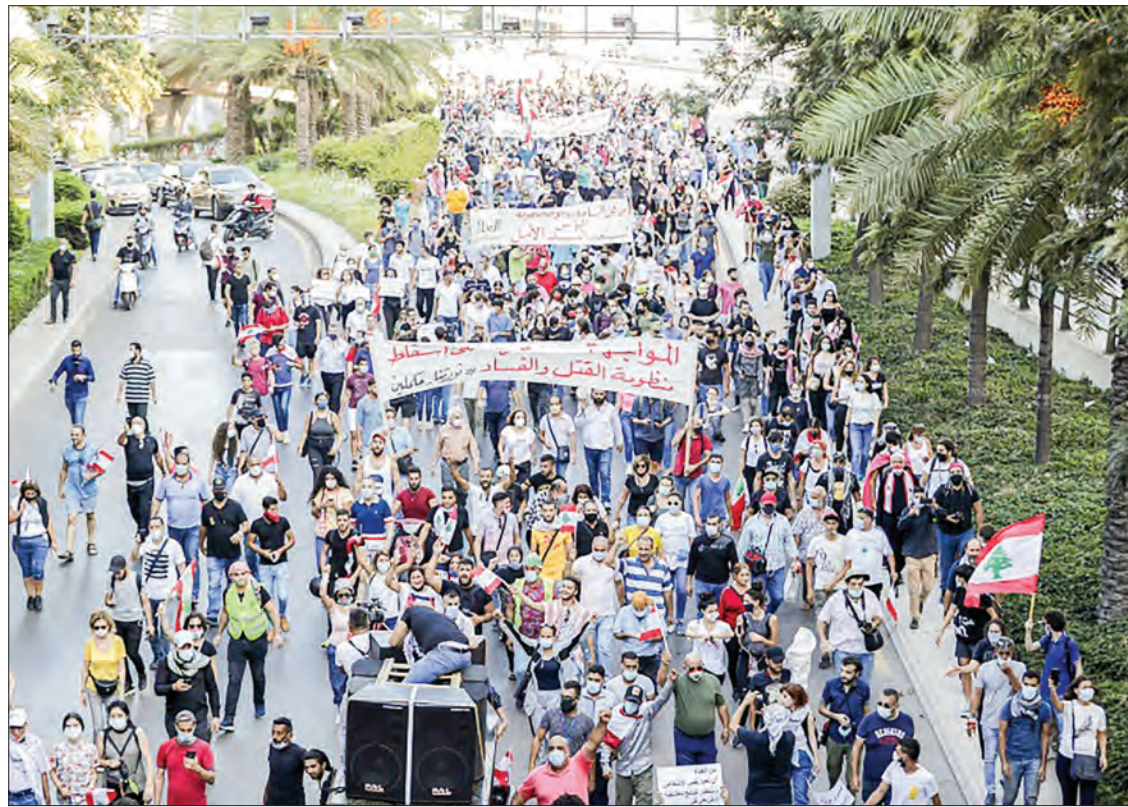
Protesters march on the fortified headquarters of Lebanon's central bank whose policies have been widely blamed for the country's plummeting currency and ballooning sovereign debt.

LEBANON'S caretaker prime minister Hassan Diab urged the central bank on Tuesday to hand over missing documents needed for a forensic audit demanded by international creditors.