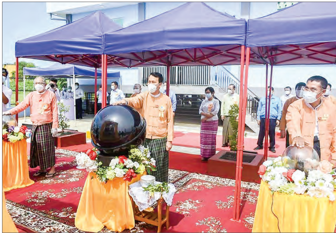
Yangon Chief Minister U Phyo Min Thein, Regional Hluttaw Speaker U Tin Maung Tun and a Hluttaw Representative open a 33/11 kV 5 MVA substation on 3 November.

YANGON region government Chief Minister U Phyo Min Thein and Regional Hluttaw Speaker U Tin Maung Tun inaugurated the three power substations in Hmawby and Htantabin townships in Yangon Region on 3 November morning.