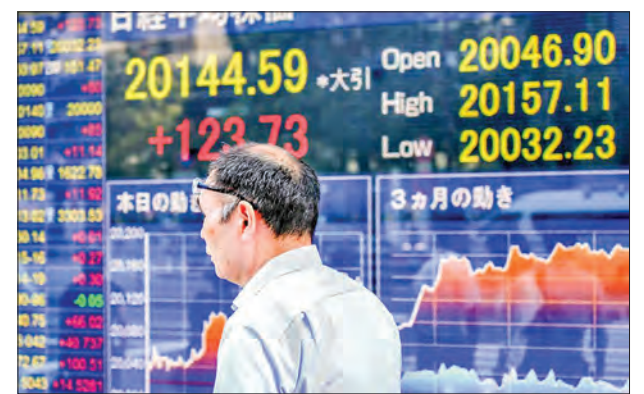
Global stock markets jumped and the dollar weakened Tuesday as polls opened for the US election. The Tokyo Stock Exchange.