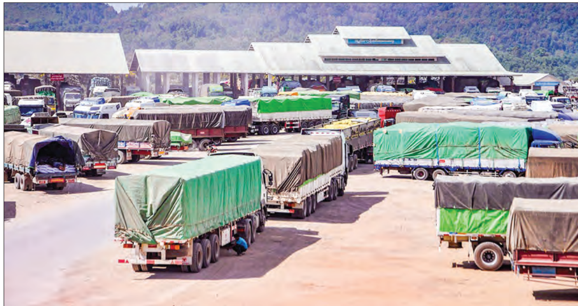
Trucks seen at the trade zone at Myawady border post.

Thailand accounted for 14.45 pc of total trade in 2016-2017FY with an estimated trade value of US$4.6 billion, 15.54 pc in 2017-2018FY with a trade value of $5.57 billion, 15.55 pc in 2018-2019FY