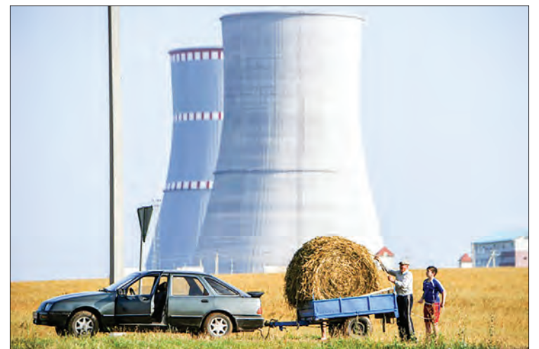
Belarus's new nuclear power plant, pictured here while still under construction, is located close to the border of Lithuania and its capital Vilnius.