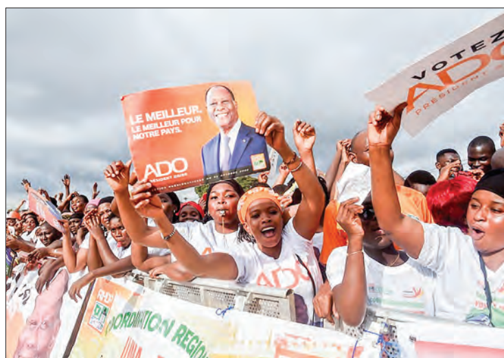
Supporters of incumbent president Alassane Ouattara take part in a campaign meeting ahead of the presidential election, Abidjan, Côte d’Ivoire, 17 October 2020.

“The EU expects all stakeholders to take the lead in easing the climate and resuming dialogue... and promoting reconciliation through very