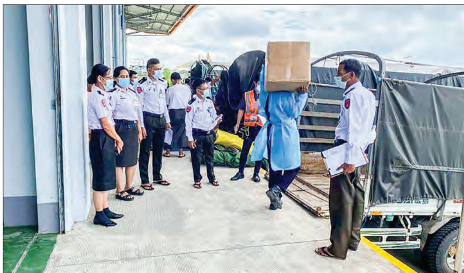
Officials are checking unloading of COVID-19 medical devices from China at Mandalay International Airport on 3 November.

sets for voters, polling station staff and volunteers.—MNA