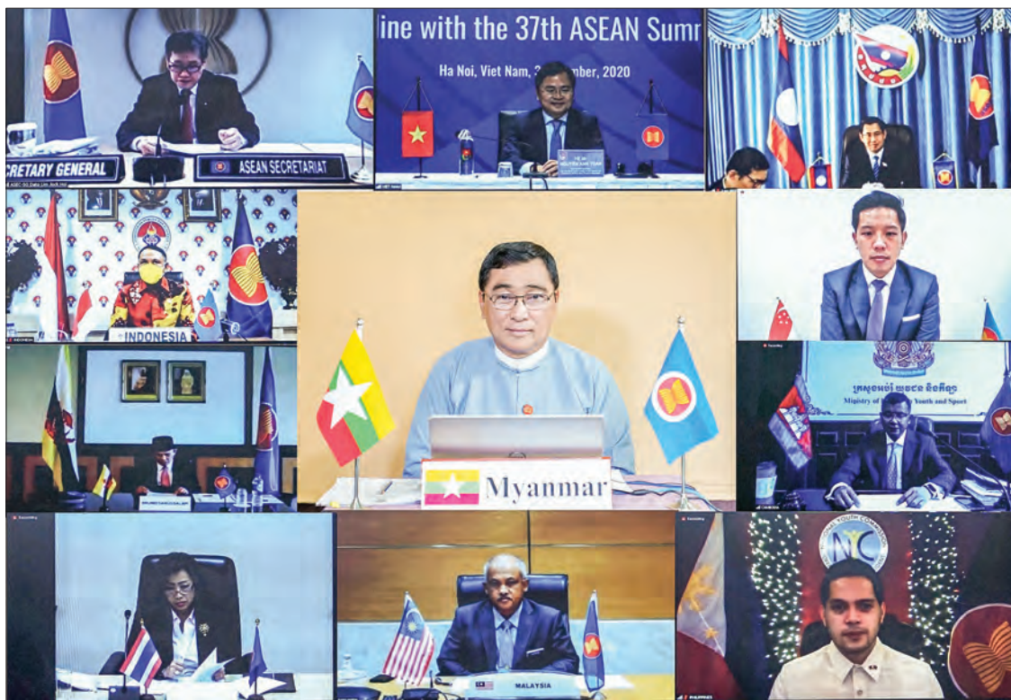
Union Minister Dr Win Myat Aye participates in ASEAN Youth Conference online on 3 November.

UNION Minister for Social Welfare, Relief and Resettlement Dr Win Myat Aye joined the ASEAN Youth Conference presided