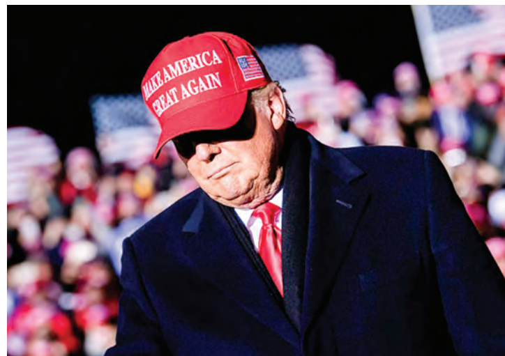
Trump said he expected victory in all the key states that will decide the election, but said he would not "play games" by declaring his win too early.