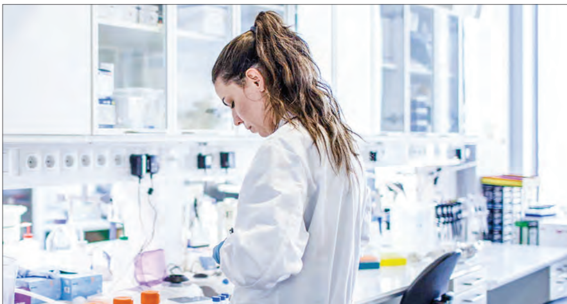
A researcher works on a vaccine against the new COVID-19 virus at the Copenhagen University research lab in Copenhagen, Denmark, on 23 March, 2020.

The IPBES suggested a global, coordinated pandemic re-