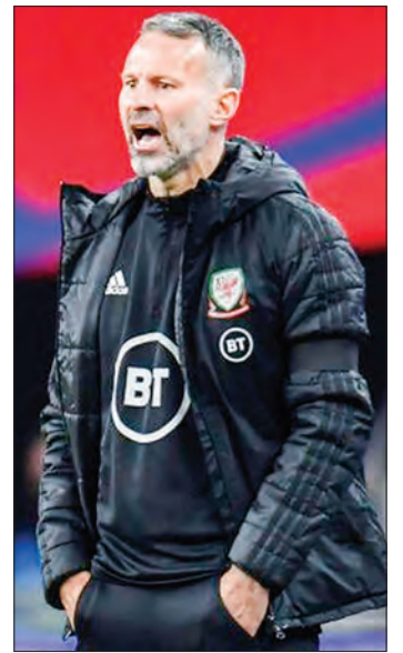
Arrest allegations: Ryan Giggs.

Wales have cancelled Tuesday's press conference