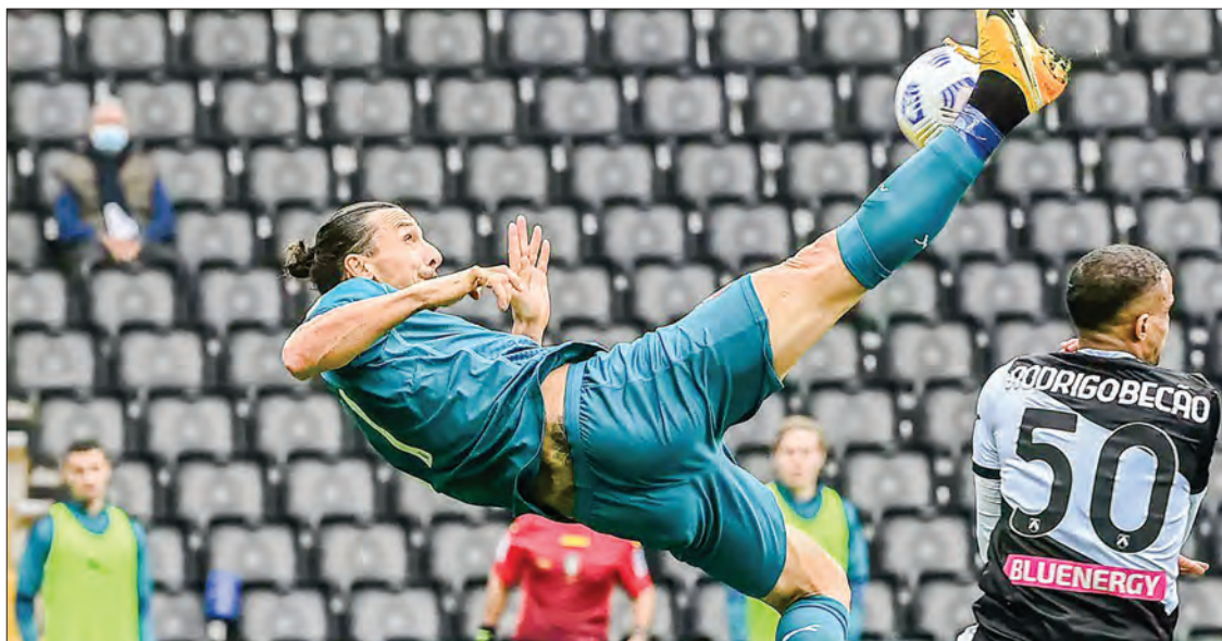
Zlatan Ibrahimovic has scored seven goals in four Serie A appearances this season.

Sweden face Denmark in a friendly match on November 11 before taking on Croatia and France in the Nations League over the course of the following week. They are bottom of Group 4 in League A after losing all four of their matches so far.—AFP