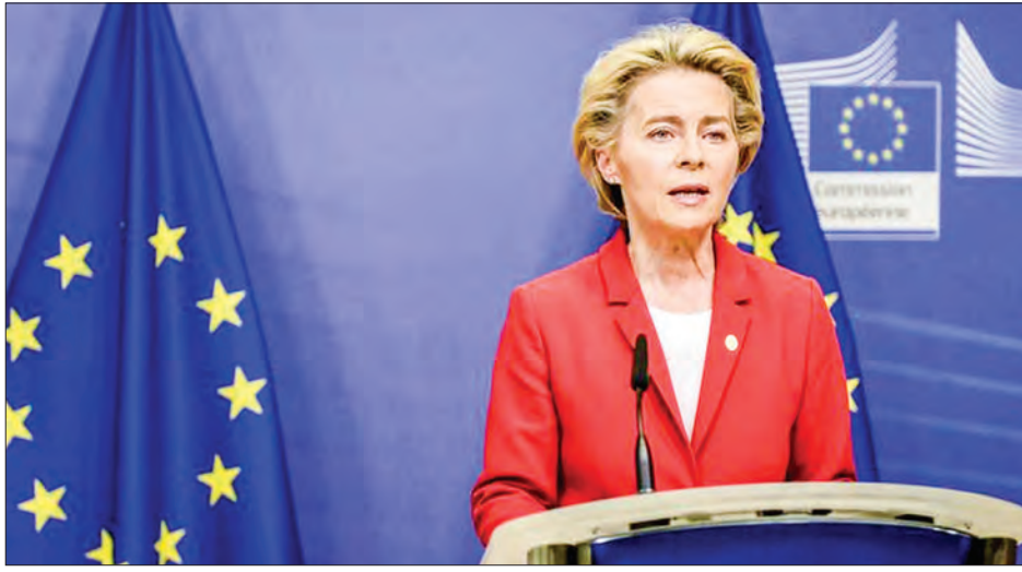
Ursula von der Leyen, the president of the European Commission.