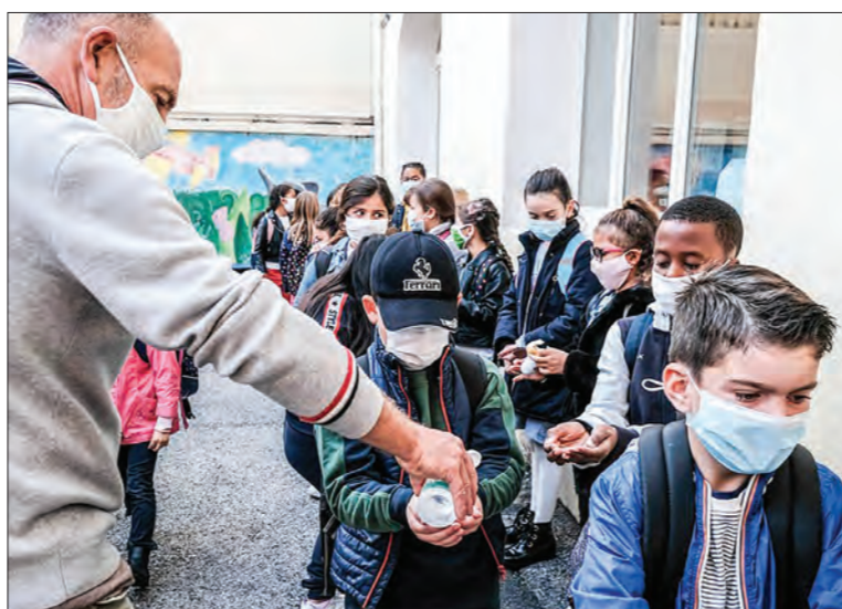
A school staff member distributes hand-cleansing gel among students returning from Halloween break in Antibes, southern France, Nov. 2, 2020.

She highlighted that young children and pregnant women are at risk from severe disease with influenza but not showing severe disease in COVID-19. If the two groups show symptoms of acute respiratory infection, they need to be tested first before taking