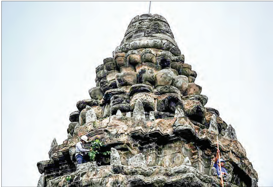
Angkor Archaeological Park was Cambodia's most popular tourist destination before the coronavirus pandemic seized up global travel

STACKING a ladder against the towering spires of Cambodia's archaeological marvel Angkor Wat, Chhoeurm Try gingerly scales the temple's exterior to hack away foliage before it damages the ancient facade.