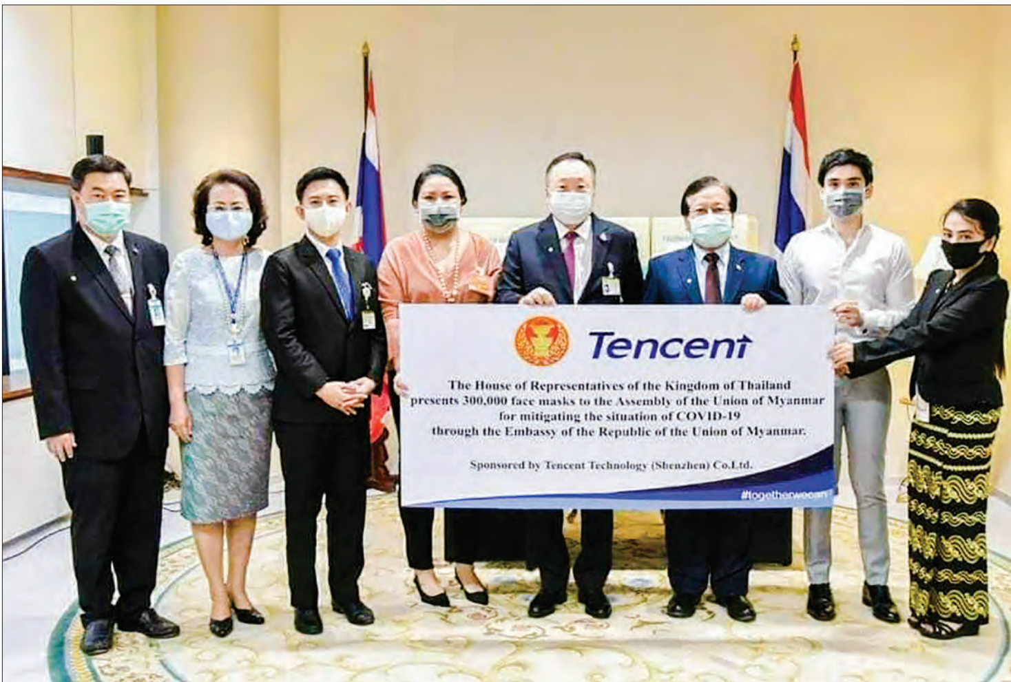
Thai officials present 300,000 face masks for Myanmar Hluttaw on 29 October in Bangkok.

T HE House of Representatives of the Kingdom of Thailand presented 300,000 face masks to the Pyithu Hluttaw of Myanmar on 29 October.