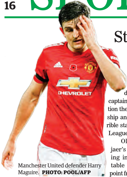
Manchester United defender Harry Maguire.