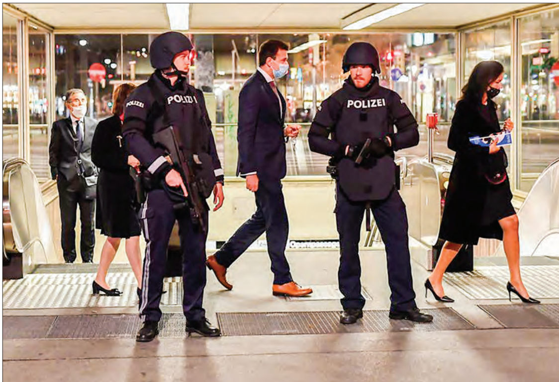
Opera guests walk past policemen after leaving the state opera in the centre of Vienna following a shooting.

RUSSIAN President Vladimir Putin on Tuesday called the Vienna shooting a “cruel and